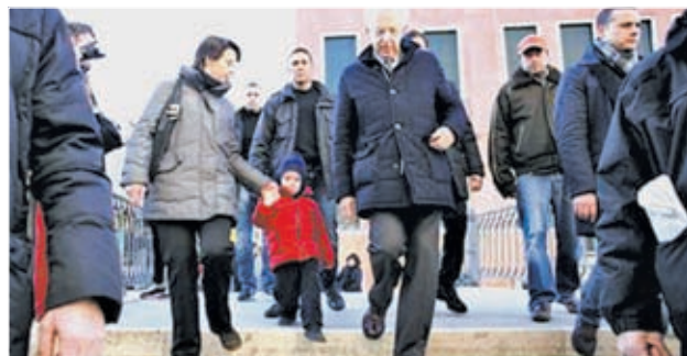
Outgoing Italian Prime Minister Mario Monti (4th R) walks during a private visit with his family in Venice on 29 Dec, 2012.

majority in the lower house without taking a secure command of the Senate, possibly making an alliance with Monti's bloc crucial to creating a stable parliamentary majority.—Reuters