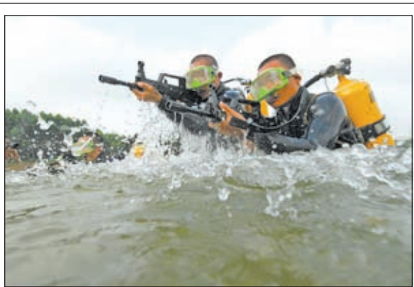
Chinese Marine Corps under the Navy of the Chinese People's Liberation Army (PLA) conducted an amphibious combat training recently.—REUTERS

immediately clear who or what was the target of the blast in the Aisha Manzil area of Karachi, although a political rally was happening nearby. The explosion was heard several kilometres (miles) away. Karachi, home to 18 million people, is the financial capital of Pakistan but has been plagued by Islamic militancy as well as violent crime.—Reuters