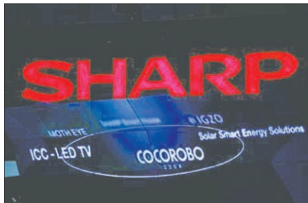
A logo of Sharp Corp is pictured at CEATEC JAPAN 2012 electronics show in Chiba, east of Tokyo, on 2 Oct, 2012.

the average household would pay an estimated $3,500 more in taxes, according to the Tax Policy Centre, a Washington think tank. Budget experts expect the economy would take a hit as families cut back on spending.—Reuters