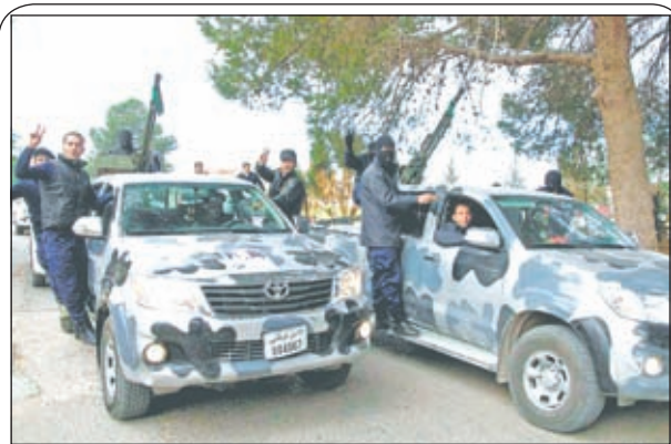
Libyan policemen take part in a police graduation ceremony at a police academy in Tripoli on 1 Jan, 2013.—XINHUA

From the final moments of 2012 to the early hours of 2013, as many as 8,200 holiday events took place in Russia, the Interior Ministry.—Xinhua