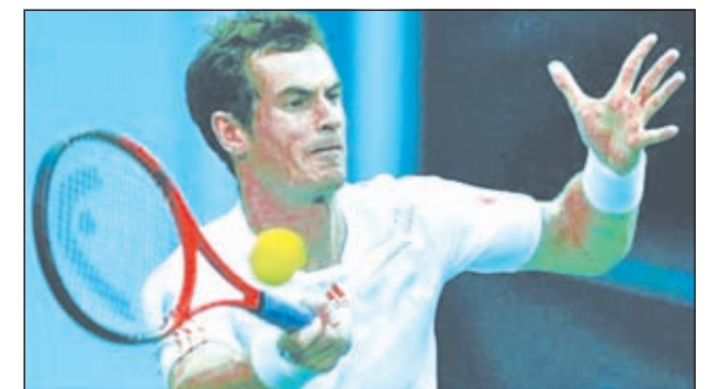
Andy Murray of Britain hits a return to Radek Stepanek of the Czech Republic during their men's singles quarterfinals tennis match at the Shanghai Masters tournament on 12 Oct, 2012.

"A lot of the sportsmen and women have been given that just because their sport isn't necessarily in the spotlight all the time, it's easy to forget what they've done for 10, 15 years.—Reuters