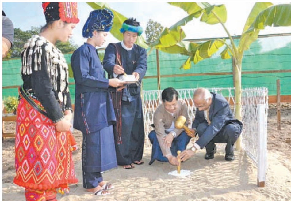
Union Minister for Agriculture and Irrigation U Myint Hlaing drives stake for construction of Advanced Centre for Agriculture Research and Education Centre.