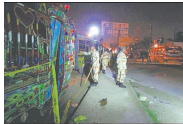
Soldiers cordon off the site of a motorcycle bomb blast in Karachi on 1 Jan, 2013.