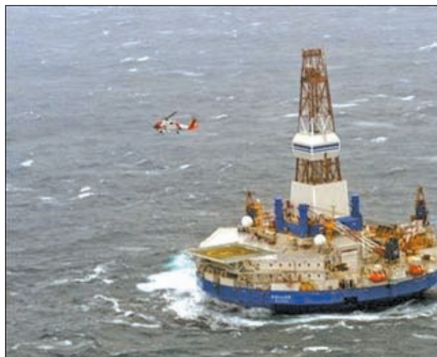
A Coast Guard Air Station Kodiak MH-65 Jayhawk helicopter crew delivers personnel to the conical drilling unit Kulluk, southeast of Kodiak, Alaska in this on 31 Dec, 2012 handout photo obtained by Reuters on 1 Jan, 2013.