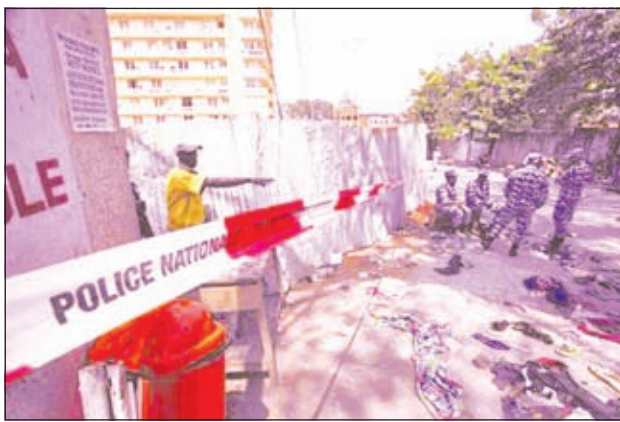
A view of a street in Plateau District where a stampede occurred after a New Year's Eve fireworks display in Abidjan on 1 Jan, 2013.— Reuters

IURD is a Pentecostal Christian church created in 1977 in Brazil, where it has over 8 million followers, according to its own website. IURD says it is present in most countries of the world. Ferner Batalha, IURD's deputy bishop for Angola, said the vigil had been overcrowded.— Reuters