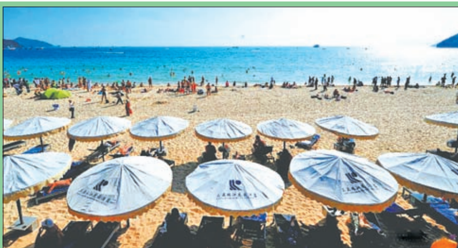
Tourists visit a beach resort in Sanya, south China’s Hainan Province, on 1 Jan, 2013, the New Year’s Day.

Abe emphasized that the most important thing is to quickly implement the policies, rather than shouting out words that can not be carried out. He also said Japan will enhance its alliance with the United States and rebuild relations with its neighbouring countries through an overall perspective.—Xinhua