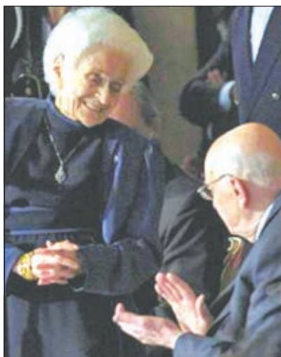
Italian neurologist Rita Levi Montalcini is greeted by Italian President Giorgio Napolitano in this undated file photograph. Rita Levi Montalcini, joint winner of the Nobel Prize for Medicine and an Italian Senator for Life, died on Sunday at the age of 103, her family said.