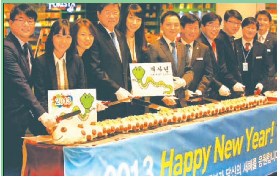
Staff pose for photos with a 3-metre snake cake during the new year celebration at a department store in Seoul, South Korea, on 1 Jan, 2013. The year of 2013 is the Year of Snake.

The annual list exchange has been taking place since 1992 under a bilateral pact between the two countries signed in 1988. Both India and Pakistan are nuclear powers and have fought three major wars since 1947.