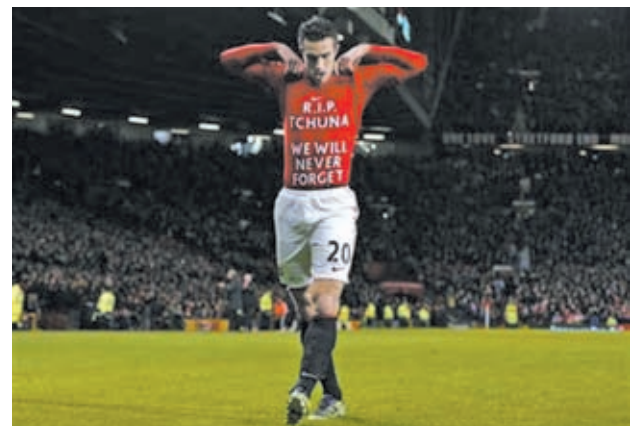
Manchester United’s Robin van Persie celebrates his goal against West Bromwich Albion during their English Premier League soccer match at Old Trafford in Manchester, northern England on 29 Dec, 2012.