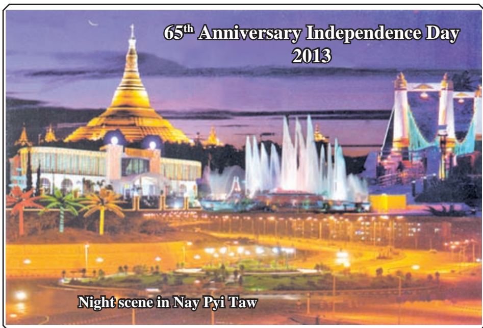
65 th Anniversary Independence Day 2013