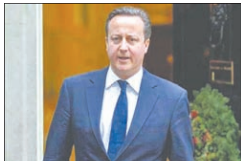
Britain's Prime Minister David Cameron leaves Downing Street in London on 19 Dec, 2012.

LONDON, 2 Jan—Trade, tax compliance and promoting greater transparency will be the main focus of the next meeting of leaders of the Group of Eight major economies in June, Britain said on Wednesday as it assumed the group's rotating presidency.