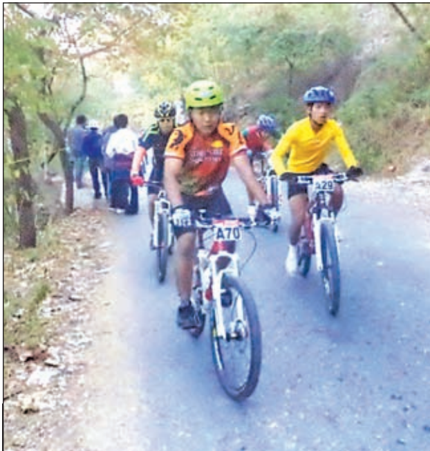
Cyclists taking part in first Mandalay Hill Biking Contest.