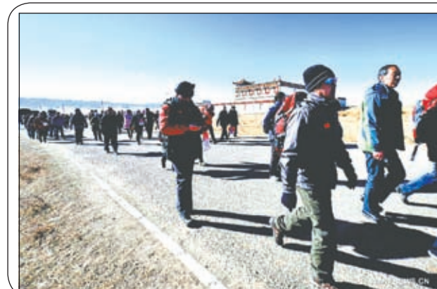
Hikers walk along Qinghai Lake, northwest China's Qinghai Province, on 1 Jan, 2013. Over 700 people attended a 13-kilometre hike along Qinghai Lake to celebrate the New Year and promote the ideal of low-carbon lifestyle.