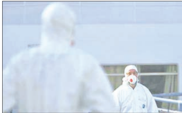
Paramedics dressed in protective attire walk in front of the ship, the Bellriva, in Wiesbaden on 8 Dec, 2012.

“In Australia the norovirus season also peaks during the winter, but this season it has gone on longer than usual and they