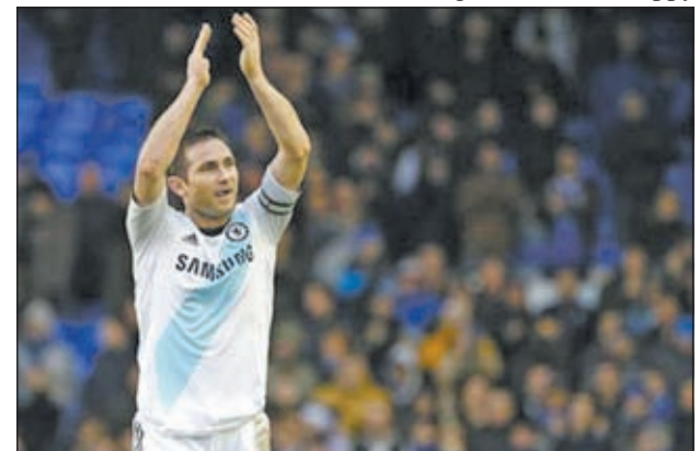
Chelsea’s Frank Lampard reacts after their English Premier League soccer match against Everton at Goodison Park in Liverpool, northern England on 30 Dec, 2012.

“That is all I can tell you for the minute and that is enough for me I am happy