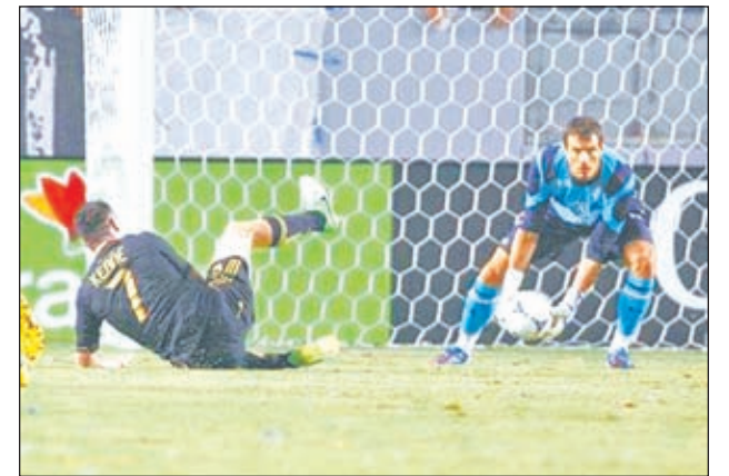
Tottenham Hotspur's goalkeeper Carlo Cudicini (R) makes a save on Los Angeles Galaxy's Robbie Keane (L) during the first half of an international friendly soccer match in Carson, California on 24 July, 2012.