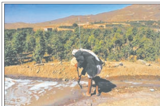
A Yemeni farmer stands in his Qat farm while he irrigates it on the outskirts of Sanaa, Yemen, on 1 Jan, 2013. Yemen is one of the most arid countries on the earth and relies almost exclusively on groundwater for its water supply. The amount of water used in agriculture in Yemen is currently about 91 percent with 40 percent for Qat shrub irrigation, mildly narcotic leaves that are commonly chewed by most of Yemenis.