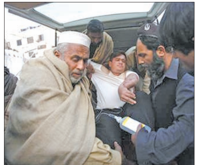
An injured driver (in white) who survived a shooting by unidentified gunmen in Swabi, arrives at the Lady Reading Hospital in Peshawar on 1 Jan, 2013.