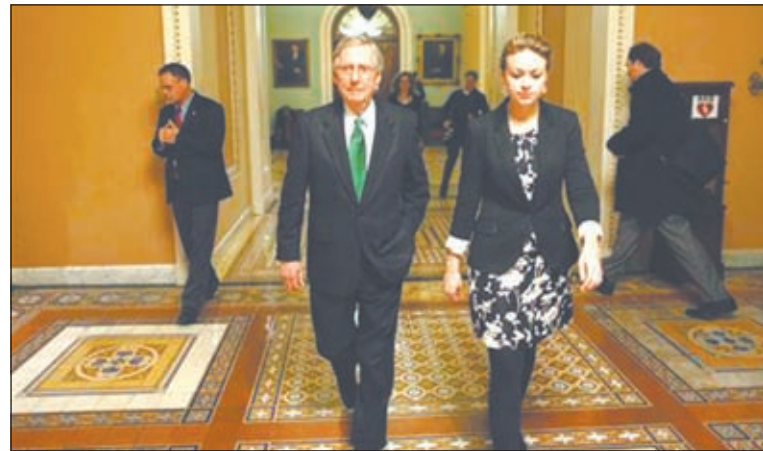
US Senate Minority Leader Mitch McConnell (C) departs the senate floor with an aide after a senate vote in the early morning hours at the US Capitol in Washington on 1 Jan, 2013.

That is in line with what many financial firms on