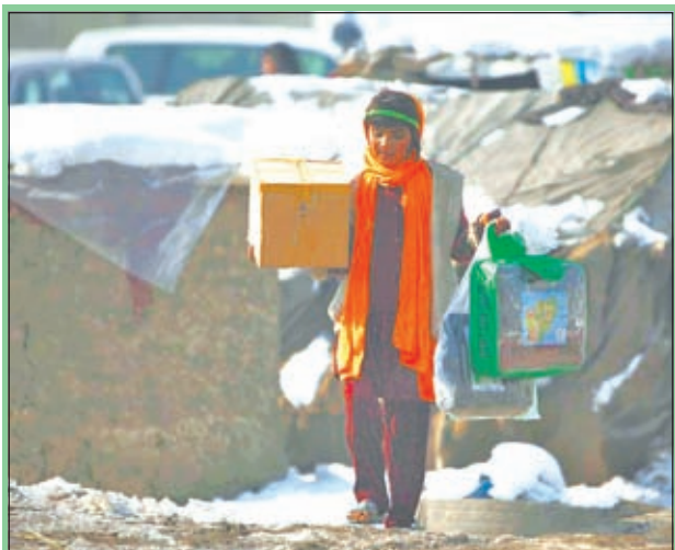
An Afghan refugee carries winter relief assistance donated by Japan government for refugee people in Kabul, Afghanistan on 1 Jan, 2013. Hundreds of refugee families received winter relief assistance on Tuesday.