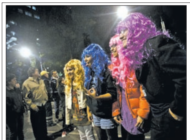
Citizens wait for the arrival of 2013 New Year at the Angel of Independence monument in Mexico City, capital of Mexico, on 31 Dec, 2012.