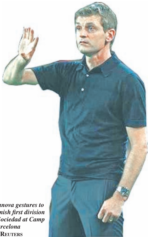
Barcelona's coach Tito Vilanova gestures to his players during their Spanish first division soccer match against Real Sociedad at Camp Nou stadium in Barcelona on 19 Aug, 2012.

"This afternoon I said farewell to the year playing a game of padel with a special person," Adria wrote. "Happy New Year to everyone!" Barca announced last month that Villanova needed a second round of surgery following an operation to remove a tumour from