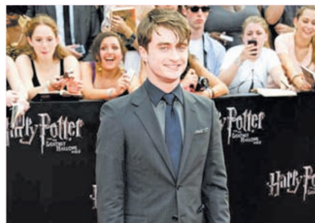
Harry Potter star Daniel Radcliffe

The film, from Eon Productions, is the 23rd installment in the iconic British spy franchise. Skyfall also stars Javier Bardem, Judi Dench and Ralph Fiennes.—PTI