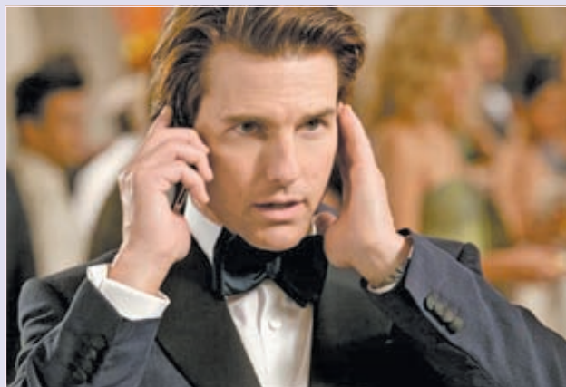
Superstar Tom Cruise