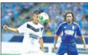
Neymar (L) of the Ronaldo and Friends team controls the ball next to Christian Karembeu of the Zidane and Friends team during their "Match against Poverty" charity soccer match in Porto Alegre on 19 Dec, 2012.

Recent Paris Saint-Germain acquisition Lucas was third, with Ronaldinho Gauchinho fourth and Fluminense's Fred fifth. The Santos striker continues to attract interest from the world's biggest clubs but has insisted that he will stay at his boyhood club until after the World Cup in 2014.