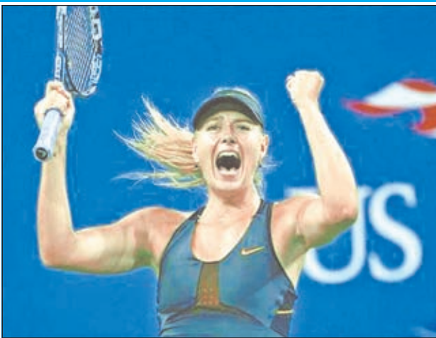
Maria Sharapova of Russia celebrates match point to defeat Nadia Petrova of Russia during their match at the US Open women's singles tennis tournament in New York, on 2 Sept, 2012.

"So I just kind of ran out of time here." While the season's first grand slam is set to start on 14 January, Sharapova was not overly concerned about her preparations. "I still have quite a bit of time to prepare for the Australian Open," she added. "I'm on the right track, been training really well, so I just don't want to jeopardise what I've gained in the off-season so far. "I just have to make a smart