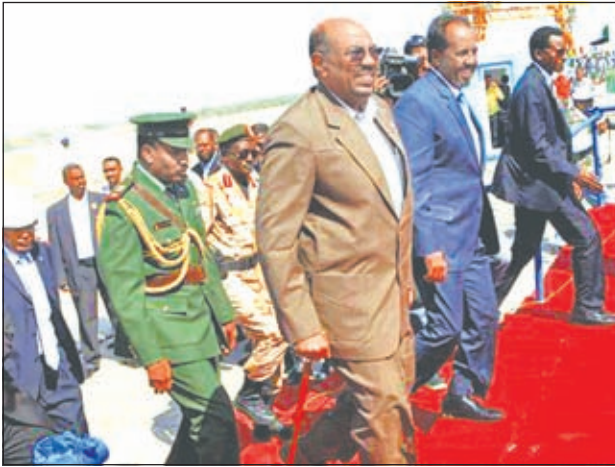
Sudan's President Omar Hassan al-Bashir (3rd R) arrives with Somali President Hassan Sheikh Mohamud (2nd R) to inaugurate the height increase of the Roseires Dam in Damazin, at the conflict-stricken Blue Nile state, on 1 Jan, 2013.

Neither country has yet withdrawn its respective army 10 km (six miles) from the border to set up a buffer zone, a condition to restart oil flows. Both accuse each other of supporting rebels on the other's territory. In a speech on New Year's Eve, Kiir said the new republic he leads was willing to withdraw its troops from the 1,800-km (1,200-mile) long border.