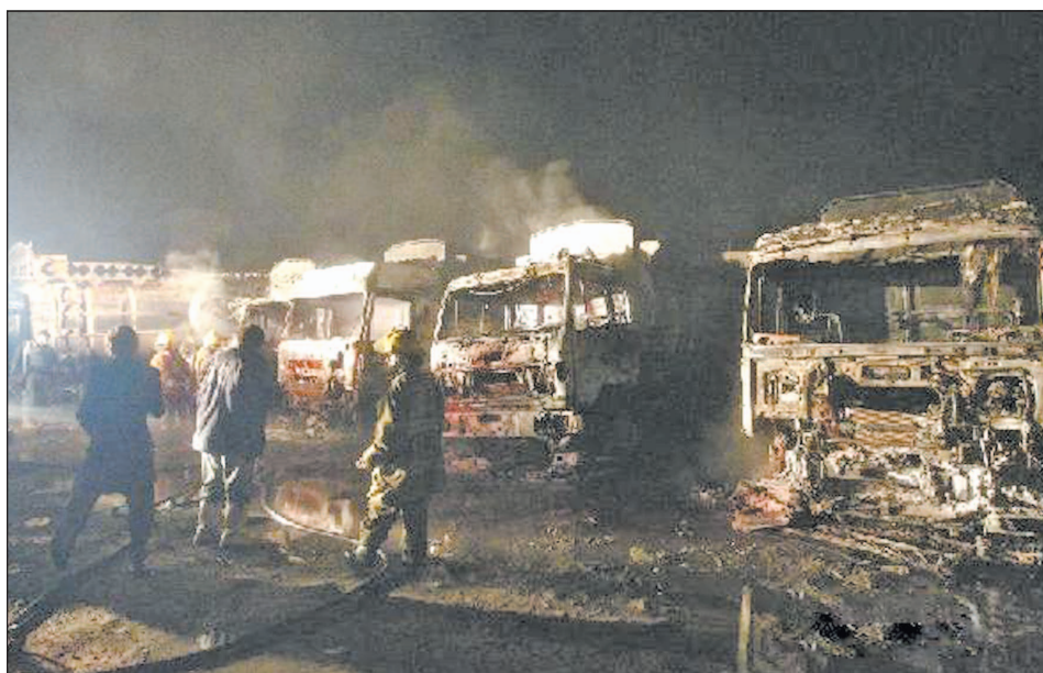
Firefighters work at the site where NATO oil tankers were burnt in the eastern Afghan Province of Nangarhar on 30 Dec, 2012. — XINHUA

Taliban has warned the civilians to stay away from official gatherings, military convoys and centres regarded as the legitimate targets by militants besides warning people against supporting government and foreign troops.—Xinhua