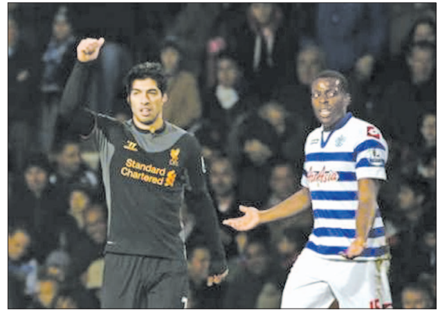
Liverpool's Luis Suarez (L) celebrates scoring a second goal as Queens Park Rangers Nedum Onuoha reacts during their English Premier League soccer match at Loftus Road in London on 30 Dec, 2012.

Club captain Steven Gerrard has long backed Suarez and after his two goals at Loftus Road, was fulsome in his praise. "He's