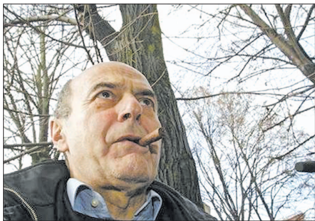
Democratic Party (PD) leader Pier Luigi Bersani arrives to cast his vote at a polling station in Piacenza, northern Italy on 2 Dec, 2012.