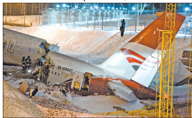
Rescue workers search at the crashed plane at Vnukovo Airport in Moscow, on 29 Dec, 2012.

government also said that it would offer necessary financial aid to the victims' families, with each family expected to receive one million rubles (32,000 US dollars) in cash.