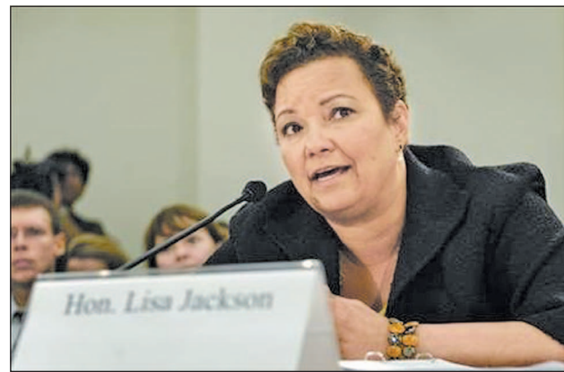
US Environmental Protection Agency Administrator Lisa Jackson testifies at a hearing of the House Subcommittee on Oversight and Investigations on Capitol Hill in Washington, on 22 Sept, 2011.