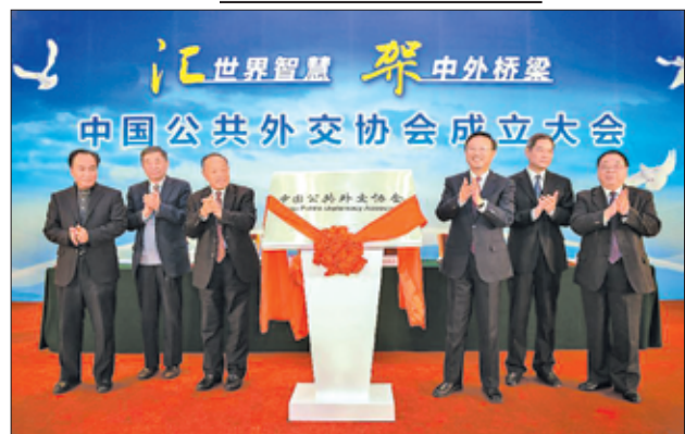
The unveiling ceremony of China Public Diplomacy Association is held at Diaoyutai State Guesthouse in Beijing, capital of China on 31 Dec, 2012.