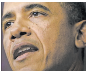
US President Barack Obama.

Influential anti-tax activist Grover Norquist predicted in an interview with Reuters that conservatives would wage repeated battles with President Barack Obama to demand budget savings every time the government needs a temporary funding bill or more borrowing capacity. The so-called "continuing resolutions" to which a divided Congress has increasingly resorted to keep the government operating, provide a "very