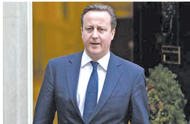
Prime Minister David Cameron leaves Downing Street in London on 19 Dec, 2012.

LONDON, 31 Dec—Prime Minister David Cameron's "odd-couple" speech on Britain's relations with the European Union, expected in the next