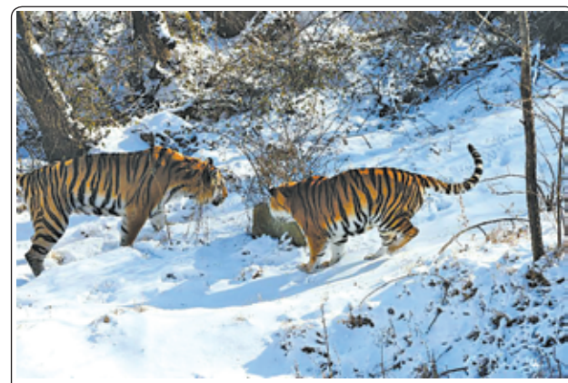
Siberian tigers tread on snow in Qingdao Forest Wildlife Park in Qingdao, east China's Shandong Province, on 30 Dec, 2012.