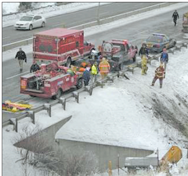
Rescue personnel respond to the scene of a charter bus crash on I-84, east of Pendleton, Oregon in this 30 Dec, 2012 handout photo.