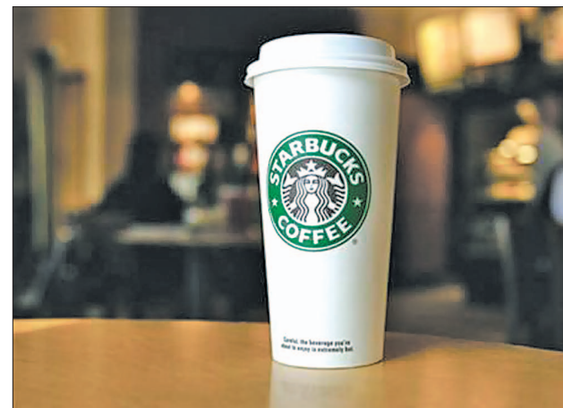
A cup displaying the Starbucks Coffee logo is pictured at one of the coffee chain's store in Boca Raton, Florida on 19 Jan, 2010.

"We believe the (Washington) DC effort caught on so swiftly because they Come Together