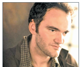
The 49-year-old will be awarded ahead of the European premiere of his new film Django Unchained in Italy next month.—PTI