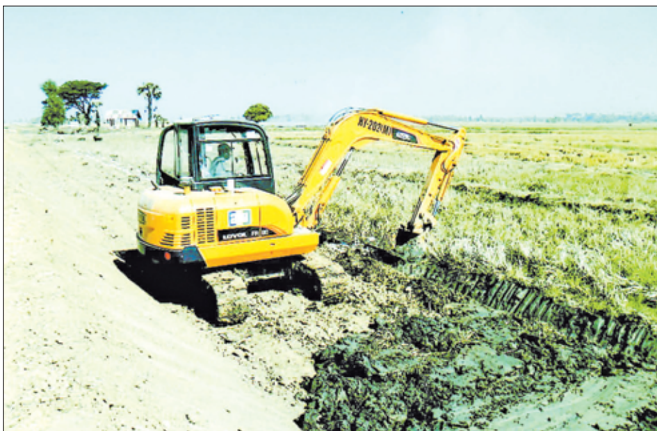
Land reclamation task in progress.

The government is making committed efforts for rural development and