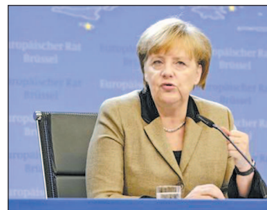
Germany’s Chancellor Angela Merkel holds a news conference at the end of a European Union leaders summit, in Brussels on 14 Dec, 2012.

Merkel, who is seeking a third term in an election in September, proudly pointed out that unemployment in Germany had fallen to its lowest levels since reunification