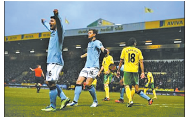
Manchester City's Edin Dzeko (C) celebrates after scoring his second goal against Norwich City during their English Premier League soccer match at Carrow Road in Norwich on 29 Dec, 2012.

“We won't leave this title easily and will fight every game. With 10 players the guys were fantastic. For us, now it is not important to look