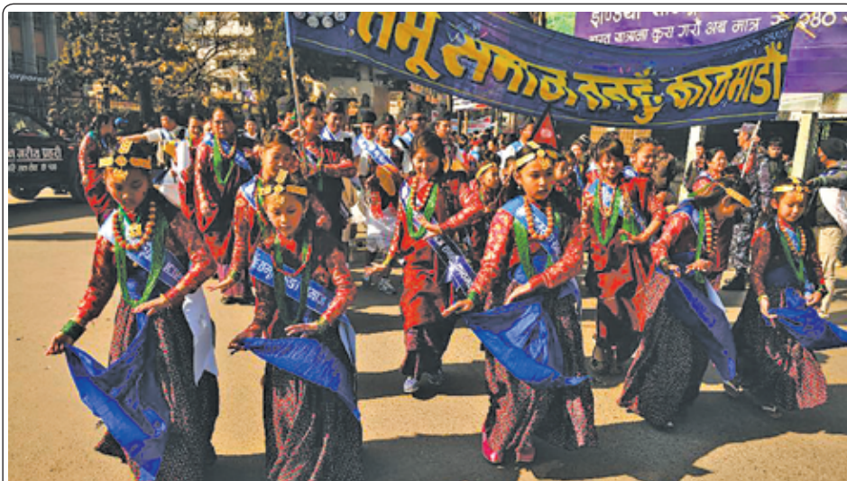
Nepalese Gurung girls wearing traditional costumes dance during the New Year parade of Tamu Losar in Kathmandu, Nepal, on 30 Dec, 2012. The indigenous Gurung community celebrates the year of the Snake during Tamu Losar (New Year) parade Sunday.

Getting married and moving overseas were low on the list for all but for the 18-29 age bracket, about a tenth of them had these as a priority. A clue to whether the goals will be achieved lies in another of the poll's findings — only 15 percent carried through their resolutions in 2012.