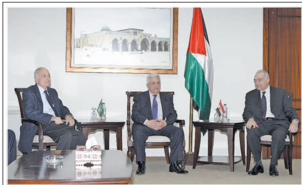
Palestinian President Mahmoud Abbas (C) meets with Arab League chief Nabil al-Arabi (L) and Egyptian Foreign Minister Mohammed Kamel Amr in Ramallah, on 29 Dec, 2012. Al-Arabi and Amr paid Saturday an official visit to the West Bank city of Ramallah, aiming at offering moral support to the Palestinian National Authority (PNA).

Nowhere is the divide more marked than over Europe, with the Conserva-