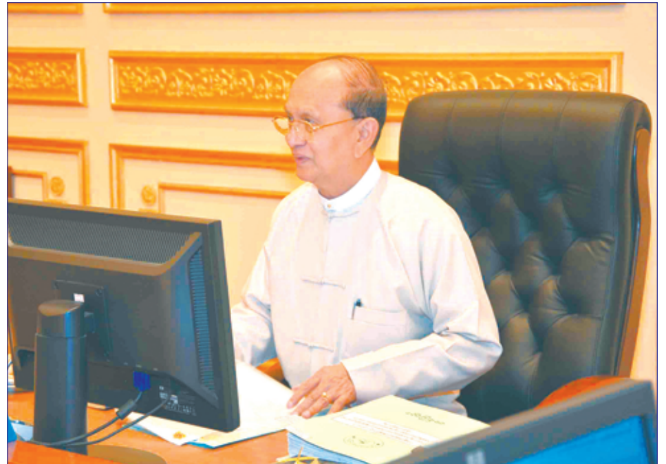
Chairman of Myanmar Financial Commission President U Thein Sein addresses the commission meeting (3/2012).

The President called on officials concerned to help develop profitable organizations which are contributing a lot to the State budget. Necessary measures should be taken for unprofitable organizations to be free from reliance on the State budget. It is necessary to invite local and foreign investments so that capital requirement of the country will be fulfilled. The President called for more effective public financial management system in the long run. The President