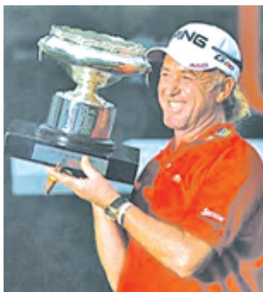
Miguel Angel Jimenez

Jimenez, who will be 49 on Saturday, was named European Tour golfer of the month in November after his victory at the Hong Kong Open made him the oldest winner in Tour history at 48 years and 318 days. A lover of fine wines and cigars and