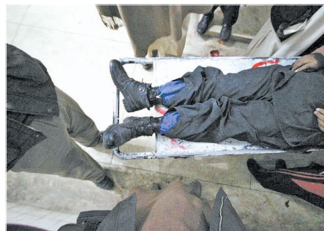
An injured policeman receives treatment at a hospital in southwest Pakistan's Quetta, on 29 Dec, 2012. At least three policemen were killed and one other injured on Saturday evening during a firing accident in Quetta, local media reported.

The Economic Community of Central African States (CEEAC) held a summit last week in the Chadian capital N'Djamena, urging the belligerent parties in the Central African Republic to immediately cease hostilities and open talks on a solution. CEEAC leaders demanded the Seleka coalition withdraw from the towns they had seized within a week.—Xinhua