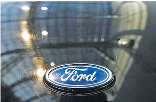
A logo of a Ford car is pictured during a press presentation prior to the Essen Motor Show in Essen on 30 Nov, 2012.

Earlier this year, Ford said it expected to lose market share in the United States because it could not build enough cars and