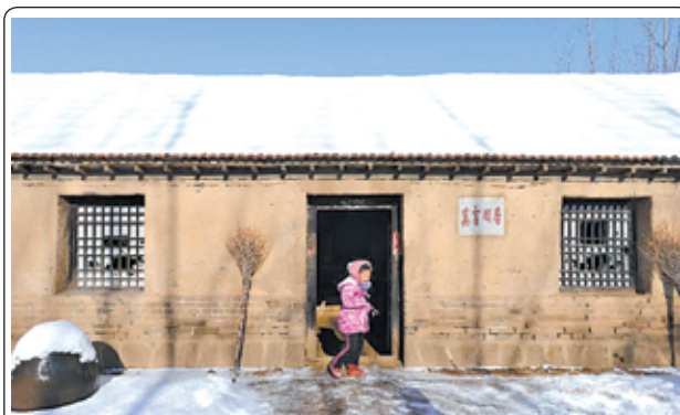
Photo taken on 30 Dec, 2012 shows the view of Mo Yan's former residence in Dalan Township of Gaomi City, east China's Shandong Province. Chinese novelist Mo Yan, winner of the 2012 Nobel Prize in Literature, once lived here since he was born in 1955 until he enlisted in the People's Liberation Army (PLA) in 1976.