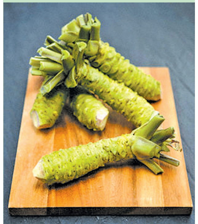
Supplied photo taken in May 2012 shows wasabi which has been grown by a farm in Dorset, England. It is thought the farm is the first commercial venture in Europe to produce wasabi.