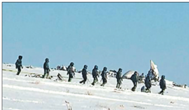
Still image from video shows security personnel walking past the remains of an Antonov An-72 military transport plane after it crashed near Shymkent on 26 Dec, 2012.

"Special commissions that are investigating will look into various possible causes. These can include weather conditions, the human factor or the plane's technical condition. Anything."—Reuters