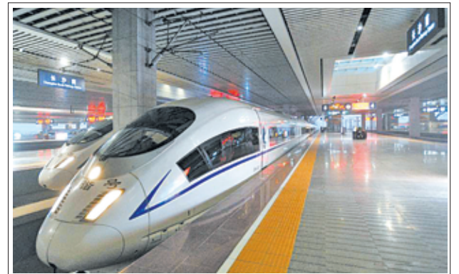
High-speed train G502 leaves the Changsha South Railway Station in Changsha, capital of central China's Hunan Province, on 26 Dec, 2012. The Changsha South Railway Station is one of the stops of the 2,298-kilometre Beijing-Guangzhou High-speed Railway, the world's longest, which was put into operation on Wednesday. Running at an average speed of 300 kilometres per hour, the high-speed railway will cut the travel time to about 8 hours from the current 20-odd hours by traditional lines between the country's capital and capital of south China's Guangdong Province.