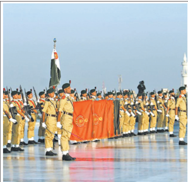
Pakistani cadets attend a ceremony on the 136th birth anniversary of Pakistan's founder Mohammad Ali Jinnah at his mausoleum in southern Pakistani Port City of Karachi on 25 Dec, 2012.