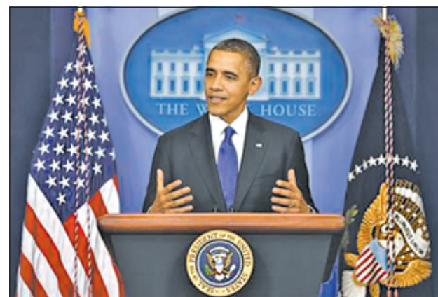
US President Barack Obama speaks about the fiscal cliff at the White House in Washington on 21 Dec, 2012.

But the "inauguration markup" still applies: The Mandarin's least expensive room, normally available for $295 a night, starts at