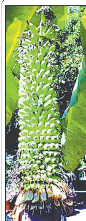
Photo shows a banana plant that bears more than 100 bunches of bananas in the compound of YwaU monastery in Wadawgyi village in Yedashe Township of Bago Region on 25 December.