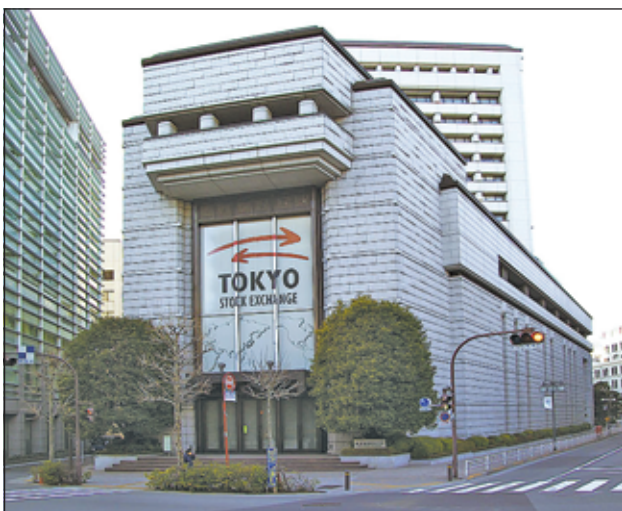
Photo shows the building of the Tokyo stock exchange.