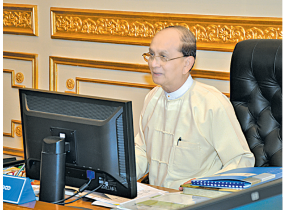
President U Thein Sein delivers an address at second day session of third Planning Commission Meeting.

Moreover, urbanization project must be implemented in parallel to ensure better living