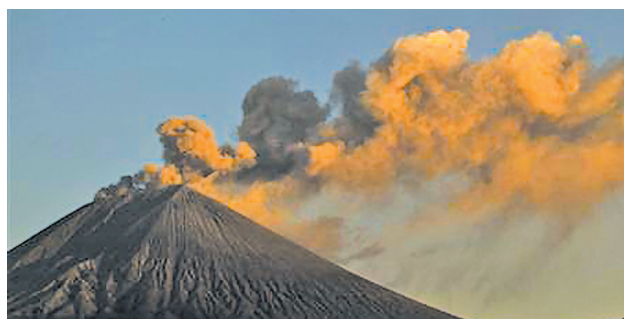
The San Cristobal volcano spews up large clouds of gas and ash near Chinandegga City, some 150 km (93 miles) north of the capital Managua on 26 Dec, 2012.

The latest activity began late on Tuesday. Government spokeswoman Rosario Murillo called on residents who live within a 1.9-mile (3-km) radius of the volcano