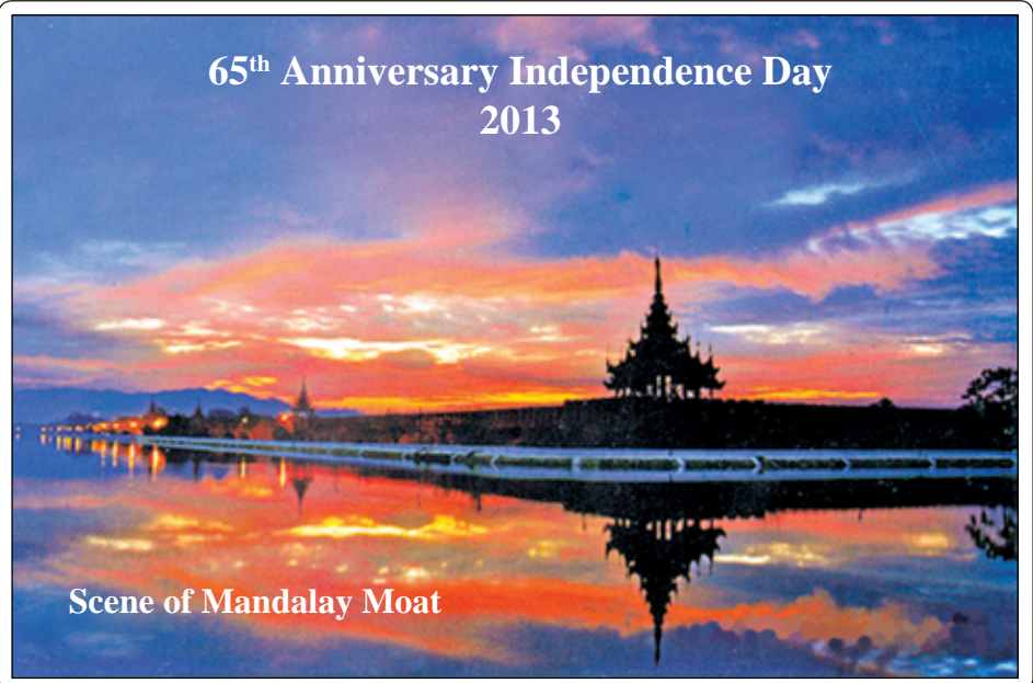
Scene of Mandalay Moat