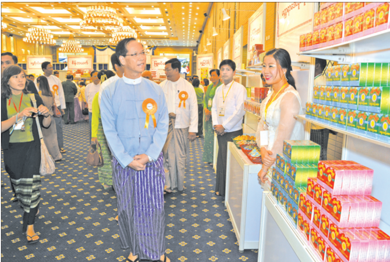
Vice-President Dr Sai Mauk Kham visits booths of Myanmar traditional medicines at Myanmar Traditional Medicine Practitioners' Conference.

NAY PYI TAW, 27 Dec— The opening of the 13 th Myanmar Traditional Medicine Practitioners' Conference was held at Myanmar International Convention Centre (MICC), here, this morning, with an address by Vice-President Dr Sai Mauk Kham.