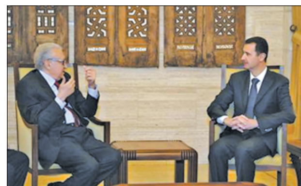
Syria's President Bashar al-Assad (R) meets International peace envoy for Syria Lakhdar Brahimi in Damascus on 24 Dec, 2012 in this handout photograph released by Syria's national news agency SANA.