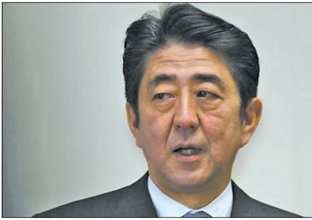
Shinzo Abe, Japan's incoming prime minister and the leader of Liberal Democratic Party (LDP), speaks during a meeting at the LDP headquarters in Tokyo on 20 Dec, 2012.

"I hope the BOJ pursues unconventional measures, including bold monetary easing," he added, maintaining pressure on the central bank