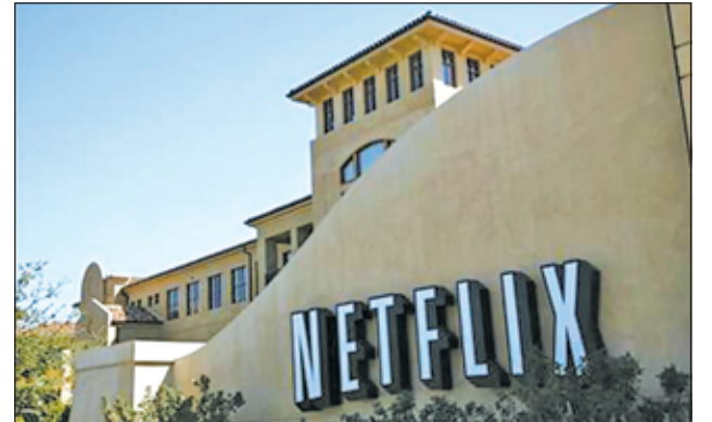
A sign is shown at the headquarters of Netflix in Los Gatos, California on 20 Sept, 2011.