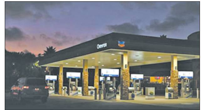
A Chevron gas station is pictured in Encinitas, California on 28 July, 2011.

Apache will then pay Chevron $150 million to raise its stake in the British Columbia project and associated lands to 50 percent,