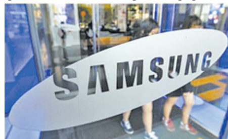
Students walk out of a showroom at the headquarters of Samsung Electronics in Seoul on 28 Oct, 2011.