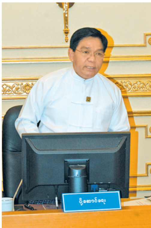
Union Minister for Transport U Nyan Tun Aung submits reports at third Planning Commission Meeting.