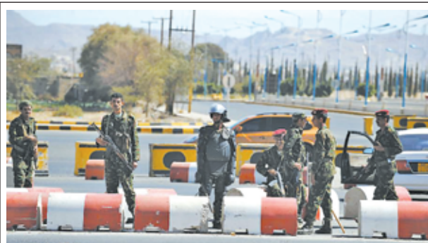
Yemeni soldiers close a road that leads to the presidential palace in Sanaa after two senior military officers were assassinated in the capital, on 25 Dec, 2012. Two senior army officials were assassinated Tuesday by suspected al-Qaeda gunmen in Yemeni capital Sanaa, an interior ministry official said.