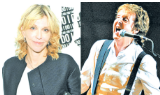
Love took to Facebook to criticise the recent performance.

NEW YORK, 26 Dec— Love has voiced her disapproval at the band's three surviving members'