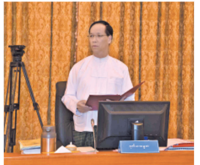
Vice-President Dr Sai Mauk Kham participates in discussion.

Nay Pyi Taw will host First Myanmar Development Cooperation Forum in third week of January, 2013.