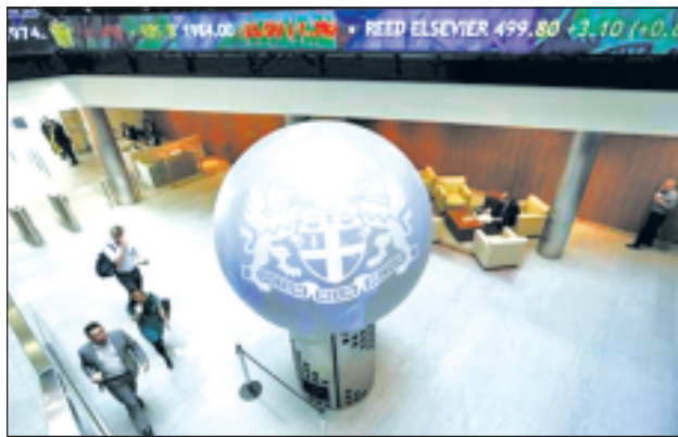
People walk through the lobby of the London Stock Exchange on 5 Aug, 2011.

"There are good reasons to be confident about the market in 2013," said Thornhill.