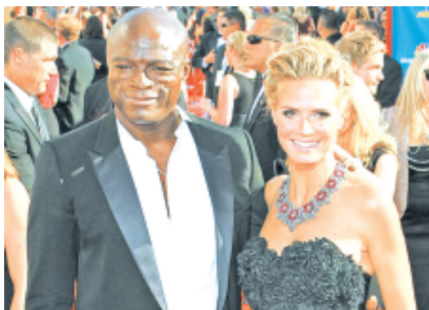
Heidi Klum and Seal announced their split in January

Charlie then makes her promise she won't drive, and Lindsay replies: "That's very sweet. You're worried about me behind the wheel." He then says: "I'm worried about me. I'm a pedestrian."—PTI