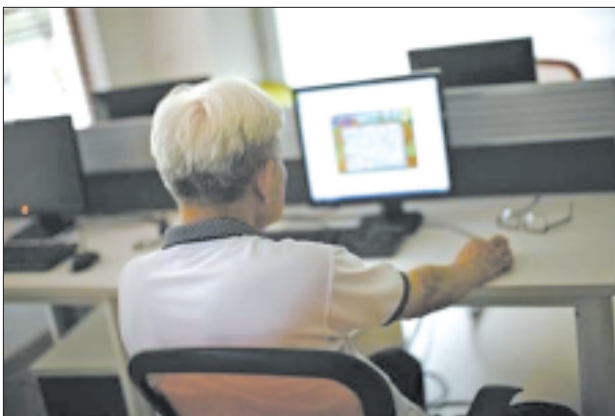
A man sits in front of a computer at a care centre in Shanghai on 14 Sept, 2012.

BEIJING, 27 Dec—China may require internet users to register with their real names when signing up to network providers, state media said on Tuesday, extending a policy already in force with microblogs in a bid to curb what officials call rumours