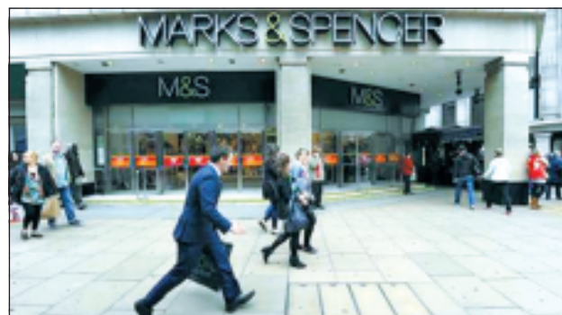
Pedestrians walk past the Marble Arch branch of Marks and Spencer in central London on 8 June, 2012.

Many British families' budgets are stretched, according to a survey from Markit that showed the biggest deterioration in household finances for seven months.—Reuters