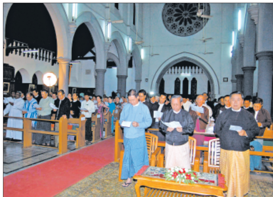
Union Minister for Religious Affairs Thura U Myint Maung, Union Minister at the President Office U Aung Min, Speaker of Yangon Region Hluttaw U Tin Aung, region ministers and responsible persons of Yangon Catholic Church and Myanmar Council of Churches attend Christmas Service and dinner.

YANGON, 26 Dec—“Despite religious diversity, peoples can live anyway together harmoniously and share the fruits of unity and peace if they only embrace mutual understanding and magnanimity setting aside the differences”, said Union Minister for Religious Affairs Thura U Myint Maung at Christmas Service