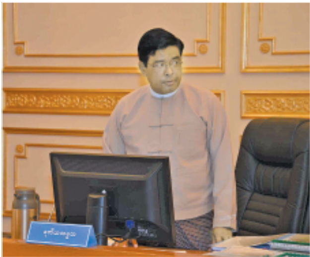
Vice-President U Nyan Tun participates in discussion.—MNA