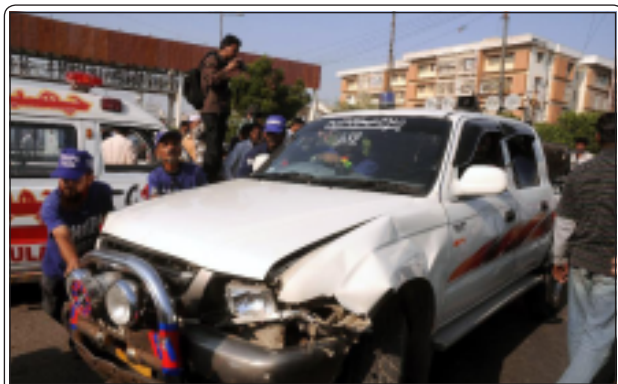
A damaged vehicle is seen at the attack site in southern Pakistani port city of Karachi on 25 Dec, 2012. At least 6 people including 4 policemen were killed and a local religious leader was injured when their vehicle was ambushed by unknown gunmen in Karachi on Tuesday, local police said.