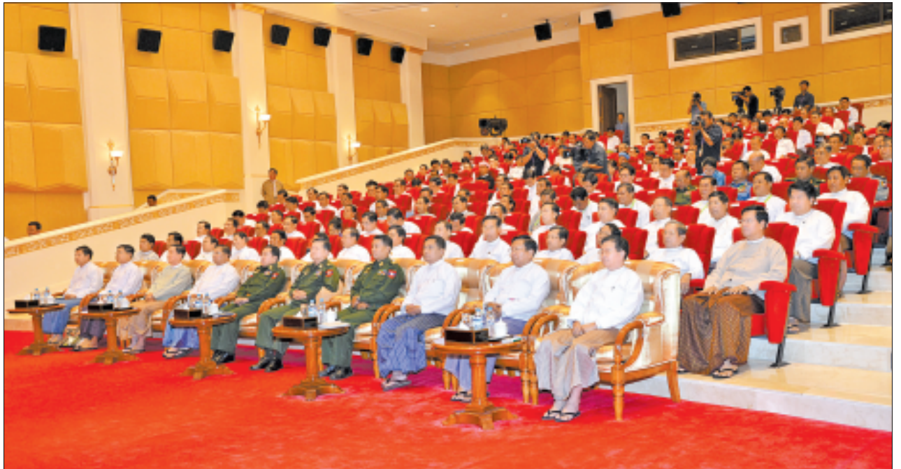
Union Ministers, officials of Union level organizations, authorities of Self-Administered Zone and Division and heads of department attending the ceremony on reforms to improve management and administrative capacity of the government.

performed in ways that will make the government more transparent, accountable, clean and effective. I also want to call on officials ranging from village administrators to union ministers to try to be good leaders whom the people can rely on. While undertaking political and