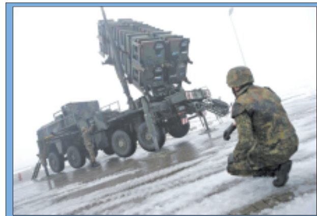
Photo shows the deployment of Patriot PAC-2 anti-missile units being conducted by German Defence Forces in Warbelow, Germany, on 18 Dec, 2012.