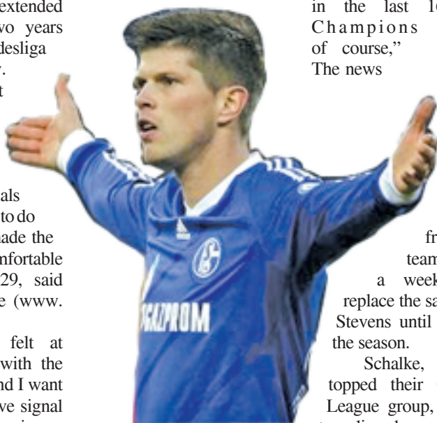
Klaas-Jan Huntelaar of Schalke 04 reacts after a failed chance against FSV Mainz 05 during their German DFB Cup (DFB Pokal) soccer match in Gelsenkirchen on 18 Dec, 2012.

team and I believe we can still achieve a great deal in the second half