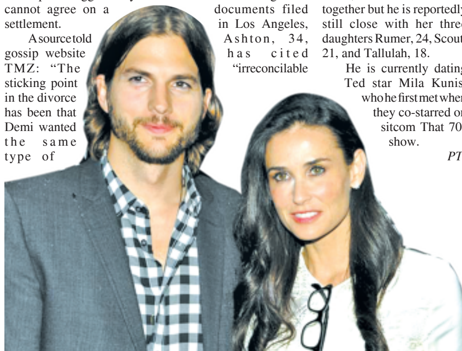
The divorce papers suggest that their property rights will be worked out later.