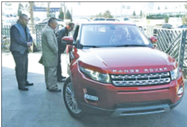
Customers look at a Range Rover Evoque car outside a dealership in Beijing on 17 Feb, 2012.

Jaguar Land Rover, the British luxury marque owned by India's Tata Motors (TAMO.NS), has relied on strong demand over the past