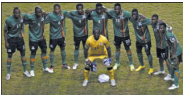
Zambia's soccer players pose for a photograph before their African Nations Cup final soccer match against Ivory Coast at the Stade De L'Amitie Stadium in Libreville on 12 Feb, 2012.