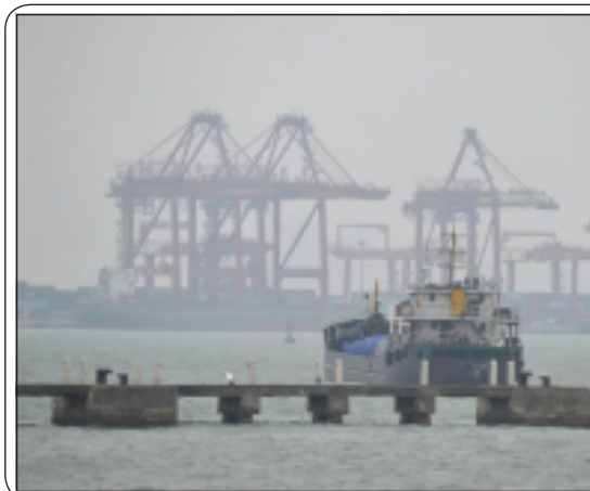
Boats anchor in the Xiuying harbor in Haikou, capital of south China's Hainan Province, on 26 Dec, 2012. The Hainan Weather Service issued a blue alert for strong gales at sea and a tropical storm warning on Wednesday. Tropical Storm Wukong, the 25th tropical storm this year, is estimated to move to the southern South China Sea from Wednesday night to Thursday morning. Hainan experienced a persistent rainfall due to Tropical Storm Wukong.