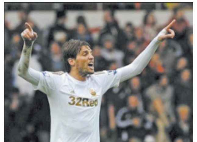
Swansea City's Michu celebrates scoring a goal during their English Premier League soccer match against Manchester United at the Liberty Stadium in Swansea, South Wales, on 23 Dec, 2012.