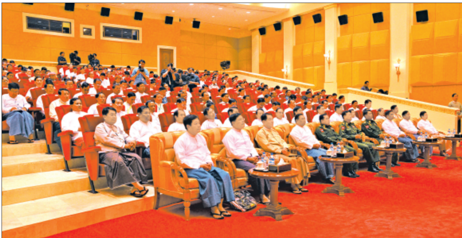
Union Ministers, officials of Union level organizations, Chairmen of Self-Administered division/zones and departmental heads at the meeting on reforms to improve the management and administrative capacity of the government.