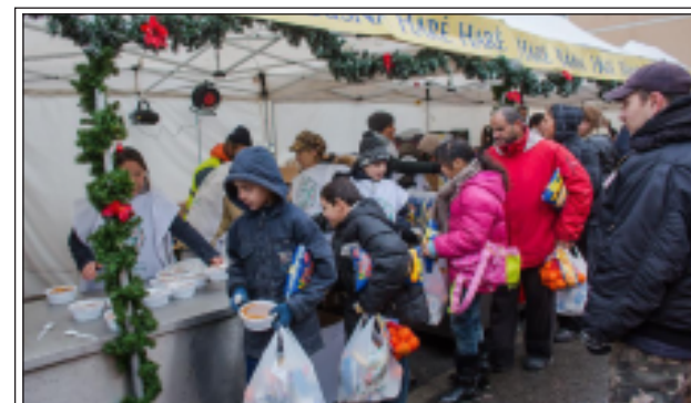
Krishna charity activists distribute free food to people in need in Budapest, Hungary, on 25 Dec, 2012.