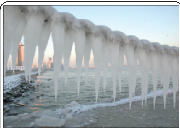
Photo taken on 24 Dec, 2012 shows the icicles by the sea in Yantai, a coastal city in east China's Shandong Province.— XINHUA

13 September. Earlier this month, Indian marine police ship, SAMRAT, anchored in Vietnam's southern Ho Chi Minh City for a five-day friendly visit.— Xinhua