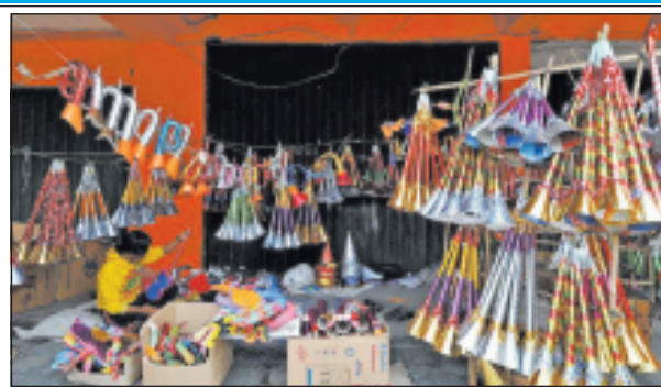
A street vendor makes paper trumpets for the New Year Eve celebrations in Jakarta, Indonesia, on 25 Dec, 2012. Many vendors come to Jakarta as seasonal sellers, trying their luck to sell paper trumpets during holiday season.

soon. The international envoy set foot in Syrian capital Damascus on Sunday to meet Syrian President Bashar al-Assad, government officials and representatives of opposition factions. On Monday, he met with Assad and discussed ways to end the crisis, including "the steps that I see could be undertaken to help the Syrian people to exit from this crisis."— Xinhua