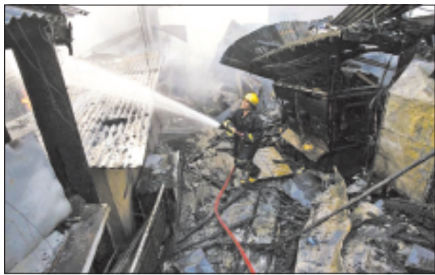
A firefighter tries to extinguish a fire that hit the slum area in San Juan City of Metro Manila, the Philippines, on 25 Dec, 2012. More than 500 houses were razed in the fire, leaving 2,000 families homeless.

MANILA, 26 Dec— At least six people were killed in two separate fires that razed residential areas in San Juan and Quezon Cities in Metro Manila of the Philippines on