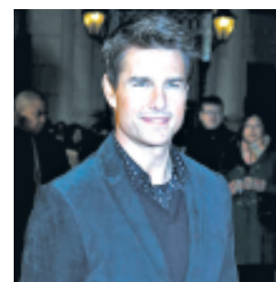
Tom will next be seen in Jack Reacher portraying the titular retired military policeman.

NEW DELHI, 26 Dec— Tom Cruise has wanted to be a movie star since he was four years old.