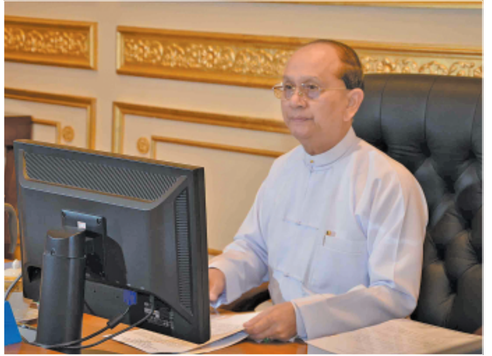
President U Thein Sein delivering speech at the meeting.

Vice-President Dr Sai Mauk Kham urged those present to establish public-private partnership without delay, demanding sale and lease of public enterprises which bear less or no profit.