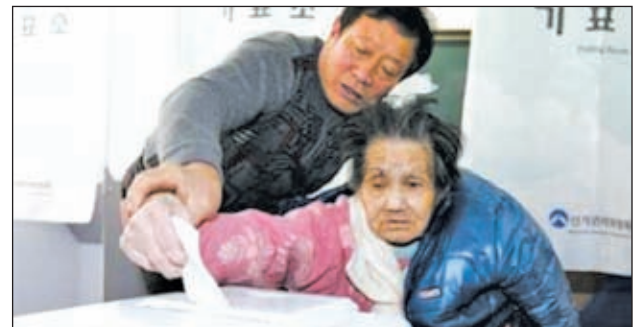
An elderly woman is assisted in casting her ballot in the presidential election at a polling station in Nonsan, about 190 km (118 miles) south of Seoul, on 19 December, 2012.