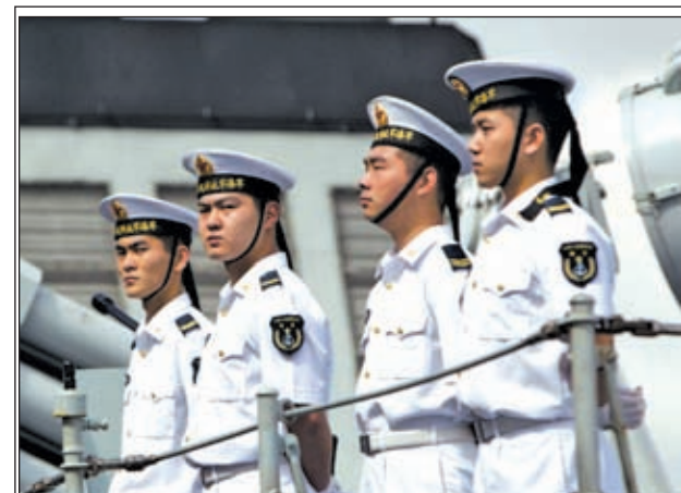
Soldiers stand on Yi Yang, one of the three visiting Chinese navy ships, upon their arrival in Sydney, Australia, on 18 Dec, 2012. Three Chinese navy ships returning home from counter-piracy operations in the Gulf of Aden have arrived in Sydney as part of a four day port visit, local media reported on Tuesday.