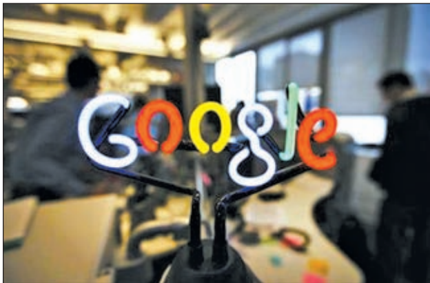
A neon Google logo is seen at the new Google office in Toronto, on 13 Nov, 2012.

WASHINGTON, 19 Dec—The Federal Trade Commission (FTC), which had been expected to wrap up an anti-trust probe into Google within days, will now delay its decision for weeks, a source said on Tuesday.