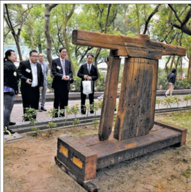
Visitors look at a sculpture created by Chinese artist Yang Xiaohua during a sculpture symposium in south China's Hong Kong, on 17 Dec, 2012.