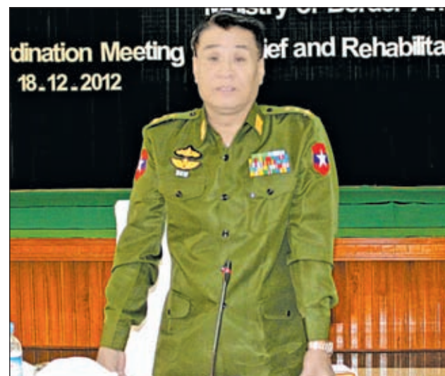
Union Minister Lt-Gen Thein Htay speaking at coordination meeting on Relief and Rehabilitation in Rakhine State.

would like to give advice on laying down the future long-term plans pertaining to education, health and water and sanitation and the livelihoods. At the same time, it needed to make arrangements for aids, rehabilitation, the end of conflicts and the regular running of livelihoods businesses. Those present presented the reports on the ongoing humanitarian