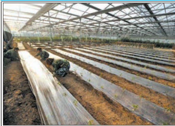
Villagers plant vegetables in a greenhouse in Jingadao Village of Changzhi County, north China's Shanxi Province, on 11 Dec, 2012. Jingadao Village of Changzhi County has formed a recycling economy. Villagers here use marsh gas as fuel after fermenting pig excrement, adopt clean sewage disposal system, produce natural fertilizer with animal excrement and plant green vegetables.