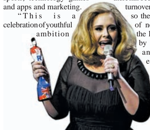
Adele speaks as she holds her award for best British female solo artist during the BRIT Music Awards at the O2 Arena in London on 21 Feb, 2012.