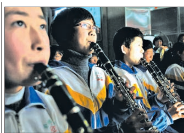
A band composing of students from Huishi Middle School rehearses for a performance in Lanzhou City, capital of northwest China's Gansu Province, on 17 Dec, 2012. The student band received an invitation letter from the art director of the Vienna Children's Choir, inviting them taking part in the Chinese Festival held in Austria in January, 2013.