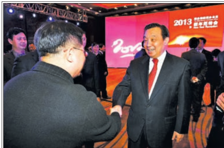
Wang Chen (C), director of China’s State Council Information Office, shakes hands with a guest during the New Year reception held by the China’s State Council Information Office in Beijing, capital of China, on 18 Dec, 2012.