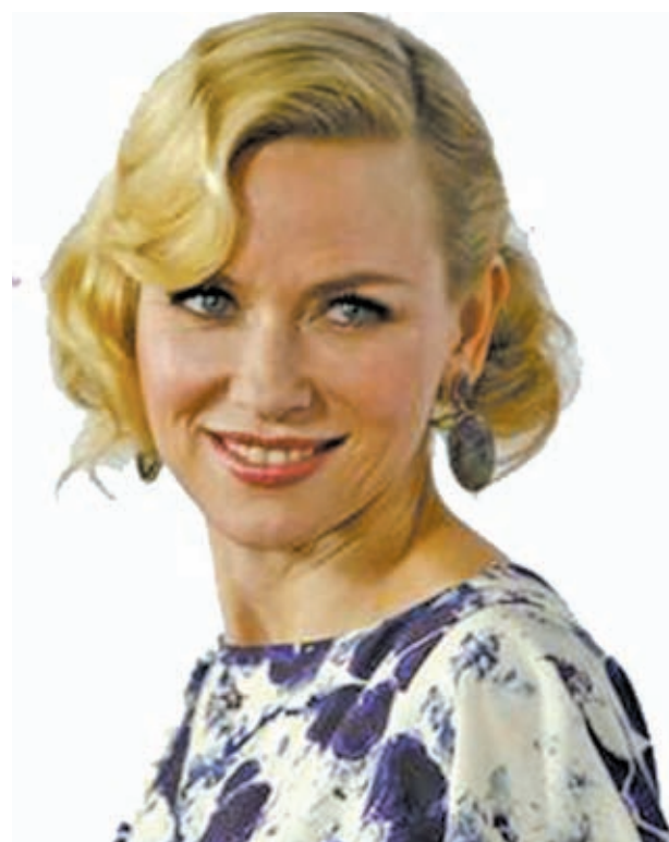
Actress Naomi Watts arrives at the premiere of the movie "The Impossible" at Arclight Cinema in Hollywood, California in this 10 December, 2012, file photo.

The British-born, Australian actress delivered, despite her fears. So far, her