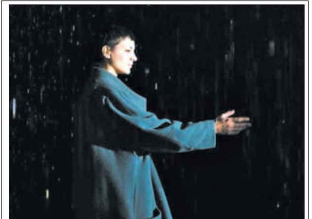
A lady experiences the "Rain Room" art installation by "Random International" in the Curve at the Barbican Centre in London, on 17 Dec, 2012. The "Rain Room" is a 100-square-metre field of falling water which visitors are invited to walk into, with sensors detecting and stops raining on the area where the visitors stand.

AQIM emerged in early 2007 from the Salafist Group for Preaching and Combat (GSPC), an Algerian armed Islamist movement. It currently operates in northwest Africa, including Algeria, Mali, Mauritania and Niger. A number of attacks were attributed to the group, including the triple suicide bomb attacks on 11 April, 2007, in Algiers, which claimed the lives of 20 people and injured 222 others, according to official figures.—Xinhua