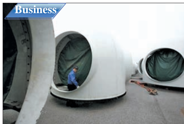
An employee works next to the shells of a wind turbine tower outside the assembly workshop of The Shanghai Electric Windpower Equipment Co, Ltd in Shanghai on 20 April, 2012.

The department also slapped final anti-dumping duties of 51.40 to 58.49