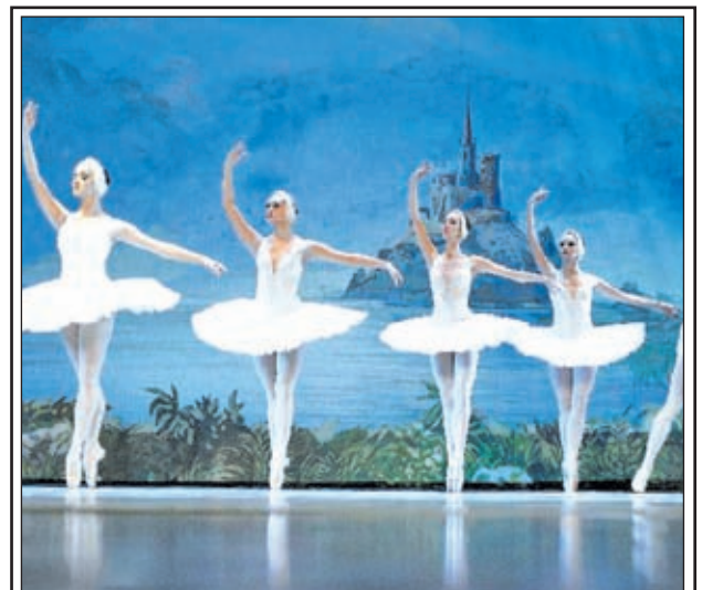
Performers from Saint Petersburg Ballet Theatre of Russia perform dance drama "Swan Lake" in Yinchuan City, capital of northwest China's Ningxia Hui Autonomous Region, on 18 Dec, 2012.