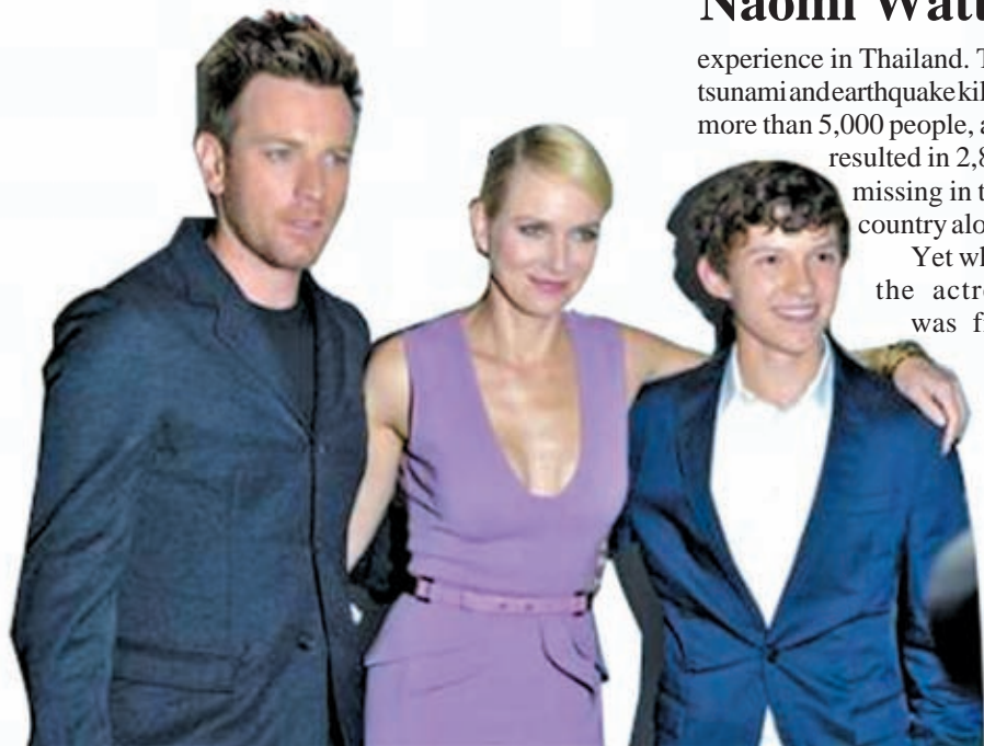
Cast members Ewan McGregor (L), Naomi Watts (C) and Tom Holland pose at the gala presentation for the film "The Impossible" at the 37th Toronto International Film Festival in this 9 Sept, 2012, file photo.

experience in Thailand. The tsunami and earthquake killed more than 5,000 people, and resulted in 2,800 missing in that country alone. Yet when the actress was first