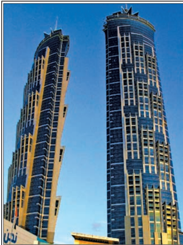
Photo taken on 17 Dec, 2012 shows the JW Marriott Marquis Hotel in Dubai, the United Arab Emirates (UAE). The Guinness World Records association acknowledged on Monday the recently opened 354.7-metre JW Marriott Marquis in Dubai as the world's tallest hotel.