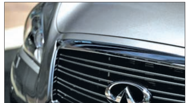
A logo of Infiniti, carmaker Nissan's luxury division, is displayed on an Infiniti car during the opening of the Nissan global head office in Hong Kong on 22 May, 2012.