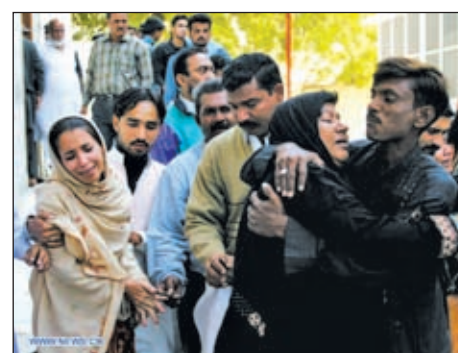
Relatives of killed polio vaccination workers mourns at a hospital in southern Pakistani port city of Karachi on 18 Dec, 2012.