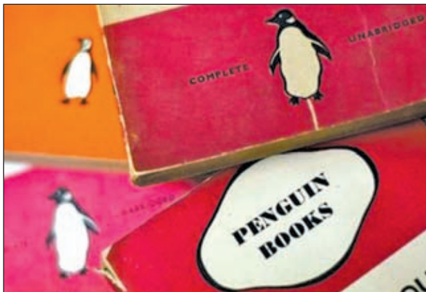
Penguin books are seen in a used bookshop in central London on 29 Oct, 2012.

Under the terms of the settlement announced on Tuesday, Penguin will drop any agreements with Apple and other ebook sellers that prevents price discounting. It will not be allowed to reinstate the deals for two years.