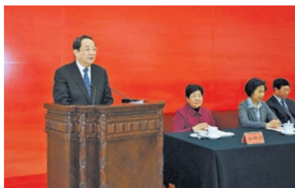
Yu Zhengsheng, a Standing Committee member of the Political Bureau of the Central Committee of the Communist Party of China, makes remarks on the opening ceremony of the 9th national congress of Taipei compatriots in Beijing, capital of China, on 17 Dec, 2012.—XINHUA