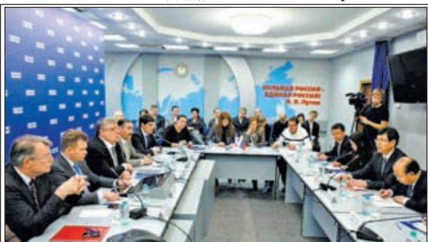
A specialist group of Chinese Communist Party (CPC) (R) promote the spirit of the 18th CPC National Congress in Moscow, Russia, on 17 Dec, 2012. The specialist group of Chinese Communist Party held meetings with the United Russia Party and Russian Communist Party here on Monday, publicizing the spirit of the 18th CPC National Congress.