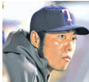
Texas Rangers relief pitcher Koji Uehara of Japan.

TOKYO, 19 Dec—Koji Uehara hopes his injury woes are a thing of the past so he can reward Major League Baseball's (MLB) Boston Red Sox for the faith they showed in him, the Japanese