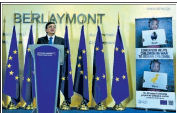
President of European Commission Jose Manuel Barroso addresses the opening ceremony of European Children of Peace initiative and the EU Nobel Peace Prize Exhibition at EU headquarters in Brussels, capital of Belgium, on 18 Dec, 2012. The European Commission has formally accepted the 2012 Nobel Peace Prize money on behalf of the European Union and decided to top up the approximate 930,000 to 2 million Euro as a fund for "EU Children of Peace" initiative, which supports projects for children exposed to the ravages of war and conflicts worldwide.

Mexico's new president, Enrique Pena Nieto, won election pledging to restore stability to the country, and on Monday he laid out his plans for reducing the violence.