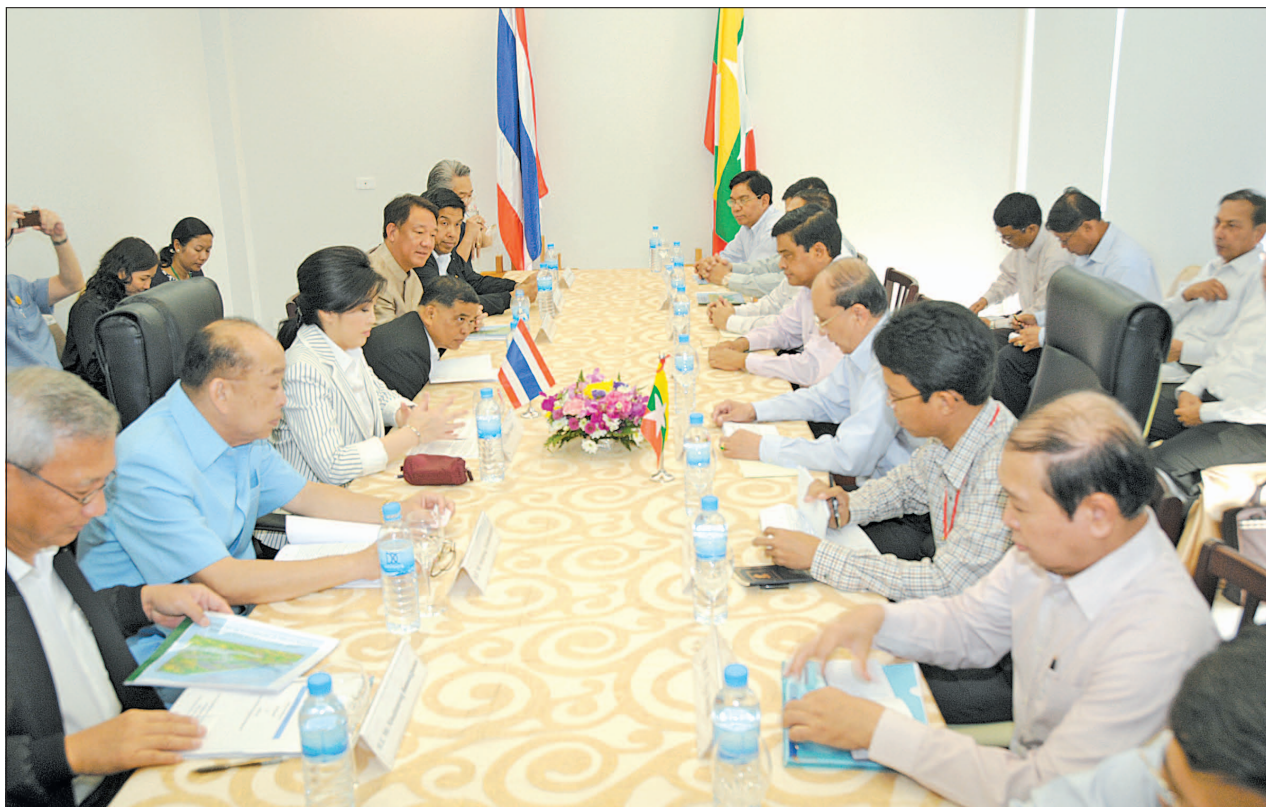
President U Thein Sein and party hold talks with Thai Prime Minister Ms Yingluck Shinawatra and party.