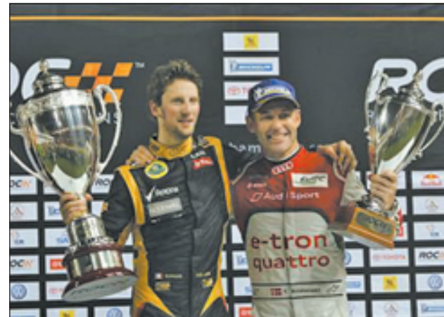
Driver Romain Grosjean (L) from Team France who won the Race of Champions (ROC) holds his trophy next to Tom Kristensen from Team All Stars, who came in second place, during the awards ceremony at the Rajamangala National Stadium in Bangkok on 16 Dec, 2012.

The annual event pits winners and champions from various motorsport series against each other over several rounds in identical machinery.