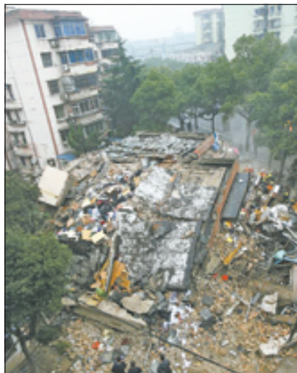
Photo taken on 16 Dec, 2012 shows a collapsed residential building in Ningbo, east China's Zhejiang Province.

NINGBO, 17 Dec—One another remained buried after a residential building in east