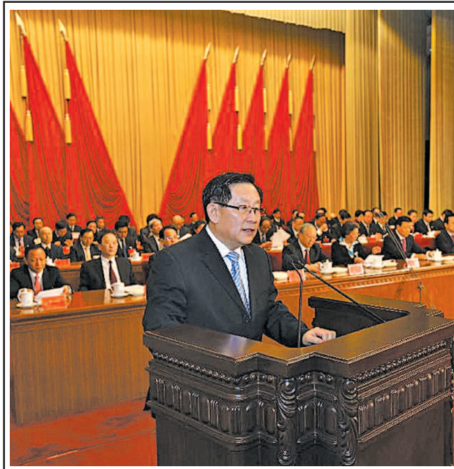
Wan Gang, vice chairman of the National Committee of the Chinese People's Political Consultative Conference and chairman of the China Zhi Gong Party, delivers a congratulatory speech on behalf of China's non-Communist political parties and the All-China Federation of Industry and Commerce at the opening ceremony of the 10th National Congress of the China National Democratic Construction Association (CNDCA) in Beijing, capital of China, on 16 Dec, 2012.