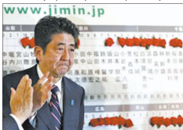
Japan's main opposition Liberal Democratic Party's (LDP) leader and former Prime Minister Shinzo Abe is applauded as he arrives at the LDP headquarters in Tokyo on 16 Dec, 2012.—XINHUA