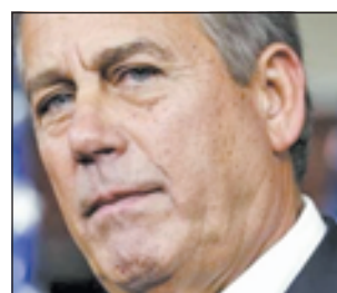
US House Speaker John Boehner (R-OH) listens to a question while speaking with reporters in the Capitol in Washington on 13 Dec, 2012.

Some lawmakers and congressional aides had