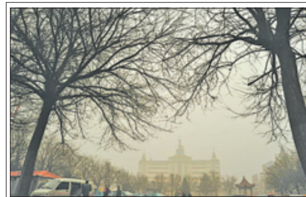
Photo taken on 16 Dec, 2012 shows the fog-enveloped Houma Railway Station in Houma City of Linfen, north China's Shanxi Province. A heavy fog hit Shanxi on Sunday.