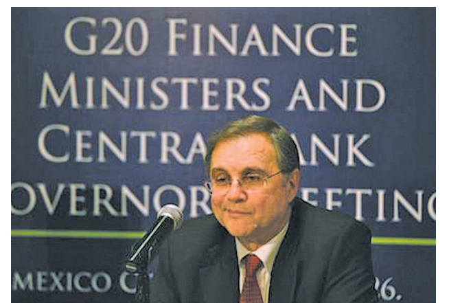
Bank of Italy Governor Ignazio Visco attends a news conference as part of Group of Twenty (G20) leading economies' finance ministers and central bankers in Mexico City on 26 Feb, 2012.