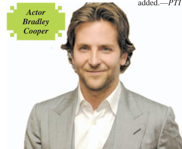
Actor Bradley Cooper

"He's been getting a cutting-edge hair-loss treatment and taking a battery of natural supplements — and he's only washing his hair every three days, with expensive organic shampoos," the source added.