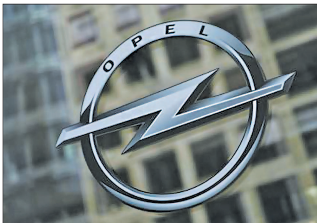
The logo of the Opel carmaker is seen at a showroom in central Berlin, on 3 June, 2010.—REUTERS

to boost Opel sales in China from 5,000 units a year now. "You can only be successful in China if you produce there. Plants in Europe aren't much help."—Reuters