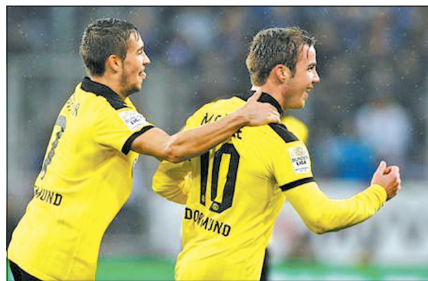
Borussia Dortmund's Mario Goetze (R) and his team mate Moritz Leitner celebrate Goetze's goal against Hoffenheim during their German first division Bundesliga soccer match in Sinsheim on 16 Dec, 2012.

Real have struggled to replicate their record-breaking performances from last year and have already dropped 15 points with three