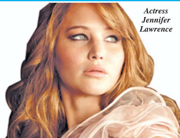
Actress Jennifer Lawrence