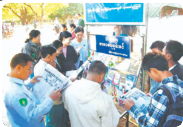
Visitors, readers and workers of bus lines reading at public service book corner opened on 3 December led by NyaungU District Information and Public Relations Department at Shwezigon bus terminal.