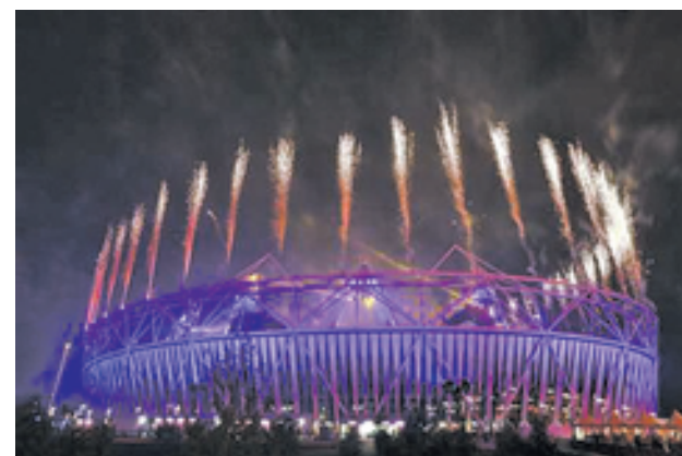
Fireworks explode over the Olympic Stadium during the closing ceremony of the London 2012 Paralympic Games on 9 Sept, 2012.

surprise and delight, British teams and athletes surpassed themselves across a range of sports, including third place in the Olympic medals' table behind the world's two great economic powers the United States and China.