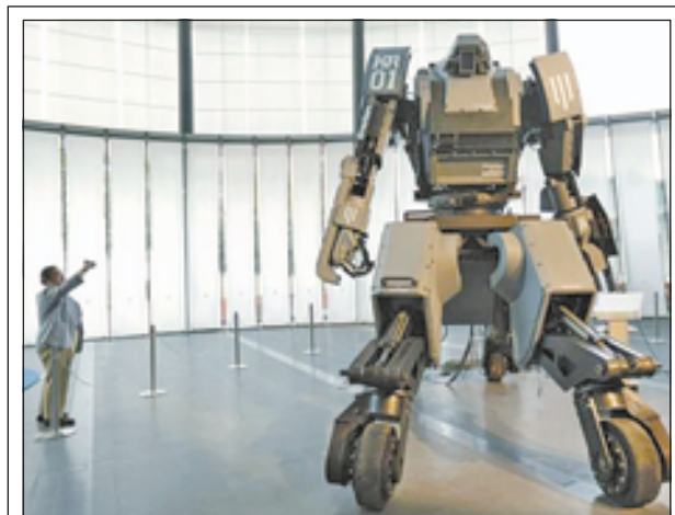
A man takes a picture of a giant 'Kuratas' robot at an exhibition in Tokyo, on 28 Nov, 2012.

The four-metre-high, limited edition, made-to-order robot is controlled through a pilot in its cockpit, or via a smartphone.