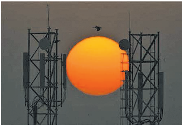
Sun rises over the telecommunication towers in New Delhi on 22 Dec, 2007.

NEW DELHI, 17 Dec—airwaves to be put on auction. The value of telecom in India in this fiscal year