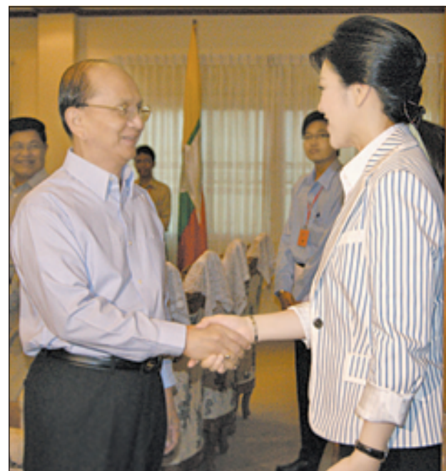
President U Thein Sein shakes hands with Prime Minister Ms Yingluck Shinawatra.—MNA

Thai Prime Minister Ms Yingluck Shinawatra and party were accompanied by the Thai ambassador to Myanmar.—MNA