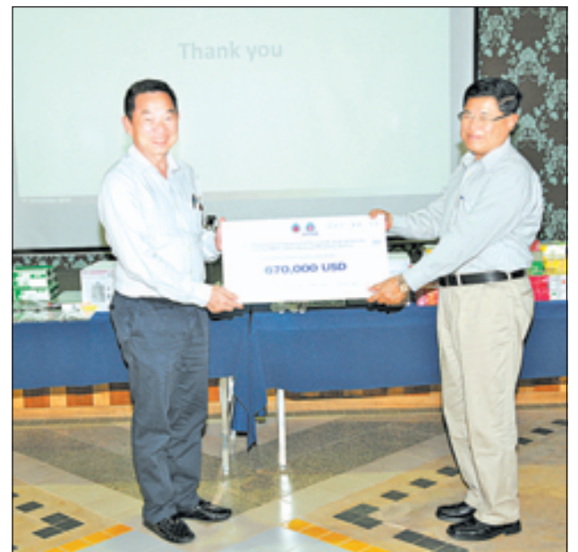
Union Minister U Soe Thein accepts cash donations.—MNA

Next, the President arrived back Dawei by helicopter.—MNA