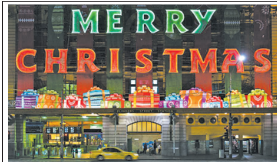
A taxi drives past the Flinders Street Station in Melbourne, Australia, on 16 Dec, 2012. Christmas Decorations are installed across the city of Melbourne to celebrate the upcoming Christmas Festival.