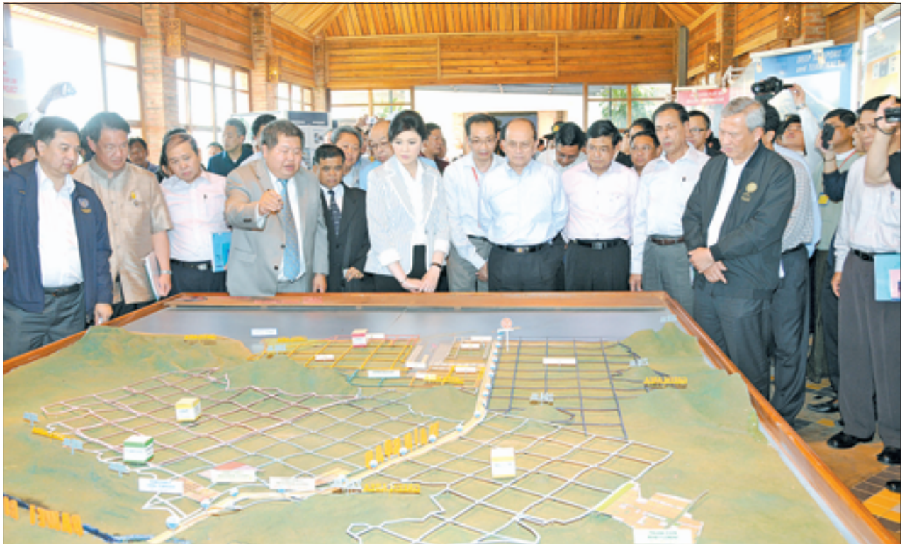
President U Thein Sein, Thai Prime Minister Ms Yingluck Shinawatra and party view scale model of Dawei Special Economic Zone Project and its related areas.

The investment of a third country must be invited in the areas as the two countries could not implement it, he said. He tipped Japan as the