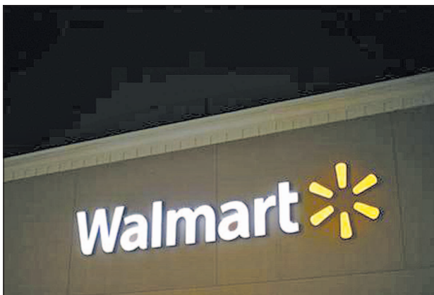
A view shows the Walmart logo at an opened Walmart store on Thanksgiving day in North Bergen, New Jersey on 22 Nov, 2012.

SAN FRANCISCO, 17 Dec—Wal-Mart Stores Inc said on Friday that it began selling Apple Inc's flagship iPhone 5 smartphone at a big discount in thousands of its stores.