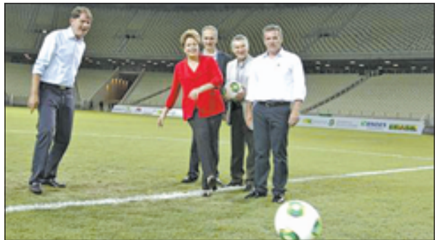
Brazil's President Dilma Rousseff (in red) kicks a soccer ball during the inauguration of the Arena Castalao in Fortaleza on 16 Dec, 2012.

opened on 21 December, they are the only stadiums to meet the December 2012 deadline set originally for next year's Confederations Cup, a World Cup finals dress rehearsal.