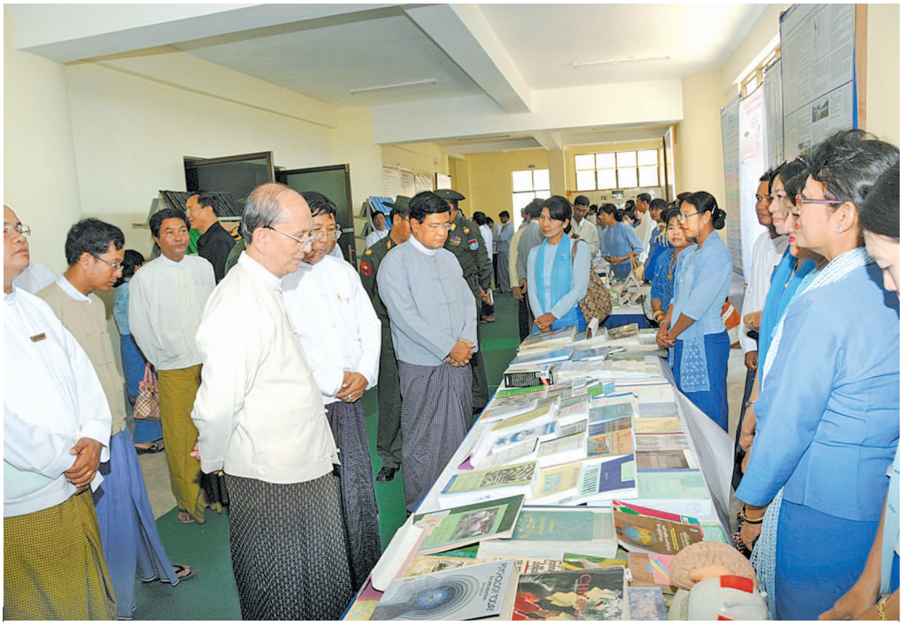
President U Thein Sein views subject-wise theses and reference books displayed at Dawei University.