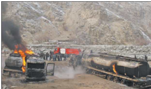
Smokes rise from burned oil tankers in Baghlan Province in the north of Afghanistan on 16 Dec, 2012.