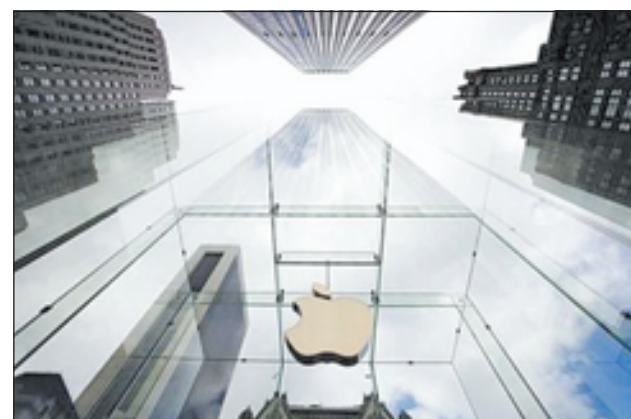
The Apple logo hangs in a glass enclosure above the 5th Ave Apple Store in New York, on 20 Sept, 2012.