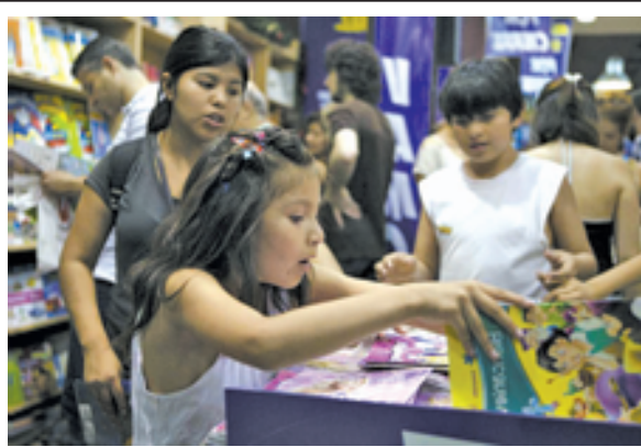
Residents visit a bookstore during the 6th Night of the Libraries event, in Buenos Aires, capital of Argentina, on 15 Dec, 2012. During the event, the city's most emblematic bars and libraries are open to the public, offering many cultural activities.