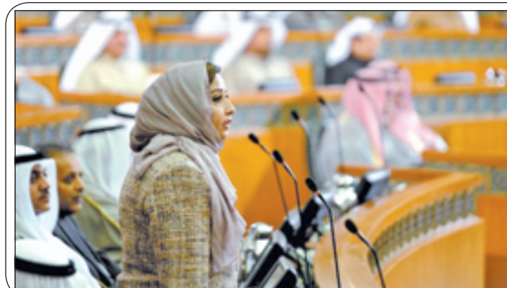
Kuwaiti Minister of Social Affairs and Labour Thekra al-Rashidi speaks at the opening of the 14th session of National Assembly (Parliament) in Kuwait City, Kuwait, on 16 Dec, 2012.

Although the White House has not accepted Boehner’s gambit, it could push negotiations away from entrenched, ideological positions.—Reuters