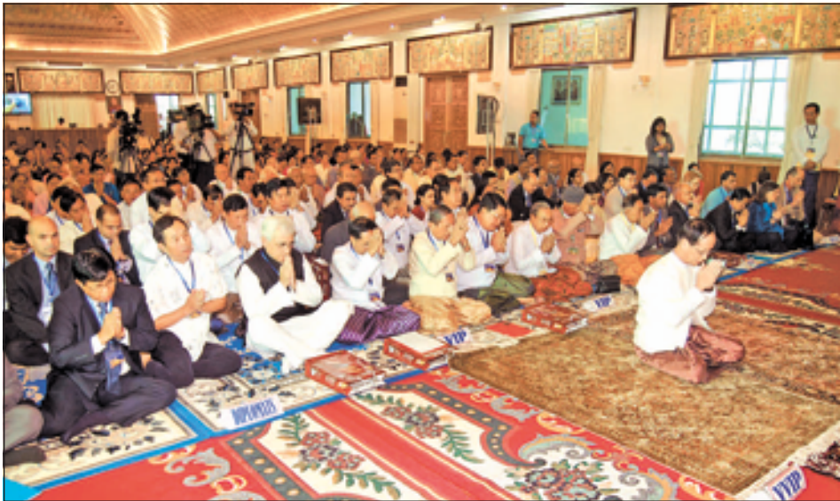
Vice-President Dr Sai Mauk Kham supplicates on religious affairs at International Seminar on Buddhist Cultural Heritage to members of the Sangha.

(from page 16) The Vice-President said he believed that it would be great help for the friendly relationship between the two countries. In the 6 th Century BC, the noble instructions and timeless teachings of the Buddha manifested itself in India