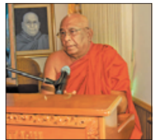
Sitagu Sayadaw Dr. Ashin Ñanissara.