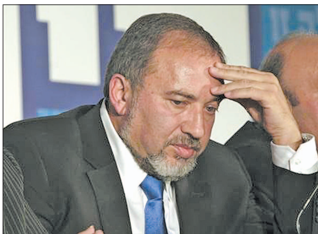
Israel's Foreign Minister Avigdor Lieberman is seen during a convention of his Yisrael Beiteinu party in Jerusalem, in this 13 April, 2011 file picture.

JERUSALEM, 15 Dec—Israeli Foreign Minister Avigdor Lieberman resigned on Friday after being charged with fraud and breach of trust, a move that could impact on January's election which his party, merged with Prime Minister Benjamin Netanyahu's Likud, was tipped to win.