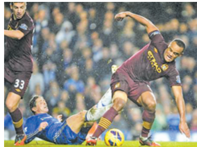
Manchester City’s Vincent Kompany (R) challenges Chelsea’s Fernando Torres during their English Premier League soccer match at Stamford Bridge stadium in London on 25 Nov, 2012.

“I would definitely say we need action on prevention but keep treating fans as human beings and not animals that have to be behind cages,” Kompany, who was taken off injured during the match and is unlikely to play against Newcastle United on Saturday, told the BBC in an interview to be shown on the Football Focus programme. “I do think we should take action against these incidents and I have heard a lot of suggestions about putting up nets and everything.”