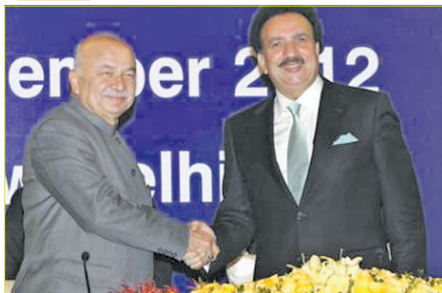
Indian Home Minister Sushil Kumar Shinde (L) shakes hands with Pakistan's Interior Minister Rehman Malik before their bilateral meeting in New Delhi on 14 Dec, 2012.

NEW DELHI, 15 Dec—India and Pakistan sealed an agreement to ease tough visa restrictions for travellers on Friday as the nuclear-armed neighbours move slowly to rebuild relations that soured in 2008 when Pakistani militants attacked India's financial capital.