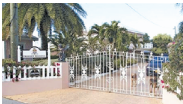
The entrance to the home of Cayman Islands Premier McKeeva Bush after investigators searched inside for evidence of economic crimes, in Georgetown on 11 Dec, 2012.

GEORGE TOWN, 15 Dec—Embattled Cayman Islands Premier McKeeva Bush faced growing pressure to resign on Friday after his arrest on suspicion of theft and corruption in the offshore Caribbean financial centre. A defiant Bush, who has blamed his troubles on the governor of the British overseas territory, has said since his detention that he did nothing wrong and has no plans to step