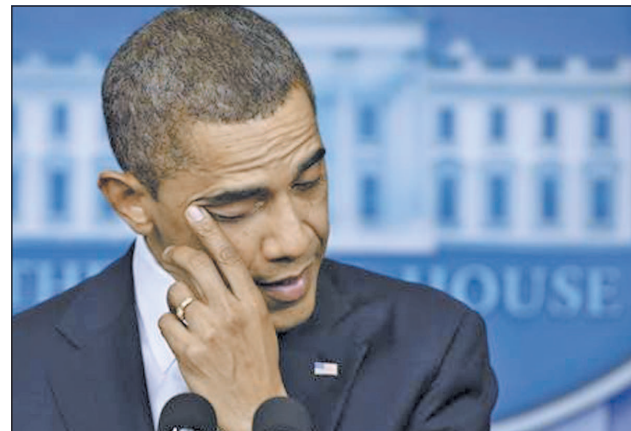
US President Barack Obama wipes a tear as he speaks about the shooting at Sandy Hook Elementary School in Newtown, Connecticut, during a Press briefing at the White House in Washington on 14 Dec, 2012.

"Our hearts are broken for the parents of the survivors as well, for as blessed as they are to have their children home tonight, they know that their children's innocence has been torn away from them too early and there are no words that will ease their pain," he said.— Reuters