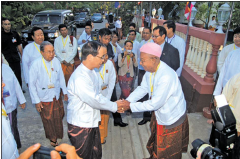
Vice-President Dr Sai Mauk Kham greets attendees to International Seminar on Buddhist Cultural Heritage.—MNA

Then, paper reading session followed. The paper reading session will continue till 17 December.—MNA