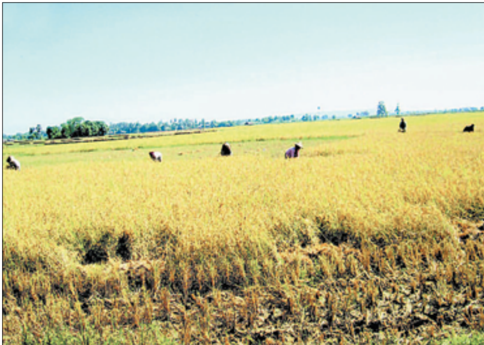
Photo shows a 900-acre Hsinthwelat, Hsin Thukha and Yezin (special) paddy plantation which is being harvested by farmers near Chanthagyi, Chinsu and Thayarkon villages of Sipaing village-tract in Lewe Township of Nay Pyi Taw Council Area recently.