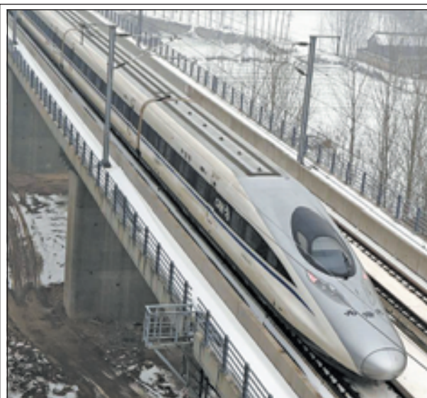
A high-speed train runs on a bridge during its trial trip from Zhengzhou, capital of central China's Henan Province to Beijing, capital of China, on 14 Dec, 2012. China is set to open the world's longest high-speed railway on 26 Dec, linking Beijing and the southern economic centre of Guangzhou, the Ministry of Railways (MOR) announced on Friday.

There has been a string of attacks by Al-Shabaab militants and their sympathizers since Kenya sent troops into Somalia on October 2011 to subdue the insurgents who were blamed for a series of murders and kidnappings on the Kenya soil with Daadab District which hosts the refugee camps being one of the worst hit by the attacks.