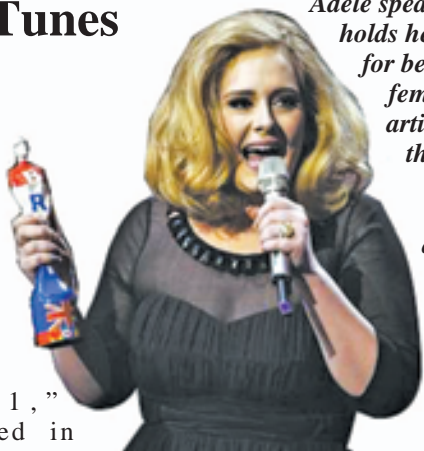
Adele speaks as she holds her award for best British female solo artist during the BRIT Music Awards at the O2 Arena in London on 21 Feb, 2012.

"21," released in February 2011, has performed strongly in the US music charts this year following the singer's