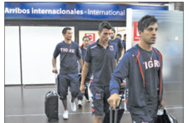
Players of Argentina's soccer team Tigre arrive at the Ministro Pistarini International Airport in Ezeiza, Buenos Aires, capital of Argentina, on 13 Dec, 2012.

Clarín described the episode as "Tigre's nightmare", citing allegations