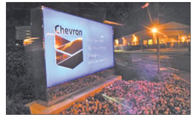
A lit sign at Chevron's oil refinery in Richmond, California is seen through a window after a large fire erupted earlier in the evening on 6 Aug, 2012.