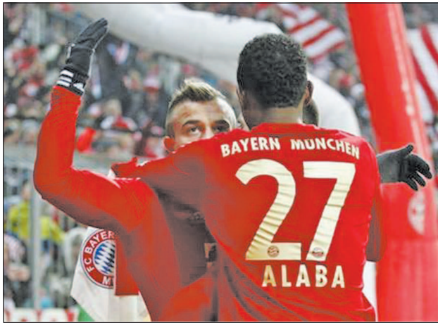
Bayern Munich's Xherdan Shaqiri (L) celebrates with David Alaba after scoring a goal during their German Bundesliga first division soccer match in Munich on 14 Dec, 2012.

BERLIN, 15 Dec—Substitute Xherdan Shaqiri's first Bundesliga goal for Bayern Munich rescued a 1-1 home draw for the runaway leaders on Friday after Borussia Mönchengladbach had taken a surprise first-half lead.