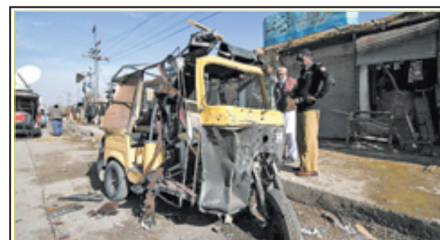
A policeman inspects a destroyed auto rickshaw at the blast site in southwest Pakistan's Quetta, on 14 Dec, 2012. At least eight people including a security officer were injured in a bomb blast at Sariab Road near girls collage in Quetta on Friday, local media reported.