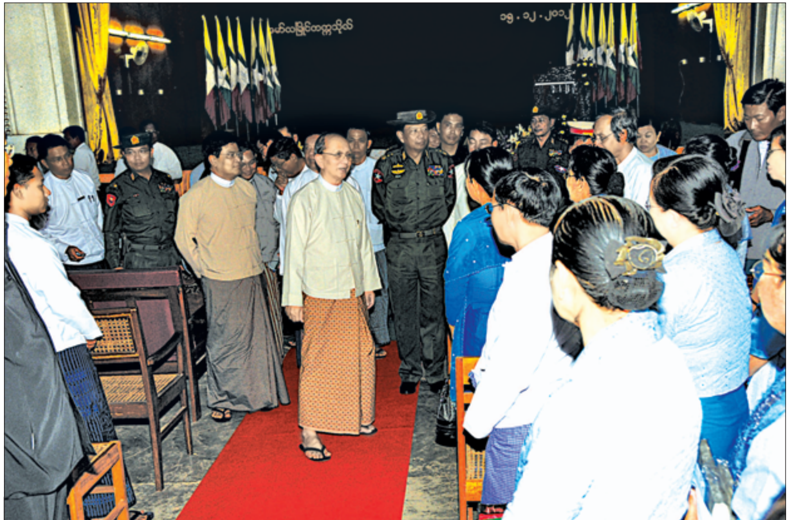
President U Thein Sein meets faculty members and students of Mawlamyine University.—MNA

that Myanmar lagged behind in development though the country sits on natural resources including forests, minerals, aquatic and terrestrial resources.