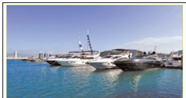
Photo taken on 14 Dec, 2012 shows yachts displayed at Sanya International Boat Show in Sanya, south China's Hainan Province. The show, which kicked off on Friday, will last until on 17 Dec.

Malaysia sent its first batch of aid including food, milk, and tents on 7 Dec, while Indonesia handed over 1 million US dollars to the government of Philippines. Singapore deployed an emergency response team to support the emergency planning and preparation, Faisal said. "We will do our best to facilitate the Government and the community in disaster-affected areas to receive what is needed through our ASEAN family," Said Faisal said.