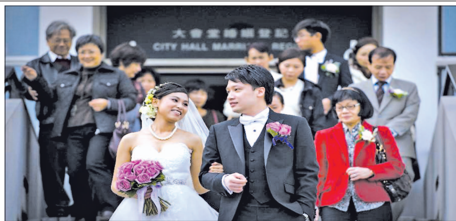
A newly married couple steps out of the marriage registration hall in Hong Kong, south China, on 12 Dec, 2012. A total of 696 couples flocked to tie the knot on 12 Dec, 2012, or 12/12/12, Dec which sounds like "will love/will love/will love" in Chinese.—XINHUA