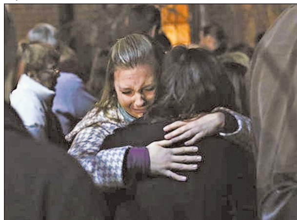
People grieve outside the overflow area of a vigil at the Saint Rose of Lima church in Newtown, Connecticut on 14 Dec, 2012.