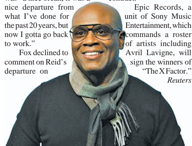
Judge LA Reid poses at the party for the television series "The X Factor" finalists in Los Angeles, California on 5 November, 2012.