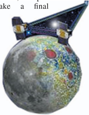
NASA handout image shows an artist's concept of the Gravity Recovery and Interior Laboratory ( GRAIL ) mission's twin spacecraft in orbit around the moon.

fornia, told reporters on a conference call. Almost out of fuel and currently flying just 7 miles above the lunar surface, the probes will make a final