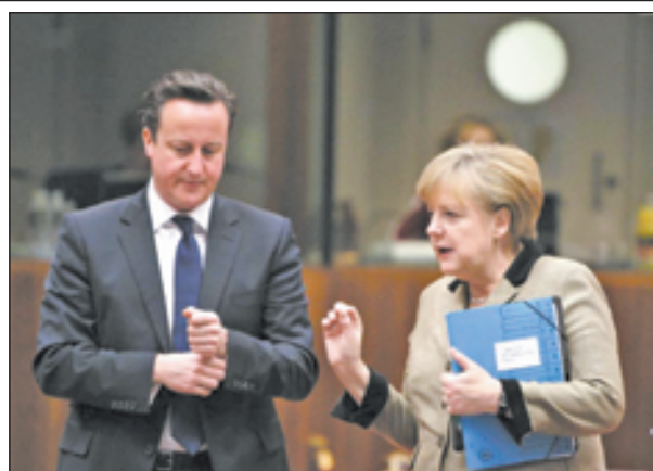
German Chancellor Angela Merkel (R) talks with British Prime Minister David Cameron during the second day's meeting of EU Summit in Brussels, capital of Belgium on 14 Dec, 2012. —XINHUA

The country's transitional government, which depends on oil exports for up to 70 percent of its budget, is struggling to launch a UN-backed reconciliation national dialogue by the end of this month to reunite the divided nation.— Xinhua