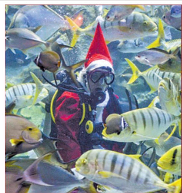
A diver wearing a Santa Claus costume swims with fishes at an aquarium in Kuala Lumpur, Malaysia, on 14 Dec, 2012.—XINHUA

An increase would likely come at the expense of purchases of US and Canadian meats while the testing and certification issue is resolved.—Reuters