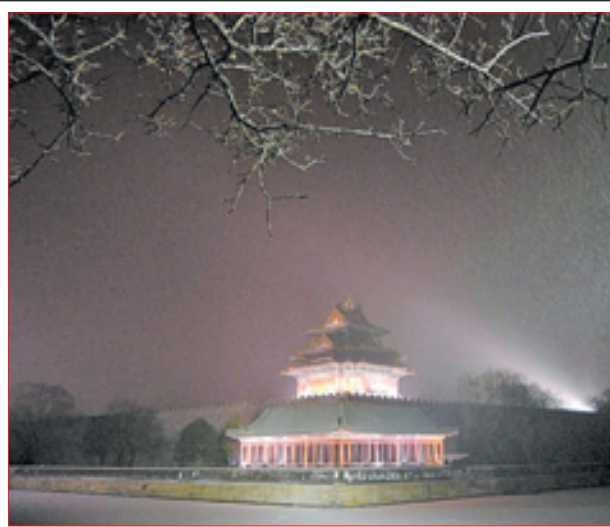
The Chinese capital city of Beijing witnessed snowfall again in the evening of 13 Dec, and the moderate snow was forecast to last to the morning of 14 Dec, 2012, according to Beijing Meteorological Bureau.