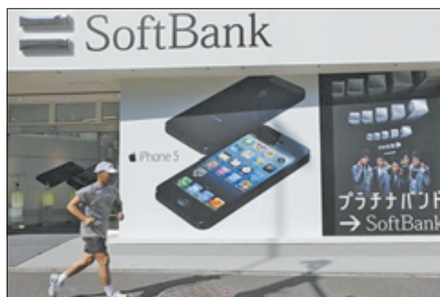
A jogger runs past a Softbank shop in Tokyo on 16 Oct, 2012.