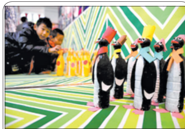
Students view handicrafts made of wastes and scraps during an exhibition in Lanzhou, capital of northwest China's Gansu province, on 14 Dec, 2012. A ten-day show themed on environmental protection opened here on Friday, during which over 1,800 artworks made by local primary and middle school students are displayed.

"Europe, international institutions, markets and also a part of Italy's political world have clearly asked him to stay, but an official candidature would be the decisive step," he told Xinhua . In his view, Monti has three main possibilities ahead of him. "He could run as prime minister and lead the moderate alignment, or allow the alignment to insert his name in the list which is almost the same thing as presenting himself as a candidate, or limit to endorse that group," the commentator said.— Xinhua