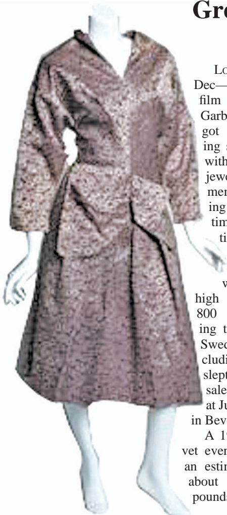
A black and pink two piece ensemble that belonged to actress Greta Garbo is shown in this publicity photo released to Reuters on 14 Dec, 2012.

Garbo started her Hollywood career in silent movies such as 1927's "Flesh and the Devil" and was among the few actors to successfully transition to talkies, becoming iconic not only for her beauty, but for her brains and the streak of independence she displayed on film and in her personal life. She earned four Academy Award nominations, her first for 1929's "Anna Christie," and was finally given an honorary award for unforgettable performances by the Academy of Motion Picture Arts and Sciences in 1954.—Reuters