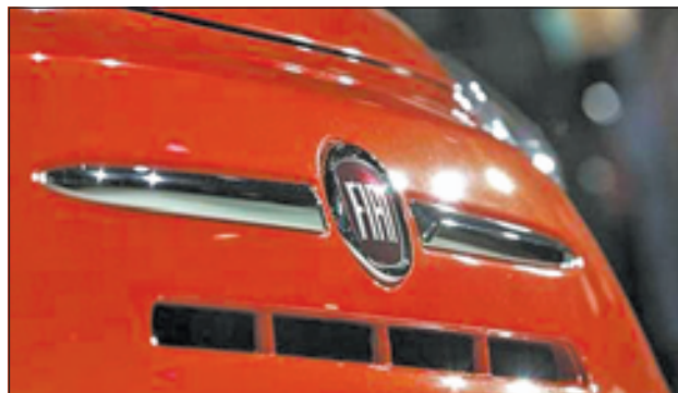
The Fiat logo is pictured at an event to introduce the 2013 Fiat 500 cars at the 2012 Los Angeles Auto Show in Los Angeles, California on 28 Nov, 2012.—REUTERS

Switzerland has agreed to allow foreign governments to get information on groups of bank clients based on suspicious behavioural patterns, such as using a bank-provided mobile phone, bringing itself into line with standards laid out by the Organization for Economic Cooperation and Development on group requests.—Reuters