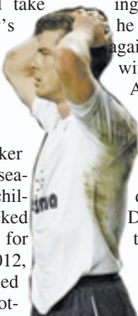
Tottenham Hotspur's Scott Parker reacts during their English Premier League soccer match against Liverpool at Anfield in Liverpool, northern England on 6 February, 2012.

Midfielder Parker has not played this season due to an Achilles' injury he picked up while playing for England at Euro 2012, while attack-minded left back Assou-Ekot-