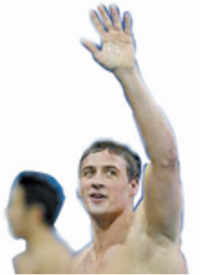
Ryan Lochte of the US celebrates winning the men's 200m individual medley final during the FINA World Swimming Championships in Istanbul on 14 Dec, 2012.

The 28-year-old American's victory gave him his fourth 200 individual medley title in a row at the short-course worlds having also snatched gold in Shanghai (2006), Manchester (2008) and Dubai (2010). Lochte's world record on Friday was the first at this year's event, on the third day of competition.