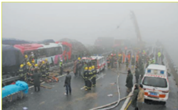
Rescuers and working staff work at the accident site after a pile-up involving over 20 vehicles happened on a snow-coated section of an expressway in Pingyin County of Jinan, capital of east China's Shandong Province, on 14 Dec, 2012.—XINHUA

Traffic on the highway has resumed. Investigation into the accident is under way.—Xinhua