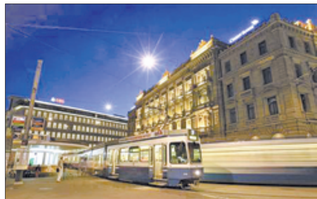
Trams drive past the offices of Swiss banks UBS (L) and Credit Suisse at Paradeplatz square in Zurich on 10 Aug, 2012.

ZURICH, 15 Dec—Switzerland's banks have suffered a major setback in their fight to maintain client secrecy after Germany rejected a key tax pact to sweep Swiss accounts clean of tax dodgers.