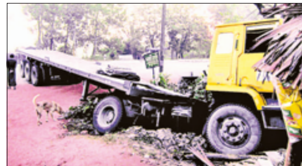
TRUCK PLUNGES INTO ROAD SIDE: Photo shows 22-wheeled container truck which was plunging down the embankment at the top of Chinsu Plywood factory street on Yangon-Mandalay motorway in Bago on 12 December.