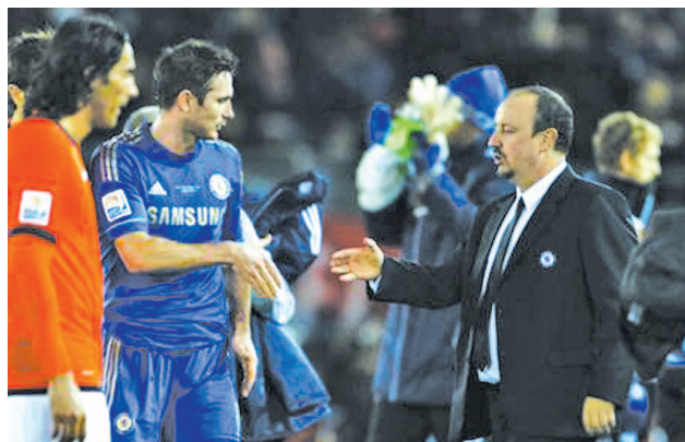
Frank Lampard (2nd L) of Britain’s Chelsea shakes hands with his interim coach Rafael Benitez after the Club World Cup semi-final soccer match against Mexico’s Monterrey in Yokohama, south of Tokyo on 13 Dec, 2012.