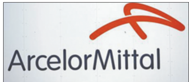
A logo of ArcelorMittal steel group is seen at the Les Chantiers de l'Atlantique shipyards in Saint Nazaire, western France.

ArcelorMittal's plant in Liege, eastern Belgium, had been suspended after the steelmaker failed to come to an agreement with unions over details of job losses.