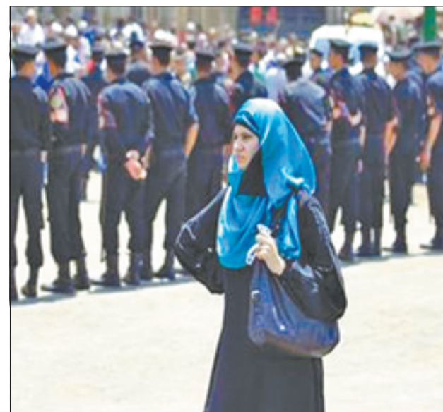
A woman waits as security personnel close off a street leading to Al-Azhar mosque when Egypt's President Mohamed Mursi is in it performing the Al-Gomaa prayer in Cairo on 17 Aug, 2012. —REUTERS

of sexual harassment in Tunisia and Egypt, and the handling of these incidents were also of deep concern, women's rights activists said.—Reuters