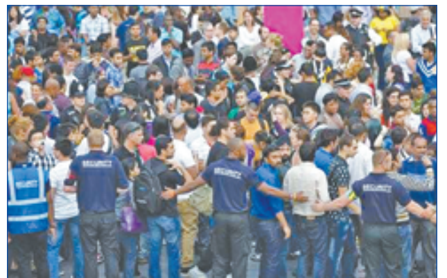
Security at Stratford station stop non ticket holders from entering Westfield by the Olympic Park for the 2012 Olympic Games opening ceremony in London on 27 July, 2012.—REUTERS

The London Olympics started a little over a month later on 27 July with most sports sold out early in the ticketing process and more than a million people unsuccessful in an initial ballot last year.—Reuters