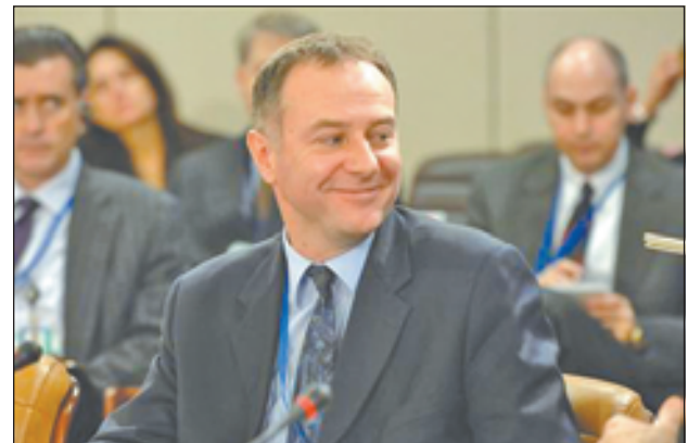
Branislav Milinkovic, Serbia's ambassador to NATO, sits at the Alliance headquarters in Brussels on 14 Dec, 2006 in this handout photo released to Reuters on 5 Dec, 2012.