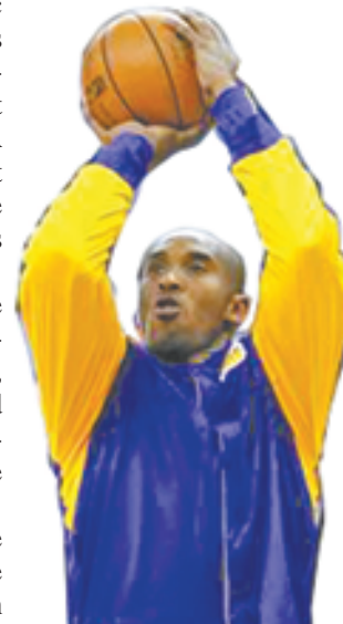
Los Angeles Lakers shooting guard Kobe Bryant (24) warms up prior to their NBA basketball game against the New Orleans Hornets in New Orleans, Louisiana on 5 Dec, 2012.

At the age of 34, the 14-time All-Star became only the fifth player to reach