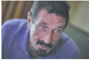
John McAfee, anti-virus software guru, speaks during an interview with Reuters in Guatemala City, on 5 Dec, 2012.

GUATEMALA CITY, 6 Dec—US software guru John McAfee, on the run from authorities in Belize seeking to question him in a murder probe, was arrested by Guatemalan police on Wednesday for illegally entering the country, that