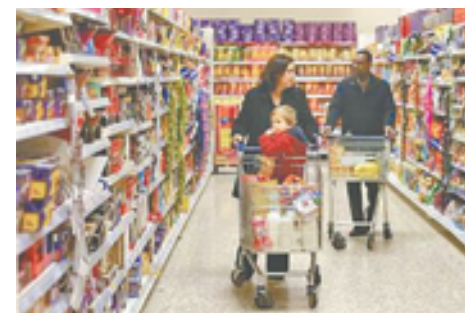
Customers shop at a Tesco shop in Bishop's Stortford, southern England on 26 Nov, 2012.

Households in the euro zone have been struggling since the global financial crisis of 2008/2009, constrained by disposable incomes that grew only during the brief recovery