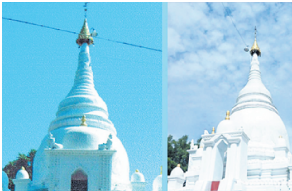
Photo shows completion of renovation tasks for Bawdi Pagoda in Htonebo ward where the diamond orb of the pagoda fell down to the ground in the earthquake.