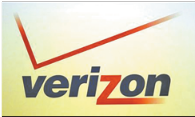
A Verizon logo is seen during the International CTIA WIRELESS Conference & Exposition in New Orleans, Louisiana on 9 May, 2012.

It may do more deals in the software space but these would be smaller transac-