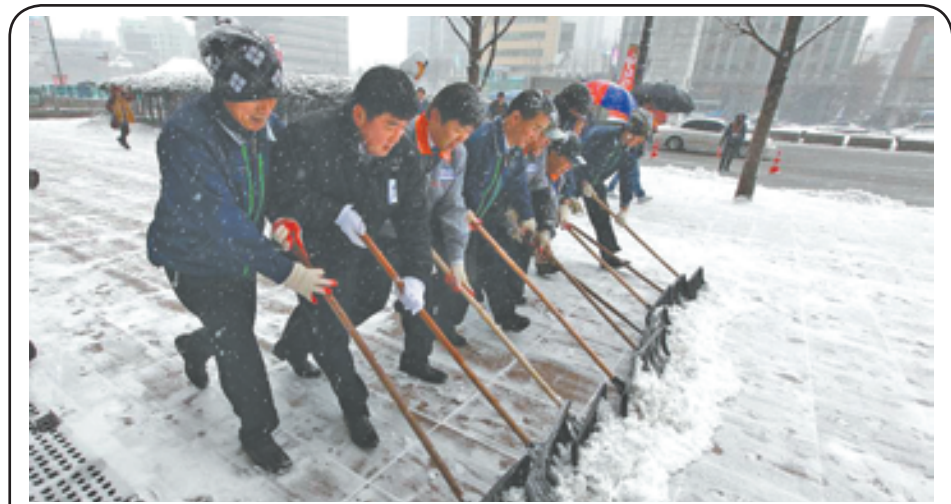
Workers clean the snow at Gwanghwamun Square in Seoul, capital of South Korea, on 5 Dec, 2012. The weather forecast agency issued a heavy snow alert in Seoul on Wednesday.

The last serious tornado in Auckland left one man dead in the north of the city in May last year.