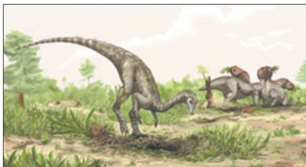
Artist rendering shows Nyasasaurus parringtoni , either the earliest dinosaur or the closest dinosaur relative yet discovered in this image released to Reuters on 4 Decr, 2012. Nyasasaurus parringtoni was up to 10 feet long, weighed perhaps 135 pounds and is depicted near plant-eating reptiles of the genus Stenaulorhynchus .

LONDON, 6 Dec—Researchers have found what could be the earliest known dinosaur to walk the Earth lurking in the corridors of London's Natural History Museum.