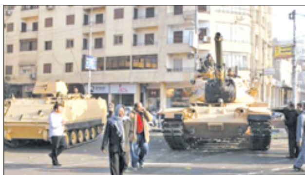
Tanks that were just deployed outside the Egyptian presidential palace in Cairo December 6, 2012.

CAIRO, 6 Dec— Five people have been killed in the overnight clash between opponents and