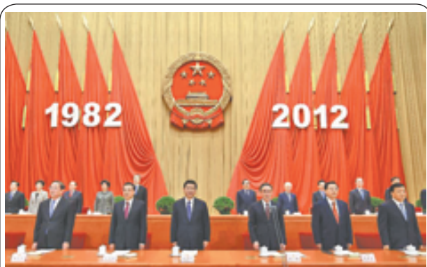
Xi Jinping (3rd L, front), Wu Bangguo (3rd R, front), Li Keqiang (2nd L, front), Zhang Dejiang (2nd R, front), Yu Zhengsheng (1st L, front) and Liu Yunshan (1st R, front) attend a congress marking the 30th anniversary of the Constitution's implementation in Beijing, capital of China, 4 Dec, 2012.