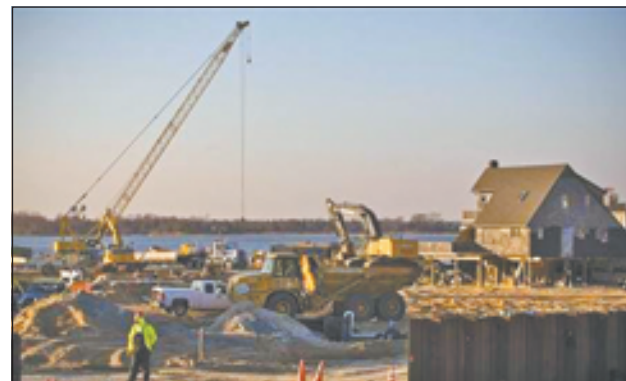
Construction workers repair roads destroyed by Hurricane Sandy, one month after the storm made landfall, in Mantoloking, New Jersey, on 29 Nov, 2012.

It remained unclear whether post-Sandy rebuilding projects, coupled with a recent uptick in residential building, could create enough construction jobs to make up for the tens of thousands lost during the recession.