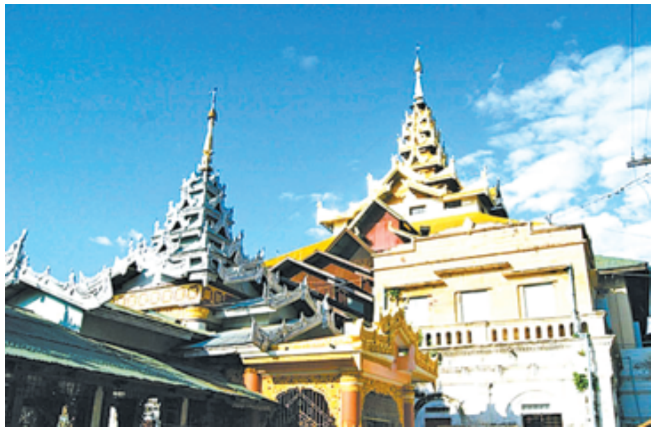
Photo shows completion of renovation tasks for Ngahtetgyi Pagoda in Daweizay ward where the earthquake caused damage to some parts of glass mosaic of the pagoda.