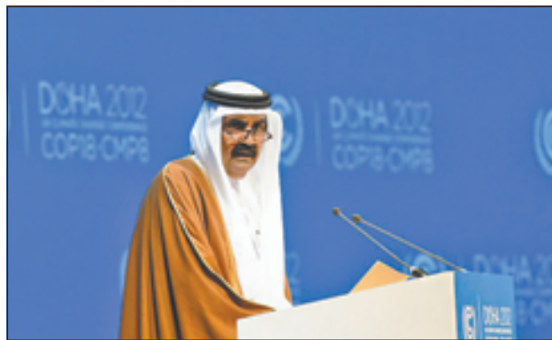
Qatari Emir Sheikh Hamad Bin Khalifa Al-Thani speaks during the opening session of the high-level segment of the United Nations Climate Change Conference in Doha, Qatar, on 4 Dec, 2012.

DOHA, 6 Dec—The ongoing UN climate conference began its high-level talks here on Tuesday, after the first week of meetings made little progress.