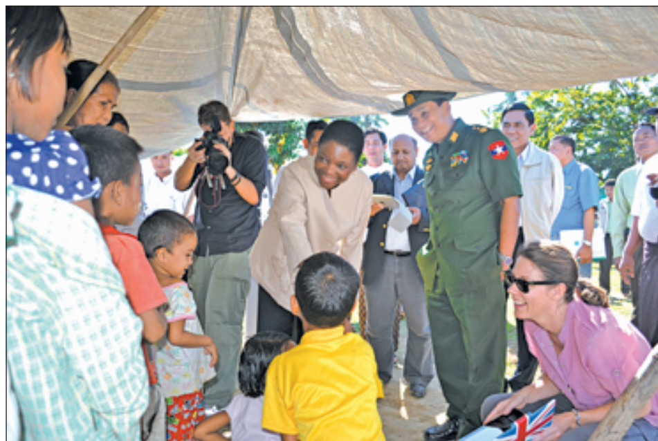
Union Minister Lt-Gen Thein Htay, UN Under-Secretary-General for Humanitarian Affairs and Emergency Relief Coordinator Baroness Valerie Amos and party meet local people in Myebon Township.