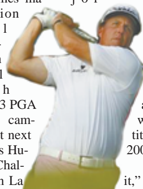
Phil Mickelson of the US tees off on the 12th hole during the first round of the Barclays Singapore Open golf tournament in Sentosa on 8 Nov, 2012.

LOS ANGELES, 6 Dec — Four-times major champion Phil Mickelson will launch his 2013 PGA Tour campaign at next month's Humana Challenge in La