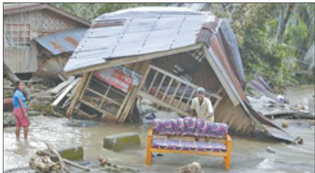
Residents clean their sofa outside their destroyed house after Typhoon Bopha hit Compostela Valley, southern Philippines on 5 December, 2012.

NEW BATAAN, 6 Dec—Dozens of soldiers and rescue workers pulled out bodies from mud-drenched debris after the strongest typhoon this year killed at least 325 people in the southern Philippines, with hundreds still missing.