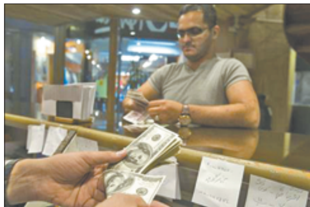
A currency exchange dealer counts US dollar banknotes at his shop in a shopping centre in northern Teheran in this 24 Oct, 2011 file photo.

every sector of the economy, resulting in spiralling food prices, a plunging Iranian rial, deepening unemployment and now, hitting health care,