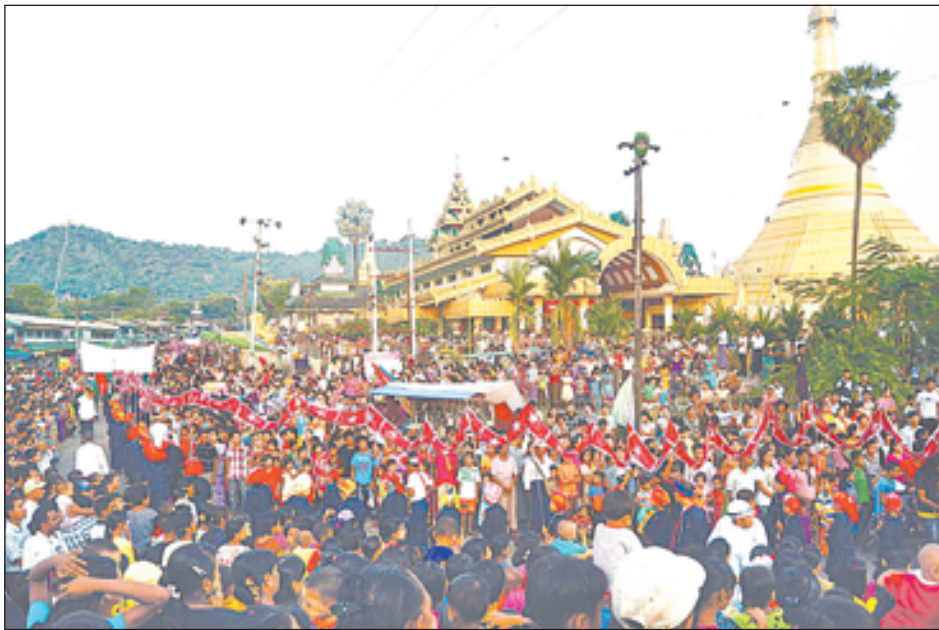
THATON, 6 Dec—The rice and robe offering ceremony was held on a grand scale

at Shwesayan Pagoda in Thaton of Mon State on 28 November (Fullmoon Day