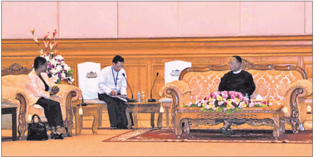
Pyidaungsu Hluttaw and Amyotha Hluttaw Speaker U Khin Aung Myint receives Baroness Valerie Amos, United Nations Under-Secretary-General for Humanitarian Affairs and Emergency Relief Coordinator.

The meeting focused on natural disaster preparedness and rehabilitation tasks, peace and development in Rakhine and Kachin States.