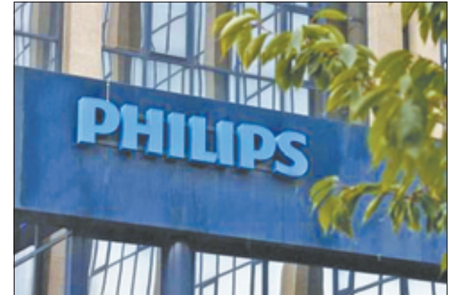
The logo of Philips is seen at the company's entrance in Brussels on 11 September, 2012.

Joaquin Almunia said in a statement. He will hold a news conference on the case at 1130 GMT on Wednesday.