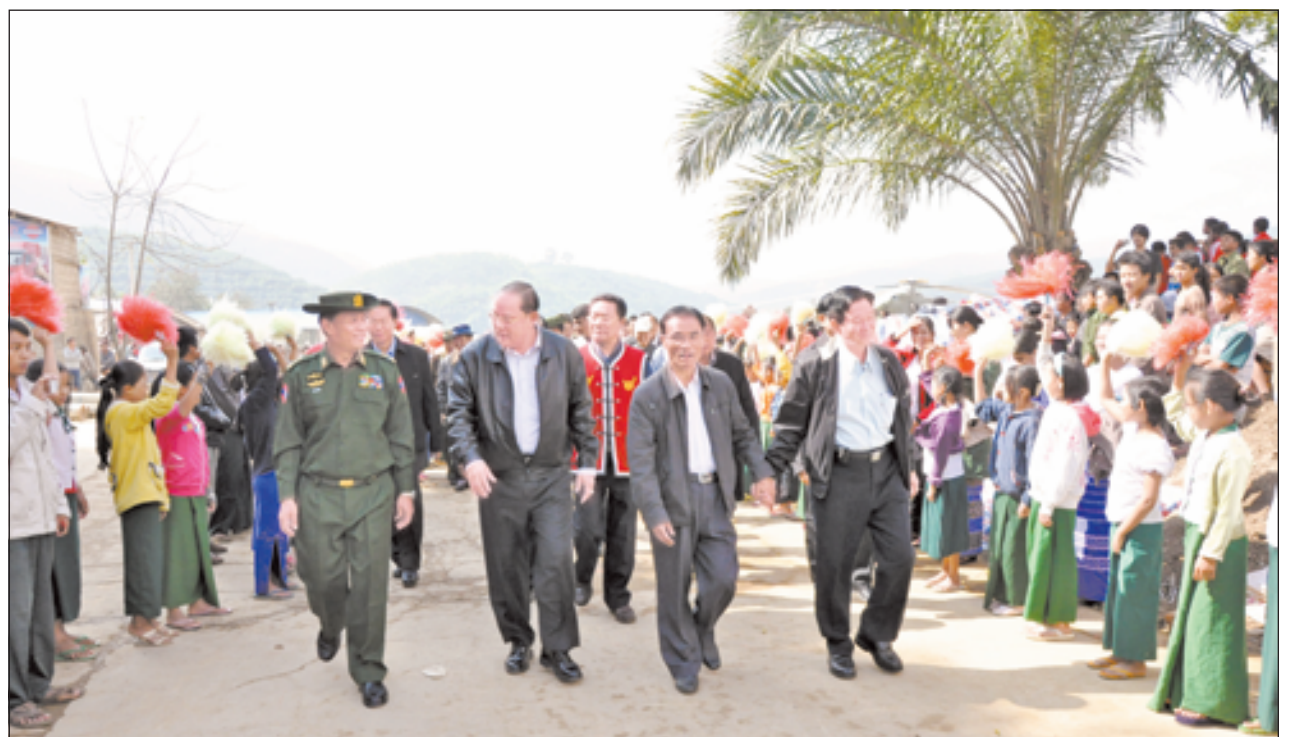
Vice-Chairmen of Union-level Peace-Making Committee U Aung Min and U Thein Zaw, and Union Minister for Border Affairs Lt-Gen Thein Htay seen with leaders of Panhsan Special Region-2 group.