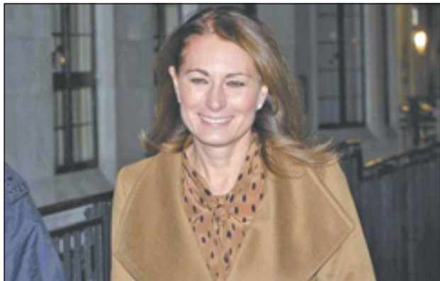
Carole Middleton leaves the King Edward VII hospital where her daughter Catherine, Duchess of Cambridge is being treated in London, on 5 Dec, 2012.

excitedly reporting any update on her condition along with the facial expressions of William when he arrives and departs.