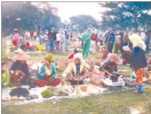
As Mohnyin has become a district level town, Nyaungbin market was closed down on 1 December in line with the town characteristics. Then, the plots were allotted to vendors in the compound of No. 2 Aungthabye Market. Photo shows local people and shoppers in sales of goods.—MYANMA ALINN