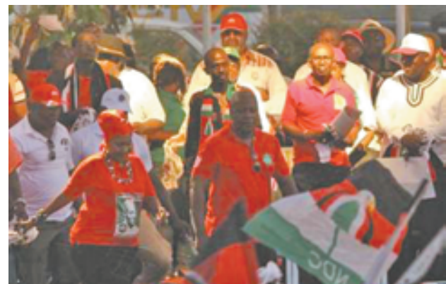
John Dramani Mahama (R), Ghana's interim president and National Democratic Congress (NDC) presidential candidate, walks with his wife Lordina Mahama during his last electoral rally at a trade fair in Accra on 5 Dec, 2012.

this is we can probably solve this in about a week. It's not that tough, but we need that conceptual breakthrough," he said.—Reuters