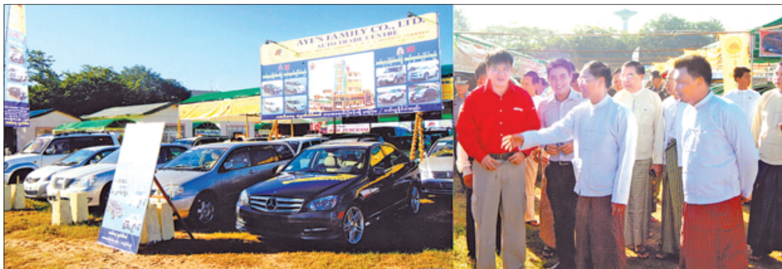
Yangon Region Chief Minister U Myint Swe views round booths at Yangon Living & Car Show.—MNA