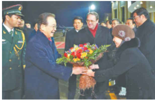
Chinese Premier Wen Jiabao (2nd L, front) is welcomed on his arrival in Moscow, Russia, on 5 Dec, 2012. Wen will attend the 17th regular meeting between the two countries' prime ministers and pay an official visit to Russia.

"The consensus to be reached will inject more dynamics into the continued, sound and stable development of the comprehensive strategic partnership of coordination between China and Russia," he said, adding that the annual meeting mechanism between the two prime ministers has played a special role in strengthening