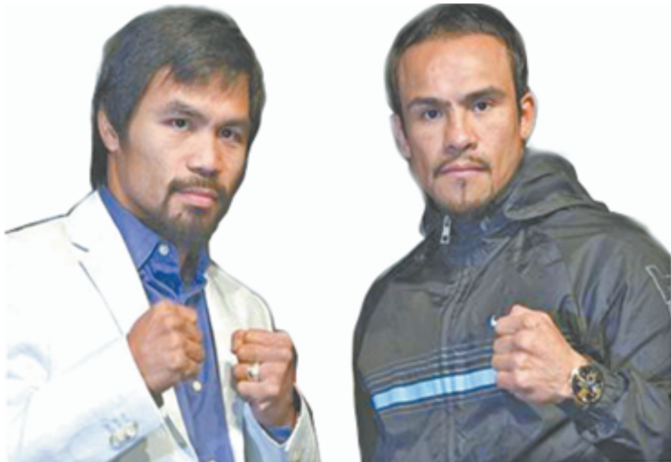
Filipino boxer Manny Pacquiao (L) and Juan Manuel Marquez of Mexico pose during a news conference at the MGM Grand in Las Vegas, Nevada on 5 Dec, 2012. Pacquiao and Marquez will fight for a fourth time in a welterweight bout at the MGM Grand Garden Arena on 8 December.

LAS VEGAS, 6 Dec — Juan Manuel Marquez's sole motivation for Saturday's non-title welterweight clash with arch-rival Manny Pacquiao is the prospect of finally being able to celebrate victory over the Filipino in the ring, the Mexican said on Wednesday. "I want them (his corner) to raise my hand (in triumph)," Marquez told reporters at the MGM Grand after the two fighters appeared for their final pre-bout news conference.