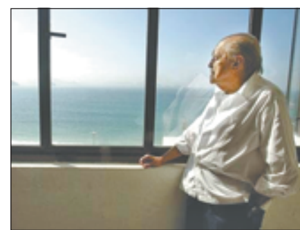
Brazilian architect Oscar Niemeyer looks at the Copacabana beach from his office after his interview with Reuters in Rio de Janeiro.

Starting in the 1930s, Niemeyer's career spanned nine decades. His distinctive glass and white-concrete buildings include such landmarks as