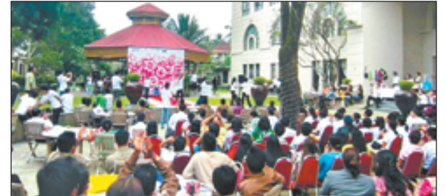
A ceremony to mark World AIDS Day was held at the Grand Mee Ya Htar Executive Residence in Pabedan Township on 1 December.

Eight groups participated in the contest. On 28 November, the prize