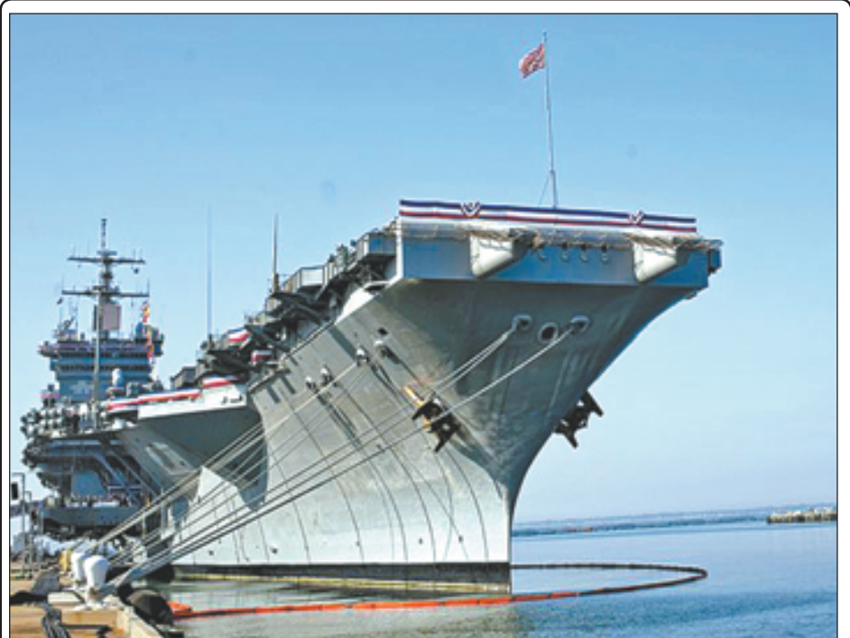
The USS Enterprise prior to the Inactivation Ceremony at Naval Station Norfolk, Virginia, on 1 Dec, 2012. The Enterprise, which was christened in 1960, is the first nuclear-powered aircraft carrier to be decommissioned.