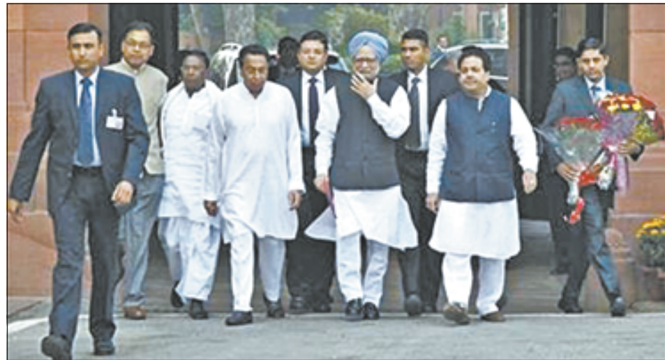
India's Prime Minister Manmohan Singh (C) arrives at the parliament on the opening day of the winter session in New Delhi on 22 Nov, 2012.

could pave the way for further measures to revive the economy.