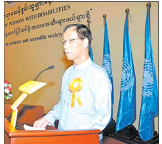
Vice-President Dr Sai Mauk Kham addresses the ceremony to mark International Day of Persons with Disabilities.

could not be created for the disabled in practical field. Thus, the 61 st UN General Assembly prescribed the Convention on the Rights of Persons with Disabilities on 13 December 2006. A total of 154 countries of 193 have signed the convention and 126 countries approved it. About 650 million of