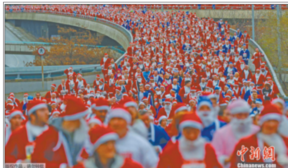
Runners dressed in Santa Claus outfits compete in the Santa Dash in Liverpool, northern England, on 2 Dec, 2012.