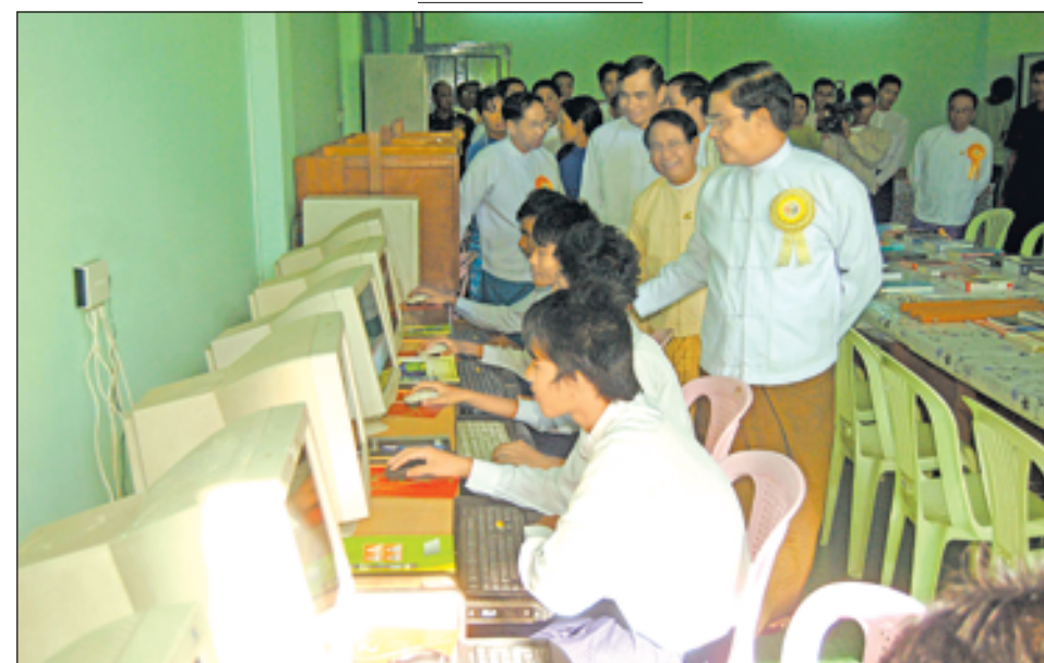
Vice-President U Nyan Tun visits computer lab at Cooperative University (Thanlyin). —MNA

As the cooperative economy played an important role in implementing tasks for improvement of the socio-economy of the people in rural areas, the government also laid down the task for development of cooperative economy in the 8-point rural area development and poverty reduction plan, he said, encouraging the small and medium scale industries via the cooperative system as part of the development of the economy of the country, he said.