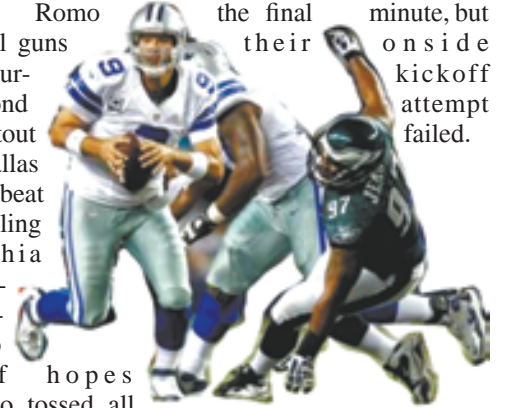
Dallas Cowboys quarterback Tony Romo scrambles as Philadelphia Eagles defensive tackle Cullen Jenkins is unable to make the tackle in the first half of their NFL football game in Arlington, Texas on 2 Dec, 2012.

LOS ANGELES, 3 Dec — Tony Romo the final minute, but came out all guns their onside kicking during a second half shootout as the Dallas Cowboys beat the crumbling Philadelphia Eagles 38-33 on Sunday to keep their playoff hopes intact. Romo tossed all