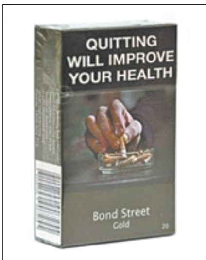
Photo illustration of a new mandatory package for cigarettes sold in Australia on 29 Nov, 2012. Australia's new stringent anti-tobacco laws, the most Draconian in the world, strips packs of all branding, bright colours and logos, leaving only the name printed in identical small font.