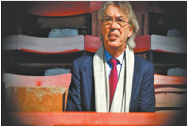
Inter president Massimo Moratti