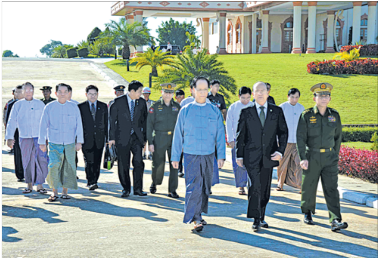
President U Thein Sein and party being seen off at Nay Pyi Taw Airport by officials.

NAY PYI TAW, 3 Dec — At the invitation of King of Brunei Darussalam Sultan Haji Hassanal Bolkiah Mu'izzaddin Waddaulah, President of the Republic of the Union of Myanmar U Thein Sein left here for Brunei Darussalam by special flight of MAI this morning.