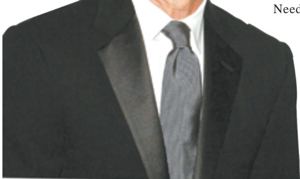
Movie producer Jeffrey Katzenberg

Katzenberg, who has helped raise funds for the Motion Picture & Television Fund and the University of Southern California's Shoah Foundation Insti-