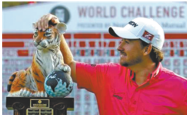
Graeme McDowell of Northern Ireland poses with his trophy after winning the World Challenge golf tournament in Thousand Oaks, California, on 2 Dec, 2012.