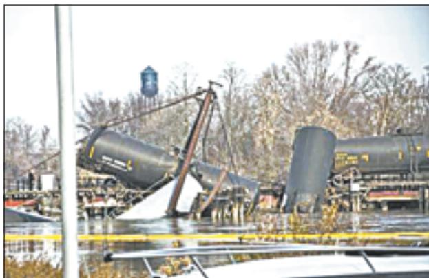
Derailed freight train cars sit semi-submerged in the waters of Mantua Creek after a train crash, in Paulsboro, New Jersey, on 30 Nov, 2012.

A bridge collapse derailed seven of the 82 Conrail freight train cars, and a tanker car that fell into Mantua Creek leaked vinyl chloride into the waterway, which feeds into the Delaware River near Philadel-