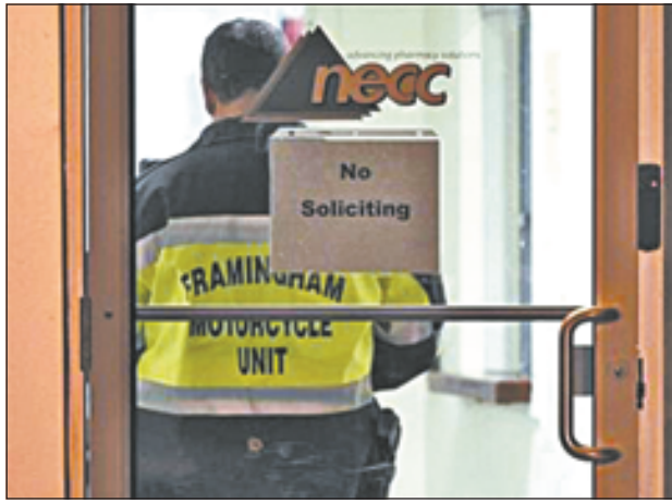
A Framingham Motorcycle Unit officer stands by while federal agents search New England Compounding Centre in Framingham, Massachusetts on 16 Oct, 2012.