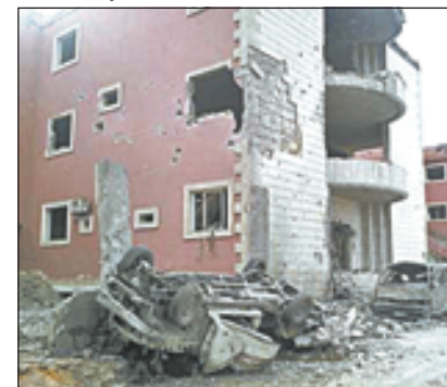
View of buildings damaged by what activists said were missiles fired by a Syrian Air Force fighter jet loyal to President Bashar al-Assad in the Akraba suburb of Damascus on 1 Dec, 2012.