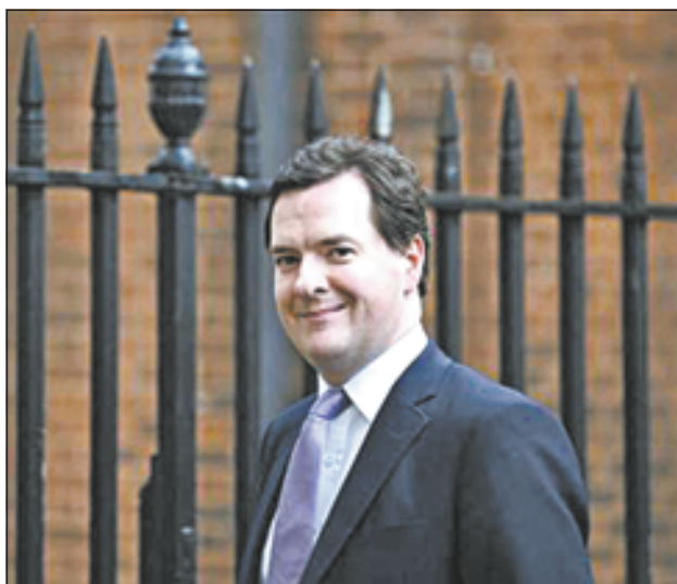
Britain's Chancellor of the Exchequer George Osborne leaves Downing Street in London on 26 Nov, 2012.

At his "Autumn statement" on Wednesday, Osborne is expected to defend his stringent economic policies as the only credible way of solving the government's biggest political problem — its failure to deliver a strong