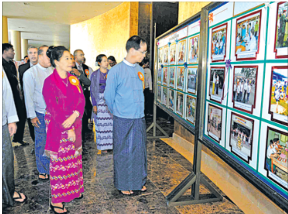
Vice-President Dr Sai Mauk Kham visits a booth at a ceremony to mark the International Day of Persons with Disabilities.