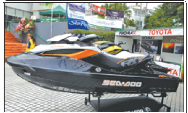
A yacht is pictured at its booth during Hong Kong International Boat Show 2012 in south China's Hong Kong, on 2 Dec, 2012. The boat show closed on Sunday.