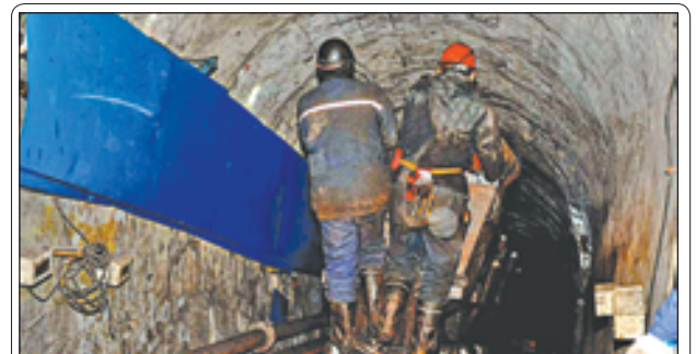
Rescuers work in the flooded mine in Qitaihe City, northeast China's Heilongjiang Province, on 2 Dec, 2012. Rescuers on Sunday pulled two miners out alive while 14 others remain trapped after the Furuixiang Coal Mine in Qitaihe City was flooded on Saturday, according to local government sources.—XINHUA