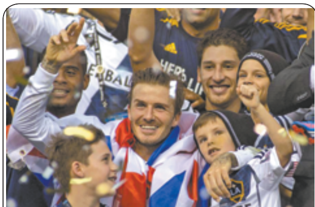
David Beckham (C) of Los Angeles Galaxy celebrates with his sons after the Major League Soccer (MLS) Cup final against Houston Dynamo in Carson, the United States, on 1 Dec, 2012. Galaxy won 3-1 to win the MLS Cup Championship. Beckham will leave the team after the match.