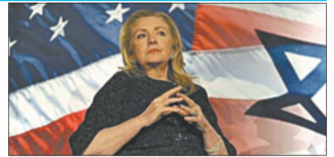
US Secretary of State Hillary Clinton answers questions from the audience at the 2012 Saban Forum on US-Israel relations gala dinner in Washington, on 30 Nov, 2012.