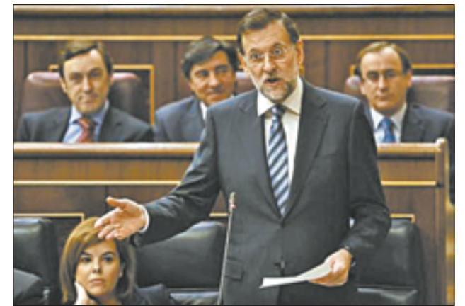
Spanish Prime Minister Mariano Rajoy (C) talks next to Spanish Deputy Prime Minister Soraya Saenz de Santamaria during a parliamentary session at Spanish parliament in Madrid on 28 Nov, 2012.

Party, which went back on an electoral pledge to link pensions to inflation last week, is on track to meet the European Union-agreed deficit target of 6.3 percent of Gross Domestic Product.