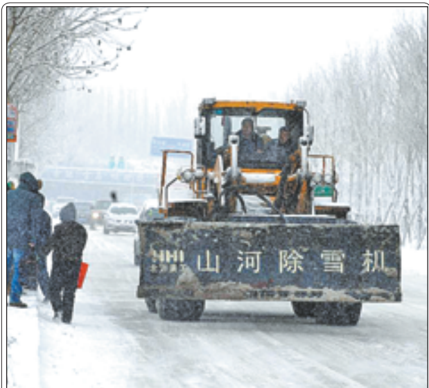
A snow sweeper works amid snowstorm in Shenyang, capital of northeast China's Liaoning Province, on 3 Dec, 2012. Liaoning Province issued a red alert for snowstorm on Monday morning, while closing an airport and expressways in the provincial capital of Shenyang.