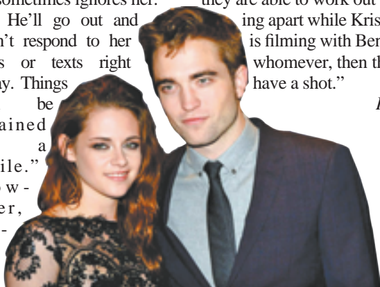
Robert Pattinson, Kristen Stewart