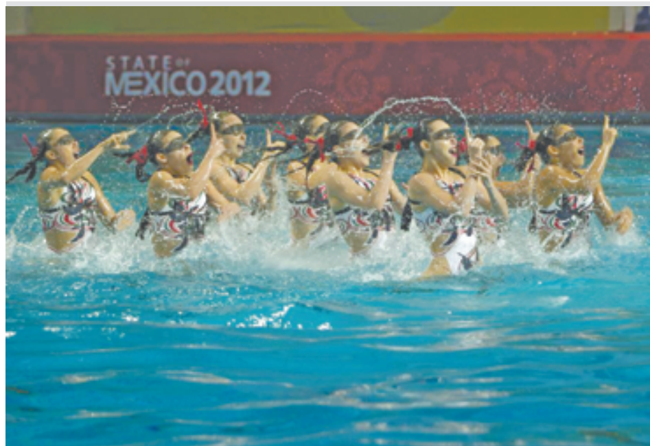
Japanese players compete in the presentation of thematic teams during the 7th FINA Synchronised Swimming World Trophy 2012 in Mexico City, capital of Mexico, on 1 Dec, 2012.