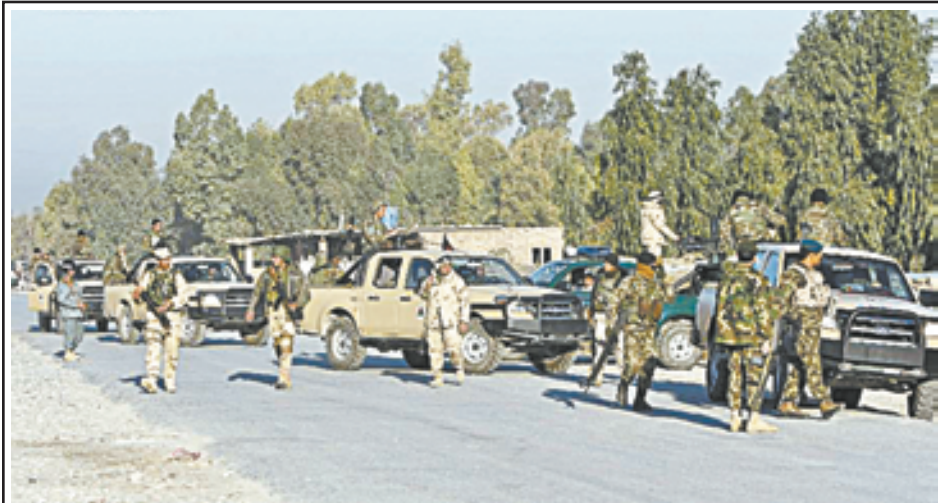
Afghan soldiers are seen at the site of an attack in Nangarhar Province, Afghanistan, on 2 Dec, 2012. At least 11 people were killed when several Taliban militants armed with suicide vests and weapons stormed an Afghan-NATO base in Jalalabad, the capital city of Afghanistan's eastern Province of Nangarhar on Sunday morning.