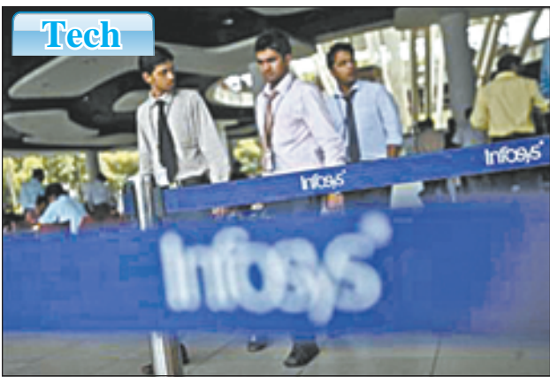
Employees of Indian software company Infosys walk past Infosys logos at their campus in the Electronic City area in Bangalore on 4 Sept, 2012.