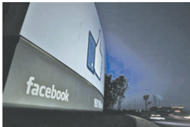
Traffic flies by the entrance sign to Facebook headquarters in Menlo Park, California before the company's IPO launch, on 18 May, 2012.

hours trading. Facebook shares were off 5 cents at $27.27. "Zynga's favored nation's status is gone but it seems like it's been slipping away for a while now," said