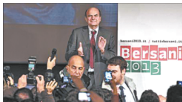
Democratic Party (PD) leader Pier Luigi Bersani celebrates his victory in downtown Rome on 2 Dec, 2012.

Monti, favourite of the business community, has said he will not be a candidate next year but might come back if the election does not provide a clear winner.