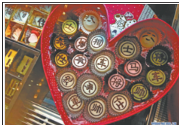
Photo taken on 2 Dec, 2012 shows a box of Chinese chess pieces made of chocolate in Suzhou, east China's Jiangsu Province. As western Christmas is coming, many new gifts have been created to attract customers.