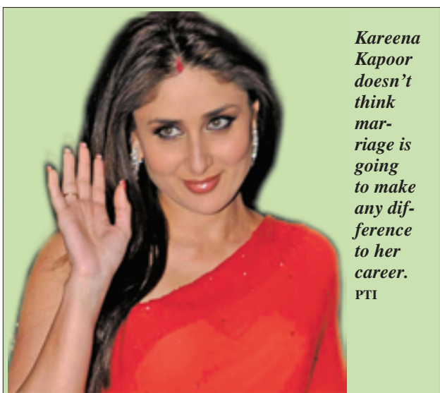
Kareena Kapoor doesn't think marriage is going to make any difference to her career.

seeing word of mouth in action, and a remarkably balanced demographic,” including strong ticket sales among those under 25, he said, adding “Many felt it was impossible to film, but Ang Li pulled it off.”