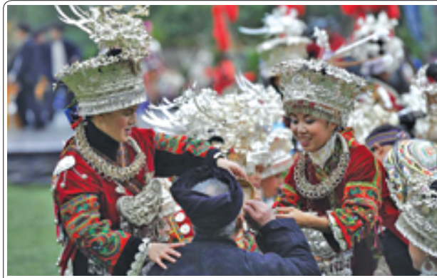
People of Miao ethnic group perform during the celebration of Miao's New Year in Leishan County, southwest China's Guizhou Province, on 25 Nov, 2012. According to the traditional calendar of the Miao ethnic group, on 25 Nov this year marks the first day of Miao's New Year. In 2006, the celebration of Miao's New Year was listed as Chinese national intangible cultural heritage.