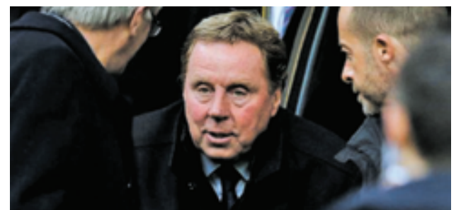
Queens Park Rangers' new manager Harry Redknapp (C)

Redknapp watched from the stands at Old Trafford on Saturday as rock-bottom Rangers took a second-half lead at Manchester United before conceding three goals in an eight-minute spell.—Reuters