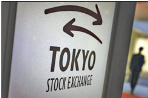
A visitor walks near the logo of the Tokyo Stock Exchange in Tokyo on 5 Nov, 2012.