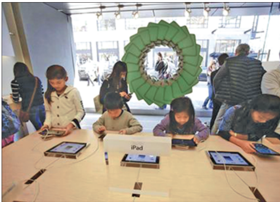
Young holiday shoppers interact with the iPad at the Apple Store during Black Friday in San Francisco, California, on 23 Nov, 2012.