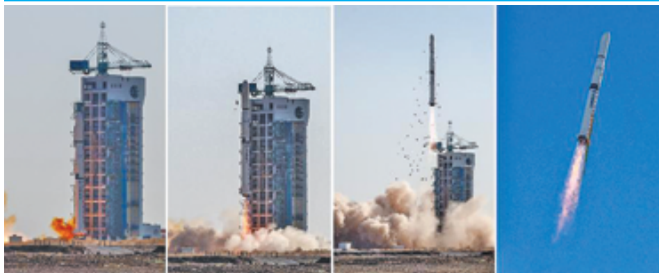
Combination photo taken on 25 Nov, 2012 shows a Long March-4C carrier rocket carrying the Yaogan XVI remote-sensing satellite blasting off from the launch pad at Jiuquan Satellite Launch Centre in Jiuquan, northwest China's Gansu Province.