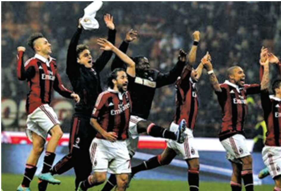
AC Milan celebrates winning at the end of their Italian Serie A soccer match against Juventus at the San Siro stadium in Milan on 25 Nov, 2012. AC Milan won 1-0.