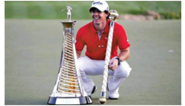
Rory McIlroy of Northern Ireland poses with the trophy after the fourth and final round of the DP World Tour Championship at Jumeirah Golf Estates in Dubai on 25 Nov, 2012.