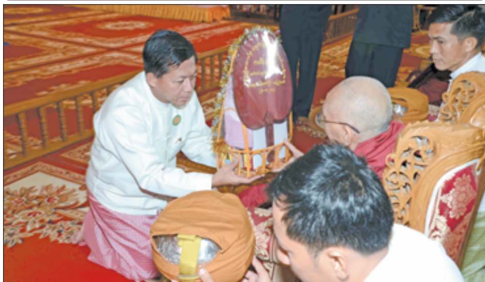
Commander-in-Chief of Defence Services Vice-Senior General Min Aung Hlaing offers robes to a Sayadaw.