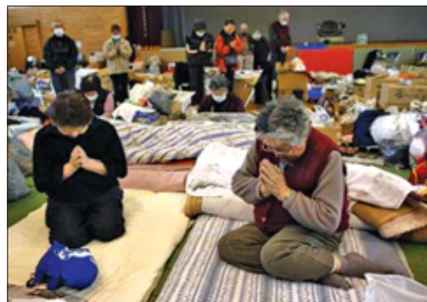
Victims of the 11 March earthquake and tsunami observe a minute of silence at a shelter in Kamaishi, Iwate prefecture, in this 11 April, 2011 file photograph, marking the one month anniversary of the deadly quake which triggered the tsunami and nuclear crisis in Japan. Weeks before Japan's first national election on 16 Dec, 2012.