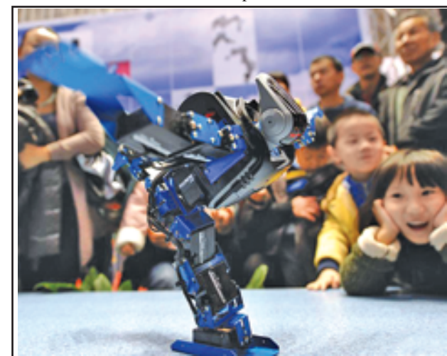
Visitors view a dancing robot during a robot show held in Qingdao University, Qingdao, east China's Shandong Province, on 25 Nov, 2012. The robot show, the first kind of this exhibition in Shandong, showcased the latest achievement of robot-related technology, involving over 100 exhibits from home and abroad.