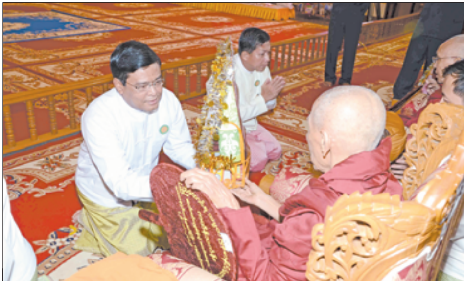
Vice-President U Nyan Tun presents robes to a Sayadaw.