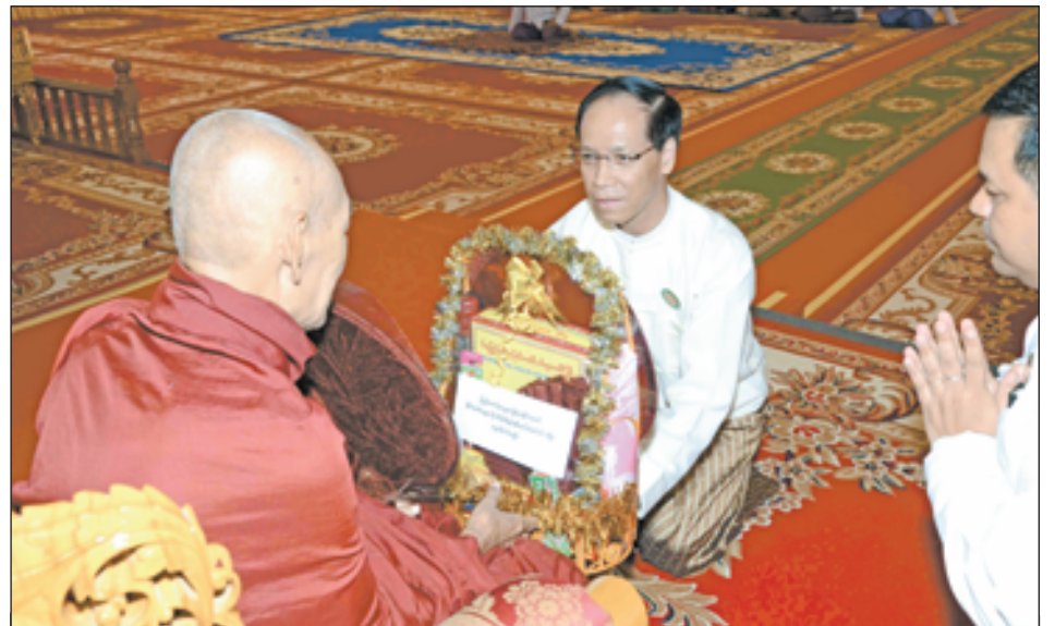
Vice-President Dr Sai Mauk Kham presents robes to a Sayadaw.