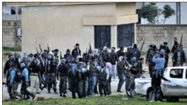
Members of the Free Syrian Army gather as gunfire is heard between them and the armed Kurds of The Kurdish Democratic Union Party (PYD) in the northern Syrian town of Ras al-Ain, on 25 Nov, 2012.