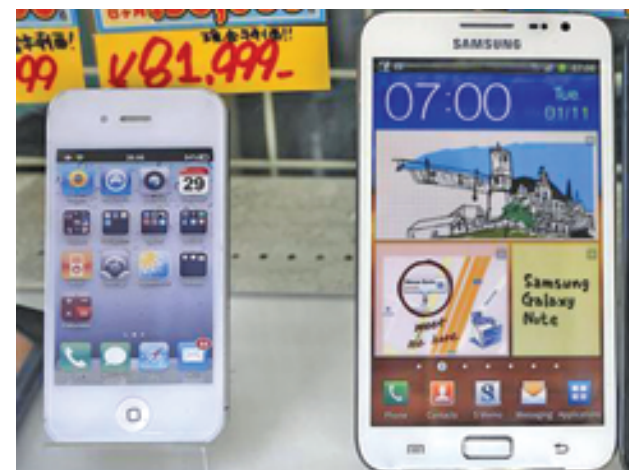
Apple's iPhone (L) and Samsung Galaxy Note are displayed at a shop in Tokyo in this 31 Aug, 2012, file photo.

Apple is also seeking to add the Samsung Galaxy S III, running the new Android "Jelly Bean" operating system, the Samsung Galaxy Tab 8.9 Wifi,