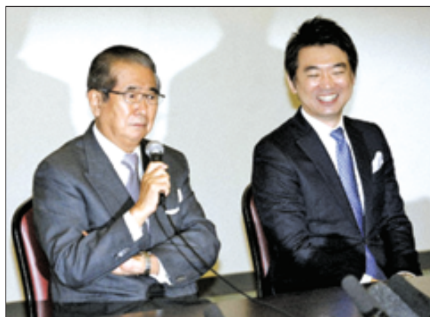
Osaka Mayor Toru Hashimoto (R) and former Tokyo Gov Shintaro Ishihara hold a Press conference in Osaka on 17 Nov, 2012. They said Hashimoto's Japan Restoration Party and Ishihara's Sunrise Party will be merged ahead of the 16 Dec, 2012, general election to counter major ruling and opposition parties.