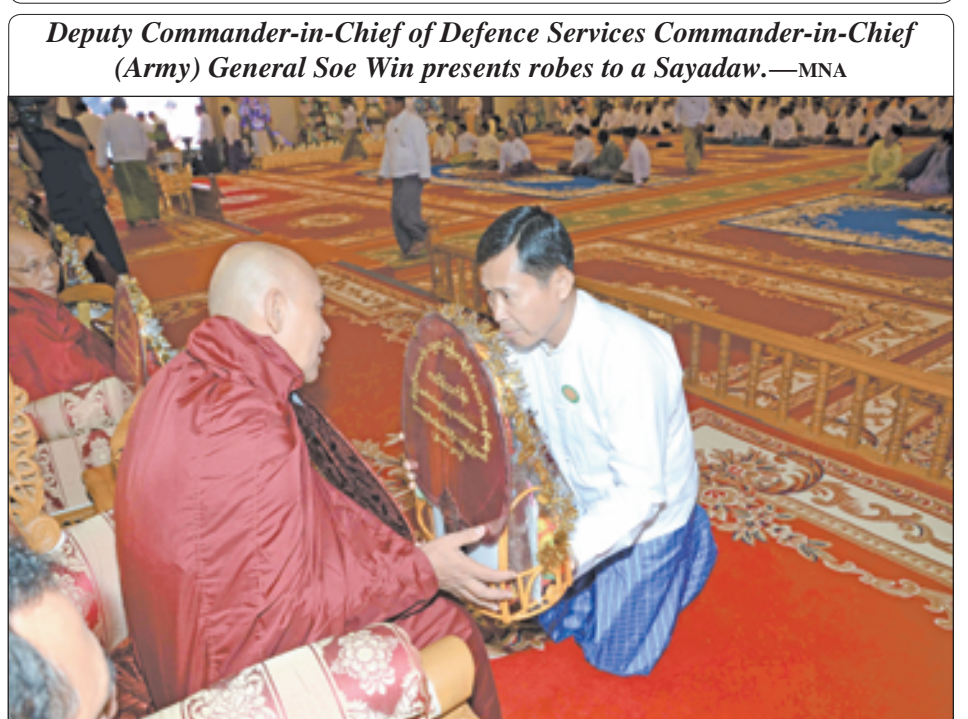
Deputy Commander-in-Chief of Defence Services Commander-in-Chief (Army) General Soe Win presents robes to a Sayadaw.