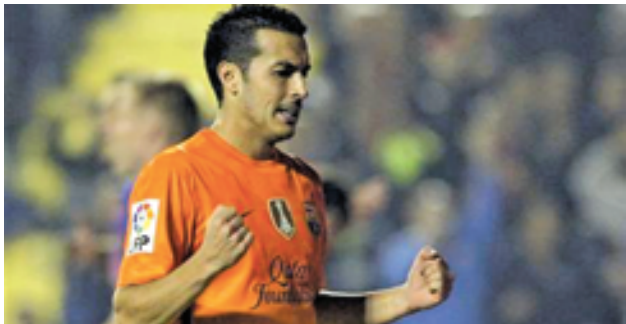
Barcelona's Pedro Rodriguez celebrates after his team scored against Levante during their Spanish first division soccer match at the Ciudad de Valencia stadium in Valencia, on 25 Nov, 2012.

MADRID, 26 Nov—As well as equalling the best start to La Liga, Barcelo-