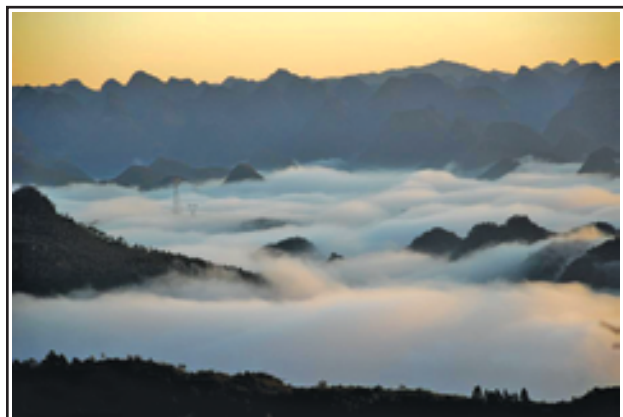
Photo taken on Nov. 25, 2012 shows the sea of clouds in Luoping County, southwest China's Yunnan Province.