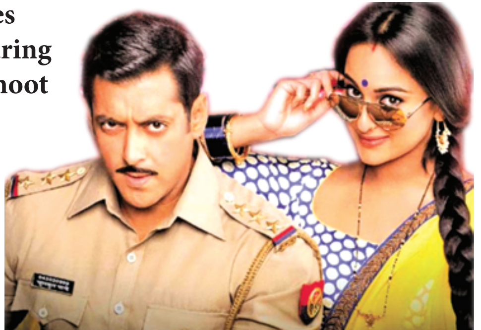
Sonakshi tried some steps of the classical dance form while shooting for the song Dagabaaz re from the movie.

“There is a sequence in the song where there are Kathakali dancers and when Sonakshi came to know about this, she got really excited! She is an actor who loves learning new things and, in fact, has even learnt some Kathakali and re-