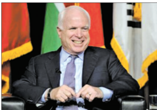
Senator John McCain reacts to a remark during the University of Southern California's Schwarzenegger Institute for State and Global Policy inaugural Symposium in Los Angeles, California, on 24 Sept, 2012.