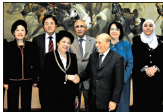
Chen Zhili (L Front), vice chairwoman of the Standing Committee of China's National People's Congress and president of the All-China women's Federation, shakes hands with Mohamed-Larbi Ould Khelifa, speaker of the National Assembly of Algeria, after their meeting in Algiers, capital of Algeria, on 25 Nov, 2012.

ALGIERS, 26 Nov — A senior Chinese legislator said on Sunday China would like to work with Algeria to step up bilateral exchanges in women's affairs and between the two countries' legislative bodies.