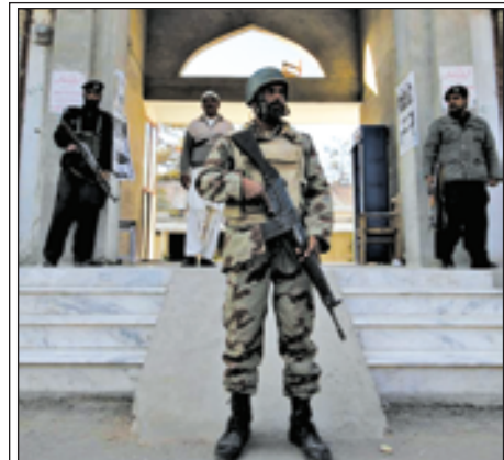
Pakistani soldiers stand guard on a street during an Ashura procession in southwest Pakistan's Quetta on 25 Nov, 2012. At least five people were killed and 83 others injured when a blast hit a Shia Muslim procession to mark Muharram, the first month of the Islamic calendar, in Pakistan's northwest District of Dera Ismail Khan on Sunday morning, said a senior official.

WELLINGTON, 26 Nov— New Zealand search and rescue officials said on Monday that an air force aircraft was returning home after finding no sign of three Kiribati fishermen missing for four days in the Pacific.