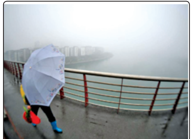
A citizen walks in the fog-shrouded Liuzhou City, southwest China's Guangxi Zhuang Autonomous Region, 25 Nov, 2012.