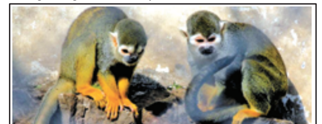
Photo taken on 24 Nov, 2012 shows two common squirrel monkeys in Suzhou Zoo, in Suzhou, east China's Jiangsu Province.—XINHUA

"The patrol seized explosives, mortar ammunition with Hebrew letters and a detonator," according to the statement.—Xinhua