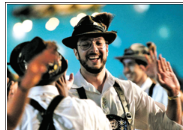
Dancers take part in the Oktoberfest festival celebrations in Sao Paulo, Brazil, on 24 Nov, 2012. Sao Paulo celebrated the originally German festival from 23 to 25 November.