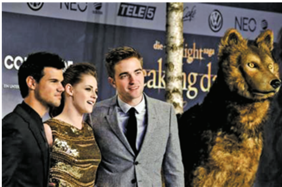
Cast members Robert Pattinson (R), Kristen Stewart (C) and Taylor Lautner pose for pictures before the German premiere of The Twilight Saga: Breaking Dawn Part 2 in Berlin, on 16 Nov, 2012.

seeing word of mouth in action, and a remarkably balanced demographic,” including strong ticket sales among those under 25, he said, adding “Many felt it was impossible to film, but Ang Li pulled it off.”