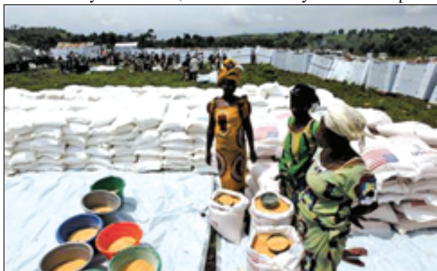
People displaced by recent fighting in eastern Congo wait to distribute corn flour in Mugunga IDP camp outside of Goma, on 24 Nov, 2012.—REUTERS

The number of homicides that emerged late Saturday and early Sunday has more than doubled the daily average of November 2011, pushing up the wave of violence that has gripped the city since the beginning of October.—Xinhua