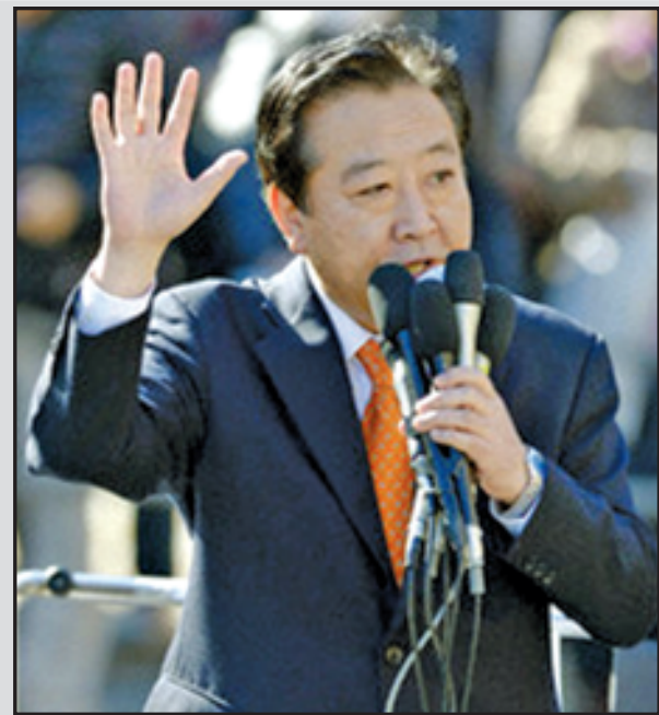
Japanese Prime Minister Yoshihiko Noda makes a stump speech in Suita, Osaka Prefecture, on 25 Nov, 2012, ahead of the on 16 Dec general election. KYODO NEWS

BANGKOK, 26 Nov— Myanmar Football team takes training at Bangkok stadium, in Bangkok to participate in ASEAN Suzuki Cup. Myanmar team will meet with host team Thai at second match. Myanmar team prepares training for its best result to play against Thai team. Forward Yan Paing and defender Thein Than Win were injured and Mai Aik Naing, too. Myanmar and Thai teams will meet at 7:50 pm MST tomorrow. Kyemon