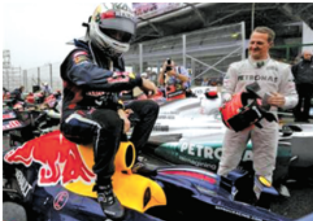
Red Bull Formula One driver Sebastian Vettel of Germany (L) celebrates winning the world championship next to compatriot Mercedes driver Michael Schumacher after the Brazilian F1 Grand Prix at Interlagos circuit in Sao Paulo on 25 Nov, 2012.

Vettel ended the season with 281 points to 278 for Alonso, who would have been the youngest triple champion at 31 had