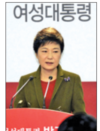
Park Geun Hye from the ruling Saenuri Party holds a Press conference in Seoul on 25 Nov, 2012, after she filed her candidacy in the South Korean presidential election.

Moon called for a broad alliance of liberals and centrists, a move aimed at winning back supporters of independent Ahn Cheol-soo, who bowed out of short-lived talks with Moon over merging their campaigns against conservative favourite Park.