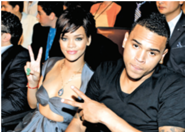
Rihanna and Chris Brown were all over each other at Adagio club after his gig.