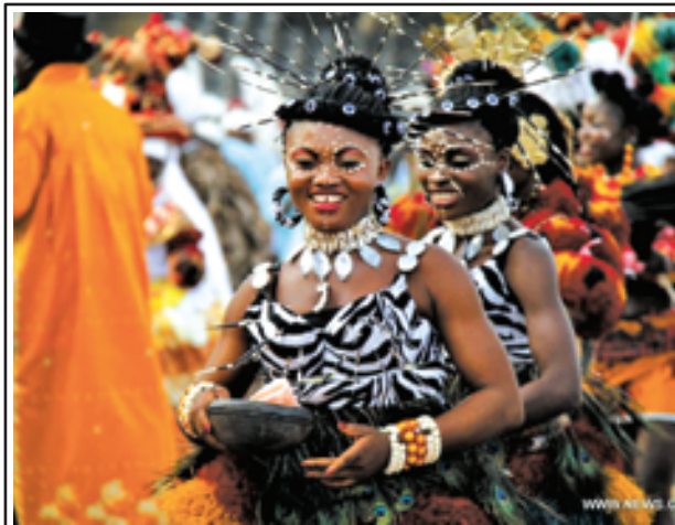
Nigerian artists perform at the opening ceremony of 2012 Abuja Carnival in Abuja, the capital city of Nigeria, on 24 Nov, 2012. Art groups from more than ten countries and regions participated in the three-day carnival, with the theme of "Carnival of Peace and Harmony".

Tialal said huge number of civilians, largely women and children, and Somali soldiers have crossed to Mandera side of the border after they fled from the heavy fighting. "Many civilians and TFG soldiers have crossed to the Border Point One in Mandera town. The TFG soldiers and some civilians have now returned back after the fighting has subsided and the attackers repulsed," Tialal said. "We still have a huge