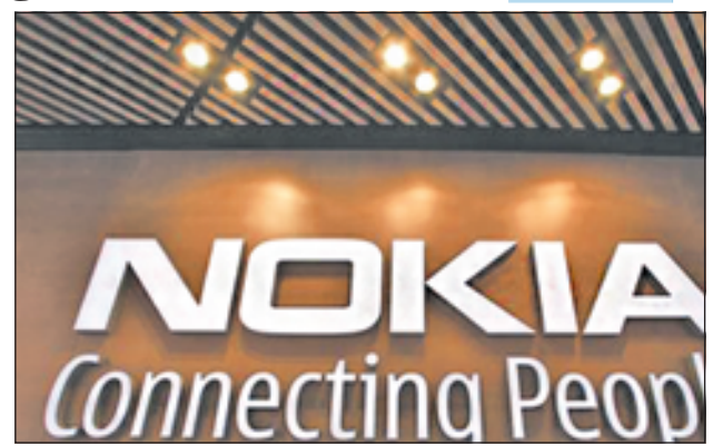
A corporate logo is displayed at the Nokia flagship store in Helsinki on 29 Sept, 2010.