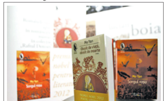
Photo taken on 24 Nov, 2012 shows the Romanian version of Chinese writer Mo Yan's novels at the 19th edition of International Book Fair Gaudeamus, in Bucharest, capital of Romania. Mo Yan is the winner of the 2012 Nobel Prize in Literature.—XINHUA