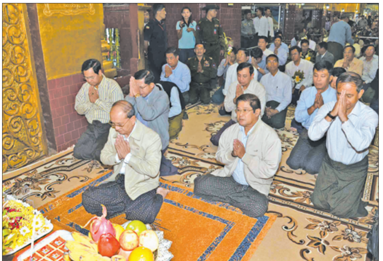
President U Thein Sein paying homage to Maha Muni Buddha Image in Mandalay.