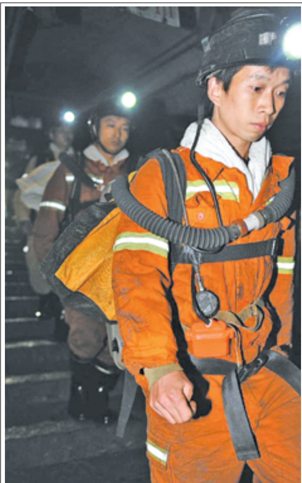
Rescuers work at a coal mine in Panxian County of the coal-rich Liupanshui City, southwest China's Guizhou Province, on 24 Nov, 2012. Eighteen miners were killed and five others remain trapped after a gas and coal outburst here on Saturday.