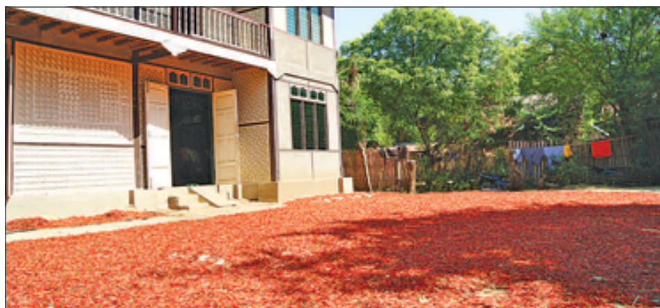
Photo shows chilies scattering on the ground to dry off at a village in Meiktila where chili growers get a good price for their produce.

On his arrival at Meiktila (Theegon) tollgate between mile post Nos (284/4) and (284/5), he oversaw the collecting of vehicle tolls and running of vehicles. — Kyemon