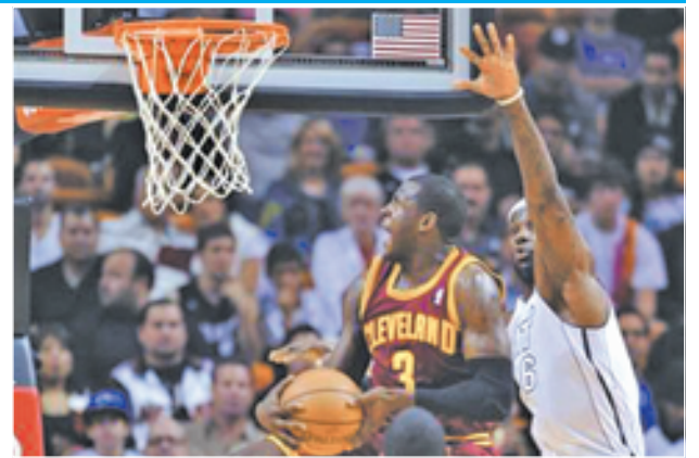
Miami Heat's LeBron James (R) defends Cleveland Cavaliers' Dion Waiters (L) during the first half of their NBA basketball game in Miami, Florida, on 24 Nov, 2012.