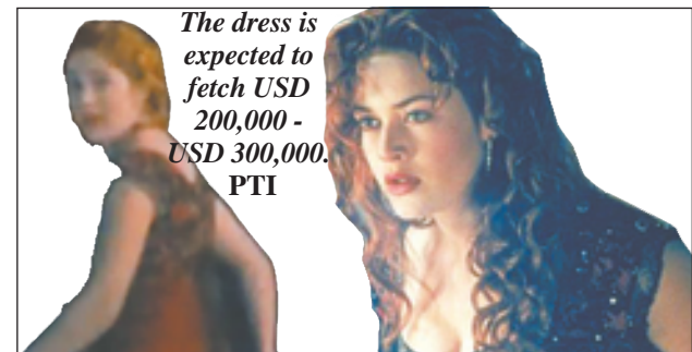
The dress is expected to fetch USD 200,000 - USD 300,000.

Legolas by Galadriel, played by Cate Blanchett. The bow is 6 feet long and is expected to fetch USD 80,000 to USD 120,000. The laser firing, vaporizing helmet is one of the greatest artifacts in science fiction film history.