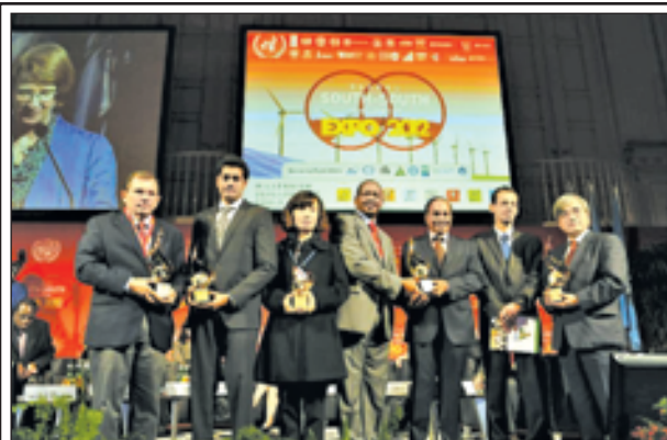
The recipients of Annual South-South Cooperation Awards and the Champions for South-South Cooperation and Triangular Cooperation Awards pose for group photos at the closing ceremony of the Global South-South Development (GSSD) Expo 2012 at the Hofburg Palace in Vienna, capital of Austria, on 23 Nov, 2012. UN agencies on Friday promised to exert more efforts together with their partners and developing countries to enhance South-South cooperation for a sustainable development of the South.

The causes of both accidents are under investigation.—Xinhua