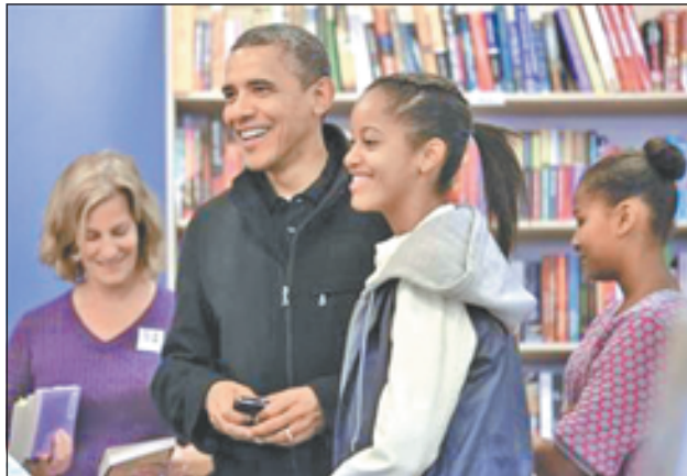
US President Barack Obama and his daughters Malia and Sasha (R) visit One More Page bookstore in Arlington, Virginia, on 24 Nov, 2012.

is needed to cushion the economic impact of the looming fiscal cliff, Obama declined to answer, saying "we're doing Christmas shopping."