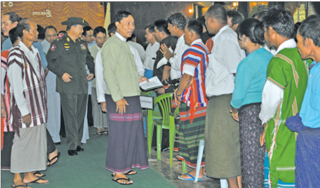
Speaker of Pyithu Hluttaw Thura U Shwe Mann cordially meets local national races in Hpa-an.

NAY PYI TAW, 25 Nov— Speaker of Pyithu Hluttaw Thura U Shwe Mann called for mutual understanding among national brethren in the interests of respective regions and the nation as he met local national races from Mon and Kayin States today.