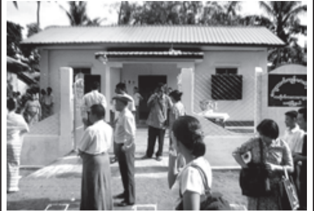
Kataikkalay rural health care centre.

THATON, 25 Nov—The handing over ceremony for rural health care centre of Kataikkalay village, Thaton Township, Thaton District was held at the centre on 20 November.