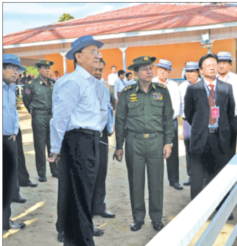
President U Thein Sein looks into reconstruction of Ayeyawady Bridge (Yadana Theinga) in Kyaukmyaung Sub-Township.