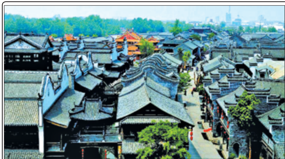
File photo taken on 18 May, 2011 shows the scenery of Tai'erzhuang ancient city in Zaozhuang, east China's Shandong Province. Tai'erzhuang ancient city was approved to be the national 5A-level tourist area on 22 Nov, 2012.

The shooting occurred at 13:00 local time (1200