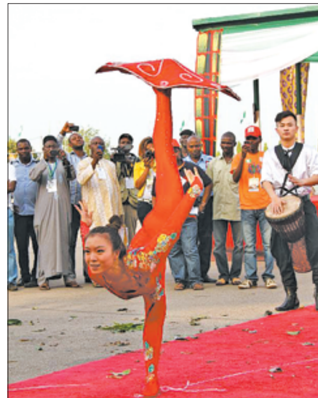
Artists from China perform at the opening ceremony of 2012 Abuja Carnival in Abuja, the capital city of Nigeria, on 24 Nov 2012.—XINHUA

Straddling black and Arab Africa on the continent’s west coast, Mauritania, a country of 3.2 million people, has been hit by two coups since 2005.— Reuters