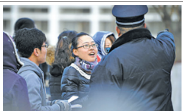
An examinee asks about the way to the examination room of the 2013 civil service exams in Yinchuan, capital of northwest China's Ningxia Hui Autonomous Region, on 25 Nov, 2012. More than 1.5 million people took part in the nationwide exams in China to qualify for about 20,000 state civil service posts on Sunday. —XINHUA