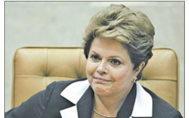
Brazil's President Dilma Rousseff participates in the ceremony of investiture for the new President and Vice-President of the Supreme Court, ministers Joaquim Barbosa and Ricardo Lewandowski, in Brasilia on 22 Nov, 2012.

speeded-up approvals. Police have been investigating the bribery ring since 2010 when an official in the government accounting office who was offered $150,000 for a favourable report got cold feet, returned the money he had been paid and blew the whistle.—Reuters