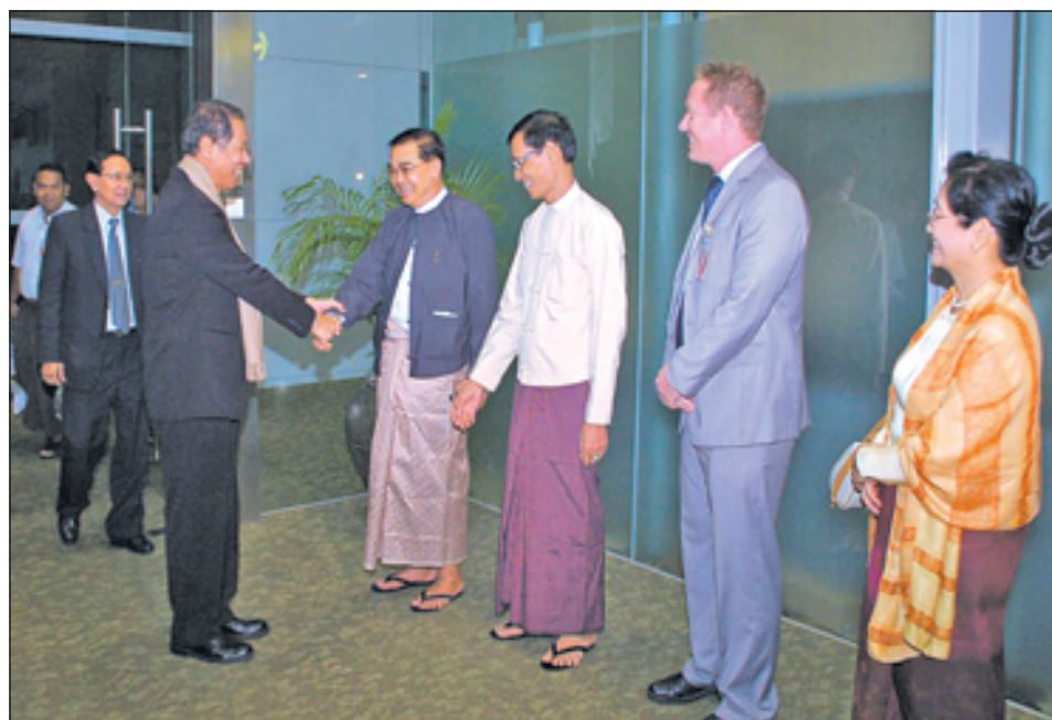
Deputy Speaker of Pyithu Hluttaw U Nanda Kyaw Swa being welcomed back by officials at the Yangon International Airport.