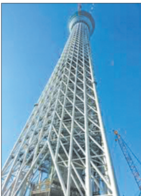
Tokyo Skytree seen in Tokyo's Sumida Ward on 22 November, since its opening to the public.