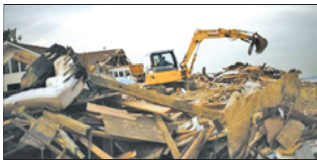
A worker removes the debris of a home destroyed by Hurricane Sandy in Union Beach, New Jersey on 20 Nov, 2012.