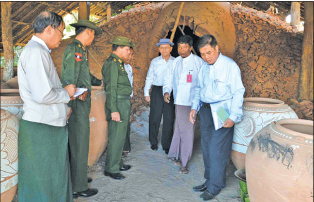
President U Thein Sein looks into damages of pottery industry in Kyaukmyaung Sub-township.—MNA

for each damaged kiln for reconstruction. He encouraged them to redouble their efforts without a sense of loss.