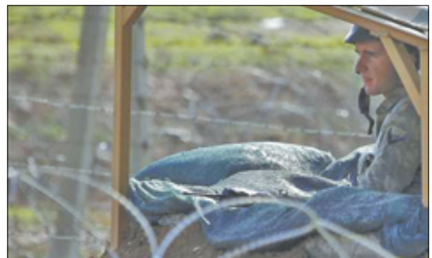
A Turkish soldier takes up his position near the border with Syria as seen from the Turkish border town of Ceylanpinar, Sanliurfa Province, on 24 Nov, 2012.

"We asked for Patriots from NATO taking into account the critical situation that emerged on our border with Syria ... The aim is for the protection of the widest possible area in Turkey," Yilmaz told reporters. "We expect the NATO Council to make its decision within the week," he said.