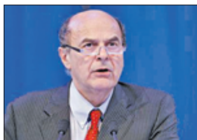
Secretary of the Italian PD (Democratic Party) Pier Luigi Bersani delivers a speech during a political rally with European Socialists in Paris on 17 March 2012

In a second round Bersani is likely to pick up the votes of third-placed left-winger Nichi Vendola, the openly gay governor of the southern Puglia region. The