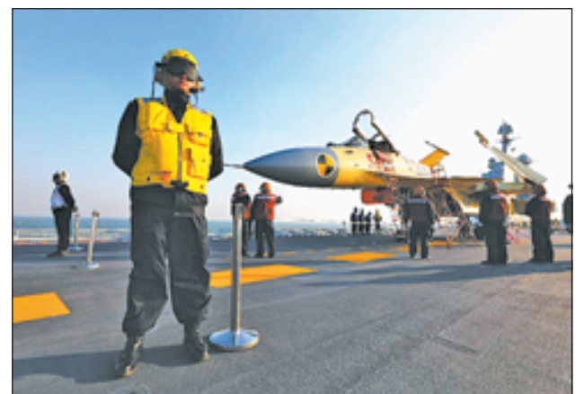
This undated photo shows staff members checking a carrier-borne J-15 fighter jet on China's first aircraft carrier, the Liaoning.

Since the carrier entered service, the crew have completed more than 100 training and test programmes. The successful flight landing also marked the debut of the J-15 as China's first generation multi-purpose carrier-borne fighter jet, the PLA Navy said. Designed by and made in China, the J-15 is able to carry multi-type anti-ship, air-to-air and air-to-ground missiles, as well as precision-guided bombs.—Xinhua