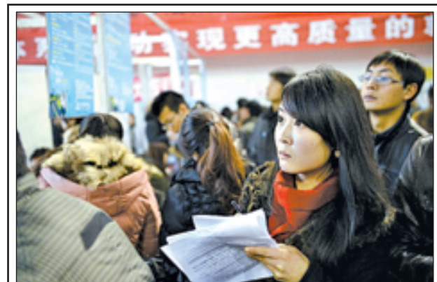
A female job seeker looks for vacancies at a job fair held in Yinchuan, capital of northwest China's Ningxia Hui Autonomous Region, on 24 Nov, 2012. The job fair provided 8,500 vacancies and attracted more than 15,000 applicants.