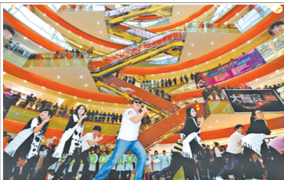
Contestants perform during a competition of dancing "Gangnam Style" in a shopping mall in Shenyang, capital of northeast China's Liaoning Province, on 24 Nov, 2012. All the contestants were citizens without professional dance training.