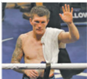
Britain's Ricky Hatton reacts after losing to the Ukraine's Vyacheslav Senchenko in their boxing match at the Manchester Arena in Manchester, northern England on 24 Nov, 2012.

LONDON, 25 Nov— Britain's Ricky Hatton announced his retirement from boxing for a second time after his comeback ended in a ninth-round knockout defeat by Ukrainian welterweight Vyacheslav Senchenko in Manchester, England on Saturday. Britain's 34-year-old two-weight former world champion had lost 4-1/2 stone in preparation for his first fight in 3-1/2