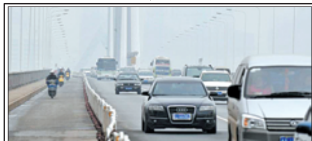
Vehicles are seen on a foggy day in Changsha, capital of central China's Hunan Province, on 24 Nov, 2012. Heavy fog brought inconvenience to local residents in Changsha on Saturday.—XINHUA

matic cooperation in all fields, strengthen their cooperation in the international arena" so as to push forward the bilateral ties to new heights, Chen said. In addition, the deepening bilateral women's exchanges served to strengthen the "traditional friendship" of the two countries, Chen said, adding China would like to further promote China-Russia women's exchanges.—Xinhua