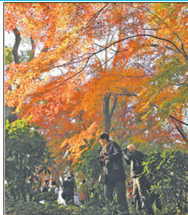
Photographers take pictures of maple leaves in a botanical garden in Nanjing, capital of east China’s Jiangsu Province, on 24 Nov 2012.

The two incidents increased worries that the debt crisis which has hit Greece hard since 2009, has weakened security measures at museums and archeological sites.