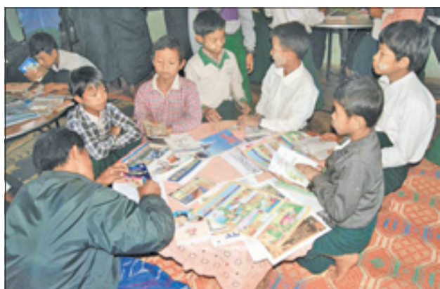
People reading at mobile library in Lawpita model village of Loikaw Township.