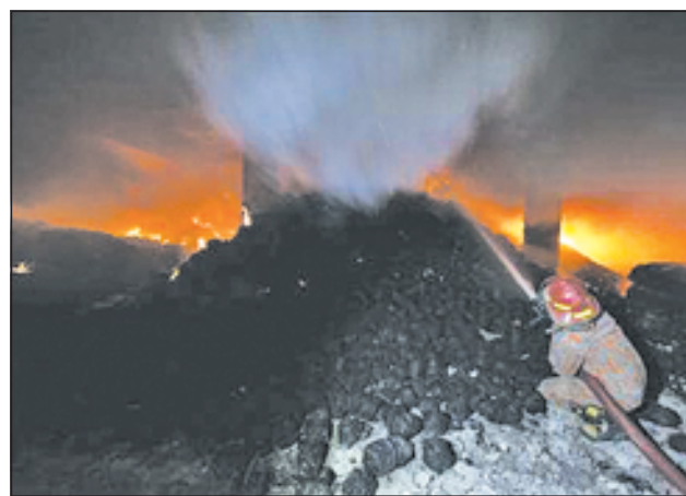
A firefighter tries to control a fire at a garment factory in Savar, outskirts of Dhaka on 24 Nov, 2012.