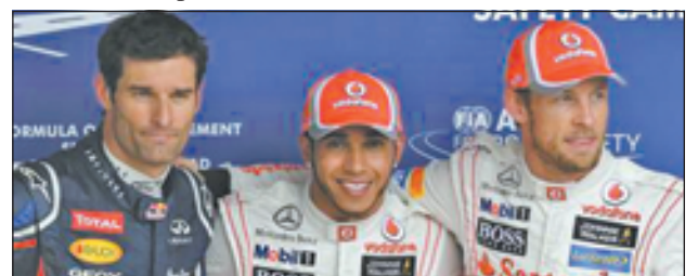
(L to R) Red Bull Formula One driver Mark Webber of Australia, McLaren drivers Lewis Hamilton and Jenson Button of Britain pose for photos after the qualifying session of the Brazilian F1 Grand Prix at Interlagos circuit in Sao Paulo on 24 Nov, 2012.