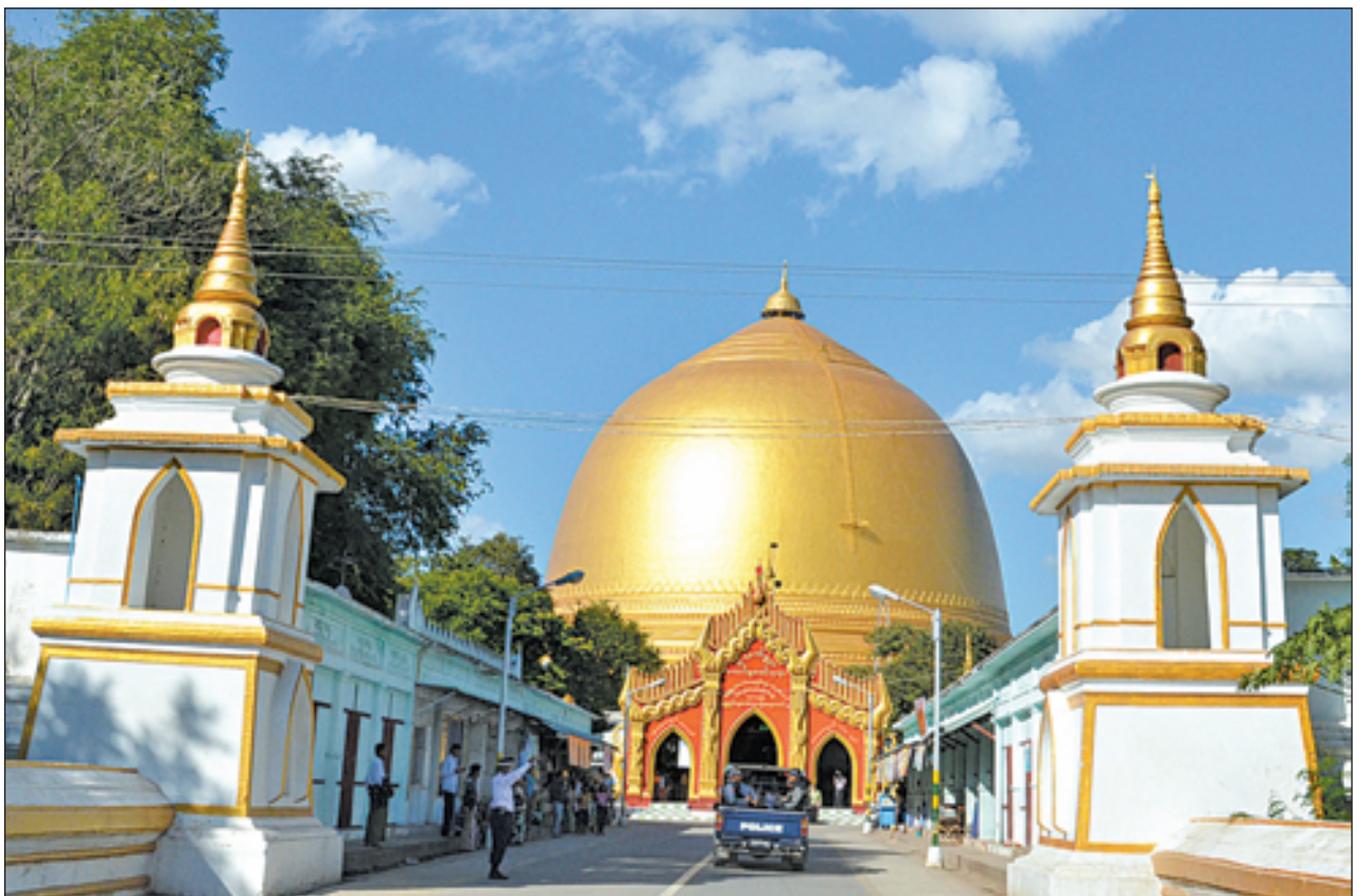
Photo shows Kaunghmudaw Pagoda after maintenance of its umbrella.