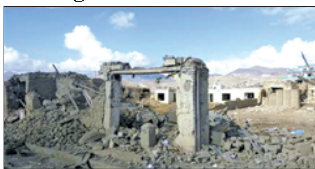
Debris from a bomb blast lies in Wardak province on 23 Nov, 2012.

(ISAF) said fewer than six coalition troops had sustained minor injuries in the bombing close to the provincial governor's office,