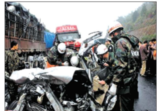
Rescuers work at the scene of a vehicle pileup on the Shenyang-Haikou Expressway in Fuding, southeast China's Fujian Province, on 22 Nov, 2012. Five people have died and two others were injured in a pileup involving five vehicles in the Fuding section of the Shenyang-Haikou Expressway on Thursday morning. The two injured people were carrying slight injuries and sent to hospital. Traffic has resumed on the expressway section, and the cause of the accident is being investigated.