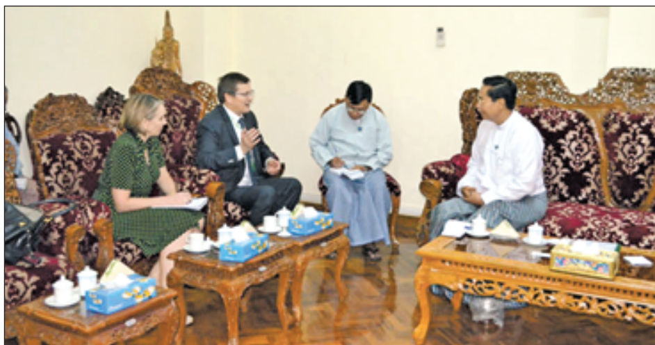
Union Minister U Ohn Myint holding talks with New Zealand Ambassador Mr Tony Lynch and party.

NAY PYI TAW, 24 Nov— Union Minister for Livestock and Fisheries U Ohn Myint received Bangkok-based New Zealand Ambassador to Myanmar Mr Tony Lynch and party at his office yesterday noon.