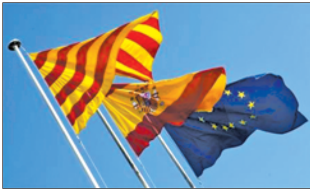
Flags of Catalunya (L-R), Spain and EU wave near Barcelona on 15 Nov, 2012.

Other problems relate to the scale of Spain's — and the region's — existing debt problems as well as how much more it may cost banks and companies