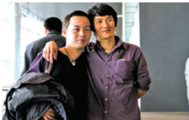
Two of the four Chinese oil workers who were released by members of the Revolutionary Armed Forces of Colombia (FARC) guerrilla group, arrive at El Dorado International Airport, in Bogota, Colombia, on 23 Nov, 2012.