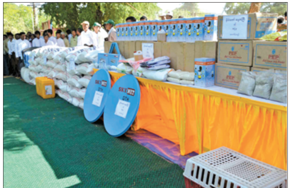
Relief items seen at Malei Village in Kanbalu Township.