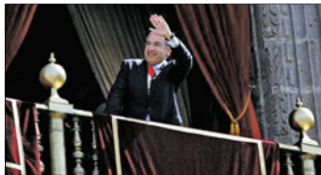
Mexico's President Felipe Calderon waves to the crowd after presiding for the last time as President over a military parade in celebration of the 102nd anniversary of the Mexican Revolution on Zocalo Square in Mexico City on 20 Nov, 2012.

MEXICO CITY, 24 Nov—Mexican President Felipe Calderon has one non-urgent item pending on his agenda in the dying days of his presidency