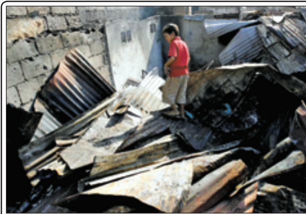
A boy looks for reusable materials after a fire hit a slum area in Quezon City, the Philippines, on 24 Nov, 2012. Three children died in the fire, while more than 100 families were left homeless.—XINHUA

Representative Scott Rigell, a Virginia Republican who won re-election despite disavowing the pledge, expressed similar sentiments publicly in a 17 November interview on CNN.—Reuters