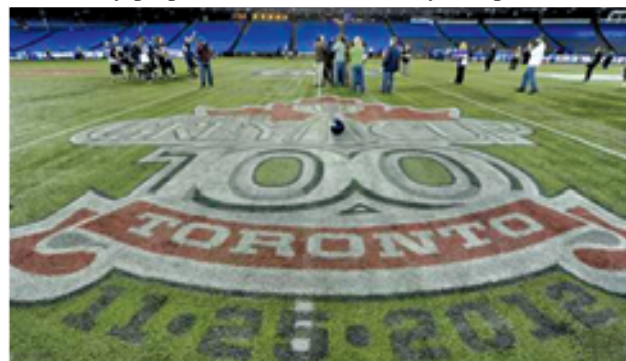
Toronto Argonauts players are interviewed on the field behind the Grey Cup logo during practice ahead of the 100th Grey Cup CFL football game in Toronto on 23 Nov, 2012.

Sometimes referred to as the Grand National Drunk, most fans are guaranteed a fun weekend but the Grey Cup has also