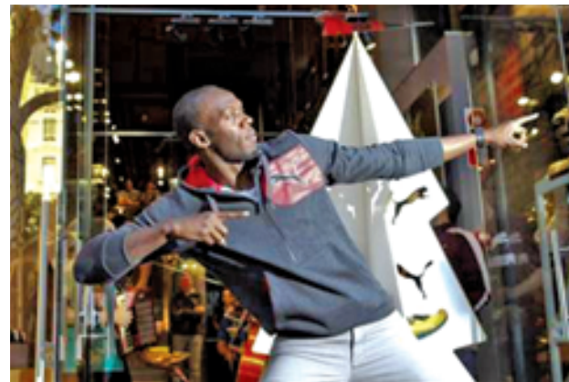
Jamaica's double Olympic champion sprinter Usain Bolt strikes a pose while inaugurating a Puma store in Barcelona on 23 Nov, 2012.

"I have discussed it with my coach (Glen Mills) and he has explained to me that the majority of the time with long jumpers, it messes with your knees," Bolt said. "If you want to try long jump it's kind of hard because then you could pick up some knee problems and then you never know, it might be a career threatening injury." So for me I think I'll just avoid long jump and think about something else."—Reuters