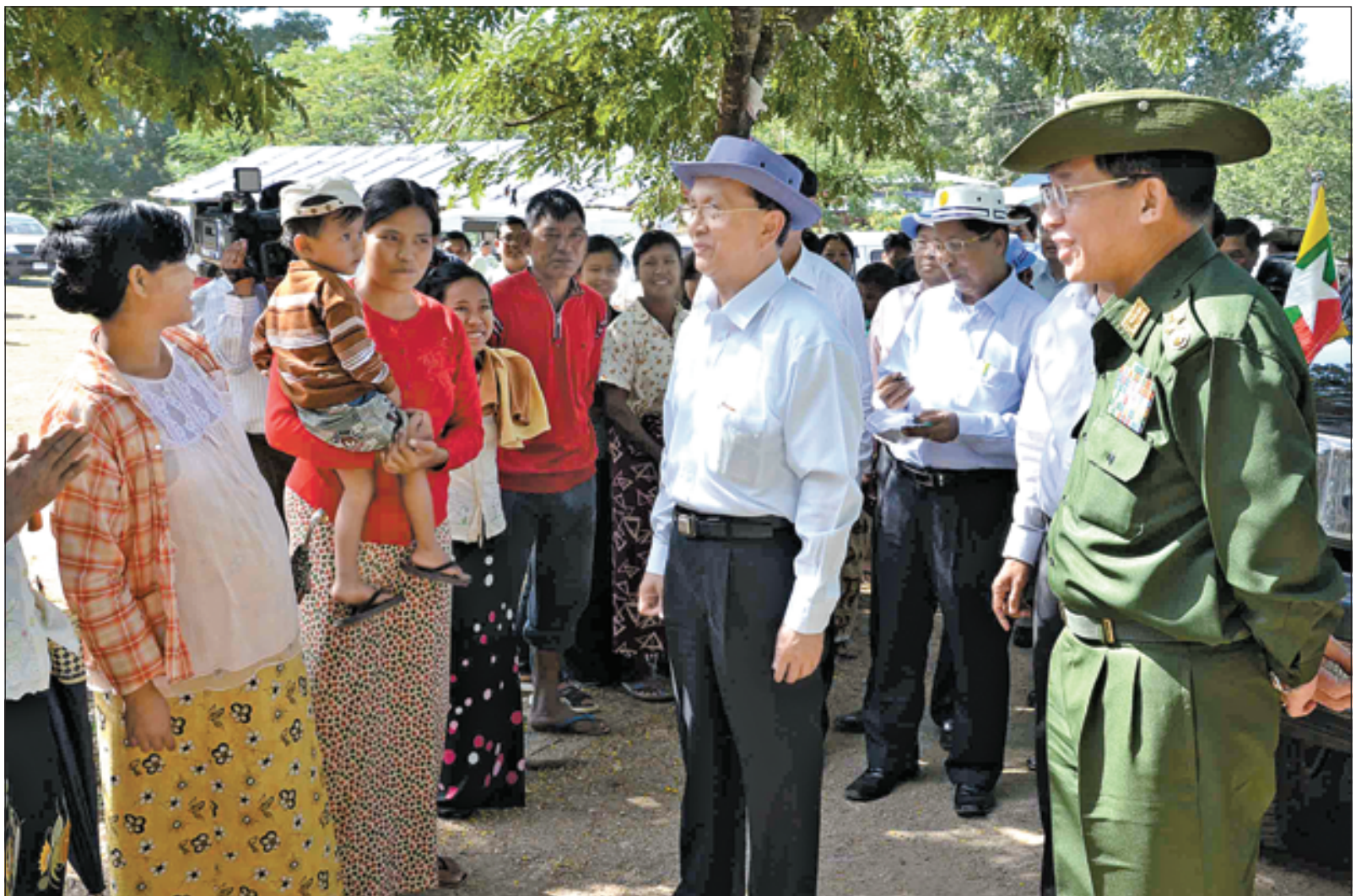
President U Thein Sein cordially greets local people at Myodwin relief camp in Thabeikkyin Township.—MNA

At the airport lounge, Mandalay Region Chief Minister U Ye Myint and Chief Minister of Sagaing Region U Tha Aye reported on earthquake, loss and damage of lives and property, relief works and plans for rehabilitation tasks.