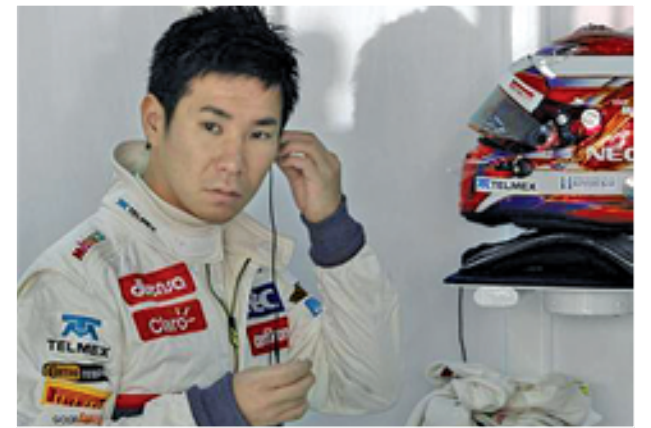
Sauber Formula One driver Kamui Kobayashi of Japan gets ready for the first practice session of the Indian F1 Grand Prix at the Buddh International Circuit in Greater Noida, on the outskirts of New Delhi, on 26 Oct, 2012.

"For Sauber it is my last race but for myself I think it is different. "Everybody looks really worried but I don't really worry at the moment, I try to work hard to get sponsors and