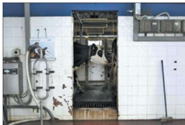
A cow is seen inside an area where the animals are milked at a farm in Orchomenos village, some 140Km (86 miles) north of Athens on 20 Nov, 2012.

"If the price fell to 40 cents none of us would be able to survive. We are barely getting by at these prices,"