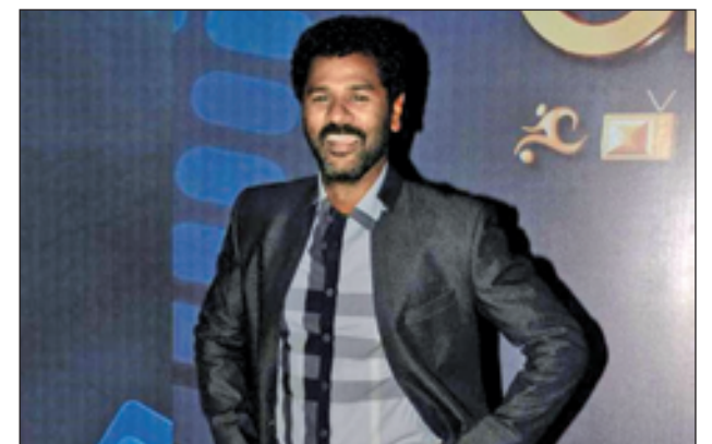
In the film, Prabhu plays a dance teacher from Chennai.