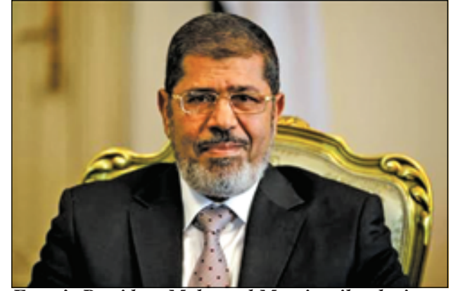
Egypt's President Mohamed Mursi smiles during a meeting with South Korea's presidential envoy and former Foreign Minister Yu Myung-hwan (not in picture) at the presidential palace in Cairo on 8 Oct, 2012.

It stated that all decisions taken by Mursi until the election of a new parliament were exempt from legal challenge.