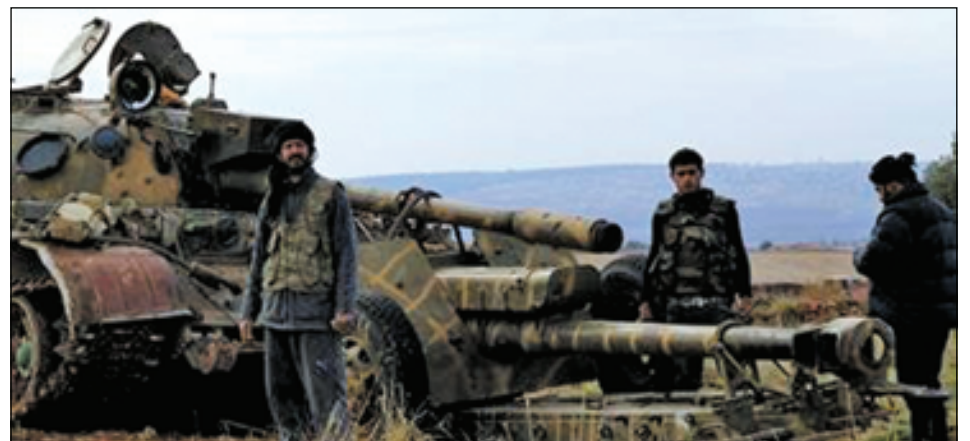
Free Syrian Army fighters pose near a tank after they said they fought and defeated government troops at military base at the town of Atareb near Aleppo on 19 Nov, 2012.

"The name of our country no longer needs to emulate that of other nations," Calderon said. "Forgive me for the expression, but Mexico's name is Mexico."—Reuters