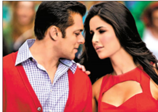
Katrina Kaif proclaimed that she would have done it provided she got a certain per cent of commission from Salman Khan’s pay for the movie.

MUMBAI, 24 Nov — According to reports, Salman Khan was unavailable to receive his award at the People’s Choice awards event recently.