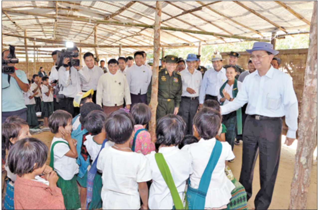
President U Thein Sein cordially greets students at relief camp in Sampanago Village.

In so doing, the President said that tasks should be