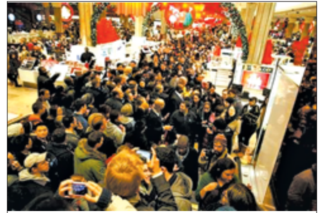
Customers shop at Macy's department store in New York on 25 Nov, 2011. —REUTERS

But crowds were thin at the flagship Lord & Taylor on 5th Avenue, where workers voluntarily signed up for holiday shifts for an extra compensation day and holiday pay.—Reuters