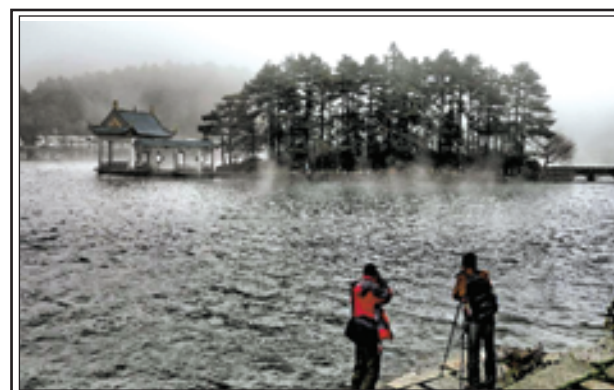
Photographers take pictures of scenery on Lushan Mountain in east China's Jiangxi Province, on 23 Nov, 2012.

ing slashing the number of legislators, copped much criticism from academics and political experts. Moon, a 59-year-old former human rights lawyer who served as chief of staff to late President Roh Moo-hyun, said that he is "sorry" for Ahn and his supporters. The current President Lee Myung-bak is constitutionally barred from seeking a second five-year term. Xinhua