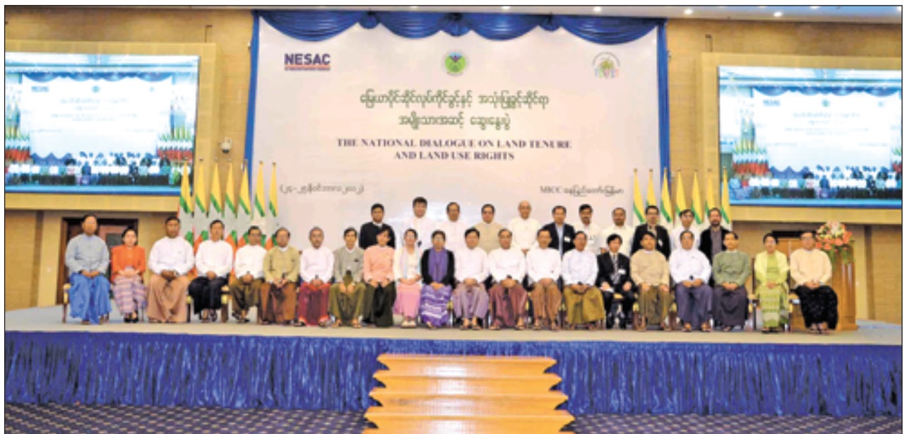
Those attendees pose for documentary photo at National Dialogue on Land Tenure and Land Use Rights.

NAY PYI TAW, 24 Nov— In his address at the National Dialogue on Land Tenure and Land Use Rights at Myanmar International Convention Centre, here, this morning, Union Minister at the President Office U Tin Naing Thein quoted the President as saying that although invitation of foreign investments aimed at ensuring job creation, generating incomes, improving socio-economic status and living standard of the people, thereby contributing towards national development, it was required to uphold interest of the nation and its people and in order not to tarnish the image of the nation and its