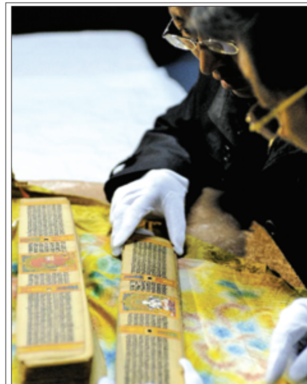
Scholars study Palm-Leaf Manuscripts of Buddhist Sutras in Lhasa, capital of southwest China's Tibet Autonomous Region, on 21 Nov, 2012. The palm-leaf manuscripts of Buddhist sutras have been well preserved in China. Palm-Leaf sutras refer to the Buddhist classics inscribed on the leaves of palm trees. The practice originated in India and was introduced into China more than 1,000 years ago during the Tang Dynasty (618-907).

The amendments and supplements will be made public to garner people's comments from 2 January, 2013 and tabled for approval by the NA by the end of the year. Apart from the Resolution on conducting vote of confidence and on people's opinions on the draft amendment of the Constitution in 1992, Vietnamese law-makers have also approved nine laws including Law on State Reserve, Law on the Capital City and Law on Anti-corruption (amended), Law on Land (amended), and gave opinions to six draft other laws to ensure that they keep abreast with reality. Xinhua