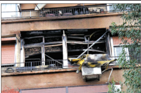
Photo taken on 22 Nov, 2012 shows shattered windows of a building that has been hit by a mortar at the Damascus' neighbourhood of Mazzeh in Syria. Syria's state TV said two mortar shells have hit two buildings, one related to the Transport Ministry, causing material damages and injuring one person.