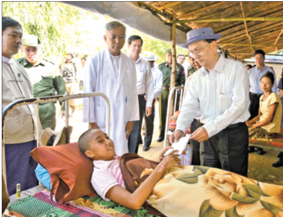
President U Thein Sein presents cash assistance to a patient at Thabeikkyin makeshift Hospital.

At present, the stake of relief works for the quake victims has finished.