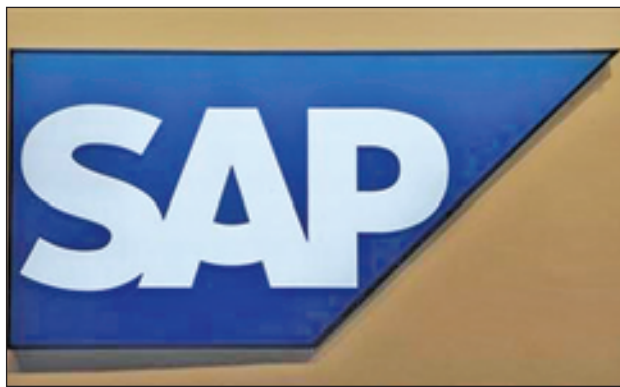
Logo of German company SAP is pictured at the CeBit computer fair in Hanover, on 6 March, 2012.

The group, which competes with Oracle, IBM and Microsoft, wants to invest $2 billion in China by 2015. It also has a mid-term