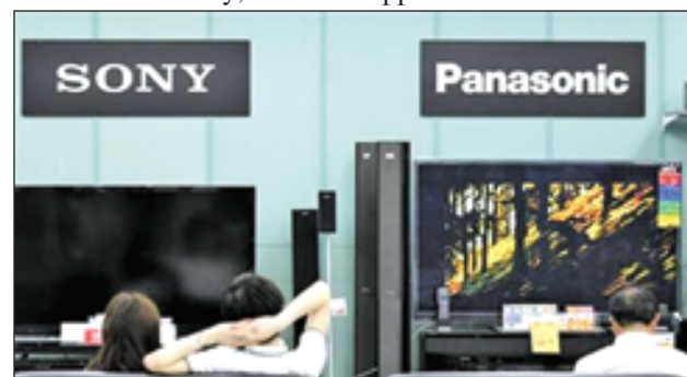
Sony and Panasonic TV sets are displayed at an electronic shop in Tokyo on 22 June, 2012.