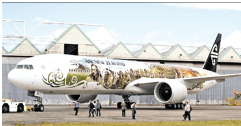
Air New Zealand reveals a Boeing 777-300ER Aircraft with graphics of the upcoming film The Hobbit: An Unexpected Journey to promote its premiere in Auckland, New Zealand, Nov. 24, 2012.

WELLINGTON, 24 Nov — Air New Zealand on Saturday launched a new Hobbit-themed aircraft in celebration of the much anticipated release of film The Hobbit: An Unexpected Journey.