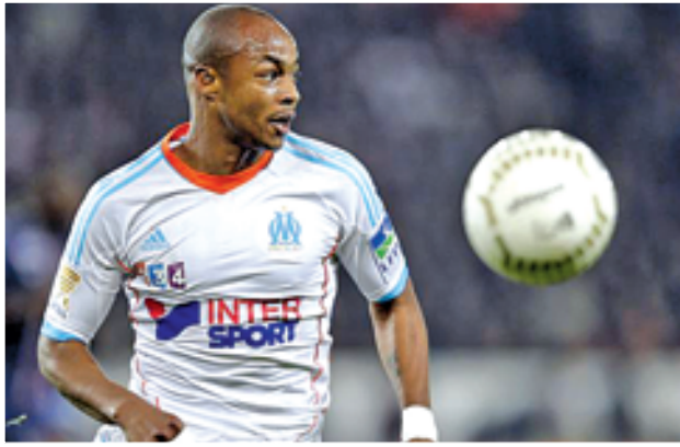
Ghanaian international Andre Ayew

ACCRA, 24 Nov—The Confederation of African Football (CAF) on Friday named Ghanaian international Andre Ayew among other players to contest the African Footballer of the Year 2012 Award.