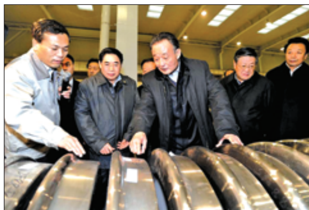
Wu Bangguo (C), chairman of the Standing Committee of the National People’s Congress of China, gets knowledge about technical issues of wheel production as he visits a heavy industry enterprise in Taiyuan, capital of north China’s Shanxi Province, on 20 Nov, 2012. Wu made an inspection tour in Shanxi from 19 to 23 Nov.

levels. He also praised local enterprises’ efforts in ecological protection through promotion of a recycling economy. He encouraged the industrial firms to contribute to clean energy development and energy efficiency improvements.