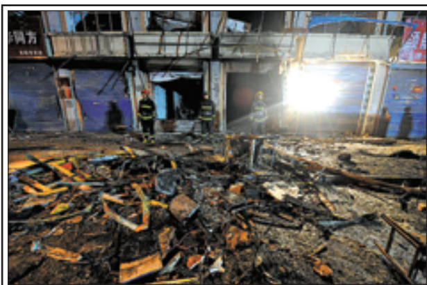
Photo taken on 24 Nov, 2012 shows the explosion site in Shouyang County of Jinzhong City, north China's Shanxi Province. An explosion at a restaurant on Friday evening killed at least eight people and injured another 37. An investigation is conducted to determine the cause of the explosion.

President Lula was conferred the prize by Indian President Pranab Mukherjee at a function in the national capital for his "outstanding contribution to the cause of eliminating hunger and promoting inclusive growth in Brazil, for his advocacy of stronger ties among the developing economies and for his signal contribution to the cause of the India-Brazil partnership", the reports said. "In awarding the prize for 2010 to President Lula, we are honouring today an outstanding champion of the developing world. President Lula has been a transformative figure in Brazil. The people of India hold you in high esteem. Xinhua