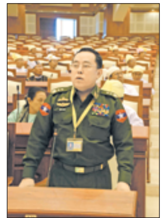
Union Defence Minister Lt-Gen Wai Lwin making clarification.

The next one is the problem of demonstration. Currently, nothing can be done since 18 November. If those projects are stopped like this, it causes the loss of USD 2 million monthly. The crisis has dragged on since