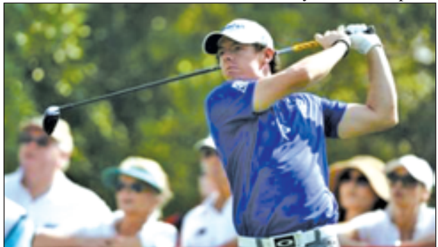
Rory McIlroy of Northern Ireland watches his shot from the third tee during the first round of the DP World Tour Championship at Jumeirah Golf Estates in Dubai, on 22 Nov, 2012.