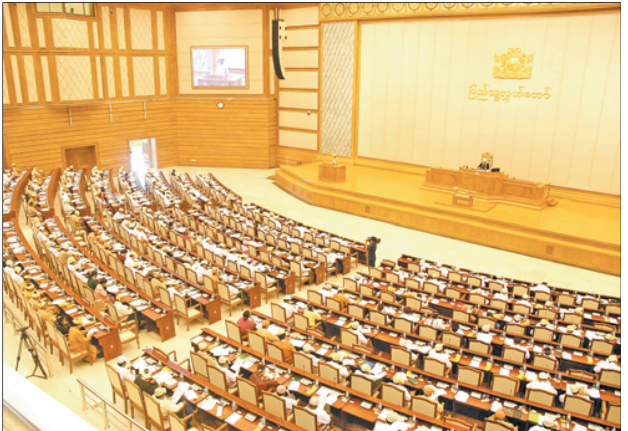
Pyithu Hluttaw session in progress.