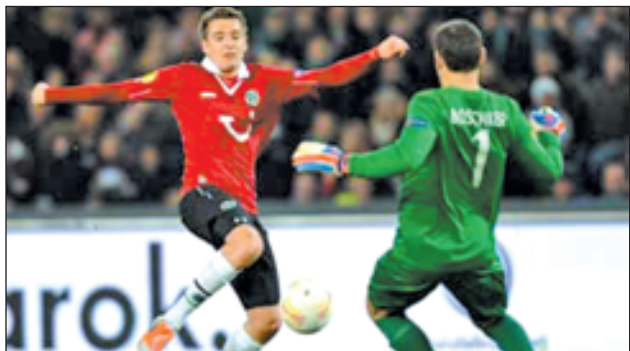
Hannover 96 tie FC Twente 0-0 at Europa League.