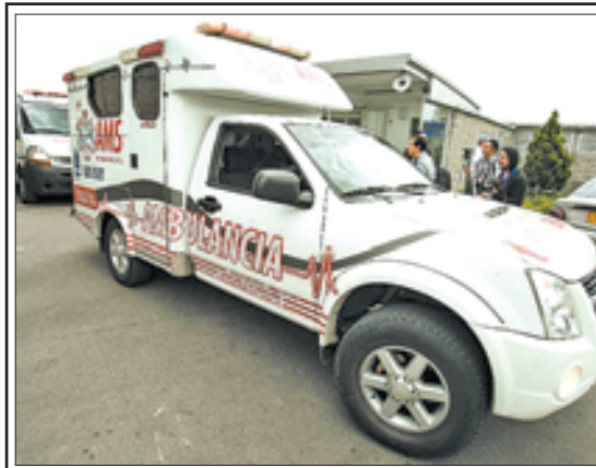
An ambulance transporting four Chinese workers of an oil company just released from their FARC captors is seen at the airport in Bogota, Colombia, on 22 Nov, 2012. Four Chinese hostages who were kidnapped in Colombia by the Revolutionary Armed Forces of Colombia (FARC) guerrilla group last year have been released, the Chinese embassy in Colombia confirmed on Thursday.