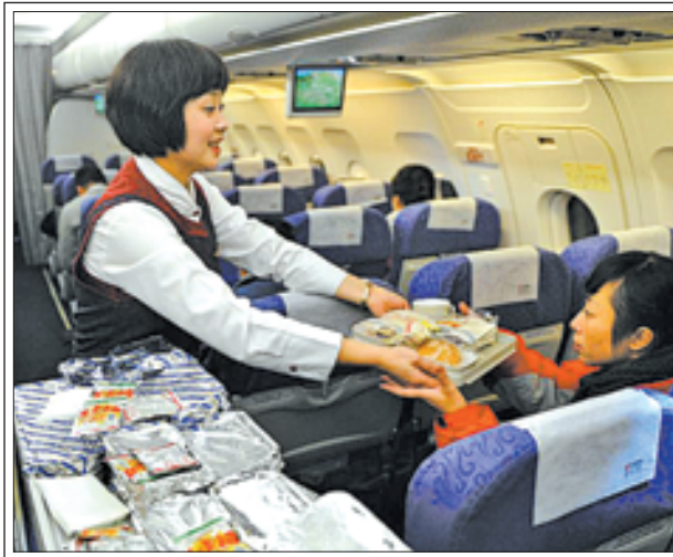
A stewardess serves passengers on the test flight to the Daochengyading Airport in Daocheng County of the Tibetan Autonomous Prefecture of Garze, southwest China's Sichuan Province, on 23 Nov, 2012. The first test flight of the airport successfully landed Friday. With the height of 4,411 metres above sea level, the Daochengyading Airport becomes the highest civil airport in the world.