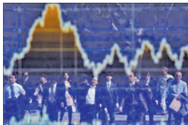
People are reflected on an electronic board displaying a graph showing the movement of Nikkei share average outside a brokerage in Tokyo on 7 Nov, 2012.

Activity was subdued across financial markets on Friday, with a public holiday in Japan and US trading curtailed by the long Thanksgiving weekend.