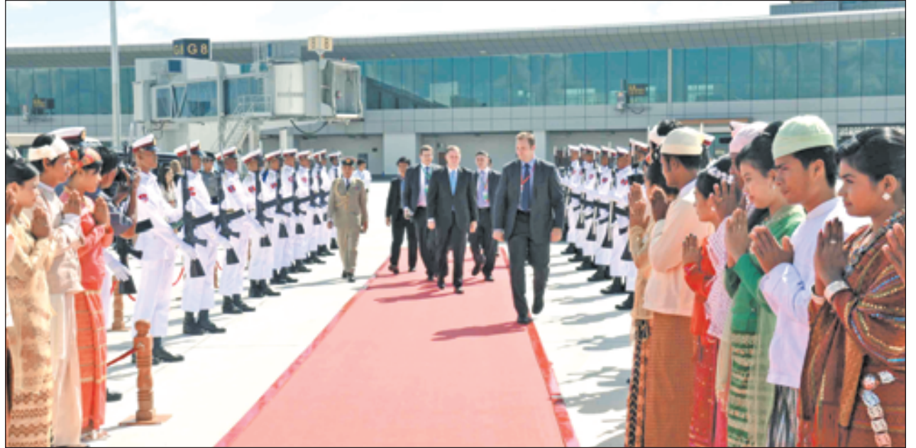
New Zealand Prime Minister Mr John Key and party being seen off at the Nay Pyi Taw International Airport by officials.

NAY PYI TAW, 23 Nov—A visiting goodwill delegation led by New Zealand Prime Minister Mr John Key who paid a goodwill visit to Myanmar