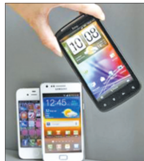
A shop attendant poses with replicas of HTC, Samsung and Apple's smartphones inside a mobile phone shop in Taipei on 6 April, 2012.

argued it is "almost certain" that the HTC deal covers some of the same patents involved in its own litigation with Apple. The court on Wednesday ordered Apple to produce a full copy of the settlement agreement "without delay", subject to