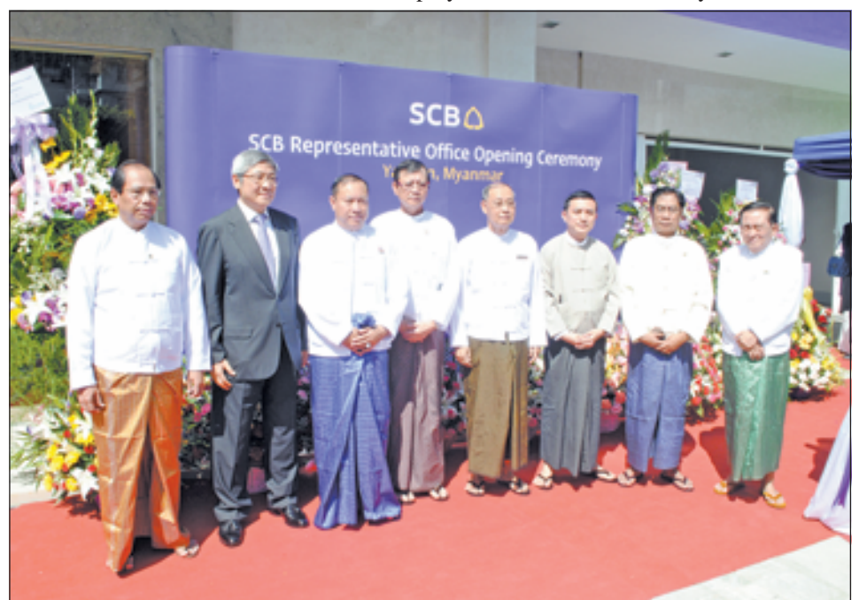
The opening ceremony of Representative Office of Siam Commercial Bank PCL (SCB) in progress.