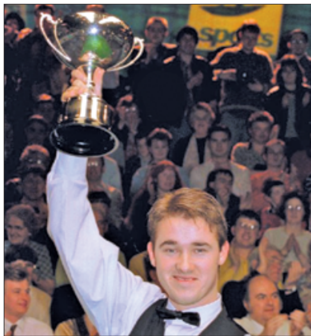
The King of Snooker Stephen Hendry

British Kelly Fisher, five-time champion of women's snookers world, German Ralf Souquet, King of Pool, Irish veteran Ken Doherty, 9 ball stars Chris Melling, Darren Appleton, Gareth Potts and Mike Hill will join legend Hendry as the international squad to play against top eight Chinese qualifiers from March to December. The Chinese 8-Ball Pool, which is mixed of the snooker style, nine ball table size and American 8-Ball Pool competition rules, has become Chi-