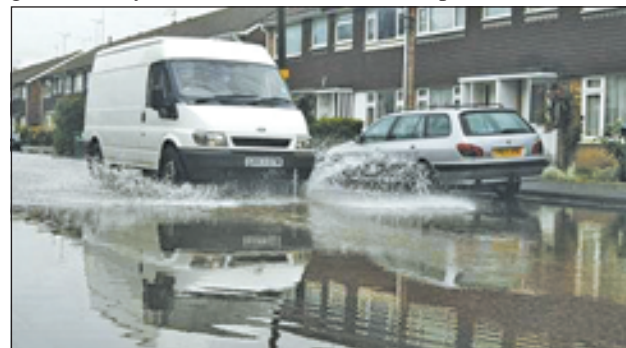
A van drives through flood water at Littlehampton in southern England on 11 June, 2012.