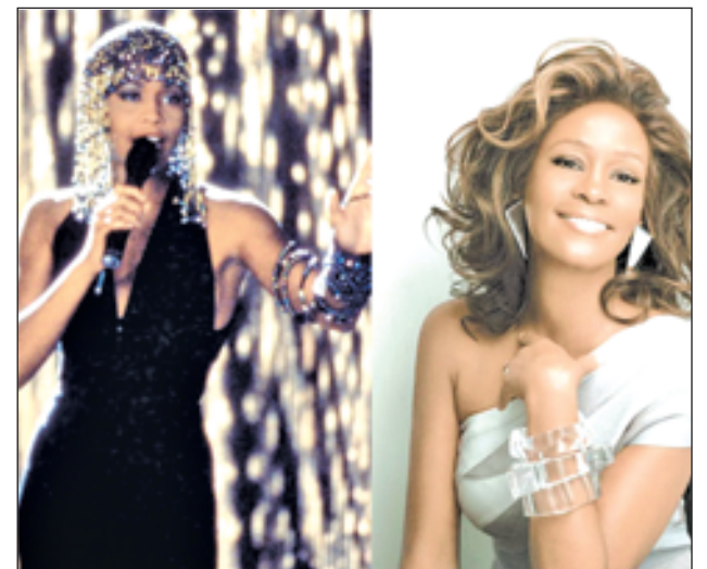
Late singer Whitney Houston