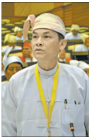
Deputy Attorney-General U Tun Tun Oo taking part in discussions.

sentatives held discussions on the proposal submitted by Chairman of Committee for Public Complaints and Appeals U Aung Nyein of Magway Region Constituency No (2) urging the Union government to investigate the cases in which service personnel saw losses as they have no right to make complaints while they were hired