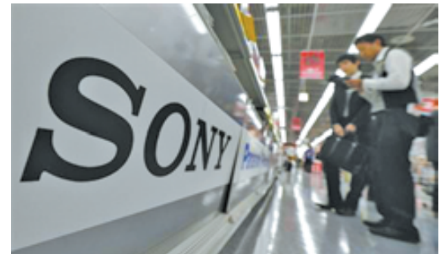
A Sony logo is seen as customers look at Sony digital cameras at an electronics shop in Tokyo, in this 10 May, 2012 file photo.