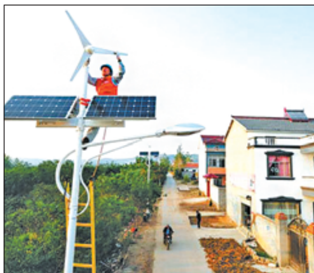
A worker maintains a solar-powered street lamp in Laiian county of Anhui Province. The county is developing more wind and solar energy. —XINHUA

Also, China's low-carbon energy technologies lag far behind developed countries, except in the use of solar heated water and methane. The technological disadvantage results in higher costs and less market acceptance. Last but not least, China's geography makes it hard to develop new energies. —Xinhua