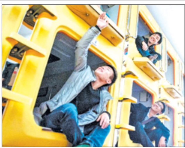
Guests sit in their rooms as they have a talk in a "capsule" hotel in Chongqing, southwest China, on 22 Nov, 2012. The "capsule" hotel, separates its space into 16 rooms with each 1.2 metres wide and 2.2 metres long. These rooms are equipped with power supply, clock, wall lamp, TV set, air conditioner and even WIFI, attracting many young people to lodge.