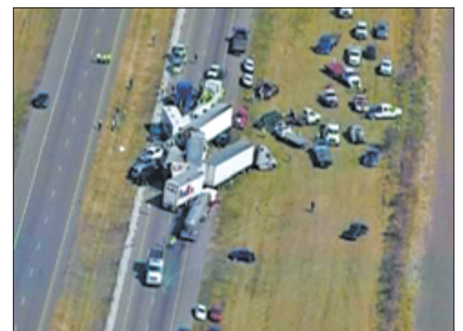
A pileup of 80 to 100 vehicles on a foggy Texas interstate near Beaumont, is pictured in this still image taken from video courtesy of KPRC-TV, on 22 Nov, 2012.—REUTERS

He said the initial accidents took place separately about a mile apart on the east—and westbound sides of the interstate. The highway had been crowded with motorists travelling over the Thanksgiving holiday. Many of the vehicles were moving close to the posted speed of 70 mph despite dense fog that limited visibility, Carroll said. The westbound lanes of the interstate have been reopened, he said.—Reuters