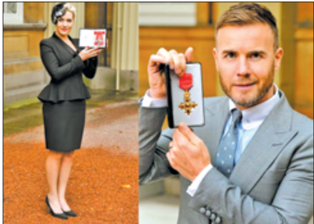
Titanic star Kate Winslet and singer Gary Barlow have been awarded with Britain's highest honour by the Queen for their accomplishments in entertainment field.