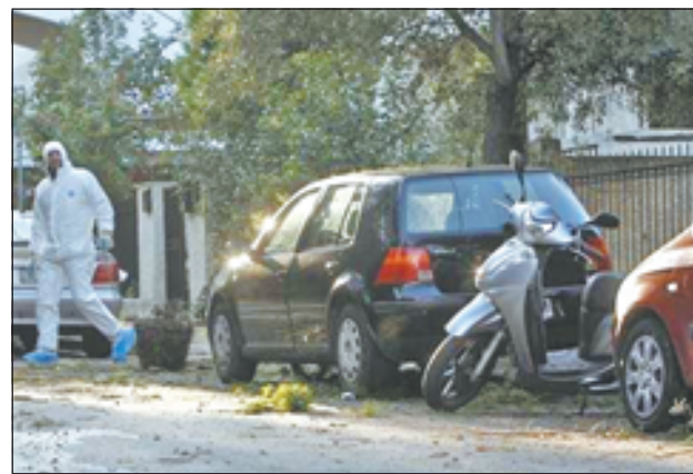
A Greek police explosives expert searches for evidence at the area outside a house in Chalandri suburb, north of Athens, on 22 Nov, 2012.

have exploded in Greece in recent years as the country struggles through harsh austerity measures imposed