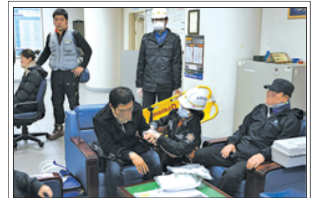
Passengers receive treatment after accident in the subway of Busan, South Korea, on 22 Nov, 2012. More than 100 people were injured when two subway trains collided with each other on Thursday in South Korea's southern city of Busan, local TV reports said.