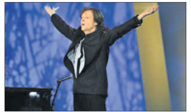
Musician Paul McCartney performs during the opening ceremony of the London 2012 Olympic Games at the Olympic Stadium on 27 July, 2012.

The version of "He Ain't Heavy, He's My Brother" will hit the shelves on 17 December and is among the frontrunners to claim the coveted Christmas No. 1 slot in the British singles chart.