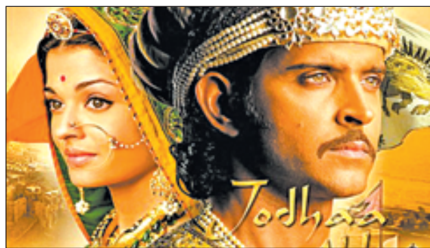
Jodhaa Akbar featured Hrithik Roshan as Akbar and Aishwarya Rai as Jodhaa.

"I am extremely happy and would really like to thank the Marrakech International Film Festival for selecting Jodhaa Akbar . This is an honour for me to showcase my film