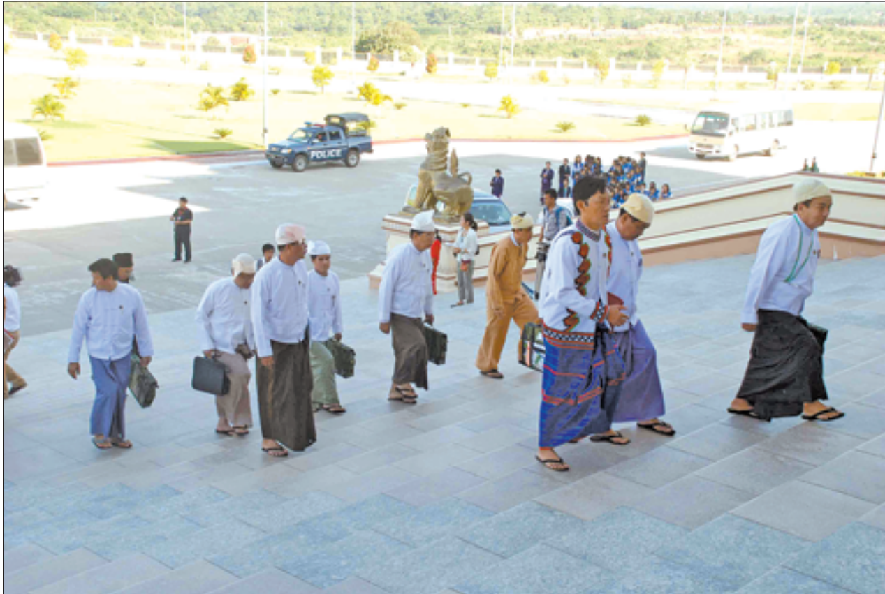
Arrival of Pyithu Hluttaw representatives at fifth regular session of First Pyithu Hluttaw.

The committee secretary proposed the Hluttaw to accept the report and the Hluttaw approved it. Then, the fifth regular session of First Pyithu Hluttaw came to an end.