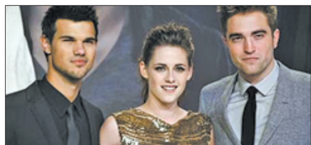
Cast members Robert Pattinson (R), Kristen Stewart (C) and Taylor Lautner pose for pictures before the German premiere of The Twilight Saga: Breaking Dawn Part 2 in Berlin, on 16 Nov, 2012.