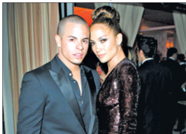
The On The Floor hitmaker says her dancer boyfriend, who has a central part in her Dance Again concerts, always has her best interests at heart.