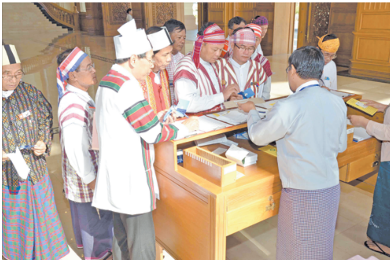
Amyotha Hluttaw representatives sign attendance book.—MNA

Similarly, a moderate earthquake of magnitude 4.3 Richter scale with its epicenter inside Myanmar (about 3 miles Northeast of Singu) about 40 miles North of Mandalay seismological observatory was recorded at 4 pm 53 min 34 sec MST today, announced Meteorology and Hydrology Department.—MNA