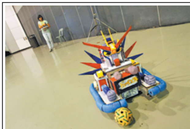
A student controls her robot during the competition of Tagisang Robotics 2012 in Pasay City, the Philippines, on 22 Nov, 2012. A total of 31 teams participated in the competition on Thursday.