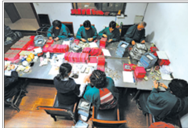
Staff members at the cash center of the Taicang Public Bus Company sort notes and coins at the cash centre of the Taicang Public Bus Company in Taicang, east China's Jiangsu Province, on 18 Nov, 2012. Each day, staff members at the cash centre of the Taicang Public Bus Company need to sort out notes and coins collected from all bus fare boxes of the company. It takes four hours on average to finish a day's work: the total earnings of 52 bus lines.

Procurement Committee Ministry of Information Office No. 7, Nay Pyi Taw Tel: 067 - 412327, 79474