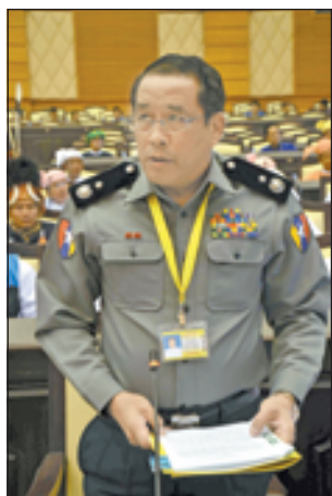
Deputy Home Affairs Minister Police Major Gen Kyaw Kyaw Tun participating in discussions.

discussed that the ministry has planned to upgrade 4295 schools across the nation adopting four-year plan from 2011-2012 to 2015-2016 academic year.