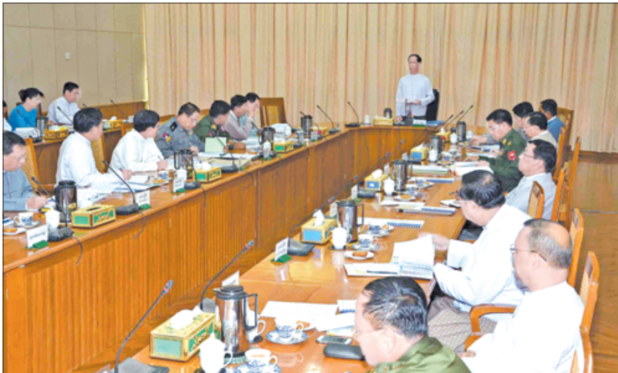
Vice-President of the Republic of the Union of Myanmar Dr Sai Mauk Kham making a speech at coordination meeting for holding 65 th Anniversary Independence Day Ceremony.