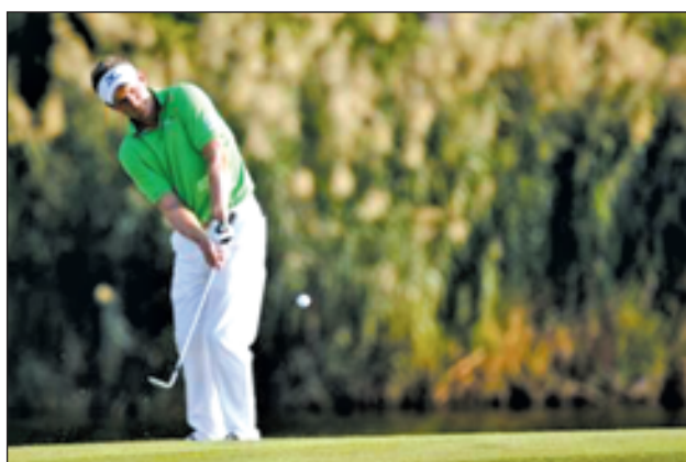
Luke Donald of England hits a shot onto the 17th green during the first round of the DP World Tour Championship at Jumeirah Golf Estates in Dubai, on 22 Nov, 2012.

Donald came to this event last year with the pres-