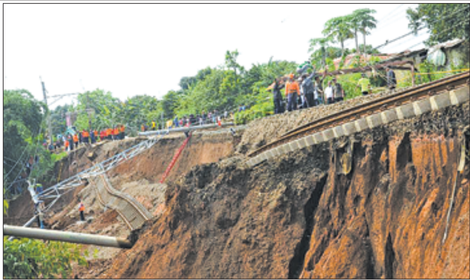
Staff members try to fix railway and electric wires broken in a landslide in Bogor, Indonesia, on 22 Nov, 2012. Landslide caused by rainfall on Wednesday night destroyed rails and led to the cancel of 98 flights.