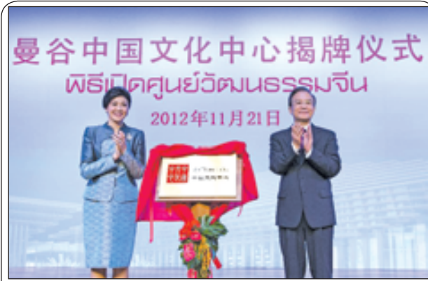
Chinese Premier Wen Jiabao (R) and Thai Prime Minister Yingluck Shinawatra attend the unveiling ceremony of the Chinese Culture Centre in Bangkok, Thailand, on 21 Nov, 2012.