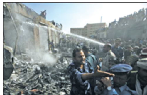
Firefighters work to extinguish a fire after a plane crashed in Sanaa on 21 Nov, 2012.

The plane came down in an abandoned produce market in the Hasaba District near the Yemeni capital's airport after suffering a technical problem, the official said. "The plane tried to land in an empty space