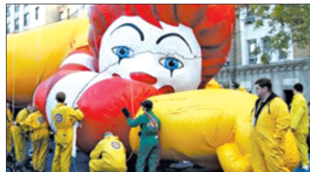
Workers fill a balloon in the shape of Ronald McDonald, with helium, ahead of the Macy's Thanksgiving Parade in New York, on 21 Nov, 2012.

in partnership with local community organizations and businesses, was coordinating 26,500 Thanksgiving meals for people hardest hit by the storm.