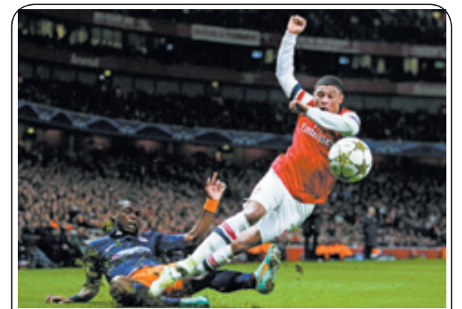
Alex Oxlade-Chamberlain (R) of Arsenal competes during the UEFA Champions League Group B match between Arsenal and Montpellier in London, Britain, on 21 Nov, 2012. Arsenal won 2-0.