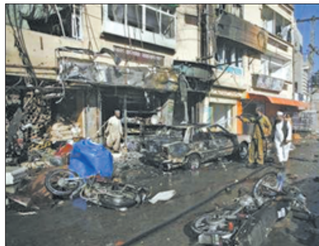
A firefighter sprays water on a vehicle at the site of a bomb attack in Quetta on 21 Nov, 2012.

In a separate attack, suspected militants shot dead four policemen in the northwestern town of Bannu, a police official said. Pakistan's Taliban movement claimed responsibility.—Reuters