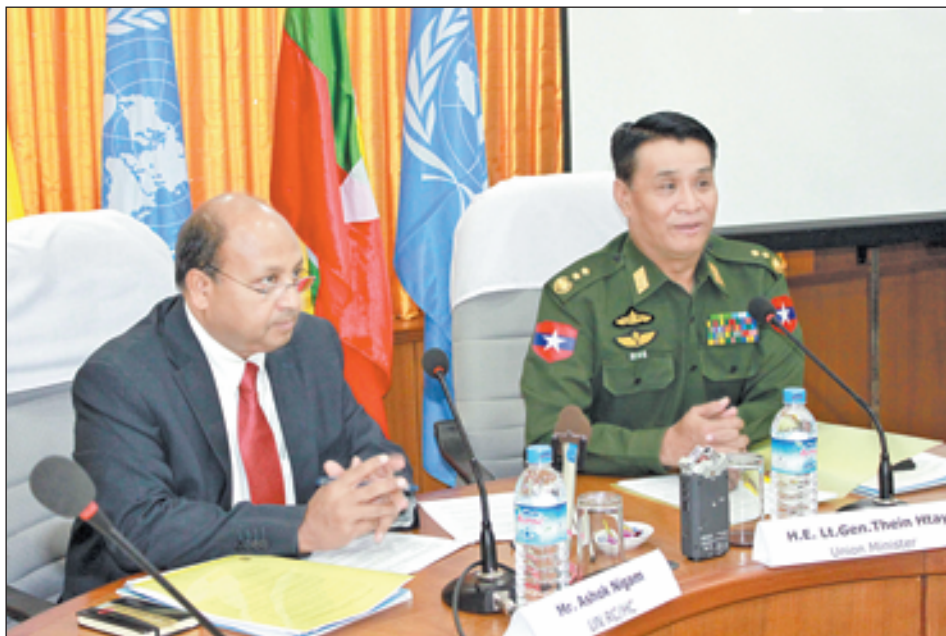
Union Minister for Border Affairs Lt-Gen Thein Htay speaking at the launching of Rakhine Response Plan.

NAY PYI TAW, 22 Nov—Union Minister for Border Affairs Lt-Gen Thein Htay gave a speech at the launching of Rakhine Response Plan at UMFCFI headquarters yesterday.