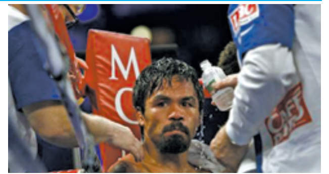
WBO welterweight champion Manny Pacquiao of the Philippines is treated in his corner between rounds during his title fight against Timothy Bradley Jr of the US at the MGM Grand Garden Arena in Las Vegas, Nevada on 9 June, 2012.