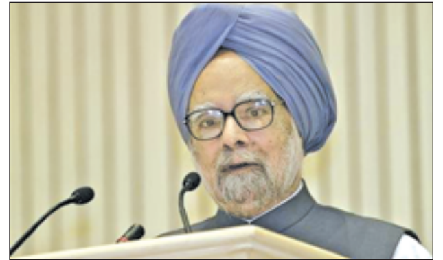
Indian Prime Minister Manmohan Singh speaks during the inauguration ceremony of International Academic Conference 2012, themed Economic Growth and Changes of Corporate Environment in Asia, in New Delhi on 22 Sept, 2012.

Criticised in the past for cold-shouldering allies