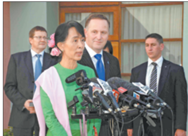
New Zealand Prime Minister Mr. John Key and Pyithu Hluttaw Rule of Law and Peace and Tranquility Committee Chairperson Daw Aung San Suu Kyi reply queries of local and foreign media.

NAY PYI TAW, 22 Nov—New Zealand Prime Minister John Key met with Myanmar students who will