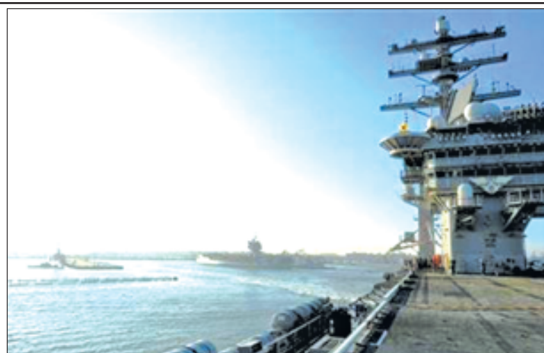
The aircraft carrier USS Dwight D Eisenhower departs Naval Station Norfolk in this file photo taken on 25 August, 2011.

Instead, the Eisenhower will return in December to the United States, where the Navy will resurface its flight deck, and it will return to the Middle East region early next year for an additional deployment lasting several more months. The Nimitz will deploy once repair work is complete, the Navy said.—Reuters