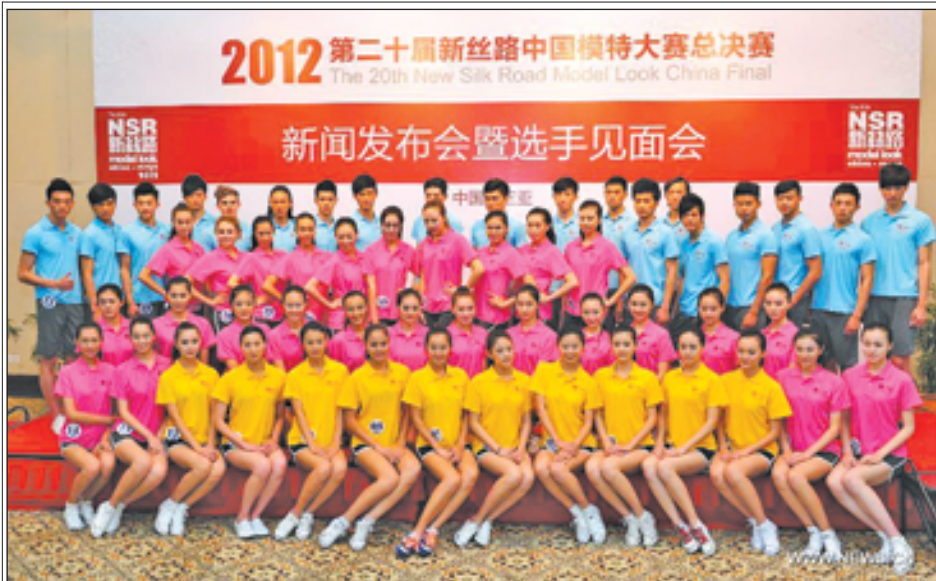
Contestants of the 20th New Silk Road model look China final pose for a group photo at a Press conference in Sanya, a seaside city in south China's island of Hainan, on 21 Nov, 2012. The final of the model competition will be held in Sanya on 30 November, which involves some 60 contestants from home and abroad.