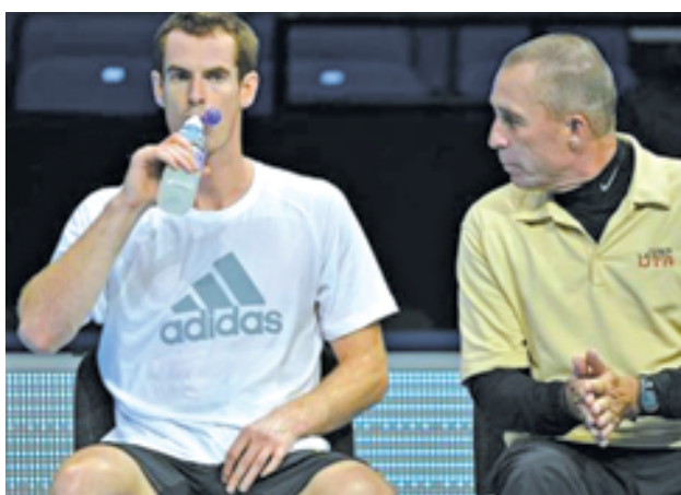
Andy Murray of Britain (L) speaks with his coach Ivan Lendl during a practice session ahead of the ATP tennis finals at the O2 Arena in London on 4 Nov, 2012.

The former world number one — now a US citizen — steered Murray to the US Open crown in September, ending Britain's wait for a men's grand slam singles champion which had stretched back to 1936. Like Murray, Lendl lost the first four grand slam finals he contested but then went on to win eight, failing only