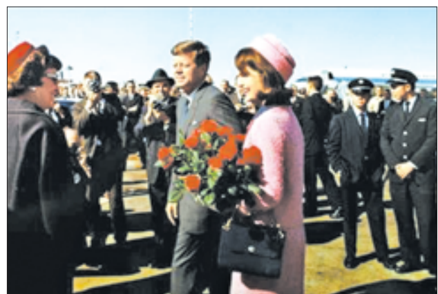
President John F. Kennedy and first lady Jacqueline Bouvier Kennedy arrive at Love Field in Dallas, Texas, in this November 22, 1963 handout photo courtesy of the John F. Kennedy Presidential Library.