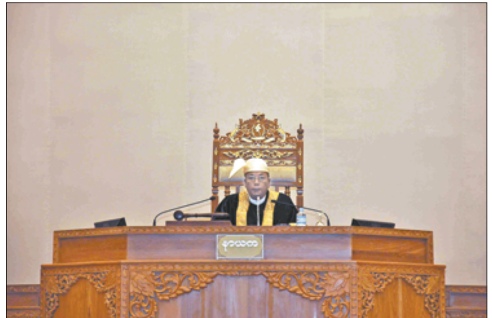
Speaker of Pyidaungsu Hluttaw U Khin Aung Myint at the fifth regular session.

U Kyi Tha of Gwa Constituency discussed signing of supplementary agreement of International Atomic Energy Agency. Deputy Foreign Affairs Minister U Thant Kyaw responded his discussion and the parliament passed