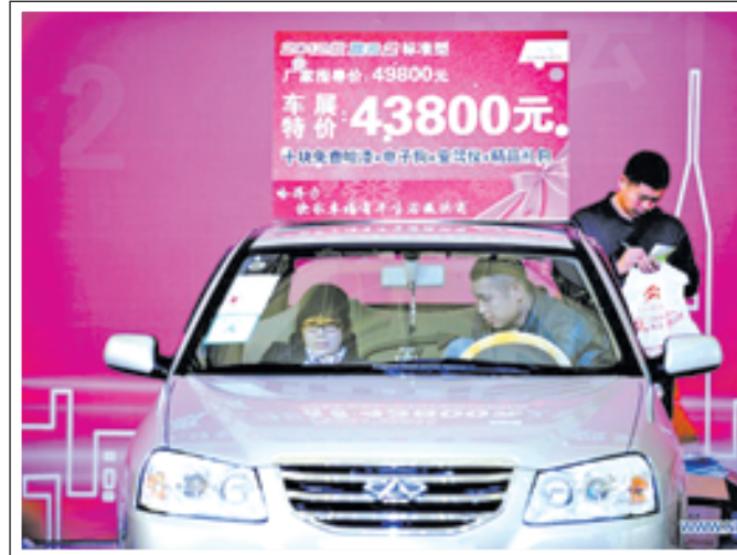
Visitors experience an economy car during the 2012 Harbin Autumn Automobile Exhibition in Harbin, capital of northeast China's Heilongjiang Province, on 20 Nov, 2012. Economy cars presented on the week-long exhibition with a price under 100,000 yuan (about 16,030 US dollars) attracted lots of attention.