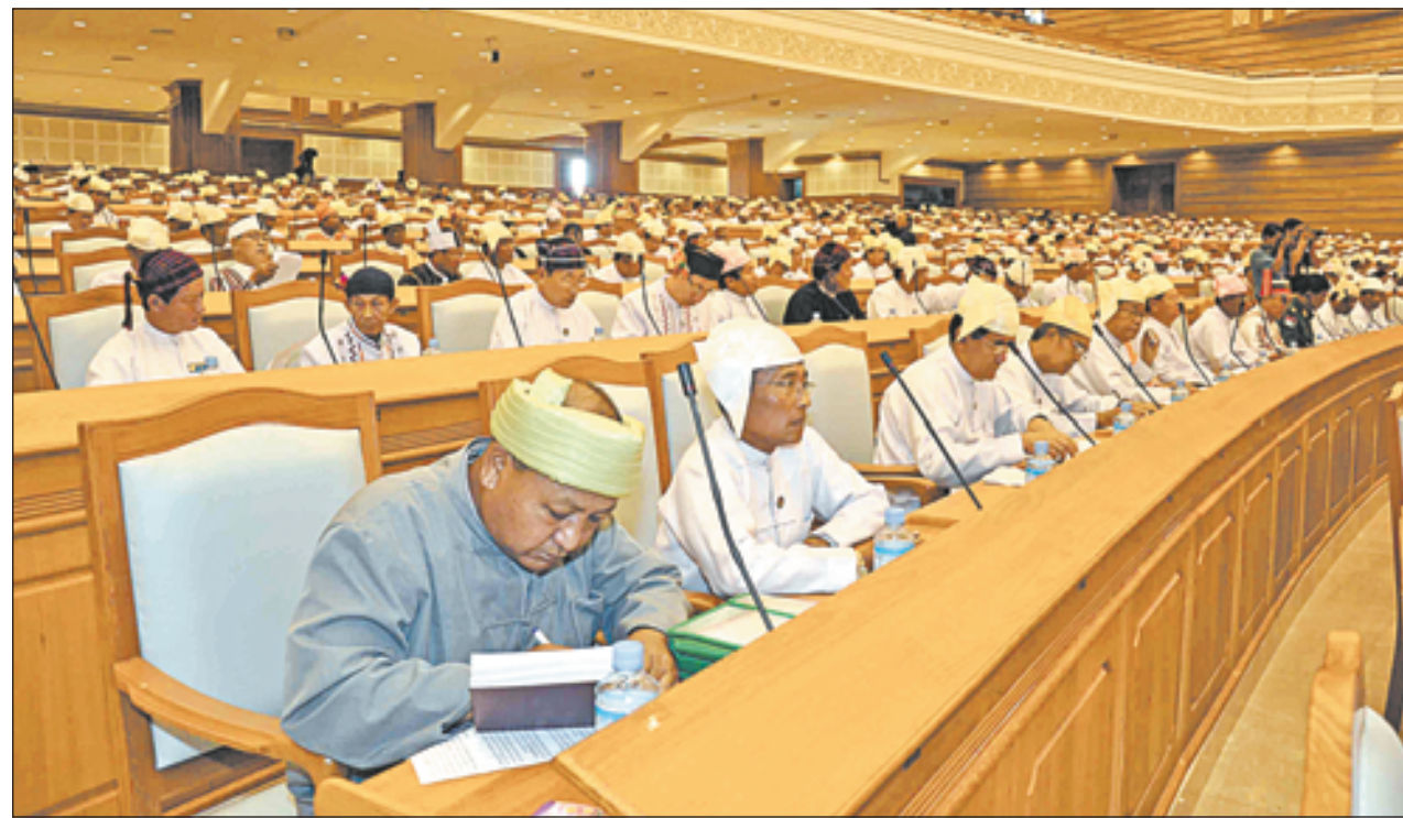
Pyidaungsu Hluttaw session in progress.

parliamentarian raised objection, the parliament approved the proposal of Parliament Administrative Committee.