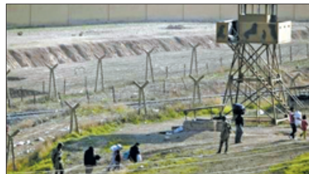
Syrian people, who are fleeing from their homes in the northern Syrian town of Ras al-Ain, walk near Turkish soldiers to cross the border fence from Ras al-Ain into Turkey, as seen from the Turkish border town of Ceylanpinar, Sanliurfa Province, on 21 Nov, 2012.

"Such a deployment would augment Turkey's air defence capabilities to defend the population and territory of Turkey," Secretary-General Anders Fogh Rasmussen said. "It would contribute to the de-escalation of the crisis along NATO's south-eastern border."