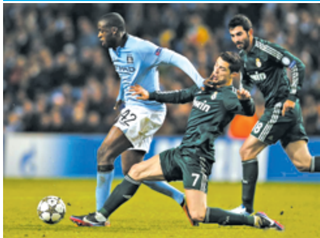
Cristiano Ronaldo (C) of Real Madrid vies with Yaya Toure (L) of Manchester City during the UEFA Champions League Group D match between Manchester City and Real Madrid at Etihad Stadium in Manchester, Britain, on 21 Nov, 2012. The match ended with a 1-1 draw.

MADRID, 22 Nov — Real Madrid drew 1-1 away to Manchester City on Wednesday night to assure their place in the last 16 of the Champions League. Karim Benzema scored a tenth minute goal after the Manchester City defence