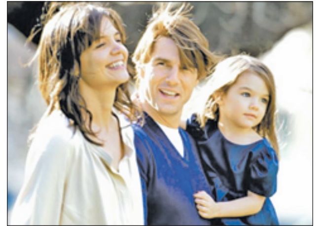
Katie Holmes and Tom Cruise parted ways in August this year.