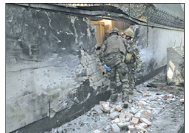
NATO troops inspect the site of a suicide bomb attack in Kabul on 21 Nov, 2012.

The Taliban took responsibility for the attack, which happened at 8.20 am (0350 GMT) local time, Taliban spokesman Zabihullah Mujahid told Reuters by telephone from an undisclosed location.