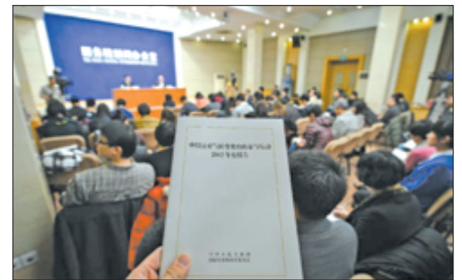
A copy of the annual report “China’s Policies and Actions for Addressing Climate Change” is shown during a Press conference in Beijing, capital of China, on 21 Nov, 2012.