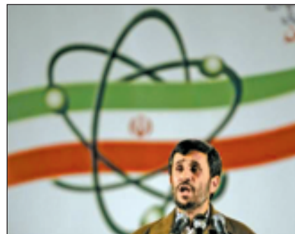
Iran's President Mahmoud Ahmadinejad speaks during a ceremony at the Natanz nuclear enrichment facility, 350 km (217 miles) south of Teheran, on 9 April, 2007.