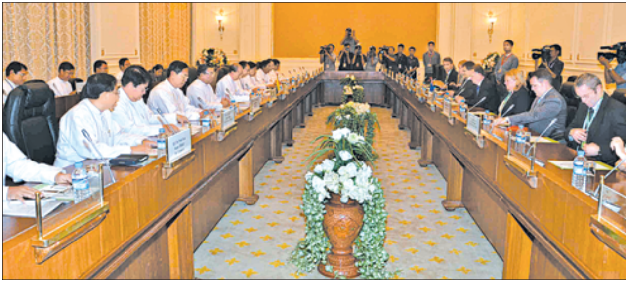
President U Thein Sein holds talks with New Zealand Prime Minister Mr John Key.