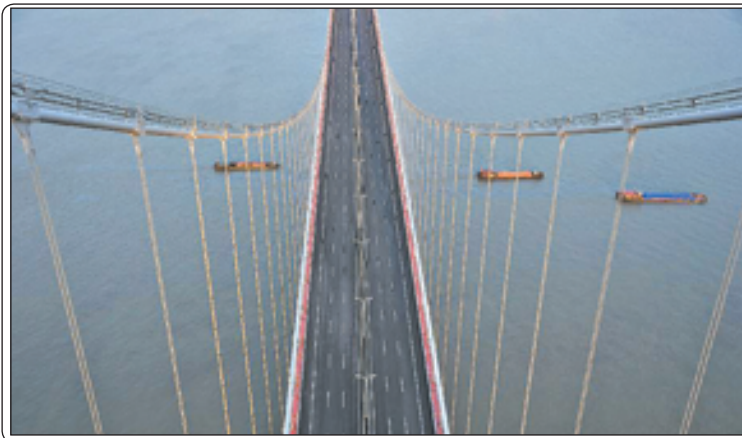
Photo taken on 4 Nov, 2012 shows the Taizhou Yangtze River Bridge in Taizhou, east China's Jiangsu Province. The bridge will open to traffic on 25 November.