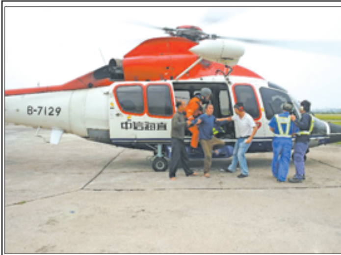
Rescuers of the First Rescue Squadron of the South China Sea carry three fishermen who got lost at Leizhou Bay area to safe place in Zhanjiang, south China's Guangdong Province, on 19 Nov, 2012. The squadron saved two sick fishermen and three missing fishermen from 17 Nov to 19 Nov.

According to the observations at (12.30) hrs MST today, the low pressure area over West Central Bay still persists. Weather is cloudy in the West Central Bay and partly cloudy in the Andaman Sea and elsewhere in the Bay of Bengal.