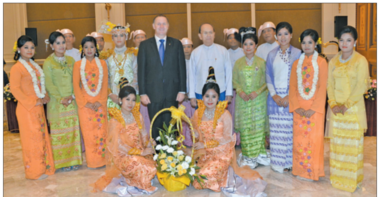
President U Thein Sein and New Zealand Prime Minister Mr John Key pose for documentary photo together with artistes from Fine Arts Department.

After that, the New Zealand Prime Minister said that both Myanmar and New Zealand are located in Asia-Pacific Region in which the fastest growth rate in the world was seen. New Zealand extended a welcome to Myanmar for its reintegration in the international community. He expressed his support for the counterpart's and government's efforts for better socio-economic status of local people and development and peace and