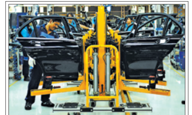
Technicians assemble cars of German made Mercedes-Benz in a PT. Mercedes-Benz Indonesia (PT MBI) plant in Bogor, Indonesia, on 21 Nov, 2012. MBI reports state that Mercedes had an increase in target market from 2011 to 2012 and invested some of 30 million euros in Indonesia from 2010 to 2012.

The Egypt-brokered truce took effect at 09:00 pm Gaza time (1900 GMT) the same day.— Xinhua