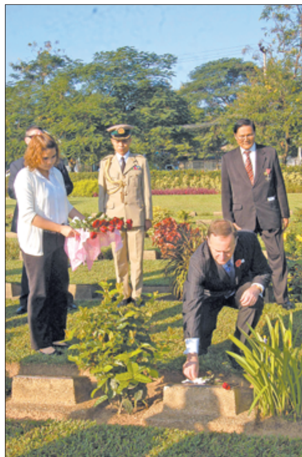
New Zealand Prime Minister Mr John Key lays wreath at Commonwealth War Cemetery in Htaukkyant.