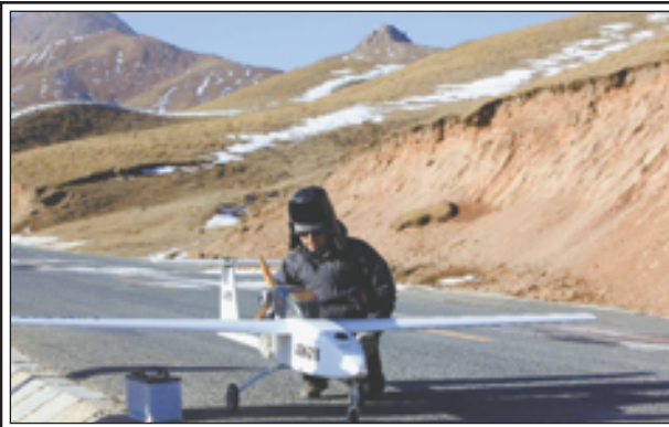
A technician from the Shandong Electric Power Research Institute (SEPRI) examines an unmanned aircraft which is designed to inspect power transportation lines in regions of high altitude, during a test in Qinghai, a province on the Qinghai-Tibet Plateau, northwest China, on 20 Nov, 2012. A research team of the SEPRI has recently conducted a flight test of unmanned aircrafts over the ground with altitude of 4,500 metres, which marks the end of the first round of the unmanned aircraft test project for inspecting power transportation lines on plateaus.

the social network. Facebook also said on Wednesday it is proposing to scrap a 4-year old process that can allow the social network’s roughly 1 billion users to vote on changes to its policies and