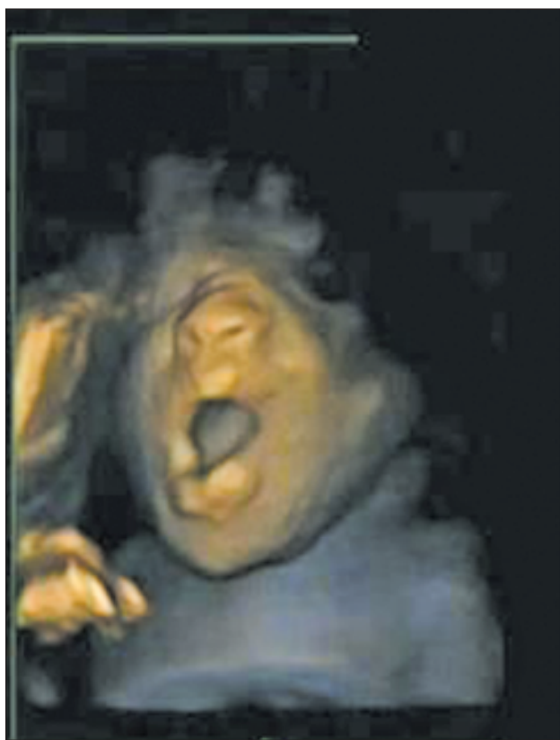
A 4D ultrasound scan shows a foetus yawning in the womb during a study by Durham and Lancaster Universities and released in Durham, northern England on 21 Nov, 2012.