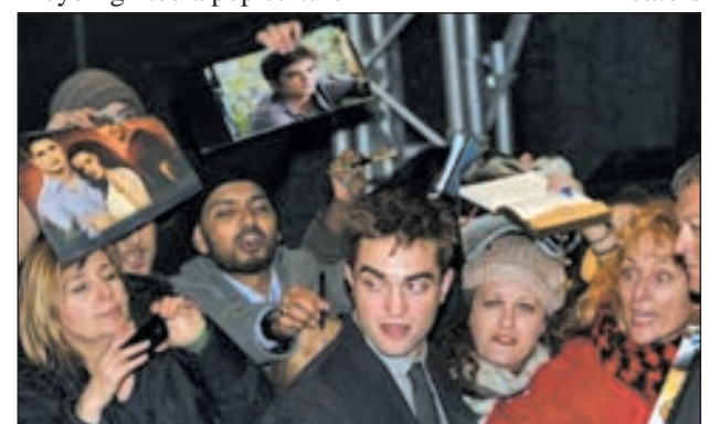
Actor Robert Pattinson signs autographs for fans as he arrives for the European premiere of "The Twilight Saga: Breaking Dawn Part 2" in London on 14 Nov, 2012.