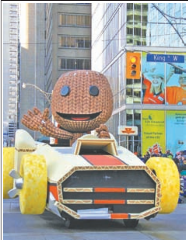
A float is seen in the Santa Claus Parade in Toronto, Canada, on 18 Nov, 2012. The 108th Santa Claus Parade took place in Toronto on Sunday afternoon, attracting more than one million spectators along the 5.6-kilometer-long route in downtown Toronto.