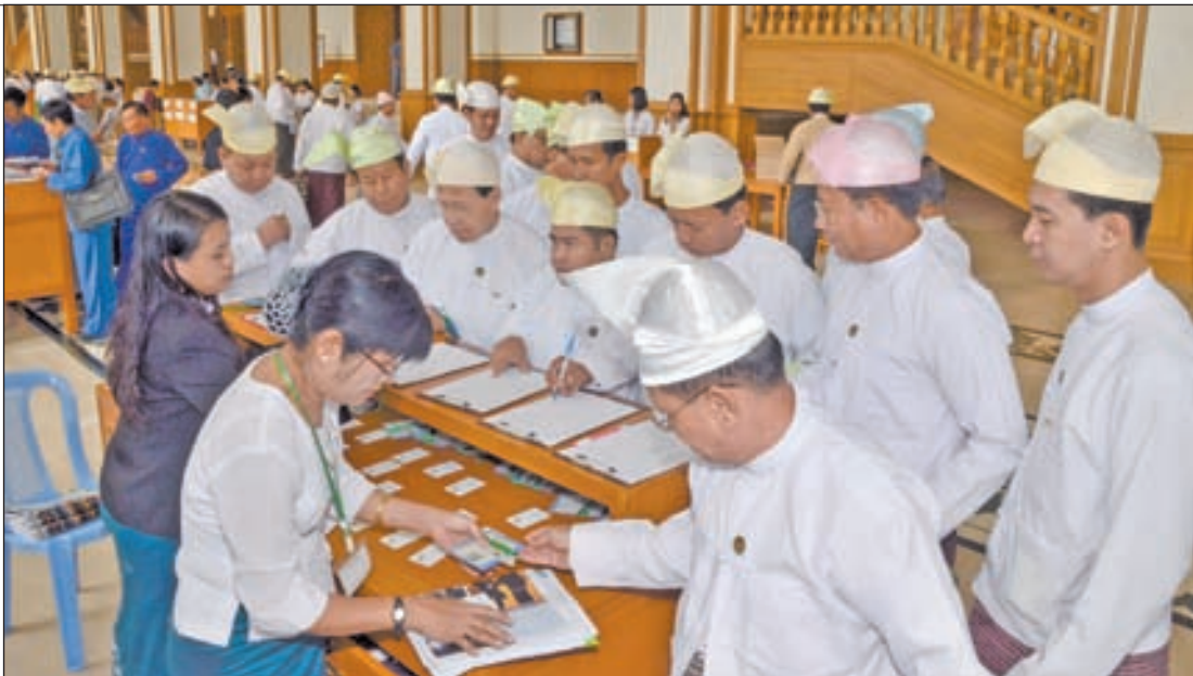
Photo shows Pyidaungsu Hluttaw representatives signing attendance book.