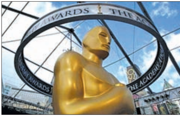
An Oscar statue is seen beneath plastic sheeting during preparations for the 83rd Academy Awards in Hollywood, California on 26 Feb, 2011.

As advertised, the move will give members of the Academy and prospective viewers extra time to see the 35 or so features that will be