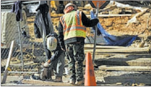
Unemployment may be associated with increased heart attack risk.