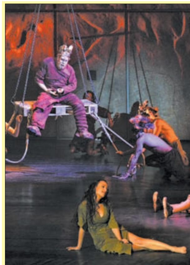
Actors perform during the musical Notre-Dame de Paris at Qingdao Grand Theatre in Qingdao, east China's Shandong Province, on 18 Nov, 2012.

Companies, meanwhile, argue that they employ contract workers to do core jobs because, under the existing Labour Law, it is costly and difficult to fire under-performing permanent staff, the Jakarta Post reported.—Xinhua