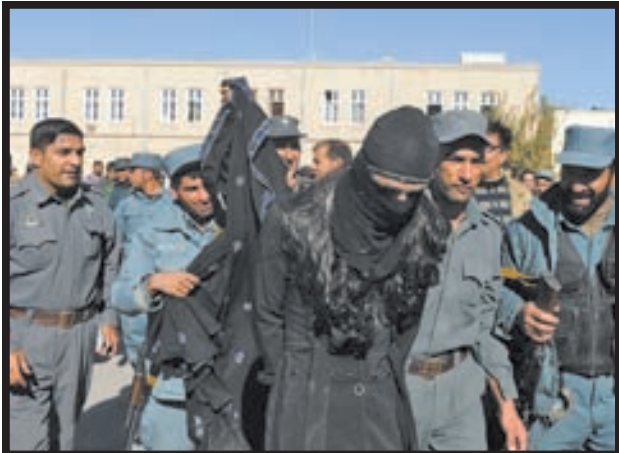
A would-be suicide bomber is presented to the media after being captured by Afghan security forces in Herat province, west of Afghanistan, on 19 Nov, 2012. Two would-be suicide bombers attired in women dress were identified and arrested while attempting to enter a conference hall attended by ranking officials.