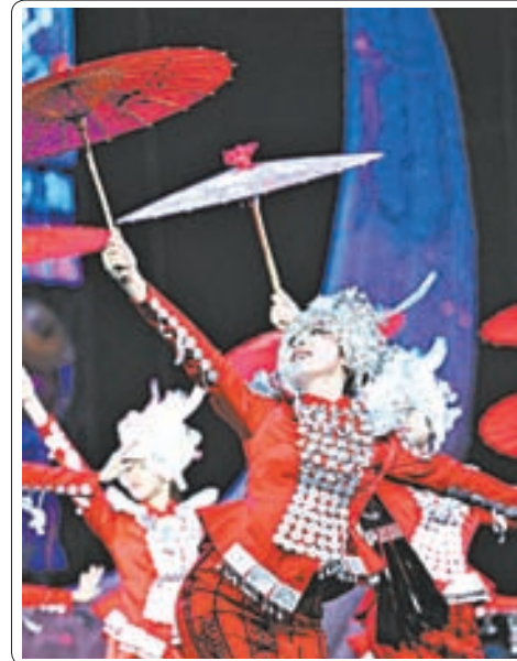
Dancers perform during a dancing show about the tradition of Miao and Dong ethnic groups in Kaili City of Qian-dongnan, southwest China's Guizhou Province, on 19 Nov 2012.

Leaders of the 18 countries in the East Asia Summit including the ten-member ASEAN and the United States, China, Japan, South Korea, India, Australia, New Zealand and Russia are gathering here to attend the 7th East Asia Summit, which will be held this Tuesday afternoon.—Xinhua