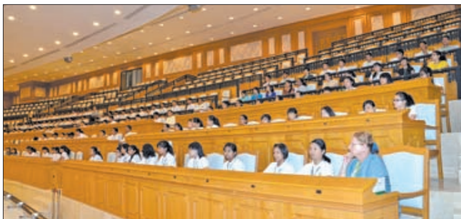
Students and instructors from ILBC (Yangon) attending Pyidaungsu Hluttaw as observers.—MNA

NAY PYI TAW, 20 Nov—A total of 139 observers including 22 instructors from ILBC (International Language & Business Centre) (Yangon) and 117 students from Secondary 3, 4 and University Foundation Program paid close attention to progress of the seventh day's meeting of the fifth regular session of the first Pyidaungsu Hluttaw. And they looked around the Hluttaw Complex, here, this morning.—MNA