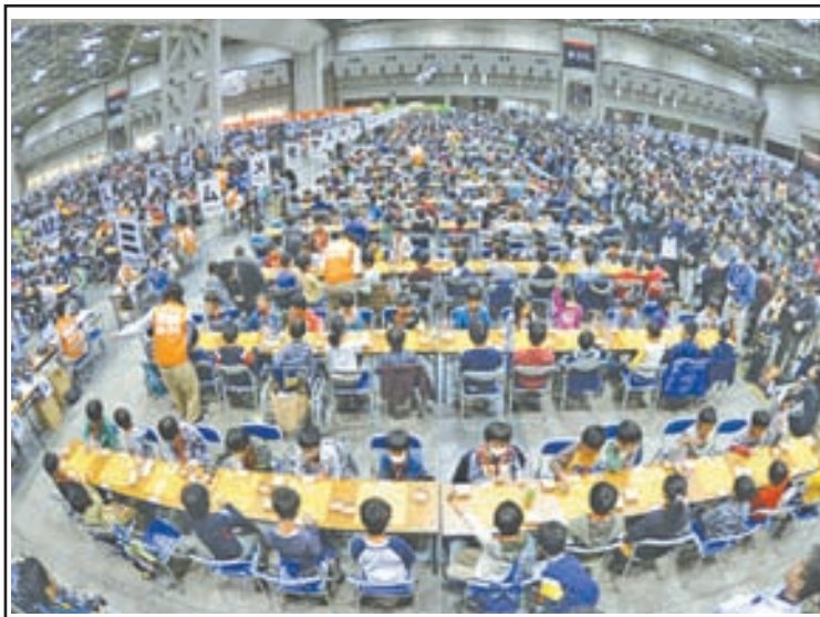
Photo taken on 18 Nov, 2012, shows a shogi event for children of elementary school age or younger held at Tokyo Big Sight in Tokyo, which was recognized as a world record by holding 1,574 games at one time and at one place.