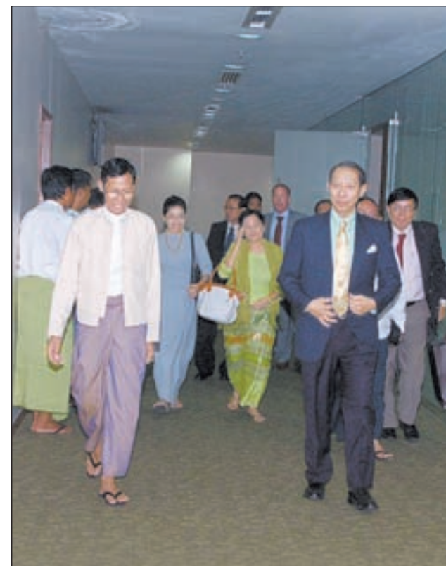
Deputy Speaker of Pyithu Hluttaw U Nanda Kyaw Swa being seen off at Yangon International Airport by officials.