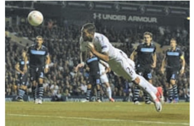
Tottenham Hotspur's Clint Dempsey heads the ball to score a disallowed goal against Lazio during their Europa League soccer match at White Hart Lane in London on 20 Sept, 2012.