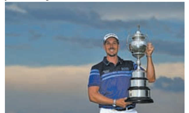
Henrik Stenson of Swede

Two successive bogeys followed, but he pushed the former Ryder Cup player all the way, and the pair were level walking down the 15th hole.—Reuters