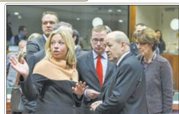
Dutch Defence Minister Jeanine Hennis-Plasschaert (L, front) talks to French Defence Minister Jean-Yves Le Drian before the European Union (EU) defence ministers' meeting in Brussels, Belgium, on 19 Nov, 2012.