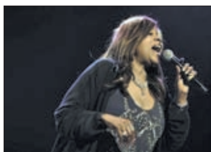
US singer Gloria Gaynor performs during the 11th edition of the Mawazine World Rhythms music festival in Rabat on 19 May, 2012.