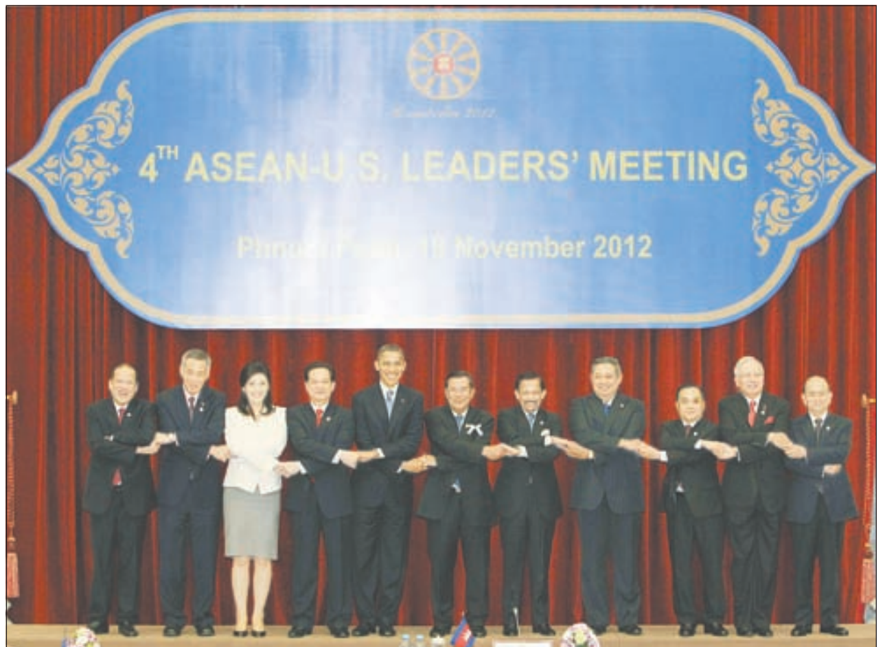
President U Thein Sein poses for documentary photo with heads of State/Government at fourth ASEAN-US Leaders' Meeting at Champa Room of Peace Palace in Phnom Penh of Cambodia.—MNA

They were seen off at Yangon International Airport by the vice-president of the federation and executives, and officials of the Ministry of Sports.—MNA