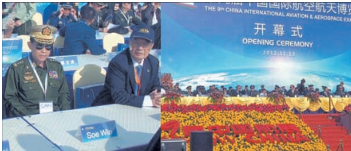
General Soe Win attends opening of ninth China International Aviation and Aerospace Exhibition in China.

NAY PYI TAW, 20 Nov— At the invitation of Deputy Chief of General Staff Lt-Gen Qi Jianguo of the Chinese People's Liberation Army, Myanmar Tatmadaw delegation led by Deputy Commander-in-Chief of Defence Services Commander-in-Chief (Army) General Soe Win paid a goodwill visit to the People's Republic of China on 12 November. They arrived at Kunming International Airport at 6 pm local standard time where they were welcomed