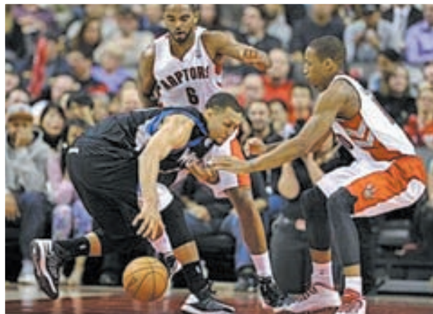
Minnesota Timberwolves guard Brandon Roy (L) grabs a loose ball in front of Toronto Raptors defenders Alan Anderson and DeMar DeRozan (R) during the first half of their NBA basketball game in Toronto on 4 Nov, 2012.