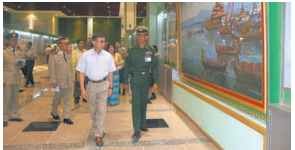
Royal Thai Air Force Commander-in-Chief Air Chief Marshal Prajin Juntong and wife visiting Defence Services Museum.