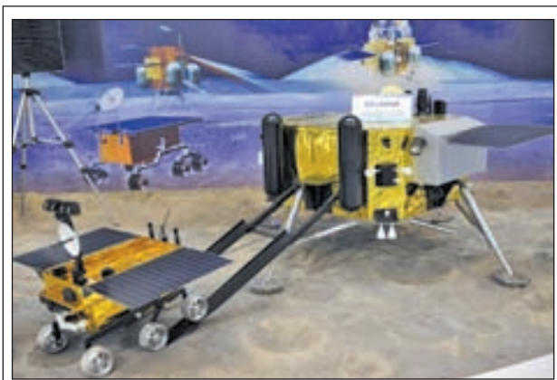
Photo taken on 14 Nov, 2012 shows the model of the Chang'e-3 lunar probe during the 9th China International Aviation and Aerospace Exhibition in Zhuhai, south China's Guangdong Province. Some 650 manufacturers at home and abroad attended the six-day airshow kicked off on Tuesday, which was expected to receive 400,000 visitors.—XINHUA