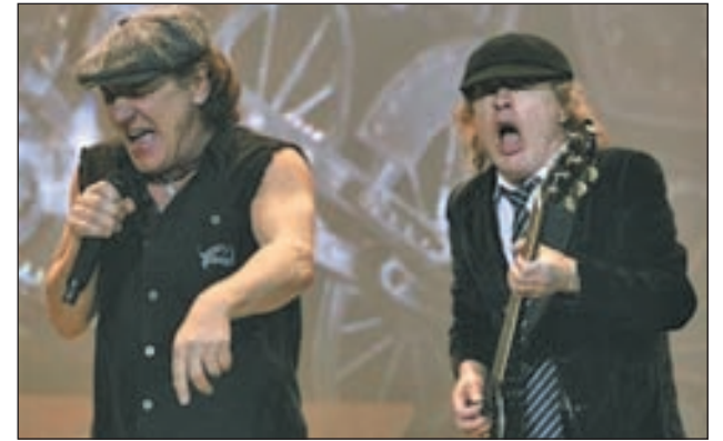
AC/DC lead vocalist Brian Johnson (L) and Angus Young performs at the O2 Millennium Dome stadium in London on 14 April, 2009.