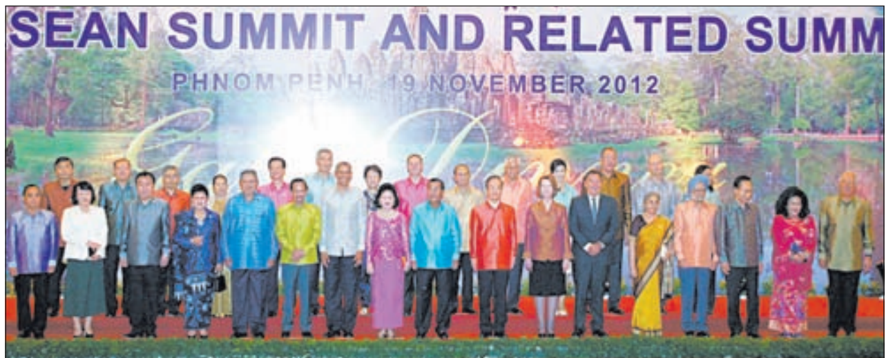
President U Thein Sein poses for documentary photo with heads of State/Government at the dinner hosted by Cambodian Prime Minister and wife.

Minister and wife, heads of state/government of ASEAN countries and the ASEAN