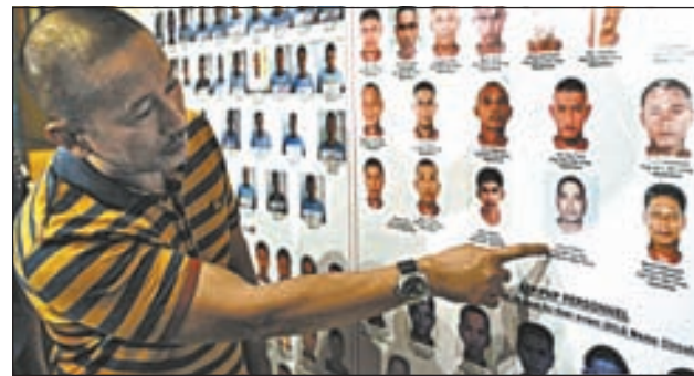
Maguindanao Governor Esmel Mangudadatu points at the photo of one of the 195 suspects of Maguindanao massacre at the Philippine National Police (PNP) Headquarters in Quezon City, the Philippines, on 19 Nov, 2012. The PNP has arrested 103 suspects while 92 remain at large. In November 2009, a total of 57 people including 32 journalists were killed in the country's worst political massacre in Maguindanao.