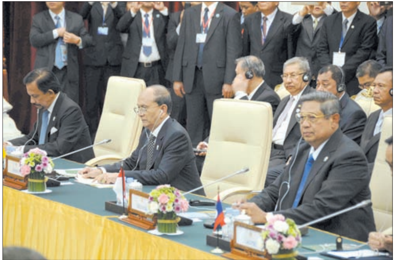
President U Thein Sein attends 4th ASEAN-US Leaders Meeting at Champa Room on the third floor of Peace Palace in Phnom Penh in Cambodia.

matters for convenience, Myanmar wishes to cooperate with Korea to promote trade volume of the two countries and Myanmar welcomes foreign