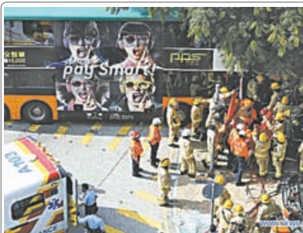
Rescuers work at the site where a double decker bus crashed with two other vehicles at Shau Kei Wan of the Hong Kong Island, south China's Hong Kong, on 19 Nov, 2012. The accident, happened at about 11:38 am local time, left three people dead and about 50 injured, local media reported.