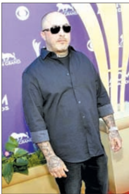
Aaron Lewis, singer for rock band Staind, arrives at the 47th annual Academy of Country Music Awards in Las Vegas, Nevada, on 1 April, 2012.