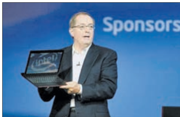
Paul Otellini, president and CEO of Intel Corporation, holds an ultrabook as he gives a keynote address during the 2012 International Consumer Electronics Show (CES) in Las Vegas, Nevada, in this 10 Jan, 2012, file photo.

"We all know that everyone is using smartphones and tablets now. It's the era of Intel versus ARM, so it may be good to come in with some fresh blood and a