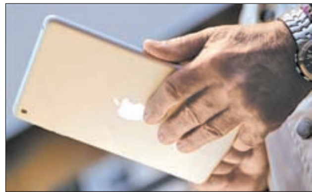
A customer looks over the iPad mini after the device went on sale at Apple’s retail store in Palo Alto, California on 2 Nov, 2012.

not violate the four patents at issue in the case, which was filed in mid-2011. The two standard essential patents in the complaint are related to 3G wireless technology and the format of data packets for high-speed transmission.