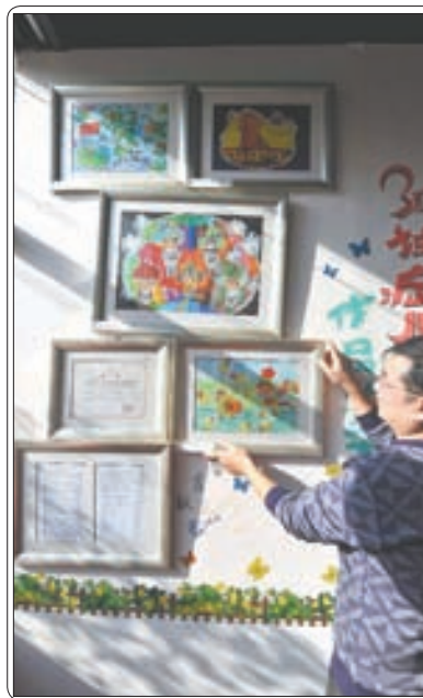
A man hangs paintings created by autistic children on the wall in Huijia Chuangyi Restaurant in Xiaodian District of Taiyuan City, capital of north China's Shanxi Province, on 19 Nov, 2012. The restaurant has provided a platform to sell paintings by autistic children from Fangzhou Autism Rehabilitation Centre in Shanxi since October in 2011.

Obama had also commended ASEAN for adopting Human Rights Declaration and commitment to address related challenges in the region. He is also to attend the East Asia Summit on Tuesday when key global and regional issues are to be raised by the leaders of ASEAN members and eight dialogue partners.—Xinhua