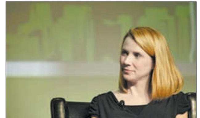
Yahoo! Chief Executive Marissa Mayer listens in a Startup Battlefield session during TechCrunch Disrupt SF 2012 at the San Francisco Design Centre Concourse in San Francisco, California on 12 Sept, 2012.

The company has been rocked by internal turmoil: CEO Carol Bartz was fired over the phone and CEO Scott Thompson left after less than six months on the job due to questions about his academic credentials. Mayer, Google’s first female engineer, took the top job at Yahoo in July.—Reuters