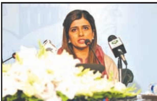
Pakistani Foreign Minister Hina Rabbani Khar speaks during a news conference at the Developing Eight (D-8) Summit in Islamabad, Pakistan, on 19 Nov 2012.