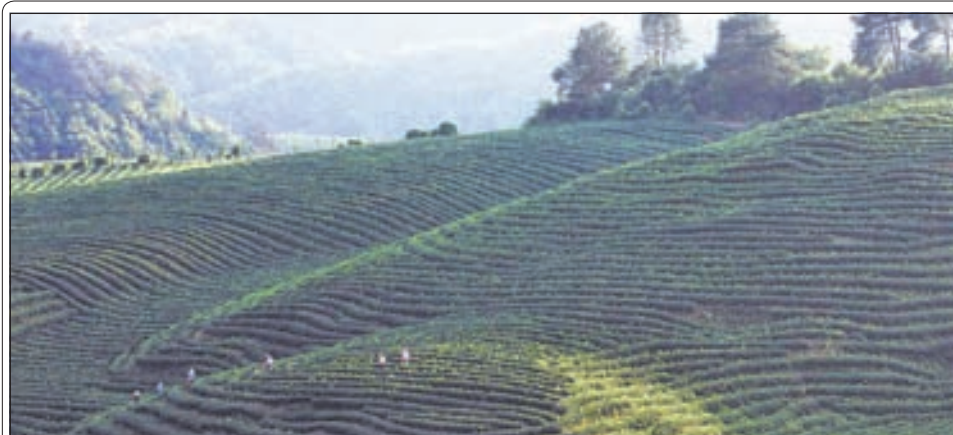
Photo taken on 21 May, 2012 shows the summer scenery of Wuyuan County, east China's Jiangxi Province. Wuyuan's environmental protection efforts in recent years has turned it into an ideal wild bird habitat. More than 370 wild bird species, including 36 endangered species, now live in the county's 193 conservation areas.