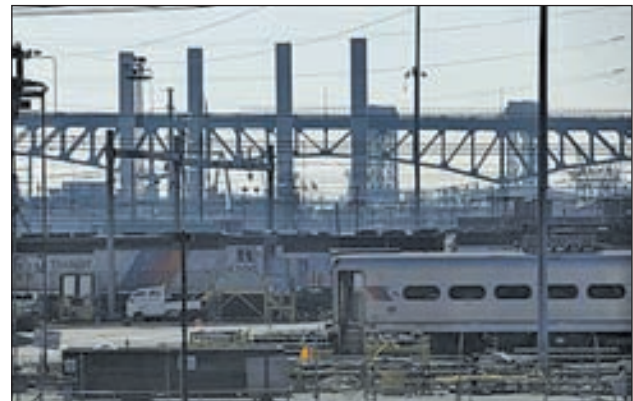
Trains are seen at New Jersey Transit's Meadowlands Maintenance Complex in Harrison New Jersey on 17 Nov, 2012.

Taliban militants have yet to make comment. Xinhua