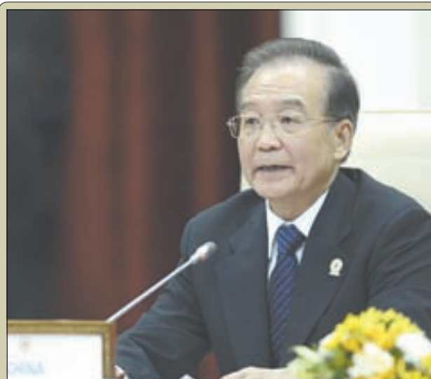
Chinese Premier Wen Jiabao (2nd L) attends a summit between the Association of Southeast Asian Nations (ASEAN) and China, Japan and South Korea (10+3) in Phnom Penh, Cambodia, on 19 Nov, 2012. The summit coincided with the 15th anniversary of ASEAN Plus Three (APT) cooperation.