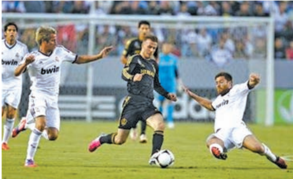
Los Angeles Galaxy's David Beckham (C) chases the ball between Real Madrid's Fabio Coentrao (L) and Xabi Alonso (R) during the first half of their World Football Challenge international friendly soccer match in Carson, California on 2 Aug, 2012.