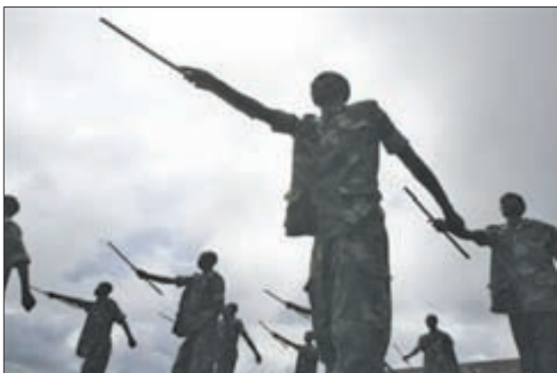
Recruits of the newly formed Congolese Revolutionary Army march during military training in Rumangabo military camp, Democratic Republic of Congo, on 23 Oct, 2012.

government contention that Rwanda, which has intervened in Congo repeatedly over the past 18 years, is behind the M23 revolt. Rwanda denies involvement.