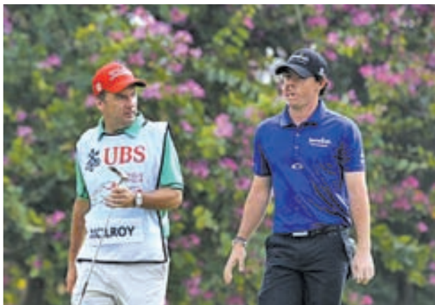
Rory McIlroy from Northern Ireland walks on the sixth green with his caddy during the second day of the Hong Kong Open Championship on 16 Nov, 2012.