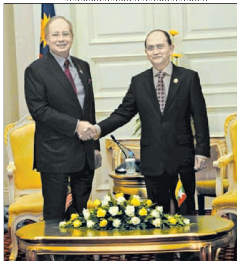
President of the Republic of the Union of Myanmar U Thein Sein shakes hands with Prime Minister of Malaysia Dato Seri Mohammed Najib Bin Tun Haji Abdullah Razak at Call Room of Peace Palace in Phnom Penh in Cambodia.