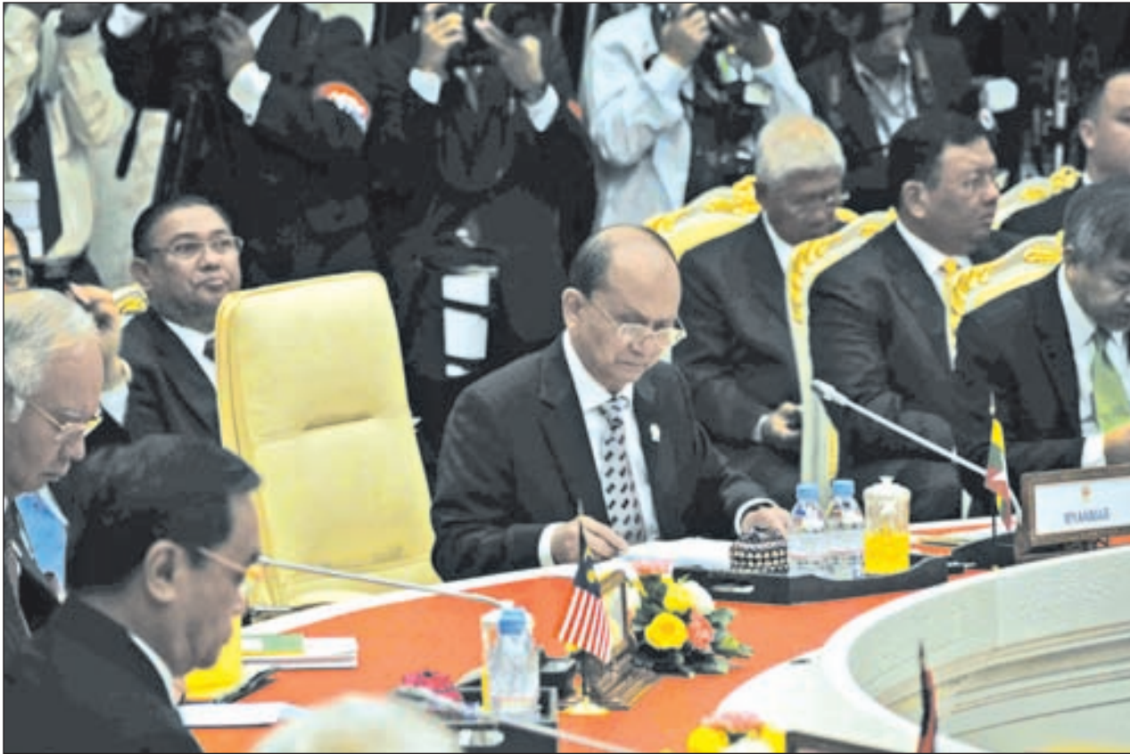
President U Thein Sein attends 21 st ASEAN Summit plenary session at Champa Room of Peace Palace in Phnom Penh, Cambodia.

NAY PYI TAW, 18 Nov— President U Thein Sein of the Republic of the Union of Myanmar attended 21 st ASEAN Summit plenary session held at Champa Room of Peace Palace in Phnom Penh, Cambodia this morning.