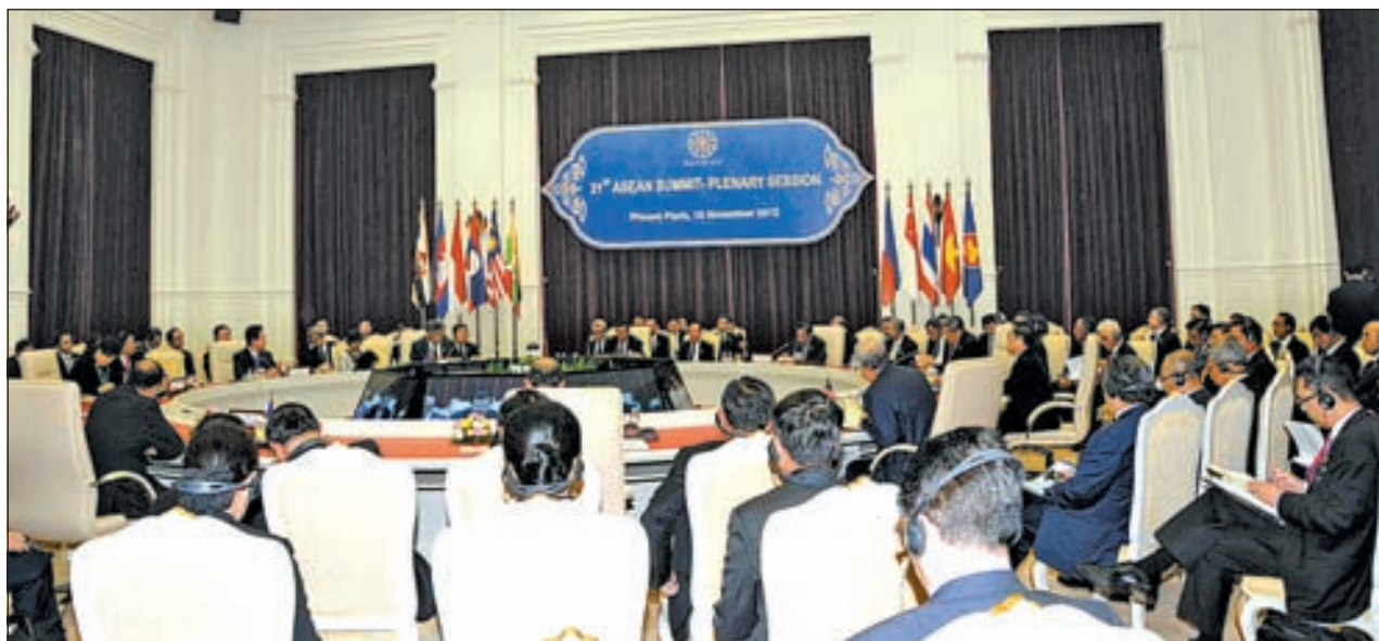
21 st ASEAN Summit Plenary Session in progress.

For narrowing the physical connectivity and infrastructural development divide between the ASEAN member countries, it is required to fully utilize ASEAN Infrastructure Fund (AIF). Only when AIF is