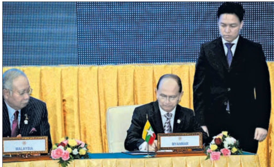
President U Thein Sein attends signing ceremony of Phnom Penh Statement at Nuon Srey Hall of Peace Palace in Phnom Penh of Cambodia.