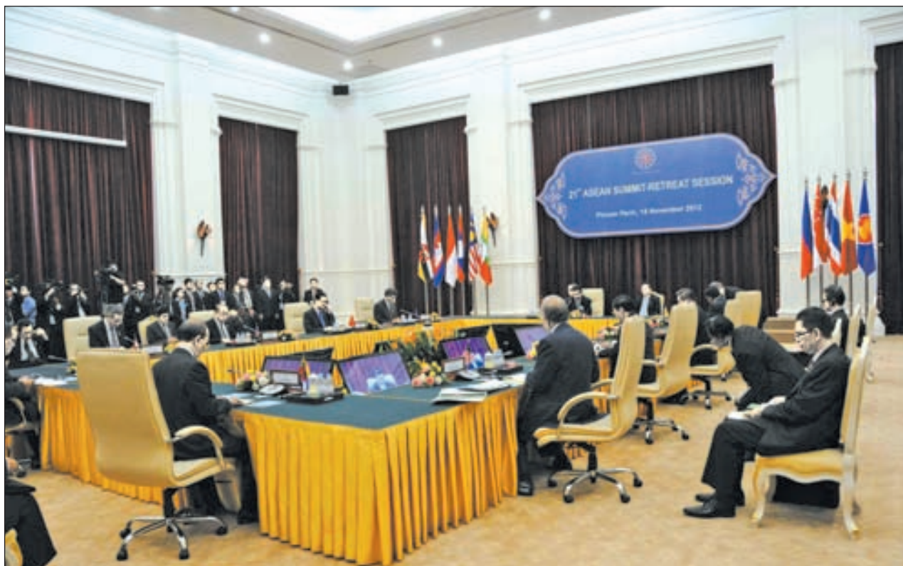
President U Thein Sein at 21 st ASEAN Summit Retreat Session at Champei Room of Peace Palace in Penom Penh in Cambodia.—MNA

President U Thein Sein and heads of state/government of ASEAN countries exchanged views on South China Sea issues, nuclear weapons-free in Korean Peninsula, endeavor for economic growth of ASEAN, natural disaster risk management and climate change, outbreak of conflicts in Rakhine State and millennium development goals.—MNA