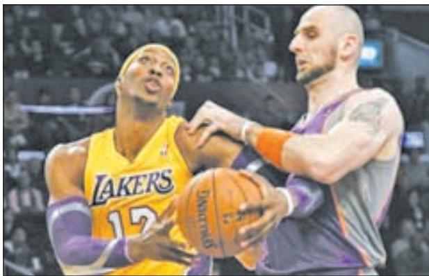
Phoenix Suns' Marcin Gortat (R) of Poland defends against Los Angeles Lakers' Dwight Howard during the first half of their NBA basketball game in Los Angeles on 16 Nov, 2012.

Guard Goran Dragic led the way for the Suns with 22 points and forward Luis Scola weighed in with 18 but the visitors paid the price after being out-rebounded 48-38. "We're just getting started, but it will make a lot of things easier," Bryant told reporters of the strategy already instilled in the team by D'Antoni after his first practice session with them the previous day. "The whole offense has to find their po-