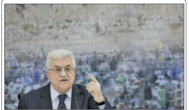
Palestinian President Mahmoud Abbas delivers a speech during a meeting with the Palestinian leadership in the West Bank city of Ramallah, on 16 Nov, 2012. Abbas on Friday said that the ongoing Israeli aggression aims at obstructing the Palestinian bid to the United Nations for recognition.