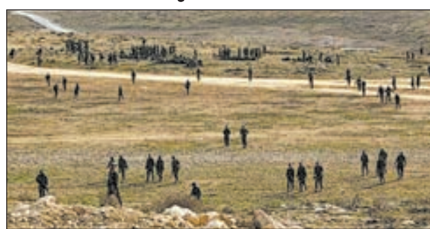
Israeli soldiers take part in a drill simulating a possible ground invasion into the Gaza Strip, at a base south of the West Bank city of Hebron on 17 Nov, 2012.

But the successful interception, witnessed by a Reuters correspondent, appeared to stretch the capabilities of the unit meant to provide coverage for Israel's biggest conurbation, which includes its main international airport, 15 km (6