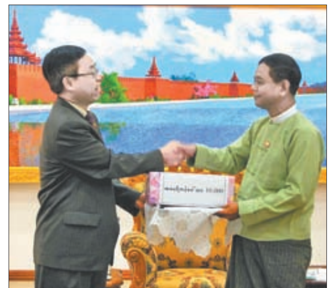
Chinese ambassador to Myanmar Li Junhua (L) shakes hands with Mandalay Region Chief Minister U Ye Myint during a donating ceremony in Mandalay, Myanmar, on 17 Nov, 2012.