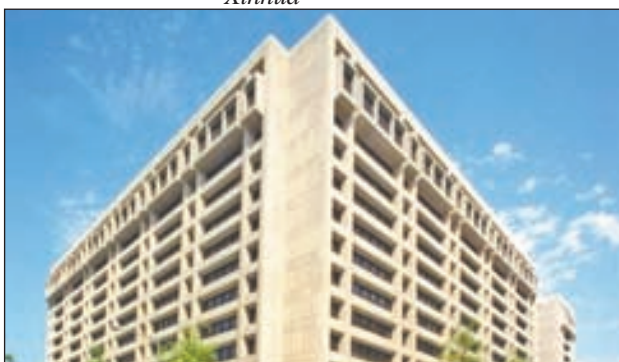
IMF building in Washington