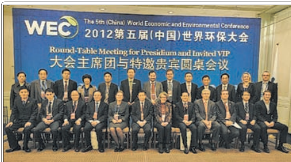
Presidium and invited VIPs at the Round-table meeting of the 5th World Economic and Environmental Conference in Beijing, on 17 Nov, 2012. The conference lasts from on 17 to 18 Nov, 2012. Its topic is Future Momentum towards Economic Prosperity: Green and Sustainable Development, and the sub-topic is Post Rio+20 Summit: Outlook.