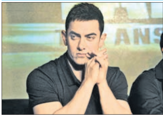
He will be on the Sony TV show to promote his movie Talaash, a suspense thriller, releasing on 30 November.