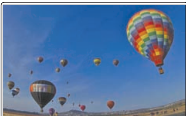
Balloons fly in the sky during the second day of the IX International Festival of Balloon, in the Metropolitan Park of the city of Leon, Guanajuato state, central Mexico, on 17 Nov, 2012. About 200 participated in the festival from on 16 to 19 November.