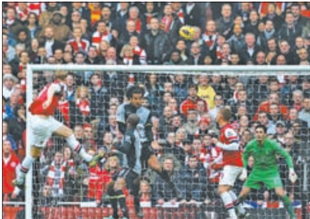
Per Mertesacker (L 1st) of Arsenal heads to score during the Barclays Premier League match against Tottenham Hotspur at the Emirates Stadium in London, Britain, on 17 Nov, 2012. Arsenal won 5-2.

European champions Chelsea were surprised by an determined West Bromwich side in an unexpected 2-1 away defeat. The blues had 19 shots in total but still failed to find the net for an equalizer and remained in the third place. Two giants' fall gave the defending champions the chance. Man City didn't waste it. The Blue Moon thrashed Aston Villa 5-0 with strikers Sergio Aguero and Carlos Tevez both netting twice, claiming the league's top berth for the first time in this season.—Xinhua