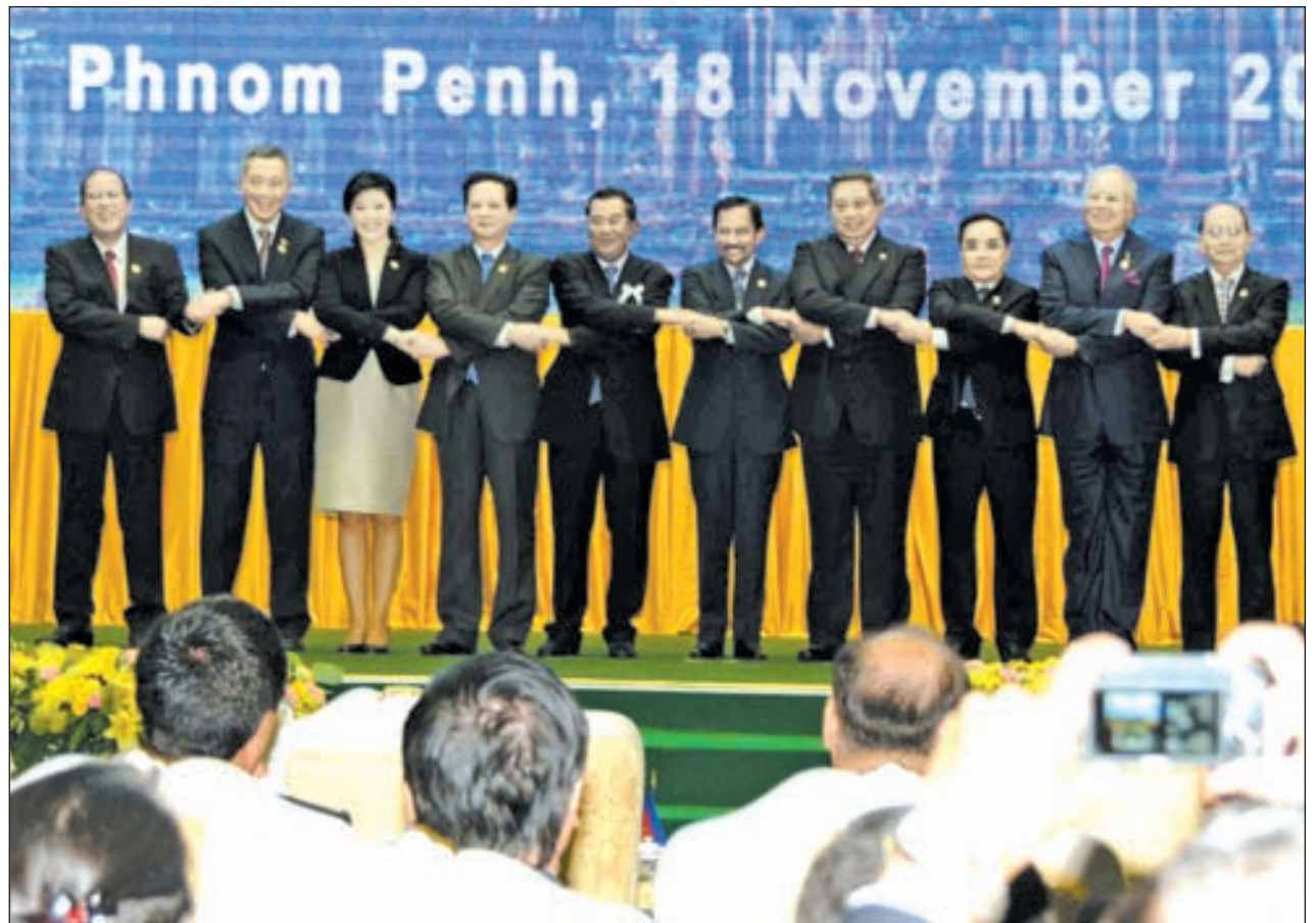
President U Thein Sein and heads of State/Government of ASEAN countries pose for documentary photo at opening of 21 st ASEAN Summit at Nuon Srey Hall of Peace Palace in Phnom Penh in Cambodia.

NAY PYI TAW, 18 Nov—President of the Republic of the Union of Myanmar U Thein Sein attended the opening of the 21 st ASEAN Summit being held at Nuon Srey Hall of the Peace Palace in Phnom Penh, Cambodia at 9.25 LST today.