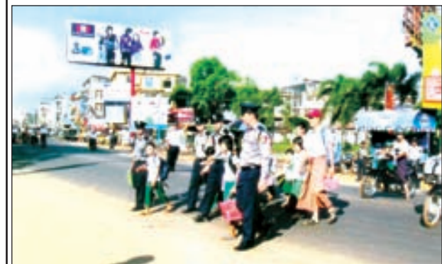
Photo shows police cadets, who are taking one-month practical for road safety measures, giving a helping hand to pedestrians crossing the road in Bago on 16 November.