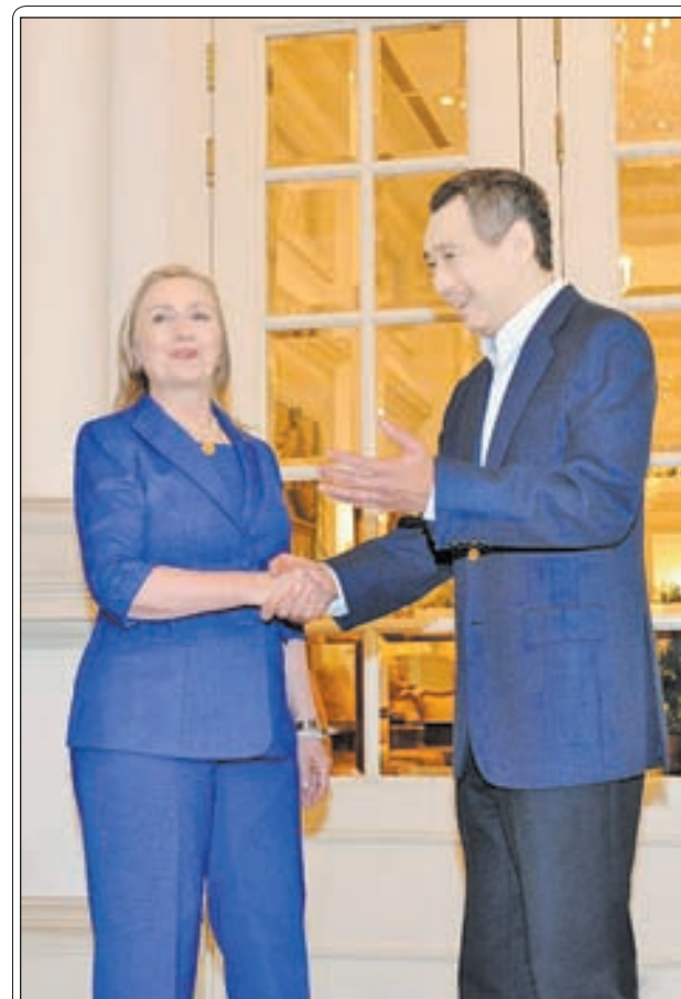
Singapore's Prime Minister Lee Hsien Loong (R) shakes hands with US Secretary of State Hillary Clinton during their meeting in Singapore, on 17 Nov, 2012.