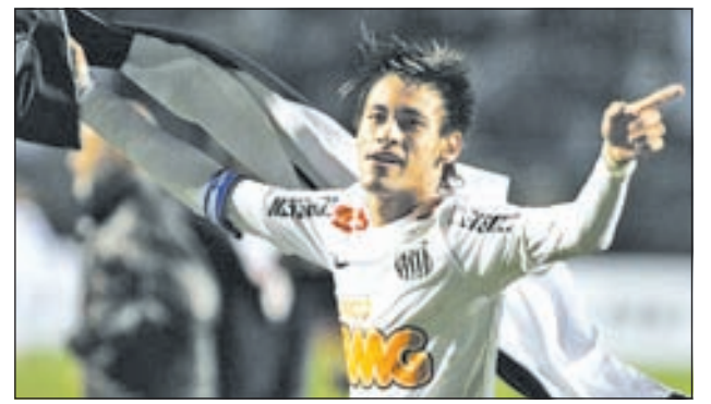
Santos star Neymar

But the Czechs shook off the slow start by racing ahead in the second set to get the crown going again. A couple of unstoppable overhead smashes gave the Czechs the second set and they took control of the match by winning the third with a Berdych backhand volley and then easing through the fourth set. "They started really on a high... and hit incredible shots," Stepanek said.—Reuters