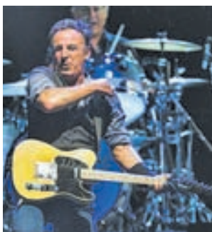
Bruce Springsteen performs with the E Street Band during a concert in East Rutherford, New Jersey, on 19 Sept, 2012.