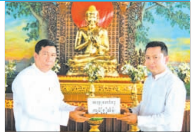
CASH DONATED: Film star Academy Khant Sithu donated K 500,000 to the fund of reconstruction of pagodas, stupas and religious edifices in quake-hit areas on 15 November to an official.—MNA