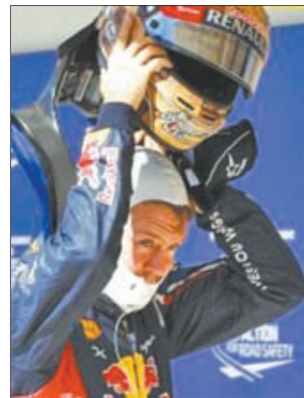
Red Bull Formula One driver Sebastian Vettel of Germany removes his helmet after the qualifying session of the US F1 Grand Prix at the Circuit of the Americas in Austin, Texas on 17 Nov, 2012.

AUSTIN, (Texas), 18 Nov—Red Bull's Sebastian Vettel roared to pole position at the US Grand Prix on Saturday with the German perfectly placed to claim a third straight Formula One title in his milestone 100th race.