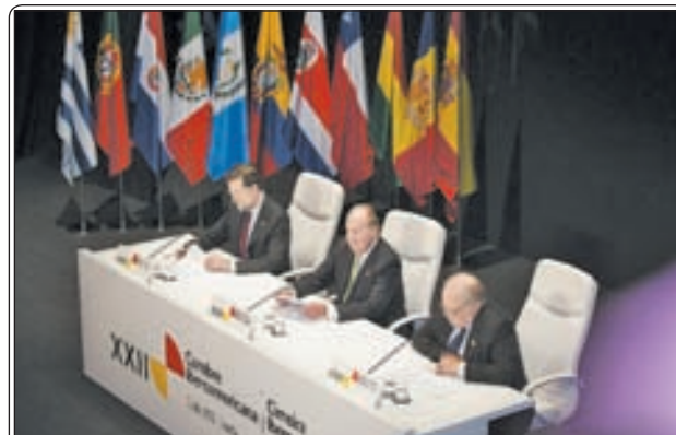
Spain’s King Juan Carlos (C), Spain’s Prime Minister Mariano Rajoy (L) and the Ibero-American Secretary General Enrique Iglesias attend the opening ceremony of the 22th Ibero-American Summit in Cadiz, southern Spain, on 16 Nov, 2012. The 2012 Ibero-American Summit kicked off in the Spanish city of Cadiz on Friday to focus on the ongoing economic crisis and the need for Spain and Portugal to boost their investment in Latin America.