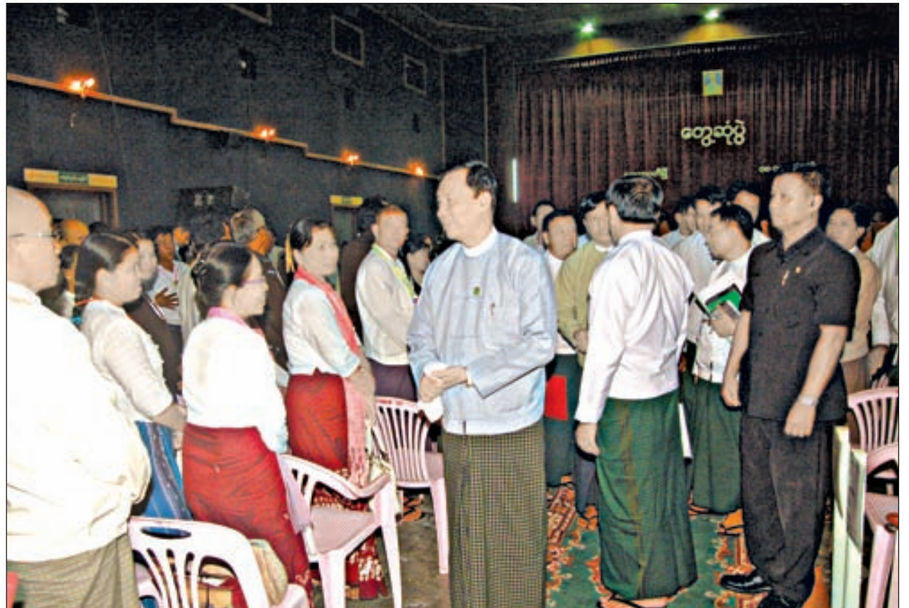
Pyithu Hluttaw Speaker Thura U Shwe Mann meets departmental personnel, members of social

In his concluding remarks, Pyithu Hluttaw Speaker Thura U Shwe Mann pledged to fulfill the requirements as much as he can after making coordination with authorities concerned. He called on representatives of Pyithu Hluttaw and Amyotha Hluttaw to hold coordination with region Hluttaw representatives in attending to the needs of local people. He urged local people to have an understanding of