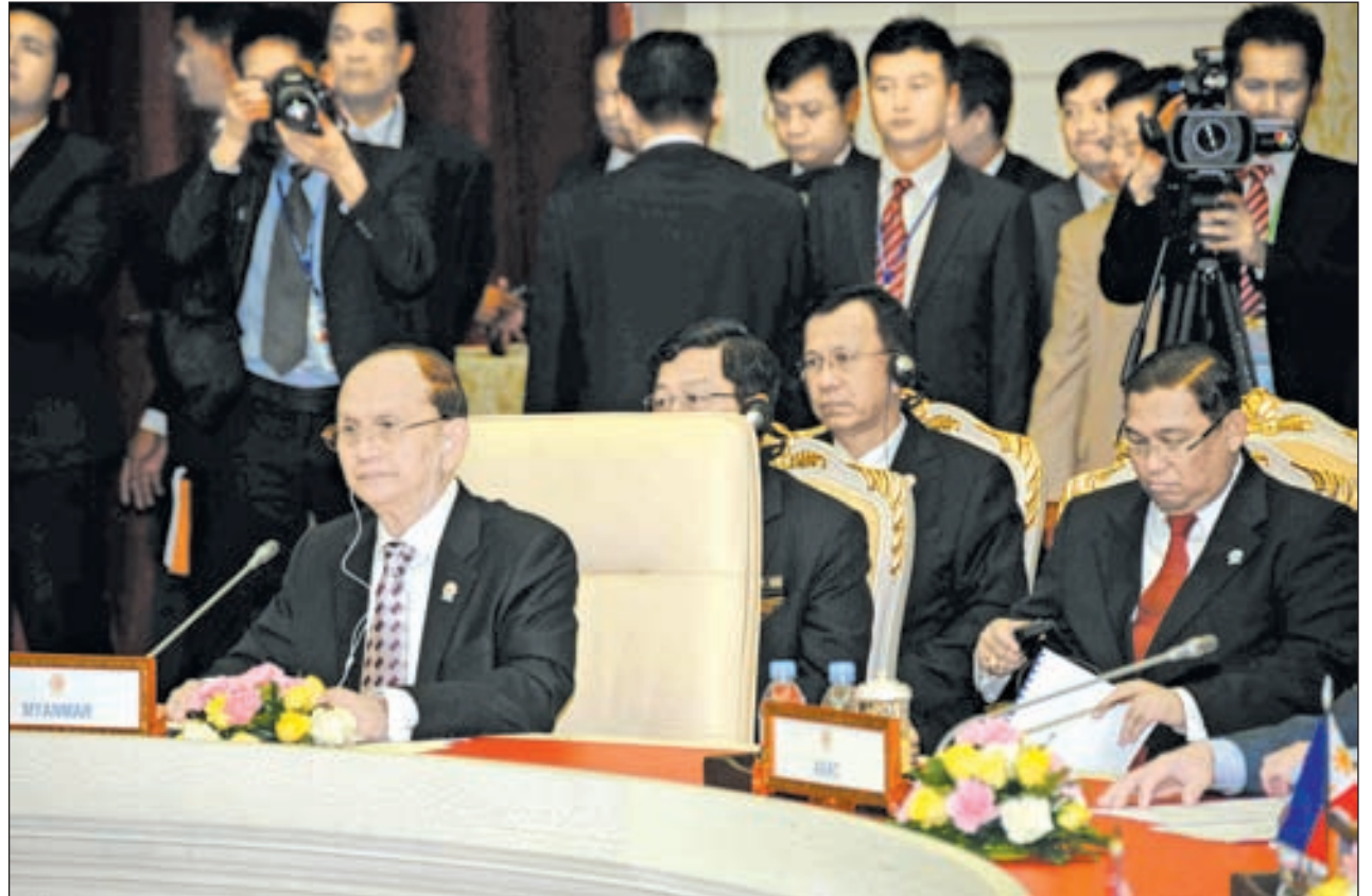
President of the Republic of the Union of Myanmar U Thein Sein attends the meeting between ASEAN leaders and members of ASEAN Business Advisory Council.

NAY PYI TAW, 18 Nov— President of the Republic of the Union of Myanmar U Thein Sein attended the meeting between ASEAN leaders and ASEAN Business Advisory Council at Champa Room on the third floor of Peace Palace in Phnom Penh of Cambodia at 2 pm local time today.