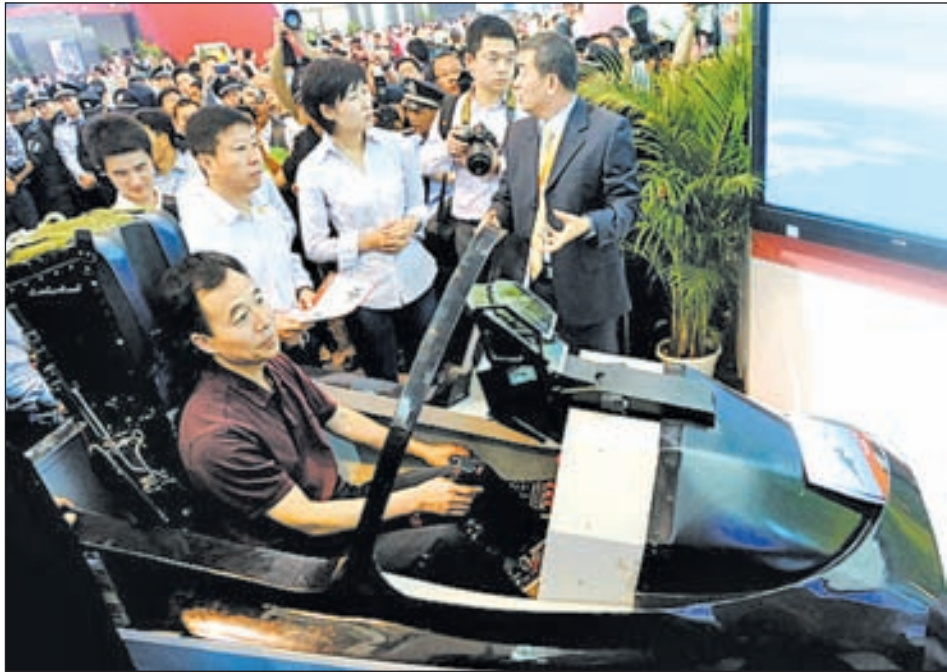
Astronauts Jing Haipeng (in the aviation simulator), Liu Wang (second left, second row) and Liu Yang (central, second row) try the aviation simulator of the Lieying L15 advanced trainer at the Ninth China International Aviation and Aerospace Exhibition in Zhuhai, Guangdong Province, on Wednesday.

BEIJING, 18 Nov—China's national aviation manufacturer has launched a long-term plan spanning until 2030 to develop advanced aviation engines.