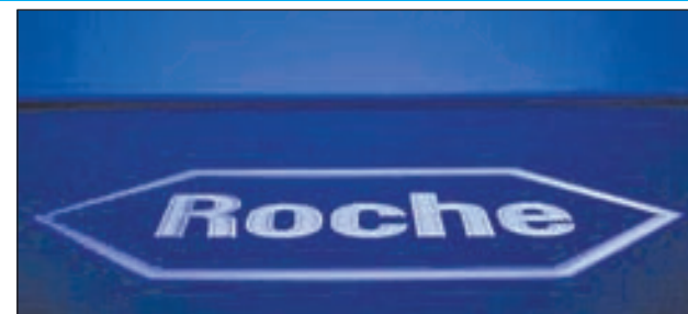
A logo of Swiss pharmaceutical company Roche is pictured in front of a company’s building in Rotkreuz, on 12 April, 2012.

The vast majority of the Twitter users sent fewer than three tweets about cardiac arrest or CPR throughout the month.