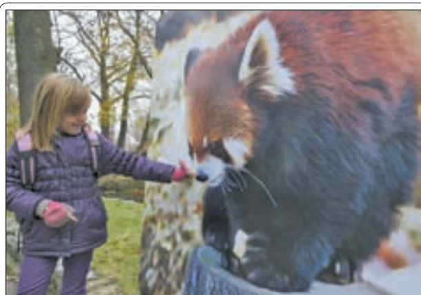
A girl plays next to red panda photo during celebration of Red Panda Day in Zagreb Zoo, on 17 Nov, 2012. Zagreb Zoo invited visitors to suggest names for the newborn baby panda twins.