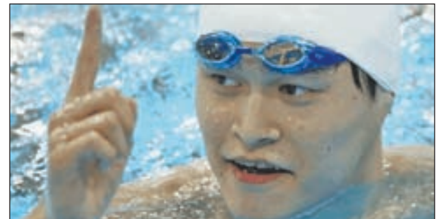
China's Olympic gold medalist Sun Yang

Sun won the 400m and 1,500m freestyle gold medals at London Olympics to become the first ever Chinese male swimmer to win an Olympics gold and he also set a new world record in the 1500m event.—Xinhua