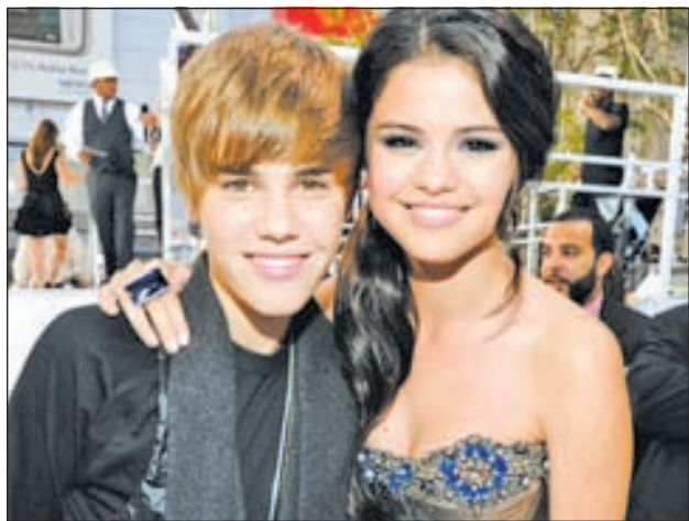
A representative told Hollyscoop.com: “Selena has never been confirmed to be at the show.”