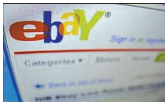
A photograph of a computer screen showing the website eBay is shown here in Encinitas, California on 22 April, 2009.

eBay said the government is wrong and that it will vigorously defend it-