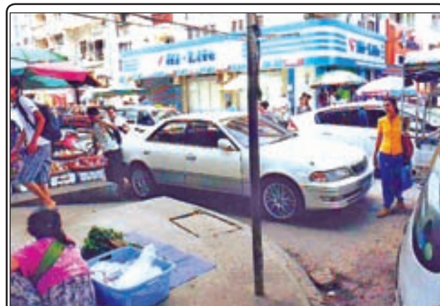
Photo shows a saloon stopped at the corner of the middle block of Shwe Taung Dan Street and Kyongyi Street in Lanmadaw Township on 12 November, resulting in road users veering off their way.

Education High School (branch) in Hsinswe village in Htilin Township and student hostels. On his arrival at the construction site of