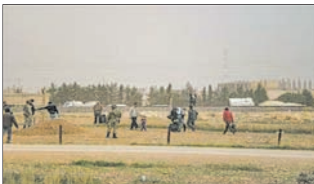
Residents, fleeing after a Syrian Air Force fighter jet loyal to Syria's President Bashar al-Assad fired missiles at the town of Ras al-Ain, are seen near Turkish troops at the Turkey side of the border with Syria on 16 Nov, 2012.

"The race is long, anything can happen and we need to keep confident and optimistic because normally the race pace improves a lot," added the Ferrari driver, who must finish at least fourth if Vettel wins in order to stay mathematically in contention for the finale in Brazil.—Reuters