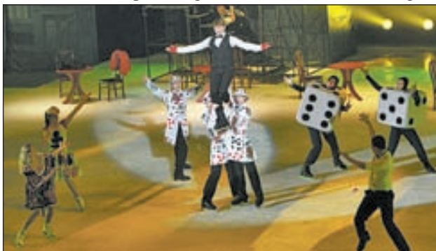
Russian artists perform on the ice stage during the closing ceremony of the “Year of Russian Tourism” at Shanghai Oriental Sports Centre in east China’s Shanghai Municipality, on 16 Nov, 2012. Under the Year of Russian Tourism programme, China and Russia held over 100 activities covering the sectors of tourism, culture, sports and education. The two nations are expected to witness another tourist rush from each other’s side in 2013’s forthcoming “Year of Chinese Tourism.”—XINHUA