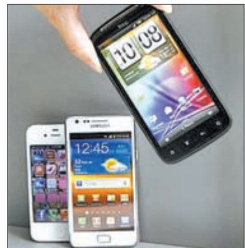
A shop attendant poses with replicas of HTC, Samsung and Apple's smartphones inside a mobile phone shop in Taipei on 6 April, 2012.