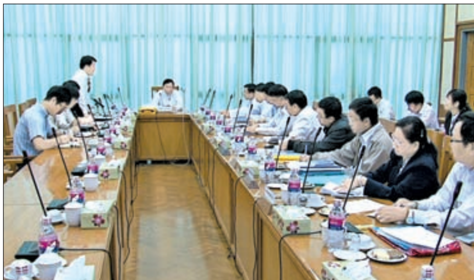
Coordination meeting on salvage of iron frames sunk in Ayeyawady River in progress.