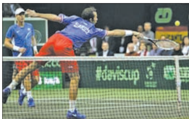
Czech Republic's Tomas Berdych (L) and Radek Stepanek return a ball to Spain's Marc Lopez and Marcel Granollers during their Davis Cup tennis tournament doubles final match in Prague on 17 Nov, 2012.

The Czech pair looked tired from the opening singles matches that went late on Friday but triumphed 3-6, 7-5, 7-5, 6-3. Spain's top duo of Marcel Granollers and Marc Lopez silenced the 14,000-strong crowd early on, cutting short a Czech ral-