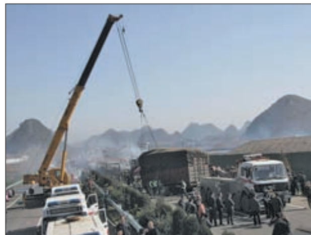
Photo taken on 17 Nov, 2012 shows a traffic accident site on the Shanghai-Kunming expressway in Anshun City, southwest China's Guizhou Province. The pileup accident occurred at about 9 am Saturday on the expressway in Anshun City, leaving nine people dead and 19 others injured. More than 25 vehicles involved in the accident, and seven of them burst into flames.

Seven cars caught fire in the accidents, which also left 19 people injured, according to police. Traffic has resumed.— Xinhua