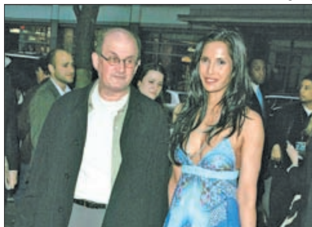
Padma Lakshmi has praised her ex-husband, who is 23-years her senior.

Rushdie, 65, is not so generous about his fourth ex-wife in his recently published memoir ‘Joseph Anton’. Describing her as ‘Millenarian Illusion’, Rushdie has painted Lakshmi as someone who was ambitious and celebrity-seeking. Rushdie said Padma’s beauty swept him over because she “seemed to contain his Indian past and his American future.” “She was capable of saying things of such majestic narcissism.... her moodiness was unpredictable and extreme.” She was ambitious and was determined to strike out for herself. “In the end she did.”