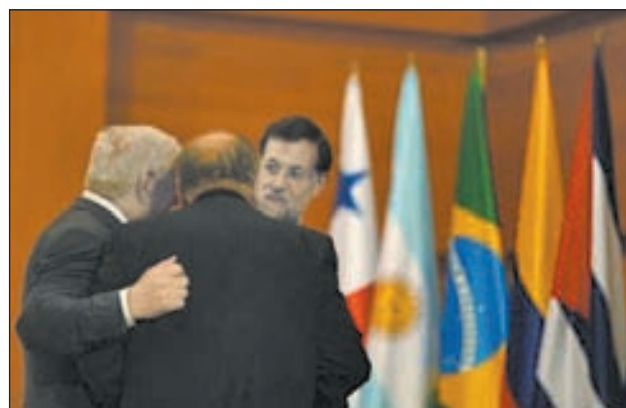
Spain's Prime Minister Mariano Rajoy (R), Panama's President Ricardo Martinelli (L) and Ibero-American Secretary-General Enrique Iglesias leave a news conference during the Ibero-American Summit in Cadiz, southern Spain on 17 Nov, 2012.

ma Rousseff was the star of the meeting because of hopes consumer demand and public building projects in her country's $2.5 trillion economy