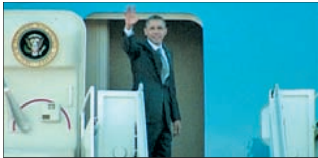
US President Barack Obama will make stops in Thailand, Myanmar and Cambodia during his three-country swing through Asia.

BEIJING, 18 Nov—US President Barack Obama's trip to Southeast Asia signals a step further in the US strategic shift toward Asia and highlights Asia's growing importance to the United States.