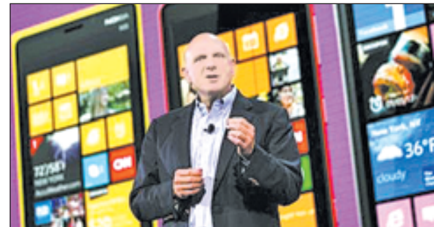
Microsoft CEO Steve Ballmer speaks during the launch of Windows Phone 8 in San Francisco, California on 29 Oct, 2012.