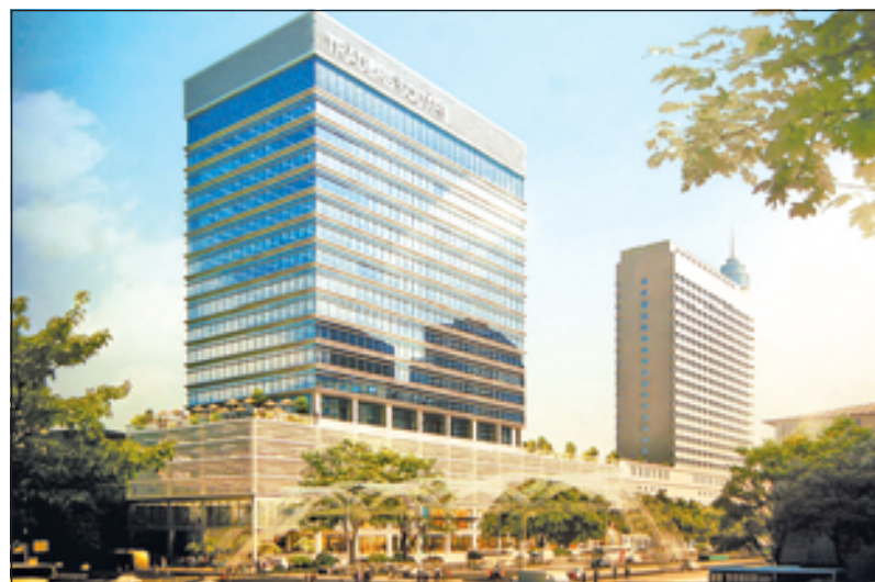
Photo shows scale model of Traders Square commercial complex to be built by Shangri-La Asia Co., Ltd.

Surface wind speed in squalls may reach 40 to 50 mph, the Meteorology and Hydrology Department announced.—MNA