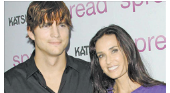
Demi Moore and Ashton Kutcher split last year amidst claims that Kutcher cheated on Moore on their sixth wedding anniversary— PTI

technology-driven aspect of these crimes demands its own attention and investment," the couple said in a statement. Kutcher and Moore started their foundation together in 2010.