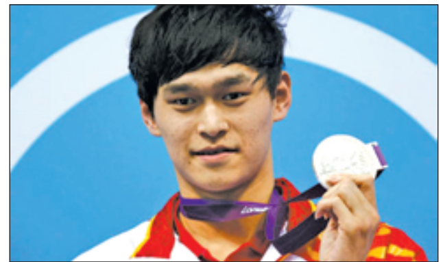
Two-time Olympic gold medalist Sun Yang

"That's the first I've heard of that this morning," he said. "But no, definitely not true." — Reuters