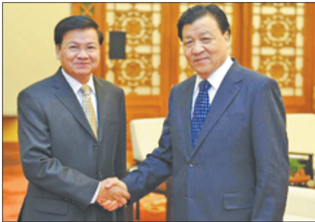
Liu Yunshan (R), a member of the Standing Committee of the Political Bureau of the Communist Party of China (CPC) Central Committee, who is also a member of the Secretariat of the CPC Central Committee and head of the Publicity Department of the CPC Central Committee, shakes hands with Laos Deputy Prime Minister Thongloun Sisoulith, representative of Choummaly Sayasone, Laos president and general secretary of Laos' ruling Lao People's Revolutionary Party (LPRP), in Beijing, capital of China, on 16 Nov, 2012.

BEIJING, 17 Nov—Senior Communist Party of China leader (CPC) Liu Yunshan met here on Friday with Laos Deputy Prime Minister Thongloun Sisoulith, representative of Choummaly Sayasone, Laos president and secretary general of Laos' ruling Lao People's Revolutionary Party (LPRP).