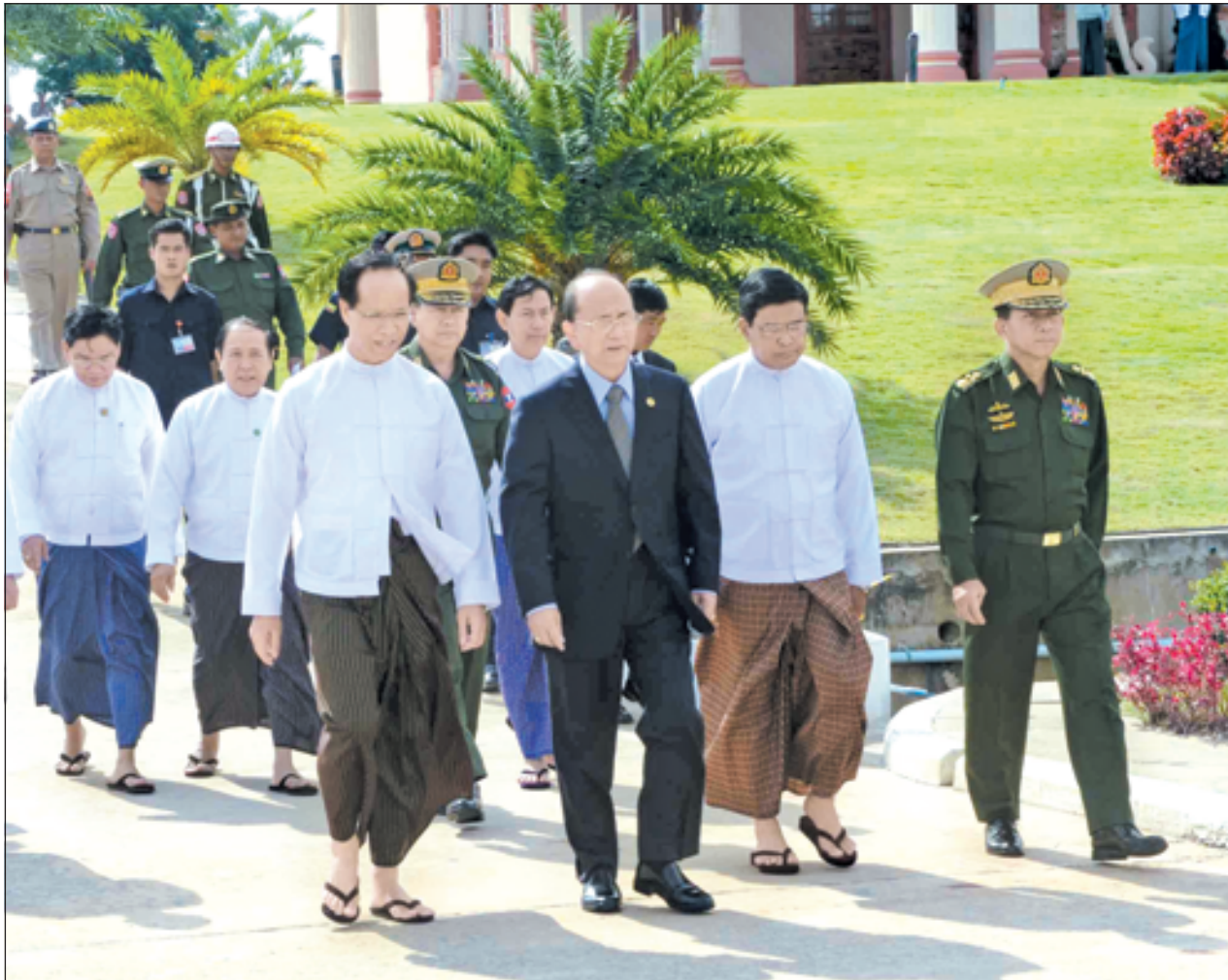
Vice-Presidents Dr Sai Mauk Kham and U Nyan Tun, Vice-Senior General Min Aung Hlaing and officials see off President U Thein Sein at Nay Pyi Taw Airport.