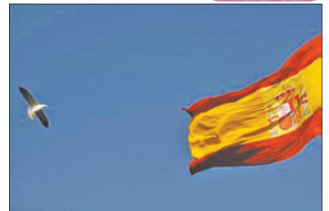
A seagull flies past the Spanish flag in front of the congress hall, venue of the Ibero-American Summit, in Cadiz, southern Spain on 15 Nov, 2012.

Spain has set up a bad bank to siphon off toxic real estate assets dating from a 2008 property crash from