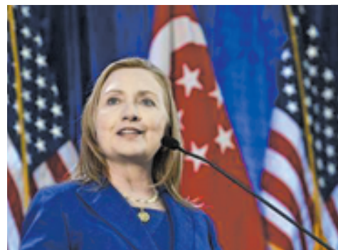
U.S. Secretary of State Hillary Clinton.

the ongoing reform efforts in the nation, encourage "further change" and offer new opportunities for businesses in both countries. As a result, the United States will open up to most products from Myanmar under a waiver and general license with the exception of jadeite and