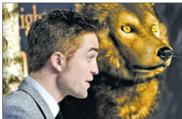
Cast member Robert Pattinson poses for pictures before the German premiere of The Twilight Saga: Breaking Dawn Part 2 in Berlin, on 16 Nov, 2012.

Next up is a drama, "Map to the Stars," again with Cronenberg, and "The Rover," a Western-style action movie set in the