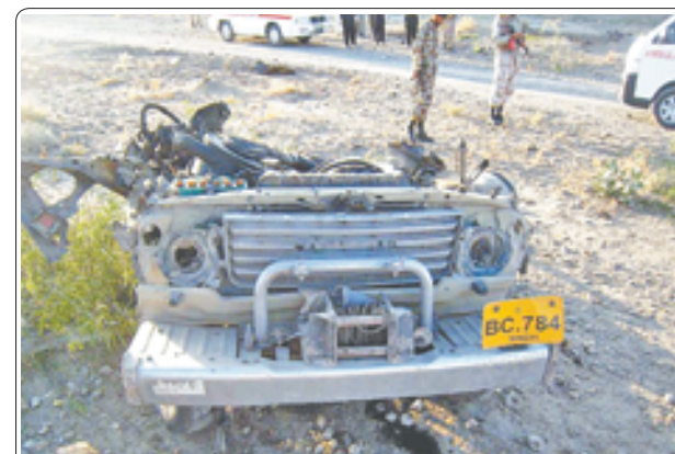
Photo taken on 16 Nov, 2012 shows the wreckage of a vehicle of security forces at the suicide blast site in Zhob, Pakistan's southwest province of Balochistan, on 16 Nov, 2012. At least four people including two troops were killed in a suicide blast here on Friday morning, said an officer.