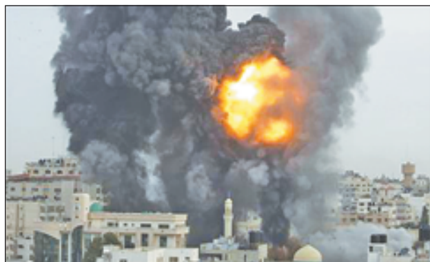
An explosion and smoke are seen after Israeli strikes in Gaza City on 17 Nov, 2012.

Officials in Gaza said 38 Palestinians, half of them