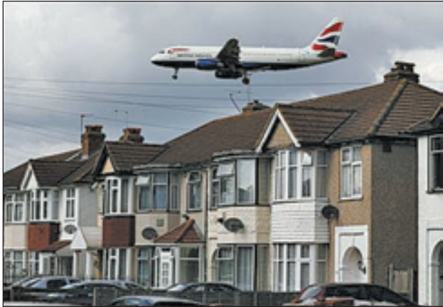
A British Airways jets arrives over the top of houses to land at Heathrow Airport in west London on 28 Aug, 2012.

LONDON, 17 Nov—A lack of spare runway capacity at Heathrow costs Britain $22 billion (14 billion pounds) a year in lost trade and means the country is losing out to European rivals in the race for lucrative emerging markets routes, a study found. The report, commissioned by Spanish group Ferrovial's Heathrow Ltd, said the