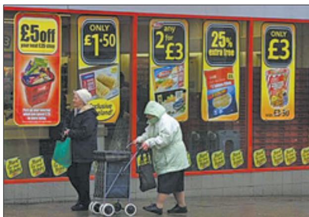
Women walk past offers advertised in the windows of a supermarket near Manchester, northern England on 25 April, 2012.