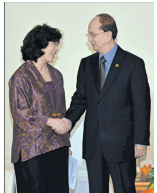
President U Thein Sein shakes hands with UN Under-Secretary-General and ESCAP Executive Secretary Dr Noleen Heyzer.