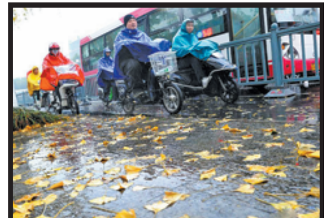
People ride in the rain on Daoqian Street in Suzhou, east China's Jiangsu Province, on 16 Nov, 2012. Suzhou witnessed a rainfall on Friday.