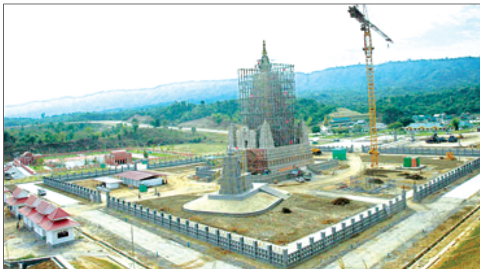
Photo shows a workplace of Thattahtana Pagoda Construction Project which is underway at Ottarathiri Hillock in Pobbathiri Township in Nay Pyi Taw Council Area recently. The project started on 22 September 2011 and 80 per cent of the whole project has been completed so far.

Thanks to collective efforts of firemen, auxiliary fire brigade members and local people, the fire was under control at 2 pm. As strong wind fanned the fire, many houses on the only main road of the hilly town were burnt down. Authorities concerned are providing necessary assistant to fire victims. — Kyemon