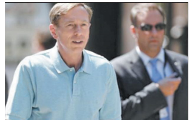
Director of the Central Intelligence Agency General David Petraeus attends the Allen & Co Media Conference in Sun Valley, Idaho on 12 July, 2012.