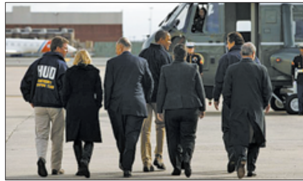
US President Barack Obama (C) walks to Marine One upon his arrival in New York City to view recovery efforts from Hurricane Sandy, on 15 Nov, 2012.