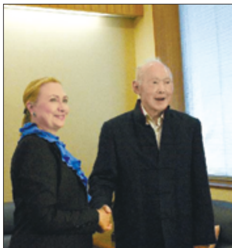
Singapore's former Prime Minister Lee Kuan Yew (R) shakes hands with US Secretary of State Hillary Clinton in Singapore's Istana, on 16 Nov, 2012.