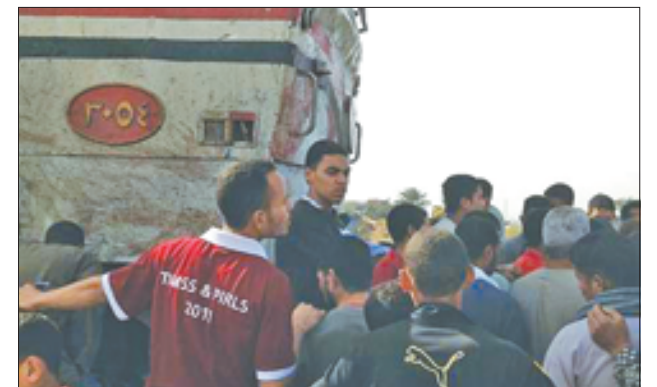
People gather near a train, with bloodstains, after it crashed into a school bus at Manflot in the southern city of Assiut, 500 km (310 miles) south of Cairo, 17 Nov, 2012.

ways have a poor safety record and Egyptians have long complained that successive governments have failed to enforce even ba-