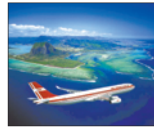
Airbus A340 south of Mauritius, with Le Morne on the left.

Air Mauritius said the first flight to Shanghai, starting