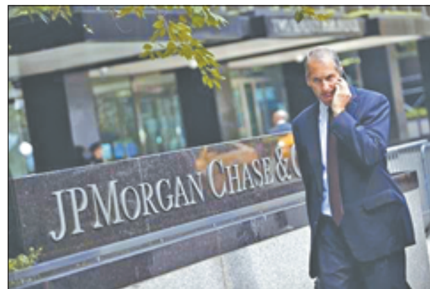
A man walks past JP Morgan Chase's international headquarters on Park Avenue in New York in this on 13 July, 2012 file photo.

The reduced final bill takes into account the transfer of assets to the bad bank, capital raising operations, such as Popular's 2.5 billion euros capital increase, and the forced losses on holders of hybrid and junior debtholders.—Reuters