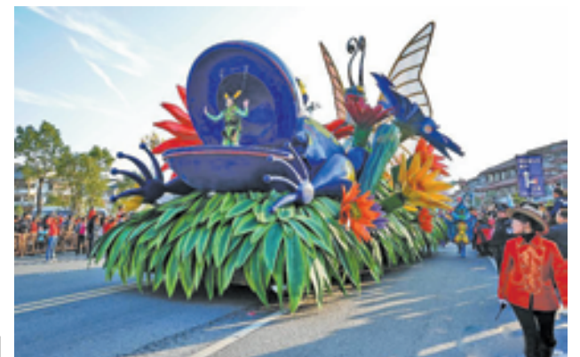
A float parades during a carnival held in Wuyi Mountain, east China's Fujian Province, Nov. 17, 2012. The carnival is aimed at further boosting the tourism industry of Wuyi Mountain. The area attracted 4.27 million visitors during the first half of 2012, with a year-on-year growth rate of 17.9 percent.

More than 500 people, including elderly people, children from home and abroad and foreign students in China, participated in the competition. All the contestants showcased their knowledge about the life story of Confucius and his Analects.