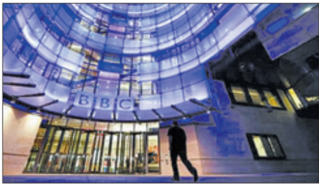
A man enters BBC New Broadcasting House in London on 11 Nov, 2012.

LONDON, 17 Nov —The BBC agreed to pay 185,000 pounds on Thursday to a former treasurer of Britain's Conservative Party wrongly accused of child sex abuse as a result of one of its reports.