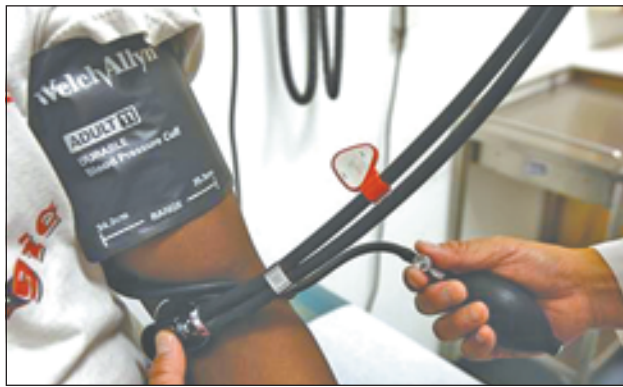
A doctor checks the blood pressure of a patient in downtown Los Angeles on 30 July, 2007.

NEW YORK, 17 Nov—A growing and aging population, along with increased access to health insurance, will create the need for 52,000 more primary care doctors within the US by the year 2025, according to a new study. The researchers wanted to estimate how many such doctors the US healthcare system would need after the passage of 2010's Affordable Care Act, which will give an estimated