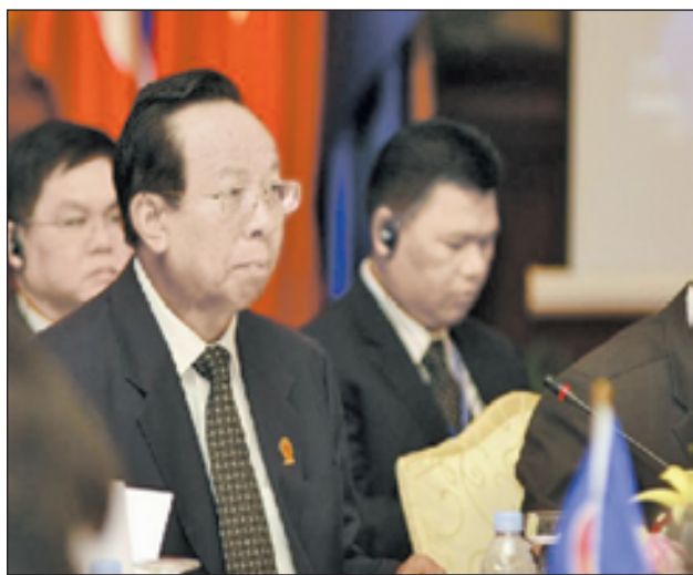
Cambodian Deputy Prime Minister and Defence Minister Tea Banh (L front) chairs the Association of Southeast Asian Nations (ASEAN) Defence Ministers' Meeting Retreat in Siem Reap, Cambodia, on 16 Nov, 2012. Defence ministers from the ten-country ASEAN met here on Friday to exchange views and to raise practical actions and measures for cooperation in order to maintain peace and security in the region.