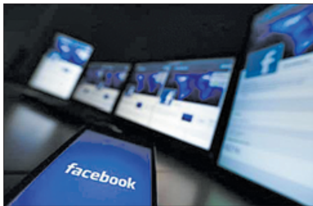
The loading screen of the Facebook application on a mobile phone is seen in this photo illustration taken in Lavigny on 16 May, 2012.