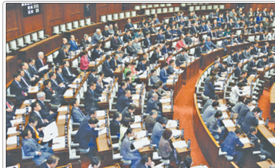
Photo shows a plenary session of the House of Councillors in Tokyo on 16 Nov, 2012, at which a bill on electoral system reform was passed. Another key bill on government debt issuance was also passed.