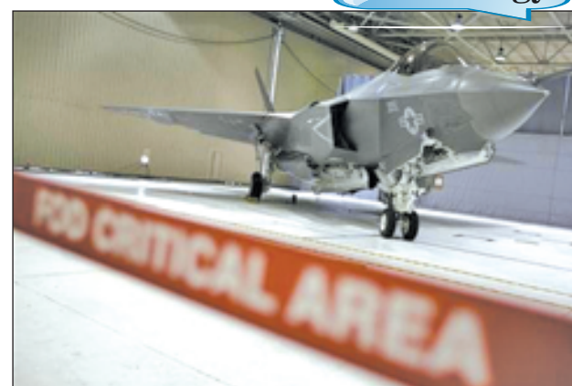
A F-35 Lightning II Joint Strike Fighter is seen at the Naval Air Station (NAS) Patuxent River, Maryland on 20 Jan, 2012.

And the weapons designers are having difficulty keeping up with the hackers. While it often takes years to field new weapons