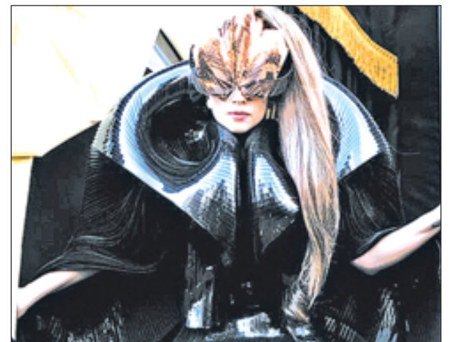
The 26-year-old eccentric pop star is a huge fan of Versace's striking designs, and she recently stepped out in the iconic safety-pin dress first worn by Elizabeth Hurley in 1994.

Lady Gaga—who is in a relationship with Chicago Fire actor Taylor Kinney—said: "When I eat and am healthy and not so worried about my looks then I'm happy. I'm happier than I've ever been. This is who I am. And I am proud at any size."