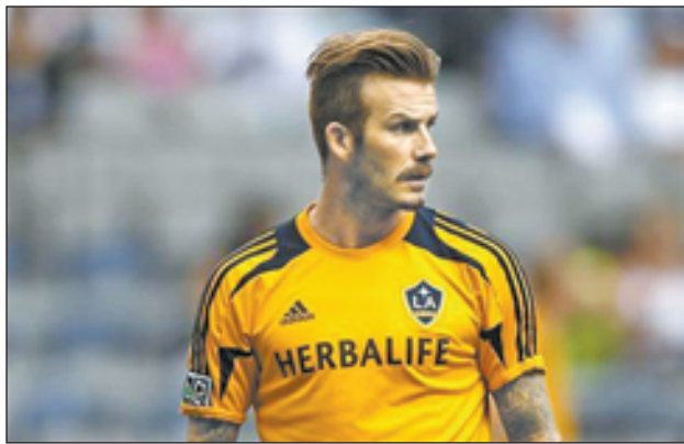
David Beckham of the LA Galaxy warms up before his team faces the Vancouver Whitecaps during their MLS soccer match in Vancouver, British Columbia on 18 July, 2012.