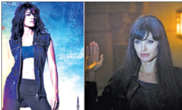
Angelina Jolie's role in Phillip Noyce's 2010 thriller was action oriented and 27-year-old Jacqueline's character in the film, also has high octane action sequences.

from the set said. Jacqueline trained extensively to attain the desired Race 2 look. She worked with a Vietnamese trainer and also practised sword fighting to fit in the character.