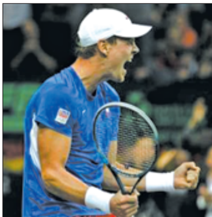
The Czech Republic's Tomas Berdych reacts after he defeated Spain's Nicolas Almagro in the singles at the Davis Cup tennis tournament final match in Prague on 16 Nov, 2012.

The top Czech player, ranked sixth in the world, used his booming serve to good effect and drew inspiration from the vocal