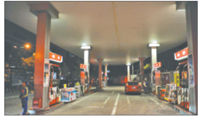
A worker fills a car at a gas station in Hangzhou, capital of east China's Zhejiang Province, on 15 Nov, 2012. China will cut the retail prices of gasoline by 310 yuan (49.2 US dollars) and diesel by 300 yuan per tonne starting from Friday, the National Development and Reform Commission (NDRC), the country's top economic planner, said on Thursday.

"Or whether because the LDP created the mess, we should have a stronger more intelligent leader, like Hashimoto," the lawmaker added, referring to popular Osaka Mayor Toru Hashimoto, who leads the small Japan Restoration Party.