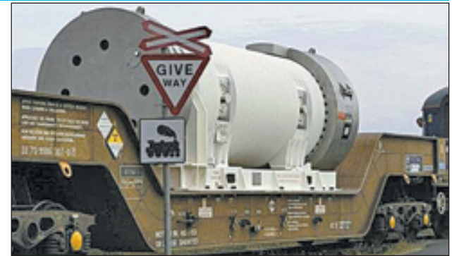
A cylinder containing nuclear waste is transported by rail from Barrow-In-Furness to Sellafield in this 17 Sept, 2002 file photo.