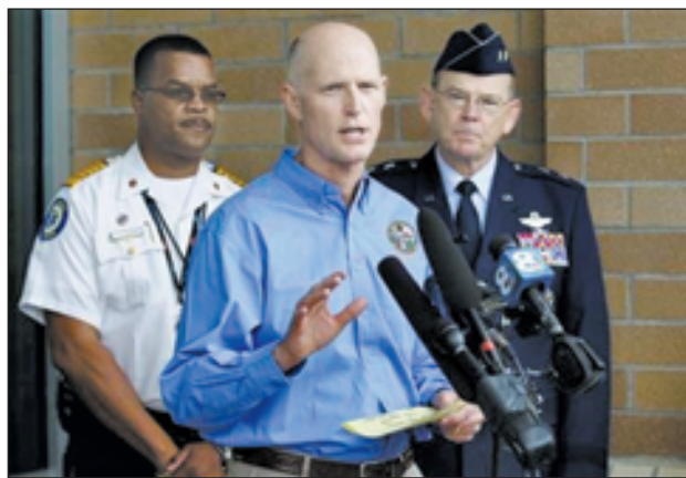
Florida Governor Rick Scott (C) speaks during a news conference as Tropical Storm Isaac approaches the state amid final preparations for the Republican National Convention in Tampa, Florida on 26 Aug, 2012.

"We encourage legislators to have a bipartisan, open and vigorous discussion about what changes need to