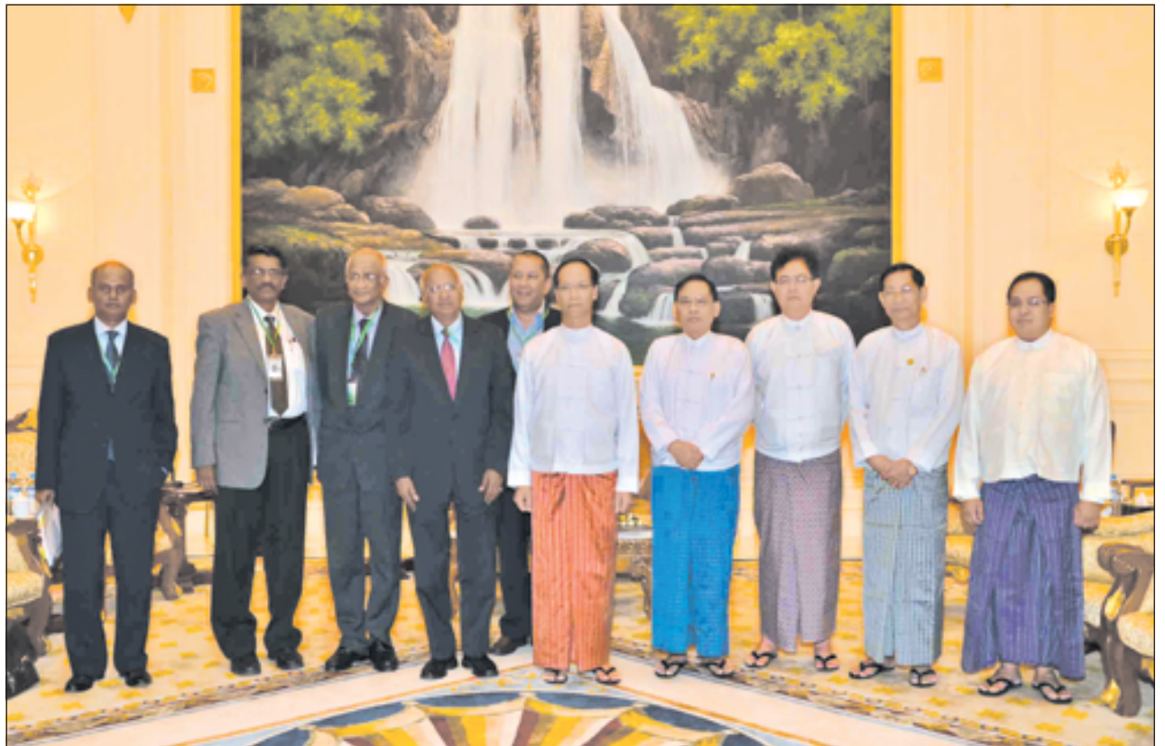
Vice-President Dr Sai Mauk Kham receives Chairman of Task Force Mr S Ramadorai of India and party.

At the call, both sides cordially discussed matters on designation land for construction of Myanmar Institute of Information Technology (MIIT) in Mandalay, appointment of trainers and staff and construction of staff quarters.