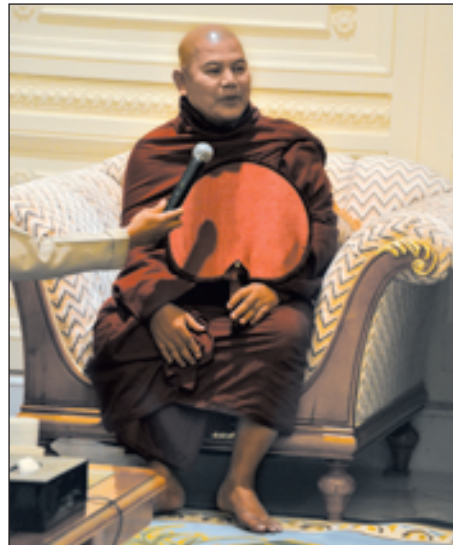
Alodawpyae Monastery Sayadaw Agga Maha Ganthavaçaka Pandita Bhaddanta Suçitta-bhivamsa. MNA

U Than Lwin of Myanmar Muslim National Affairs