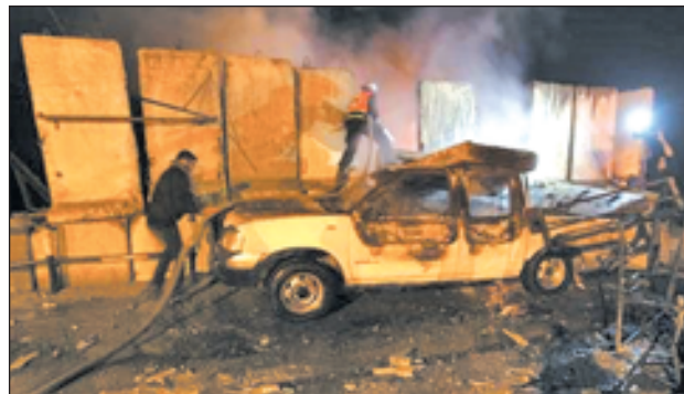
Palestinians extinguish a fire after Israeli air strikes targeted an electricity generator that fed the house of Hamas's Prime Minister Ismail Haniyeh in Gaza City on 15 Nov, 2012.