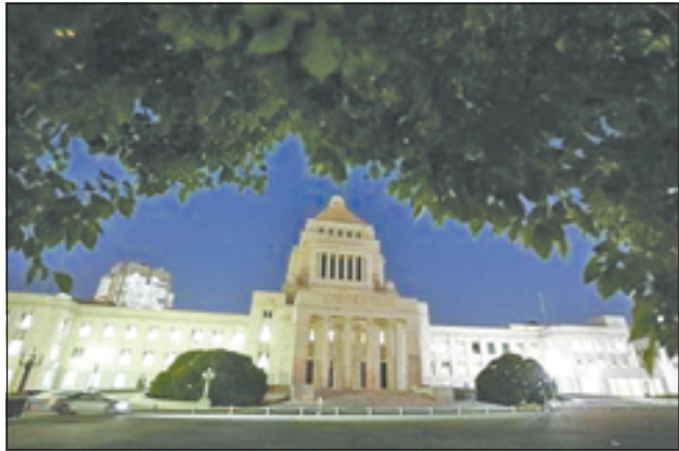
The parliament building is pictured in Tokyo on 15 November, 2012.

TOKYO, 16 Nov—Japan is set to dissolve parliament's lower house on Friday for a 16 December election that is likely to return the long-dominant Liberal Democratic Party (LDP) to power with a conservative former prime minister at the helm. However, few expect the poll, three years after a historic victory swept the Democratic Party of Japan (DPJ) to power for the first time, will fix a policy stalemate that has plagued the economy as it struggles with an ageing population and security challenges due to China's rapid rise. Political experts worry former Prime Minister and head of the LDP Shinzo Abe, who polls suggest will be the next premier, will further fray ties with China, already chilled by a territorial row over a group of islands. "They will probably have the same problems of