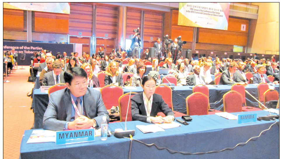
Union Minister Dr Pe Thet Khin attends Fifth Session of the Conference of the Parties to the WHO Framework Convention on Tobacco Control.—MNA

NAY PYI TAW, 16 Nov—A Myanmar delegation led by Union Minister for Health Dr Pe Thet Khin attended WHO Framework Convention on Tobacco Control Meeting for South East Asia Region on 11