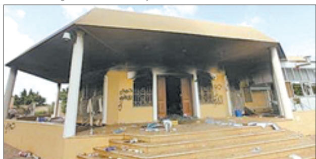
An exterior view of the US consulate, which was attacked and set on fire by gunmen, in Benghazi on 12 Sept, 2012.

Two top Republican senators on Wednesday threatened to block any nomination of Susan Rice, US ambassador to the United Nations, to a Cabinet post, which must be confirmed by the Senate, for making those initial comments. Obama came to her defence and said if she was the right person for a spot in his Cabinet, he would nominate her.—Reuters