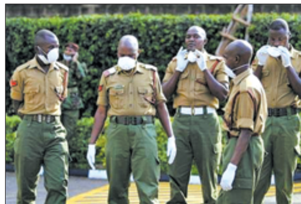
Kenyan police officers wait to receive bodies of colleagues killed in an ambush by cattle raiders in a remote northern region, at the Chiromo University Mortuary in Nairobi on 13 Nov, 2012.