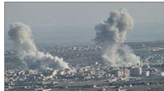
Smoke rises after a Syrian Air Force fighter jet loyal to Syria's President Bashar al-Assad fired missiles at Marat al-Numan, near the northern province of Idlib, on 14 Nov, 2012.

Speaking to Reuters as Arab and European ministers met to discuss Syria at the Arab League in Cairo, Mouaz Alkhatib, the Damascus preacher elected unopposed on Sunday to lead the new group, had asked for diplomatic backing.—Reuters