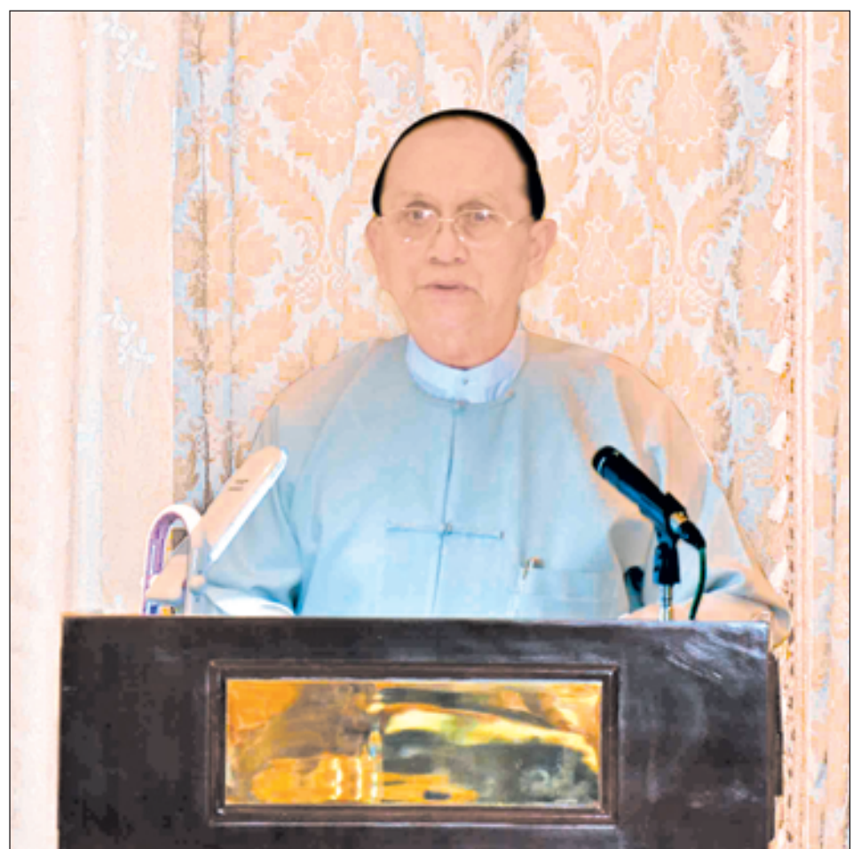
President of the Republic of the Union of Myanmar U Thein Sein makes clarifications on undertakings of the government in response to incidents in Rakhine State under the law.—MNA

During June and October incidents, there occurred conflicts in 11 of 17 townships in Rakhine State. It is found that the percentage of people who have suffered the consequences of it is 53.8% (women), 46.2% (men) and 42.9% (children under 12), mostly women and children. It is estimated that it needs 66.5 million USD for