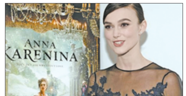
The Anna Karenina actress accepts her story doesn't sound very convincing but is adamant the spooky encounter happened.

Unlike the Grammy Awards, which are decided on by music producers, songwriters and others working in the industry, the American Music Awards are determined by fans.