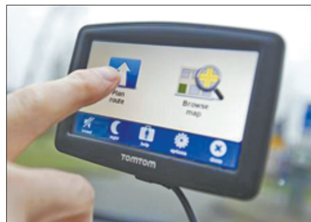
A TomTom navigation device is seen in this photo illustration taken in Amsterdam on 28 Feb, 2012.

SAN FRANCISCO, 16 Nov — Mapping software company TomTom has made its vast mapping data available to apps developers, providing an alternative to companies that now use maps from Google Inc and Apple Inc.