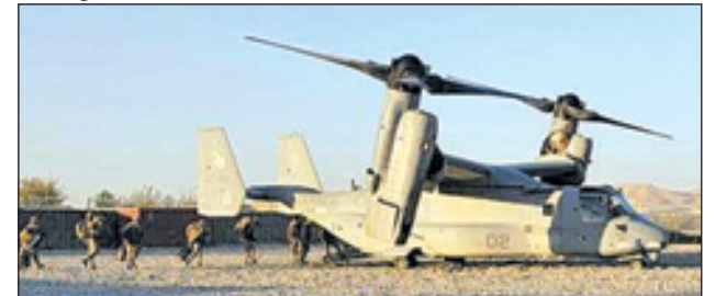
US Marines of 2nd Battalion, 7th Marines Regiment, board a military helicopter to head out for a mission at the landing zone of Combat Outpost Muza Qal-Ah in Helmand province, southwestern Afghanistan on 11 Nov, 2012.