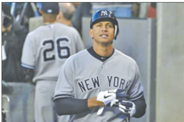
New York Yankees' Alex Rodriguez reacts after returning to the dugout after his first at-bat in the sixth inning during Game 4 of the MLB ALCS baseball playoff series against the Detroit Tigers in Detroit, Michigan, on 18 Oct, 2012.

Los Angeles, 16 Nov — The New York Yankees story will move from the baseball diamond to the Broadway stage, the sports franchise