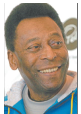
Pele Football legend Pele

According to Queiroz, the joint's damage had largely been caused by years of wear and tear suffered during the Brazilian's playing career.