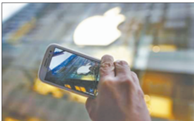
A passerby photographs an Apple store logo with his Samsung Galaxy phone on the morning iPhone 5 goes on sale to the public in central Sydney on 21 Sept, 2012.