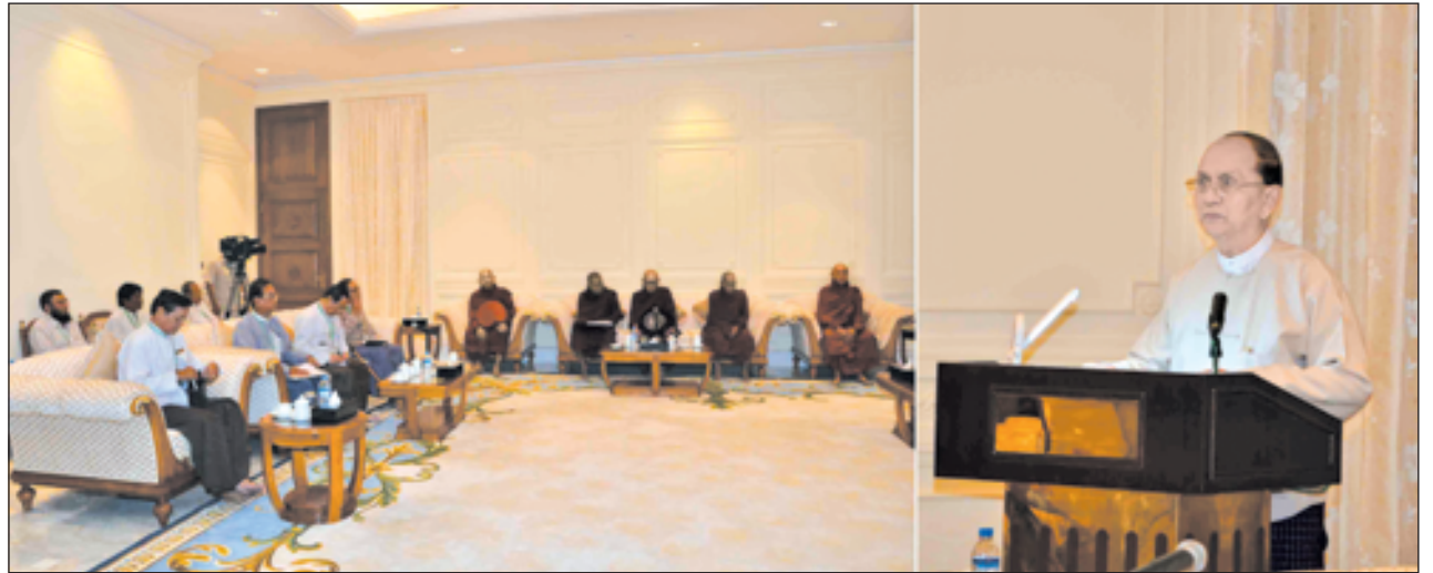
President U Thein Sein meets members of the Sangha and religious leaders.

ordered the local people to hand over illegal arms and accessories to nearby police stations and security forces as from 3 November and received 726 percussion lock firearms, 130 swords, 506 spears, 112 bows, 611 arrows, 1408 spikes and 398 catapults and accessories