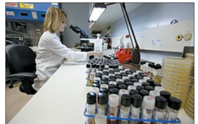
A Mycology Specialist in the Vanderbilt Clinical Microbiology Lab for patient care examines samples to isolate and identify specimens for growth in Nashville, Tennessee on 19 Oct, 2012.

according to media reports. As part of the settlement, BP also agrees to plead guilty to 11 felony counts of misconduct or neglect charges related to the deaths of 11 people in the Deepwater Horizon accident, one misdemeanor count under the Clean Water Act, one misdemeanor count under the Migratory Bird Treaty Act, as well as one felony count of obstruction of Congress, the BP statement said.—Reuters