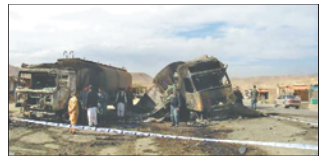
Afghans gather around burned tanker at a high way in Samangan province, 215 km north of Kabul, Afghanistan on 15 Nov, 2012. Unknown armed men attacked an oil tanker and two food-laden trucks in Samangan province, 215 km north of Kabul, late Wednesday night, a local official said on Thursday.

Meantime, Zabihullah Mujahid who claims to speak for the Taliban outfit in talks with media via telephone from an unknown location claimed of responsibility, stressing that the Taliban fighters attacked and destroyed the convoy supplying goods to NATO-led troops in Kabul. Xinhua