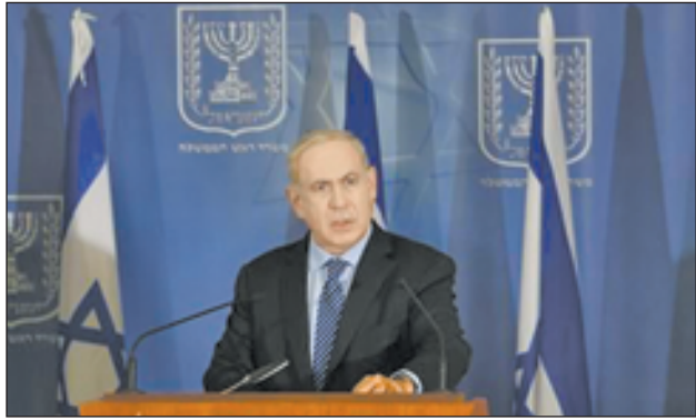
Israel's Prime Minister Benjamin Netanyahu delivers a statement to the media in Tel Aviv on 14 Nov, 2012.

GAZA, 16 Nov—Two rockets fired from the Gaza Strip targeted Tel Aviv on Thursday in the first attack on Israel's commercial capital in 20 years, raising the stakes in a showdown between Israel and the Palestinians that is moving towards all-out war.