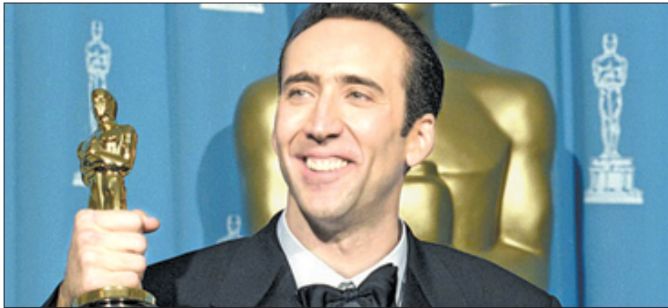
Academy Award-winning actor Nicolas Cage