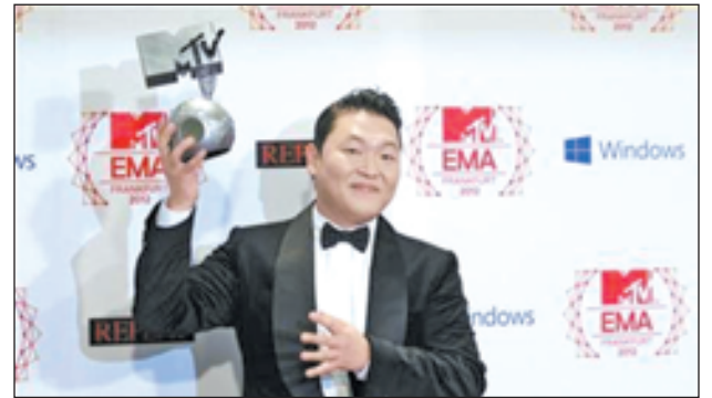
South Korean singer PSY poses with his Best Video award backstage during the MTV European Music Awards 2012 show at the Festhalle in Frankfurt on 11 Nov, 2012.

She told TV talk show host Jay Leno: "I was staying in a hotel in this city [Los Angeles]. The room had a bedroom and a sitting room. I walked into the sitting room. I'd just got out of the shower. There was a guy sitting on the sofa. He had a burgundy shirt on and he had short black hair and I thought 'Oh some guy has come into my room.' I said to him 'I'm really sorry, you're in my room,' and he disappeared. Then my mum