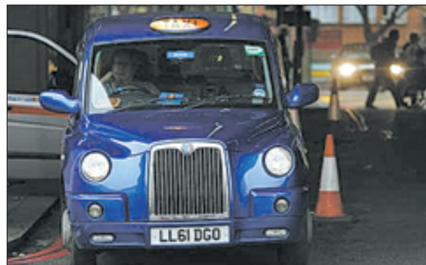
A TX4 London black cab is parked outside Victoria Station in London on 22 Oct, 2012.—REUTERS

The steering box is a design from a supplier in China, which was introduced in the company's Coventry factory in late February. "We are working to get taxis back on the road as quickly as possible but clearly, with the large number of vehicles affected in London and also in the regions, this work will take several weeks to complete," said Hammond.—Reuters