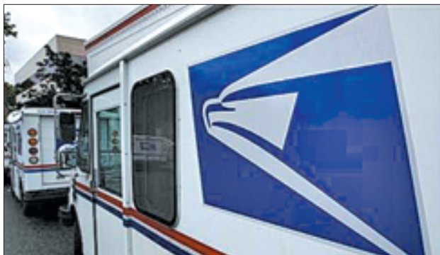
United States Postal Service trucks are seen in Manhasset, New York on 1 August, 2012.

WASHINGTON, 16 Nov— The US Postal Service reported a record annual loss on Thursday and warned that, without congressional action, it could face a cash shortfall next fall. The mail service said it lost $15.9 billion in the fiscal year that ended on 30 September. That is more than triple its $5.1 billion loss last year.