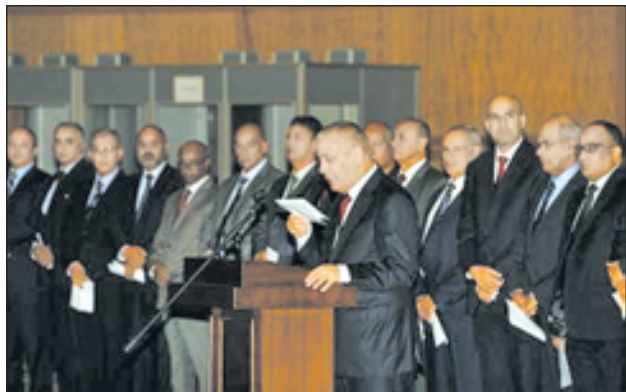
Libyan Prime Minister Ali Zeidan takes his oath during the swearing in ceremony in Tripoli, on 14 Nov, 2012.

TRIPOLI, 16 Nov—Libya's first elected government was sworn in under tight security on Wednesday with the task of establishing democracy and reining in rival militias who helped overthrow Muammar Gaddafi last year.