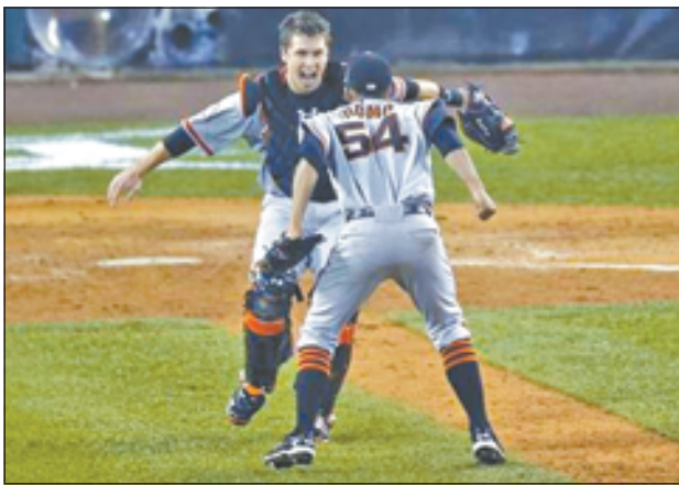
San Francisco Giants relief pitcher Sergio Romo (R) jumps into the arms of catcher Buster Posey (L) after defeating the Detroit Tigers to win the MLB World Series baseball championship in Detroit, Michigan, on 28 Oct, 2012.

Following his injury-shortened 2011 season, Posey returned this year as though nothing had