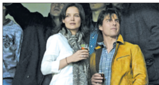
The couple would have celebrated their sixth wedding anniversary on 18 November. — PTI

"She's got to be torn up emotionally because it dredges up both good and bad