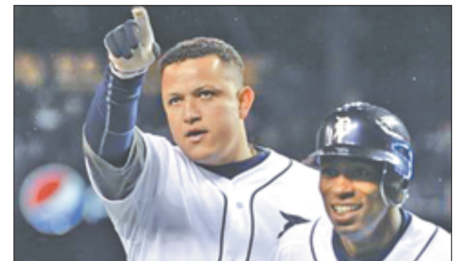
Detroit Tigers' Miguel Cabrera (L) and Austin Jackson celebrate Cabrera's two run home run against the San Francisco Giants in the third inning during Game 4 of the MLB World Series baseball championship in Detroit, Michigan, on 28 Oct, 2012.

The 29-year-old Cabrera came on strong at the end of the season to help the Tigers overcome a sluggish start to overtake the Chicago White Sox and win the AL Central title on their way to a trip to the World Series. — Reuters