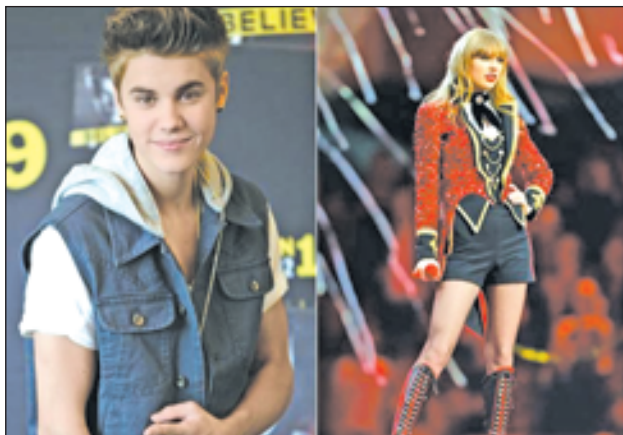
Taylor — who is one of Selena's best friends — will now sit near Justin with the 18-year-old singer's friend and mentor Usher and American Idol winner Carrie Underwood on the other side of him.

Meanwhile, Selena's friends reportedly hope her romance with Justin is over for good as she has "shed many tears" over him in the past year.