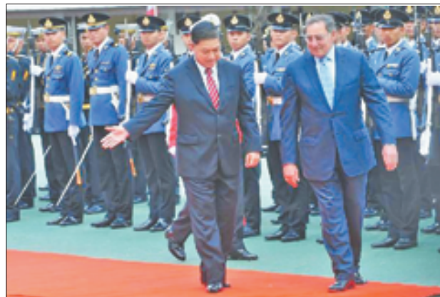
Thai Defence Minister Sukumpol Suwanatat (L, front) and US Secretary of Defence Leon Panetta (R, front) attend a welcoming ceremony at the Ministry of Defence in Bangkok, Thailand, on 15 Nov, 2012.

Thailand is one of the five countries in the Asia-Pacific categorized as a