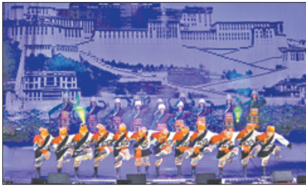
The 2012 Poland China Tibetan Culture Week.

The week-long event included an exhibition of more than 200 photos taken by Chinese and foreign