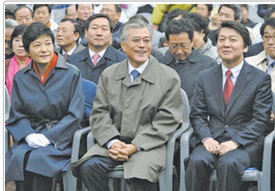
Photo taken on 6 Nov, 2012, shows (from L to R, front row) Park Geun Hye of the ruling Saenuri Party, Moon Jae In of the main opposition Democratic Party and Ahn Cheol Soo, a former university professor and software mogul, attending an event held on the square in front of the Seoul city office. The three are running in the South Korean presidential election to be held on 19 Dec.

"Two civilians, including a child, were killed and two women were seriously wounded when a minibus touched off a roadside bomb in Malang Kariz area in