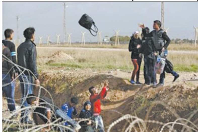
Syrians throw their belongings while trying to cross a ditch after crossing from the northern Syrian town of Ras al-Ain to Turkey in the border town of Ceylanpinar, Sanliurfa Province, on 10 Nov, 2012.—REUTERS

just crossed into the Turkish border town from Ras al-Ain through a hole in the barbed wire fence marking the border. The refugee crisis and the threat of spillover risks stretching Turkey's military and resources in a region where it is also fighting an emboldened Kurdish insurgency.—Reuters