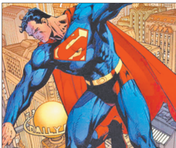
Superman topped a list of well-known names in a poll compiled by the makers of board game Stratego, reported Daily Mirror.

The best placing from the popular long-running Star Trek series was Captain Kirk (William Shatner) at number seven, in the poll of 2,000 people.