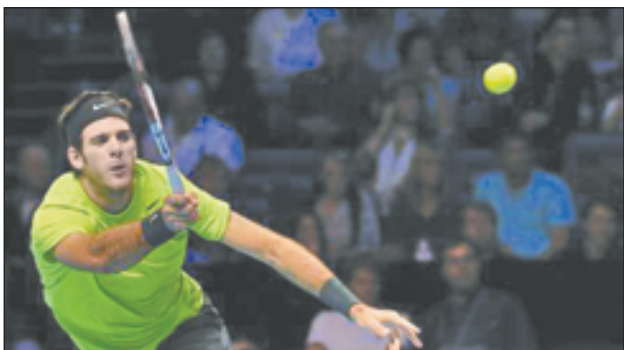
Argentina's Juan Martin Del Potro hits a return to Switzerland's Roger Federer during their men's singles tennis match at the ATP World Tour Finals at the O2 Arena in London on 10 Nov, 2012.