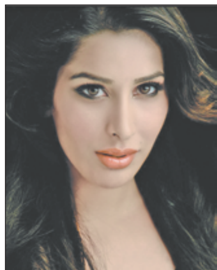
Actress-singer Sophie Choudry

Sophie has recently launched her new music