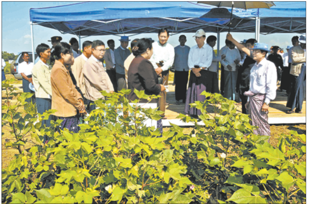
President U Thein Sein views thriving Shwedaung-8 cotton plantation at research farm.—MNA

President and party viewed the harvesting of hybrid paddy seeds with the use of a combine harvester made in Korea.