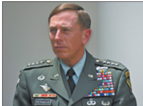
US Gen David Petraeus

The FBI investigation began fairly recently — months rather than years ago, when Petraeus would still have been in