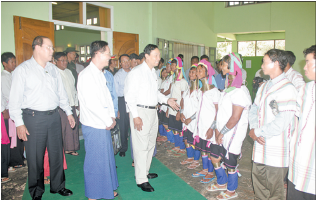
Pyithu Hluttaw Speaker Thura U Shwe Mann cordially converses with local national races.—MNA

The bicameral legislature is abolishing laws unbeneficial to citizens, and promulgating laws beneficial to citizens. He urged people's representatives, government members, and local national brethren to strive until lasting peace is built in the region.—MNA