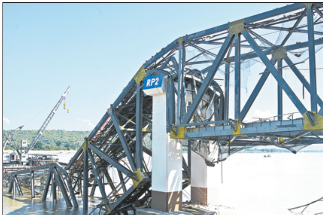
A strong earthquake of 6.8 Richter Scale destroys Ayeyawady Bridge (Yadana Theinga) in Kyaukmyaung Township.