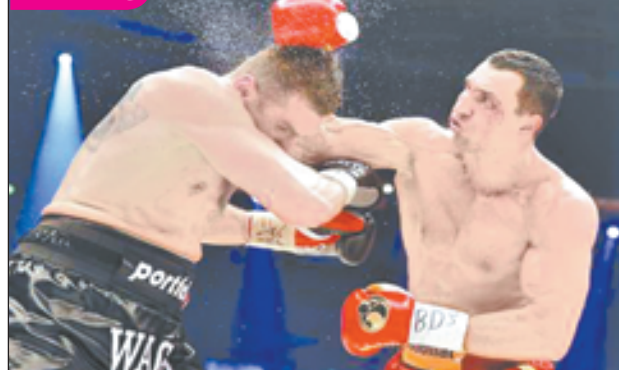
Ukrainian WBA, WBO, IBO and IBF heavy weight boxing world champion Vladimir Klitschko lands a blow on Polish challenger Mariusz Wach during their title bout in Hamburg on 10 Nov, 2012.