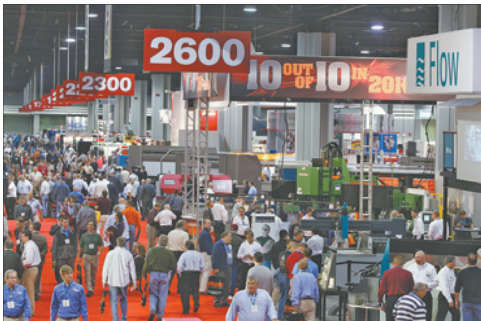
Photo shows the world's greatest economic and technological show in Las Vegas, US.