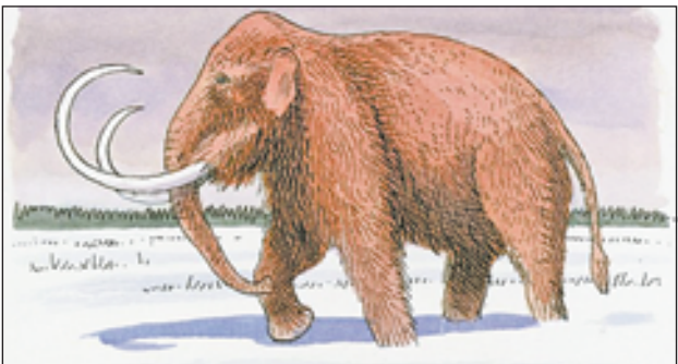
A Sketch of a mammoth

Mammoth remains are commonest in the frozen climates of Siberia, where around 140 specimens have been found including some of the world's best-preserved carcasses. The prehistoric animal disappeared from Western Europe around 10,000 years ago, most likely due to climate change and hunting.— Reuters