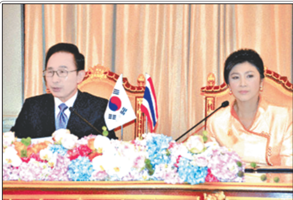
Thai Prime Minister Yingluck Shinawatra (R) and South Korean President Lee Myung Bak attend a joint Press conference in Bangkok on 10 Nov, 2012.

NAY PYI TAW, 11 Nov—Union Minister for Education Dr Mya Aye inspected Science-1, Science-2 and Arts-1 two-storey lecture buildings and staff quarters at Sagaing University at 7 am on 10 November. At the hall of the staff quarter, the Union Minister met faculty members and officials.