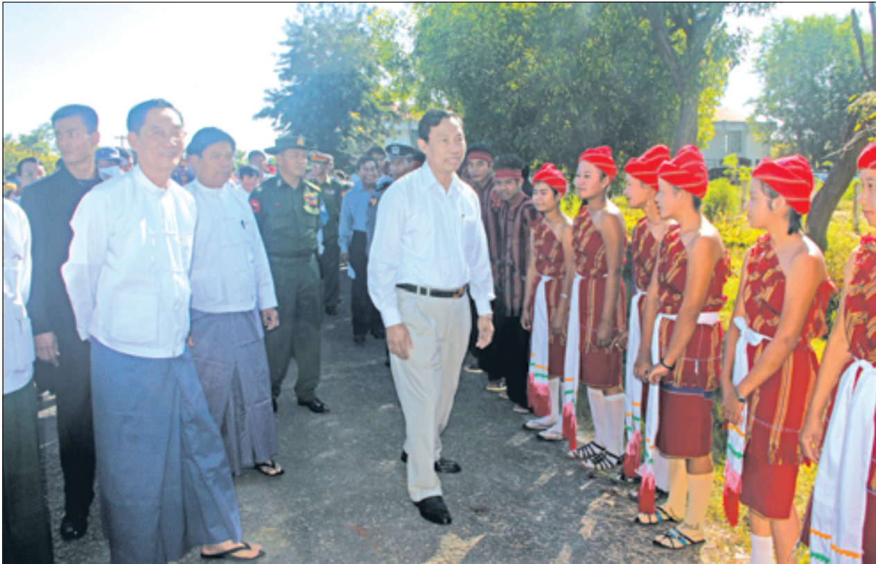
Speaker of Pyithu Hluttaw Thura U Shwe Mann cordially meets local national races.—MNA

NAY PYI TAW, 11 Nov— Speaker of Pyithu Hluttaw Thura U Shwe Mann, accompanied by Pyithu Hluttaw representatives and Union ministers arrived in Loikaw from Nay Pyi Taw by Tatmadaw helicopter this morning to fulfill the requirements of the local people of Kayah State.