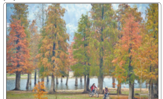
Two tourists ride bicycles at the Hong Village near Huangshan Mountain, east China's Anhui Province, on 10 Nov, 2012. The beautiful scenery of Huangshan Mountain in the early winter has attracted many tourists.