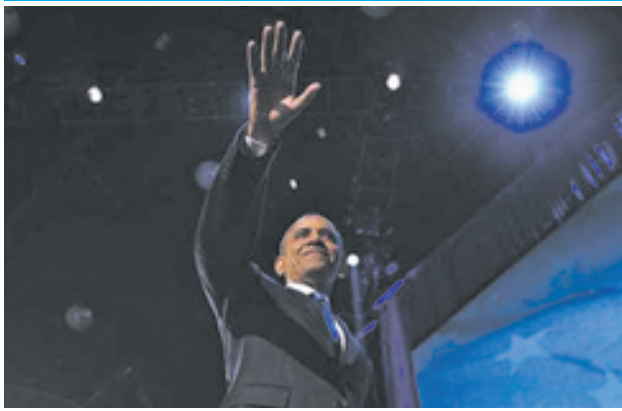
US President Barack Obama celebrates after winning the US presidential election in Chicago, Illinois, on 7 Nov, 2012.

NEW YORK, 11 Nov— With almost all ballots in Florida counted, US media on Saturday projected President Barack Obama the winner in that state four days after he won Tuesday's national election.