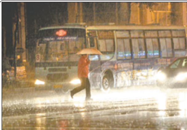
A citizen walks in the rain on Beima Road of Yantai City, east China's Shandong Province, on 10 Nov, 2012. A strong cold snap brought rainfall and wind to the coastal city, causing a fall in temperature.

Founded in 1967, the Association of Southeast Asian Nations (ASEAN) groups Brunei, Cambodia, Indonesia, Laos, Malaysia, Myanmar, the Philippines, Singapore, Thailand and Vietnam.— Xinhua