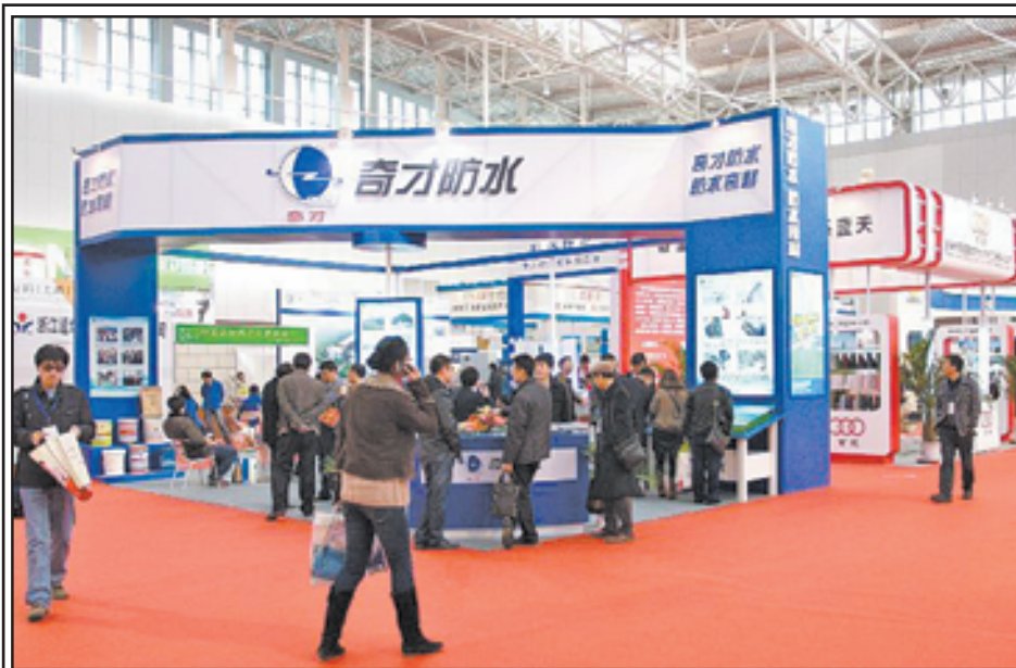
Photo taken on 9 Nov, 2012 shows the scene of the "2012 International Building Materials and Decoration Fair" in north China's Tianjin Municipality. The fair, with the participation of more than 800 enterprises, opened here on Friday.