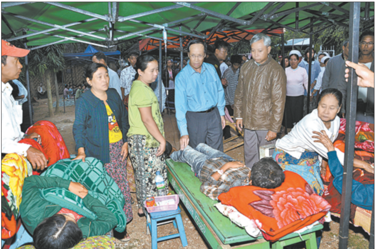
Vice-President Dr Sai Mauk Kham comforts quake victims.—MNA

In Thabeikkyin, the quake devastated 102 houses, four schools, 48 departmental buildings and 21 religious buildings, causing three people dead and 35 injured. A total of K 30 million— K 10 million contributed by the government and K 5 million each by four wellwishers— were handed over to the victims and relief and rehabilitation works are underway. As aftershocks are frequent up to a certain amount of time at the recent quake-hit areas, local people should not live in brick and brick noggin houses. —MNA