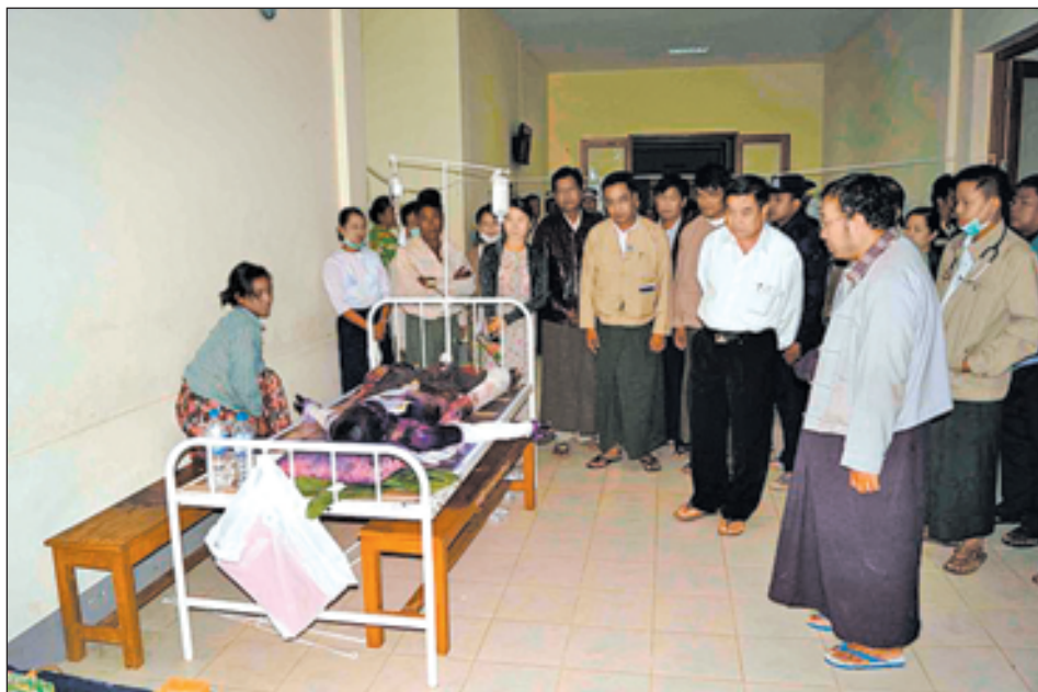
Sagaing Region Chief Minister U Tha Aye visits fire victims at Kyunhla People's Hospital.