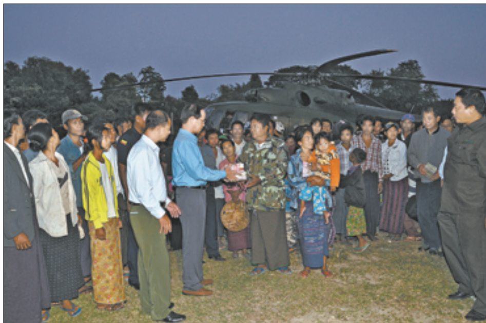
Vice-President Dr Sai Mauk Kham presents cash donations to local people at Thabeikkyin Sports Ground.