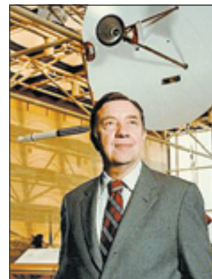
Late physicist James Van Allen