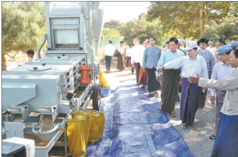
President U Thein Sein observes sorting of paddy seeds.—MNA

So first priority should be given not only to food sufficiency but also to surplus. There had been