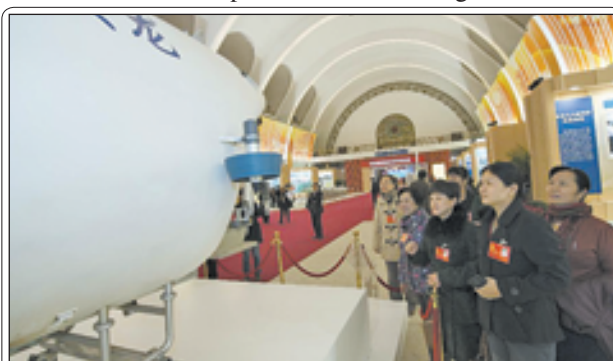
Delegates to the 18th National Congress of the Communist Party of China (CPC) visit a photo exhibition on achievements which China has gained under the leadership of the CPC, at Beijing Exhibition Centre in Beijing, capital of China, on 9 Nov, 2012.