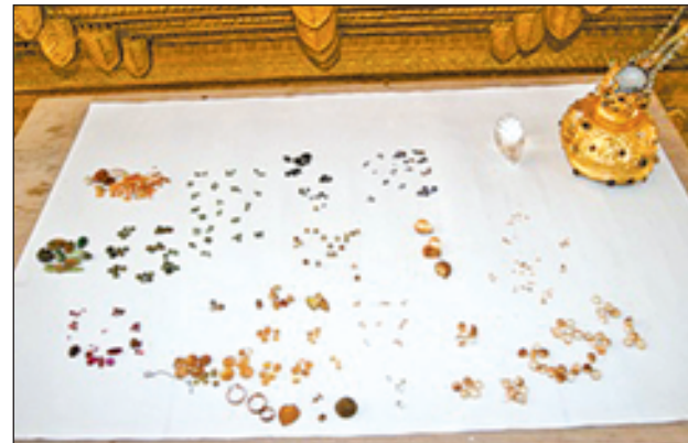
Damaged parts of diamond orb of Shwebontha Pagoda in earthquake.—MNA

In Kanbalu Township, walls of Male village monastery, two dhammayons and 20 houses were destroyed. Two stupas in Yayshin village monastery were damaged. Chimney of Myanmar Nyunt Rice Mill