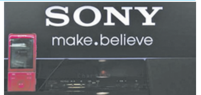
Sony Corp's logo is pictured on a Walkman speaker displayed at an electronics store in Tokyo on 24 Oct, 2012.