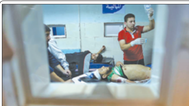
Palestinian men lie on a stretcher at al-Shifa hospital in Gaza City after being wounded in Israeli tanks shelling on 10 Nov, 2012. Four Palestinians were killed and 26 others wounded early on Saturday evening in the intensive Israeli tanks shelling on eastern Gaza city, medics and eyewitnesses said.

intervention in Mali. On Wednesday, Special Envoy of the UN Secretary General for the Sahel Region, Romano Prodi, paid a working visit to Algeria, as he discussed the crisis hitting northern Mali with Algerian top officials.— Xinhua