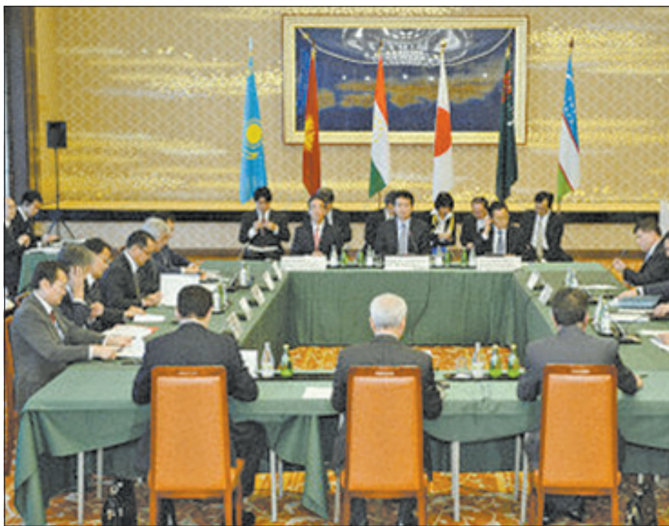
The foreign ministers of Japan and five Central Asian countries — Kazakhstan, Kyrgyzstan, Tajikistan, Turkmenistan and Uzbekistan — gather in Tokyo for a meeting on 10 Nov, 2012.

TOKYO, 11 Nov— Japan said on Saturday it will carry out $700 million worth of programmes for the next several years in five Central Asian countries to support their economic development efforts.