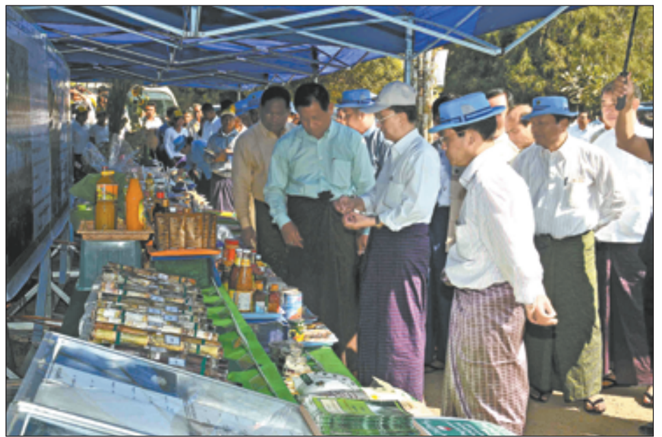
President U Thein Sein views seeds of paddy, maize, sunflower and cotton displayed by Agriculture Department and Industrial Crops Development Department and Agricultural Research Department.

Being an agro-based country with full of prospects, first priority should be placed on from food sufficiency to surplus. It is required to move forwards to the stage of 100 million people from the stage of feeding 60 million people. The objective of the government is to establish