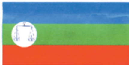
Flag of the National Democratic Party for Human Rights