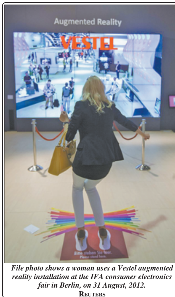
File photo shows a woman uses a Vestel augmented reality installation at the IFA consumer electronics fair in Berlin, on 31 August, 2012.