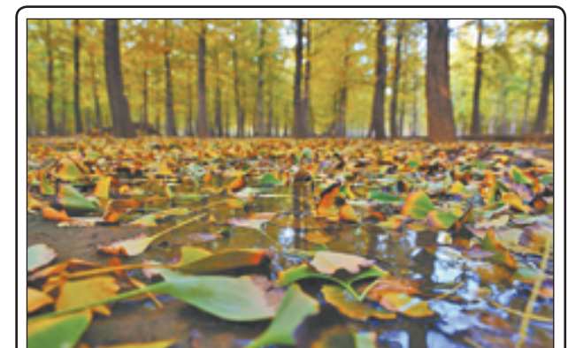
Photo taken on 4 Nov, 2012 shows fallen ginkgo leaves on the ground in Tancheng County of Linyi City, east China's Shandong Province. Most cities in northern part of China now receive beautiful autumn views as colder weather goldens tree leaves.—XINHUA