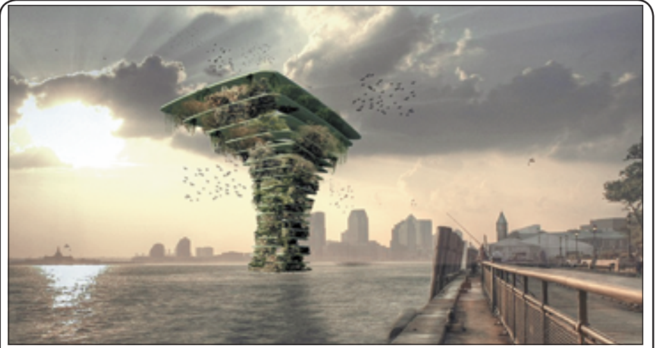
Design drawing of the Sea Tree, a multi-tiered structure comprising of layered green habitats by Dutch architect Koen Olthuis. This is a water-based park, which will offer favourable living areas for wild animals, also bring positive green effects to urban environments.