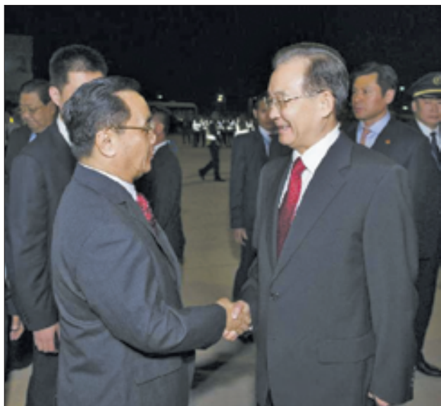
Chinese Premier Wen Jiabao (R, front) shakes hands with Lao Prime Minister Thongsing Thammavong (L, front) upon his arrival at Vientiane, capital of Laos, on 4 Nov, 2012.

VIENTIANE, 5 Nov— Chinese Premier Wen Jiabao arrived in Vientiane on