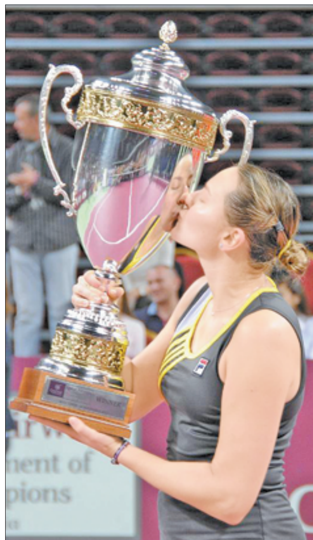
Nadia Petrova of Russia kisses her trophy after the final match against Caroline Wozniacki of Denmark at the WTA Tournament of the Champions in Sofia, Bulgaria, on 4 Nov, 2012. Petrova won 2-0 to claim the title.

Substitute Buddle squandered the home team's best opportunity in the 87th minute with a weak shot with Robbie Keane wide open.— Reuters