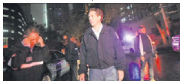
Governor Andrew Cuomo (C) inspects a deluge of water flooding the Battery Tunnel in Manhattan as Hurricane Sandy made its approach in New York on 29 Oct, 2012.

have hit the New York area since superstorm Sandy struck earlier this week, Cuomo also said 8 million gallons of fuel had been delivered since the New York Harbor reopened. Another 28 million gallons would be delivered this weekend, he said.—Reuters