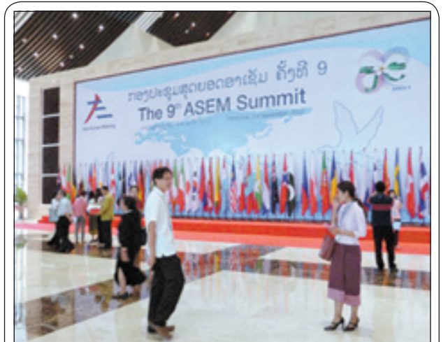
Photo taken on 4 Nov, 2012, shows the venue of a conference for senior officials from Asian countries in Vientiane, which was held 1 Nov prior to the Asia-Europe Meeting summit on 5 and 6 Nov in the capital of Laos.