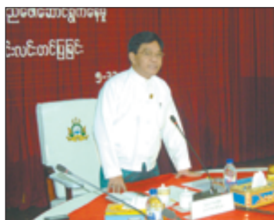
Union Minister U Nyan Tun Aung makes clarification on work progress and future tasks on Yangon Port Development project. MNA

YANGON, 5 Nov — Work is well under way to turn Yangon into a city of international level based on a plan of transforming its port into a public recreation centre. In the process, officials of Myanmar Port Authority are to make clarifications which are to be discussed by those from Yangon City Development Committee to ensure that the plan is in line with Yangon City Development Project. With this end in view, those from media world are invited for good suggestions, said Union Minister for Transport U Nyan Tun Aung at the clarification on work progress and future tasks on Yangon Port Development project being implemented under Port Conceptual Plan held at the MPA here this morning. Next, General Manager of MPA U Kyaw Myint explained work being carried and future tasks for Yangon Port Development project being implemented under Port Conceptual Plan. Afterwards, Yangon Region Development Affairs Minister Yangon Mayor U Hla Myint reported to the minister, saying that it is required not to harm the beautiful scenes of historic buildings in implementing the project and YCDC will give a helping hand to the most possible degree to the drive for the development of Yangon Port. MNA