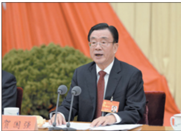
He Guoqiang, a member of the Standing Committee of the Political Bureau of the Communist Party of China (CPC) Central Committee, addresses the Eighth Plenary Session of the 17th Central Commission for Discipline Inspection (CCDI) of the CPC in Beijing, capital of China, on 4 Nov, 2012.