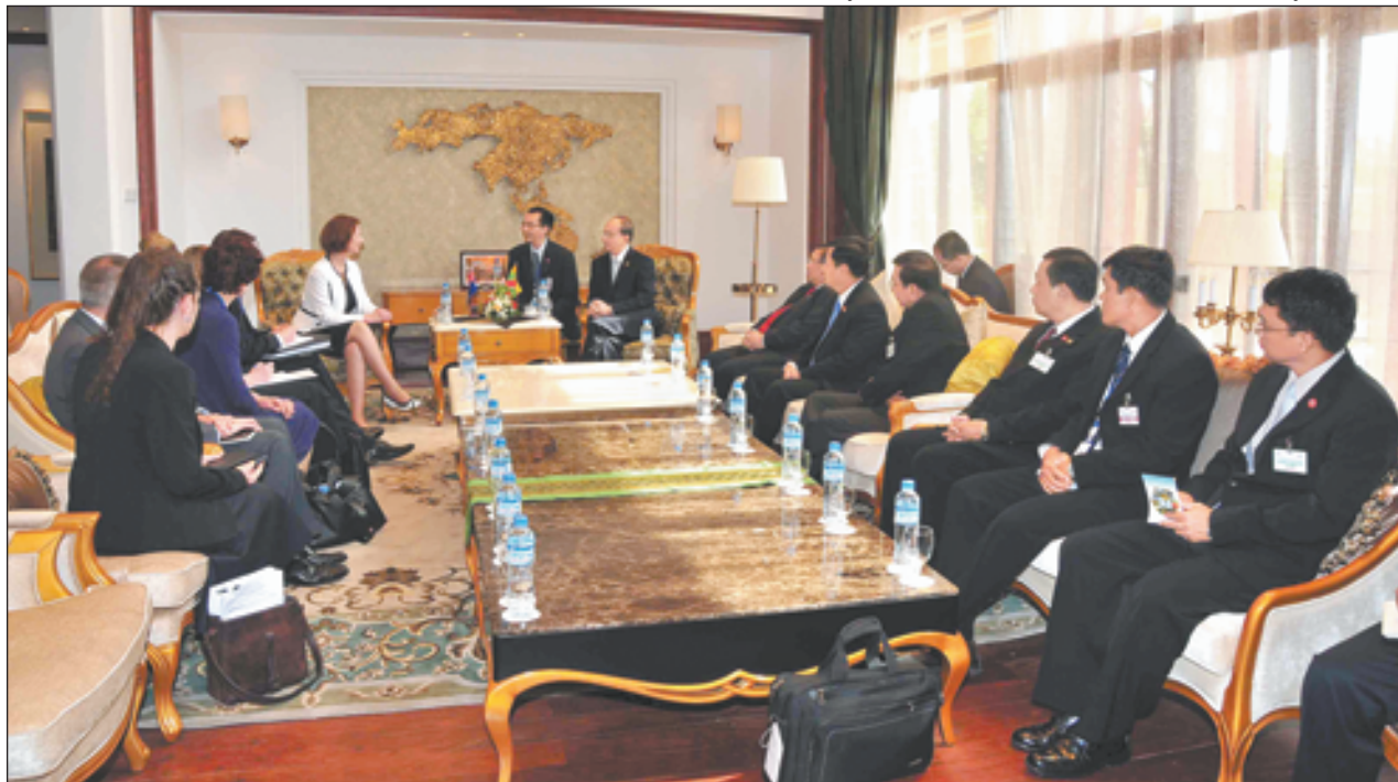
President U Thein Sein receives Australian PM Ms. Julia Gillard at Don Chan Palace Hotel in Vientiane.

agricultural production and development of telecommunications and information technology in rural areas, conducting courses and workshops for capacity building of service personnel who are going to discharge duties in ASEAN Summit 2014 in Myanmar which coincides 40 th Anniversary of Diplomatic Relations between ASEAN and Australia.