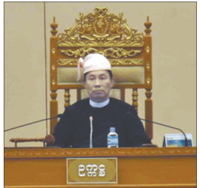
Pyithu Hluttaw Speaker Thura U Shwe Mann explains about the messages at eighth day session of the Hluttaw.

Deputy Minister for Education U Aye Kyu, with regard to the question about if there is any plan to upgrade Myogon Village Basic Education Middle School in Shwegu Township to basic education high school (branch), replied that there is no plan to do so. With respect to question about whether there is a plan to upgrade No. 27 and No. 32 basic education post primary