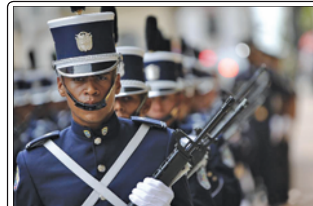
Panamanian National Police members march during a parade to commemorate the "Separation of Panama from Colombia Day" in Panama City, capital of Panama, on 3 Nov, 2012. Panama Saturday celebrated the 109th anniversary of its separating from Colombia on 3 Nov, 1903.—XINHUA

Local police are currently investigating the accident to make sure that the "Thriller Music Park" party did not exceed the 10,000 capacity of the Madrid Arena.—Xinhua