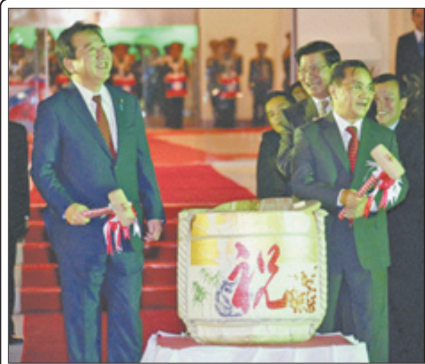
Japanese Prime Minister Yoshihiko Noda (L) and Lao Prime Minister Thongsing Thammavong finish breaking the lid of a sake barrel during a ceremony at an airport in the Laotian capital of Vientiane on 4 Nov, 2012, prior to the Asia-Europe Meeting summit to be held 5 and 6 Nov.

China, now the world's second largest economy, has also made earnest efforts to increase imports from Europe in the past three years since the onset of the financial crisis. As promised, China will continue to help bring the euro debt crisis to an early end.