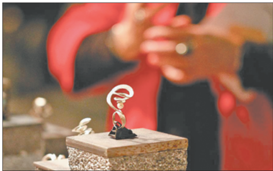
A visitor tries a piece of jewellery at the 11th International Jewellery Art Fair in Amsterdam on 4 Nov, 2012. The four-day exhibition closed on Sunday attracted more than 150 jewellery designers from all over the world.