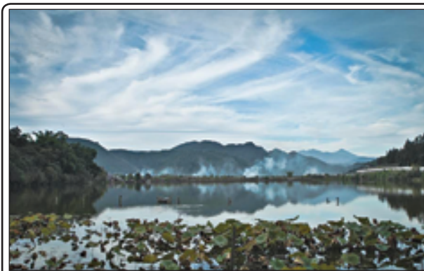
Photo taken on 3 Nov, 2012 shows the scenery around the ancient townlet Heshun in Tengchong County, southwest China's Yunnan Province. The townlet, featuring time-honoured temples and houses, is located three kilometers away from the county seat of Tengchong, where live 6,000 people.