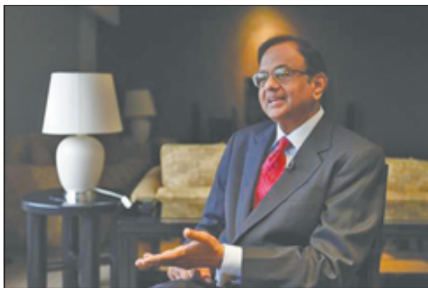
India's Finance Minister P Chidambaram speaks during an interview with Reuters at a hotel during his visit for the G20 meeting in Mexico City on 4 Nov, 2012.

"In 2004-2008 we had 9 percent plus growth. It's not as though we have not