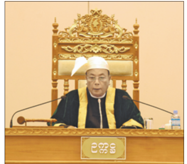
Amyotha Hluttaw Speaker U Khin Aung Myint attends eighth day session of the First Amyotha Hluttaw Fifth Regular Session.

Deputy Education Minister U Ba Shwe answered that students