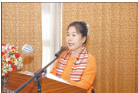
Union Minister Dr Daw Myat Myat Ohn Khin makes a speech at the ceremony. MNA

NAY PYI TAW, 5 Nov — “According to the 2008-09 statistics, females comprise more than half of the total population of 58.38 million of Myanmar. As women make up of 63.99 per cent in health sector, 76.64 per cent in education sector and 50.99 per cent in administrative sector, women play a vital role in shaping the nation into a modern and developed one. It is required to implement the plans laid down in Beijing Conference in accordance with the State’s policies, Union Minister