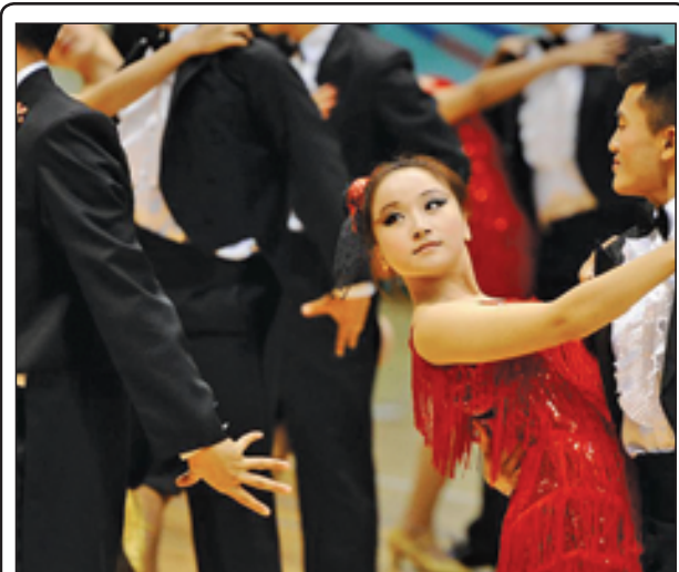
Contestants attend the final of the 2012 National Line Dance Competition in Chengdu, capital of southwest China's Sichuan Province, on 3 Nov, 2012. Line dance is a choreographed dance with a repeated sequence of steps in which a group of people dance in one or more lines or rows.