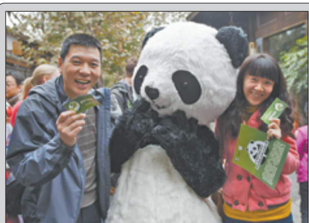
Visitors pose for photo with a panda doll during a charity sales for the study of releasing pandas to the wild in Chengdu, capital of southwest China's Sichuan Province, on 4 Nov, 2012. Pambassadors from America, Italy, Britain and other countries and regions attended the activity on Sunday.—XINHUA

More than 150 people battled waist-deep snow to search for tourists after learning from a Chinese tourist who came down the mountain to seek police help. Xinhua