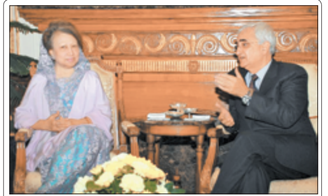
Indian Foreign Minister Salman Khurshid (R) holds talks with Khaleda Zia, chairwoman of the Bangladesh Nationalist Party, at Hyderabad House in New Delhi, India, on 30 Oct, 2012.