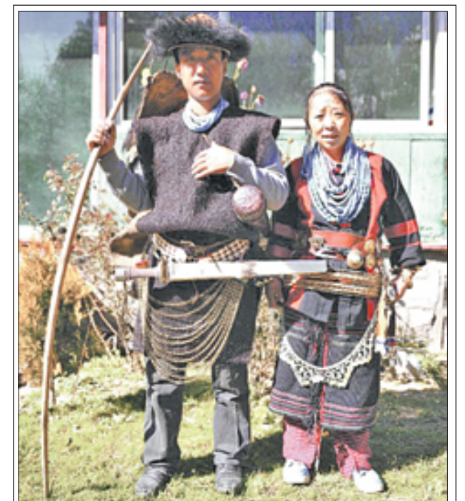
Residents of Lhoba ethnic group present their traditional costumes in Nyingchi, southwest China's Tibet Autonomous Region on 30 Oct, 2012. The Lhoba costume has been listed as China's intangible cultural heritage.—XINHUA