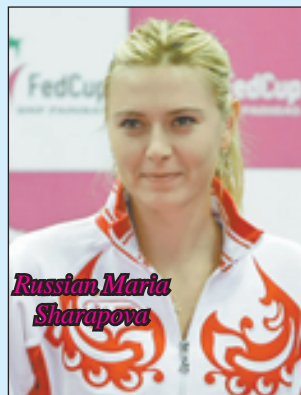
Russian Maria Sharapova

group, hosts favorite Pironkova beat Zheng Jie of China 2-6, 6-4, 7-6 (4). In the three matches on Wednesday, Russians Nadia Petrova and Maria Kirilenko will face Zheng and Pironkova respectively in the "Sredets" group, while Wozniacki will meet Vinci in the "Serdika" group.