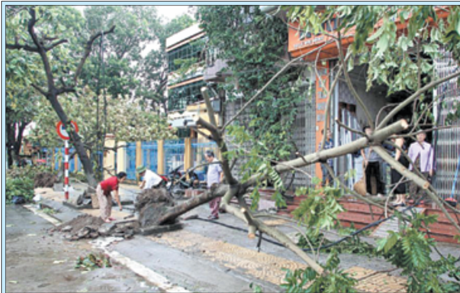
People clean up the mass after Typhoon Son-Tinh hit in north Vietnam's Ninh Binh Province, on 29 Oct, 2012. At least three were killed and two others missing after Typhoon Son-Tinh slashed Vietnam on Sunday, Vietnamese state-owned news agency VNA reported.

Earlier reports said that during the previous minister's administration, the ministry had allocated some 1 trillion rupiah (about 104 million US dollars) to finance those projects. According to the ministry's 2011 data, 442 penitentiaries across the country were inhabited by 135,000 inmates, or higher than their capacities of 99,000 inmates. Xinhua