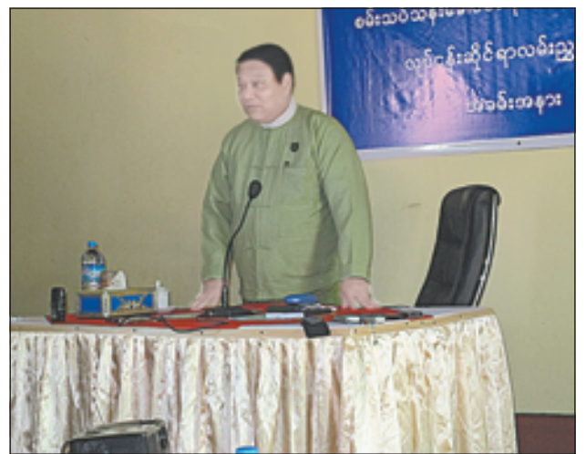
Union Minister for Immigration and Population U Khin Yi speaking at the briefing ceremony.—MNA

NAY PYI TAW, 31 Oct— “Under the leadership of Ministry of Immigration and Population, test-run country-wise census will be taken from 30 March to 10 April next year,” said Union Minister for Immigration and Population U Khin Yi, at a briefing ceremony of test-run country-wise census taking, at Immigration and National Registration Department in Shwepyitha Township, Yangon North District, Yangon on 27 October. The Union Minister and officials replied to the queries raised by media.—MNA