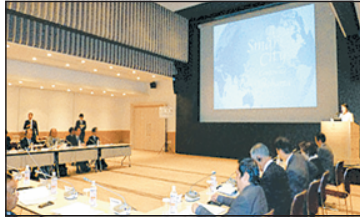
Delegates from some 10 major Japanese and other Asian cities meet in Yokohama on 31 Oct, 2012, to discuss energy-efficient "smart cities" utilizing advanced environmental and information technology, in the first gathering of its kind.

YOKOHAMA, 31 Oct — Delegates from some 10 major Japanese and other Asian cities met on Wednesday in Yokohama to discuss energy-efficient "smart cities" utilizing advanced environmental and information technology, in the first gathering of its kind.