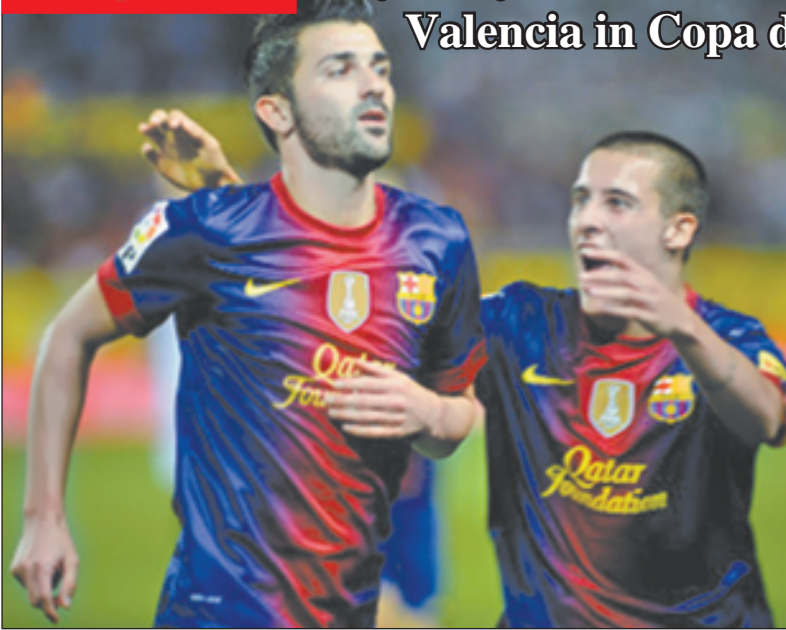
FC Barcelona strolled to a comfortable win away to Deportivo Alaves in the first leg of the third round of the Spanish Copa del Rey on Tuesday night.

MADRID, 31 Oct — FC Barcelona strolled to a comfortable win away to Deportivo Alaves in the first leg of the third round of the Spanish Copa del Rey on Tuesday night. Goals from David Villa and Andres Iniesta took the reigning Copa del Rey champions to victory against the third tier Basque side that is best known for its appearance in the final of the 2001 UEFA Cup.