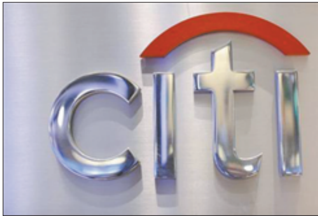
A Citi sign is seen at the Citigroup stall on the floor of the New York Stock Exchange, on 16 Oct, 2012.

Citigroup has a back-up trading floor in New Jersey that it planned to use as of Sunday, two sources at the bank said on Sunday.