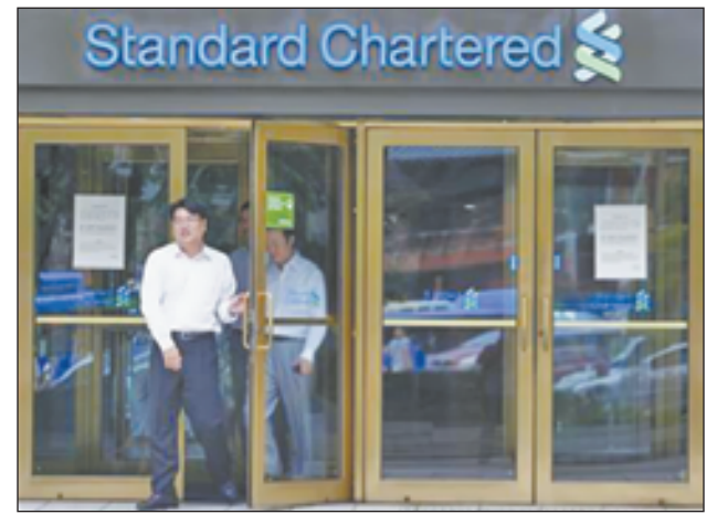
Employees of Standard Chartered leave a branch of the bank in central Seoul on 9 Aug, 2012.

Swiss bank UBS announced on Tuesday it was winding down its fixed income business and axing 10,000 bankers, one of the biggest industry lay-offs since Lehman Brothers imploded in 2008. And Germany’s flagship lender Deutsche Bank (DBKGn.DE), reporting third-quarter