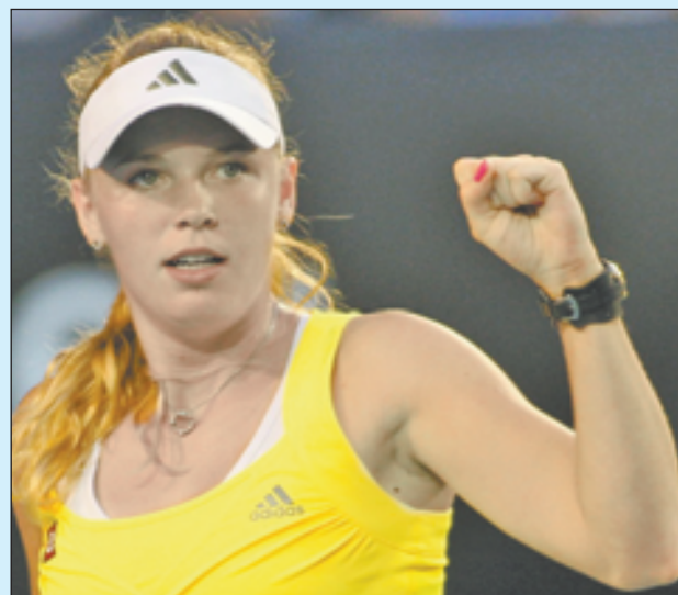
Caroline Wozniacki of Denmark