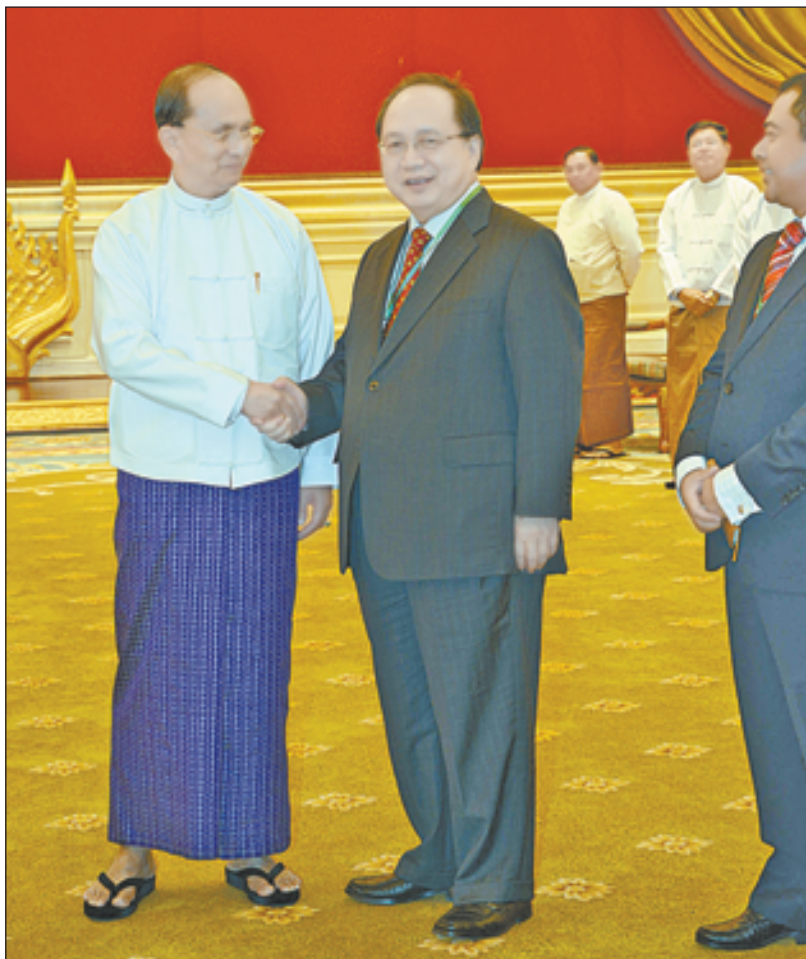
President U Thein Sein cordially meets Plantation Industries and Commodities Minister of Malaysia H.E Tan Sri Bernand Giluk Dompok. MNA

At the call, both sides discussed promoting trade and investment between the two countries and cooperation in production of palm oil, rubber and forest products sector.—MNA