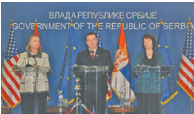
US Secretary of State Hillary Clinton(L), Serbian President Tomislav Nikolic(C) and European Union's High Representative for Foreign Affairs and Security Policy Catherine Ashton(R) attend a joint press conference after their meeting in Belgrade, Serbia, on 30 Oct, 2012.

BELGRADE, 31 Oct—US Secretary of State Hillary Clinton and the European Union's High Representative for Foreign Affairs and Security Policy Catherine Ashton arrived in Belgrade on Tuesday to continue their joint Balkan tour.