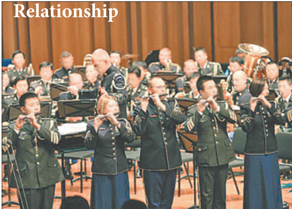
Musicians from China PLA Military Orchestra and the US Army Band "Pershing's Own" perform during a rehearsal at the National Centre for the Performing Arts (NCPA) in Beijing, capital of China, on 29 Oct, 2012. A joint concert of the two orchestras were held at the NCPA on Monday.

in culture and political regimes, tonight the world's two superpowers found harmony through music. Many consider this cultural exchange "good public diplomacy", which helps build trust, improve understanding and communication.