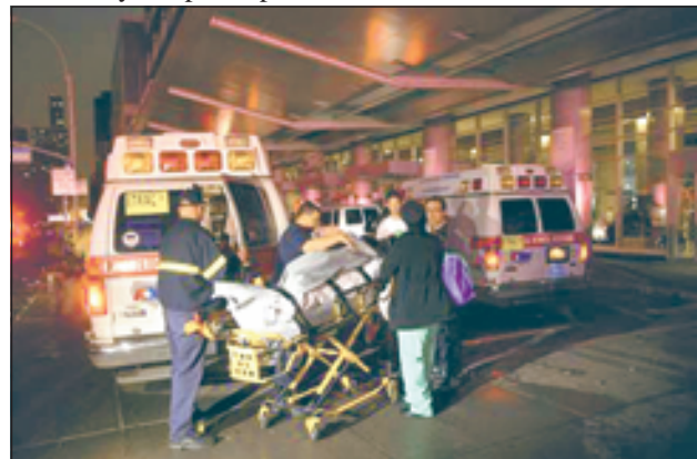
Paramedics evacuate patients from New York University Tisch Hospital due to a power outage as Hurricane Sandy makes its approach in New York on 29 Oct, 2012.