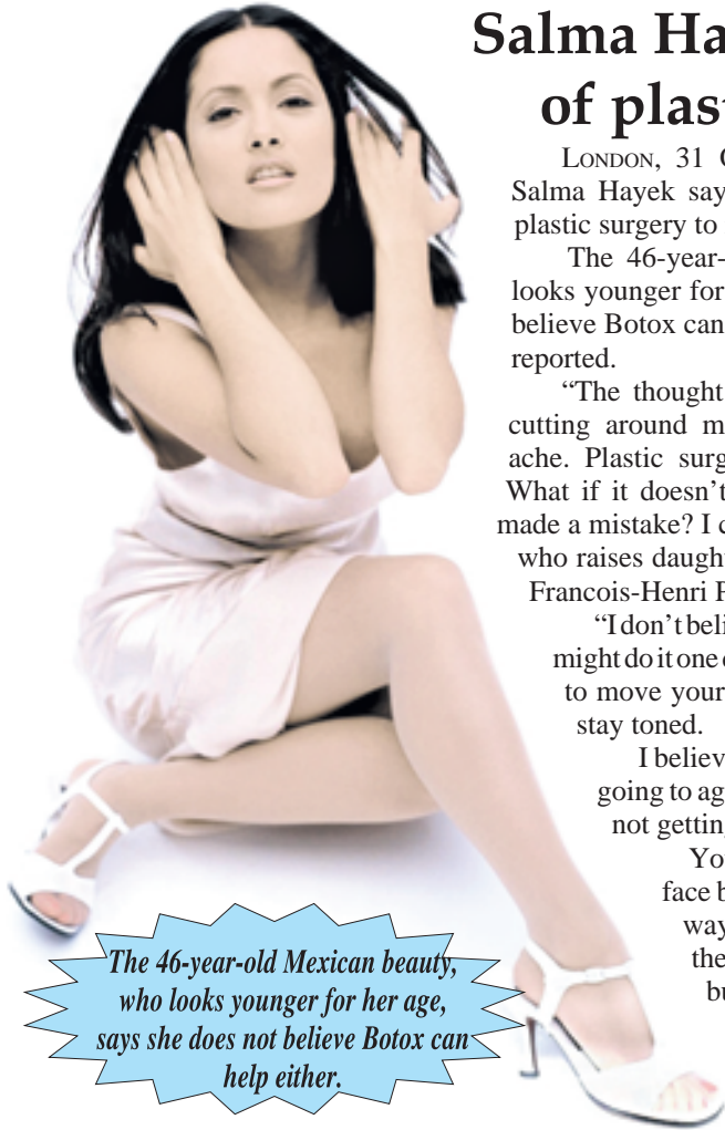
The 46-year-old Mexican beauty, who looks younger for her age, says she does not believe Botox can help either.