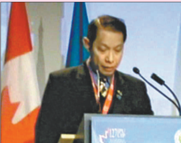
Deputy Speaker of Pyithu Hluttaw U Nanda Kyaw Swa speaking at a 127 th IPU Assembly in Quebec, Canada.

NAY PYI TAW, 31 Oct— Deputy Speaker of Pyithu Hluttaw U Nanda Kyaw Swa attended a 127 th International Parliamentary Union (IPU) Assembly in Quebec, Canada.