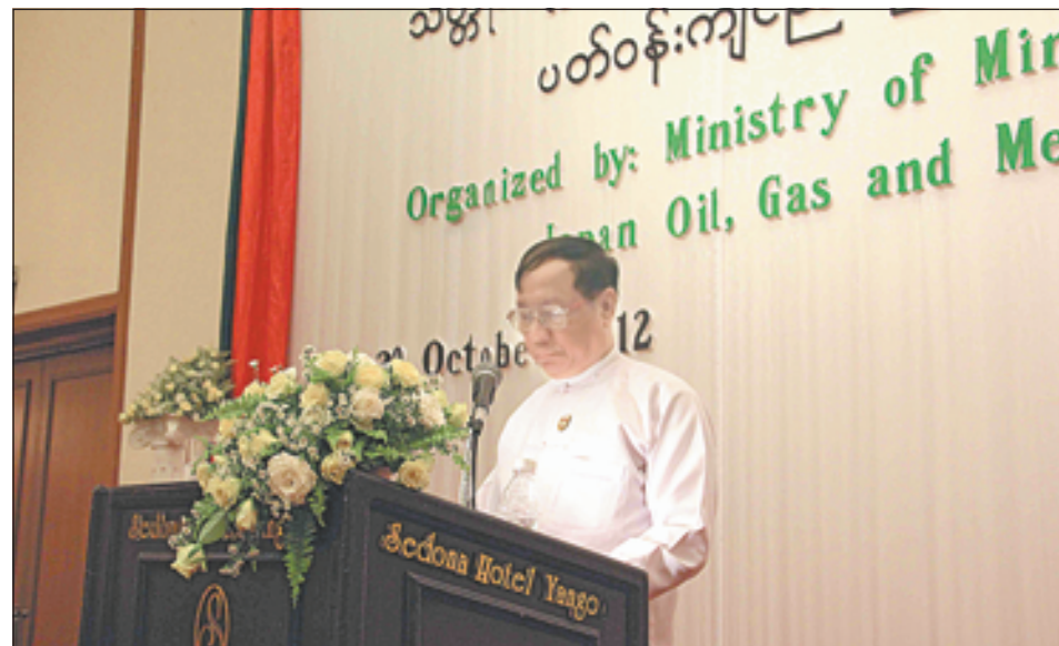
Union Minister for Mines Dr Myint Aung delivers an address at Sustainable Development and Mines Pollution Control Seminar.—MNA

The Union Minister as he addressed the Seminar on Sustainable Development and Mines Pollution Control, the first seminar on mining-related environmental conservation jointly organized by Mines Ministry and Japan Oil, Gas and Metals National Corporation (JOGMEC) with a view to sharing knowledge about environmental conservation and carbon offsetting measures for mining industry, at Sedona Hotel in Yangon on 29 October morning,