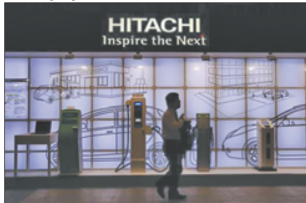
A man walks past Hitachi’s booth at CEATEC JAPAN 2012 electronics show in Chiba, east of Tokyo, on 2 Oct, 2012. REUTERS

weekend it was near the deal for the nuclear project. REUTERS