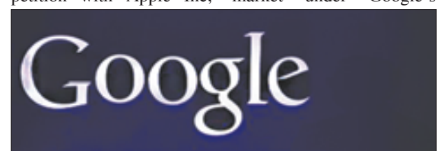
The Google logo is seen as Google Executive Chairman Eric Schmidt speaks at a promotional event for the Nexus 7 tablet in Seoul on 27 Sept, 2012.

SAN FRANCISCO, 31 Oct — Google Inc unveiled a larger version of its Nexus-branded tablet computer on Monday, and updated its mobile gadget and online content offerings as competition with Apple Inc,