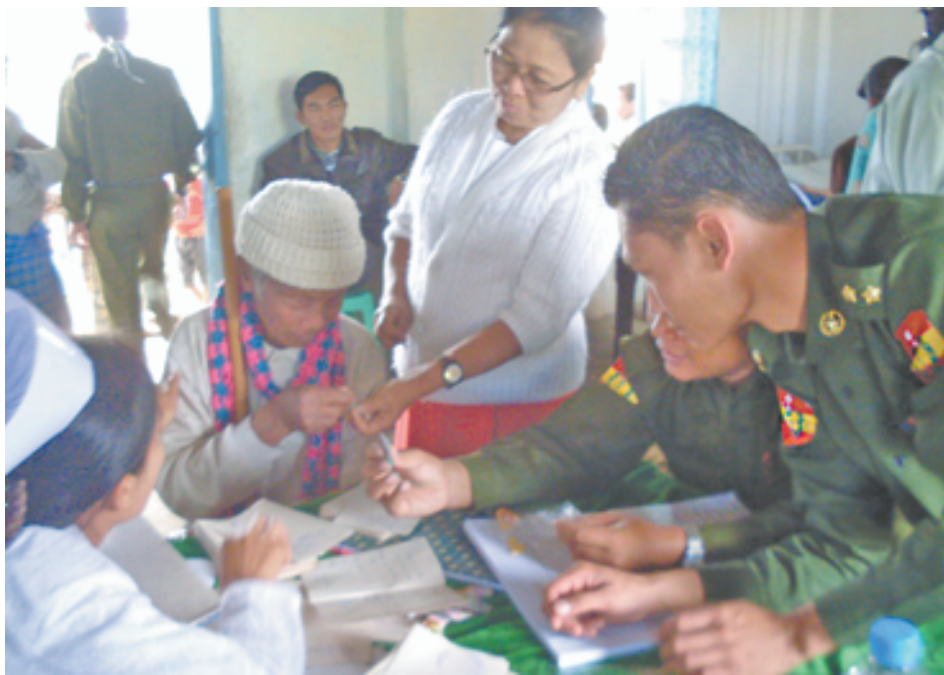
Specialists from mobile military medical teams providing health care services to local people.

They also provided 17 locals from villages in Reed sub-township, 173 from villages in Thantlang sub-township, 269 villages in Matupi Township and 113 from villages in Mindat Township, 207 from villages