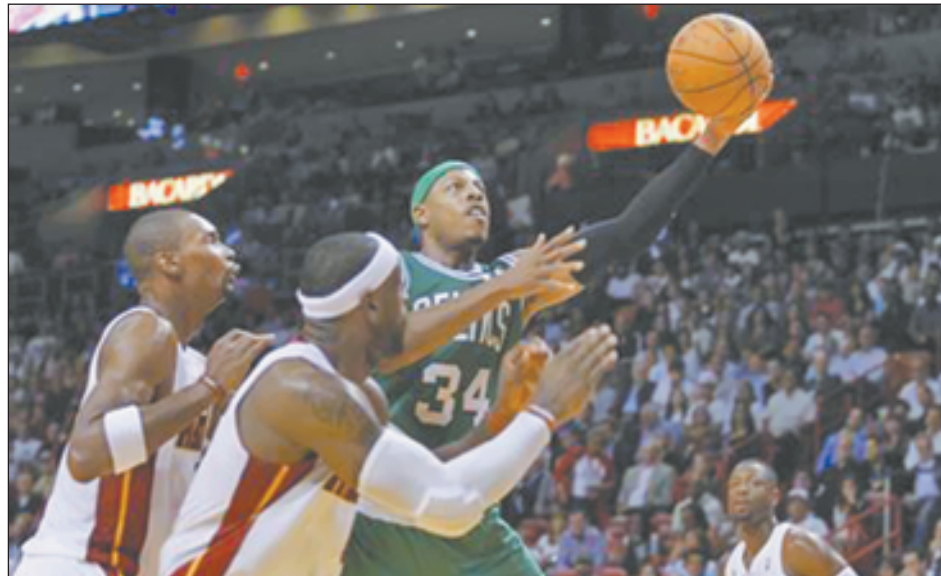
Boston Celtics forward Paul Pierce (C) drives to the basket as Miami Heat defenders (L-R) Chris Bosh, LeBron James and Dwyane Wade pursue in the second half during their NBA basketball game in Miami, Florida, on 30 Oct, 2012.

Game one is not the time to pull what we did in the finals," he added. James' points tally continued his run of scoring at least 20 points in each of his last 28 regular season games against Boston. Wade, looking fresh after the knee surgery in the off-season which cost him a place in the gold medal US Olympic team, top scored with 29 points, while Bosh delivered down the stretch and finished with 19 points. Miami were 19 points up early in the fourth but, in the absence of James, Boston launched a comeback and reduced the deficit to four with just over two minutes remaining on the clock.—Reuters