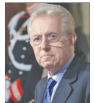
Italy Prime Minister Mario Monti