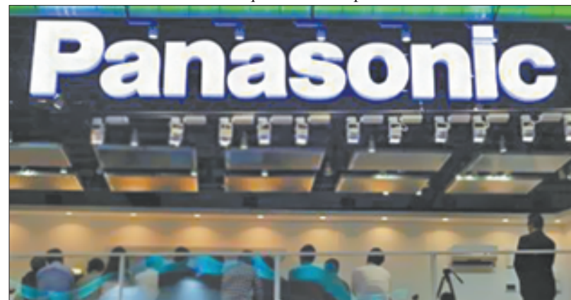
People visit Panasonic Corp's booth at CEATEC JAPAN 2012 electronics show in Chiba, east of Tokyo, on 2 Oct, 2012.