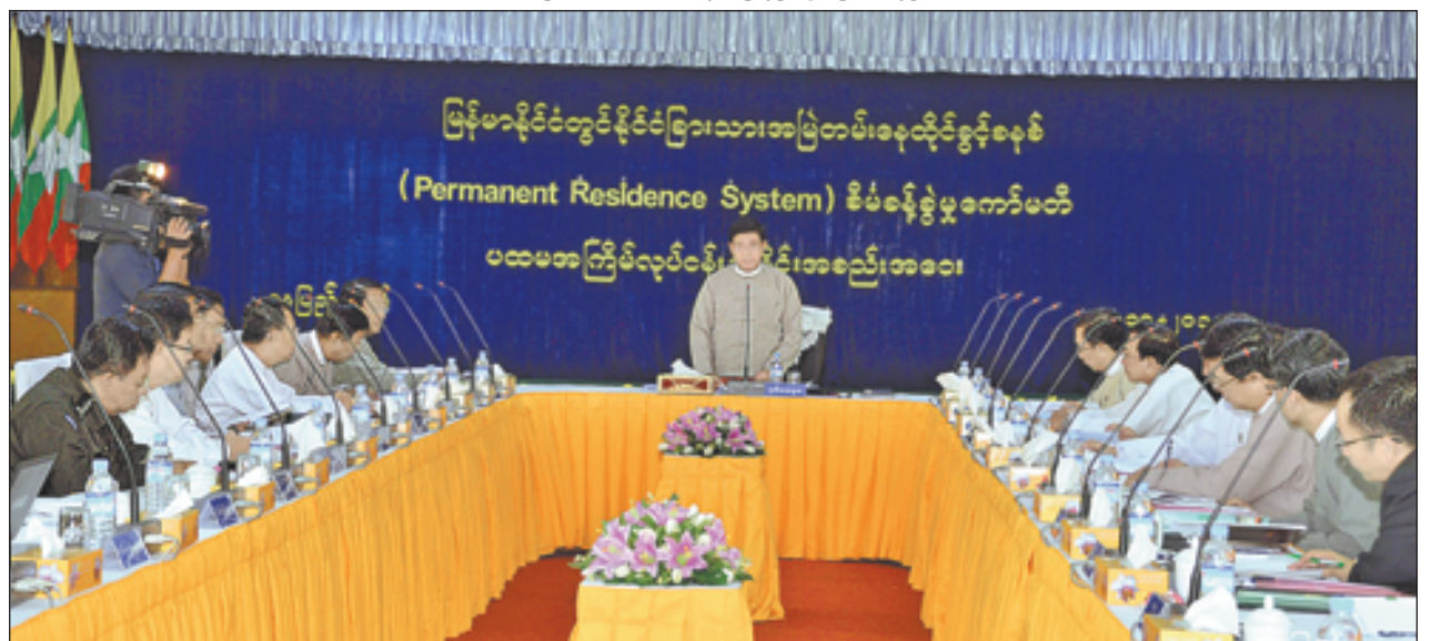
Vice-President U Nyan Tun addresses the first work coordination meeting of Permanent Residence System.

NAY PYI TAW, 31 Oct— The existing regulations do not allow dual citizenship, posing difficulties to foreign businessmen, intellectuals and technicians and immigrant Myanmar willing to make investment in Myanmar because of its economic potential and permanent residence system is supposed to be an advisable solution, said Vice-President U Nyan Tun.