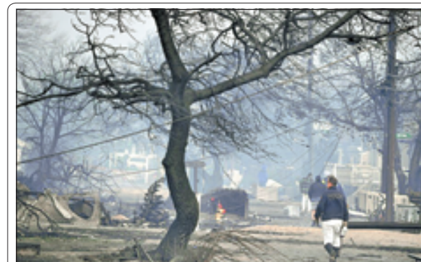
A firefighter walks at Breezy Point in the New York City borough of Queens, on 30 Oct, 2012. A fire broke out in the flooded community late Monday night, destroying 80 to 100 houses.