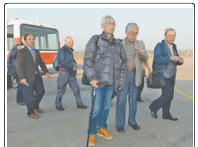
A group of Japanese nationals arrive at Pyongyang's international airport on 30 Oct, 2012, to return to Japan via Beijing after visiting sites believed to contain the remains of their relatives who died around the end of World War II in what is now North Korea.