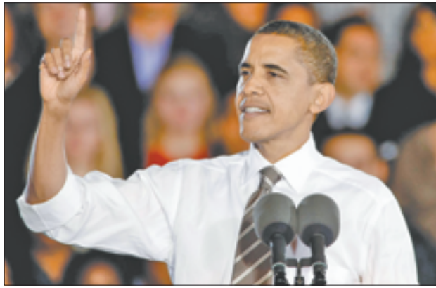
US President Barack Obama

Obama also holds an advantage among the 22 percent who said they have already cast their ballots. Some 55 percent of this