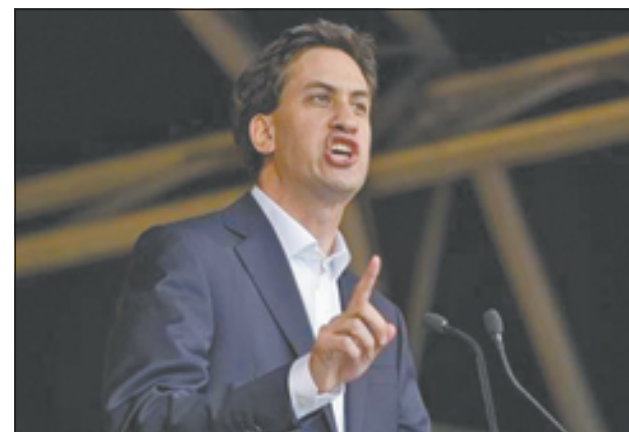
Britain's opposition Labour Party leader Ed Miliband, speaks to demonstrators in Hyde Park at the end of a protest march organised by the Trades Union Congress (TUC), in central London 20 Oct, 2012.

Many Britons regard the EU as an ineffectual and spendthrift source of bureaucracy and Britain's ties with the 27-member bloc are likely to be a key theme in a national election set for 2015. "Labour will argue against the proposed increase in EU spending and instead support a real-terms cut in the budget," Labour finance spokesman Ed Balls and foreign affairs spokesman Douglas Alexander said in a joint opinion piece in