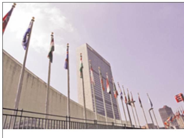
Flags fly in front of the United Nations Headquarters in New York.

"The amount of water intrusion into the tunnels is unprecedented — as was the storm itself — so a date for restoration of Amtrak service directly to/from New York Penn Station from either the north or south is not available at this time," Amtrak said in a statement.— Reuters