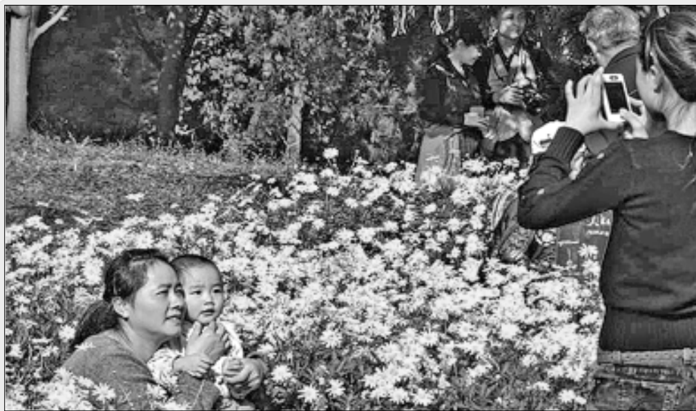
Tourists pose for photos at Xiangshan, or the Fragrant Hills, in Beijing, capital of China, 23 Oct, 2012. Citizens in Beijing visit Xiangshan to greet the Double Ninth Festival, or Chongyang Festival, which is a traditional Chinese holiday, with the tradition of climbing hills, viewing chrysanthemums and paying respect to the seniors.

ULAN BATOR, 24 Oct—Chinese and Mongolian delegates inked a deal on Tuesday to further promote bilateral collaboration in the agricultural sector. Under the agreement, signed after a meeting of the China-Mongolia Working Group on Agriculture Cooperation, the two neighbours will push forward their South-South cooperation under the framework of the Food and Agriculture Organization (FAO). China will continue to provide technical assistance to help enhance Mongolia's agricultural production and will help Mongolia provide training and set up its organic product standards and certification systems. Meanwhile, the two sides also agreed to boost cooperation in food safety and agricultural commodity trade negotiations. China and Mongolia have seen rapid development in agricultural cooperation in recent years. China has provided Mongolia with soft loans for the purchase of farm machinery, and has had experts and technicians working in Mongolia since 2010 to help promote Mongolia's national food security programme. Xinhua