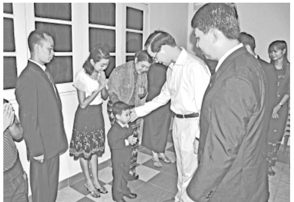
Vice-President Dr Sai Mauk Kham greets embassy staff.

departure via border regions, issuance of arrival visas and improving stability of the State recently have led to a surge in number of tourists, resulting in significant development of hospitality industry, noted the Vice-President who said potential prosperity would also be used in furnishing of Myanmar embassies in global countries.