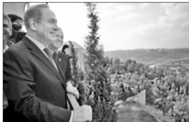
Israeli Prime Minister Benjamin Netanyahu looks at the area, where Israel plans to build some 800 new housing units, during his visit to the east Jerusalem Jewish settlement of Gilo on 23 Oct 2012.

The Qatari leader was given a hero's welcome and greeted by a guard of honour ceremony as he entered Gaza. Qatar has become one of Hamas' main benefactors since it fell out with Syria and relations cooled with Iran.