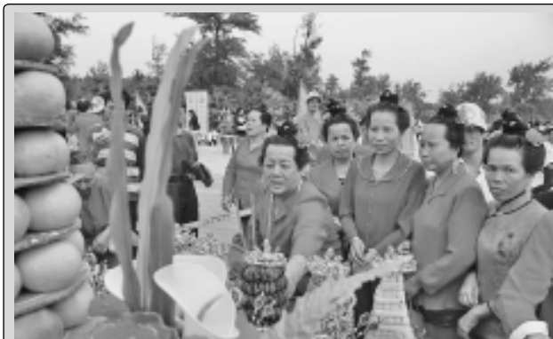
People attend a memorial ceremony for Mazu, the goddess of the sea, during a tourism festival in the Meizhou Island in Putian City, southeast China's Fujian Province, on 23 Oct, 2012. The tourism festival themed on Mazu culture, which kicked off here on Tuesday, attracted tens of thousands of worshippers from the Chinese mainland and Taipei.