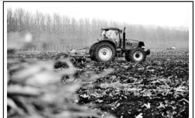
A tractor plows on the field at a farm in Mingshui county of northeast China's Heilongjiang province, 23 Oct, 2012. Local agricultural authorities recently implemented methods on the autumn ploughing to ensure the harvest of the next year.

At a press conference held on Sunday in Damascus after his meeting with Syrian President Bashar al-Assad, Brahimi appealed to all conflicting parties that they observe the cease-fire in a bid to build a permanent pacification.— Xinhua