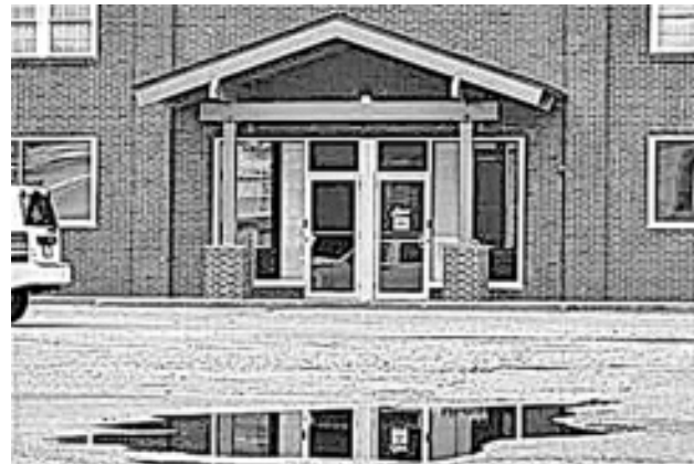
Pharmaceutical compounding company New England Compounding Centre (NECC), a producer of the steroid methylprednisolone acetate, is seen in Framingham, Massachusetts on 8 Oct 2012.

After three months on the bean diet, study participants’ estimated 10-