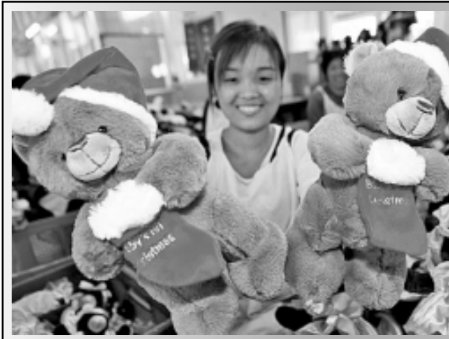
A worker shows stuffed toys to be sold to Beijing market at a toy company in Tashan Township of Ganyu County, east China's Jiangsu Province, on 22 Oct, 2012. Toy companies in the county now have received increasing orders of toy products with the approaching of the Christmas shopping rush.