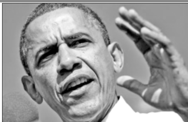
US President Barack Obama speaks during a campaign rally in Delray, Florida on 23 Oct 2012.

The charge ties together several critiques of Romney, from shifting policy stances that Obama mockingly attributes to "Romnesia" to a persistent charge that the wealthy former private-equity executive is more concerned with helping fellow millionaires than the struggling middle class. Obama leads Romney among likely voters by a statistically insignificant margin of 1 percentage point, according to Reuters/Ipsos daily