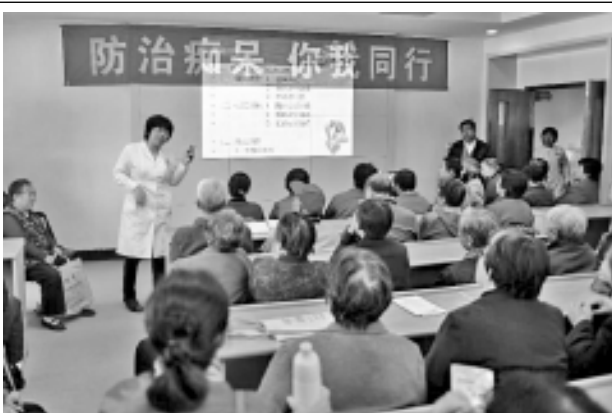
During a free clinic activity at the Tangu Community Health Centre in Shijiazhuang, capital of north China's Hebei Province, on 23 Oct, 2012. Free clinics from some 210 medical institutions in the city were provided to aged citizens on Tuesday, as a way to greet the Double Ninth Festival, or Chongyang Festival, which is a traditional Chinese holiday to pay respect to the seniors.