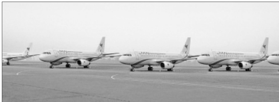
A-320 airbuses of Myanmar Airways International seen at airport.

In addition to Mandalay-Gaya-Mandalay flight, the MAI plan to fly the Mandalay-Bangkok-Mandalay, Yangon-Bangkok-Yangon, Yangon-Singapore-Yangon, Bangkok-Yangon and the new flights to Korea, Japan and China (Taipei).