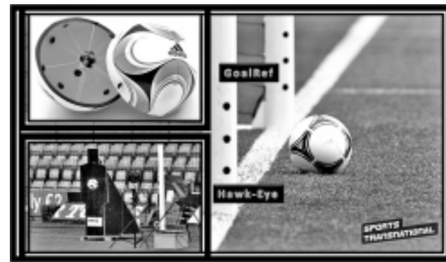
Goal-line technology providers GoalRef and Hawk-Eye

Football's rule-making body, the International Football Association Board (IFAB), approved the use of the