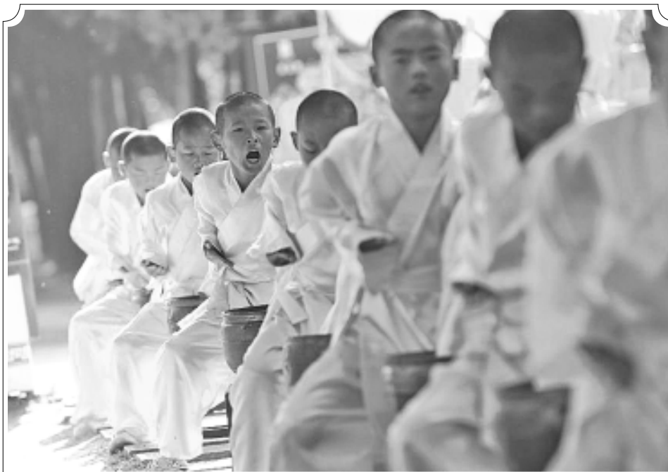
Young students of kungfu school perform during a welcoming ceremony of the 9th Zhengzhou International Shaolin Wushu Festival in Dengfeng City, central China's Henan Province on 22 Oct, 2012. A series of performance as well as Wushu contest and seminar will be held during the festival from 21 to 25 Oct.

Director General, Department of Civil Aviation, Myanmar Telephone : 951 533015 Fax: 951 533016 Email : dgdca@dca.gov.mm