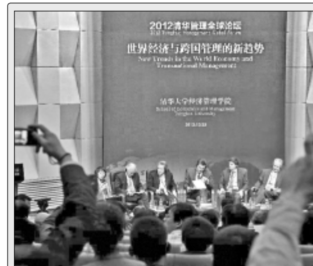
Guests attend the discussion session of the "New Growth Engines for the World Economy" during the 2012 Tsinghua Management Global Forum at Tsinghua University in Beijing, capital of China, on 23 Oct 2012. About 600 business leaders, scholars and officials took part in the annual forum themed on "New Trends in the World Economy and Transnational Management".