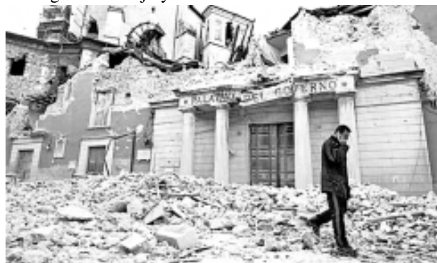
An Italian military carabinieri walks on debris past destroyed buildings after an earthquake, in downtown Aquila, in this on 6 April, 2009 file photo.