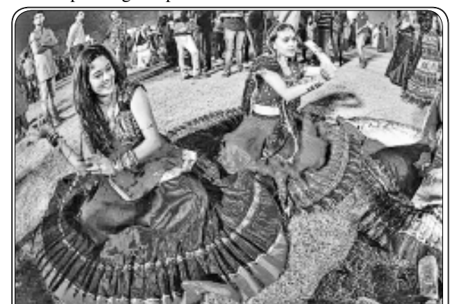
People dance to celebrate the Navratri festival in Ahmedabad, capital of the west Indian state of Gujarat, 23 Oct, 2012. Navratri, which literally means nine nights, is a festival of worship, dance and music celebrated during a period of nine nights almost throughout India.

TOKYO, 24 Oct—Japan's nuclear regulatory authorities on Wednesday released for the first time projections for the spread of radiation from nationwide reactors in the event of a severe accident like the one at the Fukushima Daiichi complex last year. The amount of radiation released a week after an accident at Tokyo Electric Power Co.'s Kashiwazaki-Kariwa plant in Niigata Prefecture could reach the level where evacuation is recommended for an area as far as 40 kilometers from the plant, the Nuclear Regulation Authority said.