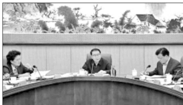
Li Changchun (C), a Standing Committee member of the Political Bureau of the Communist Party of China (CPC) Central Committee, speaks at a meeting on the work of China's publicity, ideological and cultural fields, in Beijing, capital of China, on 23 Oct 2012.

BEIJING, 24 Oct— Senior Chinese leader Li Changchun on Tuesday expressed his appreciation for the achievements made in China's publicity, ideological and cultural fields over the last five years.