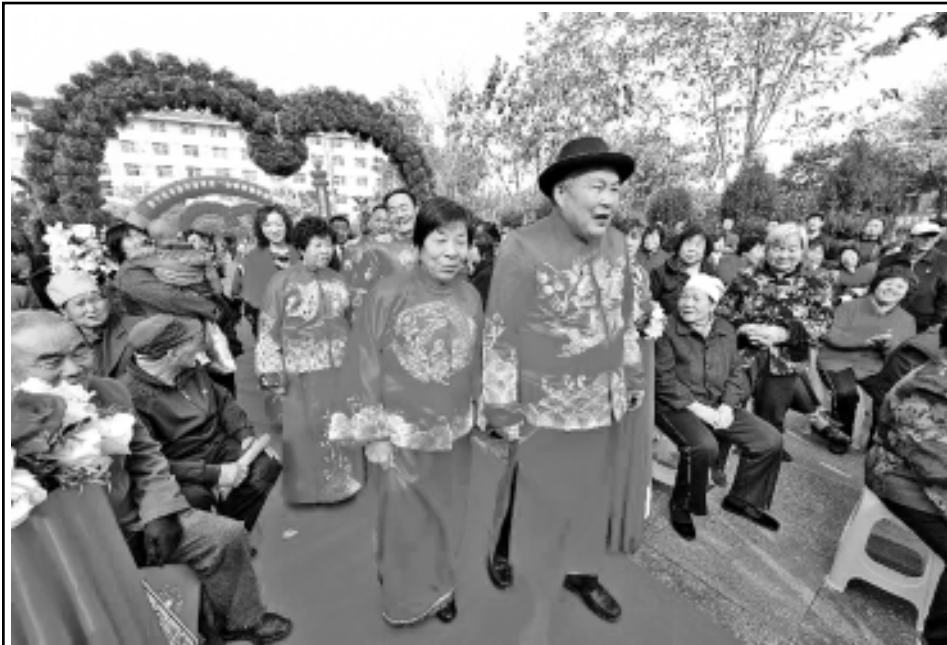
Couples who have been married for 50 years walk on the red carpet during a golden and silver wedding anniversary to greet the Double Ninth Festival in the Helan County of northwest China's Ningxia Hui Autonomous Region, on 23 Oct, 2012. The Double Ninth Festival, or Chongyang Festival, is a traditional Chinese holiday to pay respect to the seniors.