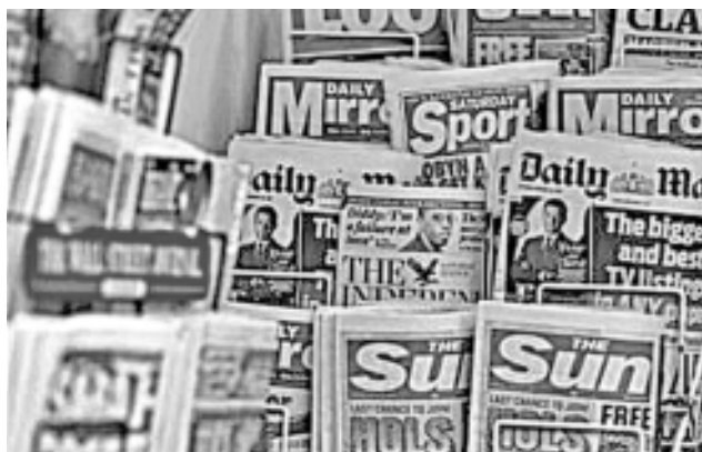
British newspapers are displayed at a newsagent’s stand in central London on 22 Jan 2011.

LONDON, 24 Oct — Shares in publisher Trinity Mirror fell 12 percent in early trading on Tuesday after four people filed legal claims accusing the group’s newspapers of hacking into their phones to generate