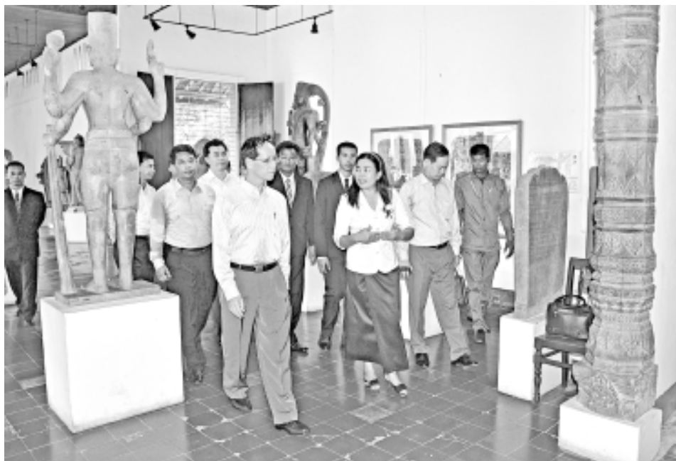
Vice-President of the Republic of the Union of Myanmar Dr Sai Mauk Kham visits National Museum in Cambodia.

The Vice-President and party then visited National Museum to view antiques from Angkor Wat, works of arts of ancient times excavated from