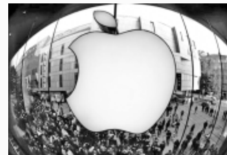
Customers gather outside an Apple store before the release of iPhone 5 in Munich early on 21 Sept 2012.

A smaller tablet would mark the first device to be added to Apple's compact portfolio under Chief Executive Tim Cook, who took