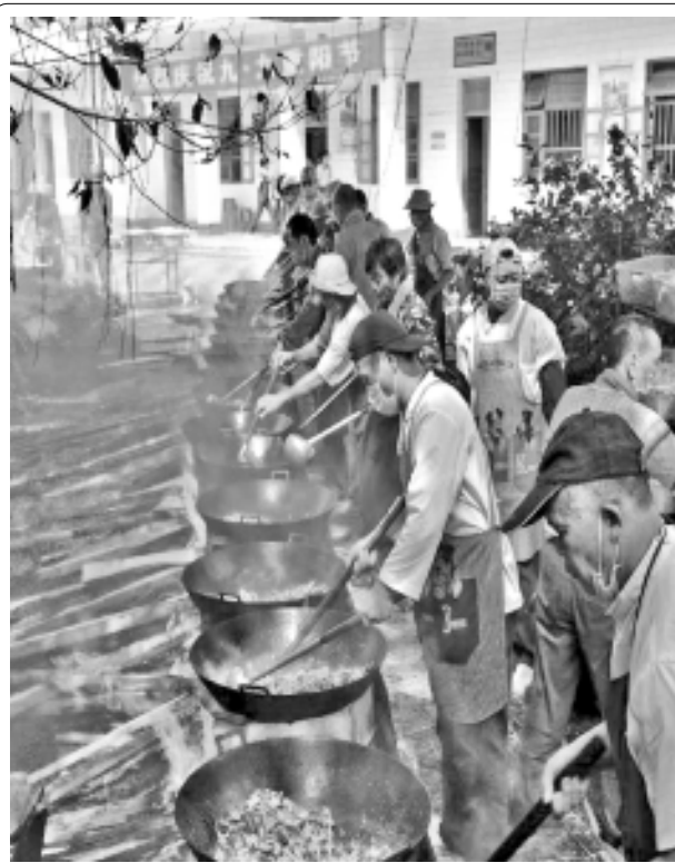
Chefs prepare meals in Jiaotang Village, Wenchang City, south China's Hainan Province, on 23 Oct, 2012. A dinner was held here for local seniors to greet the Double Ninth Festival, or Chongyang Festival, which is a traditional Chinese holiday, with the tradition of climbing hills, viewing chrysanthemums and paying respect to the seniors.