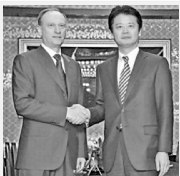
Russian Security Council Secretary Nikolai Patrushev (L), who is an aide to President Vladimir Putin, and Japanese Foreign Minister Koichiro Gamba shake hands before their meeting in Tokyo on 23 Oct, 2012.