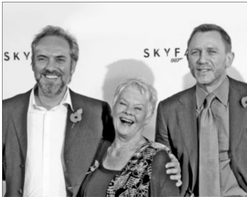
Sam Mendes with Judi Dench and Daniel Craig.

I kept it small. I worked hard to keep it on a human scale, for the actors," he said.—PTI