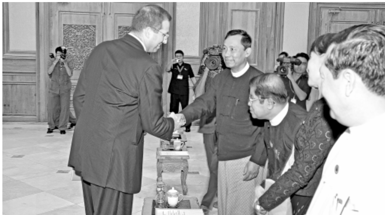
The ceremony to donate publications to parliamentary library in progress at Press Room of Zabuthiri Hall in Hluttaw Complex.—MNA

NAY PYI TAW, 24 Oct—The United States of America contributed publications to parliamentary library in a ceremony at Press Room of Zabuthiri Hall in Hluttaw Complex here this evening.