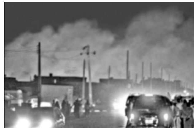
Onlookers gather to look at a huge fire that engulfed the Yarmouk ammunition factory in Khartoum on 24 Oct, 2012.