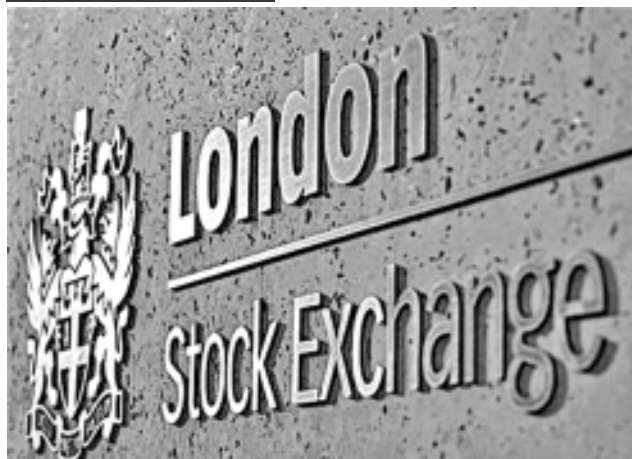
The London Stock Exchange is seen during their morning rush hour in the City of London on 11 April 2011.

LONDON, 24 Oct — Blue chips edged higher at the open as strong results from ARM Holdings helped alleviate some concerns about the incipient earnings season. Shares in ARM rose 1.4 percent as the chip designer posted a 22 percent