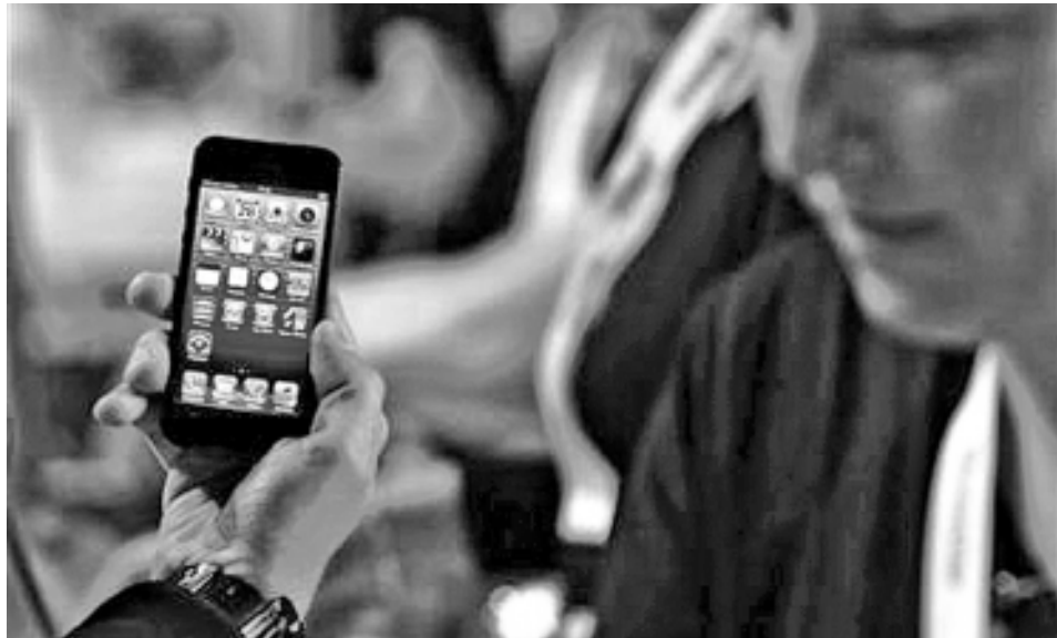
A customer holds up an Apple iPhone 5 to pose for a photo during an exclusive sale by Belgian operator Mobistar in Brussels on 28 Sept 2012.—REUTERS

The announcement came as Apple Inc (AAPL O) prepares to launch a smaller, cheaper tablet of its own on Tuesday. The device, dubbed the iPad Mini, may challenge Amazon's success at the lower end of the booming tablet market. Meanwhile, Amazon has launched larger, more expensive Kindle Fire HD tablets, aimed at Apple's full-sized iPad, which still dominates the sector.—Reuters