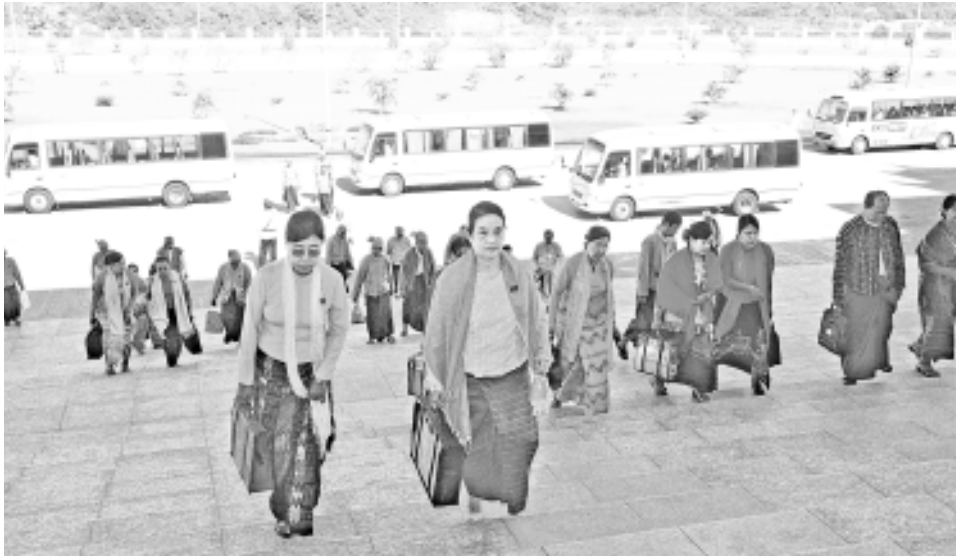
Pyithu Hluttaw representatives arrive at Pyithu Hluttaw Hall to attend Hluttaw session.

NAY PYI TAW, 24 Oct—Fifth day session of Pyithu Hluttaw took place at Pyithu Hluttaw Hall of Hluttaw Complex, here, at 10.10 am today, attended by Pyithu Hluttaw Speaker Thura U Shwe Mann and 382 MPs.