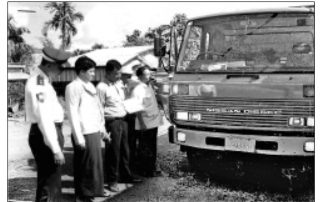
Vehicle inspection team members check a up-hill vehicle.

NAY PYI TAW, 24 Oct—Mon State Vehicle Inspection Team constituted by Mon State Government discharges inspection duty to safety of pilgrims and prevention against traffic accident along the route from Kinmun camp to Yathedaung platform dur-ing Kyaikhtiyoe Pagoda Pujaniya period in 2012-2013. The team comprising departmental officials, the secretary of bus-line control committee and the chairman of bus line association inspected engines, gears, steering, breaks and tyres of 143 buses from Kyaikhtiyoe bus line at Kinmun camp on 20 and 21 October. Moreover, the team supervised tests of driving licence, bus conductor licence and distributes traffic rules to the drivers and conductors.—MNA