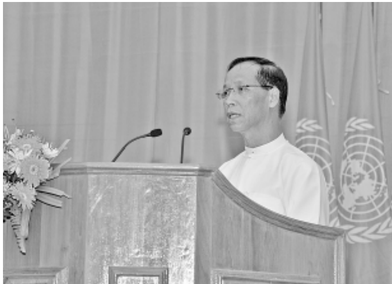
Vice-President Dr Sai Mauk Kham delivering address at the 67 th Anniversary of the United Nations Day.

He continued that Myanmar, as a member of the United Nations, joined other member states in celebrating