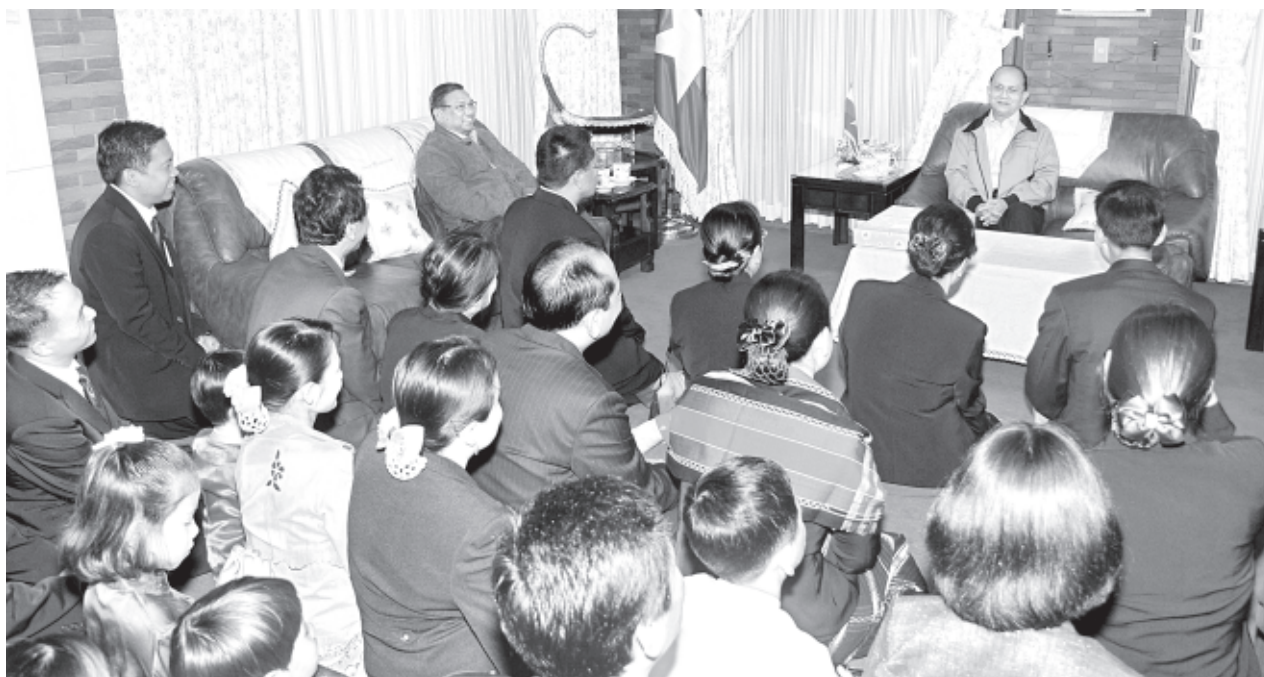
President U Thein Sein meets with staff from Myanmar Embassy and Myanmar students.

The huge foreign investments would flow into the country when the country has peace and stability. And the country would see a lot of factories and workshops from which technology transfer would be got. To become a developed country, people should work together with knowledge and diligence. He continued to say that Myanmar citizens are to keep in touch with the development of those countries in which they reside, at a time when they are in other foreign countries.