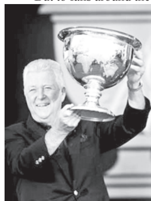
American team captain Ken Venturi.