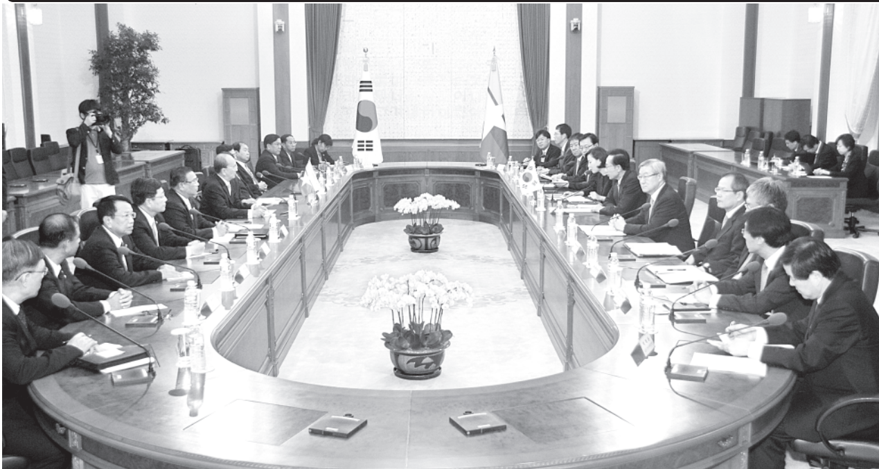
President of the Republic of the Union of Myanmar U Thein Sein and President Mr Lee Myung-bak of the Republic of Korea hold discussion at President's Residence in Seoul. (News on page 1)