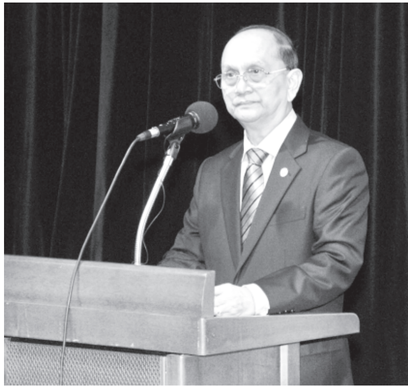
President U Thein Sein delivering an address at Myanmar Investment Forum.