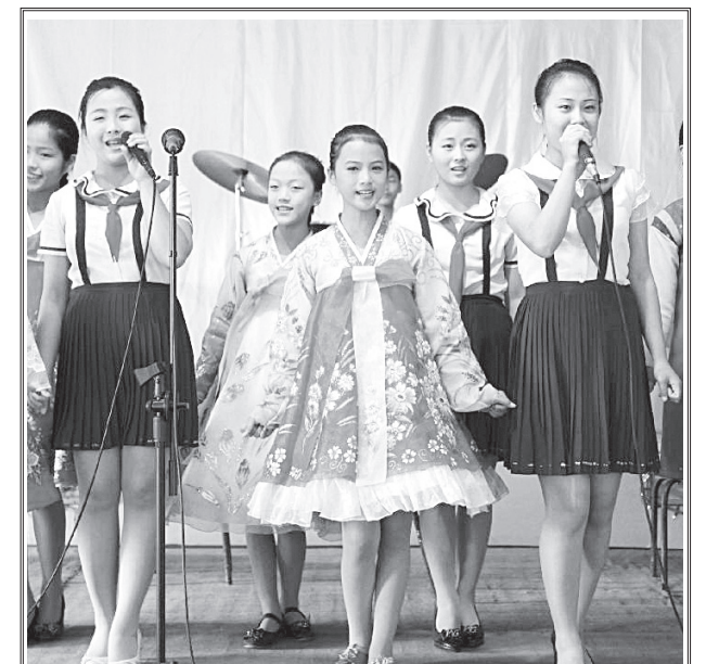
Students perform at a school in Pyongyang, capital of the Democratic People's Republic of Korea (DPRK), on 5 Oct, 2012.

The water is half a meter deep on the roads, said the report, adding that the local graveyard was under the water now. The further north of Sweden was also affected by the heavy rain, yet there is no report on death and injuries for the time being.— Xinhua