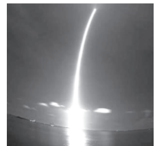
The SpaceX Falcon 9 rocket lifts off from Space Launch Complex 40 at the Cape Canaveral Air Force Station in Cape Canaveral, Florida on 7 Oct, 2012.

The Falcon booster, flying for the fourth time, streaked through balmy,