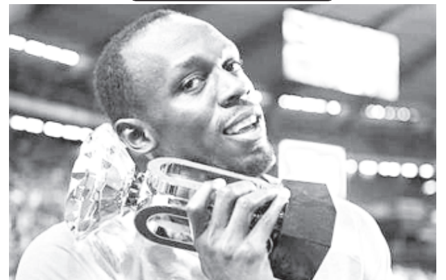
Usain Bolt of Jamaica

"Rio is just to defend my titles to show the world the possibility that I can do it again, the 'three-peat'," added the sprinter, who also retained his 4x100 relay gold medal with a world-record run inside London's Olympic Stadium.