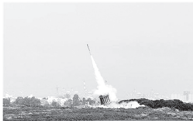
An Iron Dome launcher fires an interceptor rocket near the southern city of Ashdod on 11 March, 2012.

Israeli defence officials have not confirmed this. Hezbollah has sent a drone into Israeli airspace at least once previously.—Reuters