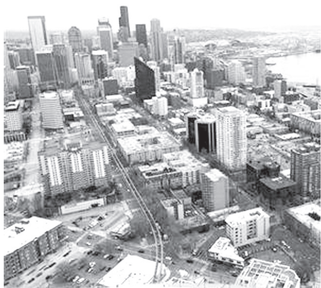
Downtown Seattle and the Elliott Bay waterfront are seen from atop the roof of the 650-foot-tall Space Needle looking South over the skyline on 17 April, 2012.

The United States needs $2 trillion of infrastructure upgrades, according to a 2011 report by the Urban Land Institute and Ernst & Young. Many of these roads, bridges, dams, water and sewer plants serve major metropolitan areas, but the recession left many cities struggling to pay for capital projects and services.