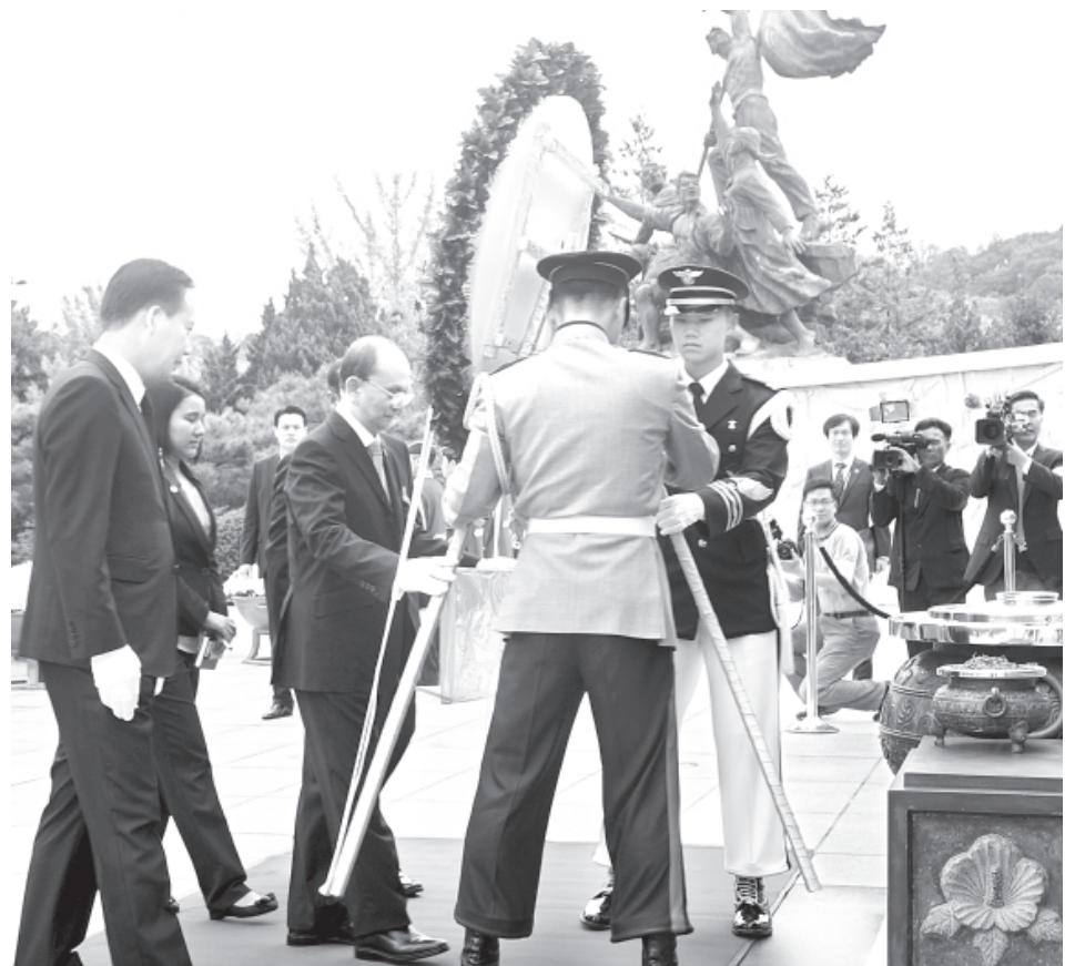
President U Thein Sein lays wreath at National Cemetery in Seoul.

He hoped for the help of KBIZ extended to small and medium enterprises of Myanmar to get ready themselves to tap opportunities and tackle challenges stemmed from foreign investments that