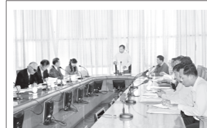
More investment in Myanmar discussed PAGE 2

UK, Japan scientists win Nobel for adult stem cell discovery