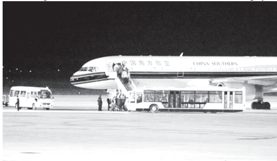
Passengers board on the plane CZ680 at Gansu Zhongchuan Airport in Lanzhou, northwest China's Gansu Province, on 8 Oct, 2012. The passenger plane, which made a forced landing in Lanzhou on Monday afternoon after receiving an anonymous "terrorist threat," took off at about 10:45 pm Monday after a security check.

In the same week, a Shenzhen Airlines domestic flight returned after receiving a bomb threat. Police in central China detained a man who confessed that he fabricated the bomb hoax to stop a creditor aboard the flight from collecting his debt.