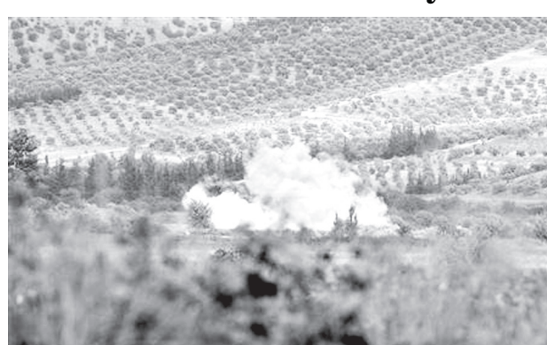
Smoke rises after a mortar bomb fired from Syria landed in Turkish soil on the Turkish-Syrian border in southern Hatay Province on 8 Oct, 2012.

GUVECCI, 9 Oct—Turkish President Abdullah Gul said on Monday the “worst-case scenarios” were now playing out in Syria and Turkey would do everything necessary to protect itself, as its army fired back for a sixth day after a shell from Syria flew over the border.