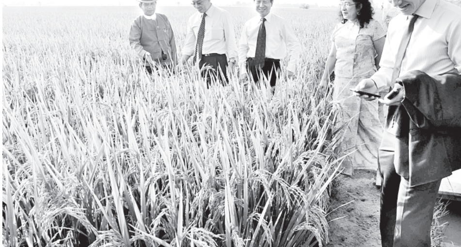
Union Minister for Agriculture and Irrigation U Myint Hlaing and Singaporean delegation observing Palethwe hybrid paddy plantations.—MNA

At the call, both sides had a cordial discussion on technical cooperation in agriculture sector, cooperation in production