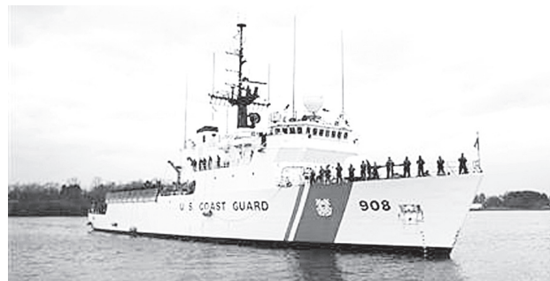
Crewmembers aboard the US Coast Guard Cutter Tahoma stand on the bow as the cutter enters port at the Portsmouth Naval Shipyard in Kittery, Maine in this 26 Feb, 2010 handout photo supplied by the US Coast Guard.