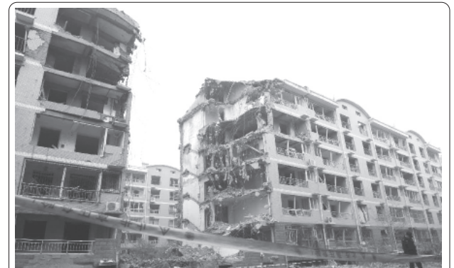
Photo taken on 8 Oct, 2012 shows debris of a blast-hit residential building in Baoding, north China's Hebei Province. The death toll of an explosion that happened at around 3 pm last Saturday has climbed to eight, while 27 injured remain in hospital.