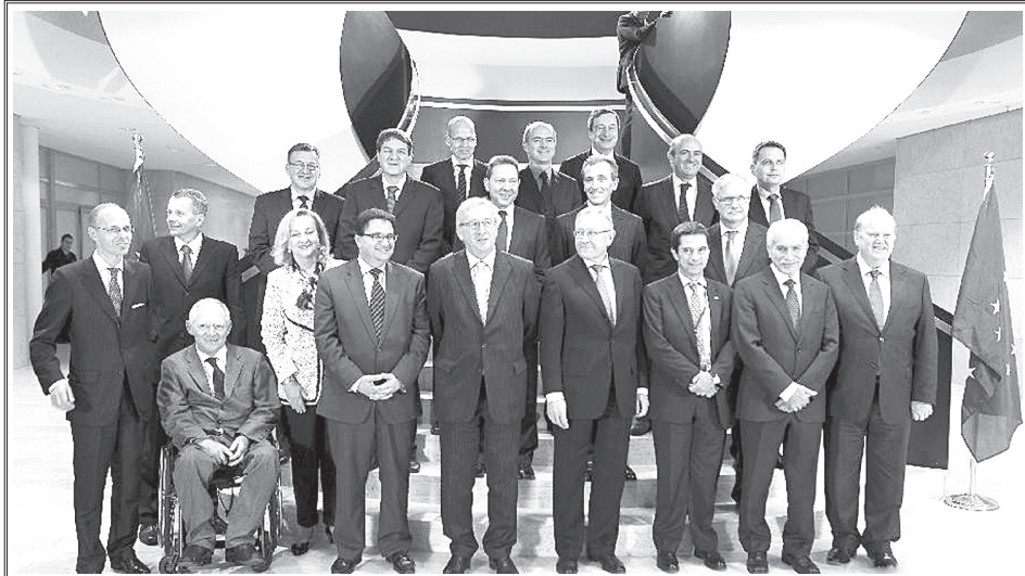
Eurozones ministers pose for a family photo after an European Stability Mechanism meeting, in Luxembourg, on 8 Oct, 2012.