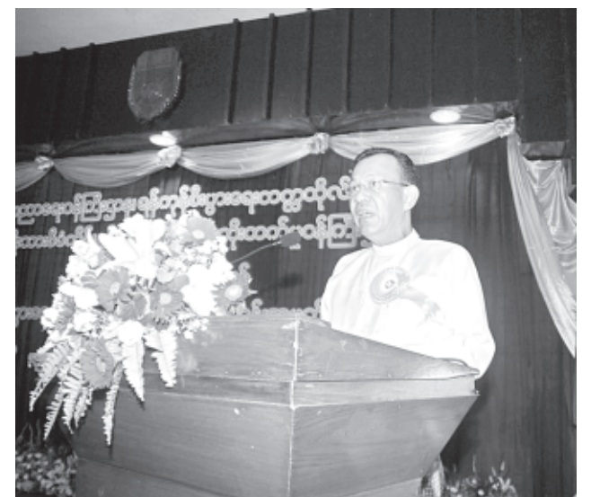
Union Minister for NPED Dr Kan Zaw speaking at opening of Certificate for ASEAN Economic Studies (CAES) course.