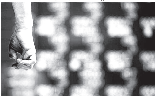
A man clicks his nails as he looks at an electronic board displaying share prices outside a brokerage in Tokyo on 20 Sept, 2012.