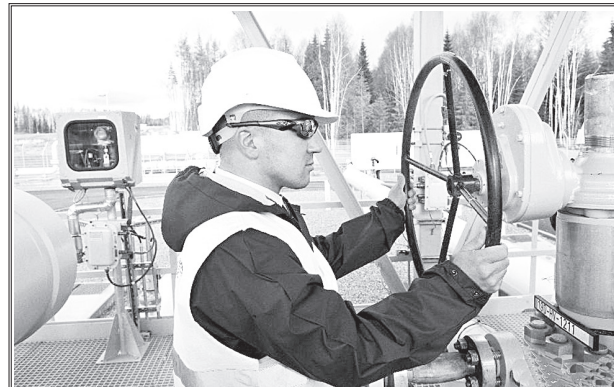
A Nord Stream pipeline operator stands on a platform before the opening ceremony of the North Stream second gas link in Portovaya bay, some 60 kilometres from the town of Vyborg in northwestern Russia, on 8 Oct, 2012. Nord Stream’s 1,224-kilometre Line Two started operating at full capacity on Monday. Line One with an annual capacity of 27.5 billion cubic metres has been working since November 2011.

The shooting “will require what I believe to be a grand jury investigation to determine precisely what happened there,” Kelly told the paper. An NYPD spokesman did not respond to requests for comment on Kelly’s remarks. —Reuters