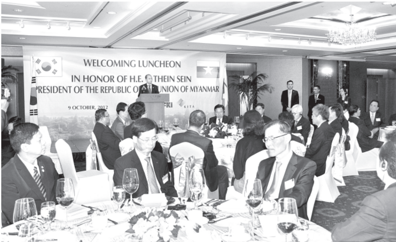
President U Thein Sein making a speech at luncheon hosted by Korean small- and medium-scale enterprises.

NAY PYI TAW, 9 Oct—President U Thein Sein addressed a luncheon hosted by the Korea Federation of Small and Medium Business (KBIZ) at Lotte Hotel of Seoul in South Korea this afternoon.