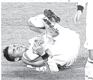
Real Madrid's Cristiano Ronaldo grimaces on the pitch during their Spanish first division soccer match against Barcelona at Nou Camp stadium in Barcelona on 7 Oct, 2012.

club medical staff at his home this morning and a serious injury was ruled out so further tests at a hospital are not necessary," Real said in a statement on their website