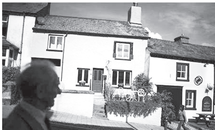
Locals enjoy a mid morning stroll in the sun through Dalton-in-Furness in northwestern England, where relatives of US presidential candidate Mitt Romney were born and bred in the 18th and 19th Century, on 26 Sept, 2012.