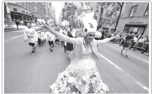
Revellers take part in the 68th annual Columbus Day Parade on the Fifth Avenue in New York, on 8 Oct, 2012.