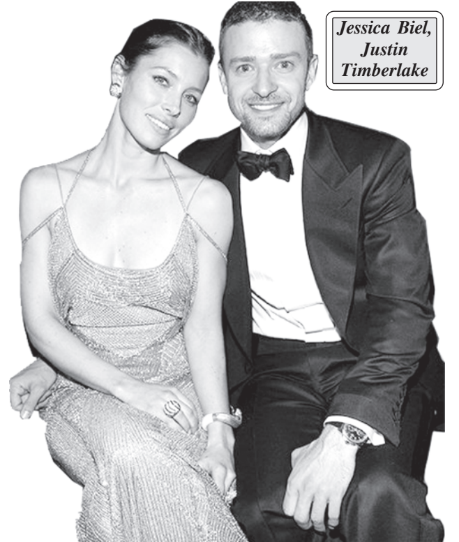
Jessica Biel, Justin Timberlake

When asked what makes Jessica wife material, the 31-year-old star grinned: “She’s a really, really, really special person. Plus, she’s really, really, hot!”—PTI