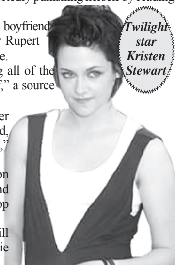
Twilight star Kristen Stewart

The couple met on the sets of Twilight in 2008 and will soon be seen onscreen in Breaking Dawn 2 , the final movie of the franchise. —PTI