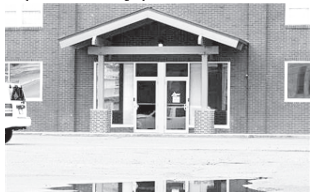
Pharmaceutical compounding company New England Compounding Centre (NECC), a producer of the steroid methylprednisolone acetate, is seen in Framingham, Massachusetts on 8 Oct, 2012.