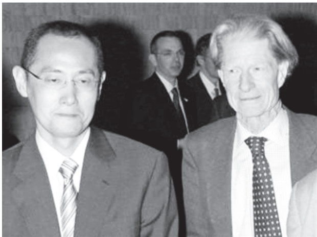
Kyoto University Professor Shinya Yamanaka (L) and John Gurdon of the Gurdon Institute in Cambridge are seen at a symposium on induced pluripotent stem cell in Tokyo, in this photo taken by Kyodo on April 2008.

STOCKHOLM, 9 Oct— Scientists from Britain and Japan shared a Nobel Prize on Monday for the discovery that adult cells can be transformed back into embryo-like stem cells that may one day regrow tissue in damaged brains, hearts or other organs.