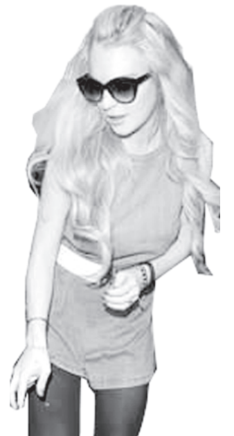
Lindsay Lohan

“She was visibly shaken already at that point [when she discovered the pictures]. She was shocked. At that moment, you feel betrayed when you are in a private space and you realise someone has documented the entire night on the phone.”