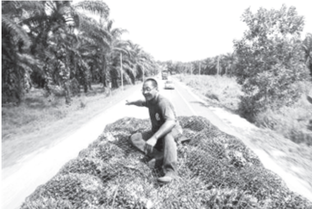
A Federal Land Development Authority (FELDA) farmer sits on oil palm fruits to be delivered to the factory in Hulu Selangor, about 100 km (62 miles) north of Kuala Lumpur in this 22 Feb 2012—REUTERS

US deputy chief of mission Brian Goldbleck said this year's PHIBLEX is another demonstration of the "great friendship and cooperation" between the Philippines and the United States. PHIBLEX 13 is a regularly scheduled exercise hosted annually by the Philippines. It is the 29th of a continuing series of exercises "designed to promote regional peace and security by ensuring interoperability and readiness of Philippine and US forces."—Xinhua