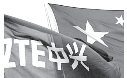
A ZTE flag flutters in front of the Chinese national flag outside its headquarters in Shenzhen, Guangdong Province on 17 April, 2012.