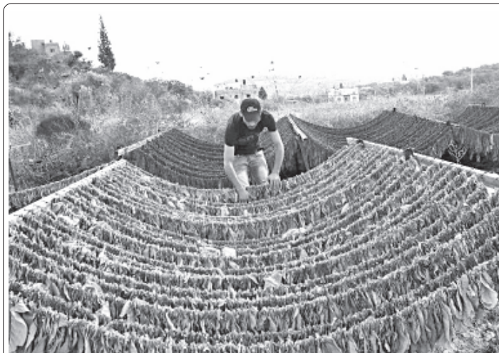
A Palestinian farmer dries Arabic tobacco leaves at a farm in the West Bank village Yaabed, near Jenin, on 8 Oct, 2012. Arabic Tobacco cigarettes manufacturing is famous in Yaabed village which produce a quality local cigarettes cheaper than imported cigarettes.

Daewoo International Corporation and IPS Add Energy also wish to convey their sincere and heartfelt condolences to wife and son of late Mr. Hagler.