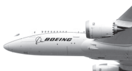
A Boeing 787 Dreamliner aircraft does a flyby at the Farnborough Airshow, Hampshire, in this 18 July, 2010.