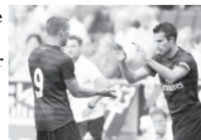
Robin van Persie (right) is looking forward to challenging for trophies with Manchester United.