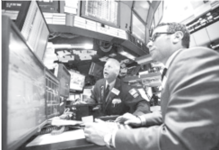
Traders work on the floor of the New York Stock Exchange, on 14 Aug, 2012.