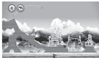
iOS and Android are stomping on Sony and Nintendo's portable game businesses.