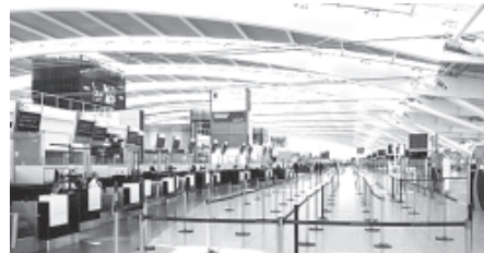
The British Airways check-in area at Heathrow airport. The Spanish construction group Ferrovial said on Friday it will sell off a further 10-percent stake in British airport operator BAA which controls London's Heathrow airport.

Ferrovial in 2011 sold a 5.88 percent stake in BAA to US investment fund Alinda.