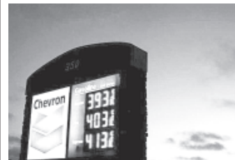
The sign of a Chevron gas station is pictured in Encinitas, California on 28 July, 2011. — REUTERS

Retailer Sears Holdings Corp reported a quarterly loss in line with Wall Street estimates as lower expenses offset weak sales. Shares rose 6.5 percent to $60.29. Dollar Tree fell 1.8 percent to $49.11 after the discount retailer posted second-quarter earnings and forecast quarterly earnings and sales below analysts' expectations. About 5.82 billion shares traded on the New York Stock Exchange, the American Stock Exchange and Nasdaq on Thursday, well below last year's daily average of 7.84 billion. — Reuters