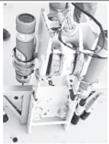
Masers are still in use by NASA to listen in to far-flung space probes.