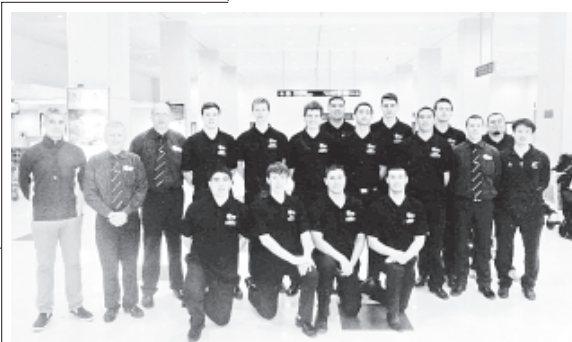
Arrival of New Zealand selected volleyball team seen at Yangon International Airport.

The New Zealander men's volleyball team arrived here by air this morning. The team was welcomed at Yangon International Airport by officials of the Myanmar Volleyball Federation.—MNA