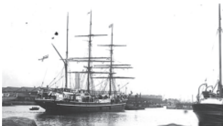
The Terra Nova carried Scott's party on their ill-fated expedition to the Antarctic.

LONDON, 18 Aug — The wreck of the ship that carried Captain Robert Scott on his doomed expedition to the Antarctic a century ago has been discovered off Greenland. The SS Terra Nova was found by a team from a US research company. Scott and his party set off from Cardiff aboard the Terra Nova in 1910 with the aim of becoming the first expedition to reach the South Pole. The ship had a life after the polar trek, sinking off Greenland's south coast in 1943.