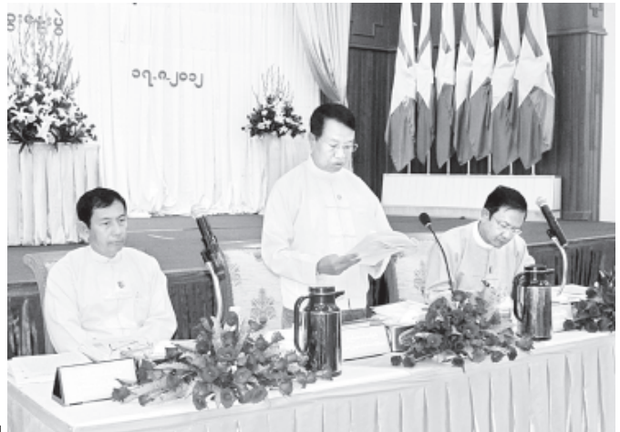
Union Minister for Electric Power No 2 U Khin Maung Soe speaking at National Level Seminar on Energy and Electric Sectors Development.—MNA

Next, Union Minister U Zaw Min said that the Ministry of Electric Power No. 1 is taking steps to implement projects capable of linking with national grid