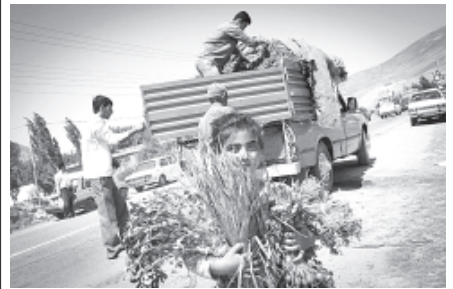
An Iranian girl carrying vegetables donated by a man after the earthquake in Varzaqan in northwest Iran, on 15 Aug, 2012. The twin quakes, which left 306 dead and over 3,000 injured, were followed by dozens of aftershocks in the following days in the region.

TEHRAN, 18 Aug—Iran's top leader is urging the reconstruction of the northwestern region hit by deadly twin earthquakes last weekend. State TV showed Supreme Leader Ayatollah Ali Khamenei visiting the ruins of a village on Thursday that was heavily damaged by the quakes.