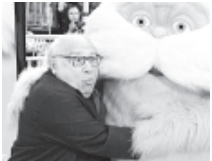
Actor Danny DeVito, the voice of The Lorax in the animated motion picture fantasy "Dr. Seuss' The Lorax" arrives for the premiere of the film at Universal Studios Hollywood in Universal City, California on 19 February, 2012.

LOS ANGELES, 18 Aug—The animated family flick "Dr Seuss' The Lorax" is the top-selling DVD and Blu-ray and No 1 rental in the United States, Rentrak said on Thursday. Coming in a No 2 on the DVD and Blu-ray sales