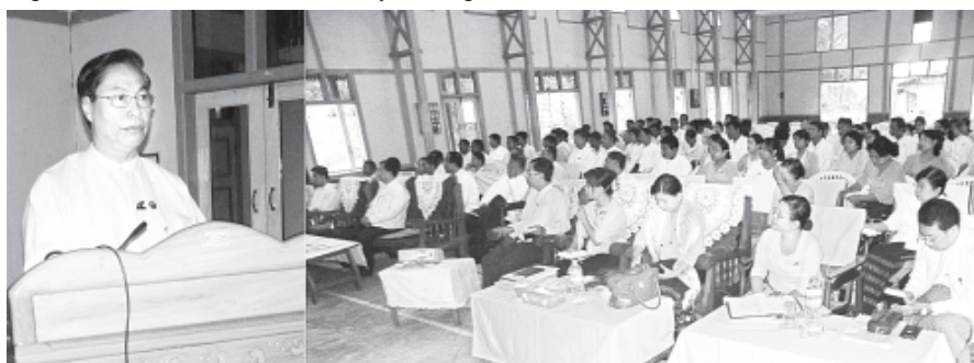
Union Minister for Cooperatives and for Livestock and Fisheries U Ohn Myint delivering an address in meeting with faculty members from Cooperatives University (Sagaing).

The union minister said that the milk processing plant will be built in the village in Sagaing Township, Sagaing Region in the near future and it will be able to produce high