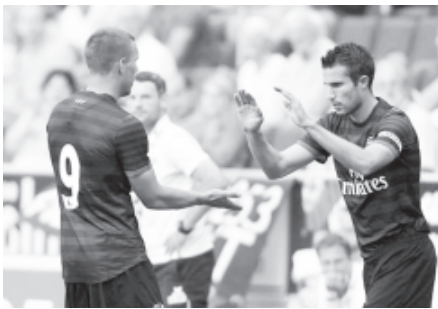
Robin van Persie (right) is looking forward to challenging for trophies with Manchester United.