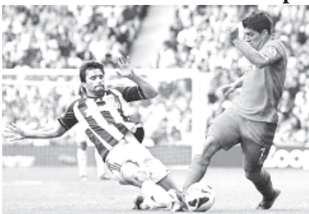
West Bromwich Albion's Claudio Jacob (L) challenges Liverpool's Luis Suarez during their English Premier League soccer match at The Hawthorns in West Bromwich, central England, on 18 Aug, 2012.

LONDON, 18 Aug— Liverpool crashed to a miserable 3-0 defeat at West Brom in Brendan Rodgers' first Premier League match as Reds boss, while Arsenal started life without Robin van Persie with a dour 0-0 draw against Sunderland on Saturday.