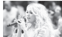
Carrie Underwood performs on the NBC Today Show at Rockefeller Center in New York City on 15 Aug, 2012.

Paisley. "I think you walk out there with people expecting a certain thing now and that's a great place to be. I think they know who we are. They know what we do up there together and we've become something different together than we are separately I think, which is fun."