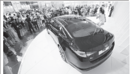
Visitors watch a car on 2012 Jiangsu (Nanjing) International Auto Show in Nanjing, capital of east China's Jiangsu Province, on 17 Aug, 2012. The 5-day international auto show, displaying a total of 800 cars of 60 brands, opened here on Friday.