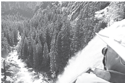
In this 20 July, 2011 file photo, a hiker takes a photo from the top of Vernal Falls in Yosemite on 20 July, 2011.

FRESNO, 18 Aug—A 10-year-old boy died and his 6-year-old brother was missing after they were swept away along a popular but treacherous boulder-strewn stretch of the Merced River, Yosemite National Park officials said on Thursday.