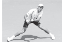
Novak Djokovic of Serbia hits a return shot to Marin Cilic of Croatia during their quarter final round match in the Cincinnati Open tennis tournament in Cincinnati, Ohio, on 17 Aug, 2012.

"I had the biggest challenge today with Cilic who