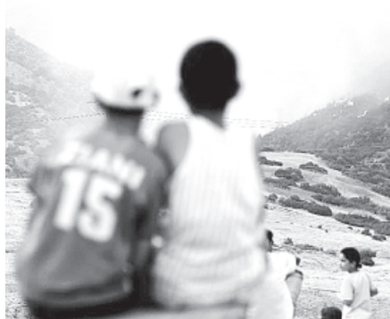
Algerian boys watch the forest fire in the province of Medea, 80 km south of Algiers, Algeria, on 17 Aug, 2012. Since early June, forest fires broke out in 18 provinces of Algeria, devastating some 20,000 hectares forest till now.