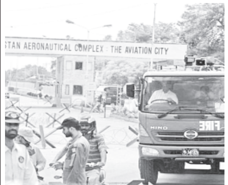
Pakistani firefighters leave the Minsas Air Force base after the completion of a commando operation against armed militants in Kamra on 16 Aug, 2012.

Its aeronautical complex assembles Mirage and, with Chinese help, JF-17 fighter jets.