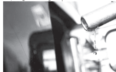
Gasoline drips off a nozzle during refueling at a gas station in Altadena, California, on 24 March, 2012.

and impact on the Iran sanctions policy," the source said, noting that Washington