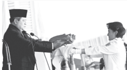
Indonesian President Susilo Bambang Yudhoyono (L) gives the National Flag to a member of the National Flag raisers troop during a celebration of Indonesia's 67th independence anniversary at the Presidential Palace in Jakarta, Indonesia, on 17 Aug, 2012.—XINHUA

The intensity of the quake was felt at 3 to 4 MMI (Modified Mercalli Intensity) in Palu town of Central Sulawesi, the official said.—MNA/Xinhua