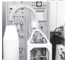
A camera package called Shrimp was sent down to film the wreck.