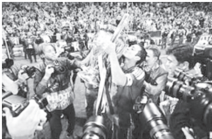
Chelsea enters season with new players, a new attacking style and confidence.

LONDON, 18 Aug—Since being rebranded from the UEFA Champions Club Cup to the UEFA Champions League in 1992, no club has ever repeated as European champions—not even Lionel Messi's Barcelona. But Marko Marin believes Chelsea is in a good position to make history after defeating Barcelona and Bayern Munich en route to winning Europe's stop prize last season. "Yeah, [I believe Chelsea can repeat]," the Blues' new midfielder told Goal.com. "The team changed a lot, but there's a lot of high quality here."