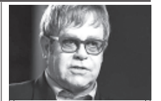
Musician Elton John speaks during an interview in Washington on 23 July, 2012. John was in town to speak at the AIDS 2012 conference.