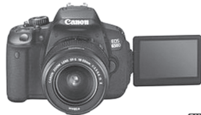
The problem has only affected a particular batch of the Canon EOS 650D camera.