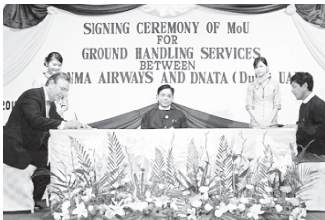
Signing ceremony of MoU on Joint Operation for ground handling services between Myanmar Airways under the Ministry of Transport and UAE-based Dnata in progress.—MNA

The Union Minister delivered a speech at the event. He said that Myanmar Airways had been established since 1948 and now it turned 64 years. The cooperation with Dnata Co would give them international experiences in the field. The airways in neighbouring countries are achieving success in their works due to their bilateral cooperation. The MoU proved energetic efforts of the staff who