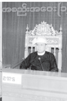
Third day special session 1/2012 of Ayeyawady Region Hluttaw in progress.