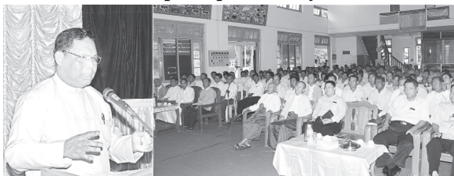
Union Minister for Commerce U Win Myint meets with chairmen and officials from brokerages, responsible persons of merchants associations, entrepreneurs and farmers from Magway Region.—MNA

NAY PYI TAW, 18 Aug—Myanmar farmers and agro business men should change their mind set, using quality seeds and shifting to modern farming methods, in the face of competitive market, said Union Minister for Commerce U Win Myint.