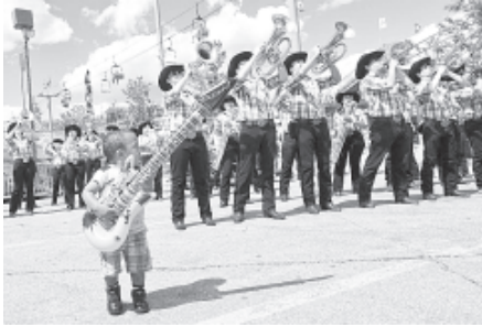
A boy joins a performance with a band during the 2012 Canadian National Exhibition in Toronto, Canada, on 17 Aug, 2012. Founded in 1879, the Canadian National Exhibition is one of the largest fairs in Canada. This year's event started on 17 August and will last 18 days.