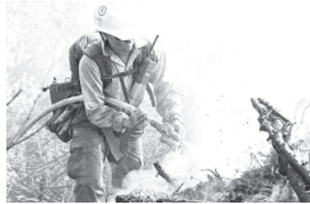
A US Forest Service firefighter works on the Springs Fire in Boise National Forest near Banks-Garden Valley, Idaho in this 13 Aug, 2012 photograph made available to Reuters on 17 Aug, 2012.

Authorities estimated the two enclaves together were home to about 1,000 year-round residents and