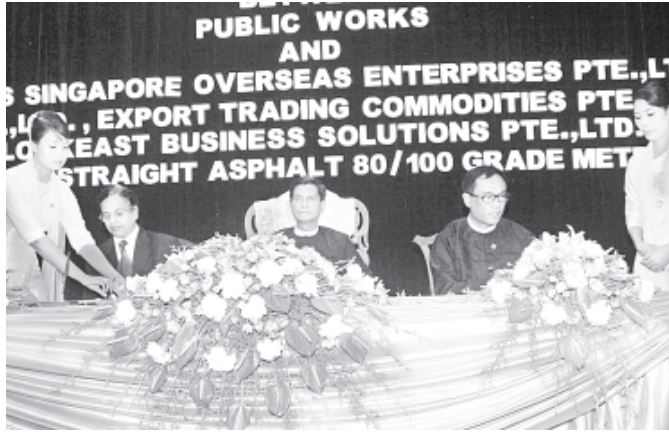
Union Minister for Construction U Khin Maung Myint attends contracts signing ceremony between Public Works and Swiss Singapore Overseas Enterprise Pte, Ltd, IPL Pte, Ltd, Export Trading Commodities Pte Ltd and Lookeast Business Solutions Pte Ltd.