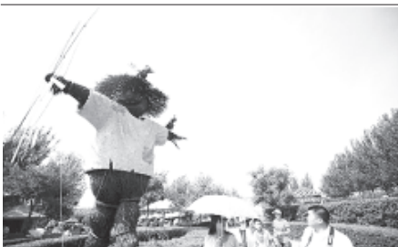
Visitors look at a sculpture of straw during the 11th China (Changchun) International Agriculture-Food Expo in Changchun, capital of northeast China's Jilin Province, on 17 Aug, 2012. During the expo, various sculptures featuring the agriculture attracted many visitors.