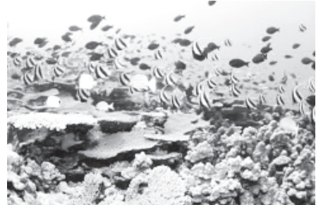
Australian scientists said on Friday there was now "striking evidence" of extensive southward migration of tropical fish and declines in other species due to climate change, in a major ocean report card.