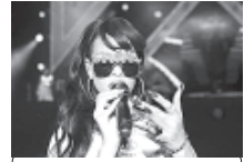
Rihanna performs at the Hackney Weekend festival at Hackney Marshes in east London, on 24 June, 2012.

"It was embarrassing, it was humiliating," Rihanna told Winfrey in the interview, excerpts of which were released on Thursday. "I lost my best friend. Everything I knew switched, switched in a night, and I couldn't