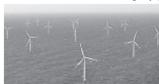
Pink-footed geese fly around and above wind farms, new research shows.