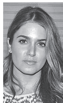
Actress Nikki Reed

"It's sad. I'm really sad," she added. The franchise started in 2008 with the first