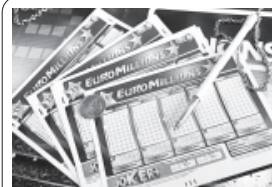
A Euro Millions lottery grid is shown in 2011.