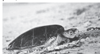
Hawksbill turtles forage on coral reefs but that habitat is increasingly under threat.

The article is published in the journal Global Ecology and Biogeography . "Ultraviolet B radiation has caused a steep increase in deaths among marine animals and plants," said Dr Llabres. UVB radiation is