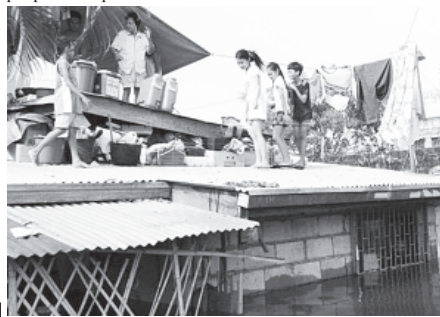
A family gathers on the roof of their home in Calumpit town, north of Manila, on 11 August.

affected by the worst flood since 2009. Of the total