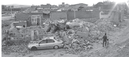
Ruins of a houses are seen after an earthquake in the city of Varzaqan in northwestern Iran, on 11 Aug, 2012.

The US Geological Survey measured Saturday's first quake at 6.4 magnitude and said it struck 60 km (37 miles)