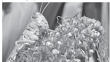
Drought in the US has hurt crops, and the world's poorest.

The index reading in July was still well below the all-time high reached in February 2011. The Rome-based organization took the surprise step of publishing the index this month — which it usually does not — due to the exceptional market conditions affected by unusual weather patterns. Cereal prices