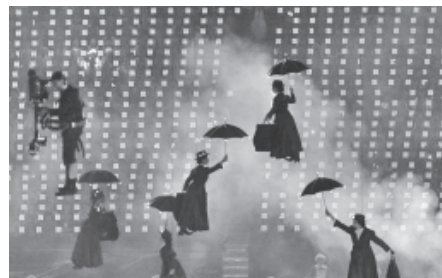
Actors perform during a tribute to Mary Poppins during the Opening Ceremony of the London 2012 Summer Olympics on 27 July, 2012 in Stafford, London.