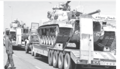
An Egyptian army truck carries tanks and vehicles to Rafah city, some 350 km (217 miles) northeast of Cairo, 10 August, 2012.

Egypt sent hundreds of troops and armored vehicles into North Sinai on Thursday to tackle militants operating