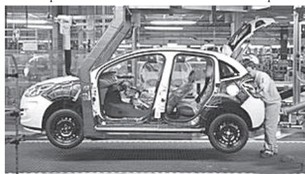
The eurozone crisis has hit French exports.—INTERNET

France's economy has been hit by the eurozone debt crisis, which has weakened demand for its exports. The debt woes of fellow eurozone nations, such as Greece, Spain and Portugal, have also knocked French business and consumer confidence. If France does fall back into recession, it will be for the second time in three years. It last returned to economic growth in the spring of 2009.—Internet