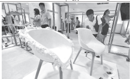
Visitors view chairs made from recycled paper pulp at the 2012 China Hangzhou Industrial Design Expo in Hangzhou, east China's Zhejiang Province, on 11 Aug, 2012.

captured six people it considered "terrorists" in Sinai on Friday and the security source said three of them were later released.—Reuters