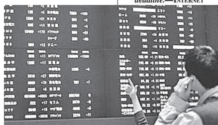
Oki Electric may face a possible delisting for missing its financial reporting deadline.

Earlier this year, Japan's Olympus Corp was fined 10m yen after it admitted to a 13-year accounting fraud. The medical equipment and camera-maker lost about $4bn (£2.5bn) in market value because of the scandal, but was allowed to keep its listing