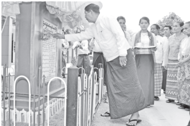
Union Minister for Education Dr Mya Aye sprinkles scented water on stone inscription of Myawady two-storey building at Chanayethazan BEHS No 5.

At the ceremony to hand over the new school building to the Ministry of Education,