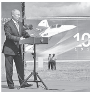
Russian President Vladimir Putin attends an air show dedicated to the 100th anniversary of Russia's Air Force at Zhukovskiy outside Moscow on 11 Aug, 2012.

In his address at the air show in Zhukovskiy, outside Moscow, Putin thanked air force officers, veterans and industry workers he said "helped our aviation endure the very difficult times of the 1990s and early 2000s". A former Soviet KGB officer who has often used warnings of external threats to rally, Putin said during his presidential campaign that Russia needed a stronger military to protect it from foreign attempts to stoke conflicts around its borders.— Reuters