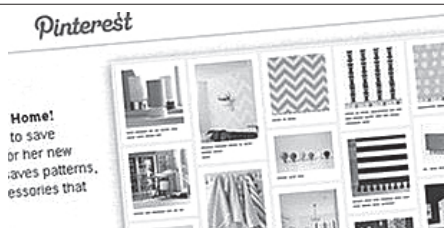
Pinterest became the fastest-growing site in history. INTERNET

One social media analyst told the BBC that having invites had been part of Pinterest's marketing