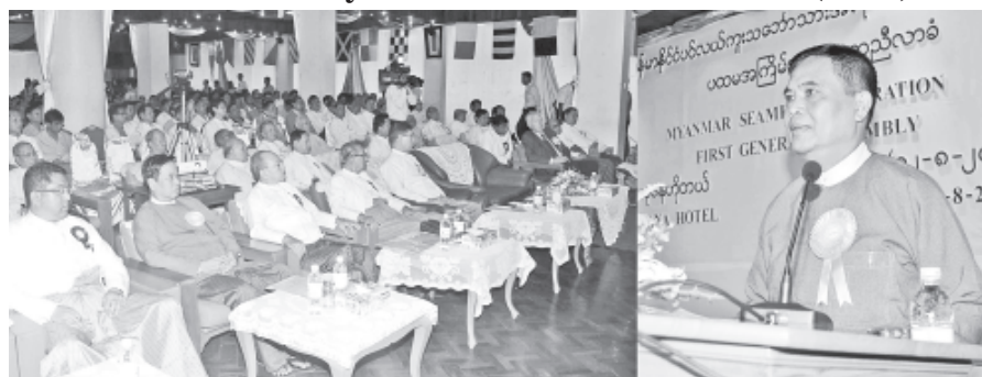
Union Minister for Social Welfare, Relief and Resettlement and for Labour U Aung Kyi addresses first conference of Myanmar Seamen's Federation (MSF).

the later are trying hard for increased capacity of factories and mills. With this end in view, the employers' associations in cooperation with the management are to introduce workplace reform, he reiterated.