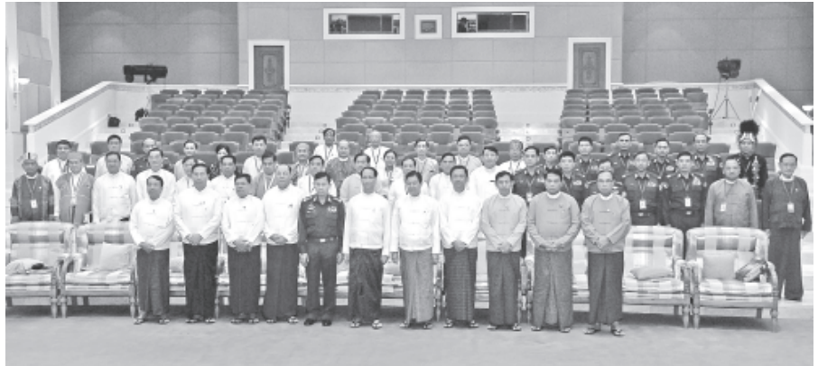
Chairman of Union-level Peace-making Working Committee Vice-President Dr Sai Mauk Kham and Work Committee members pose for documentary photo.

Agreements have been reached with 10 out of 11 groups at the State level or the Union level and engagement is being made with each of the groups.