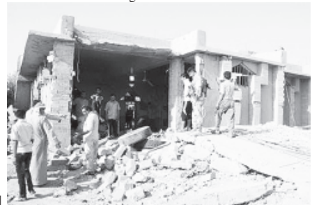
Residents gather at the site of a bomb attack in Mwafaqiya village at Mosul, 390 km (240 miles) north of Baghdad, on 10 Aug, 2012.