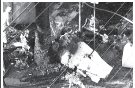
A small plane crashed into a Los Angeles neighbourhood of Westwood this on Friday, leaving smoldering airplane wreckage in a corner yard and at least one person dead.