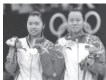
Gold medalists China’s Tian Qing (L) and Zhao Yunlei pose at the women’s doubles badminton victory ceremony at the London 2012 Olympic Games at the Wembley Arena on 4 Aug, 2012.

Lin Yue of China competes during men’s 10m platform diving semifinal contest, at London 2012 Olympic Games in London, Britain, on 11 Aug, 2012.