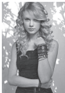
Singer Taylor Swift