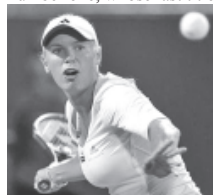
Caroline Wozniacki of Denmark hits a return during her match against Aleksandra Wozniak of Canada at the Rogers Cup tennis tournament in Montreal, on 11 Aug, 2012.

The 22-year-old former number one, whose last title