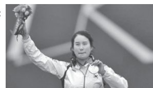
South Korea's Ki Bo-bae, with the impression of her bow on her nose, poses with her gold medal during the victory ceremony for the women's individual archery event at the London 2012 Olympic Games at the Lord's Cricket Ground on 2 Aug, 2012. PAGE 14