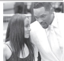
Will Smith and his wife Jada Pinkett Smith

"You need understanding, acceptance, and compassion," the actress said. "And usually you get understanding through friendship, so you need to have that."