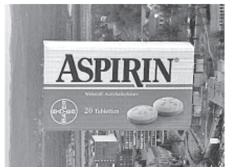
An aerial view shows an administration building of the German Bayer AG chemical company in Leverkusen wrapped as giant "Aspirin" box.