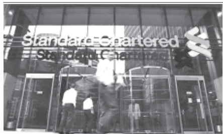
An exterior view of the Standard Chartered headquarters is seen in London on 7 August, 2012.