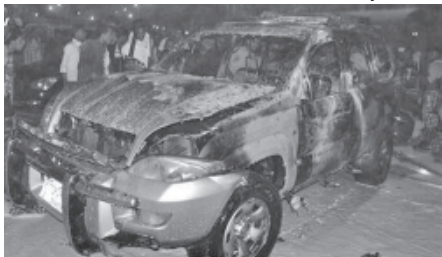
People look at the burnt car of Brigadier Omar Barasheed, the dean of the Command and General Staff College, after a blast ripped through it in the southern Yemeni port city of Mukalla on 9 Aug, 2012.