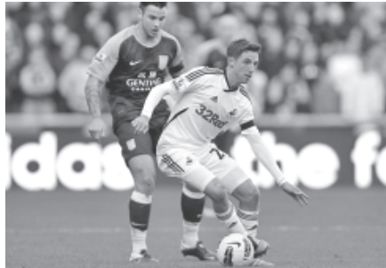
Joe Allen made 36 Barclays Premier League appearances for Swansea City last season.

Allen believes that Rodgers, who led Swansea to an 11th place finish in the table last season, will bring success to Liverpool. “I have a lot of faith that Brendan Rodgers can bring success, that’s one of the reasons I’m here,” he added. “I wanted to be part of this project, his