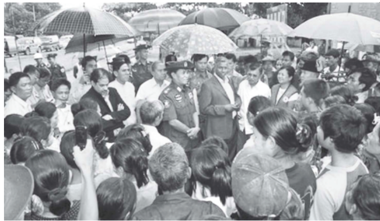
Union Minister Lt-Gen Thein Htay, Chairman of Indonesian Red Cross Society Mr Jusuf Kalla and party meet victims at relief camp in Sittway.

Next, they proceeded to the relief camp in Thekkebyin Village of Sittway where they greeted and asked the victims.