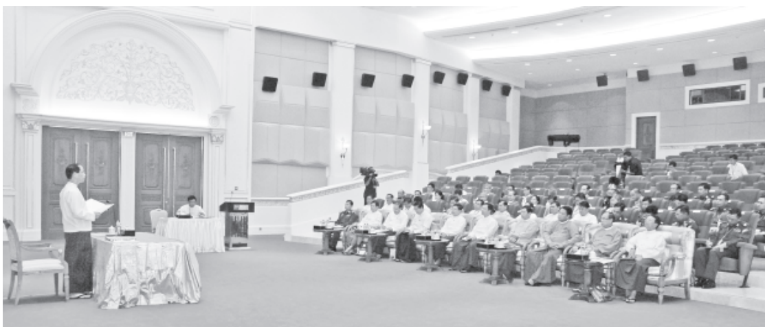
Chairman of Union-level Peace-making Working Committee Vice-President Dr Sai Mauk Kham addresses meeting (1/2012) of the committee.

Vice-President Dr Sai Mauk Kham said in his address said that it is the first-ever meeting of the committee. The purposes of the meeting were getting all the members together,