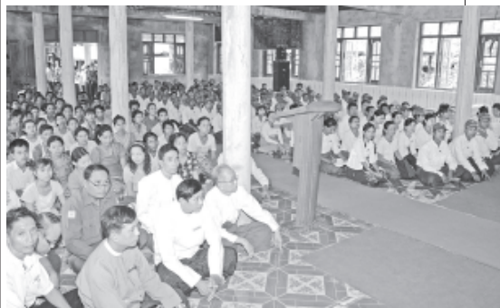
Union Minister at the President Office U Thein Nyunt speaking on the occasion.