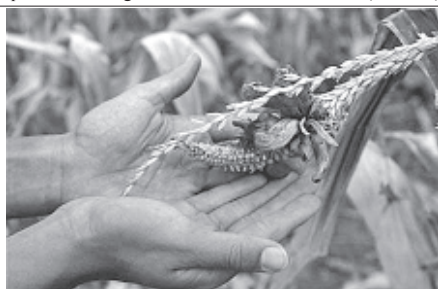
A damaged corn crop in Rice County, in central Kansas August 7, 2012.