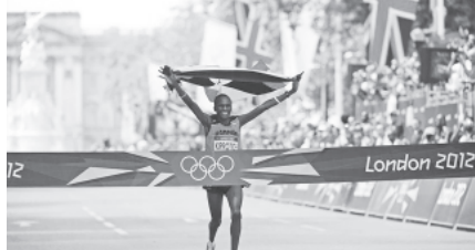
Stephen Kiprotich celebrates as he approaches the line to win gold in the men's Marathon on Day 16 at London 2012.

Kiprotich followed in the footsteps of his compatriot