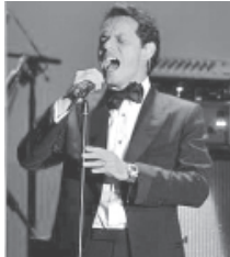
Singer Marc Anthony

NEW YORK, 12 Aug— Singer Marc Anthony hosted a fundraiser event in New York for an orphanage.