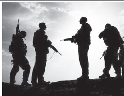
British soldiers are silhouetted against the sky as they provide security in southern Afghanistan. A British soldier has been killed while on patrol in southern Afghanistan, the Ministry of Defence in London said on Friday.

Public health officials typically advise residents of mosquito-prone areas to drain standing water, apply insect repellent containing the ingredient DEET and wear long-sleeve shirts and long pants.