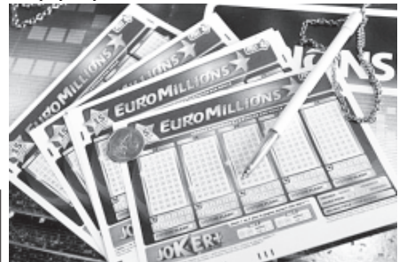
A Euro Millions lottery grid is shown in 2011.