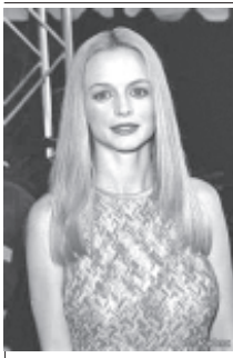
Actress Heather Graham

movie "Twilight". It was followed by "New Moon", "Eclipse" and "Breaking Dawn: Part 1".—Internet