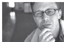
Twilight director Bill Condon

LONDON, 12 Aug— Twilight director Bill Condon has urged fans to show Kristen Stewart and Robert