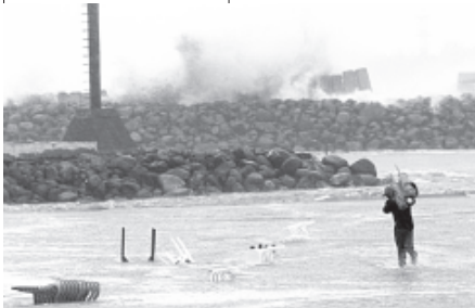
VERACRUZ, 12 Aug — Ernesto killed at least nine people in Mexico, officials said, with the dissipating storm

A man collects beach umbrellas ahead of the expected arrival of Tropical Storm Ernesto in Veracruz, Mexico. Ernesto killed at least nine people in Mexico, officials said, with the dissipating storm threatening more heavy rain and possible flooding.