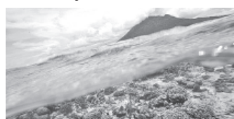
Increased ultraviolet radiation has caused a sharp rise in the deaths of marine species, scientists have found. —INTERNET

known to impair photosynthesis, nutrient absorption, growth and reproductive rates in certain species but this is thought to be the first attempt to quantify the damage it does to marine ecosystems. "The organisms most affected are protists, such as algae, corals, crustaceans and fish larvae and eggs," she said.