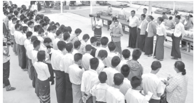
Union Minister U Myint Hlaing meets faculty members and students from Institute of Agriculture from Pwintbyu Township at 500-acre farmer educative farm in Koeywa Thabyegon.

NAY PYI TAW, 12 Aug—Union Minister for Agriculture and Irrigation U Myint Hlaing this morning met faculty members and students from Institute of Agriculture from Pwintbyu Township at 500-acre farmer educative farm in Koeywa Thabyegon of Ngalaik irrigated region in Nay Pyi Taw Council Area and explained cultivation of paddy, edible oil crops sunflower and groundnut including cash crops.