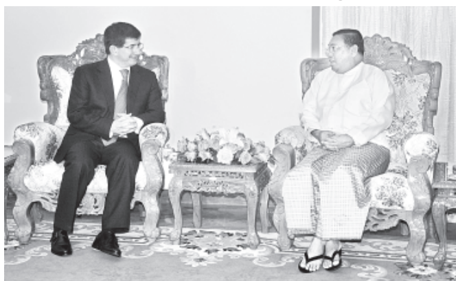
Union Minister for Foreign Affairs U Wunna Maung Lwin receives Mr Ahmed Davutoglu, Foreign Minister of the Republic of Turkey.—MNA

NAY PYI TAW, 9 Aug— Union Minister for Foreign Affairs U Wunna Maung Lwin received Mr. Ahmed Davutoglu, Foreign Minister of the Republic of