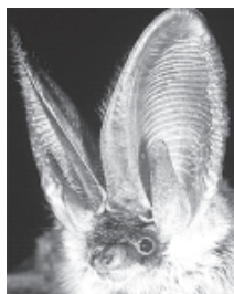
Many bat species migrate, making a pan-European identification tool necessary.

The team selected 1,350 calls from 34 different European bat species from EchoBank, a global echolocation library containing more than 200,000 bat call recordings. This raw data has allowed them to develop the identification tool, iBatsID, which can identify 34 out of 45