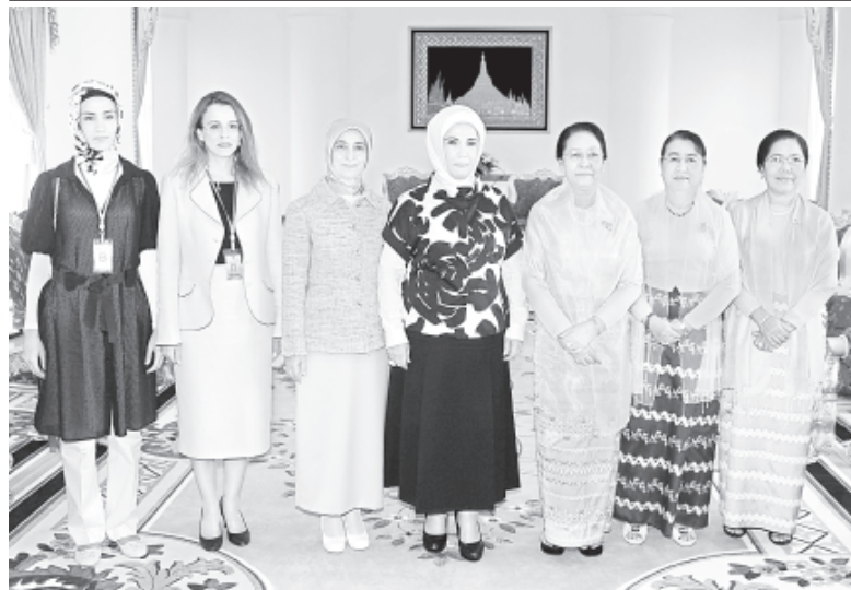
Daw Khin Khin Win, wife of President U Thein Sein, and a delegation led by Mrs Emine Erdogan, wife of the Prime Minister of the Republic of Turkey, pose for documentary photo.