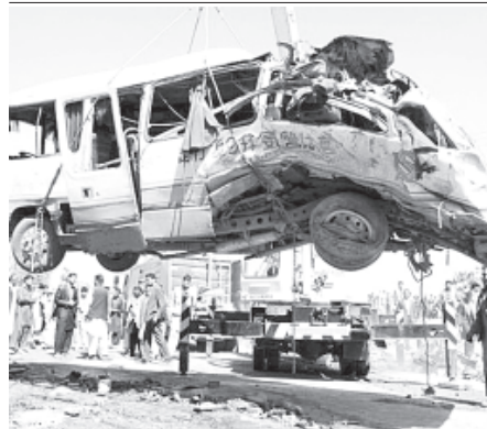
A damaged bus which was hit by a remote control bomb is lifted by a crane on the outskirts of Kabul, Afghanistan, on 7 Aug, 2012.