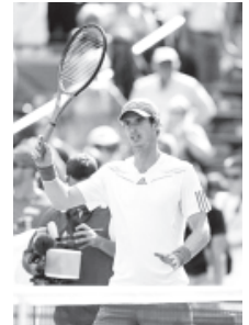
Andy Murray of Scotland celebrates after winning his match against Flavio Cipolla during the Rogers Cup Presented By National Bank at Rexall Centre at York University, on 8 August, in Toronto, Ontario, Canada. Murray won 6-1, 6-3.

"I feel a little bit sore in the joints, I feel tired mentally," said Murray. "I