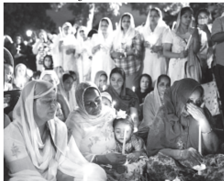
Sikhs attend a vigil in Oak Creek, Wisconsin, on 7 Aug, 2012. The killings of six worshippers at a Sikh temple in Wisconsin has thrust attention on white power music, a thrashing, punk-metal genre that sees the white race under siege.

are often mistaken for Muslims in the United States. The Sikh faith was founded in the Punjab area of India and Pakistan and has an estimated 500,000 or more adherents in the United States. President Barack Obama called Indian