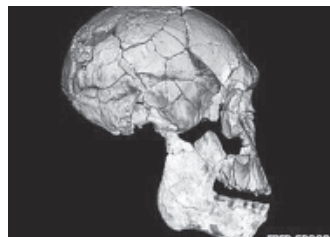
A new species of human: One of several co-existing in Africa two million years ago.