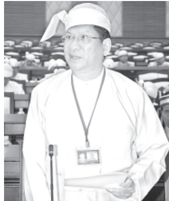
Deputy Minister for Labour U Myint Thein replies to queries.