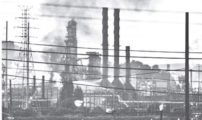
Firefighters douse a flame at the Chevron oil refinery in in Richmond, California on 6 Aug, 2012.