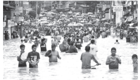
Residents wade through floodwaters to return to their submerged houses in Marikina City Metro Manila on 8 Aug, 2012.

The national disaster agency said on Wednesday