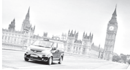
Nissan's new London taxi