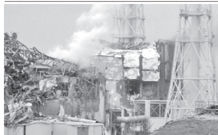
In this 15 March, 2011 file photo released by Tokyo Electric Power Co, smoke rises from the badly damaged Unit 3 reactor, left, next to the Unit 4 reactor covered by an outer wall at the Fukushima Dai-ichi nuclear complex in Okuma, northeastern Japan. — INTERNET

The structures housing three of the reactors suffered hydrogen explosions after gas filled the unvented buildings, and the blasts spewed radiation and delayed repair work. To try to halt the explosions, the videos show officials even considered dropping a hammer from a helicopter to make a hole in the ceiling, but they scrapped the idea because it was too dangerous. The footage reveals communication problems between the plant and the government as well as workers' lack of knowledge of emergency procedures and delays in informing outsiders about the risks of leaking radiation. — Internet