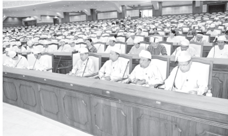
Photo shows Pyithu Hluttaw representatives attending 23 rd day meeting of fourth regular session of Pyithu Hluttaw.

To give license for hotel and guest house industry, local offices of the Ministry of Hotels and Tourism inspect the business when a businessmen applies a license for hotel and guest house for tourists together with necessary documents and recommendation of local authority. The local offices have to report their findings to the monthly meeting of the management committee of the director-general of the Directorate of Hotels and Tourism to seek an approval and to