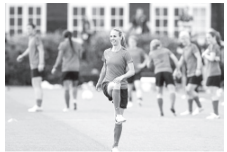
Heather Mitts, of the United States women's soccer team, trains in London, on 8 Aug., 2012, ahead of the upcoming women's soccer final at the 2012 Summer Olympics.

No matter the result on Thursday, the Olympic women's soccer tournament couldn't task for a better finale. The teams from last year's World Cup final meet again at Wembley Stadium, with organizers expecting the largest crowd ever to watch women play the sport at a Summer Games. For the players, of course, the result does matter. The Japanese are attempting to become the first team to win World Cup and