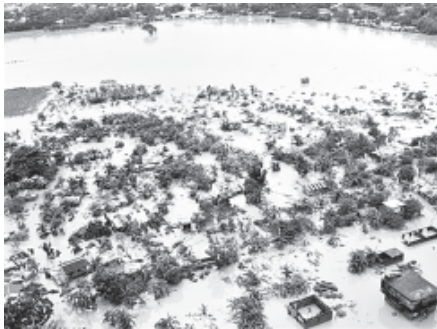
A Department of National Defence aerial photograph shows buildings and roads submerged by floodwaters in Rodriguez town, Rizal Province, east of Manila on 8 Aug, 2012.

MANILA, 9 Aug — Heavy rains pounded the Philippines capital on Wednesday, prompting a new danger alert as emergency workers rushed food, water and clothes to almost one million people through streets turned into rivers after 11 straight days of monsoon downpour. About 60 percent of Manila, a metropolis of about 12 million people, remained inundated, Benito Ramos, head of the national disaster agency, told Reuters.