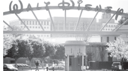
In this 8 Feb, 2011 file photo, people stand near the entrance to the Walt Disney Studios in Burbank, Calif.