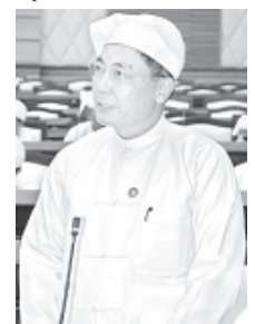
Amyotha Hluttaw representative U Win Naung of Yangon Region Constituency No. 5 makes question.

As there were representatives who fail to reach agreements on it, Hluttaw took votes by mean of standing up. Hluttaw decided to discuss it as more than 40 representatives voted it. Hluttaw announced that representatives who want to