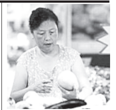
Rising consumer prices have been a hot political issue in many Asian economies.—INTERNET