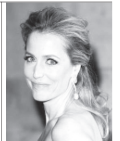
American actress Gillian Anderson

They had a brief split in May due to Gaga's touring commitments, but they soon reconciled and are back to being very close.— Internet