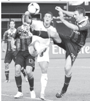
AC Milan defender Daniele Bonera, right, blocks a shot by Real Madrid forward Cristiano Ronaldo during the first half of their exhibition soccer match at Yankee Stadium in New York, on 8 Aug., 2012.

Ronaldo, cheered loudly by the crowd of 49,474, had played only half of other preseason games but stayed in this one until the 80th. "Lots of magic here, and I think we did what the stadium deserved, what Yankee history deserves," Mourinho said, comparing the venue to his home stadium. "If I have this kind of crowd, so enthusiastic crowd in the Bernabeu, I don't lose a match in the Bernabeu." — Internet