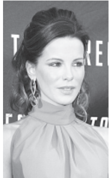
Actress Kate Beckinsale