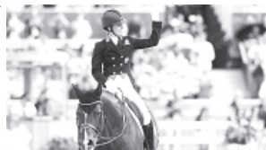
Charlotte Dujardin of Great Britain riding Valegro celebrates during the Individual Dressage on Day 13 of the London 2012 Olympic Games at Greenwich Park.