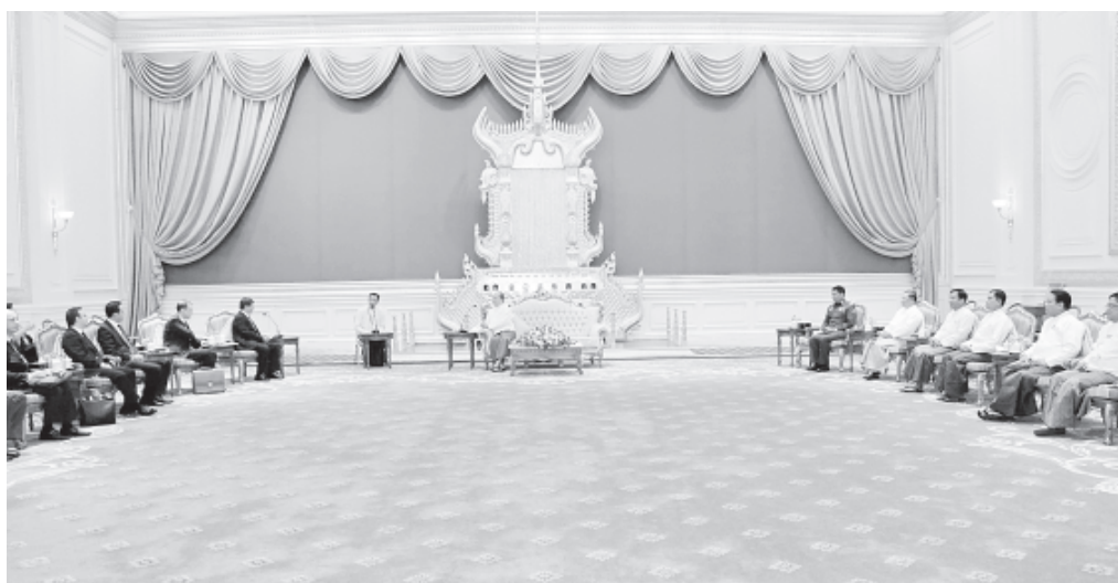
President U Thein Sein receives Mr Ahmet Davutoglu, Foreign Minister of the Republic of Turkey, at the Credentials Hall of the Presidential Palace.

Also present at the call together with the President were Union Minister for Border Affairs and for Myanma Industrial Development Lt-Gen Thein Htay, Union Minister for Foreign Affairs U Wunna Maung Lwin, Union Minister at the President Office U Soe Maung, Union Minister for Labour and for Social Welfare, Relief and Resettlement U Aung Kyi, Union Minister for Immigration and Population U Khin Yi and departmental heads. The delegation led by the Turkish Foreign Minister was accompanied by Turkish Ambassador to Myanmar Mr Murat Yavuz Ates.