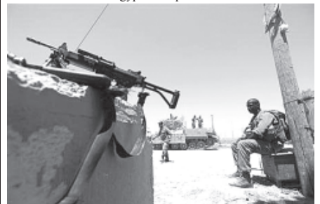
Israeli soldiers guard the border with Egypt at the Kerem Shalom crossing, a military zone where the borders of Israel, Egypt and Gaza intersect, and where an Egyptian military vehicle that was seized by Islamist gunmen tried to storm the border into Israel on Sunday.

But in a major shake-up, he sacked intelligence chief Mourad Mwaif and announced other changes in security appointments. He has also promised to restore calm to the Sinai region after militants killed 16 Egyptian guards on Sunday and then stormed through the border before being killed by Israeli fire. It was the bloodiest attack on security forces in Sinai since Egypt made peace with Israel in 1979.