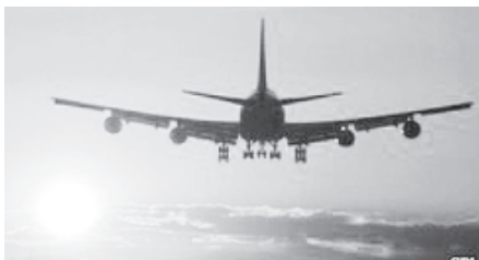
The different germs and food in a foreign country, rather than air travel, seem to make athletes ill.—INTERNET

Prof Martin Schwelnius, one of the paper's authors said: "It is a common perception that international travel increases illness—due to organisms in aeroplanes." However, this study suggests that increased illness from travel is more likely to be due to the fact that the person is out of their normal environment. Prof Schwelnius added: "The stresses of travelling seem not to affect the players because when they return home the risk of illness does not differ from normal. "Changes in air pollution, temperature, allergens, humidity, altitude as well as