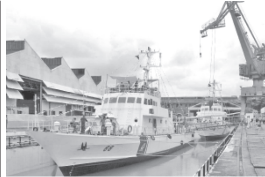
Two additional water-jet propelled Inshore Patrol Vessels (IPV) of Indian Coast Guard (ICG) are launched at newly acquired and refurbished Rajabagan dockyard in Calcutta, India, on 6 Aug, 2012.

Corporate deposits are usually regarded as an unstable source of retail funding for banks. Local exporters deposit foreign cash holdings earned through trade into the foreign currency deposits mainly for short-term settlement purposes, leading to higher volatilities. By currency, retail deposits denominated in the US dollar ranked first in terms of deposit size with 30.94 billion dollars deposited as of end-July. It was followed by the European single currency with 2.7 billion dollars deposited, the Japanese yen with 2 billion dollars and other currencies, including the British pound, the Australian dollar and the Chinese yuan, with 1.15 billion dollars. — Xinhua