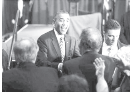
US President Barack Obama greets members of the audience after delivering remarks at an election campaign fundraiser in Stamford, Connecticut, on 6 Aug. 2012.