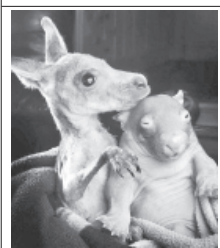
In Australia, a wombat cub became good friend of a kangaroo cub by sharing the same pouch. XINHUA

The report also found that more adults with arthritis or hypertension are walking and there was no increase in walking among adults with type 2 diabetes. Xinhua