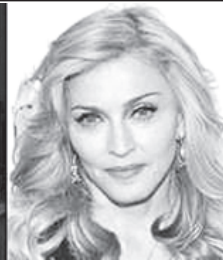
Elton John and Madonna

NEW YORK, 9 Aug — Elton John and Madonna's rivalry seems to have gone to a new level. John has lashed