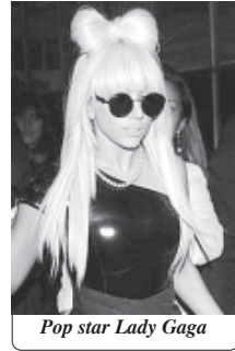
Pop star Lady Gaga

The couple was joined by four friends for the seafood feast.