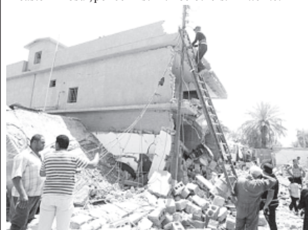
Iraqis survey the scene of a series of bomb attacks in the town of Taji, north of Baghdad which killed at least 42 people and wounded 40 in July 2012.