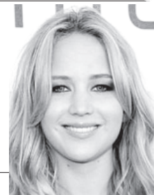
Actress Jennifer Lawrence