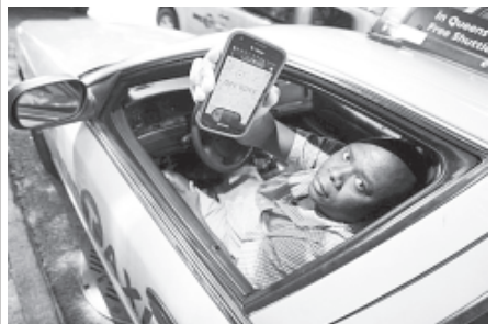
A Taxi driver displays the driver's ZabKab app on his smartphone, in New York, on 8 Aug, 2012. Hailing a taxi on a New York street is going high-tech, with a smartphone application. Starting on Wednesday, a passenger can send out a hailing signal to all cabs within a four or five-block area. — INTERNET

Drivers will be charged $14.95 a month, or $9.95 on a six-month subscription — after several promotional, cost-free months. The passenger app is free of charge. — Internet