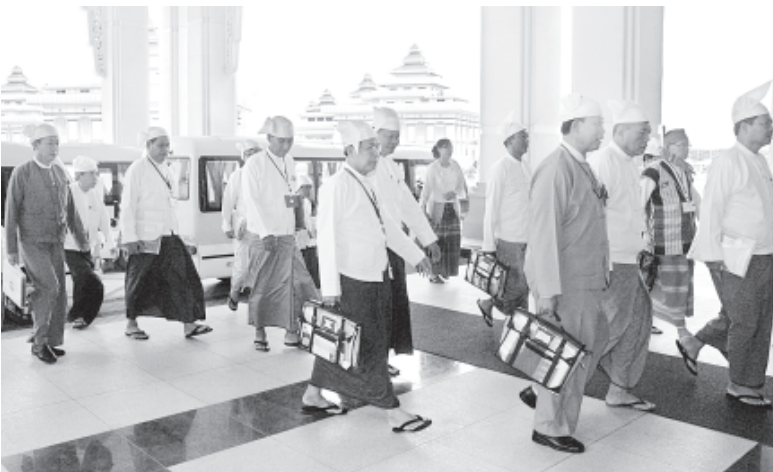
Amyotha Hluttaw representatives arrive at Amyotha Hluttaw hall to attend 23 rd day Amyotha Hluttaw regular session.