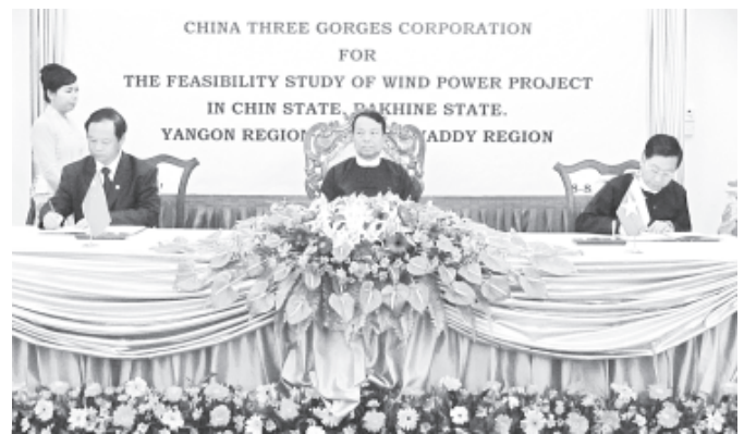
Union Minister for Electric Power No.2 U Khin Maung Soe attends MoU signing ceremony between Electric Power Department and China Three Gorges Corporation.—MNA

momentum should sources for generating wind energy used power be found; and that likewise, it will also contribute to power supply in Yangon Region and Ayeyawady Region.