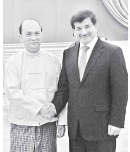
President U Thein Sein cordially shakes hands with Turkish Minister of Foreign Affairs Mr Ahmet Davutoglu.

There are possibilities to establish oil mills in Taninthayi Region which has 300,000 acres of oil palm plantations. Establishing mineral factories would be more beneficial as Myanmar has mineral, copper and iron deposits and is surrounded huge markets, the President said.