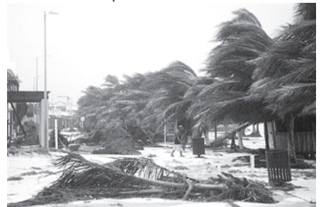
A resident walks past swaying palm trees following the passing of Hurricane Ernesto in Mahahual, in the Mexican state of Quintana Roo, on 8 Aug, 2012.