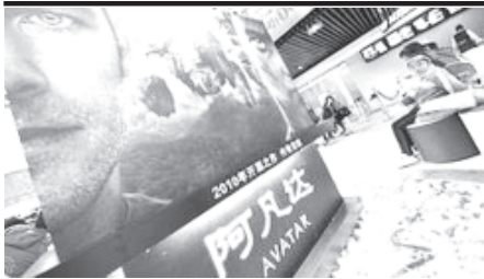
Three-dimensional movies have been among the highest grossing films in China in recent years.