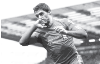
Luis Suarez has scored 15 goals in 44 Barclays Premier League matches.

LIVERPOOL, 9 Aug — Luis Suarez has paid tribute to Liverpool's "unbelievable" fans after agreeing to sign a new contract with the Barclays Premier League club. Suarez, who joined the Carling Cup holders from Ajax in January last year, had four years left of his five-and-a-half year deal but agreed to commit his future to the club by penning a new, improved long-term deal. "To sign a new contract with Liverpool is unbelievable for me because I am so happy here at the club and also in the city," Suarez told the club's official website. "That is important for me and I am very happy with my new contract." "When you are a kid, everybody wants to play for Liverpool. I am here now and it is a dream for me, and now I am a Liverpool fan. I am happy