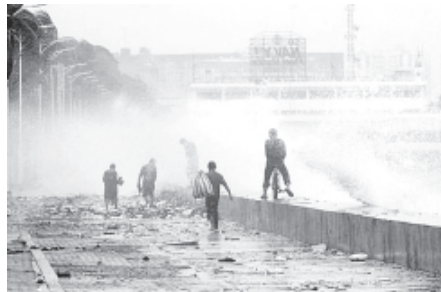
People walk past high waves breaking into the promenade of Roxas boulevard in Manila, on 30 July, as strong winds and rains due to Tropical Storm Saola hit the capital. At least one person was killed and millions were left without power during the storm.