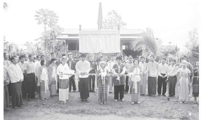
The liaison office of Karenni National Progressive Party in Dawukhu ward of Loikaw in progress.

More KNPP liaison offices will be opened in Hpahsaung and Shadaw with the agreement reached