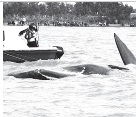
Image provided by the Jakarta Animal Aid Network shows rescuers trying to free a sperm whale (C) stuck in shallow waters at Pakis Jaya beach in West Java on 27 July.—INTERNET