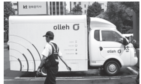
A police officer passes by a vehicle advertising KT, South Korea's largest fixed-line telephone company and No 2 mobile operator, at the company's branch office in Seoul, South Korea, Monday, on 30 July, 2012.

Police said the two made about $877,000 from the hacking scheme. They sold the program as well as mobile subscriber data to telemarketing companies which used the details to