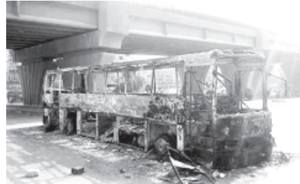
A burnt bus which belonged to forces loyal to Syria President Bashar Al Assad is seen at Aleppo's district of al Sakhour on 29 July, 2012. Syrian troops said they had recaptured a district of Syria's largest city Aleppo, after heavy fighting against rebels who remain in control of swathes of the commercial hub despite being pushed out of the capital Damascus.—INTERNET