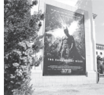
A poster for the Warner Bros. film "The Dark Knight Rises" is displayed at Warner Bros. studios in Burbank, California, 20 July, 2012.

global haul now stands at $537 million for the film that cost its backers some $250 million to make and tens of millions more to market.