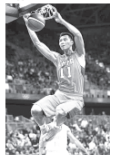
Yi Jianlian of China dunks during men's basketball preliminary round group B match between China and Spain, at London 2012 Olympic Games in London, Britain, on 29 July, 2012. China lost to Spain 81-97.

25. Pau Gasol led the team with 21 points and 11 rebounds, while Ibaka adding 17 and Juan-Carlos Navarro 14. China's Wang Zhizhi had 15 points and Chen Jianghua chipped in 12.