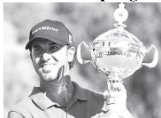
Scott Piercy holds the championship trophy after winning the Canadian Open.