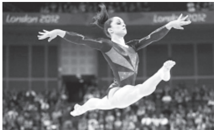
US gymnast Jordyn Wieber performs on the floor during the Artistic Gymnastics women's qualification at the 2012 Summer Olympics on 29 July, 2012, in London.

A heavy favorite for gymnastics' biggest prize — and the attention and riches that go with it — Wieber lost her chance with a series of uncharacteristic mistakes. She wound up with the fourth-best individual score in qualifying, but countries are limited to two gymnasts in the all-around and event finals and pal Aly Raisman and Gabby Douglas were ahead of her.