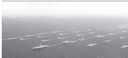
Naval ships from 22 nations on 9 June kicked off the biennial Rim of the Pacific (RIMPAC) exercise, billed the largest international maritime drill, in and around the Hawaiian Islands. Scheduled from 29 June to 3 Aug the drill was participated by 42 ships, six submarines, more than 200 aircrafts and 25,000 personnel from countries including Russia, New Zealand and Singapore.