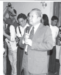
Union Minister U Wunna Maung Lwin extends greetings at the press briefing on Rakhine incidents.—MNA