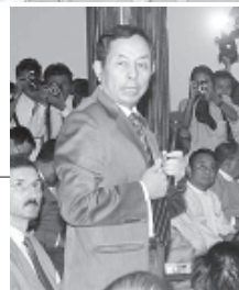
Bangladeshi Ambassador to Myanmar raises question.—MNA