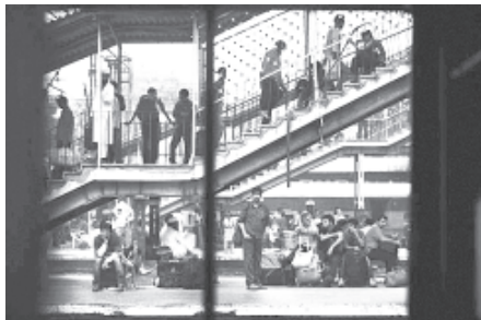
Stranded commuters wait for their trains to arrive at a train station in New Delhi, India on 30 July.