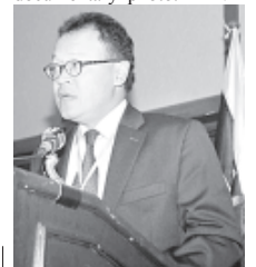
Deputy Secretary-General of the ASEAN Secretariat Dato' Misran Karmain making a speech.—MNA

At the end of the ceremony, Chairman of Myanmar ASCC Council Union Minister U Kyaw Hsan, Yangon Region Chief Minister U Myint Swe, deputy ministers, region ministers, distinguished guests and attendees posed for a documentary photo.—MNA