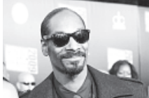
Rapper Snoop Dogg

Officials discovered eight grams of marijuana and an illegal amount of bundled cash when he attempted to go through customs June 28 at Kjevic Airport in Kristiansand, NME.com reported. He was fined about $2,000, which he