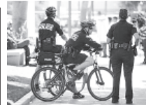
General Services Police officers stand watch as the park surrounding Los Angeles City Hall is reopened seven-and-a-half months.