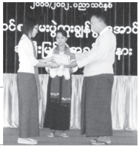
Speaker of Pyidaungsu Hluttaw U Khin Aung Myint presents outstanding student who passed 2011-2012 academic year with distinctions.

A total of 101 distinction-winners emerged from the township.