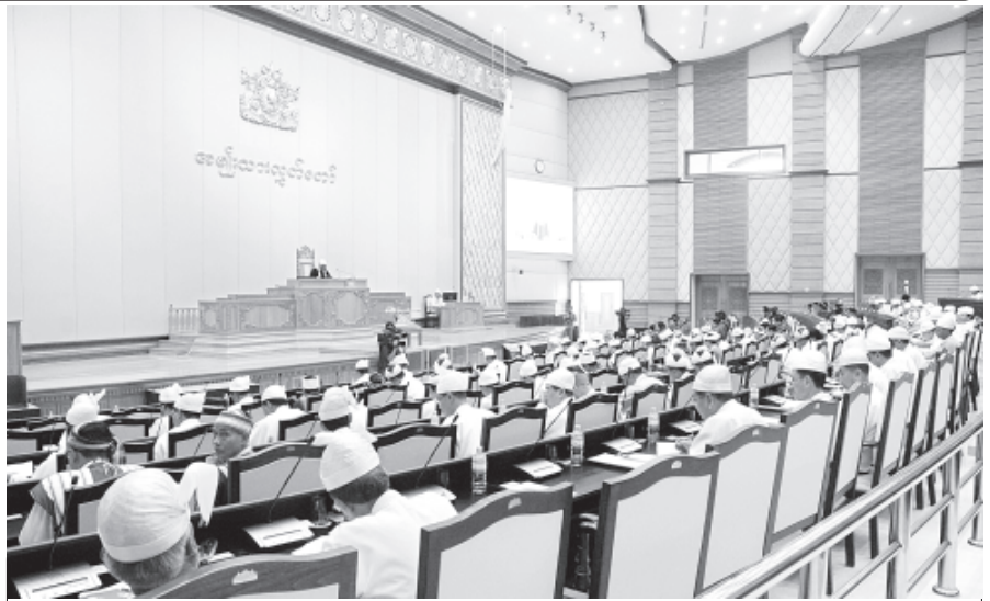
17 th day of Amyohta Hluttaw session in progress.—MNA

Directorate of Water Resources and Improvement of River Systems of the Ministry of Transport suggested the Ayeyawady Region chief minister in his tour of Nyaunggyoe Village on 6 January, 2012, that deflectors and willow mattress should be constructed for prevention of bank erosion. The chief minister in response instructed the directorate to provide necessary technical help and work in cooperation with local people. He also called on the