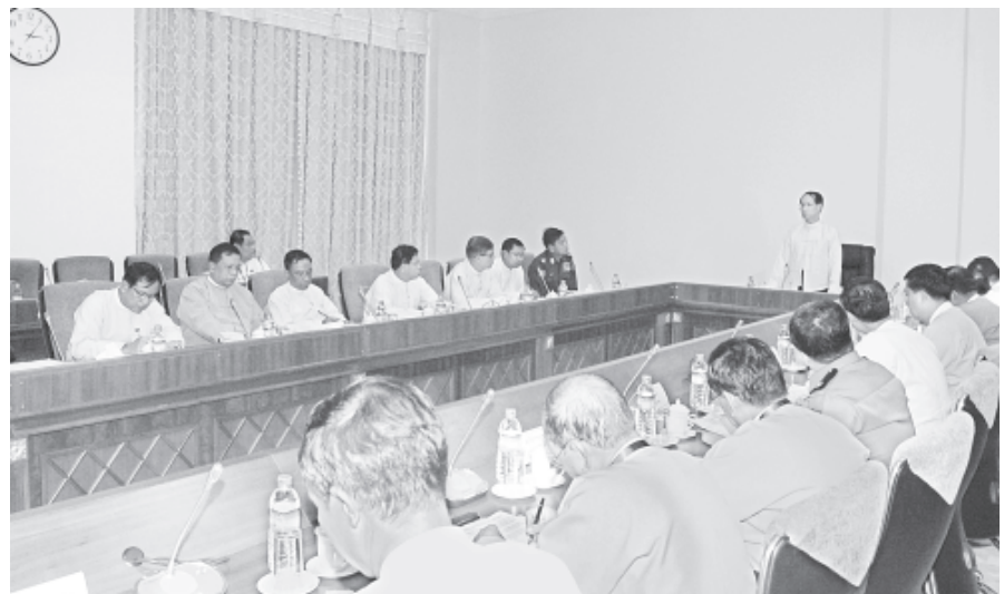
Vice-President Dr Sai Mauk Kham addresses coordination meeting on Rehabilitation of Rakhine State.