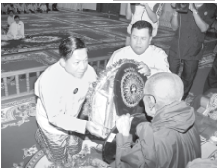
Commandar-in-Chief of Defence Services Vice-Senior General Min Aung Hlaing offer waso robe and offertories to the Vice-Chairman of SSMNC Masoeyein Monastery Sayadaw.