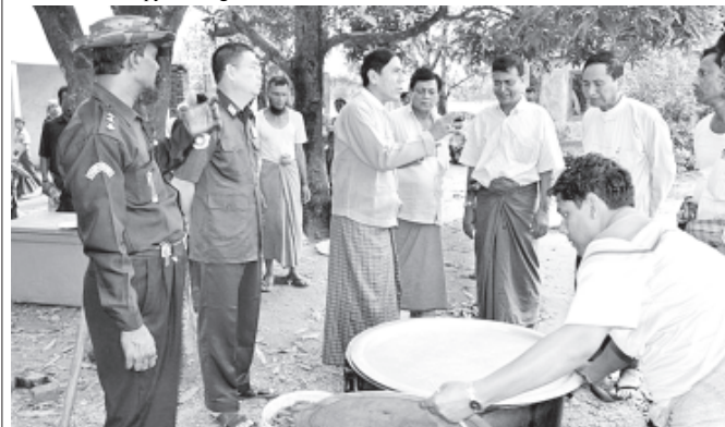
Rakhine State Chief Minister U Hla Maung Tin inspects cooking of rice to be provided to households at relief camps in Thetkalpyin Village in Sititway Township. —MNA