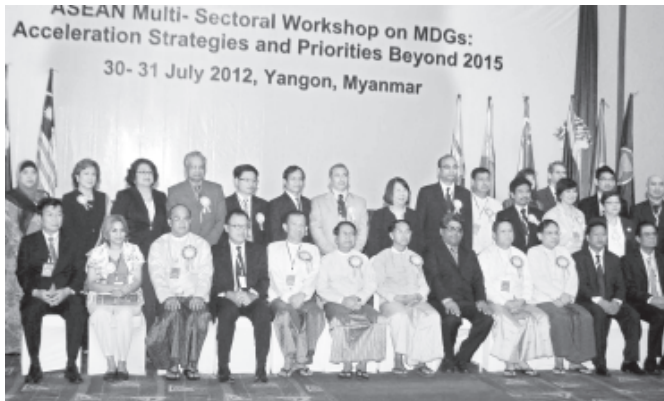
Chairman of ASEAN Socio-Cultural Community Council of Myanmar Union Minister for Information and for Culture U Kyaw Hsan and Chief Minister of Yangon Region U Myint Swe and those present pose for documentary photo.

YANGON, 30 July—ASEAN Multi-Sectoral Workshop on MDGs: Acceleration Strategies and Priorities Beyond 2015 was convened at Grand Ball Room of Sedona Hotel here this morning, with an address by Chairman of ASEAN Socio-Cultural Community Council of Myanmar Union Minister for Information and for Culture U Kyaw Hsan.