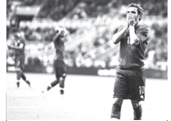
Spain's Juan Mata reacts after missing a chance to score against Honduras during their men's Group D football match in the London 2012 Olympic Games at St James' Park in Newcastle on 29 July, 2012.