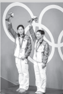
Wu Minxia (L) and He Zi of China wave to spectators at the awarding ceremony of women's synchronised 3m springboard final of the London 2012 Olympic Games in London, Britain, on 29 July, 2012. The Chinese divers claimed the title with 346.20.