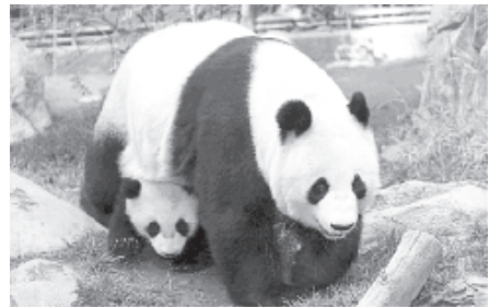
Twenty-year-old San Diego Zoo panda Bai Yun gave birth to a brand-new cub today, her sixth. Here, she is seen three years ago with her last cub, Yun Zi.