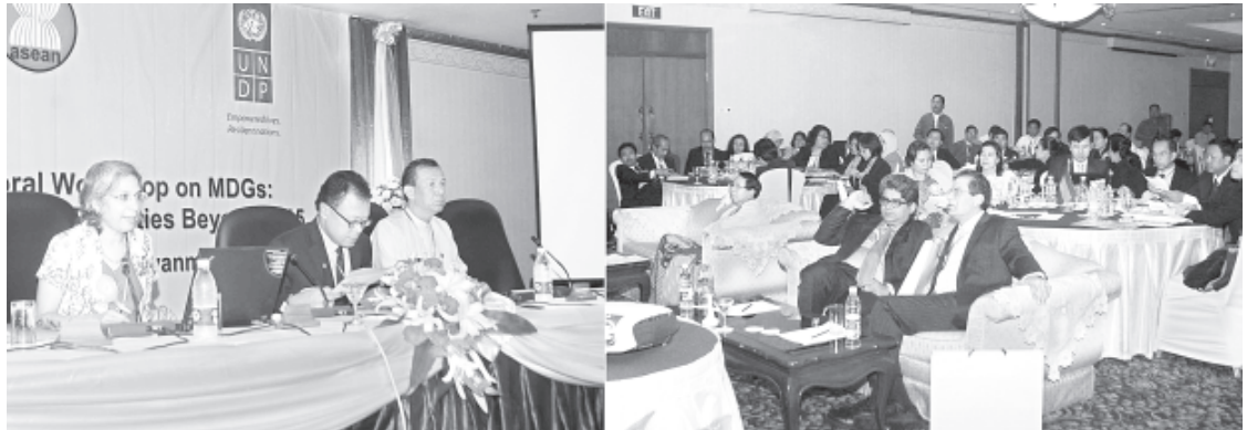
Chairman of ASEAN Socio-Cultural Community Council of Myanmar Union Minister for Information and for Culture U Kyaw Hsan at ASEAN Multi-Sectoral Workshop on MDGs: Acceleration Strategies and Priorities Beyond 2015.

The first session of the workshop was convened at 10.30 am, chaired by the deputy secretary-general of the ASEAN Secretariat.