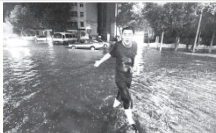
A pedestrian walks on a flooded road in Yinchuan, capital of Ningxia Hui Autonomous Region, on 30 July, 2012. A downpour hit the city on Sunday evening and caused the urban waterlogging and the torrential flood along the Helan Mountain.

Traditionally, US voters have backed generous pay and benefits for the cops and firefighters willing to risk their lives to keep citizens safe. That was especially so after the deaths of many emergency workers in the 11 September, 2001, attack on the World Trade Center in New York.— Reuters