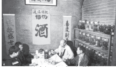
A typical rice wine shop in China.

Two of the five workmates responsible for the