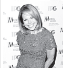
Comedienne and actress Kathy Griffin.

Guests on Season 1 include Jane Fonda, Anderson Cooper, Sharon