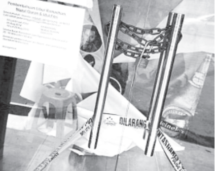
A police cordon hangs across the doors of the locked De Most bar in Jakarta on 30 July, 2012.