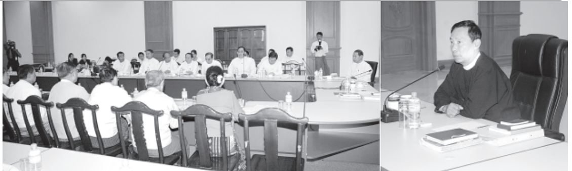
Pyithu Hluttaw Speaker Thura U Shwe Mann delivers an address at the coordination meeting of committees and commission.

The Pyithu Hluttaw Speaker noted that the four permanent committees could be formed since the Hluttaw had come into operation, calling for