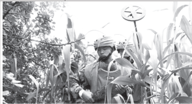
Two members of China's eighth peacekeeping sapper unit to Lebanon carry out a bomb disposal task at the Lebanese side of the Lebanon-Israel border, about a year ago. Over the two decades since it sent its first peacekeeping troop to Cambodia in April 1992, China has participated in more than 20 UN peacekeeping missions, dispatching a total of 20,000 soldiers. There are now nearly 2,000 Chinese peacekeepers carrying out their tasks in 12 peacekeeping missions. Chinese peacekeeping troops are formed by members of the People's Liberation Army (PLA), which will celebrate its 85th founding anniversary on 1 August, 2012.—XINHUA

"An investigation is currently underway to confirm what has exactly caused the automatic shutdown of the reactor," an official from the KHNP was quoted by Yonhap news agency as saying. There was no release of radioactivity and the safety of the nuclear power plant showed no major problems.—Xinhua