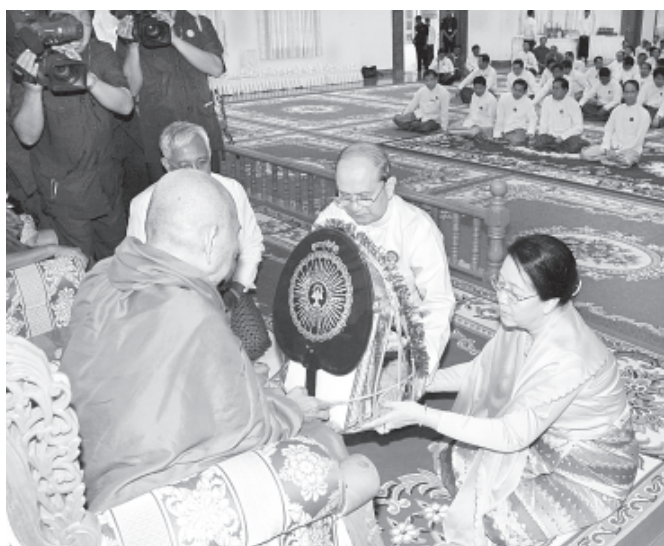
President of the Republic of the Union of Myanmar U Thein Sein and wife Daw Khin Khin Win offer Waso Robe to the Chairman of State Sangha Maha Nayaka Committee Abbot of Bhamo Monastery of Mandalay.

Next, President U Thein Sein and wife Daw Khin Khin