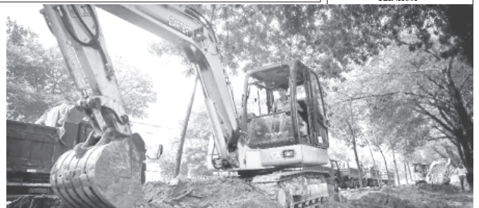
An excavator works at a greenbelt in Beijing, capital of China, on 27 July, 2012. The city is on guard against heavy rain, which has been forecasted over the coming days. XINHUA