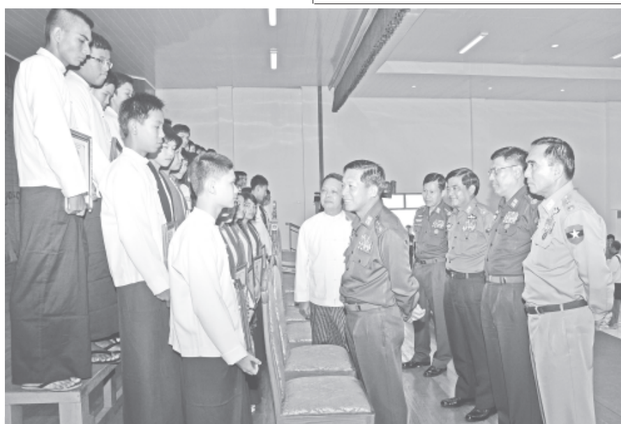
Patron of Myanmar War Veterans Organization Commander-in-Chief of Defence Services Vice-Senior General Min Aung Hlaing cordially greets WVO members' offsprings who passed 2011-2012 matriculation exam with flying colours.