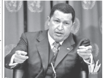
Venezuelan President Hugo Chavez

The summit will also mark Chavez's first official trip abroad since his battle with cancer began last year. He declared on 11 May that he had fully recovered from the disease, which required several trips to Cuba for surgery and radiation therapy treatment. — Xinhua