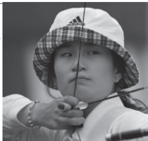
South Korea's Ki Bo-bae takes aim during the women's archery individual ranking round of the London 2012 Olympics Games at the Lords Cricket Ground in London on 27 July, 2012.