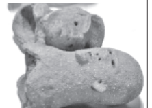
Two of the figurines American officials formally returned to the Nigerian government on 27 July. These roughly 2,000-year-old sculptures are the work of the Nok culture and were stolen from the Nigerian national museum.

On display for the ceremony were seven pieces of figurines, which resembled bits of cylindrical gingerbread men thanks to the orange hue of the terracotta. The two best preserved pieces, a head and torso, and a pair of legs standing on a pedestal, appeared to have once belonged to a single figure.