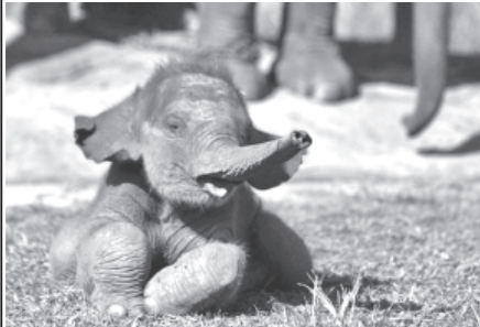
A sixteen day old baby elephant enjoys sun at an elephant breeding centre in Sauraha in Chitwan, about 170 kilometres (106 miles) south of Katmandu, Nepal.