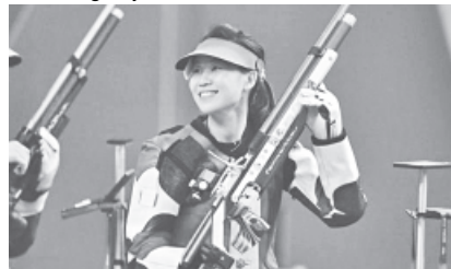
China's Yi Siling wins gold medal, the first gold medal for both the London 2012 Olympic Games and the Chinese delegation.

Yi 23, world No. 1 in the event, extended a stable and consistent performance in the final, shooting all her ten shots above 10 points and won the title in a deserved and convincing way.—Xinhua