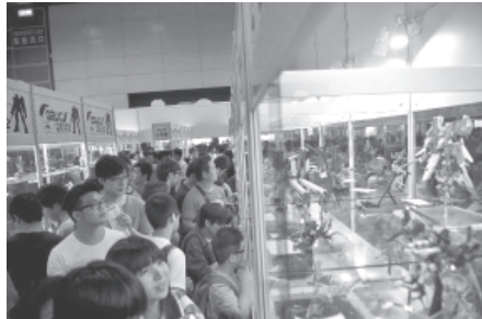
Visitors attend the 14th Ani-Com & Games Hong Kong in south China's Hong Kong, on 27 July, 2012. The 14th Ani-Com & Games Hong Kong (ACGHK) opened in Hong Kong on Friday, attracting some 170 exhibitors.—XINHUA

The Port of Busan, the country's largest, retained its fifth place in the world in terms of container cargo handling, with an increase of 8.4 percent to 8.53 million TEUs.—Xinhua