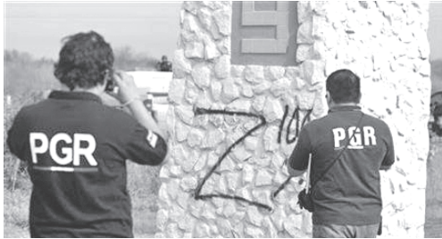
Federal agents take photographs of a sprayed "Z", the symbol of Zetas drug cartel, on a pillar at a crime scene in the municipality of Cadereyta on 13 May, 2012.