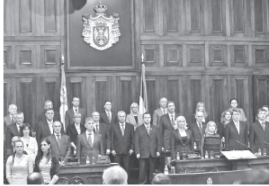
Members of the new cabinet of Serbia attend the swearing-in ceremony in Belgrade on 27 July, 2012. Serbian parliament on Friday voted to approve the government led by Ivica Dacic.