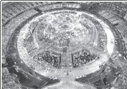
Athletes of participating countries stand in the middle of the Olympic Stadium during the athletes parade at the opening ceremony of the London 2012 Olympic Games, on 27 July, 2012.

LONDON, 28 July—The Queen declared the London Olympics open after playing a cameo role in a dizzying ceremony designed to highlight the grandeur and eccentricities of the nation that invented modern sport. Children's voices intertwining from the four corners of her United Kingdom ushered in an exuberant historical