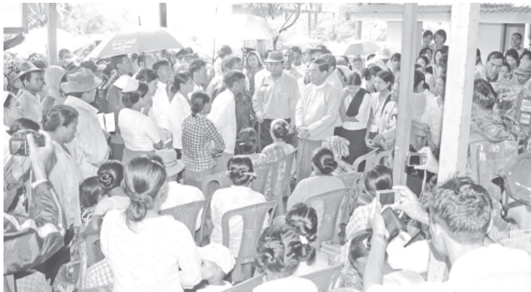
Union Minister at President Office Chairman of Nay Pyi Taw Council U Thein Nyunt inspects medical staff providing treatments to patients in Sipingyi Village of Zeyathiri Township.

NAY PYI TAW, 28 July—Accompanied by Member of Nay Pyi Taw Council U Kan Chun and Member of Nay Pyi Taw Development Committee U Myo Aung, Union Minister at the President Office Chairman of Nay Pyi Taw Council