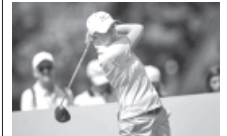
American Stacy Lewis, pictured on 26 July, birdied the final hole for a three-under-par 69 to retain the lead at the halfway stage of the Evian Masters here on Friday.