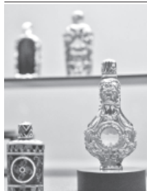
Photo taken on 25 July, 2012 shows various exquisite snuff bottles displayed in the Palace Museum in Taipei, southeast China's Taiwan. The exhibition "Lifting the Spirit and Body: The Art and Culture of Snuff Bottles" kicked off in Taipei Palace Museum on Wednesday. The display includes various snuff boxes and bottles as well as related paraphernalia, especially reflecting how the ancient Chinese court responded to the European fashion of snuff to create a unique culture of snuff bottles.