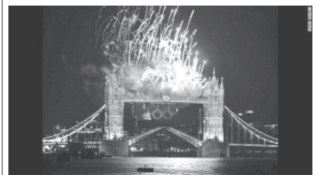
Fireworks light up Tower Bridge.