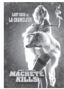
“Machete Kills” poster featuring Lady Gaga. From director Robert Rodriguez’s Twitter account.

“Yes it’s true, I will be making my debut as an actress in the amazing MACHETE KILLS BY @RODRIGUEZ IM SO EXCITED!!! AH! Filming was insane,” Lady Gaga said in a separate message.