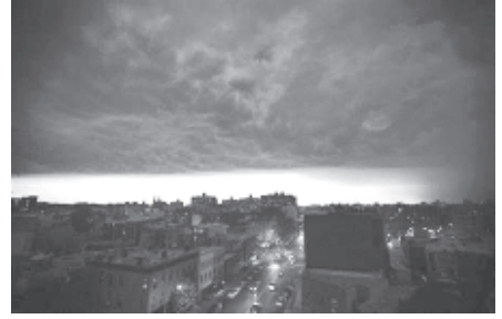
A storm cloud begins to dump rain as it passes over the Brooklyn borough of New York, on 26 July, 2012.

One two-story brick building had most of its second story torn off in the storm, and most power remained out for the city's 29,000 residents on Friday morning. Meteorologists said 70-mile-per-hour (113-kph) winds were reported in parts of Ohio, Kentucky, Pennsylvania and Oklahoma. As the storms sent black, menacing clouds across cities and open country, hail ranging from dime- to quarter-sized fell in some areas of Pennsylvania, AccuWeather.com said. By midday Friday,