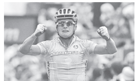
Alexandr Vinokurov of Kazakhstan celebrates crossing the finish line to win the men's Road Race Cycling on Day 1 of the London 2012 Olympic Games.