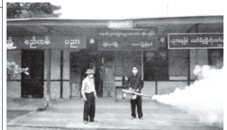
DHF PREVENTED: With a view to ensuring prevention against dengue hemorrhagic fever, Health staff members fumigated at Basic Education High School No. 3 in Naungya A Ward of Loikaw on 3 July.

YAMETHIN, 28 July—A ceremony to present Htaik Thu San award to outstanding students, organized by KEC Education for 2011-2012 academic year, was held at the school in Kyaungbyugon Ward of Yamethin of Mandalay Region on 16 July afternoon. At the ceremony, the headmistress of Basic Education High School No. 1 and those present gave words of advice to students. After that, the chairman of Township Sangha Nayaka Committee and officials presented Htaik Thu San awards to the outstanding students.—Kyemon