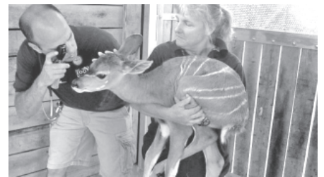
kudu, a baby giraffe and two fringe-eared oryx calves have

also been born at the zoo in the past two months.