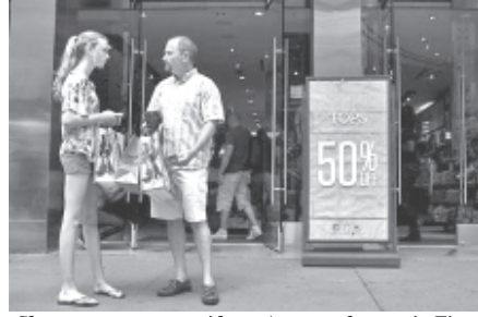
Shoppers are seen outside an Aeropostale store in Time Square in New York, on 27 July, 2012.

The ailing economy could cost President Barack Obama a second term in office when Americans vote in November. Obama's approval rating on his handling of the economy is slipping. An Ipsos/Thomson Reuters poll published last