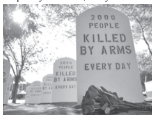
Campaigners for the Control Arms coalition set up a mock graveyard next to the United Nations building in New York, on 25 July, 2012.

The United States has also set preliminary duties on solar panels from China in another renewable energy case that has strained trade ties. Importers have to post bonds based on the preliminary rates while Commerce continues its investigation. A final decision on duty rates is expected by the end of the year.— Reuters