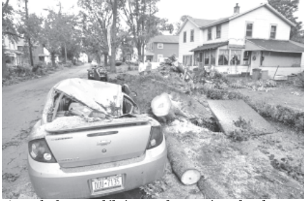
A crushed automobile is seen the morning after the town was hit by a tornado in Elmira, New York on 27 July, 2012.