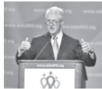
Former US President Bill Clinton delivers remarks at the XIX International AIDS Conference closing ceremony in Washington DC, the United States, on 27 July, 2012.

welcome but shouldn't lead the world's governments to curtail their search for a cure. "This optimism must not make us complacent," she said. "Even in difficult fiscal times, cutting back on our HIV/AIDS investments is a false economy that costs us more in the future." "Where there is scientific opportunity, there is a moral obligation to fund it," Pelosi said. "Where there are people in need of drugs and care — and communities in need of prevention — we have a moral obligation to provide it. And where there is discrimination, we have a moral obligation to continue to fight it." "HIV/AIDS is still adapting," she added, "So must we." The International