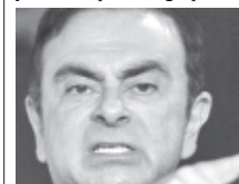
Chief executive Carlos Ghosn has vowed to make Nissan number one.