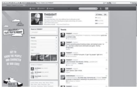
The Twitter page for Vermont Tourism is seen on 26 July, 2012. Copying Sweden, Vermont's tourism department has launched a new social media campaign that relies on its residents to tweet about why Vermont is a great place live, work and visit.

Nigeria has laws that control the export of Nok pieces; however, the sculptures have flooded out of the country. In the 1990s, so many reached the European art market that the prices dropped sharply, according to a New York Times article in 2000.