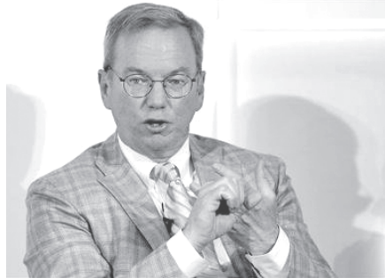
Google Executive Chairman Eric Schmidt speaks at the Global Investment Conference in London on 26 July, 2012.