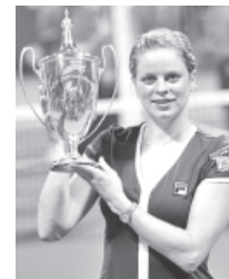
Belgium's Kim Clijsters