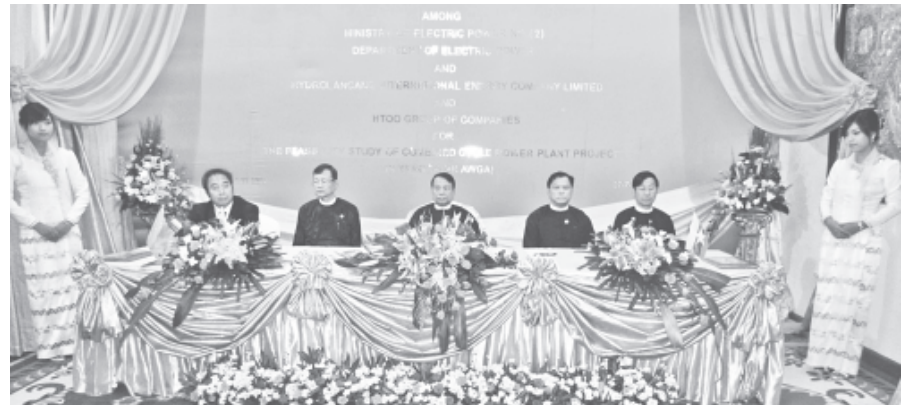
Signing ceremony of MoU on conducting feasibility study of natural gas and thermal power plant in Yangon (Hlawga) in progress.—MNA

The Union minister quoted the President saying as the incumbent government has managed to achieve remarkable success in political reforms and national