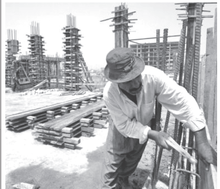
Iraqis work at a new construction site in Baghdad in 2008 as reconstruction efforts in the Iraqi capital continued despite the unstable situation in the war-torn country. At least 719 people participating in reconstruction projects financed by the United States in Iraq were killed during the conflict between 2003 and 2010, a US study revealed on Friday. — INTERNET

Zhang said. Guo Xiaoguang, China's cultural attaché in Hungary, lauded the exhibition, saying this "wonderful window will be open to the Hungarian public as well as the local Chinese community, and can provide an opportunity for Hungarians and Chinese people to better understand each other." The Xinhua Gallery was supported by the Asia Centre, a local commercial center hosting many businesses from China and elsewhere in Asia. — Xinhua