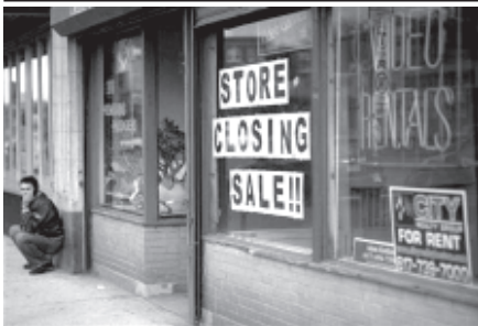
A man talks on his mobile phone outside a now closed store in the Allston neighborhood of Boston, Massachusetts recently.

NEW YORK, 28 July— Consumer sentiment fizzled in July, falling to its lowest level of the year, as Americans took a dim view of the employment situation and