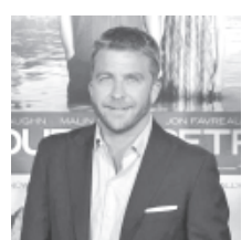
Director Peter Billingsley attends the premiere of his new motion picture comedy “Couples Retreat” in Los Angeles on 5 October, 2009.

The film’s original Ralphie, actor-producer Peter Billingsley, is producing the show.