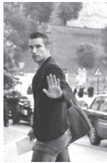
Arsenal manager Arsene Wenger claims the Premier League club have received no offers for captain Robin van Persie.

"I have talked about that, I am not talking about that question anymore. Do you understand? "If you understand and respect what I said, then why do you ask me again?"—Internet