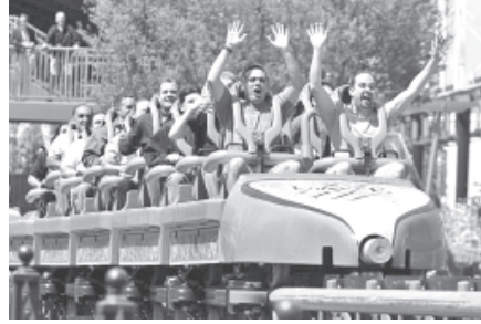
In this 19 May, 2005, file photograph, people cheer at the end of a ride on Six Flags Great Adventure’s roller coaster, Kingda Ka, in Jackson, NJ. A boy is recovering after he was hit in the face by a bird on 26 July, 2012.