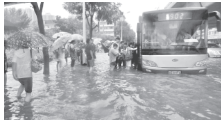
Commuters try to get on a bus on a flooded road following a heavy rain, in Tianjin, China on 26 July, 2012. Residents impatient for official updates compiled their own death tolls Thursday for last weekend's massive flooding in Beijing and snapped up survival gear following new forecasts of rain, reflecting deep mistrust of the government's handling of the disaster.—INTERNET

The coalition offered two possible reasons for the uptick. It says a shortened poppy harvesting season prompted insurgents to start their spring offensive earlier this year. Also, with more Afghan security forces on the ground and taking the lead in more operations, more of them are getting killed.—Internet