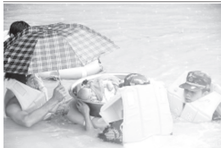
Fire fighters rescue a trapped baby with a bason in Xieqiao Village of Bijiang District in Tongren, southwest China's Guizhou Province, on 16 July, 2012. A rain-triggered flood hit the village on Monday, and rescuers have transferred all the six trapped persons.

Total trade in June grew by 2.8 percent year on year to 83 billion Singapore dollars.