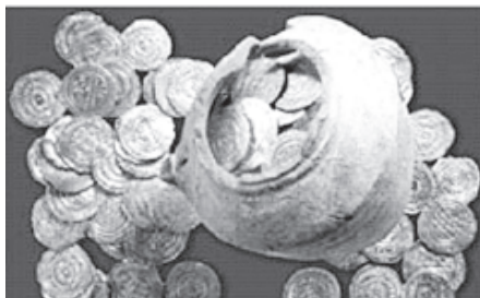
More than 100 gold coins were found hidden in a partly broken pottery vessel at the Apollonia National Park, where archaeologists say the former Crusader town of Apollonia-Arsuf once thrived.

JERUSALEM, 17 July— One of the largest gold treasures ever to be discovered in Israel was uncovered last week at an archaeological dig near Herzliya. The treasure, more than 100 gold pieces and weighing approximately 400 grams (nearly one pound), is estimated at a value of more than $100,000.