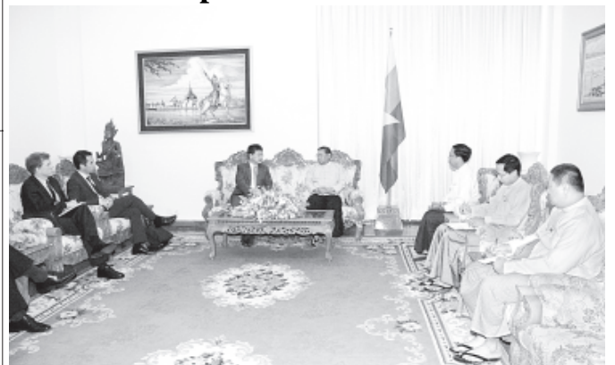
Union Minister for Foreign Affairs of the Republic of the Union of Myanmar U Wunna Maung Lwin meets Mr Joseph Y Yun of Deputy Assistant Secretary in the Bureau of East Asia and Pacific Affairs of US Department of State.