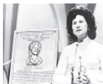
Kitty Wells is inducted into CMA's Country Music Hall of Fame in 1976 on the CMA Awards.