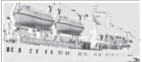
Xiangyanghong-9 ship which carries China's manned submersible Jiaolong arrives in Qingdao, east China's Shandong Province, on 16 July, 2012. China's manned submersible Jiaolong has successfully completed its programme of deep sea dives, with a sixth and final dive to 7,000 metres in the Mariana Trench in the Pacific Ocean on 30 June.