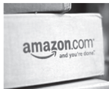
A box from Amazon.com is pictured on the porch of a house in Golden, Colorado on 23 July, 2008.

The company has a travel business, a securities