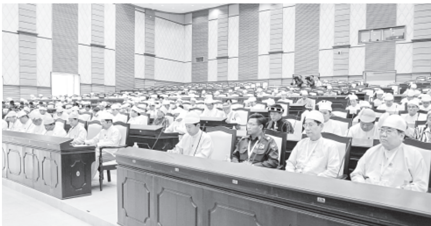
Amyotha Hluttaw representatives attend 10th day session of Amyotha Hluttaw.—MNA

Sending messages of condolence to flood-hit Russia and India agreed, six questions answered