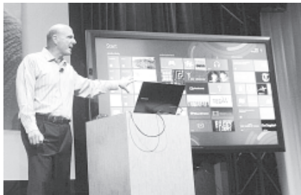
Microsoft CEO Steve Ballmer, Kirk Koenigbauer speaks at a Microsoft event in San Francisco, on 16 July, 2012. Microsoft unveiled a new version of its widely used, lucrative suite of word processing, spreadsheet and email programs on Monday, one designed specifically with tablet computers and Internet-based storage in mind.

SAN FRANCISCO, 17 July — New versions of Microsoft's word processing, spreadsheet and email programs will sport touch-based controls and emphasize Internet storage to reflect an industry-wide shift away from the company's strengths in desktop and laptop computers. The new offerings appear designed to help Microsoft retain an important source of revenue as more people access documents from mobile devices. The new Office suite also reflects the fact that people tend to work from multiple computers — perhaps a desktop in the office, a laptop at home and a tablet computer on a train and a smartphone at the doctor's office. Like an upcoming redesign of Microsoft's Windows operating system, the new Office will respond to touch as well as commands delivered on a computer keyboard or mouse. The addition of touch-based controls will enable Office to extend its franchise into the rapidly growing tablet computer market. Apple dominates that market with the iPad, though Microsoft