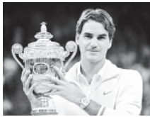
Seventeen-time Grand Slam champion Roger Federer