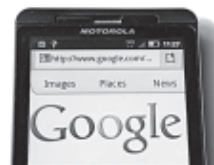
A Google homepage is displayed on a Motorola Droid phone in Washington on 15 Aug, 2011.