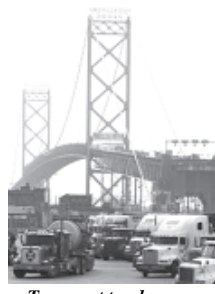
Transport trucks move slowly across the Ambassador Bridge into Detroit, Michigan from Windsor, Ontario, Canada in this file photo.