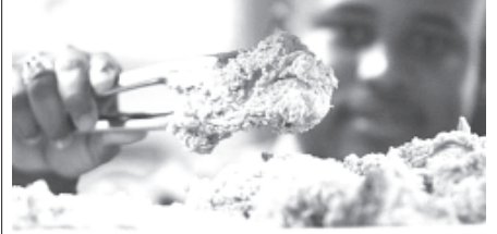
In this 30 Oct, 2006 file photo, a Kentucky Fried Chicken employee uses tongs to hold up a sample of the company's trans fat-free Extra Crispy fried chicken in New York.