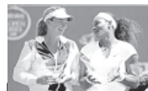
Coco Vandeweghe (L) and Serena Williams pose for photographers after their match during the final of the Bank of the West Classic at Stanford University Taube Family Tennis Stadium on 15 July, in Stanford, California.

The world number four is not in competition this week after winning Stanford and will soon head to Britain for the Summer Games, which open a week from Friday. "A gold medal would mean a lot to me, but I can't put all my hopes and dreams on just that," said the 30-year-old