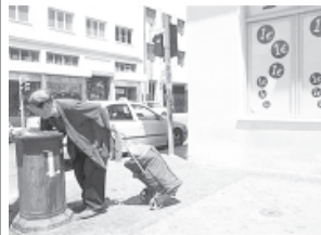
A man searches for food inside a garbage, in front of a One Euro shop in central Athens in this on 24 June, 2012 file photo.

WASHINGTON, 17 July — The International Monetary Fund on Monday cut its forecast for global economic growth and warned that the outlook could dim further if policymakers in the euro zone do not act with enough force and speed to quell their region's debt crisis. In a mid-year health check of the world economy, the IMF said emerging market nations, long a global bright spot, were being dragged down by the economic turmoil in Europe. It said a drop in exports in these countries would combine with earlier policies meant to prevent overheating and slow growth more sharply than hoped.