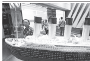
This file photo shows a visitor looking at the model of the original Titanic, displayed at an exhibition in Bangkok, in June.