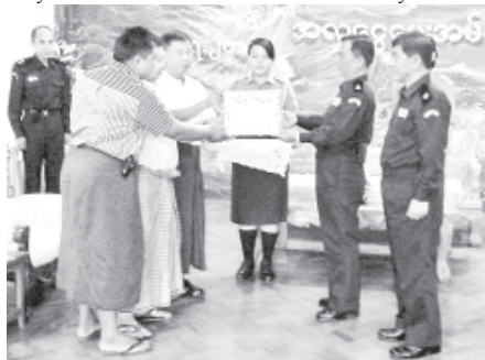
Wellwishers donate cash and foodstuff for locals of Rakhine State through officials.—MNA

Up to date, a total of donation amounted to K 292,571,523.—MNA