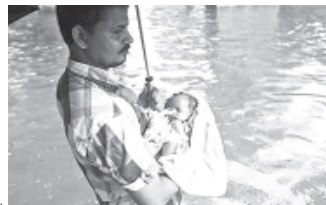
A father carries his newly-born baby as he takes his baby home from a maternity hospital, through a flooded street during "World Population Day" in Kolkata on 11 July, 2012.

make money on repairing of embankments and relief distribution." Over the past 60 years successive governments have built levees along most of the length of the volatile Brahmaputra, which is Assam's main river and is fed by Himalayan snow melt and some of the world's heaviest rainfall. Experts say these embankments are both criminally under-maintained and a discredited form of flood management.—Reuters