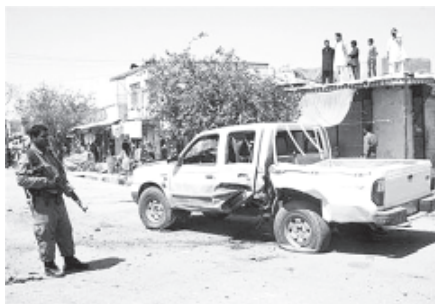
An Afghan policeman stands guard near the bomb-damaged vehicle of the district chief of Khan Abad in Kunduz Province on 16 July, 2012.

Afghanistan have jumped 10 percent in three months as a severe winter damaged poppy crop harvests and caused fighter-farmers to pick up guns earlier than last year, said German Brigadier-