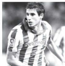
Athletic Bilbao midfielder Javi Martinez

"I spoke with [Sammer] on Friday," the former West Germany international