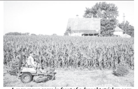
A man mows grass in front of a drought stricken corn field in Welton, Iowa on 12 July, 2012.

The USDA on Monday rated the corn crop—which had once been estimated to total a record 14 billion bushels this year—at only 31 percent good-to-excellent, down 9