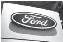
A Ford logo is seen on the car maker's booth during the first media day of the Geneva Auto Show at the Palexpo in Geneva, on 6 March, 2012

The Ford Falcon was once Australia's top-selling