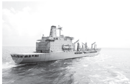
The US Navy supply ship USNS Rappahannock maintains station as it prepares a replenishment at sea in this US Navy photo handout photo taken in the South China Sea on 21 March, 2012.

On 28 July, a Rocket missile will be launched from the Plesetsk cosmodrome in northern Russia. On 15 Aug, a commercial sea launch was also scheduled.—Xinhua