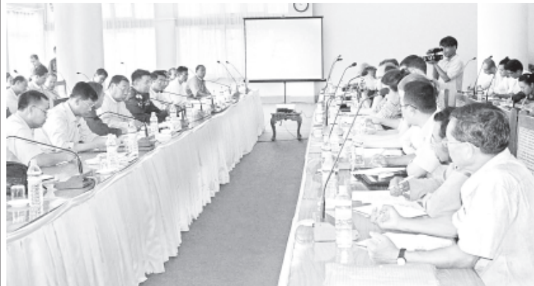
Union Minister for Border Affairs and for Myanma Industrial Development Lt-Gen Thein Htay attends coordination meeting on rehabilitation of displaced persons in Rakhine State.

NAY PYI TAW, 17 July—Union Minister for Border Affairs and for Myanma Industrial Development Lt-Gen Thein Htay, attended a coordination meeting on the rehabilitation of the displaced persons in Rakhine State, at Rakhine State Government Office in Sittway of Rakhine State, this morning.