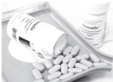
Bottles of antiretroviral drug Truvada are displayed in 2010 in San Anselmo, California. The first-ever daily pill to help prevent HIV infection was approved on day by US regulators for use by healthy adults who are at risk for getting the virus that causes AIDS.

heterosexual couples in which one partner was infected with HIV and the other was not showed that Truvada reduced the risk of becoming infected by 75 percent compared with a placebo. Common side effects were the same as experienced by people with HIV who were taking Truvada, and included diarrhea, nausea, abdominal pain, headache, and weight loss. However, the adherence rate — meaning how often people in the study actually took the drug daily — was low in the study of men who have sex with men, at just 30 percent, Birnkrant said. In the study of heterosexual partners, adherence was much higher, at between 80 and 90 percent.