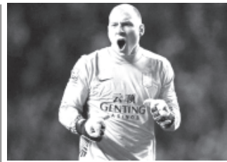
Brad Guzan moved to Aston Villa from Major League Soccer in 2008.