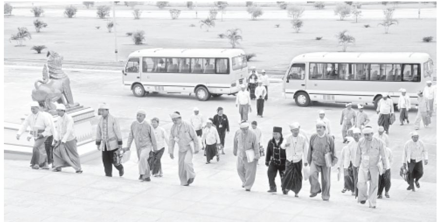
Pyithu Hluttaw representatives on arrival at Hluttaw.