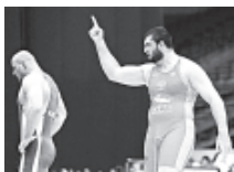
Russian Bilyal Makhov (R) celebrates his gold victory over Uzbek Artur Taymazov during the 120 kg freestyle final at the World Wrestling Championships in Moscow in 2010.

KRASNOYARSK, 17 July — Ahead of the 2008 Olympics in Beijing, life seemed golden for Russia's freestyle wrestling star Bilyal Makhov. A 1.94 metre tall man-mountain from the Caucasus, conquering all before him in the 125 kg weight division, Makhov was