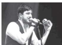
Marcus Mumford of British folk rock band Mumford and Sons performs at the Optimus Alive Festival in Alges, on the outskirts of Lisbon on 14 July, 2012.

"As a band, we've never been closer or more collaborative, all working to our strengths. And so we feel that this record is a natural progression that we're proud of, and we cannot wait to take