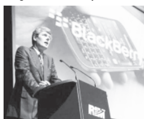
Research In Motion Limited (RIM) President and CEO Thorsten Heins speaks during the annual general meeting of shareholders in Waterloo on 10 July, 2012.

But Heins, who joined RIM from electronics giant Siemens AG four years ago and took over as CEO in January, expressed confidence that RIM was heading in the right direction. "I have assembled a leadership team for RIM that's truly capable of taking us into future," he told shareholders. RIM virtually invented mobile email with its first BlackBerry devices more than a decade ago, but its market share has evaporated as consumers flock to Apple Inc's iPhone and devices based on Google Inc's Android system.—Reuters