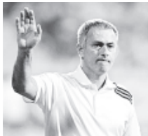
Real Madrid coach Jose Mourinho.

MADRID, 11 July — A two-match ban given to Real Madrid coach Jose Mourinho for poking Barcelona assistant Tito Vilanova in the eye has been lifted as part of a general amnesty, the Spanish soccer federation