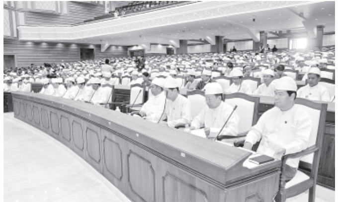
Representatives attending sixth day session of Pyithu Hluttaw.

Maung about nationwide planning for certain infrastructural development for townships within set period , six MPs discussed that smooth transportation and access to electricity speeds up the transportation and enhances the productivity, promoting economic performance, contributing to health, education and social areas. Studying the places with high number of human resources, it can be found that those regions are developed with economic growth and access to electricity and smooth transportation. It can be concluded that living standards in regions with access to electricity is relatively higher than regions without access to electricity. So, the government in office which is building the new nation should give priority to transportation and adequate supply of electricity rather than other sectors for equitable development of the entire nation, adopting related policies.