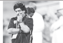
Argentinian football legend Diego Maradona, pictured in June 2012, was sacked as coach of United Arab Emirates side Al Wasl just over a year after he was appointed to the job, the club announced on Tuesday.

Al Wasl Football Team under the leadership of coach Diego Maradona, it was decided to terminate the services of coach Diego Maradona and his technical staff," a statement from the club said. Maradona—who as a player almost singlehandedly guided Argentina to the 1986 World Cup trophy and then to the 1990 final—had another year left on his contract. Internet