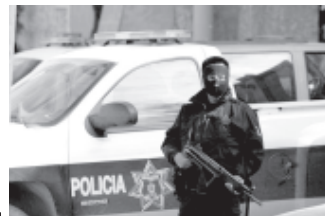
File picture shows a policeman on duty in Ciudad Juarez, Mexico.