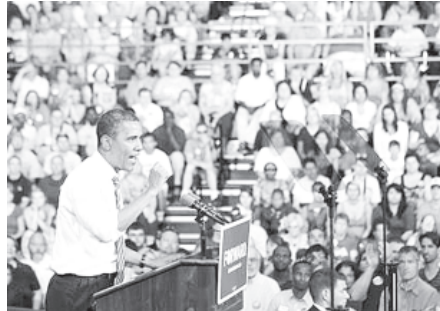
US President Barack Obama speaks during an event on extending the Bush-era tax cuts for middle class families at Kirkwood Community College in Cedar Rapids, Iowa, July 10, 2012.

The poll of 1,154 adults, including 885 registered voters, was taken between Thursday and Monday. During the period, a weak labour report was issued on Friday that showed sluggish job gains and an unchanged unemployment rate of 8.2 percent in June. It also followed a long-anticipated Supreme Court decision late last month upholding Obama's landmark healthcare overhaul. —Reuters