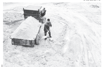
A labourer works at a site of a rare earth metals mine at Nancheng county, Jiangxi Province on 14 March, 2012.