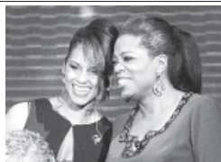
This 17 May, 2011 file photo shows singer Alicia Keys, left, and Oprah Winfrey during a taping of "Surprise Oprah! A Farewell Spectacular," in Chicago. Keys announced on 10 July, 2012 that her organization Keep a Child Alive will pay homage to Winfrey at its Black Ball event on 1 Nov. Winfrey's humanitarian efforts include the building of schools in South Africa.