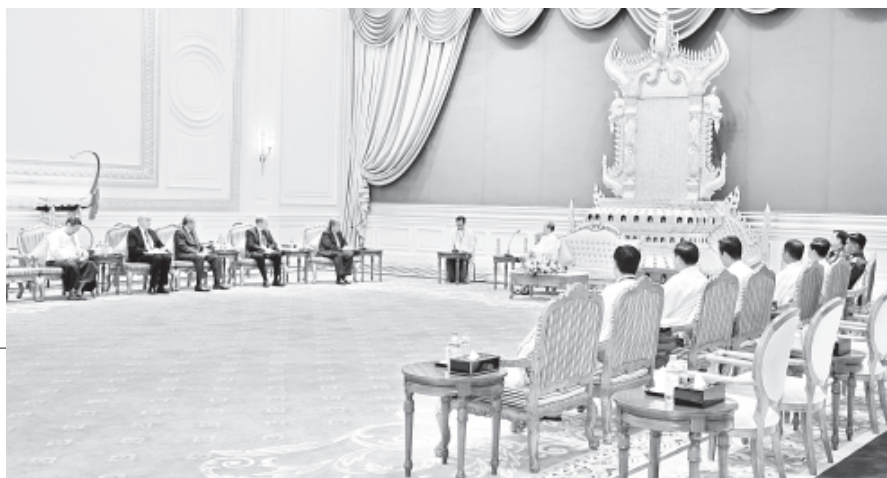
President of the Republic of the Union of Myanmar U Thein Sein receives United Nations High Commissioner for Refugees Mr Antonio Guterres and party at the Credentials Hall of the Presidential Palace.—MNA

At the call, they cordially discussed matters related to work programmes being jointly undertaken by Myanmar and UNHCR.—MNA