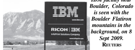
The sign at the IBM facility near Boulder, Colorado is seen with the Boulder Flatiron mountains in the background, on 8 Sept 2009.