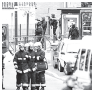
Special French RAID intervention police and firefighters secure a street where a man has taken an adult hostage in a school in Vitry-sur-Seine near Paris on 10 July, 2012.