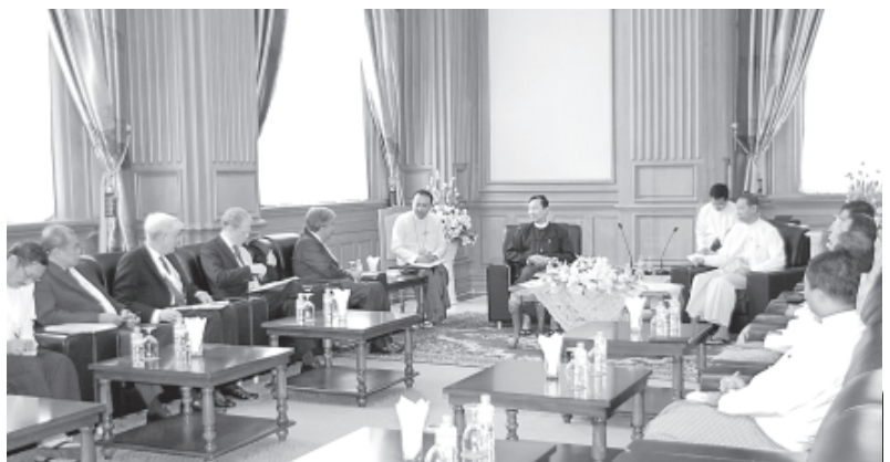
Speaker of Pyithu Hluttaw Thura U Shwe Mann receives a delegation led by United Nations High Commissioner for Refugees Mr Antonio Guterres at Pyithu Hluttaw Hall at Hluttaw Complex.—MNA