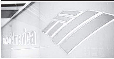
A Bank of America logo can be seen in a bank branch in New York on 28 April, 2009.