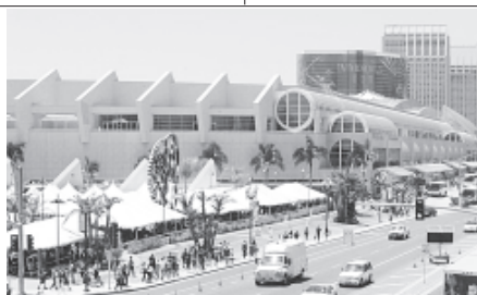
In this 22 July, 2011 file photo, fans are seen outside the San Diego Convention Centre during the second day of the Comic-Con International 2011 convention held in San Diego.