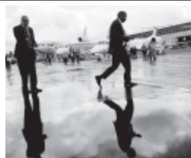
Businessmen walk across the tarmac in front of the single aisle jets on display during the second day at the Farnborough International Airshow in Hampshire, southern England.—INTERNET

According to the World Health Organization, some 5,217 people died in 2010 from road accidents.—Internet