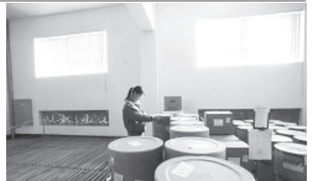
Barrels of artemisinin await processing into drugs in a warehouse in China in 2004.

Eight were found to be significantly under-dosed in