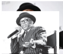
This 18 June, 2012 file photo shows director Spike Lee talks about his Broadway directorial debut "Mike Tyson: Undisputed Truth", a one man show starring Mike Tyson, in New York.

the 25th anniversary of the "Bad" album, Jackson's follow-up to "Thriller" that included hits like the title track, "Smooth Criminal," "The Way You Make Me Feel" and more. The album is being rereleased 18 Sept with additional tracks, a DVD and other bonus material; Lee's film is due to come out later this year, but no date has been set.—Internet