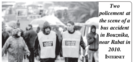
Two policemen at the scene of a bus accident in Bouznika, near Rabat in 2010.

By industry, the health and social welfare industry, which drove up the June job growth, created 91,000 jobs last month, with the science and technology service industry employing 78,000 workers.