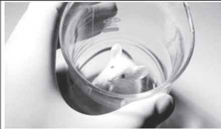
Hormone curbs depressive-like symptoms in stressed mice.—XINHUA