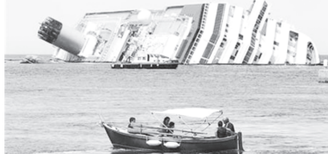
A boat sails past capsized cruise liner Costa Concordia near the harbour of Giglio Porto on 20 June, 2012.