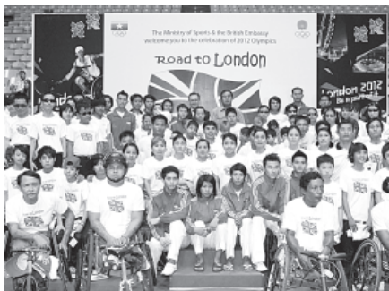
Attendees of Road to London pose for a documentary photo.

Archery Federation and Myanmar Taekwondo Federation made demonstrations. After that, London Olympics