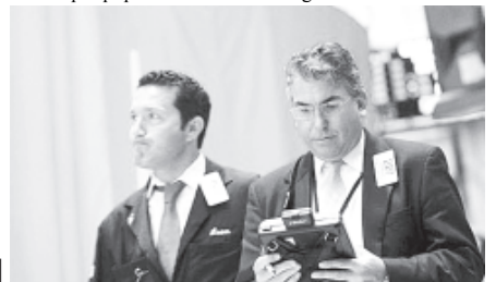
Traders work on the floor of the New York Stock Exchange, on 10 July, 2012.