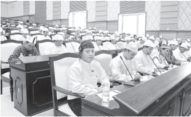
Photo shows representatives at sixth day session of Amyotha Hluttaw.

NAY PYI TAW, 11 July—Sixth day session of Amyotha Hluttaw continued at Amyotha Hluttaw Hall of Hluttaw Complex, at 10 am today, attended by Deputy Speaker of Amyotha Hluttaw U Mya Nyein and 203 representatives.