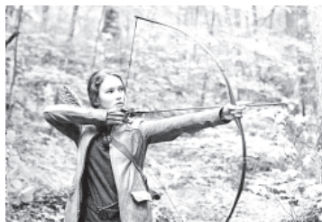
In this image released by Lionsgate, Jennifer Lawrence portrays Katniss Everdeen in a scene from "The Hunger Games," opening on 23 March, 2012.

LOS ANGELES, 11 July—The final book in "The Hunger Games" trilogy is coming to the big-screen in two parts starting in 2014.