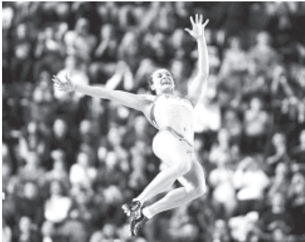
Russia's pole vaulting legend Yelena Isinbayaeva, pictured in March 2012, won on her first appearance at an open air athletics meeting this season here on Tuesday just under a month ahead of her bid for a third successive Olympic title.

Moscow, 11 July — Russia's pole vaulting legend Yelena Isinbayaeva won on her first appearance at an