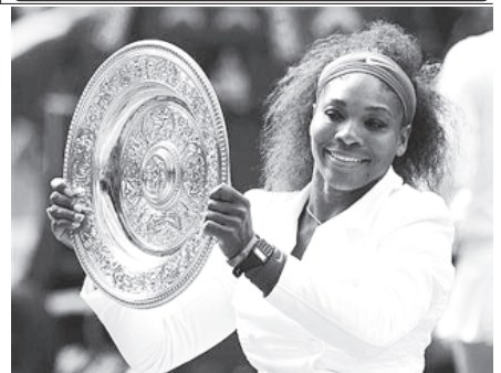
Serena Williams of the US holds her trophy after defeating Agnieszka Radwanska of Poland in their women's final tennis match at the Wimbledon tennis championships in London on 7 July, 2012.

Williams, 30, became the first woman in her 30s to win Wimbledon since Martina Navratilova won in 1990 at age 33. She admittedly did not go into 2012 Wimbledon with a lot of confidence as she had been stunned in the first round of the French Open by Virginie Razzano, the only time she had lost in the first round of a major in 47 attempts.— Internet