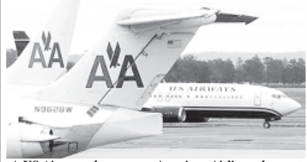
A US Airways plane passes American Airlines planes at Ronald Reagan National Airport in Washington on 23 April, 2012.