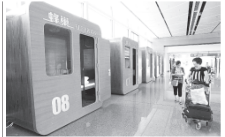
Passengers walk past mini sleepboxes at Xianyang International Airport in Xi'an, capital of northwest China's Shaanxi Province, on 10 July, 2012. Twenty mini sleepboxes were put into trial operation at the airport on Tuesday. The 2.7-meter-high sleepboxes covering about 3 square meters is equipped with a bed, a digital TV set, a computer desk, power sockets and wireless network, providing passengers and other personnel with resting places.—XINHUA

"It is evolutionary rather than revolutionary," Lewis told Reuters.—Reuters