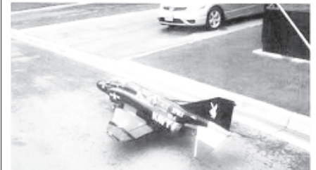
A scale model of a US Navy F-4 Phantom fighter plane is seen in a handout photo released by the US Justice Department after the photo was submitted to US District Court in Massachusetts as part of a criminal complaint and affidavit filed by the Federal Bureau of Investigation in Boston, on 28 September, 2011.