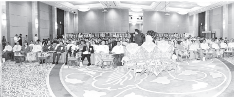
Vice-President Dr Sai Mauk Kham delivers an address at ceremony to mark World Population Day.

NAY PYI TAW, 11 July—Vice-President of the Republic of the Union of Myanmar Dr Sai Mauk Kham addressed World Population Day commemorative ceremony held at Thingaha Hotel here this morning.