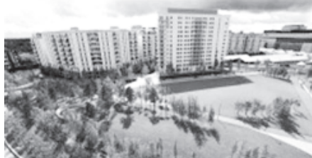
Victory Park in the Olympic Village, built for the London 2012 Olympic Games, is seen in Stratford, east London on 30 June, 2012.