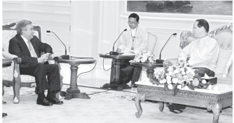
Vice-President Dr Sai Mauk Kham receives United Nations High Commissioner for Refugees Mr Antonio Guterres and party.