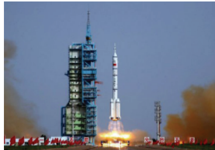
The Shenzhou-9 — China's fourth manned space mission — blasts off from the Jiuquan space base, northwest China's Gansu province in the remote Gobi desert.

"I would like to extend warm congratulations and sincere regards to all those participating," said Hu, adding the docking operation would mark a "major breakthrough in the country's manned space programme".