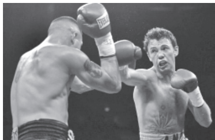
Irish southpaw Andy Lee (R), seen here in 2006, will fight for a world title for the first time in his career on Saturday when he faces unbeaten World Boxing Council middleweight champion Julio Cesar Chavez Jr.