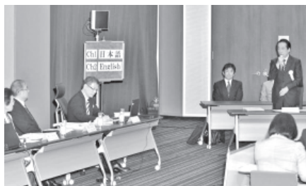
Japan's former Prime Minister Naoto Kan appears as a witness at a commission meeting of the National Diet of Japan Fukushima Nuclear Accident Independent Investigation Commission (ANIIC) in Tokyo, Japan, on 28 May, 2012.