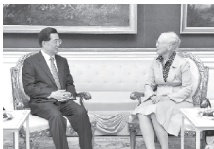
Chinese President Hu Jintao (L) meets with Danish Queen Margrethe II in Copenhagen, capital of Denmark, on 15 June, 2012.

COPENHAGEN, 16 June—Visiting Chinese President Hu Jintao undertook a number of official engagements here on Friday during his first state visit to Denmark. The visit, the first by a Chinese head of state since the two countries established diplomatic ties 62 years ago, served to further advance the comprehensive strategic partnership between the two countries. It has also brought about fresh opportunities for cooperation, with a raft of trade deals being signed here between enterprises of the two countries. On Friday, Hu and his wife Liu Yongqing paid a courtesy call to Denmark's Queen Margrethe II and her husband Prince Consort Henrik at Amalienborg Castle, the Queen's official residence. During the meeting, Hu and the Danish royal couple discussed bilateral relations, agreeing