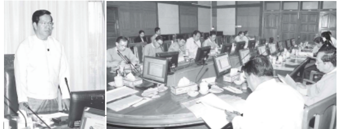
Union Minister for Finance and Revenue U Hla Tun addresses Stock Market Development Committee Meeting 1/2012 at Finance and Revenue Ministry.

In his speech, the Union Minister elaborated on securities exchange law, the core of healthy development of stock market. The Policy Research Institute (PRI) of the Finance Ministry of Japan had proposed to sign MoU to offer legal assistance. He called for earliest formation of working groups as MoU had been inked between Tokyo Stock Exchange and Daiwa Research Institute. He also