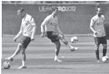
Portugal's Cristiano Ronaldo (C) controls the ball during a training session for the Euro 2012 at a training field in Opaenica on 15 June, 2012.

Bert van Marwijk's team are set to follow a curious trend in which beaten World Cup finalists exit the following European Championship at the group stage. It happened to the Dutch themselves in 1980, West Germany in 1984, Italy in 1996, Germany in 2004 and France in 2008.