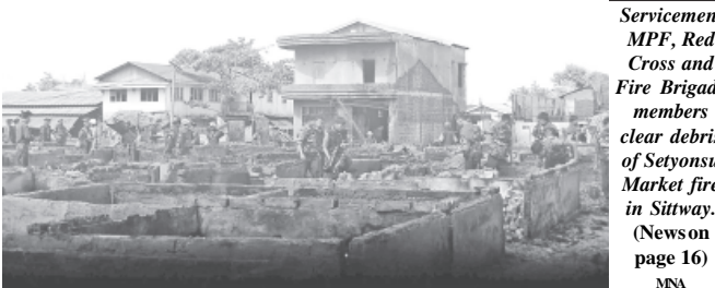
Servicemen, MPF, Red Cross and Fire Brigade members clear debris of Setyonsu Market fire in Sitwaw. (News on page 16) MNA

Those wishing to take part in the tournament mat dial 661702, 092037671 and 0973130474 and Myanmar Golf Club, not later than 3 pm on 20 June.—MNA