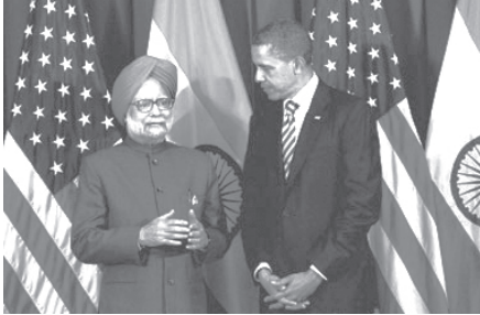
US President Barack Obama and Prime Minister Manmohan Singh.

WASHINGTON, 16 June—White House said. In a readout of their telephone call before the G20 meeting in Mexico next week, the White House said the two leaders discussed “the importance of steps to strengthen the resilience of the global economy” with a focus on steps to lift growth.