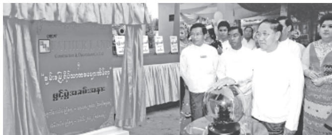
Yangon Region Chief Minister U Myint Swe unveils signboard of Chanmyay Yeiktha Home for Mothers for veteran film artistes.

YANGON, 16 June—Opening of the Chanmyay Yeiktha home for mothers of the Veteran Film Artistes was held at the home in Aungchantha Ward of Thanlyin Township this morning.