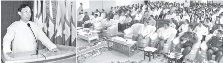
Pyithu Hluttaw Speaker Thura U Shwe Mann delivering an address at the meeting.

NAY PYI TAW, 16 June—Pyithu Hluttaw Speaker Thura U Shwe Mann addressed the prize presentation to outstanding students who matriculated with flying colours and teachers who managed to turn out such students at Zeyathiri Township General Administration Department in Nay Pyi Taw Council Area this noon.