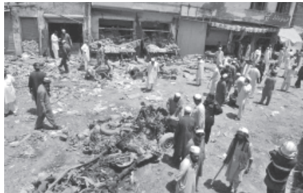
Pakistani security officials inspect the site of a bomb explosion in the main bazaar of Landi Kotal in Khyber tribal district. A car bomb ripped through a market area in a northwest Pakistan tribal town near the Afghan border, killing 25 people including three children.

Bagh's Lashkar-i-Islam group has links to Islamist militants and criminal gangs.