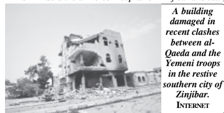
A building damaged in recent clashes between al-Qaeda and the Yemeni troops in the restive southern city of Zinjibar.