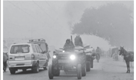
This file photo shows commuters driving on a busy road in India. At least 32 pilgrims were killed and more than 20 injured on Saturday when their bus plunged off a bridge in western India, the Press Trust of India (PTI) reported.

Twenty-four Hindu pilgrims were killed in May when their bus collided with a truck and fell into a fast-flowing river in northern India. Nearly 135,000 people or 366 a day died on India's roads in 2010, according to the National Crime Records Bureau.