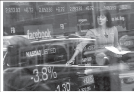
A television reporter talks about the Facebook stock at the NASDAQ MarketSite in New York’s Times Square on 22 May, 2012.

Officials from the G20 nations said that central banks were ready to take steps to stabilize financial markets by providing liquidity and prevent any credit squeeze after Sunday’s election.