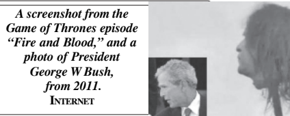
A screenshot from the Game of Thrones episode "Fire and Blood," and a photo of President George W. Bush, from 2011.