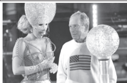
Lady Gaga and New York City Mayor Michael Bloomberg chat before pushing the button that will start the decent of the New Year's Eve crystal ball and ring in 2012 in Times Square on 1 January, 2012 in New York City.

From this darkness, the fragrance evolves to a sensual accord of opulence, a fusion of dripping honey, saffron and apricot nectar. And lastly, the light accord whispers magnificence. The rich floral layer of crushed Tiger Orchid and Jasmine Sambac embodies timeless beauty. The accords work together to create a fragrance of floral and fruity elements, with the star ingredient inspired by Belladonna