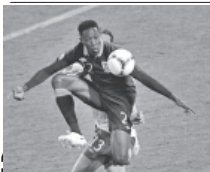
English forward Dany Welbeck jumps to control the ball during their Euro 2012 championships football match against Sweden at the Olympic Stadium in Kiev.

KIEV, 16 June — Theo Walcott finally got his chance at the European Championship, and he only needed three minutes to make it count. Walcott scored shortly after coming on as a substitute and then set up Danny Welbeck for a sublime