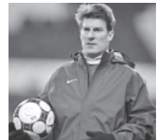
Michael Laudrup is regarded as one of the finest players to have come out of Europe.

LONDON, 16 June — Swansea City have appointed former Barcelona and Real Madrid playmaker Michael Laudrup as their new manager on a two-year contract. He succeeds Brendan Rodgers, who left the club to join Liverpool earlier this month, and takes the role on his 48th birthday. "I've spoken to the chairman and I'm very pleased to sign for Swansea City," Laudrup told the club's official website. "It's going to be a new experience for me and I'm really looking forward to it." I've spoken to many people about Swansea and watched a number of their games on DVD — with many more to watch!