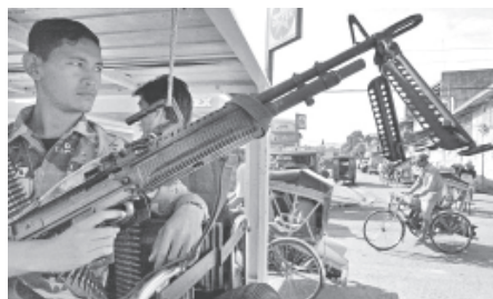
File photo shows heavily armed police on patrol in downtown Jolo, a remote Philippine island notorious for Islamist militants and kidnappings.