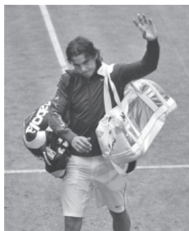
Rafael Nadal of Spain leaves the field after his match against Philipp Kohlschreiber of Germany at the Halle Open ATP tennis tournament in Halle on 15 June, 2012.

Federer was taken to the wire by big-serving Canadian Raonic, losing the first set before coming through 6-7, 6-4, 7-6. Raonic served 25 aces but that was not enough to halt the Swiss's march into the last four where