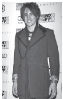
Reeve Carney arrives for the 48th New York Film Festival Premiere of "The Tempest" at Alice Tully Hall at Lincoln Centre in New York on 2 October, 2010.