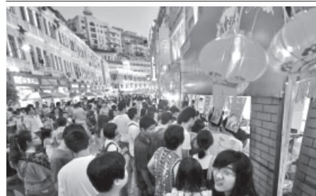
Visitors tour a Taipie-style temple fair in Xiamen, southeast China's Fujian Province, on 15 June, 2012. The temple fair is part of the fourth Straits Forum, which will be held in Xiamen from June 16 to 22. Visitors will have access to cuisines, specialties and creative products from Taipie at the temple fair.