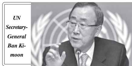
UN Secretary-General Ban Ki-moon