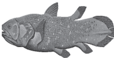
A fish dubbed a "living fossil" that hasn't changed fundamentally for 400 million years is still able to genetically adapt to its environment, researchers say.