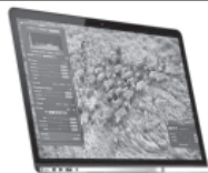
The newest MacBook Pro with Retina display merits a 1 on a 10-point repair scale and is nearly impossible to fix or upgrade, a popular tech Web site says.

The laptop's RAM is soldered to the logic board, the solid-state drive isn't upgradeable, the lithium-polymer battery is glued rather than screwed into the case and even the screws that hold the unit together are a proprietary design requiring a special screwdriver, they said. "Apple has packed