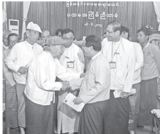
Union Minister U Kyaw Hsan cordially greets those present at First Conference of Myanmar Writers Association.

He also acknowledged the efforts of the committee for forming Myanmar Writers Association for drafting the constitution and principles of the association within a short time. The union minister expressed his delight saying that the first conference of the