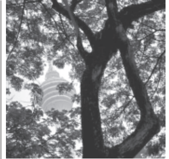
Kuala Lumpur Tower is seen through haze, on 15 June. Haze caused by forest fires in neighbouring Indonesia blanketed parts of Malaysia including Kuala Lumpur, causing air pollution to hit unhealthy levels.

On 15 Sept, 2010, the US filed the case to WTO and requested a consultation with China. The US requested the establishment of a panel on 11 Feb, 2011, which then was established on 25 March, 2011. The product, grain oriented flat-rolled electrical steel, is mainly used in the manufacturing of transformers, reactors and generators.— Xinhua