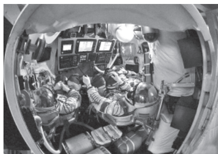
This undated photo shows three taikonauts Jing Haipeng (C), Liu Wang (R) and Liu Yang attending a training in a capsule simulating the re-entry one of the Shenzhou-9 spaceship. They will be carried by the Shenzhou-9 spaceship for China's first manned space docking mission with the orbiting Tiangong-1 space lab module.