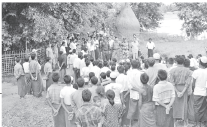
Union Minister for Border Affairs and Myanmar Industrial Development Lt-Gen Thein Htay meets Bengali villagers in Khamaungseik Village.

The minister met representatives of ethnic (See page 8)