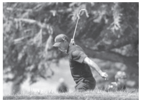
Tiger Woods of the US reacts after hitting from the edge of a bunker on the sixth green during the second round of the 2012 US Open golf tournament on the Lake Course at the Olympic Club in San Francisco, California on 15 June, 2012.

SAN FRANCISCO, 16 June — Tiger Woods charged into a share of the lead in the second round of the US Open on Friday as Rory McIlroy's title defence collapsed on another brutal day at the Olympic Club. Woods had the galleries buzzing with anticipation that his major championship drought was about to end as he conjured up all his old magic to tame the notoriously difficult course and join Jim Furyk and David Toms in a three-way tie for the lead at one-under par 139.