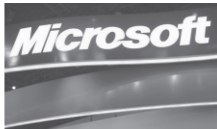
A sign hangs at the Microsoft booth at the annual Consumer Electronics Show (CES) in Las Vegas, Nevada on 9 Jan, 2009.

It says it counts more than 80 percent of Fortune 500 companies as clients, and is backed by PayPal co-founder Peter Thiel, who also invested in Facebook (FB O).—Reuters