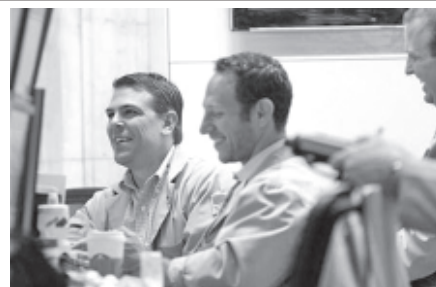
Traders work on the floor of the New York Stock Exchange on 11 June, 2012.