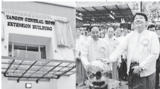
Union Health Minister Dr Pe Thet Khin and Yangon Region Chief Minister U Myint Swe unveil signboard of new 50-bed ward.

NAY PYI TAW, 3 June—The new 50-bed ward of Yangon General Hospital was commissioned into service yesterday morning, formally opened by Yangon Region Social Affairs Minister Dr Myint Thein, Director Dr Htay Naung of Health Department and main