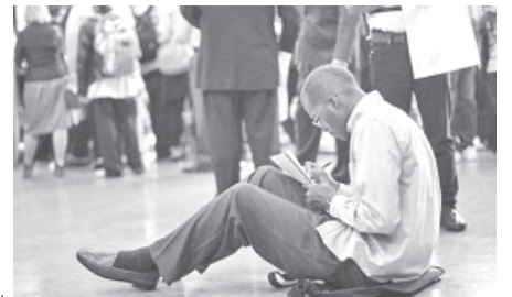
A job seeker fills out an application during 11th annual Skid Row Career Fair the Los Angeles Mission in Los Angeles, on 31 May, 2012.

try to shrink their own debts. The result is smaller budgets for schools, transportation projects and services. Companies also complain that changes in environmental regulations and business subsidies are too hard to predict and plan for.