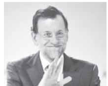
Spain's Prime Minister Mariano Rajoy gestures during the XXVIII Meeting of the Economic Circle "Cercle D'economia" in Sitges, near Barcelona on 2 June, 2012.