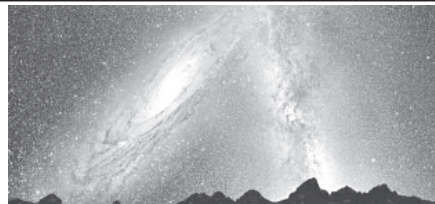
This illustration shows a stage in the predicted merger between our Milky Way galaxy and the neighbouring Andromeda galaxy.

“After nearly a century of speculation about the future destiny of Andromeda and our Milky Way, we at last have a