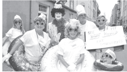
Dressed as doughnuts, Mardi Gras revelers calling themselves the Krewe of Krispy Kreme roam New Orleans' historic French Quarter during the city's pre-Lenten party.

The holiday was started by the Salvation Army in 1938 to honour volunteers who handed out doughnuts to soldiers on the front lines during World War I.