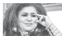
Indian cosmetics businesswoman Shahnaz Husain speaks during an interview in New Delhi.

NEW DELHI, 3 June—Shahnaz Husain was a bored Indian housewife when she spotted a gap in the beauty-treatment market and single-handedly set about building a global corporate empire.