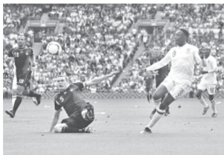
Manchester United's Danny Welbeck scored the only goal with a well-judged chip.— INTERNET

The visitors continued to play flowing football after the interval and full-back Guillaume Gillet clattered the outside of Joe Hart's post with a fine long-range effort 12 minutes from full-time as Belgium pushed forward in search of an equaliser. Substitute Jermain Defoe also hit the woodwork for England minutes later as England held on for their second 1-0 victory in a week. They play their first Euro 2012 group match against France in Donetsk on 11 June.— Internet