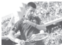
Djokovic showed plenty of heart to recover from two sets down.

PARIS, 3 June—Roger Federer reached his 32nd consecutive grand slam quarter-final and world No.1 Novak Djokovic survived