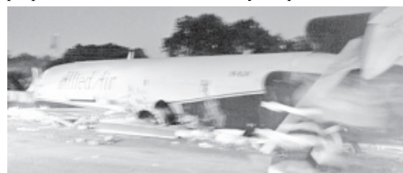
Rescuers work at the site of plane crash in Accra, Ghana, on 2 June, 2012. A cargo plane crashed outside the El Wak Stadium, less than 10 km from the Accra airport in the capital of Ghana, around 8 pm local time on Saturday. — XINHUA

However, one military soldier who is unwilling to be named at the scene told Xinhua that there are 24 people in the passenger bus which started from 37 military Lary Park station and that all them died in the accident. The reason why the plane was crashed is not clear, but on Saturday it was raining in Accra, and the visibility was not good. Ambulances are at the scene which is cordoned off by the police. — Xinhua