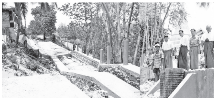
Mon State Social Affairs Minister Dr Hla Oo looked into progress in construction of the 200 feet long and 14 feet wide motor road in the precinct of U Zina Pagoda in Pabedan Ward, Mawlamyine on 27 April.—MNA