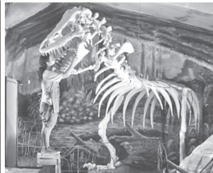
An installation artist puts final touches on the new exhibit of a replica of a Tyrannosaurus rex skeleton inside a crocodile farm in Pasay city, metro Manila on 2 June, 2012.

The new allegation involves an incident from February, the month before the mass shooting, in which Bales is accused of using his hands and knees to "unlawfully strike" a male Afghan whose name is unknown, according to the charging documents. Bales is also accused of destroying a laptop computer. — Reuters