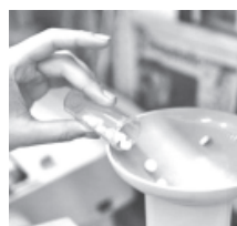
The study involved 361 women whose cancer had stopped responding to traditional platinum-based chemotherapy.

Avastin, developed by Roche's Genentech unit, is an antibody that blocks the growth of blood vessels tumors need to survive and grow. It is approved in the US for treating glioblastoma,