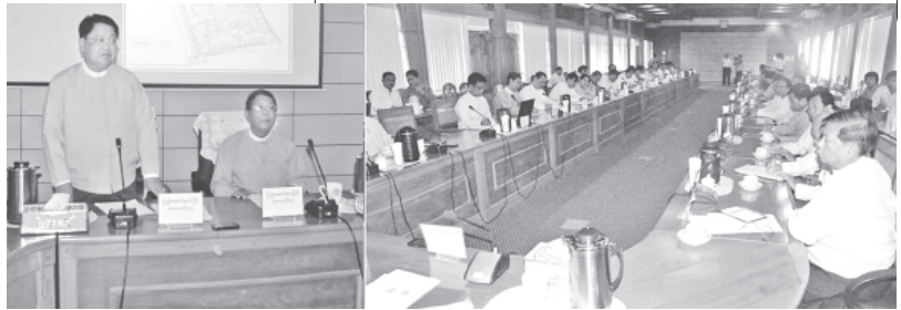
Union Minister U Tint Hsan speaking at meeting on proposal of Sports Ministry for upgrading tennis courts.—MNA

The Sports Ministry would assist the Education Ministry in upgrading the tennis courts and