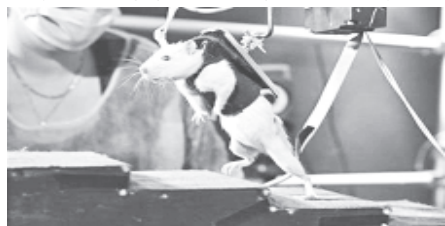
An undated handout photo provided by the Swiss Federal Institute of Technology (EPFL) on 31 May, 2012, shows a rat walking on its hind legs during an experiment at the Centre for Neuroprosthetics and Brain Mind Institute in Ecublens.