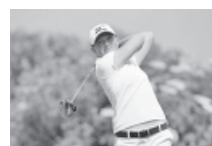
Stacy Lewis hits her tee shot on the 13th hole during the second round of the ShopRite LPGA Classic on the Bay Course at Seaview Resort in Galloway, New Jersey.

Lewis had a comfortable cushion in the 54-hole event over Sweden's Anna Nordqvist, who posted a four-under 67 for 136. Nordqvist's six birdies included three in a row from the 11th. Paula Creamer and So Yeon Ryu, the last two winners of the US women's Open, were in a group on 137.