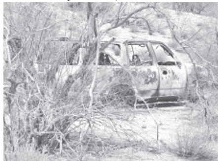
Pinal County, Arizona, Sheriff's photograph shows a burnt SUV which had bodies of five people burned beyond recognition in Vekol Valley is about 35 miles south of Phoenix, Arizona in this 2 June, 2012 photograph.

Early on Saturday, US Border Patrol agents spotted a white Ford Explorer in the area that was parked off the side of Interstate 8, Babeu said. When the agents tried to approach the sport utility vehicle, its driver sped away into the darkness and the agents lost track of it and issued a request for other law enforcement to look for the SUV, Babeu said. After dawn, Border Patrol agents found tracks from the vehicle that led into the desert away from Interstate 8, and they followed those markings to arrive at the smoldering SUV. Inside the rear bed of the SUV and the back seat were the bodies of five people who had evidently been killed, Babeu said.