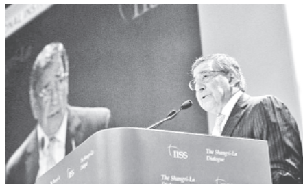
US Defence Secretary Leon Panetta speaks at the Shangri-La Dialogue held in Singapore on 2 June, 2012.

SINGAPORE, 3 June — The United States will try to improve the strategic trust with China by strengthening military-to-military exchanges, while shifting some of its warships to the Pacific over the coming years,