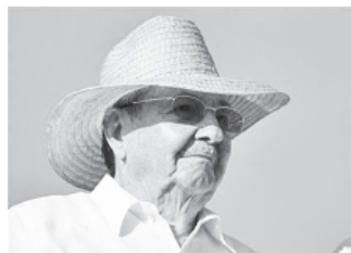
Cuba's President Raul Castro attends the May Day parade in Havana's Revolution Square on 1 May, 2012.