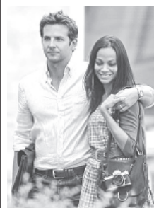
Actors Bradley Cooper and Zoe Saldana

NEW YORK, 3 June—Actors Bradley Cooper and Zoe Saldana have reportedly rekindled their love affair.