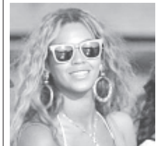
Singer Beyonce Knowles