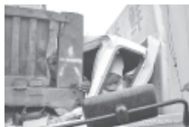
The truck driver is stuck in the cab after a traffic accident on the Shenhai Highway in Yancheng, east China's Jiangsu Province, on 3 June, 2012.

NANJING, 3 June—At least 11 people were dead and 19 others were injured, five seriously, in seven highway pileups caused by heavy fog that occurred Sunday morning in east China's Jiangsu Province.