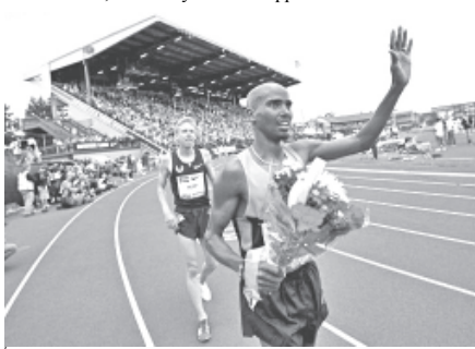
Mo Farah of Great Britain waves to the crowd after winning the 5000m at the Samsung Diamond League Prefontaine Classic at Hayward Field in Eugene, Oregon. Farah says he is targeting the 10,000 metres at the London Olympics and will wait to see how he feels before deciding whether to go for a double in the 5,000.