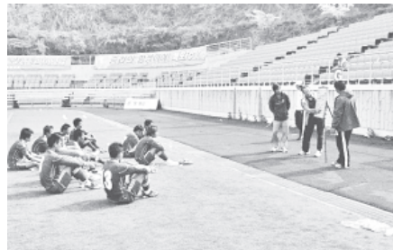
Myanmar U-22 team in training.

Maldives counterparts in Thailand on 17 and 19 May. The confirmed squad for the qualifier will be announced after the friendlies.