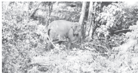
A wild Sumatran elephant walks in the Ulu Masen forest in western Indonesia. Three critically-endangered Sumatran elephants have been found dead in an oil palm plantation in western Indonesia and are believed to have been poisoned, an NGO said on Saturday.— INTERNET

elephant's status from "endangered" to "critically endangered" in January, largely due to severe habitat loss driven by oil palm and paper plantations. Conflicts between humans and animals are increasing as people encroach on wildlife habitats in Indonesia, an archipelago with some of the world's largest remaining tropical forests.— Internet