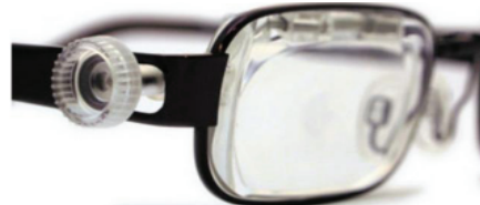
Photo shows new adjustable eyeglasses which enable wearers to adjust their own lens prescriptions by turning a knob until they can see clearly.