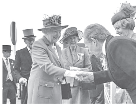
Britain's Queen Elizabeth shakes hands with a racegoer as she arrives with Prince Philip (2nd L) at the Epsom Derby festival in Epsom, southwest of London on 2 June, 2012. Queen Elizabeth gets four days of celebrations to mark her 60 years on the British throne under way on Saturday with one of her favourite pastimes, a trip to the horse races, as tributes to the long-serving monarch pour in.

LONDON, 3 June — A flotilla of 1,000 boats will sail London's River Thames on Sunday in a spectacular highlight of four days of nationwide celebrations marking Queen Elizabeth's 60 years on the throne.