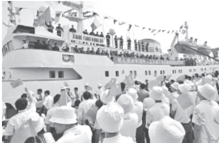
People see the " Xiangyanghong 09 " off in Jiangyin, east China's Jiangsu Province, on 3 June, 2012. The " Xiangyanghong 09 " scientific exploration ship, the mother ship of the Jiaolong, set off on Sunday for a 7,000-metre dive in the Mariana Trench region.