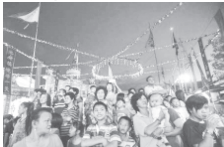
Residents gather during a prayer at a temple in Chinese village of Pulau Ketam, outside Kuala Lumpur on 17 May, 2012.

rival Singapore, in a troubling brain drain of talent and capital. "Malaysia needs talent to meet its goal of becoming a high-income country," the World Bank noted in a report last year.