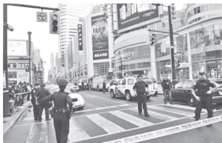
Police set up a perimeter outside the Eaton Centre shopping mall in Toronto, on 2 June, 2012. Panic broke out at the Eaton Centre Saturday after shots were fired at the downtown mall packed with weekend shoppers.

Swarms of people watched from outside as an injured man with visible bullet wounds was wheeled out on a stretcher. Toronto Blue Jays baseball player Brett Lawrie was