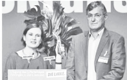
Katja Kipping (L) and Bernd Riexinger, new leaders of Germany's left wing Die Linke party, stand on stage after being elected at a federal party congress in Goettingen on 2 June, 2012.

unification. Why can't you accept that we're a major political force in the east? And in the west just a small splinter party? I can't understand that." —Reuters