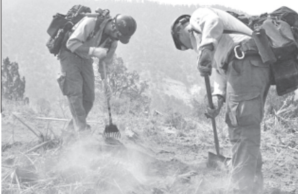
Firefighters from the Granite Mountain Hotshots of Prescott, Ariz., cut a fire line along a mountain ridge outside Mogollon, NM on 2 June, 2012.

ALBUQUERQUE, 3 June — A wall of smoke advances across a vast swath of rugged country in southwestern New Mexico where the nation's wilderness movement was born nearly a century ago.