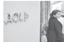
A woman walks out of AOL offices in New York, on 19 Nov, 2009.