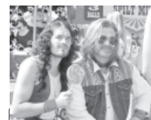
British comedian Russell Brand, co-star Alec Baldwin.