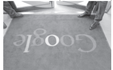
A Google carpet is seen at the entrance of the headquarters of Google France in Paris on 6 Dec 2011.

loss of market share threaten its future.