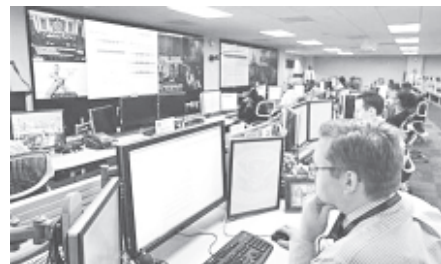
US Department of Homeland Security analysts work at the National Cybersecurity & Communications Integration Center (NCCIC) located just outside Washington in Arlington, Virginia on 24 Sept, 2010.