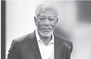
US actor Morgan Freeman receives his trophy for Category "International Lifetime Achievement" during the 47th Golden Camera award ceremony in Berlin on 4 Feb, 2012.

LOS ANGELES, 3 June—Oscar winner Morgan Freeman turns 75-years-old on 1 June, but he's not slowing down a bit. This summer he'll be seen in the blockbuster Batman movie "The Dark Knight Rises," and he is currently shooting sci-fi epic "Oblivion" with Tom Cruise.