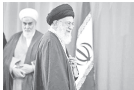
Iran's Supreme Leader Ayatollah Ali Khamenei departs after casting his ballot in the parliamentary election in Teheran on 2 March, 2012.

"Iran's nuclear issue has been put at the top of world developments and they are deceitfully using the term nuclear weapons ... to divert attention from the problems inside America and Europe." — Reuters