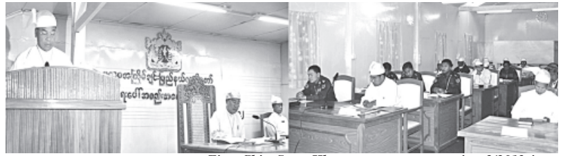
First Chin State Hluttaw emergency meeting 2/2012 in progress.

The state chief minister also submitted a proposal for upgrading