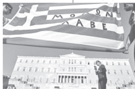
Protesters hold a Greek flag in front of parliament during a rally marking the one year anniversary of Greece's Indignant group in Athens on 25 May, 2012.

issued under Greek law would be redenominated and the country's economy and banking system would be hit