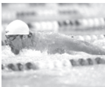
Michael Phelps, seen here on 12 May, has won the 400 meter medley as club-mate Allison Schmitt stole the show at the Longhorn Elite Invitational.