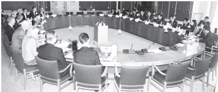
Pyithu Hluttaw Speaker Thura U Shwe Mann meets Danish parliament speaker Mr. Mogens Lykketoft. —MNA