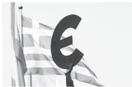
A Greek flag flies behind a statue to European unity outside the European Parliament in Brussels ahead of an EU informal heads of state summit on 22 May, 2012.