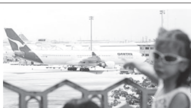
A girl points to a Qantas Airbus 330-300 aircraft on the tarmac of the Ninoy Aquino International Airport in Manila on 31 October, 2011.