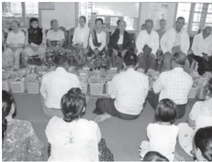
RESPECTS PAID TO THE ELDERLY: The 46 th respect-paying ceremony was held at Township administrator office in Pyigyikyathayay East Ward in Aungmyaythazan Township, Mandalay, on 17 April.