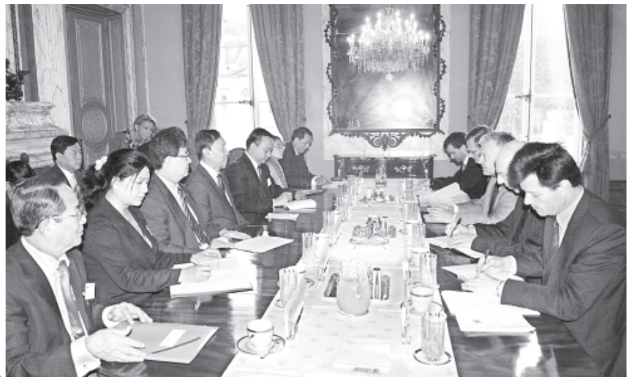
Pyithu Hluttaw Speaker Thura U Shwe Mann and party meet Deputy Prime Minister and Foreign Affairs Minister of Belgium Mr Dider Reynders.—MNA

On 8 May, the delegation met with Chairman of Parliament Economic Cooperation and Development Committee Ms Dagmar Wöhrle and party at German