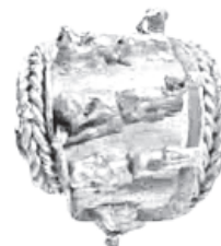
The gold earring decorated with molded ibexes, or wild goats, found in northern Israel and dated to 1,100 BC.

The vessel, found in the remains of a private home in the ancient Canaanite city-state of Tel Megiddo, was probably not the jewelry's normal storage place, researchers said.