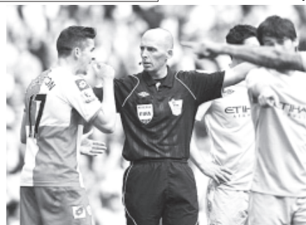
Queens Park Rangers' English midfielder Joey Barton (L) is sent off by referee Mike Dean during the English Premier League football match between Manchester City and Queens Park Rangers at The Etihad stadium in Manchester. Barton apologised for his red card at Manchester City but the controversial QPR midfielder insisted he was only reacting to provocation from Carlos Tevez.