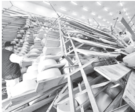
An owner of a cheese factory in San Giovanni in Parsiceto looks at toppled shelves, following a strong earthquake in northeast Italy.—INTERNET

She said that if Iran actually takes steps, the US might be able to respond, suggesting an easing of sanctions.—NHK