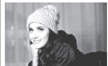
Singer Katy Perry

"It's a shame as they both liked each other but Katy wants to be able to have a relationship with someone she isn't constantly having to work out what time zone they're in," the source added.—INTERNET