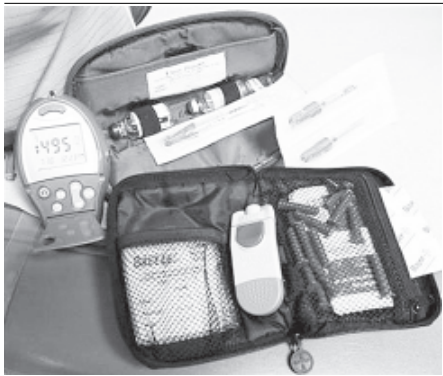
A diabetic patient displays her insulin supplies and blood sugar level-testing device in downtown Los Angeles, on 30 July, 2007. The percentage of US teenagers with "pre-diabetes" or full-blown type 2 diabetes has more than doubled in recent years — though obesity and other heart risk factors have held steady, government researchers reported on Monday.