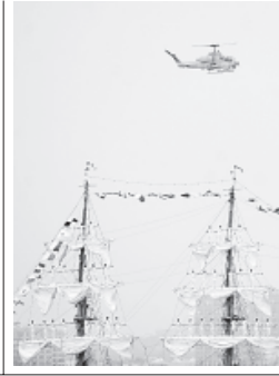
A United States Navy's helicopter flies over the Hudson River during the 25th Fleet Week in New York, on 23 May, 2012. The annual Fleet Week was opened on Wednesday, with over 20 fleets from 13 countries attending the fleet march.