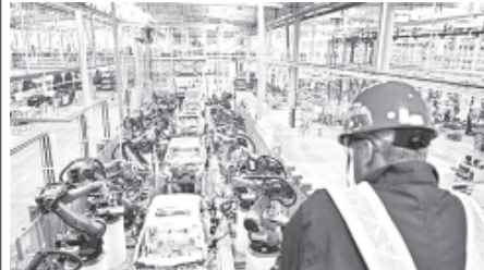
An employee looks at an assembly line at a Ford manufacturing plant in Chongqing municipality on 20 April, 2012.—REUTERS

"Policymakers have been and will step up easing efforts to stabilize growth, as indicated by a slew of measures to boost liquidity, public housing and infrastructure investment and consumption," HSBC's chief economist Qu Hongbin, wrote in a statement accompanying the PMI release.—Reuters