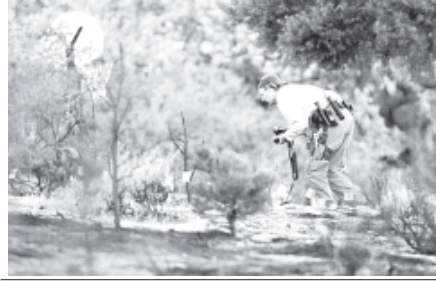
Investigators work the scene where a wildfire started south of Gardnerville, on 22 May, 2012. The fast-moving blaze near the Nevada-California line destroyed at least two homes on Tuesday as it forced evacuations and sent up huge plumes of black smoke, witnesses said.