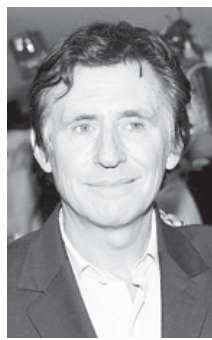
Irish actor Gabriel Byrne