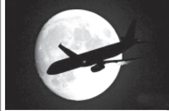
File illustration photo shows the silhouette of a passenger aircraft.