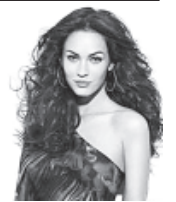
Actress Megan Fox