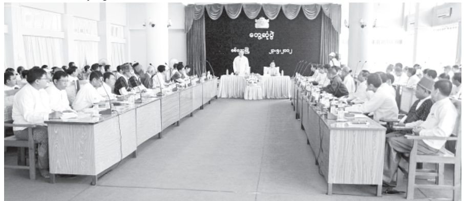
Chairman of Pyithu Hluttaw National Races Affairs and Internal Peace-making Committee U Thein Zaw meeting with Pyithu Hluttaw National Races Affairs and Internal Peace-making Committee and Rakhine Hluttaw representatives and national races representatives

Chairman of the Committee U Thein Zaw made a speech on the occasion. Next, State Chief Minister U Hla Maung Tin and State Hluttaw Speaker U Htein Lin delivered addresses followed by a general round of discussions.