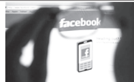
In this photo illustration, a Facebook logo on a computer screen is seen through glasses held by a woman in Bern on 19 May, 2012.

Serious trading glitches interfered with the stock's opening on Friday, and subsequent revelations by