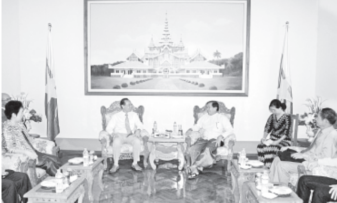
Bago Region Chief Minister U Nyan Win holds discussion with Kerry Group Limited Vice Chairman Mr George Yeo of Singapore.