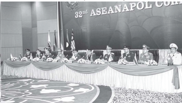
Chiefs of Police Force from ASEAN countries who have attended the 32 nd Conference of the ASEAN Chiefs of Police (ASEANPOL) hosted by Myanmar meet journalists at Thingaha Hotel in Nay Pyi Taw Hotel Zone.—MNA