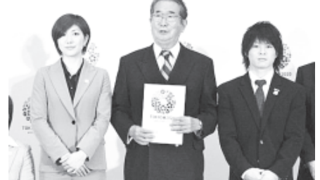
(L-R) Badminton player Reiko Shiota, Tokyo Governor Shintaro Ishihara and artistic gymnast Kohei Uchimura with the Tokyo 2020 floral Olympic bid logo in Tokyo in February.