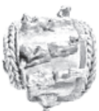
The gold earring decorated with molded ibexes, or wild goats, found in northern Israel and dated to 1,100 BC.