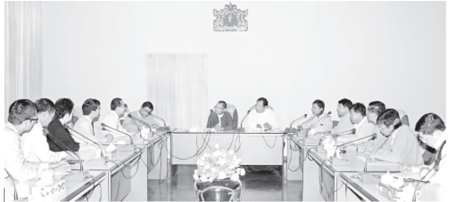
Union Minister U Myint Hlaing and Union Minister U Win Myint receive former Singaporean Foreign Minister Mr George Boon Yeo and Vice Chairperson Mdm Kuok Oon Kwong of KUOK Group.—MNA

Both sides also discussed matters related to implementation of large scale farm in addition to downstream industry, job creation for local people and making investment in Ayeyawady, Bago and Magway regions and Rakhine State where arable lands are