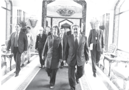
Iraq's Foreign Minister Hoshiyar Zebari (R) walks with European Union foreign policy chief Catherine Ashton before their meeting in Baghdad on 23 May, 2012.

a senior US official said of the discussions, which opened on Wednesday in the Iraqi Capital, Baghdad, in a renewed effort at diplomacy that will seek to ease decades of ingrained mistrust.