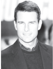
American actor Tom Cruise attends the premiere of "Mission: Impossible Ghost Protocol" at BFI Imax in London on 13 December, 2011.

Water Tower Music said those who pre-order the set through iTunes will get a free