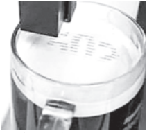
The machine can print onto the coffee's froth.