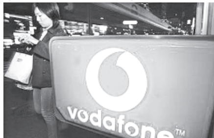
A Japanese woman passes Vodafone's logo in Tokyo on 17 March, 2006.

In the telecoms sector specifically, rivals have also struggled, with net profit at Spain's Telefonica halved in