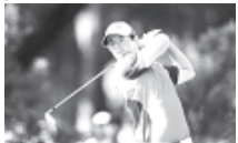
Rory McIlroy of Northern Ireland at The Players Championship on 11 May.