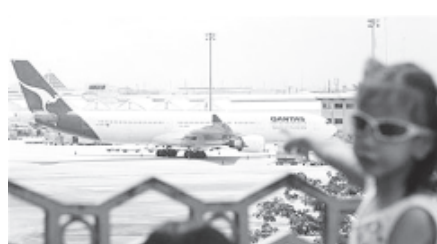
A girl points to a Qantas Airbus 330-300 aircraft on the tarmac of the Ninoy Aquino International Airport in Manila on 31 October, 2011.

SYDNEY, 24 May—Australia's top airline, Qantas Airways, said on Tuesday its international and domestic business will be managed as separate businesses with their own chief executive with earnings to be reported separately from 1 July.