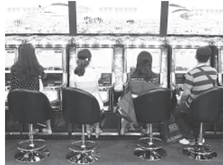
Visitors play a game during the G2E Asia gaming expo in Macau on 23 May, 2012.

Without getting into classified information, Lieberman confirmed that there has been a spike in cyber intrusions, which is believed to originate from Iran.