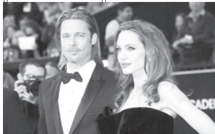
Brad Pitt and Angelina Jolie

LONDON, 24 May—Brad Pitt and Angelina Jolie seem too busy to walk down the aisle as the actor has admitted that they have no plans for a summer wedding.