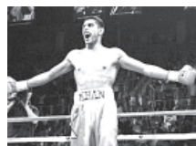
Britain's Amir Khan, pictured in 2011, will return to the ring on July 14 against unbeaten World Boxing Council light-welterweight champion Danny Garcia after his planned bout last weekend was wiped out.

Khan had to seek a new opponent after a 19 May rematch against Lamont Peterson was canceled following the American's positive doping test for synthetic testosterone, a banned performance-enhancing substance.