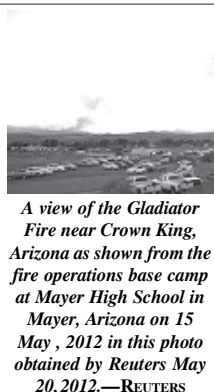
A view of the Gladiator Fire near Crown King, Arizona as shown from the fire operations base camp at Mayer High School in Mayer, Arizona on 15 May, 2012 in this photo obtained by Reuters May 20, 2012.—REUTERS