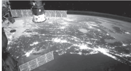
An Expedition 30 crew member aboard the International Space Station took this nighttime photograph of much of the Atlantic coast of the United States on 6 February, 2012. A former high school math teacher who became an astronaut arrived at the International Space Station on his 45th birthday.

He will play 8th century ruler Earl Haraldson in "Vikings," set to premiere in 2013, the History channel's president and general