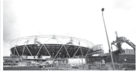
A general view of the ArcelorMittal Orbit Sculpture and the Olympic Stadium is seen in this picture taken on 3 April, 2012 in the Olympic Park in London, the United Kingdom.