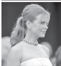
Australian actress Nicole Kidman, is in talks to play the late Grace Kelly, the screen legend who married the prince of Monaco, in a film by French director Olivier Dahan, Variety reported on Thursday.