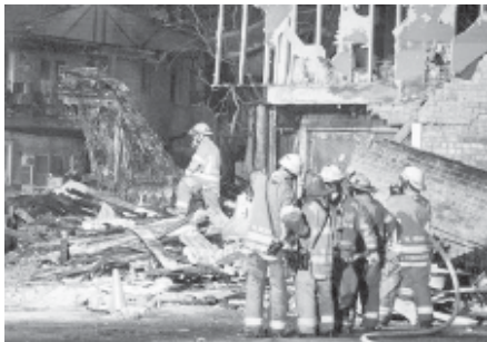
Fire fighters survey the burnt-out wreckage of the tail of a Navy F/A-18D jet fighter which crashed into an apartment complex in Virginia Beach on 6 April, 2012.