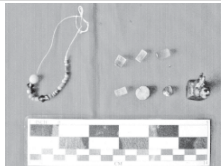
Bronze lion scale and 31 pieces of colourful jewellery handed over to Archaeology, National Museum and Library Department (Nay Pyi Taw).