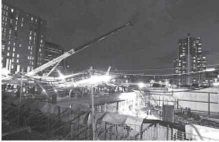
Police and fireman remove an injured person from the site of a crane collapse where construction is going on for the 7 line subway extension on 3 April, 2012, in New York. Fire officials say a crane collapse at a Manhattan construction site has injured two people.