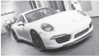
Now in its seventh version, the 911 is still recognizably FA Porsche's design.

STUTTGART, 7 April — The designer of the iconic Porsche 911 sports car, Ferdinand Alexander Porsche, has died at the age of 76. FA Porsche first designed the model in the early 1960s. The 911 first appeared in 1963, and the elegance and simplicity of its shape quickly made it a classic. It is now in its seventh version, and was recently voted one of the best cars of the twentieth century. His grandfather, Ferdinand Porsche, designed the Volkswagen Beetle. FA Porsche was in charge of the family firm's design department when he conceived the 911 as a