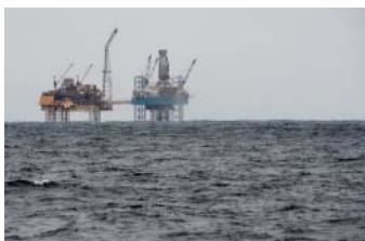
French energy giant Total's Elgin rig, 150 miles (240 kms) off Aberdeen in the North Sea.

In a statement, Total said the team found no gas on the the processing platform and the 90-metre (year) bridge to the well head platform was also free of gas. The structural condition of that platform, G4 and the surrounding rig were unchanged since the evacuation, as were safety situations. "The visual inspection confirmed that the leak is coming from the G4 well head at Well Head Platform deck level. In parallel, a remote operated vehicle survey confirmed no underwater gas leak," Total said.— Internet