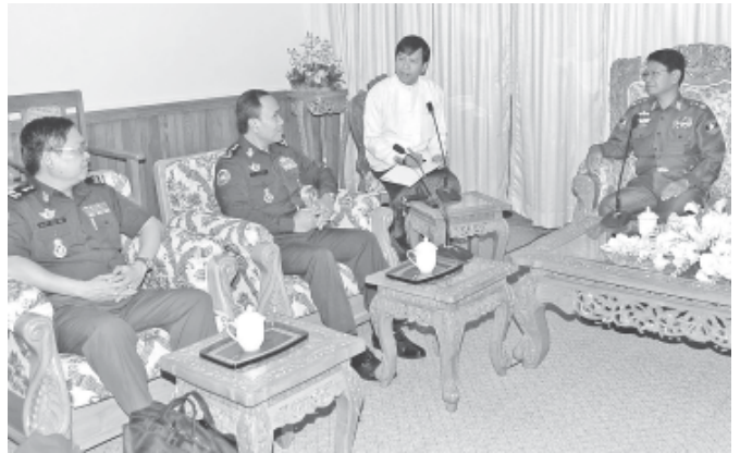
Union Minister for Defence Lt-Gen Hla Min receives Lieutenant General Nem Sowath, the special envoy of Cambodian Deputy Prime Minister and Minister of Defence General Tea Banh.—MNA