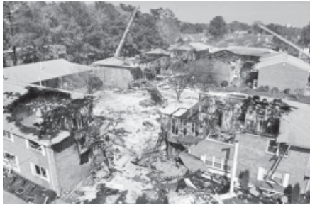
Firefighting foam covers the scene of a crash of an F/A-18D Hornet assigned to Strike Fighter Squadron (VFA) 106, in Virginia beach on 6 April, 2012.

VIRGINIA BEACH, 7 April — A US Navy F/A-18D fighter crashed into an apartment complex in Virginia soon after takeoff on Friday, sending fireballs into the sky, damaging six buildings and injuring at least seven people. No deaths have been reported, but three residents of the Mayfair Mews complex for the elderly were unaccounted for, authorities said. “We have physically been in every structure, and we have 95 percent completed the search and rescue,” Virginia Beach Fire and Rescue Battalion Chief Tim Riley said.