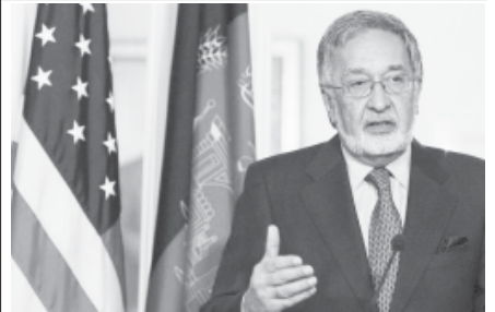
Afghan soil will not be used to launch attacks against any country after foreign troops withdraw, the war-torn nation's foreign minister, pictured here in March 2012, told Al-Jazeera in an interview, excerpts of which were received by AFP on Friday.