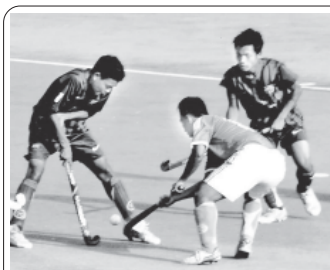
Myanmar hockey, a sports event to bring honour to the nation