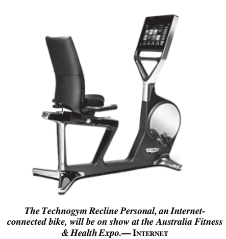
The Technogym Recline Personal, an Internet-connected bike, will be on show at the Australia Fitness & Health Expo.