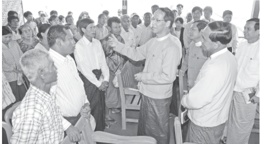
Vice-President Dr Sai Mauk Kham cordially greets locals at briefing hall near 288-acre Paletwe hybrid paddy farm in Aungchantha Village.

The Vice-President added that looking to the developed countries, they are found to have been focusing on industrial development and engaging in agricultural tasks with the use of modern machinery. For Myanmar which relies on agriculture for fulfilling people's basic needs, it is to introduce mechanized farming in order to improve the agricultural sector. If the nation can develop the industrial sector while engaging in agricultural work, its economy will develop as well. Technology and capital are necessary to change the conventional farming into mechanized farming. Only if national economy develops, will