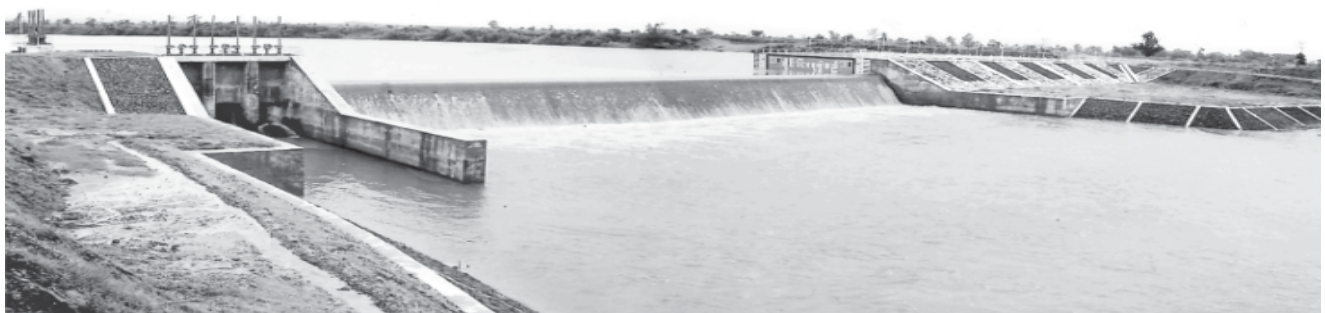
Baida Diversion Weir in DaikU Township, Bago Region.