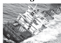
The Rena broke in two in January, three months after it ran aground.

WELLINGTON, 7 April — The owners of a ship which ran aground off New Zealand spilling hundreds of tonnes of fuel oil are being charged with discharging harmful substances. The Rena ran aground on a reef near Tauranga on 5 October 2011, causing what has