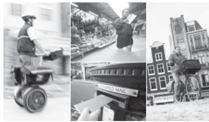
The price of postage is going up sharply in the UK, but it still won't be the most expensive place in the world to post a letter, or not quite. Which countries earn that dubious honour?—INTERNET

And that's if you adjust the price to take into account the fact that money goes further in some countries where