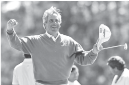
Fred Couples celebrates after finishing the second round the Masters golf tournament on the 18th on 6 April, 2012, in Augusta, Ga.

Swansea dominated possession but could not find a breakthrough, with Gylfi Sigurdsson stinging the palms of Tim Krul and Joe Allen forcing a save too. But Cisse doubled the lead with a second glorious finish from another clever Cabaye pass and the Magpies held on to collect another crucial three points.— Internet