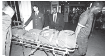
Police say they are awaiting a medical report on the death.