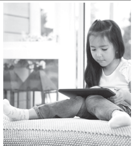
Concerns grow over children using tablet computers. INTERNET