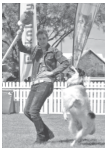
Nutriphase animal carnival 2012: dance with pet dogs: A woman and her dog attend the Nutriphase animal carnival 2012 in Johannesburg, South Africa, on 6 April, 2012. The 4-day carnival was held to promote responsible pet care and ownership.