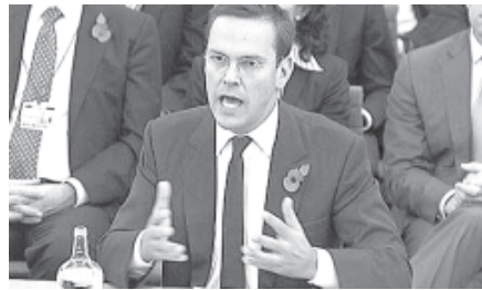
News International Chairman James Murdoch speaks to parliamentarians in London in this 10 Nov, 2011 file photo.