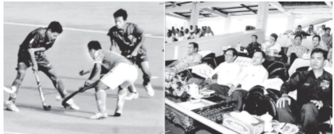
Myanmar National Sports Committee Chairman's Hockey Tournament being held at Theinbyu Hockey Pitch.

Until 1887, hockey was played exclusively by men and was regarded too rough and dangerous for women. But in that