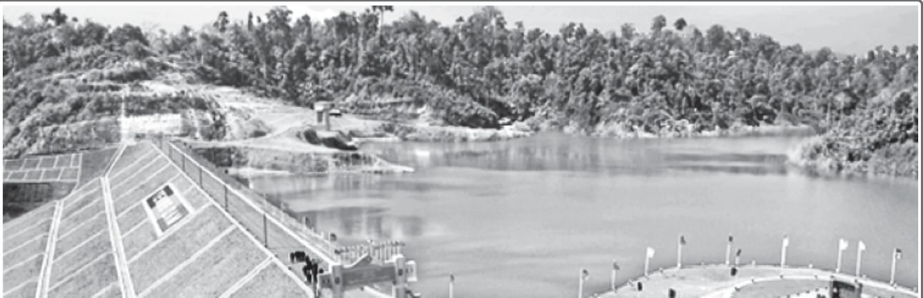
Yenwe Dam in Kyaukdaga Township, Bago Region.