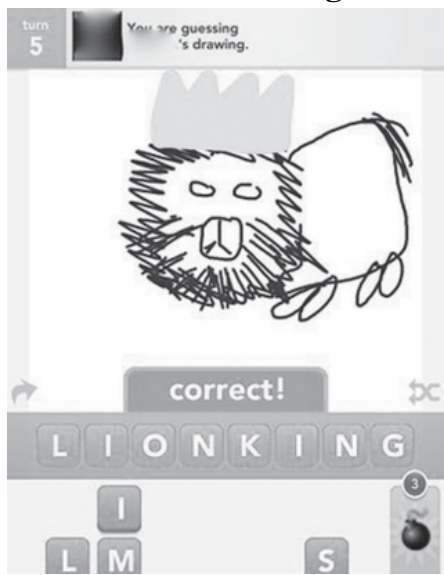
Players must guess words based on friends' drawings created using touchscreens.