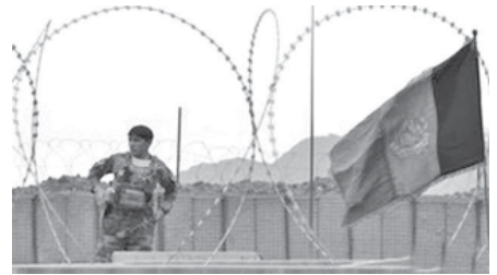
Kunar has been at the centre of the Taliban’s insurgency.