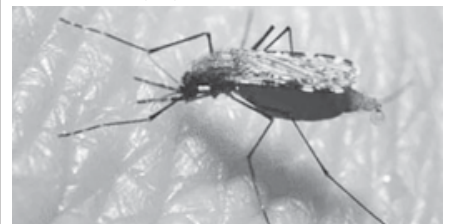
Malaria is spread by mosquitoes.

malaria have been derived from the Chinese plant, Artemisia annua . It is also known as sweet wormwood. In 2009 researchers found that the most deadly species of malaria parasites, spread by mosquitoes, were becoming more resistant to these drugs in parts of western Cambodia. This new data confirms that these Plasmodium falciparum parasites that are infecting patients more than 500 miles away on the border between Thailand and Myanmar are growing steadily more resistant. — Internet