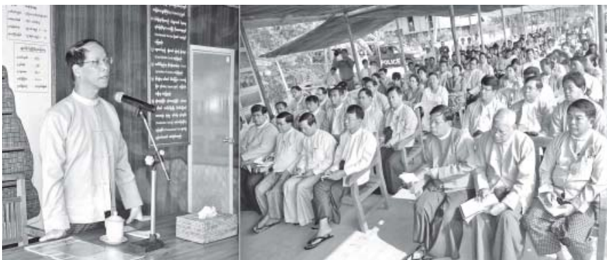
Vice-President Dr Sai Mauk Kham speaks to local farmers at 369-acre farmer educative high yield Paletwe hybrid paddy plantation in Alyinlo Village of Pynmana Township.