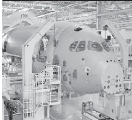
Final assembly of 1st A350 XWB underway in Toulouse, France. This latest step in the A350 XWB's progress was achieved as Airbus started joining the 19.7-meter-long central fuselage with the 21-meter-long front fuselage.