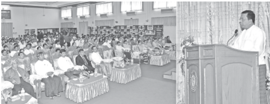
Deputy Health Minister Dr Win Myint speaking at the celebration of World Health Day.

NAY PYI TAW, 7 April—Jointly organized by the Ministry of Health and World Health Organization, World Health Day was marked at the ministry here this morning with an address by Deputy Minister for Health Dr Win Myint.