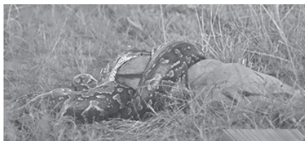
Bloody! African python swallows antelope.