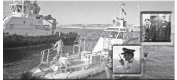
All 28 Chinese crew members aboard a China-linked cargo ship hijacked by Somali pirates were rescued on 6 April, 2012.