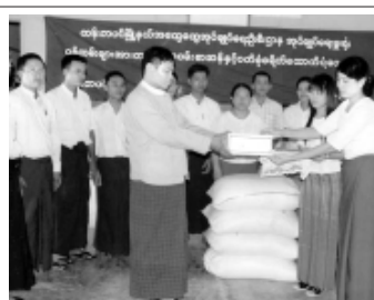
Cash assistance for rice, uniform provided in Htantabin