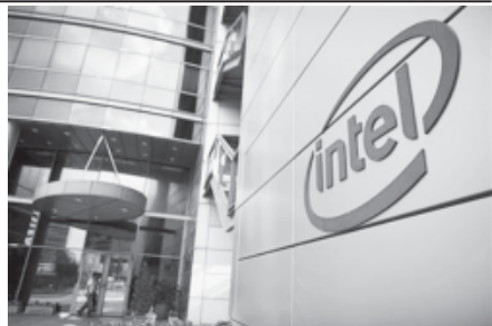
An Intel logo is seen at the company's offices in Petah Tikva, near Tel Aviv on 24 Oct, 2011.