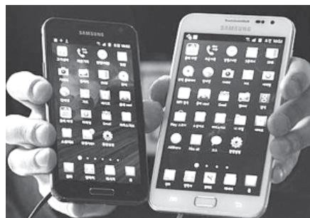
An employee poses with Samsung Electronics' Galaxy phones at a store in Seoul on 14 March, 2012.