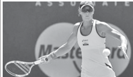
Australia's Samantha Stosur, booked her semi-final spot at the WTA Charleston clay court event with a pair of three-set wins, ruining the prospect of an all-Williams clash.

Serena reached the semifinals on Friday when injury-cursed Sabine Lisicki quit their last-eight clash in floods of tears. The American fifth seed was 5-1 ahead in the first set when Lisicki — whose career went into a tailspin in 2010 when an injury left her barely able to walk — retired after falling and hurting her ankle. Stosur posted her first career win over Venus after losing four straight — all in straight sets, including three on clay.— Internet