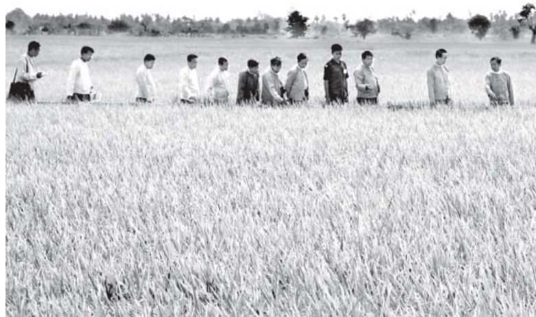
Vice-President Dr Sai Mauk Kham at 369-acre farmer educative high yield Paletwe hybrid paddy plantation in Alyinlo Village of Pynmana Township.