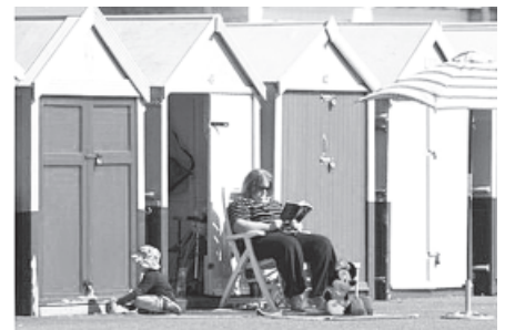
March 2012 was one of the warmest, driest and sunniest on record.

LONDON, 4 April — Last month was the third warmest March on record — outshone only by 1938 and 1957 — the Met Office has said. It had an average temperature of 7.7C, compared with March 1938, which had an average of 8C. It was also the fifth driest and third sunniest March. March saw a total precipitation of 36.4mm of rain and 156.5 hours of sunshine across the month. Records for temperature and rainfall began in 1910, while the measurements for sunshine began in 1929.