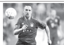
Bayern Munich's French midfielder Franck Ribery controls the ball during the UEFA Champions League second leg quarter-final football match FC Bayern Munich vs Olympique de Marseille in Munich, southern Germany.

Aston Villa skipper Stiliyan Petrov began his treatment for acute leukaemia this week.