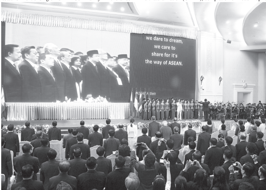
President of the Republic of the Union of Myanmar U Thein Sein attends the opening of 20 th ASEAN Summit and 45 th Anniversary of ASEAN at Peace Palace in Phnom Penh.

ASEAN Community Building (2009-2015), prioritized measures for establishment of ASEAN economic community in 2015, narrowing of development gap among the ASEAN members and linking material and institutional infrastructure for successful integration, (See page 8)