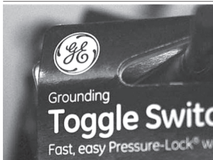
A General Electric Company (GE) logo is seen on a toggle switch package in New York on 18 Jan, 2012.