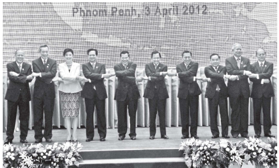
President of the Republic of the Union of Myanmar U Thein Sein and Heads of State/Government of ASEAN countries pose for documentary photo at the opening of 20 th ASEAN Summit and 45 th Anniversary of ASEAN.—MNA

In his opening address, Alternate ASEAN Chairman Cambodian Prime Minister Samdech Hun Sen called for further cooperation for attainment of the goal of "ASEAN: One Community—One Destiny" of the ASEAN, establishment of single ASEAN Community in 2015 under