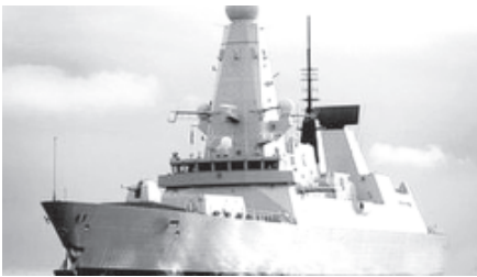
The UK says HMS Dauntless is being sent to the South Atlantic as part of routine operations.

LONDON, 4 April— HMS Dauntless , one of the UK's largest and most powerful air defence destroyers, is due to set sail for the Falkland Islands. The Ministry of Defence says it is a "pre-planned and routine" six-month deployment in the South Atlantic. However, it comes days after the 30th anniversary of the start of the war. The move had earlier prompted an official complaint