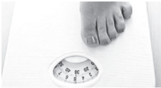
Obesity has been linked to several cancers.—INTERNET

LONDON, 4 April—Taller women have a slightly higher risk of ovarian cancer, according to a review of studies. Obesity is also a risk factor among women who have never taken HRT, say international researchers. Previous studies have suggested a link, but there has been conflicting evidence. The latest research, published in the journal PLoS Medicine , analysed all worldwide data on the topic. It looked at 47 epidemiological studies in 14 countries, including about 25,000 women with ovarian cancer and more than 80,000 women without ovarian cancer. Lead researcher Prof Valerie Beral of the Oxford University Epidemiology Unit told the BBC: "By bringing together the worldwide evidence, it became clear that height is a risk factor."