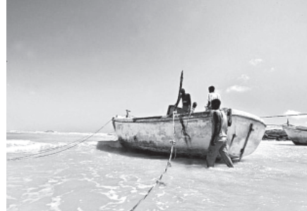
Armed Somali pirates carrying out preparations to a skiff in Hoby, northeastern Somalia, in 2010. A Bolivian-flagged vessel seized by Somali pirates since last week has been freed, and is continuing on to Iran with its sugar shipment, the Bolivian government announced on Tuesday.

be held in Istanbul, the first such meeting since January 2011 when the two sides failed even to agree on an agenda. Iraqi Foreign Minister Hoshiyar Zebari told Reuters the proposal for talks in Baghdad came from an Iranian delegation visiting on Tuesday and he would meet with ambassadors from the