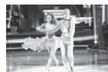
In this 2 April, 2012 image released by ABC, actor Jack Wagner and his partner Anna Trebunskaya perform on the celebrity dance competition series "Dancing with the Stars," in Los Angeles.

The 52-year-old actor was axed from the ABC dance competition Tuesday despite turning in a samba that the judges praised. Judges' scores are combined with viewer votes to determine