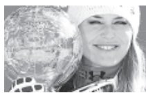
Lindsey Vonn of the US Celebrates with her trophy after winning the Alpine skiing women's overall World Cup at the Alpine Skiing World Cup finals in Schladming on 18 March, 2012.

TORONTO, 4 April — Lindsey Vonn, winner of the women's alpine skiing