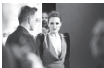
Actress Julianne Moore walks the red carpet for a viewing party for the new HBO film "Game Change", about the 2008 McCain-Palin republican presidential campaign, at the Newseum in Washington, on 8 March, 2012.

WASHINGTON, 4 April—Sarah Palin gave a visible