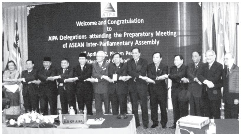
Pyidaungsu Hluttaw Speaker U Khin Aung Myint poses for documentary photo together with delegates to preparatory meeting of ASEAN Inter-Parliamentary Assembly Chairman and parliamentary heads of ASEAN countries.