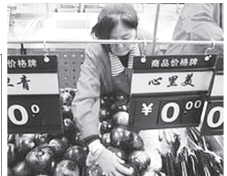
Foreign grocery retailers are looking to China and the other Brics countries.