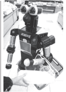
A Chinese cabbage is handed to a robot named "Robovie-II", developed by Japanese robotics research institution ATR, at a grocery store during a shopping assisting experiment by utilizing the robot in an ubiquitous network technology platform in Kyoto, western Japan recently.