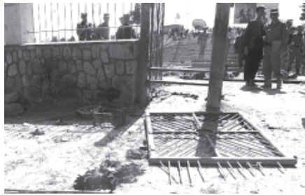
Afghan policemen inspect the site of a suicide attack in Maymana, the capital of Faryab province, on Wednesday.

KABUL, 4 April—A suicide bomber attacked foreign military forces in northern Afghanistan on Wednesday, killing 12 people, officials said, as NATO's fatalities for the year passed the 100 mark.