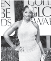
In this 15 Jan, 2012 file photo, singer Mary J Blige arrives at the 69th Annual Golden Globe Awards in Los Angeles.

NEW YORK, 4 April—A Burger King commercial featuring Mary J Blige singing about chicken has