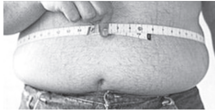
How should obesity be calculated?

NEW YORK, 4 April — The obesity problem in the US may be much worse than previously thought, according to researchers. They said using the Body Mass Index or BMI to determine obesity was underestimating the issue. Their study, published in the journal PLoS One , said