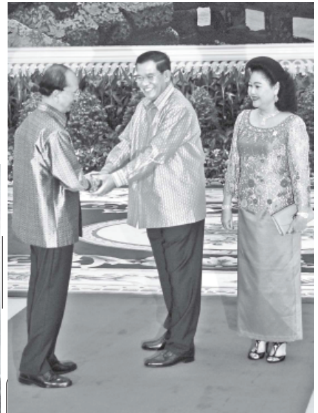
Cambodian Prime Minister Samdech Hun Sen and wife cordially greet President U Thein Sein at the dinner.