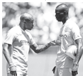
Man City midfielder Nigel de Jong makes a point to team-mate Mario Balotelli during a Herbalife World Football Challenge 2011 game in Carson, California, in July 2011.

"Lots of people expect him to pull off crazy stunts and as a result he feels he must do something. People like that need to have upheaval