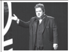
In this 12 Jan, 2012 file photo, actor-comedian Patton Oswalt is seen onstage during the 17th Annual Critics' Choice Movie Awards in Los Angeles.

Returning to compete next week will be actors Jaleel White, Roshon Fegan, William Levy and Melissa Gilbert; singers Gladys Knight, Gavin DeGraw and Katherine Jenkins; TV personalities Maria Menounos and Sherri Shepherd; and football star Donald Driver.— Internet