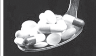
The US Food and Drug Administration warns of cancer-causing agent in Japan weight loss pills.—INTERNET