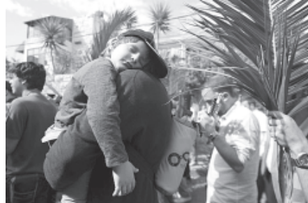
A sleeping boy is carried as Catholic Christians take part in a Palm Sunday procession on the Mount of Olives in Jerusalem on 1 April, 2012.

WASHINGTON, 4 April — Falling asleep is a routine yet mystifying process. Like trying to see the 3D image in a Magic Eye poster, the more you focus on it, the less likely it is to happen. It shies away from scrutiny and is best approached