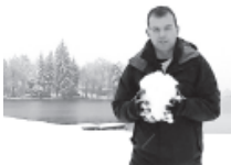
Several inches of snow has fallen in Aboyne overnight.

A spokesman for the Met Office said, with widespread ice developing on untreated surfaces in northern Scotland, the public should be prepared for disruption to transport.