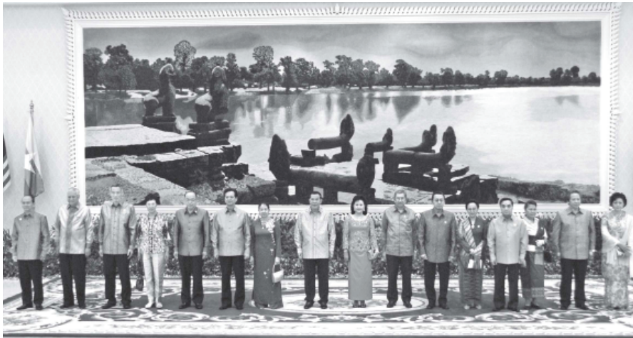
President of the Republic of the Union of Myanmar U Thein Sein, Cambodian Prime Minister Samdech Hun Sen and ASEAN Heads of State/Government pose for documentary photo at the dinner.