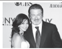
In this 12 June, 2011 file photo, Alec Baldwin, right, and Hilaria Thomas arrive at the 65th annual Tony Awards in New York.