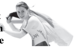
Germany's Miriam Welte celebrates after winning gold with teammate Kristina Vogel in the women's team sprint event at the track world championships in Melbourne, on 4 April, 2012.

MELBOURNE, 4 April—Germany's Miriam Welte and Kristina Vogel upset Australia on the opening day of the track world championships Wednesday by winning the hosts' coveted women's team sprint crown in a new record time.