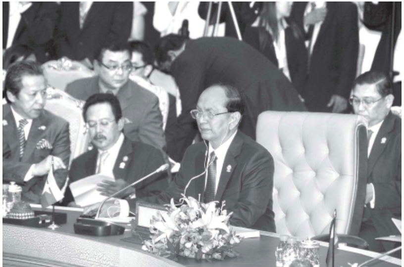
President of the Republic of the Union of Myanmar U Thein Sein attends 20 th ASEAN Summit Plenary Session at Peace Palace in Phnom Penh of Cambodia.—MNA

Service industry usually grows in parallel with economic development. Creating more job opportunities and nurturing more