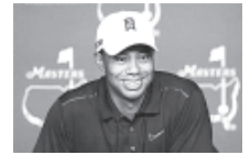
Tiger Woods of the US answers questions during a Press conference following his practice round for the 2012 Masters Golf Tournament at the Augusta National Golf Club in Augusta, Georgia, on 3 April, 2012.

AUGUSTA, 4 April — While this week's Masters is one of the most anticipated in years with so many players bringing good form to Augusta National, Tiger Woods once again commands the spotlight. The former world number one has a renewed spring in his step after ending a 30-month title drought on the PGA Tour with a win at last month's Arnold Palmer Invitational and is unquestionably the player to beat at a venue where he triumphed four times.