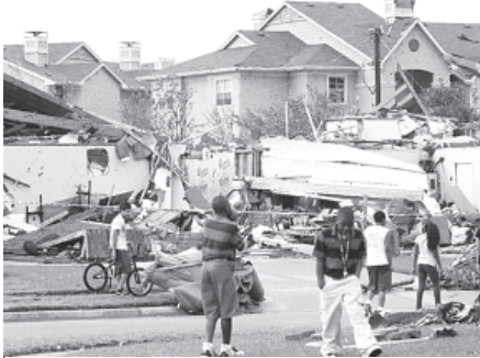
Neighbours view what remains of a home in Arlington, Texas, on 3 April, 2012.