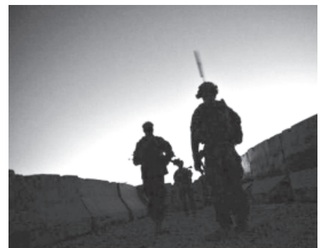
Photo illustration of troops on patrol in Afghanistan. Three international troops were killed in separate insurgency incidents in Afghanistan in one day, the NATO-led coalition force said.

troops in Afghanistan and its Western allies. Most fighting the Taliban-led foreign soldiers are due to be withdrawn by the end of 2014. insurgency against President Hamid Karzai's government Internet