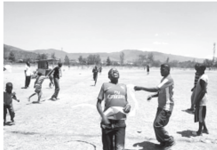
Football supporters from many countries — including Kenya — took part in the charity run.