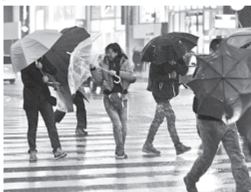
Pedestrians struggle against the wind and rain in Tokyo on 3 April, 2012. INTERNET

The dead included a 96-year-old man who fell from the roof of a three-storey house during high winds and a 28-year-old woman who was hit by a falling tree while walking a dog. The storm temporarily reduced electricity supplies to the Onagawa nuclear power plant, in Miyagi prefecture, halting the cooling system for a fuel pool, operator Tohoku-Electric Power Co said. Plant workers manually restarted the cooling system after about 20 minutes, it said. "There was no problem in the operation," a company spokesman added. All reactors at the plant are currently idle.—INTERNET