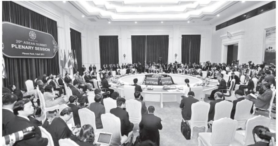
At 20 th ASEAN Summit Plenary Session, all ASEAN leaders welcomed successful holding of free and fair and transparent by-elections in Myanmar and unanimously supported the call for prompt lifting of economic sanctions on Myanmar.

After the summit, the Heads of State and Government together had lunch hosted by the Cambodian Prime Minister.