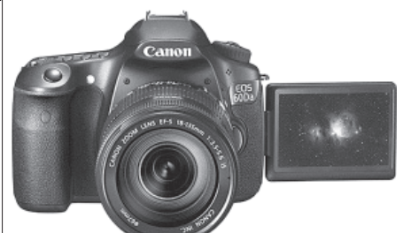
Astrophotography enthusiasts can now take great images of the sky without modifying cameras.