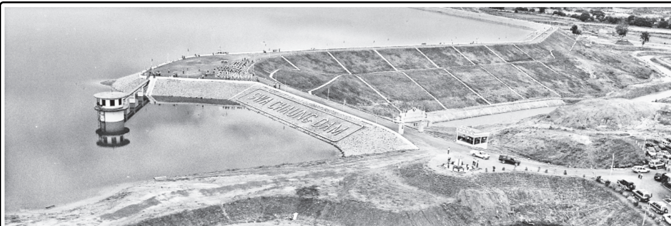
Swachaung Dam in Yedashe Township of Bago Region feeding irrigation water to 35000 acres of farmlands, contributing towards socio-economic development of local people and greening of its environs.