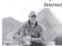
Federer defeated Isner 7-6(7), 6-3 to win his record fourth BNP Paribas Open title.

Federer improved to 39-2 since last year's US Open, with his only losses to No 2 Rafael Nadal in the semifinals of the Australian Open and the 11th-ranked Isner, who won on the Swiss star's home turf last month. Azarenka improved to 23-0 this year, the best start to a season since Martina Hingis went 37-0 to open 1997. The