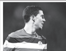
Lille's French midfielder Eden Hazard celebrates after scoring a goal during the French L1 football match Lille vs Valenciennes at Lille metropole stadium in Villeneuve d'Ascq.