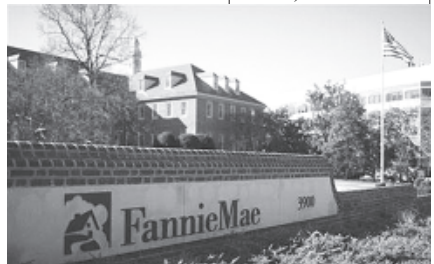
A sign in front of the Fannie Mae headquarters is photographed in Washington on 11 Feb, 2011.

fund manager Paulson & Co and private-equity investors Colony Capital LLC are also considering bids, the Journal said. Spokesmen for Fannie Mae and Credit Suisse declined to comment to the Wall Street Journal on the sale.