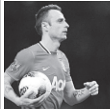
Man Utd's Bulgarian striker Dimitar Berbatov

SOFIA, 19 March—Bulgarian striker Dimitar Berbatov is poised to leave Manchester United at the end of the season despite the English champions taking up an extra year's option on his contract, his agent said on Sunday.