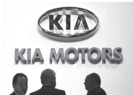
Visitors talk on the KIA Motors booth during the second media day of the 82nd Geneva Car Show at the Palexpo Arena in Geneva on 7 March, 2012.