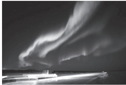
The largest solar storm in five years sent a huge wave of radiation into earth's atmosphere creating a brilliant show of the aurora borealis near Yellowknife, North West Territories on 8 March, 2012.

The storms can't hurt people, but can disturb electric grids, GPS systems and satellites. In 1989, a strong solar storm knocked out the power grid in Quebec,