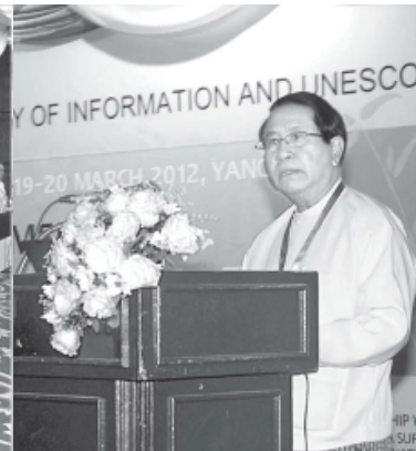
Union Minister for Information and for Culture U Kyaw Hsan delivers an address at Conference on Media Development in Myanmar.