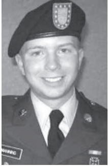
US Army PFC Bradley Manning, seen in this undated file photo, is accused of leaking classified information to WikiLeaks. Manning faces a court martial which could land him in prison for life.