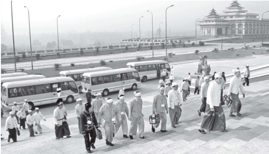
Pyidaungsu Hluttaw representatives attend the meeting.

NAY PYI TAW, 19 March—The 22 nd day Pyidaungsu Hluttaw session took place at Pyidaungsu Hluttaw Hall in Hluttaw Complex here today, attended by Pyidaungsu Hluttaw Speaker U Khin Aung Myint, Pyithu Hluttaw Speaker Thura U Shwe Mann and 516 MPs approving three bills. Approval was sought from the Pyidaungsu Hluttaw for amendments to the Environmental Conservation Bill made