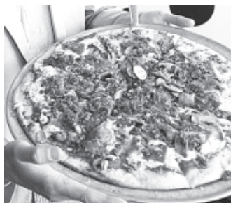
A Cape Cod, Mass., urologist is offering a free pizza to men who are seeking vasectomies in March, officials said.