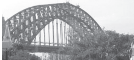
Sydney's Harbour Bridge.—INTERNET

The small audience featured six "Bridge heroes" with a special connection to the structure, according to event organisers. They included descendants of the bridge's engineer JJC Bradfield, a man whose uncle placed the very first rivet, and one woman who was born in an ambulance on the span. The bridge is one of Sydney's most-photographed and best-known landmarks and is often the centrepiece of fireworks displays in the city.—Internet