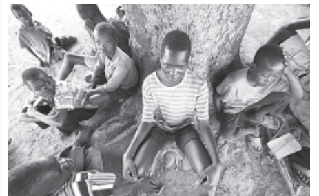
Children suffering from nodding syndrome gather in Akoya-Lamin Omony village in Gulu district, 384 km (238 miles) north of Uganda's capital of Kampala on 19 Feb, 2012. Nodding syndrome, which mostly affects children under 15, was first documented in Tanzania as early as 1962. However, despite extensive investigations, researchers are still largely confounded by it. Most of the fatalities attributed to the disease are the result of secondary causes.

Children with nodding syndrome are prone to accidents such as drowning and burning.