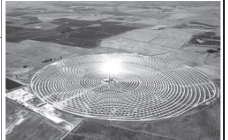
The Torresol Energy Gemasolar plant in Fuentes de Andalucía near Seville.