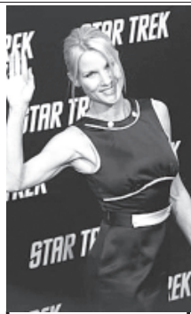
Nicollette Sheridan attends the premiere of the sci-fi adventure motion picture "Star Trek", at Grauman's Chinese Theatre in the Hollywood section of Los Angeles on 30 April, 2009.