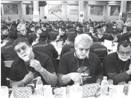
2,150 men shave simultaneously in Thessaloniki, Greece, in a bid to break the previous Guinness record set by 1,863 men in India.