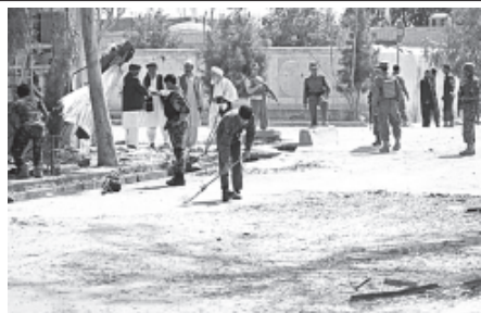
An Afghan policeman sweeps broken glass at the scene of a bomb explosion in Kandahar south of Kabul, Afghanistan, on 14 March, 2012. A delegation investigating Sunday’s shooting killing civilians in Panjwai, Kandahar by a US soldier was meeting in the southern city of Kandahar on Wednesday when a bomb hidden in a motorcycle exploded about 600 yards away. The blast killed one Afghan intelligence official and wounded three other people, but the delegation members were unharmed.