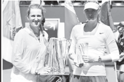
Victoria Azarenka (L) of Belarus and Maria Sharapova (R) of Russia pose with their trophies after Azarenka defeated Sharapova to win their women's final match at the Indian Wells WTA tennis tournament in Indian Wells, California, on 18 March, 2012.

top-ranked Belarusian won her Tour-leading fourth title of the year. Federer, ranked third, avenged his two defeats in consecutive days at Indian Wells, putting away Nadal in the rain-delayed semifinals Saturday and then Isner in a final delayed 12 minutes in the