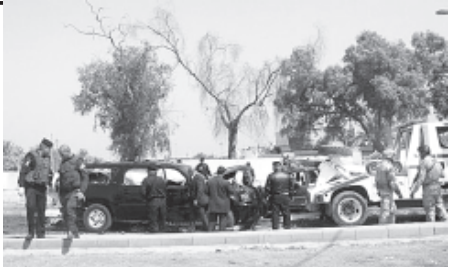
Iraqi security forces inspect the scene of a car bomb attack in the Mansour neighbourhood of Baghdad, Iraq recently. Iraqi officials say a car bomb has killed and wounded several people in a commercial area full of shops and clinics in western Baghdad.