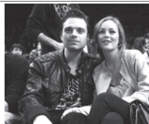
Sebastian Stan and Leighton Meester (R) watch the New York Knicks play the Charlotte Bobcats at Madison Square Garden in New York City on 7 March, 2009.