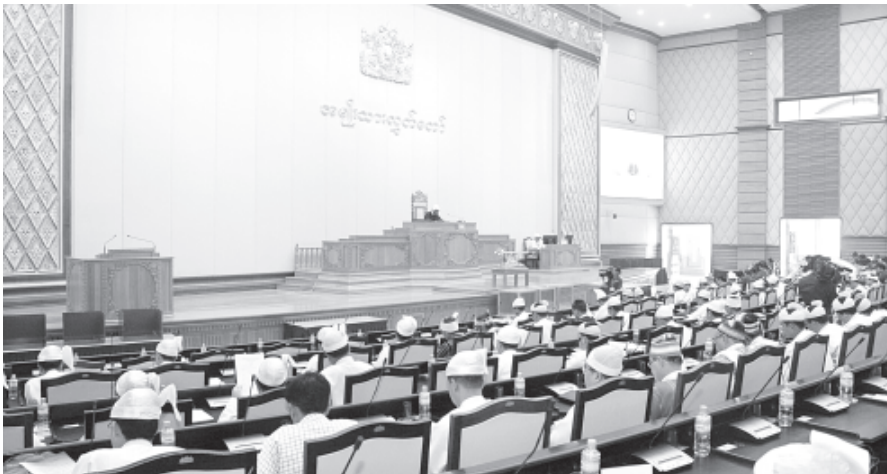
The 16 th day session of Amyotha Hluttaw in progress.

NAY PYI TAW, 19 March—Third regular session of first Amyotha Hluttaw continued for 16 th day at Amyotha Hluttaw Hall of Hluttaw Complex here at 2.40 pm today.