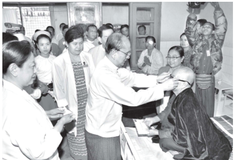
President U Thein Sein puts sunglasses to a patient at Nay Pyi Taw Pynmana Hospital (200-bed).

In his report on public healthcare services, Union Minister at the President Office Chairman of Nay Pyi Taw Council U Thein Nyunt said the Nay Pyi Taw Council in cooperation with the Health Ministry provided free public healthcare services to the townships of the council area – 1054 people in Zabuthiri Township on 3 February, 1029 in Ottarathiri Township