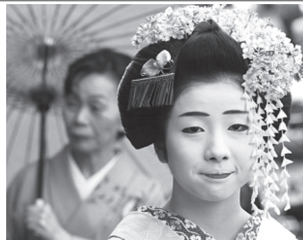
A woman dressed as a geisha takes part in a Saint Patrick's day parade in Central London on 18 March, 2012. Thousands of people were out on the streets for the parade which started at Green Park. INTERNET

"If unchecked, the resorts mushrooming in the area will choke the corridor and block the free movement of tigers through it. If the tiger in India is to be saved for posterity, the Kosi River tiger corridor needs to be protected at all costs," he added.—Internet