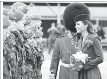
Catherine, the Duchess of Cambridge, talks to members of the Irish guards as she takes part in a St Patrick's Day parade while visiting Aldershot Barracks Aldershot Barracks on St Patrick's Day in Aldershot on 17 March, 2012.