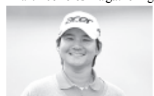
Yani Tseng of Taiwan

Tseng won 12 titles last year in a breakout season, seven of them in LPGA events and two at majors. She will try to add to her major total in two weeks at the Kraft Nabisco, where she was second last year to American Stacy Lewis.— Internet