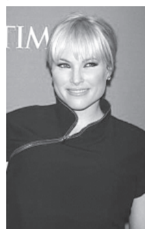
Meghan McCain arrives for the Time 100 Gala at the Time Warner Centre in New York on 26 April, 2011.

"You're nobody unless you have a gay rumor about you," she said. —Internet