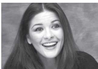
Actress Catherine Zeta-Jones

"I can clearly remember going trick or treating with my kids to Bono's house, I had