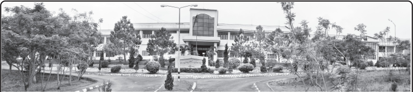
General Hospital in Kengtung, Shan State (East) is a health infrastructure for local people in border areas.

The conference continues on 20 March. MNA