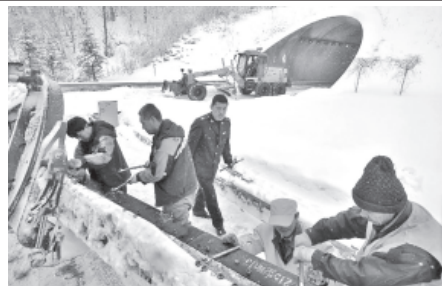
Workers swap shovel for a snow-sweeping vehicle on the G10 national highway in Hailin, northeast China's Heilongjiang Province, on 17 March, 2012. The traffic of Mudanjiang to Harbin section of the G10 national highway was influenced due to the heavy snowfall in northeastern China.— XINHUA

JAKARTA, 19 March—At least 10 people were killed Sunday when their van stalled at an unmanned railway crossing and was rammed by a train in Indonesia, police said. Four people, including the driver, were injured in the accident in Tasikmalaya in West Java, Xinhua reported.— Internet