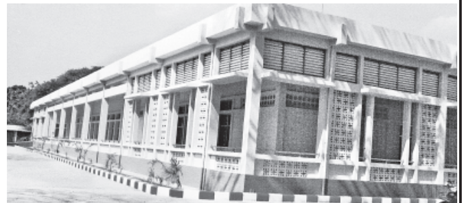
The operation theatre (extension) of the 100-bed People's Hospital in Hsipaw, Shan State (North).

The 50-bed People's Hospital in Namhsan, Shan State (North) is now providing health care services to local national races in the region.