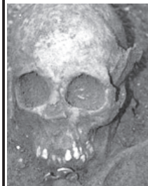
The skull of an Anglo-Saxon girl was found with a jewelled symbol of Christianity.

A bag of precious and semiprecious stones and a small knife were found with