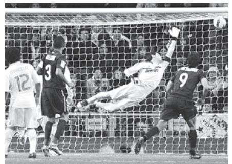
Real Madrid's goalkeeper and captain Iker Casillas tries to stop a goal of Malaga's midfielder Santiago Cazorla during the Spanish league football match Real Madrid vs Malaga at the Santiago Bernabeu stadium in Madrid.

Real coach Jose Mourinho chose not to rest players after the Champions League victory over CSKA