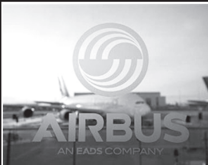
An A380 aircraft is seen through a window with an Airbus logo during the EADS / Airbus 'New Year Press Conference' in Hamburg on 17 January, 2012.