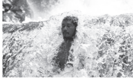
A man cools off in the Wawa Dam spillway in Rizal Province, the Philippines, on 18 March, 2012. The Wawa Dam is an abandoned water reservoir that was turned into a travel destination for local and foreign tourists.