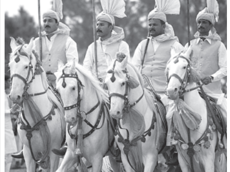
Horse riders warm up their horses during a tent pegging competition in Islamabad. The competition is taking place for the first time since 2004.—INTERNET