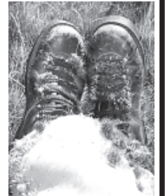
Scientists are inadvertently helping to carry seeds and other bits of plant around Antarctica.

quickly." The Antarctic Peninsula, which runs up towards the southern tip of South America, has warmed by about 3C over half a century, much faster than the global average. As a result, ice cover is dwindling.