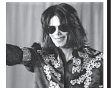
Sony says a number of Michael Jackson tracks have been stolen after its website was hacked.