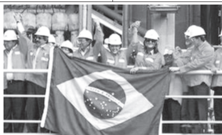
The Brazilian economy is still booming, despite the global economic slowdown. — INTERNET