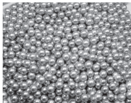
A lot of golden Myanmar pearl being displayed at 49 th Myanmar Gems Emporium.

While viewing jade, gems and pearl lots to be sold, I was thoughtful for