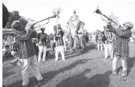
A dressed-up elephant enters the Rambagh Polo Ground in Jaipur, capital of the north India state Rajasthan, during the Elephant Festival on 7 March, 2012.