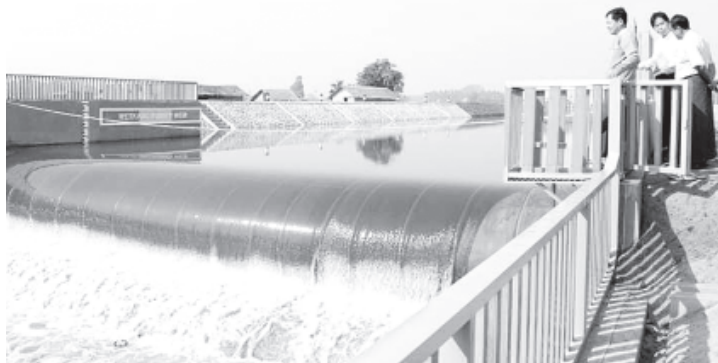
Union Minister for Agriculture and Irrigation U Myint Hlaing inspects Wakkamu Rubber Diversion Weir built through Rubber Dam Technology for the first time in Myanmar on the Nyobin Creek near Wakkamu Village of Lewe Township.

NAY PYI TAW, 8 March—Union Minister for Agriculture and Irrigation U Myint Hlaing, together with Vietnamese agriculturists, inspected thriving 11-Vietnamese-strain 120-day Palethwe hybrid paddy plantation near Chaing Village of Dekkhinathiri Township this morning.