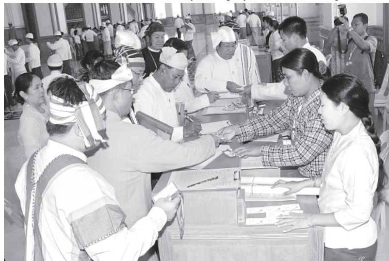
Pyithu Hluttaw representatives sign attendance book.

Those who passed the matriculation examination are allowed to attend the two-year teachership diploma course, and the course completed trainees are appointed as teachers in the state. From 1998 to 2011, a total of 234 male teachers and 2631 female teachers, totalling 2865 have been appointed at the schools. Moreover, the graduates are