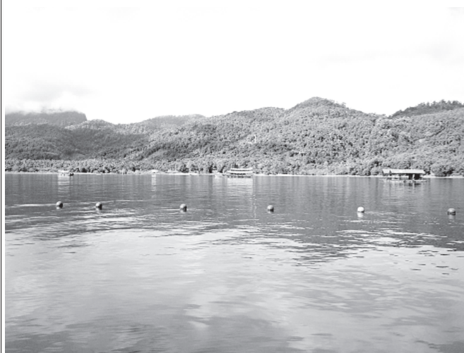
Photo shows Mali pearl oyster breeding farm in Mali Island.