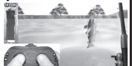
Researchers say the thumbsticks can be used to signal what actions should be carried out.