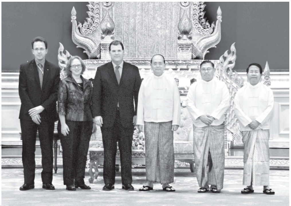
President of the Republic of the Union of Myanmar U Thein Sein poses for documentary photo with Canadian Foreign Affairs Minister Mr. John Baird.