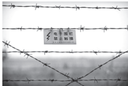
A warning sign is seen on a barbed wire fence dividing China and North Korea on the outskirts Dandong.