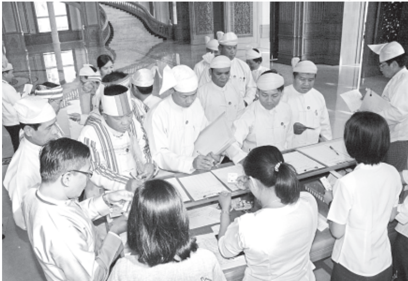
Amyotha Hluttaw representatives signing attendance book.

Now, fertilizers manufactured by the Energy Ministry are being distributed through (See page 11)