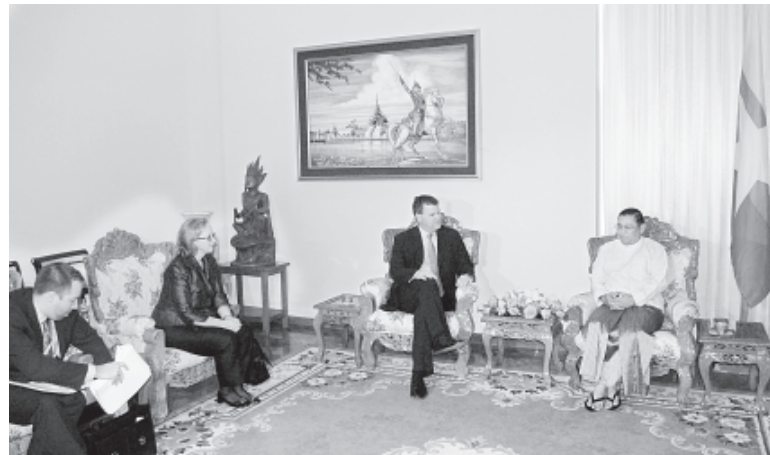
Union Foreign Affairs Minister U Wunna Maung Lwin receives visiting Minister for Foreign Affairs of Canada Mr John Baird.

NAY PYI TAW, 8 March—Visiting Minister for Foreign Affairs of Canada Mr John Baird paid a call on Union Foreign Affairs Minister U Wunna Maung Lwin at his