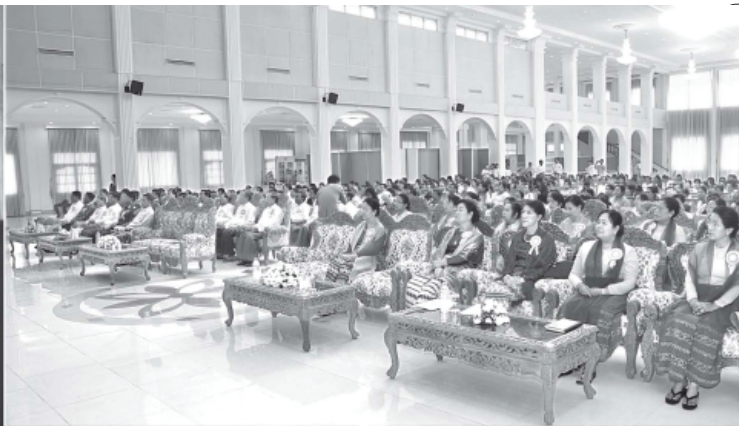
Vice-President Dr Sai Mauk Kham delivers an address at the ceremony to mark International Women's Day.

NAY PYI TAW, 8 March—Vice-President of the Republic of the Union of Myanmar Dr Sai Mauk Kham attended a ceremony to mark the International Women's Day held at Thiriyadana Hall of Myanmar Women's Affairs Federation in Dekkhinathiri Township here at 10 am today and made a speech on the occasion.