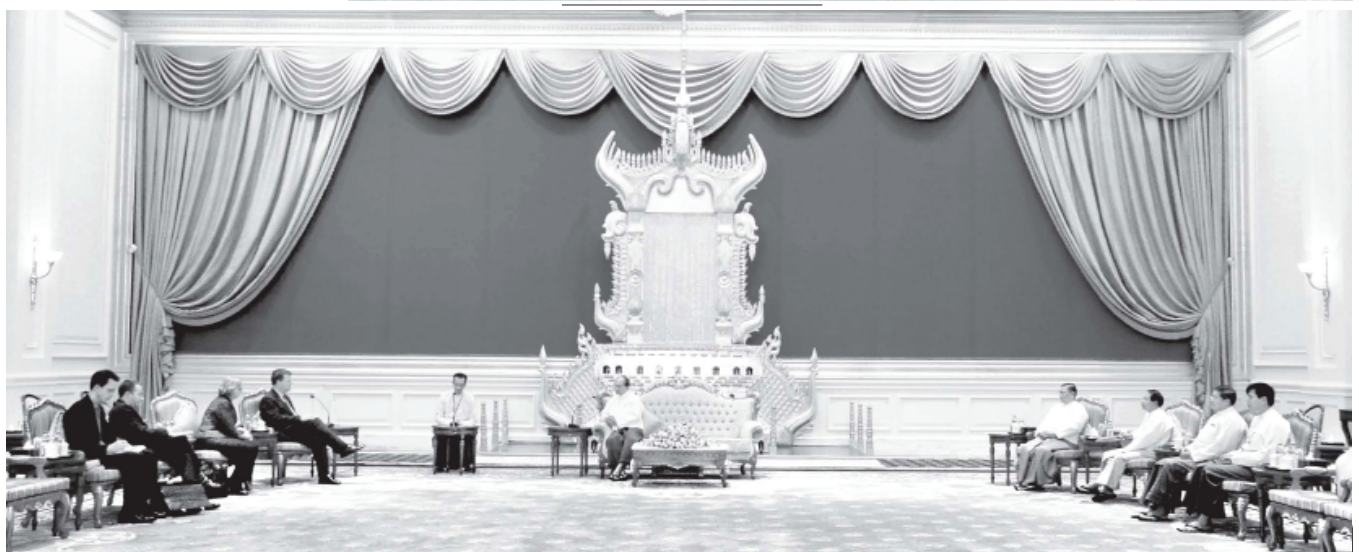
President of the Republic of the Union of Myanmar U Thein Sein receives goodwill delegation led by Canadian Foreign Affairs Minister Mr. John Baird at Credentials Hall of Presidential Palace.