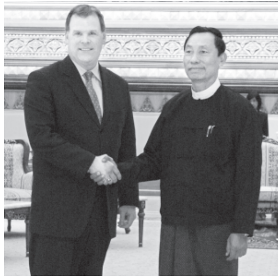
Speaker of Pyithu Hluttaw Thura U Shwe Mann shaking hands with Canadian Foreign Affairs Minister Mr John Baird.

Both sides discussed matters relating to developments in Myanmar, preparation tasks to hold