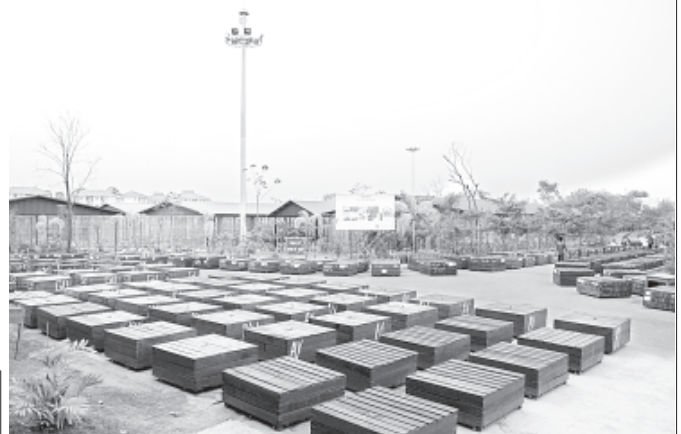
Jade lots systematically kept in boxes displayed at 49 th Myanmar Gems Emporium.

It was reported that gem merchants from Thailand, China and Japan and local gem merchants purchase gem lots. Mongshu ruby is favorite for most of gem merchants from Thailand. Although Chinese gem merchants