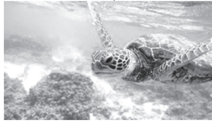
The Great Barrier Reef off the Queensland coast is home to a wealth of marine life.

The Unesco team is scheduled to visit the reef for a week before making recommendations to the World Heritage committee. They will also meet members of the government. Environmentalists are concerned that an increase in coal production and the