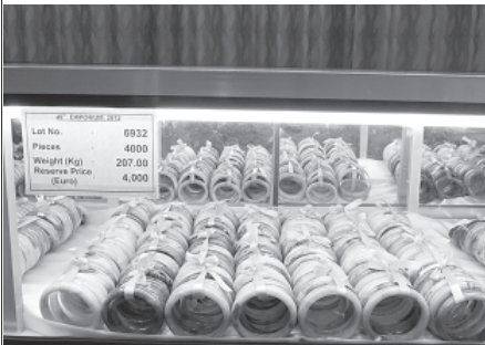
Photo shows bracelets in lots of gems at 49 th Myanmar Gems Emporium.

Article: Nyi Nyi Tun; Photos: Myo Maung Maung