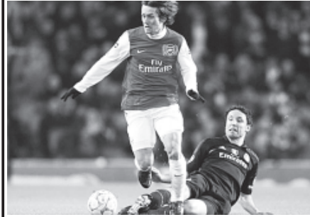
Midfielder Tomas Rosicky produced another impressive display for Arsenal on Tuesday night.