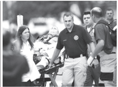
A sheriff deputy is transported after being shot at the County Courthouse on 7 March, 2012 in Tulsa, Okla. A sheriff's deputy and two other people were wounded Wednesday afternoon during an exchange of gunfire outside a courthouse plaza in Tulsa, police said.

The missile defence shield, which will be deployed in stages from 2011 until 2020 and involves the deployment of US interceptor missiles and radar in Europe, will be capable of intercepting long-range and intercontinental ballistic missiles.—Xinhua