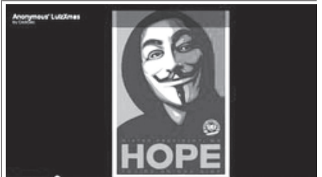
The hackers posted one of Lulzsec's old videos to Panda Lab's webpage as part of the attack.