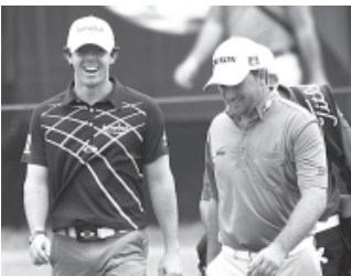
Rory McIlroy, left, and Graeme McDowell, both of Northern Ireland, chat as they walk to the ninth hole during a practice round for the World Golf Championships, on 7 March, 2012 in Doral, Florida.

DORAL, 8 March — Rory McIlroy and Tiger Woods are at Doral to build momentum in different ways. McIlroy is the new No. 1 in golf after winning the Honda Classic. He is not concerned with how long he can stay there as much as he is winning the Cadillac Championship