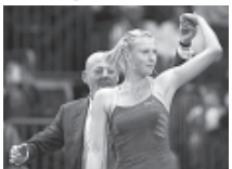
Maria Sharapova of Russia dances with a fan from the stands during her match against Caroline Wozniacki of Denmark in the BNP Paribas Showdown at Madison Square Garden in New York, on 5 March, 2012.

INDIAN WELLS, 8 March — Losing two grand slam finals in the past nine months has been bitter-sweet for Maria Sharapova as she continues her bid to return to the game's pinnacle from injury. The former world number one has not won any of the sport's blue riband