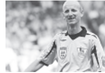
PGMOL chief Mike Riley had a 13-year career as a referee in the Premier League.

of Professional Game Match Officials Limited (PGMOL), met with members of Everton's Fans' Forum at Goodison Park in the first meeting of its kind. He gave an in-depth presentation about the work of PGMOL and advances in officiating in recent years, and engaged in a debate on a variety of refereeing issues with the supporters.