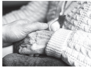
A woman, suffering from Alzheimer's disease, holds the hand of a relative in a retirement house in Angervilliers, eastern France.