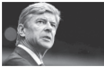
Arsenal boss Arsene Wenger

First-half goals from Laurent Koscielny, Tomas Rosicky and Robin van Persie gave Arsenal hope but AC Milan hung on to book their place in the quarter-finals. Despite the 4-3 aggregate