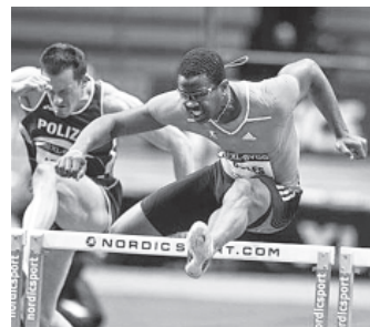
Dayron Robles of Cuba competes in the 60 meter hurdles event at the XL Galan indoor athletics meeting in Stockholm on 23 Feb, 2012.

"We wanted to give (Istanbul) a try but unfortunately things didn't flow properly and we had to come back (to Cuba)." The 25-year-old's trainer, Santiago Antunez said: "What Robles can't do is high intensity competition but we're already preparing for the Olympic Games." The Olympic Games in London are from 27 July to 12 August.— Internet