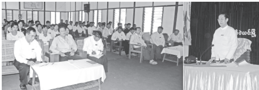
Union Minister for Cooperatives and for Livestock and Fisheries U Ohn Myint meets departmental officials and livestock breeding entrepreneurs in Dabayin Township.