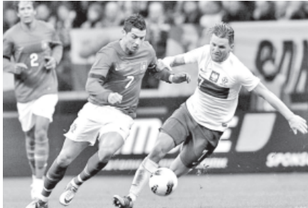
Portugal's striker Cristiano Ronaldo (C) fights for the ball with Poland's defender Damien Perquis during an international football friendly match between Poland and Portugal at National Stadium in Warsaw.

WARSAW, 1 March — Euro 2012 hosts Poland and qualifiers Portugal were unable to deliver a thriller for fans on Wednesday, drawing