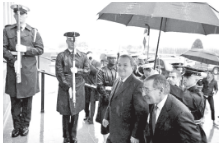
US Defence Secretary Leon Panetta (front) welcomes Israeli Defence Minister Ehud Barak (C) at Pentagon in Washington DC, the United States, on 29 Feb, 2012.