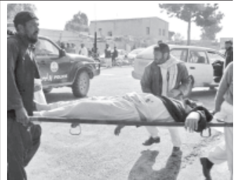
Men transport a wounded man to a hospital after a suicide car bomb attack in Helmand Province on 29 February, 2012. Six people were wounded including civilians when the suicide car bomber attacked a convoy of foreign troops in Lashkar Gah, capital of the southern Helmand Province, said senior police officer Kamaluddin Sherzad.

According to Xinhua , the highest annual figure of victims was in 2006, when sectarian strife killed 21,539 people and wounded 39,329.—Internet