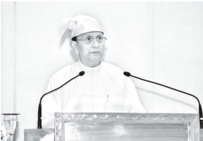
President of the Republic of the Union of Myanmar U Thein Sein delivering an address at first Pyidaungsu Hluttaw's third regular session.—MNA

NAY PYI TAW, 1 March— The following is the translation of the address delivered by President of the Republic of the Union of Myanmar U Thein Sein's at today's third regular session of first Pyidaungsu Hluttaw in accord with the section 210 of the Constitution in commemoration of the first anniversary of the government's inauguration.