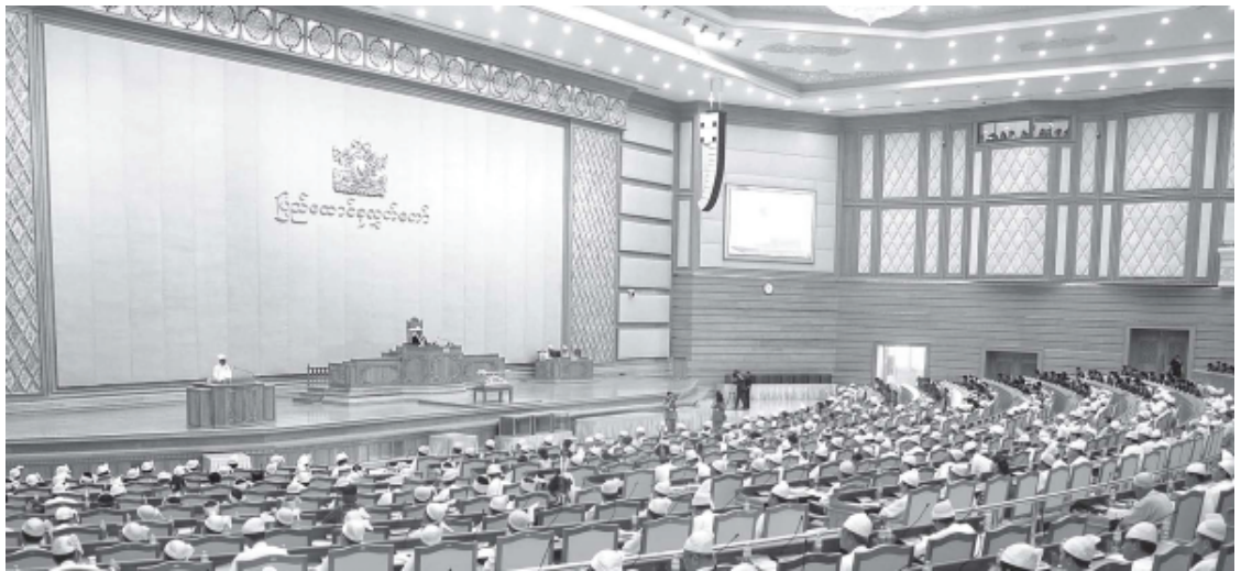
17 th day regular session of Pyidaungsu Hluttaw in progress.