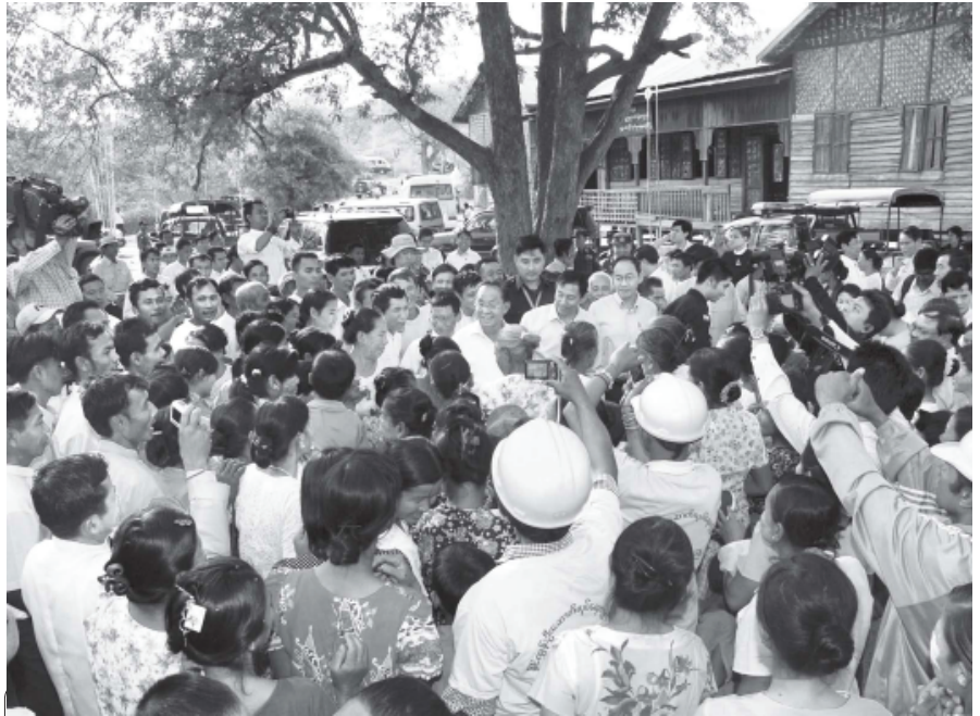
Vice-President Thiha Thura U Tin Aung Myint Oo cordially greets locals in Sartaing Village, Yenangyoung Township.

The Vice-President and party arrived back in Nay Pyi Taw in the evening. —MNA