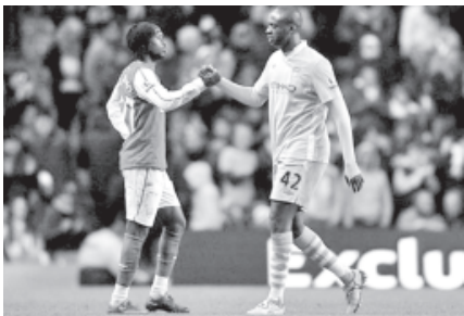
Manchester City beat Arsenal 1-0 in the Barclays Premier League in December.