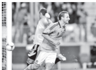
Spain's forward Roberto Soldado celebrates after scoring during the friendly football match Spain vs Venezuela at La Rosaleda stadium in Malaga. Soldado, in his first international run out since 2007, conjured up a hat-trick in Spain's 5-0 drubbing of last year's surprise Copa America semi-finalists Venezuela.

MALAGA, 1 March — Roberto Soldado, in his first international run out since 2007, conjured up a hat-trick in Spain's 5-0 drubbing of last year's surprise Copa America semi-finalists Venezuela in a friendly here on Wednesday. The reigning world and European champion's win was completed by goals from David Silva (41) — his first this year for club and country — and Andres Iniesta (37) as the hosts dominated this warm-up to Euro 2012. This was Spain's last appearance before coach Vicente del Bosque announces his squad for Poland and Ukraine in May. Valencia's Soldado came on after the break to leave his mark on the game with goals in the 49th, 52nd and 83rd minutes and advertise his claims for inclusion in the squad perhaps at the expense of Fernando Torres, who was left out of the squad. Venezuela were reduced to 10 men in the 66th minute with the sending off of Fernando Amorebieta for felling Soldado. — Internet