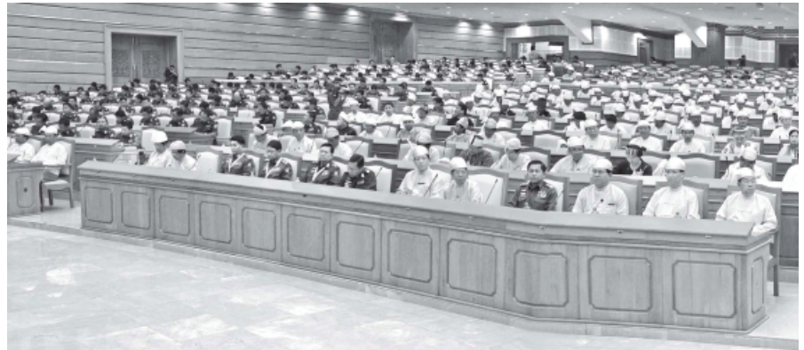
Representatives attend 17 th meeting of Pyidaungsu Hluttaw.

U Khet Htein Nam of Kachin State Constituency (1) suggested that plans should have been laid by the Ministry of Information for air programmes of ethnic races from MRTV as prescribed in Paragraphs (a) and (b) of Section (22) of the constitution to help develop language, literature, arts and culture of national people, national unity,