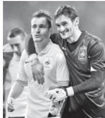
French captain Hugo Lloris (R) and defender Mathieu Debuchy react after the International friendly football match Germany vs France in the northern German city of Bremen.

Germany's Brazil-born striker Cacau scored a late consolation for the hosts, but the French deserved the win. It was a disciplined performance from France who open their Euro 2012 campaign against England in Donetsk on 11 June and Laurent Blanc's side dominated a weakened German team lacking five first-choice players. "I am very pleased with the game my team played, this was one