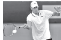
Top seed John Isner