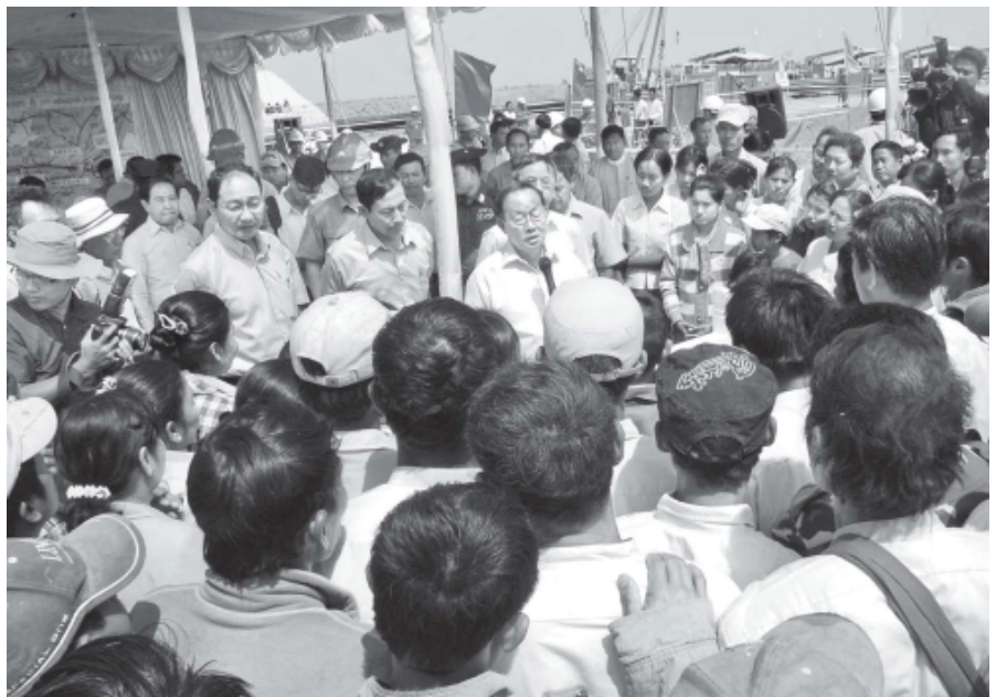
Vice-President Thiha Thura U Tin Aung Myint Oo explains connection of Myanmar-China natural gas and crude oil pipeline to locals, social organization members and villagers in Sagu pipeline connection site.—MNA

The Vice-President and Party proceeded to Magway