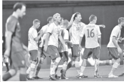
Sweden's players celebrate their team's score during their friendly football match against Croatia in Zagreb.

"It was a good game. We played against a very good team, we are very happy and hope that we can continue (playing) like this in the games to come," Ibrahimovic told Croatian national television. Asked about Sweden's chances at Euro 2012 Ibrahimovic said: "We'll do our best like any other team and you can never know what can happen at Euro but we hope for the best. "For sure we will prepare and hope to go as far as possible." Sweden have been paired alongside England, France and co-hosts Ukraine in Group D at Euro