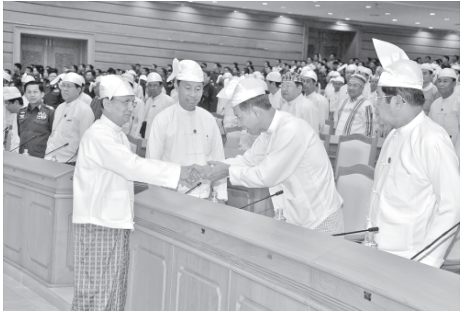
President of the Republic of the Union of Myanmar U Thein Sein cordially greets those present at 17 th day session of Pyidaungsu Hluttaw.—MNA

The three steps are the roadmap of the State to ensure eternal peace . This roadmap will entail such many strategies as infrastructures, economic opportunities, industrial zones, resettlement and rehabilitation measures, and social structures as education and health. It is compulsory for national race leaders, political parties, people's representatives and civil society organizations to stand united with our government until national races under the shade of peace can stand tall. We all must try our hardest to see national races youths, who had brandished guns, using laptops . By inviting local and foreign investments and welcoming assistance, we must fulfill their requirements from every conceivable angle. Our Union, home to over one