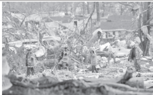
Emergency crews comb through some of the damage after a severe storm hit in the early morning hours on 29 Feb, 2012, in Harrisburg, Illinois, the United States.