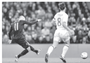
Former Chelsea winger Arjen Robben fires the Netherlands in front against England.

LONDON, 1 March — England produced a thrilling fightback against World Cup finalists Netherlands at Wembley only for the Dutch to win the friendly in injury time. The visitors had taken a 2-0 lead before England pegged them back in the final six minutes, but deep into stoppage time Arjen Robben saw his shot deflected into the England net to win it.