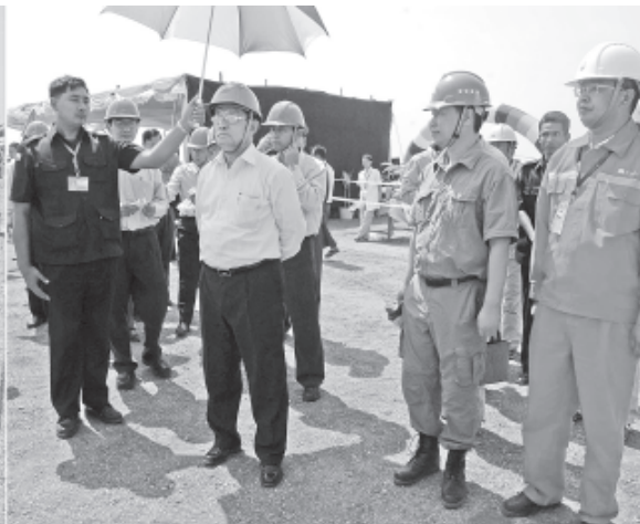
Vice-President Thiha Thura U Tin Aung Myint Oo inspects connection of Myanmar-China natural gas and crude oil pipeline in Sagu pipeline connection site in Magway Region.

Hospital where they were warmly welcomed by medical superintendent and officials concerned.