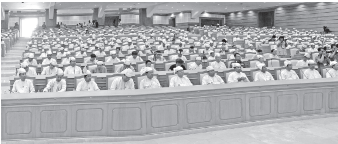
Representatives seen at 17 th day session of Pyidaungsu Hluttaw.

alongside subtle work plans, corruption and bribery will die down. Thus, we are taking time to restructure our administrative mechanism.