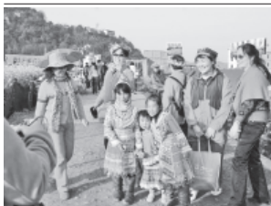
Tourists pose for photos with local children near the field of cole flowers in Luoping County, southwest China's Yunnan Province, on 29 Feb, 2012.