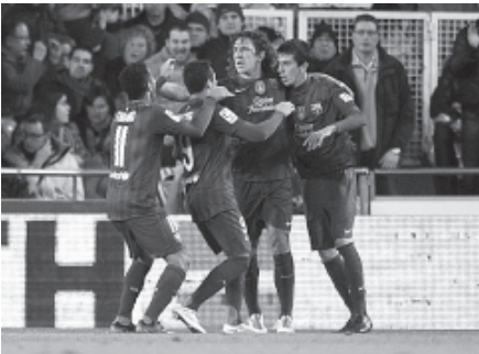
Barcelona's captain Carles Puyol (2nd R) celebrates with teammates after scoring during the Spanish Cup semi-final match Valencia CF vs Barcelona at the Mestalla stadium in Valencia.

VALENCIA, 2 Feb — A first leg match on Wednesday. Barcelona — veteran central defender Carles Puyol saw the Spanish champions come from behind to draw 1-1 with Valencia in their Spanish Cup semi-final