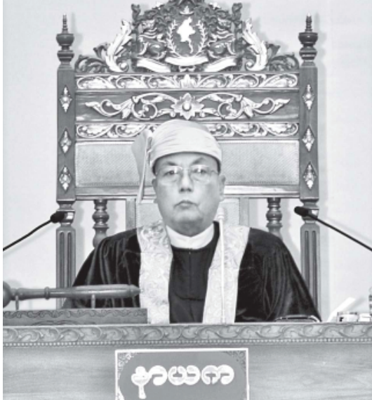
Pyidaungsu Hluttaw Speaker U Khin Aung Myint attends third day session of Pyidaungsu Hluttaw.

NAY PYI TAW, 2 Feb—The third day session of Pyidaungsu Hluttaw continued today at Pyidaungsu Hluttaw Hall of Hluttaw Building here, attended by Pyidaungsu Hluttaw Speaker U Khin Aung Myint, Pyithu Hluttaw Speaker Thura U Shwe Mann and 579 Pyidaungsu Hluttaw representatives.