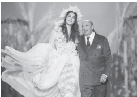
Spain's designer Francis Montesinos walks with a models after his Autumn/Winter collections of Madrid Mercedes-Benz Fashion Week (MBFW) in Madrid, Spain, on 1 Feb, 2012. The presentation of the Autumn/Winter 2012/2013 collections of MBFW kicked off on Wednesday.