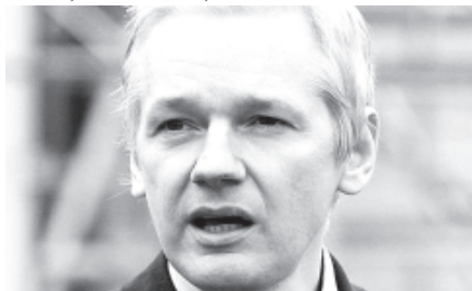
WikiLeaks founder Julian Assange begins the final phase of his fight to avoid extradition from London to Sweden for questioning on sex crime allegations. 2011 file photo.