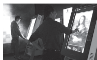
People use touch-screen computers to study details of the Mona Lisa painting at the "Leonardo da Vinci's Workshop: Inventor, Artist, Dreamer" exhibit shown at the Discovery Times Square Exposition on 20 Nov, 2009 in New York.