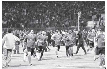
Team El-Ahly football players get away from the field during a football match riot at a stadium in Port Said of Egypt on 1 Feb, 2012. The death toll of a football match riot in Egypt's Port Said rose to 74 with hundreds of others injured, state media reported on Wednesday night.