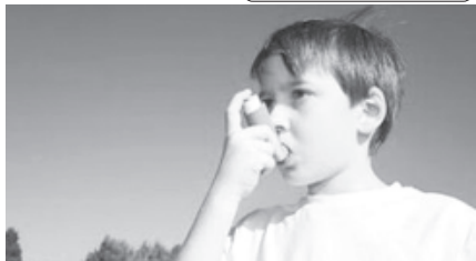
Asthma affects 1 in 10 children and adults in the UK. — INTERNET