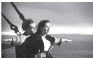
Leonardo DiCaprio and Kate Winslet are pictured in a scene from "Titanic" which was nominated on 10 February for a best picture Oscar for the 70th Academy Awards to be telecast live 23 March from the Shrine Auditorium in Los Angeles. Winslet was also nominated for best actress for her performance in the film.

The 1997 epic romance starring Kate Winslet and Leonardo DiCaprio will be released worldwide on 6 April. Written, directed and produced by James Cameron, the movie won 11 Oscars, including Best Picture. 14 April is the 100th anniversary of the sinking of the luxury liner in the Atlantic Ocean.—INTERNET