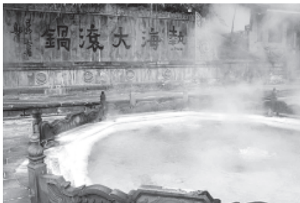
The hottest spring in the Rehai scenic area is known as the "Boiling Pot" for its extraordinary high temperatures.—INTERNET

Rehai, or the "Hot Sea" scenic area, is constantly enveloped by the steam produced from its many hot springs. The king of Rehai's hot springs is known as the "Boiling Pot", boasting temperatures as high as 97 degrees Celsius. As the heat is too much for the human body to withstand, the "Boiling Pot" has been adapted so that it can boil food such as eggs and peanuts, which are then