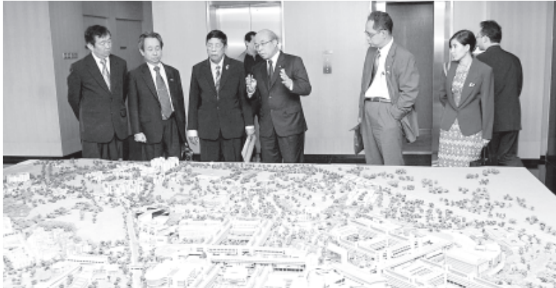
Union Education Minister Dr Mya Aye at Nanyang Technological University.—MNA

The two sides discussed matters related to arbitration in case of economic disputes, signing of investment agreement. Over 120 Singaporean businessmen are reported to come to Myanmar on 12 February to discuss matters related to investment in Yangon and Nay Pyi Taw. U Win Aung and party met personnel of Singapore Indian Chambers of Commerce and Industry and discussed further economic cooperation between Myanmar and India and Singapore-based Indian businessmen's visit to Myanmar.—MNA