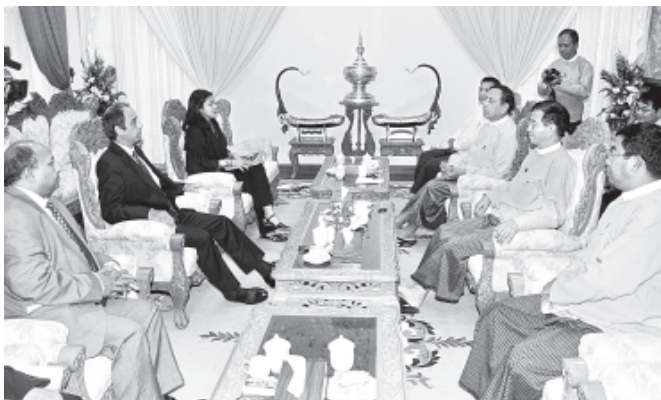
Union Minister for Rail Transportation U Aung Min receives Special Rapporteur on Human Rights Situations in Myanmar Mr Tomas Ojea Quintana.

NAY PYI TAW, 2 Feb—Special Rapporteur on Human Rights Situations in Myanmar Mr Tomas Ojea Quintana and party called on Union Minister for Rail Transportation U Aung Min at the latter's