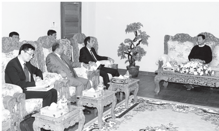
Attorney-General of the Union Dr Tun Shin receives Special Rapporteur on the situation of human rights in Myanmar Mr Tomas Ojea Quintana.