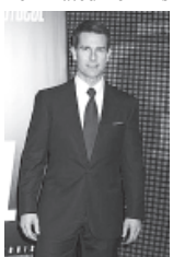
Three-time Oscar-nominated actor Tom Cruise is to be a presenter at the 84th Academy Awards ceremony in Los Angeles, telecast producers said on Wednesday.