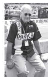
1. "Do I get to have sex with Madonna?"

2. "Will I forever be known as 'the ass [expletive] who spent $16,000 on a Super Bowl ticket?"