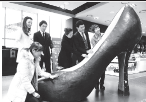
People appreciate a giant chocolate-made shoe displayed at the Hyundai Department Store in Seoul, South Korea, on 1 Feb, 2012. The department store said it took 60 kilogrammes of chocolate and two weeks to make the shoe with a height of 2 metres and a width of 3 metres.