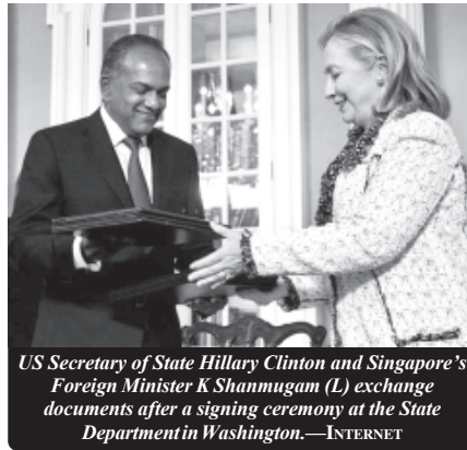
US Secretary of State Hillary Clinton and Singapore's Foreign Minister K Shanmugam (L) exchange documents after a signing ceremony at the State Department in Washington.

“In all of these areas and the new ones, we will jointly explore solutions to emerging 21st century challenges, and rely on our shared beliefs and aspirations when applying dynamic and practical solutions,” said the statement.—Xinhua