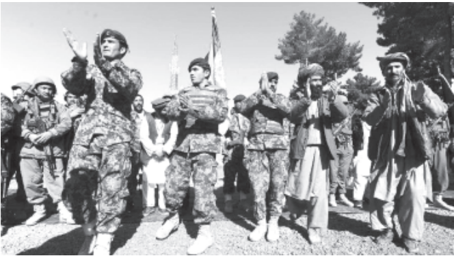
Afghan soldiers perform a dance during the second phase of security transition ceremony in Badghis Province, west Afghanistan, on 31 Jan, 2012. The security responsibilities of two districts including the provincial capital of Badghis was handed over from the NATO-led forces to Afghan security forces on Tuesday.