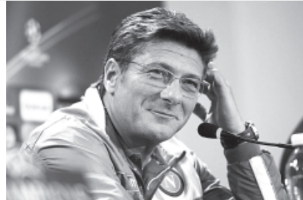
Napoli head coach Walter Mazzarri