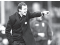
AC Milan head coach Massimiliano Allegri

ROME, 2 Feb—AC Milan head coach Massimiliano Allegri saw a blessing in disguise after his side lost to Lazio 2-0 on Wednesday, saying "a terrible game, but the defeat to Lazio can do us good." The Rossoneri could've gone top after