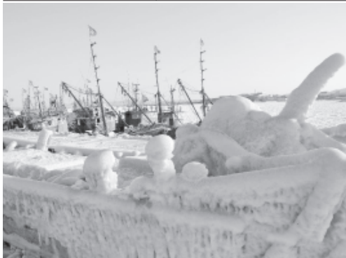
A fishing boat is frozen on the seashore of the Bohai Sea off the coast of Dalian, northeast China's Liaoning Province, on 1 Feb, 2012. The recent cold snap caused a drastic temperature drop in the Bohai Sea along the northern part of China, resulting in a quick build-up of sea ice.