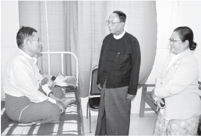
Speaker of Pyidaungsu Hluttaw U Khin Aung Myint comforts Amyotha Hluttaw Representative U Naing Tun Ohn at Nay Pyi Taw General Hospital (1000-bed).—MNA

NAY PYI TAW, 2 Feb—Speaker of Pyidaungsu Hluttaw U Khin Aung Myint comforted Amyotha Hluttaw representative U Naing Tun Ohn of Mon State Constituency No. 5 who was receiving medical treatment at Nay Pyi Taw General Hospital (1000-bed) at 3 pm today.