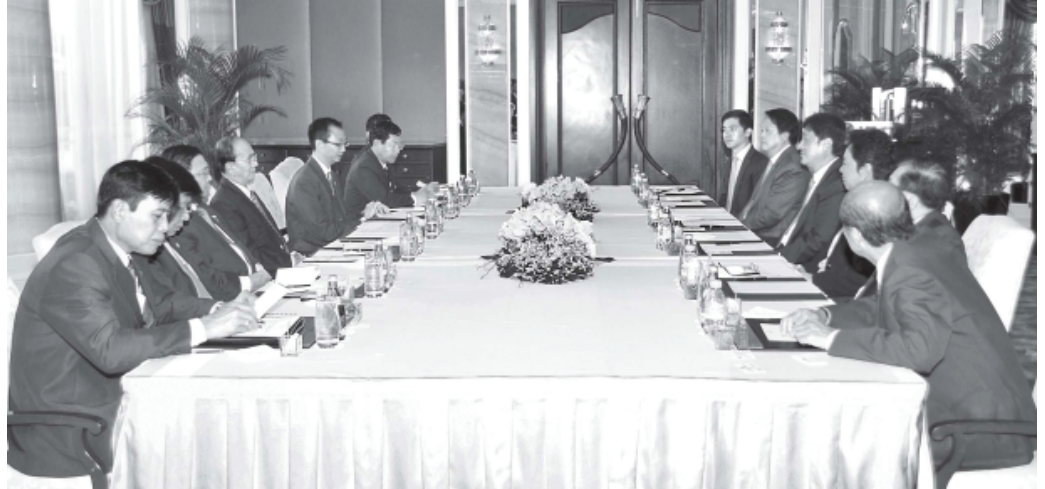
President U Thein Sein receives personnel of Malaysia-based Kuok and Wilmer investment companies at Shangri-La Hotel.