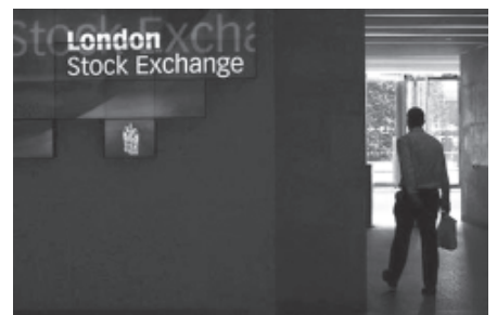
A man walks through the lobby of the London Stock Exchange on 5 Aug, 2011.

The defendants, all British nationals with Bangladeshi or Pakistani backgrounds, had been inspired by al Qaeda and the late radical Muslim cleric Anwar-al-Awlaki, Edis said.