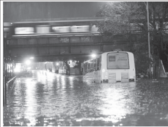
A bus is stranded at a flooded street in Buenos Aires, Argentina, on 1 Feb, 2012. Heavy rains hit the city on Wednesday, causing several streets flooded.