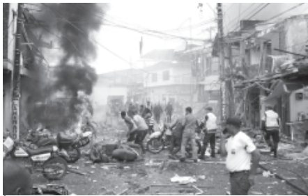
Residents and police rush to the site where a bomb exploded outside a police station in Tumaco on Colombia's southern Pacific coast, on 1 Feb, 2012.

The 1:58 pm blast occurred “in an area with a great abundance of population, as much for the hour as the geographical location,” Palomino said. It is the end of lunch hour in Colombia.