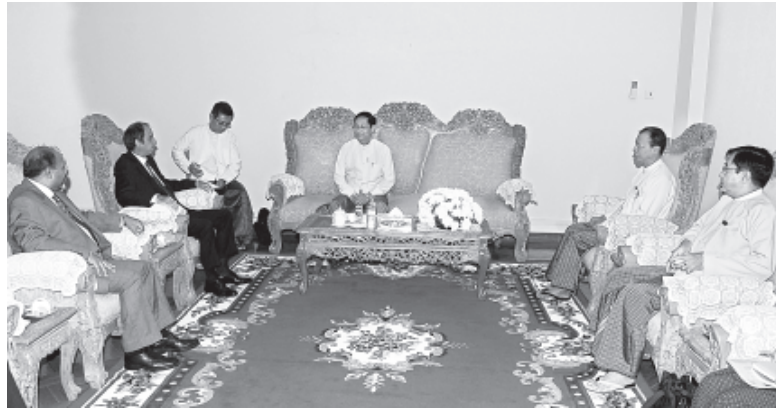
Deputy Education Minister U Ba Shwe receives Special Rapporteur on the situations of human rights in Myanmar Mr Tomas Ojea Quintana.