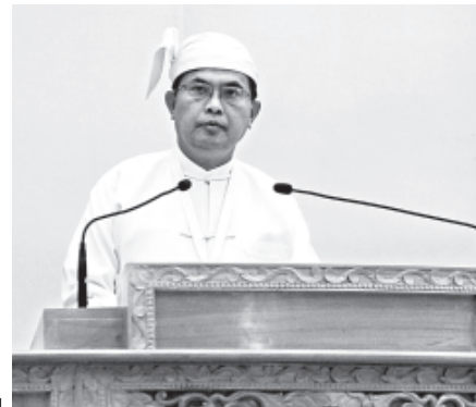
Union Minister for Labour U Aung Kyi makes clarification. —MNA

The meeting was adjourned this afternoon and the fourth-day session continues tomorrow.—MNA