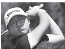
New Zealand teenager Lydia Ko, who at the weekend became the youngest player to win a pro golf tournament, hopes to compete at a US major this year, her coach said on Tuesday.