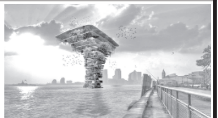
Design drawing of the Sea Tree, a multi-tiered structure comprising of layered green habitats by Dutch architect Koen Olthuis. This is a water-based park, which will offer favourable living areas for wild animals, also bring positive green effects to urban environments.

"A room like an office or a laboratory that may have few or no windows will have higher levels of indoor air pollutants than a room that has lots of windows. Also, if the room does not have good ventilation those levels would increase," she said. For her research, Weerasinghe is testing and analysing photocatalysts and dark catalysts, materials made by chemically bonding a metal to oxygen. Photocatalysts react to light while dark catalysts react to darkness.—Internet