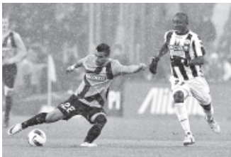
Juventus' midfielder Arturo Vidal (L) challenges for the ball with Udinese's defender Pablo Armero during their the Serie A football match between Juventus and Udinese at the "Juventus Stadium" in Turin on 28 January.

TURIN, 31 Jan—Juventus have been fined once again for racist chanting by their fans during Saturday's 2-1 victory against Udinese in Serie A. Colombian wing-back Pablo Armero and Cape Verde-born Switzerland midfielder