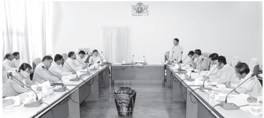
Coordination meeting on development of Naga region in progress.

NAY PYI TAW, 31 Jan—The Ministry of Agriculture and Irrigation held a coordination meeting on development of Naga region at its hall yesterday afternoon.