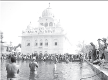
Indian Sikh devotees take a dip in the sarover (water tank) at the Sikh Shrine Gurdwara Chheharta Sahib on Basant Panchami, the Festival of Spring, celebrated mainly in Haryana and Punjab.