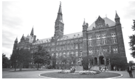
Healy Hall, at Georgetown University's main campus in Washington, DC in 2011. The part of the brain used for speech processing is in a different location than originally believed, according to a US study that researchers said will require a rewrite of medical texts.—INTERNET

Rauschecker and colleagues based their research on 115 previous peer-reviewed studies that investigated speech perception and used brain imaging scans—either MRI (functional magnetic resonance imaging) or PET (positron emission tomography).—Internet