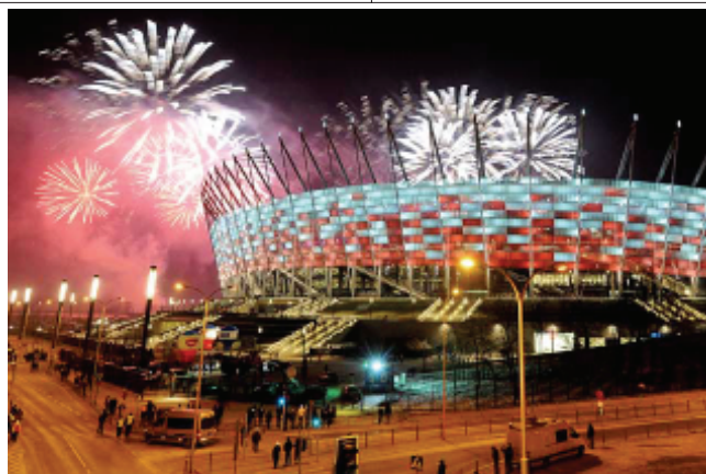
Thousands of football fans attend a rock concert and fireworks display to celebrate the opening of Poland's new National Stadium where the 2012 European Championship will kick off in June.

visited India, after a gap of six years, for the combined exercises with the ICG off Chennai. The visit was in pursuance of the Memorandum of Cooperation (MoC), signed between the two Coast Guards in November 2006, which stipulates that heads of the two organizations meet alternately in India and Japan, to discuss maritime issues of mutual concerns and formulate a cooperative approach to address them. The MoC encompasses issues of maritime search and rescue, combating marine pollution, technical assistance for responding to natural disasters and exchange of information regarding crime at sea, including smuggling and illicit trafficking. The first ICG-JCG combined exercises were carried out in November 2000 off Chennai in which one JCG ship had participated and led to close interaction between the two organizations that included regular visits and exercises, sharing of information and expertise and training visits, the ministry added.—Internet