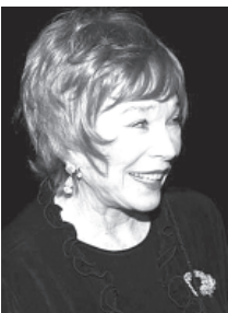
Oscar-winning American actress Shirley MacLaine is to join the cast of "Downton Abbey" next season, the British period drama's producers said Monday.

NEW YORK, 31 Jan—Oscar-winning American actress Shirley MacLaine is to join the cast of "Downton Abbey" next season, the British period drama's producers said on Monday. Season 2 of the ITV series is airing in the United States Sundays on PBS under the network's Masterpiece programming banner.