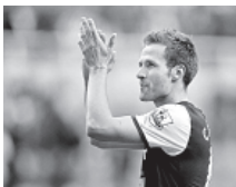
France midfielder Yohan Cabaye, pictured in 2011, has been charged with violent conduct following an incident during Premier League side Newcastle's FA Cup defeat by Brighton on Saturday.

The next season the club was punished four times, including a partial stand closure once, for fans anti-Balotelli chants.