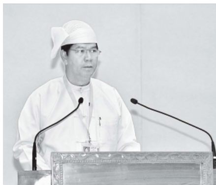
Union Minister for Finance and Revenue U Hla Tun makes clarification.