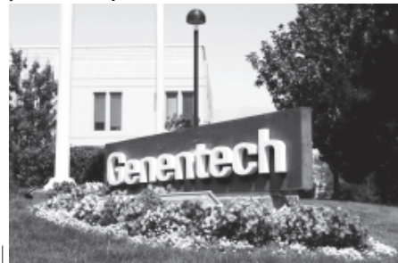
US authorities approved a new drug to treat the most common form of skin cancer, basal cell carcinoma, which is rarely lethal but can spread if left untreated.

advanced basal cell cancer who are not candidates for surgery or radiation and for patients whose cancer has spread to other parts of the body," said the FDA. —Internet