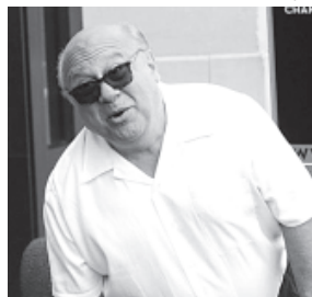
A bare-footed Danny DeVito, holds a replica plaque after he was honored with the 2,445th star on the Hollywood Walk of Fame during an unveiling ceremony in Los Angeles on 18 August, 2011.

DeVito and British actor Richard Griffiths will play an estranged comedy team who reunite for one last performance, the BBC reported. Performances of the show are scheduled at the Savoy Theatre from 27 April to 28 July. Griffiths won numerous awards for his work in the stage production of "The History Boys." He played a supporting role in the Harry