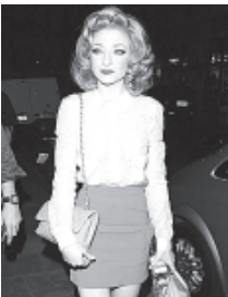
Girls Aloud singer Nicola Roberts.

LONDON, 31 Jan—Girls Aloud singer Nicola Roberts admits she felt "sad and angry" when the band went on hiatus as she didn't know what to do with herself.