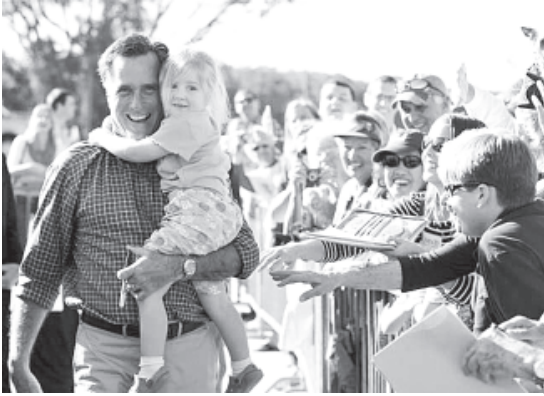
Republican presidential candidate, former Massachusetts Gov Mitt Romney, carries a young girl as he campaigns at Eastern Ship Building in Pensacola, Florida.