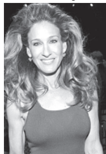
Actress Sarah Jessica Parker

recover and has dropped out of the film in which she was to play feminist Gloria Steinem.