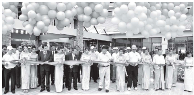
Opening ceremony of Club House of Royal Mingaladon Golf & Country Club in progress.