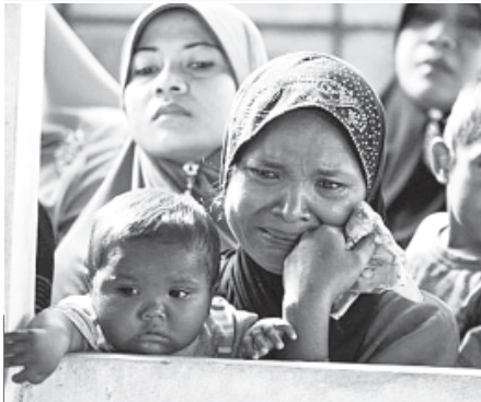
Relatives of Thai men shot dead by paramilitaries mourn during their burial at a cemetery in Thailand's restive southern province of Pattani, on 30 January. Thai paramilitaries shot dead four people including an elderly man and a teenager in the kingdom's violence-torn far south because they feared they were under attack, according to police.