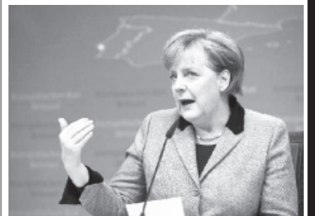
German Chancellor Angela Merkel attends a Press conference after EU's informal summit at EU headquarters in Brussels, capital of Belgium, on 30 Jan, 2012. All EU member states except Britain and the Czech Republic would join and sign a new fiscal treaty designed to enshrine tighter deficit and debt discipline, European Council President Herman Van Rompuy said here late on Monday.

Even for low-income Singaporeans at the 20th percentile, real income has grown over the last five years.