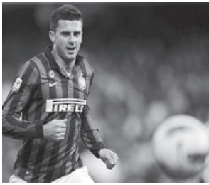
Brazilian-born Italy midfielder Thiago Motta, seen here in 2011, joined Paris St Germain from Inter Milan for a fee believed to be in the region of 10 million euros.

Motta qualified to play for Italy through Italian grandparents and made his Italy debut in February 2011, despite having already represented Brazil at the 2003 CONCACAF Gold Cup competition.