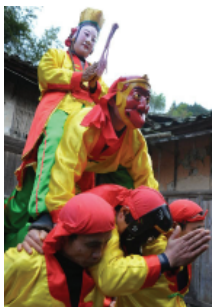
Actors perform traditional Nuo dance at Zhuyuan Village in Nanfeng County, east China's Jiangxi Province, 30 Jan, 2012. "Nuo", a sacrificial ritual that is staged at the beginning of the Chinese Lunar New Year to expel evil spirits and pray for blessings and good harvests, is popular in some regions of China.