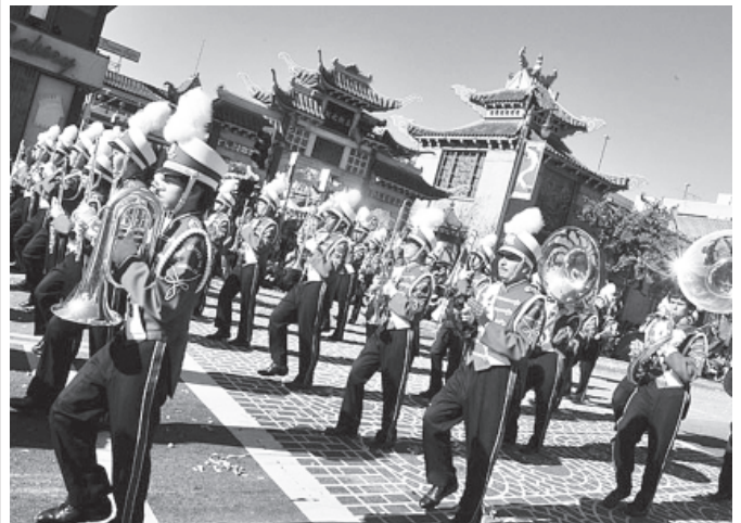
A band parades on 28 Jan, 2012 in downtown of Los Angeles, at the traditional Chinese New Year festivities in the California's metropol.

New Wave Entertainment has so far refused to return the funds.