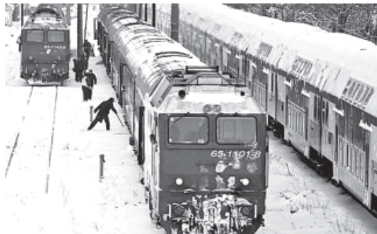
Heavy snow storms paralyzed southern and eastern Romania, causing train delays and severe congestion on the roads.—INTERNET