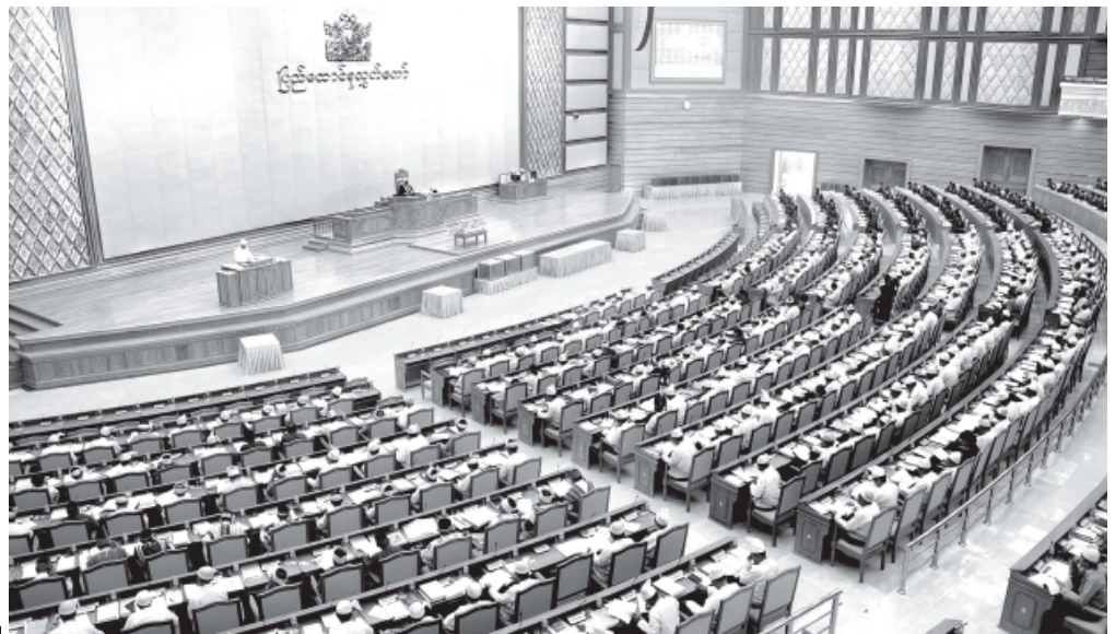
First day third regular session of First Pyidaungsu Hluttaw in progress.

After submitting the bills, National Planning Bills will be discussed and approved as a first phase. As a second phase, a discussion on Supplementary Union Budget Allocation Bill (2012) will be held based on the approved Bills and on National Planning