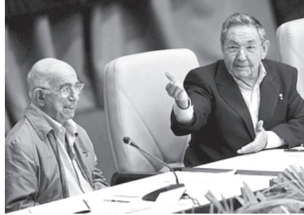
Cuba's President Raul Castro, right, and Cuba's Vice-President Jose Ramon Machado Ventura attend the closing ceremony of the Communist Party Conference in Havana, Cuba, on 29 Jan, 2012.