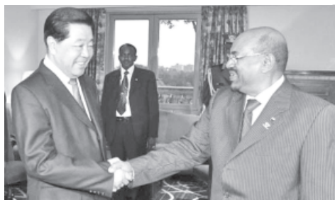
Jia Qinglin (L), chairman of the National Committee of the Chinese People’s Political Consultative Conference, meets with Sudanese President Omar al-Bashir (R) in Addis Ababa, capital of Ethiopia, 28 Jan, 2012.