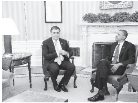
US President Barack Obama (R) meets with Georgian President Mikheil Saakashvili in the Oval Office of the White House in Washington DC, capital of the United States, on 30 Jan, 2012. Obama on Monday offered his support for Georgia's accession to NATO and a possible free trade agreement between the two countries.

For India, the stakes are clearly high, with the strategic Andaman and Nicobar Islands dominating the approaches to Malacca Strait, the report said.—Xinhua