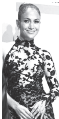
Singer and actress Jennifer Lopez will be a presenter at the 84th Academy Awards ceremony in Los Angeles, the telecast's producers said Monday.