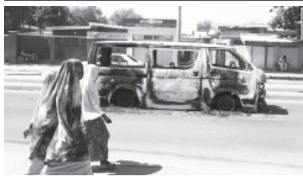
Young Nigerian girls walk past a vehicle burned in Daturu, Yobe State, northeastern Nigeria, in November.

The five-year project would also offer 500 new jobs across the country, the ministry of defence said.