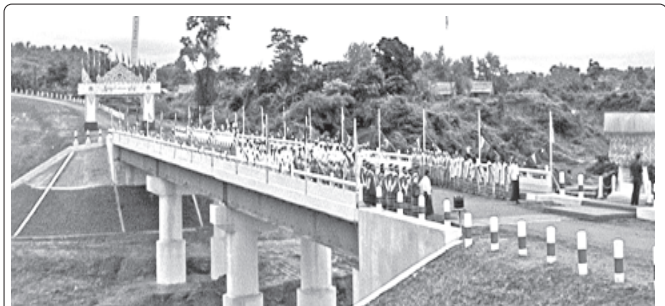
Myo Creek Bridge commissioned into service in time of new government