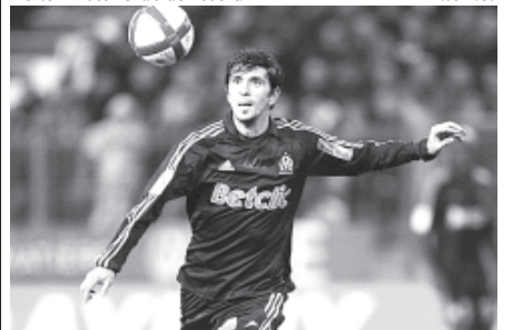
Marseille midfielder Lucho Gonzalez.