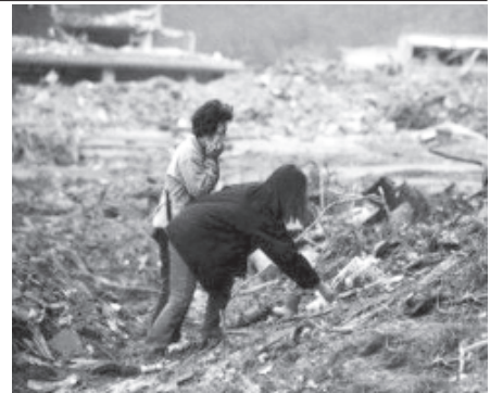
File photo of family members offering flowers to lost children at the site where a school was washed away in Ishinomaki.

"The (missing) person is in the mind of his or her family but they still want proof that the person lived in this world. I think it's hard for them to accept the reality" without a body, he said. The massive tsunami that pummelled Japan in March last year claimed more than 19,000 lives. One-in-six of the