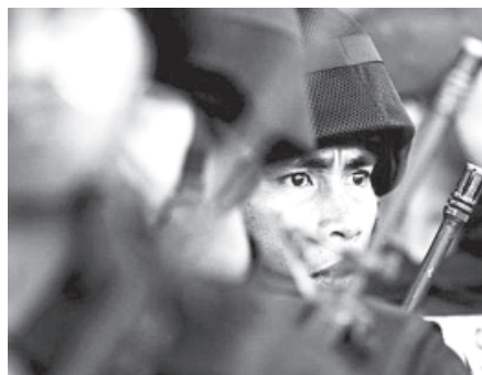
Police officers attend a ceremony in Manila in 2011. Philippine police arrested three men on Sunday in a sting operation that netted illegal drugs worth over two million dollars, officials said.