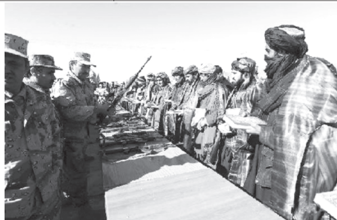
Taliban fighters (R) attend a surrender ceremony in western Afghan Province of Herat, on 30 Jan, 2012. Thirty more Taliban rebels surrendered in the Afghanistan's western province of Herat on Monday, a provincial police source said.