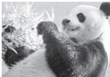
Male giant Panda Yang Guang (Sunshine) relaxes with some bamboo in hand in his enclosure at Edinburgh Zoo on 12 Dec. Yang Guang and female panda Tian Tian have been removed from public view this weekend after falling ill with colic, a zoo spokeswoman said.

A number of roads have been closed in the area and motorists are being told to avoid the area.—Xinhua