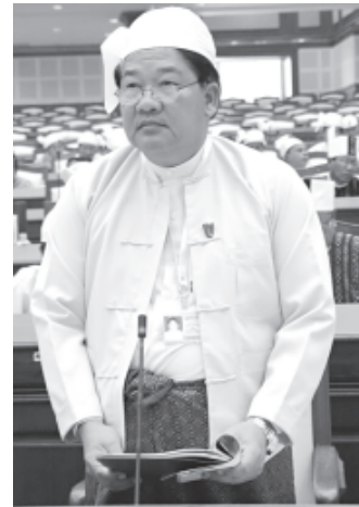
Union Minister for Health Dr Pe Thet Khin answers queries. MNA

U Thein Tun Oo of Amarapura Constituency asked whether there is plan to allow MBBS graduates in Myanmar to attend Master degree courses for preferred subjects or take admission exams before the government cannot offer them jobs. The Union minister answered: