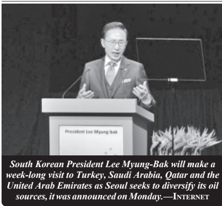
South Korean President Lee Myung-Bak will make a week-long visit to Turkey, Saudi Arabia, Qatar and the United Arab Emirates as Seoul seeks to diversify its oil sources, it was announced on Monday.

In 2010 South Korea discussed a $20 billion project to build nuclear reactors in Turkey but negotiations were suspended due to differences. South Korea operates 20 nuclear plants that generate some 35 percent of its electricity needs, and is eager to export its expertise as a new growth engine.— Internet