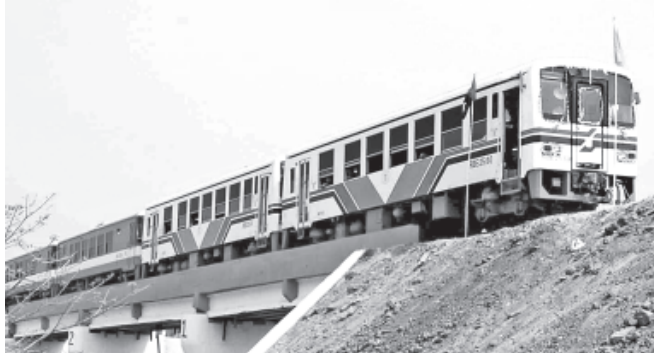
Photo shows a train running on Thayet-Minhla road session.