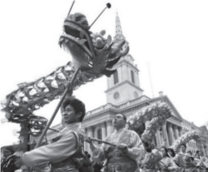
Performers make their way through central London as they take part in Chinese New Year celebrations. Thousands of people packed into London's Trafalgar Square to celebrate Chinese New Year, with pyrotechnics and dancers in dragon costumes entertaining the crowds.

LONDON, 30 Jan—Thousands of people packed into London's Trafalgar Square on Sunday to celebrate Chinese New Year, with pyrotechnics and dancers in dragon costumes entertaining the crowds.