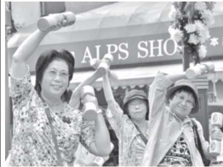
This file photo shows elderly people working out with wooden dumbbells at the grounds of a temple in Tokyo. Japan's population is expected to shrink to a third of its current size over the next century, with the average woman living to over 90 within 50 years, according to a government report.

Japan's population has been declining as many young people have put off starting families, seeing it as a burden on their lifestyles and careers. A slow economy has also discouraged young people from having babies.—Internet