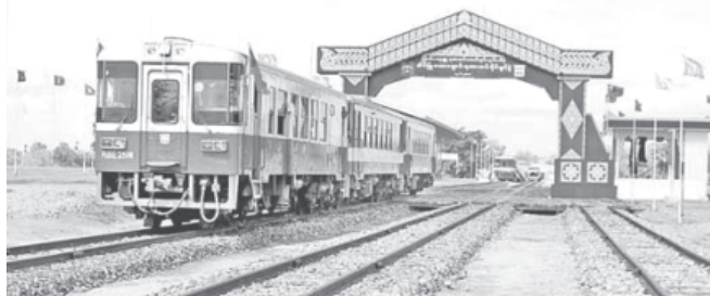
Seikpyu-Yawchaung railroad section opened on 12 June, 2010 in Seikpyu, Pakokku District in Magway Region.