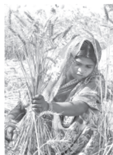
An Indian farm labourer uses a scythe to harvest wheat in a field on the outskirts of Amritsar in 2011. More intense heat waves due to global warming could diminish wheat crop yields around the world through premature ageing, according to a study published in Nature Climate Change.

Current projections based on computer models underestimate the extent to which hotter weather in the future will accelerate this process, the researchers