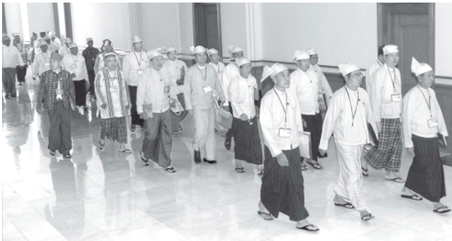
Amyotha Hluttaw Representatives attending third regular session.