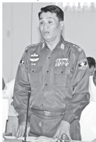
Union Minister Lt-Gen Thein Htay replies to the queries.—MNA

To bring Human resource development to the country, it is necessary not only to promote the education standard but also to uplift the health standard, thinking, morality etc. Therefore, the government, people, businessmen and social organizations and INGOs are to work together for the human resource development.