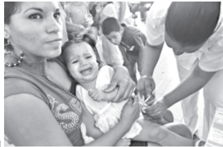
A nurse vaccinates a child against Pneumococcus-caused pneumonia in Managua in 2011. Bugs that cause childhood pneumonia and meningitis have evolved to evade vaccines by swapping bits of their genome with other bacteria, according to a study published.

Vaccines that protect against these so-called pneumococcal infections are designed to recognise a material on the outer surface of a bacterium's cell called polysaccharide.