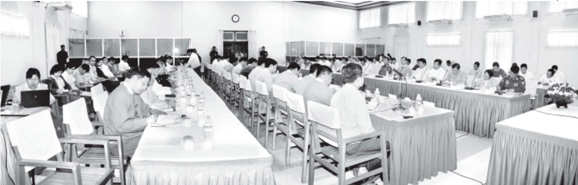
Vice-President Dr Sai Mauk Kham addresses coord meeting on Drawing and Implementation of Human Resources Development Project.

that the natural resource based economy is now changing into human resource based economy or knowledge based economy, and the human resource based economy is making much more