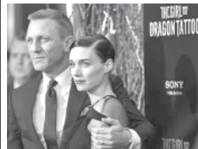
Cast members Daniel Craig (L) and Rooney Mara arrive for the premiere of the film "The Girl with the Dragon Tattoo" in New York on 14 Dec, 2011.

Helen Hunt and John Hawkes and is about a man's quest to lose his virginity while mostly confined to an iron lung, won the Audience Award for best drama. The film, based on the life of poet and journalist Mark O'Brien, fetched one of the highest selling prices at the festival—a reported $6 million—and with its mix of comedy and drama could turn out to be one of the bigger US indie hits in cinemas to come out of the festival.