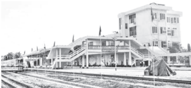
Pakokku-Kyunchaung railroad section opened on 20 November, 2009.