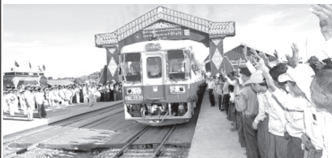
A special train running from Thayet to Kanma.

"My special thanks go to the government for opening Seikpyu-Yawchaung railroad section as we no more have to cross Yaw creek by boat."