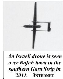
An Israeli drone is seen over Rafah town in the southern Gaza Strip in 2011.

The huge drone, of which the army only has a few in service, is the size of a Boeing 737 , can fly 36 hours non-stop—bringing Israel's arch-foe Iran within range—and carry a payload at an altitude of 13,000 metres (40,000 feet).