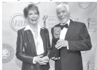
Actress Mary Tyler Moore poses backstage after accepting the Lifetime Achievement Award from presenter Dick Van Dyke at the 18th annual Screen Actors Guild Awards in Los Angeles, California on 29 Jan, 2012.

When she entered show business at age 18 in 1955, Moore said, there were already six others Mary Moores in the Screen Actors Guild.