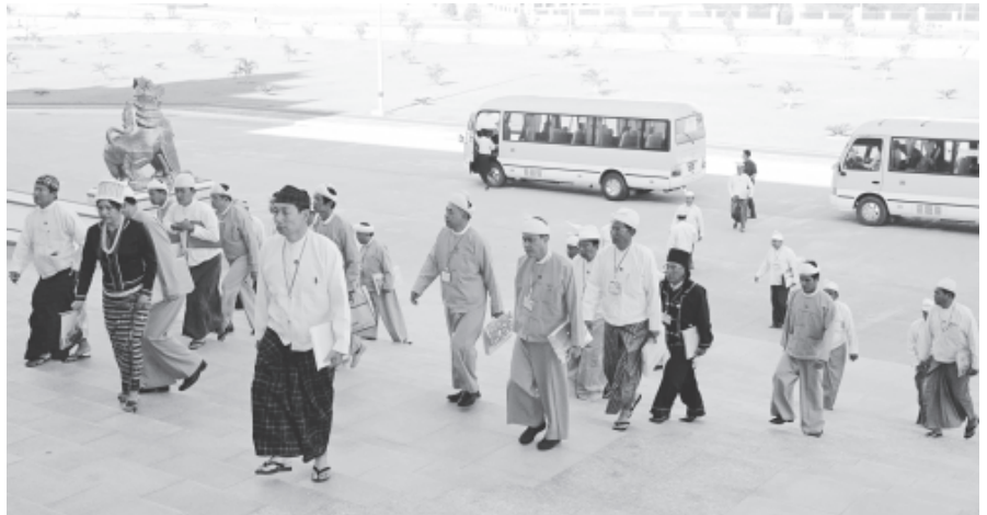
Pyithu Hluttaw Representatives at third regular session of Pyithu Hluttaw.

Upon completion of the power station, the budget for installing 25-mile 66-KV power grid to the river water