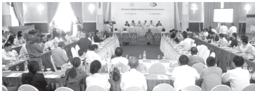
Media development workshop of Myanmar Writers and Journalists Association and Asia Media Information and Communication Centre from Singapore in progress.

A total of 11 resource persons— nine from abroad and two from home— will discuss papers on media related laws- responding to internet age, disseminating public information in a democratic society, journalists' perspective on media's role in a democracy and roundtable discussion on media law reforms and social responsibility of the media, till tomorrow.