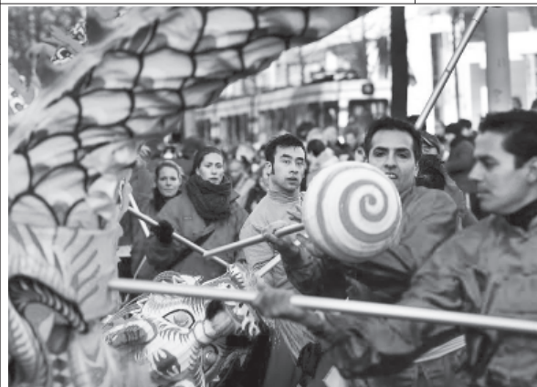
People perform Chinese dragon dance during the Chinese Spring Festival celebration in Hague, the Netherlands, on 28 Jan, 2012.

European leaders were to meet later Monday in Brussels to discuss austerity and belt-tightening measures as well as a tentative deal reached Saturday between Greece and its private investors that could avert a disastrous Greek default on its debt.— Internet