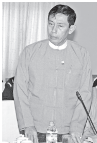
Union Minister U Than Htay responds to the questions.—MNA

After that, Union Minister for National Planning and Economic Development U Tin Naing Thein presented the report on agenda that should be included in drafting plan for human resource development project and formation and duties of committee and subcommittee. Afterwards, Union Minister for Border Affairs and for