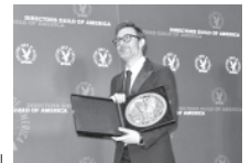
Director Michel Hazanavicius with his DGA award on 28 Jan in Hollywood, California.

won the top prize from the Producers Guild of America (PGA) earlier this month—another key pre-Oscar bellwether—and picked up three Golden Globes including best picture on 15 January.—Internet