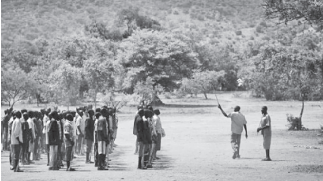
Recruits for the Sudan People's Liberation Army training in a secret camp in the Nuba mountains of South Kordofan in 2011.