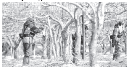
This file photo shows a farmer pruning pear trees at a plantation in Fukushima prefecture. Japanese scientists are studying how radiation has affected plants and animals living near the crippled Fukushima nuclear plant, according to an official.—INTERNET

Parts of the exclusion zone are expected to be reclassified to allow people to move back to their homes over the next few years, but other areas are expected to be uninhabitable for several decades.—Internet