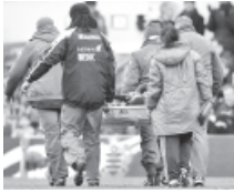
Ramires of Chelsea is stretchered off the pitch after sustaining an injury during their FA Cup soccer match against Queens Park Rangers at Loftus Road in London, on 28 Jan, 2012.