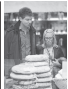
People degust bread during the Fine Food Days Linz in Linz, capital of Oberoesterreich, Austria, on 28 Jan, 2012.