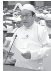
Pyithu Hluttaw Representative U Win Naing of Shwegu constituency raises questions. MNA

schools and clerks and other staffs in middle/high schools. The deputy minister answered: One headmaster/headmistress, teachers and one general worker are employed in primary schools. Upper divisional clerks, lower divisional clerks and other ranks are employed in middle and high schools.