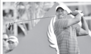
Tiger Woods tees off during the third round of the Abu Dhabi Championship at the Abu Dhabi Golf Club, on 28 Jan.