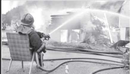
Can you be lazier?