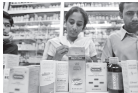
This file photo shows staff checking batch numbers of Ranbaxy medicines at a shop in Mumbai. Shares of Indian pharmaceutical giant Ranbaxy slumped to a near-nine-month low on Friday due to costs of a proposed settlement with US authorities over alleged violations of safety manufacturing guidelines.