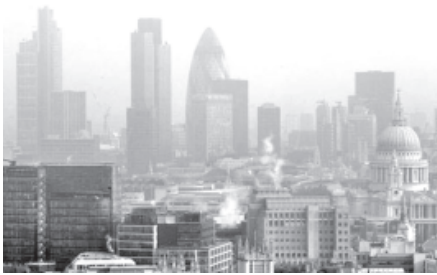
The skyline of the City of London. The 2012 Olympics organizers have released more than 120,000 hotel room nights back onto the open market.

LONDON, 30 Jan—London 2012 Olympics organizers have released more than 120,000 hotel room nights back onto the open market, they announced. They confirmed that some 20 percent of the room nights they had reserved in London would be returned to hotels to offer up to other customers. The spaces had been reserved to provide accommodation for media, global sport federations, the International Olympic Committee, Games workers and sponsors. The rooms at more than 200 hotels, range from five-star to budget accommodation. Hundreds of thousands of visitors are expected to flock to London for the 27 July to 12 August Games, whether ticket holders or not. As part of the bid to stage the 2012 Olympics, agreements had been struck