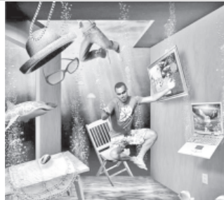
Fascinating underwater world

for help but the workers at the Asda store in Weymouth said they were prohibited by safety regulations from pushing the button that would have released the stalled elevator car. An Asda spokeswoman said the technician actually arrived within 20 minutes and needed another 30 minutes to work on the machinery before the button could be pushed.