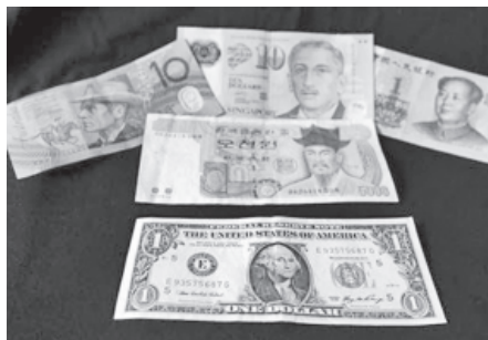
A US dollar note (bottom) is pictured alongside other currencies including (L-R) the Australian Dollar, Singapore Dollar, Korean Won and China's Yuan in this picture illustration taken in Washington, on 14 October, 2010.

yuan trading markets, and the government-backed Shanghai Interbank Offered Rate, or Shibor, would be the benchmark for yuan credit everywhere.