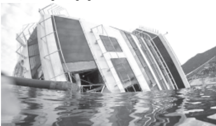
View of the bow of the grounded cruise ship Costa Concordia off the Tuscan island of Giglio, Italy, on 27 Jan, 2012.