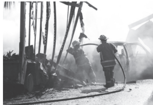
Firemen hose down a commercial carrier truck on Interstate 75 near Gainesville, Fla, after it was involved in a multi-vehicle wreck which killed at least nine people in the early hours of on 29 Jan, 2012.