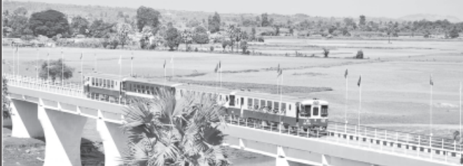
A special train running from Thayet to Kanma.