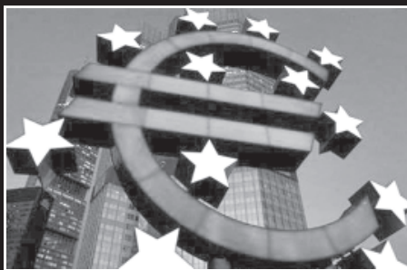
A huge sculpture of the euro symbol, constructed by German [designer Otmar Hoerll], is illuminated during a test in front of the European central bank (ECB) headquarter in Frankfurt, on 20 December, 2001.