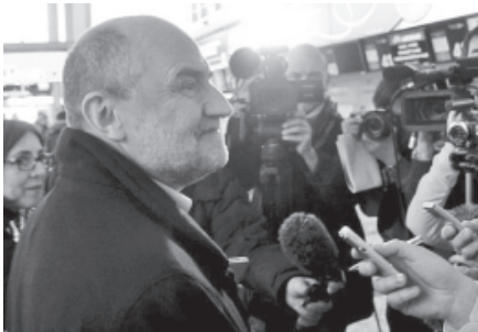
Herman Nackaerts of the International Atomic Energy Agency, IAEA, the chief agency official in charge of the Iran file, prepares for his flight to Iran at Vienna's Schwechat airport, Austria, on 28 Jan, 2012.

The team is likely to visit an underground enrichment site near the holy city of Qom, 80 miles (130 kilometres) south of Teheran, which is carved into a mountain as protection from possible airstrikes.