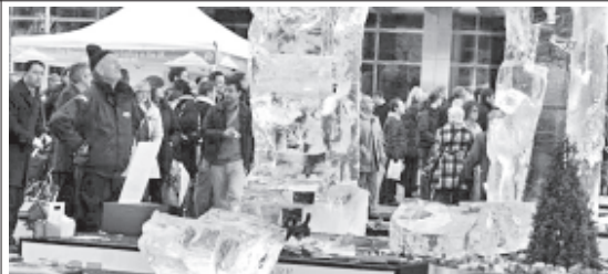
People look at ice sculptures during the London Ice Sculpting Festival in London on 13 Jan, 2012. The annual festival runs from 13 to 14 January this year.—XINHUA

The ambulance service says there are no reports of damage or injury. GNS Sciences said early this month that aftershocks might continue in Canterbury for the next 30 years.—Xinhua