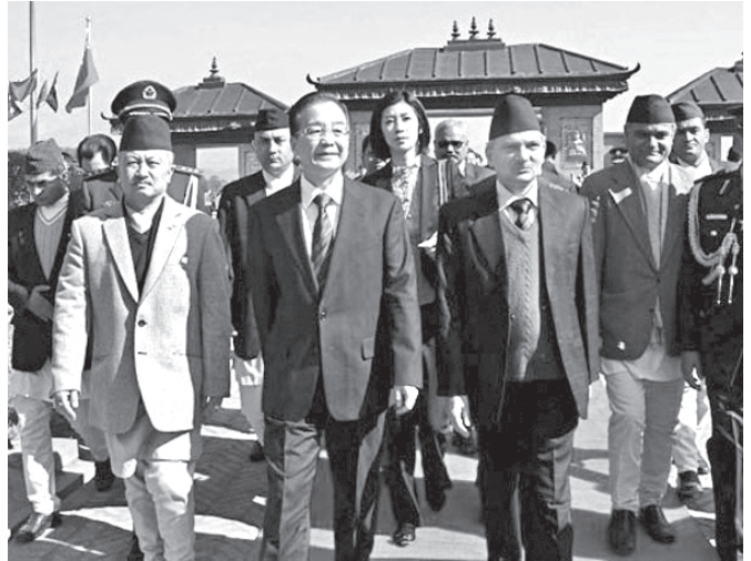
Chinese Premier Wen Jiabao (C, front) is accompanied by Nepalese Prime Minister Baburam Bhattarai (R, front) during the welcoming ceremony in Kathmandu, Nepal, on 14 Jan, 2012.— XINHUA