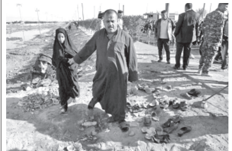
People inspect the scene of a bomb attack on Shiite pilgrims, killing and wounding scores of people, police said, near the southern port city of Basra, Iraq's second-largest city, 550 kilometres (340 miles) southeast of Baghdad, Iraq, on 14 Jan, 2012.