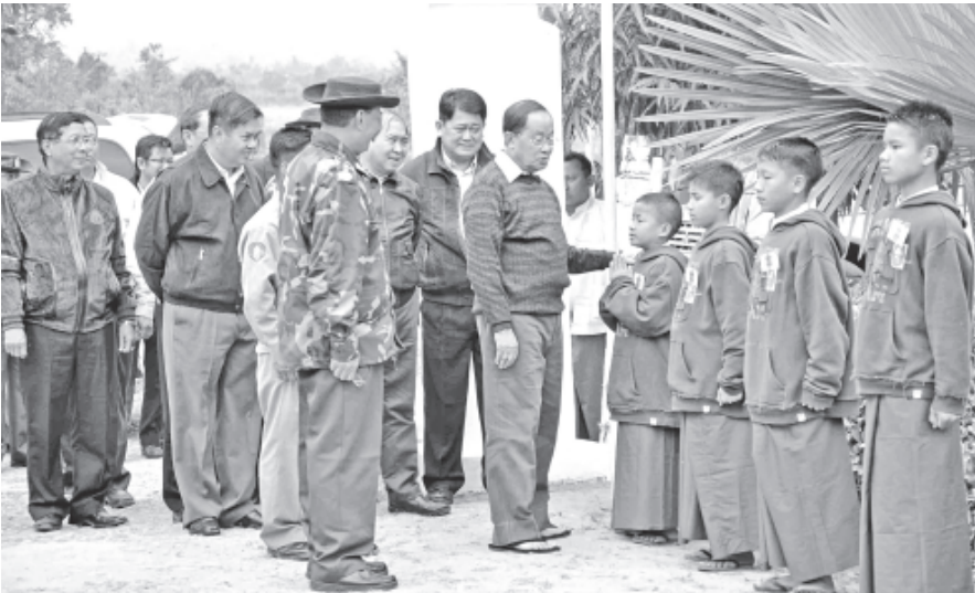
Vice-President Thiha Thura U Tin Aung Myint Oo converses with trainees of Border Region Nationalities Youths Development Training School (Hkamti).

Speaking on the occasion, the Vice-President said arrangements have been made for the students who have matriculated from the training school to join Ywathitgyi National Races Development University in Sagaing Region for BED, arts & science and GTI course and then to pursue B. Tech and BE course if qualified. Plans are being made for them to be able to work at respective departments after graduating.