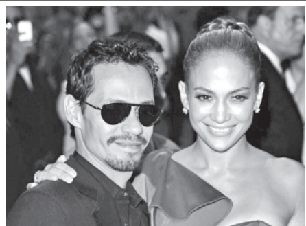
In this 7 June, 2011 photo, Marc Anthony and Jennifer Lopez attend the Samsung Hope for Children Gala in New York.