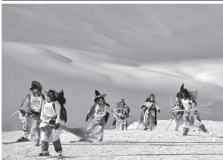
Participants ski in the 30th edition of the Belalp Witches Ski Race on 14 Jan, 2012 in Belalp, Switzerland. The race is inspired by a legend dating back to the middle ages, of a witch who tormented villagers in the area until she was burnt to death.