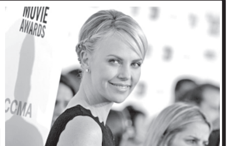
Charlize Theron arrives at the 17th Annual Critics' Choice Movie Awards on 12 Jan, 2012 in Los Angeles.

Orlando Bloom and his wife, model Miranda Kerr, charmed partygoers together, while model Agyness Deyn