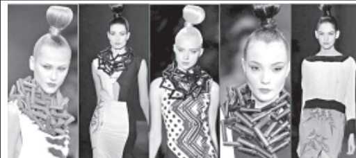
Models presented creations from Filhas de Gaia's collection during Fashion Rio Winter 2012 in Rio de Janeiro, Brazil.