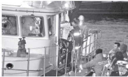
The South Korean man was brought ashore on a rescue boat, after being found with his wife.

The man and woman, about 29 years old, were both said to be in good condition when they were brought ashore. Meanwhile, divers are continuing to comb submerged parts of the ship, which is lying on its side close to a coastal island. The vessel, which is operated by Costa Cruises, had sailed from