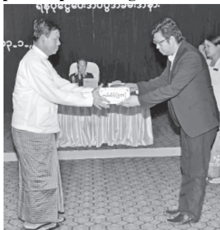
Chairman of IGE Co U Nay Aung presents cash for regional development.—MNA

He pointed out that loans from the fund are to be disbursed to the borrowers at not more than 2 per cent interest rate. The 50% of interests obtained from the loans are to be spent on education, health, regional development and poverty alleviation tasks, he said. The remaining 50% interest is to