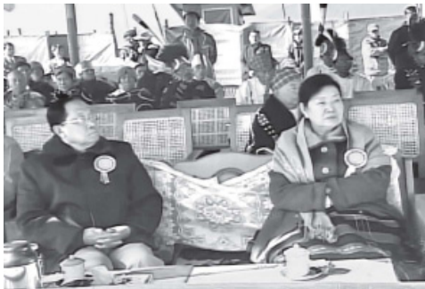
Naga Traditional New Year Festival 2012 in progress in Leshi of Naga Self-Administered Zone.—MNA

NAY PYI TAW, 15 Jan—Naga nationals celebrated their New Year festival 2012 in Leshi of Naga Self-Administered Zone of Sagaing Region this morning.