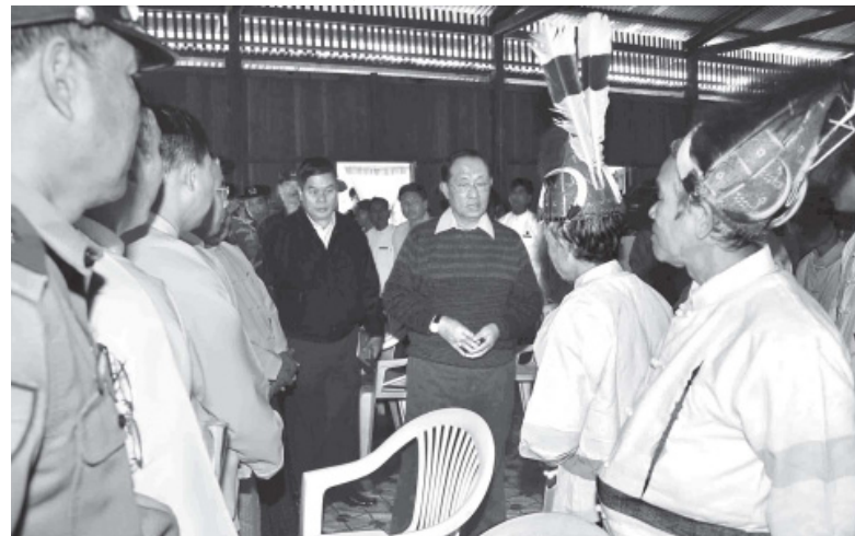
Vice-President Thiha Thura U Tin Aung Myint Oo cordially greets to those at Nanyun Township General Administration Department.