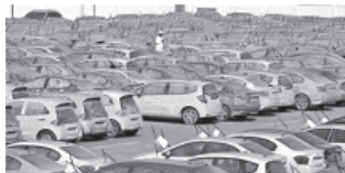
A Honda staff member walks between Honda Motor cars after floodwaters receded at the Honda Automobile Plant in Rojana Industrial Park in Ayutthaya, about 80 km north of Bangkok, on 27 December, 2011.