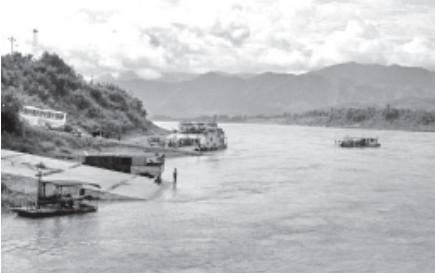
This file photo shows boats crossing Mekong River. Unidentified attackers fired on a Chinese cargo boat on the Mekong River in Laos on Saturday evening, China's police said, less than two months after Beijing began joint patrols to protect shipping.—INTERNET

No one was injured in the incident but passengers were forced to stay in Japan overnight, the reports said. The airline was not immediately available for confirmation.— Internet