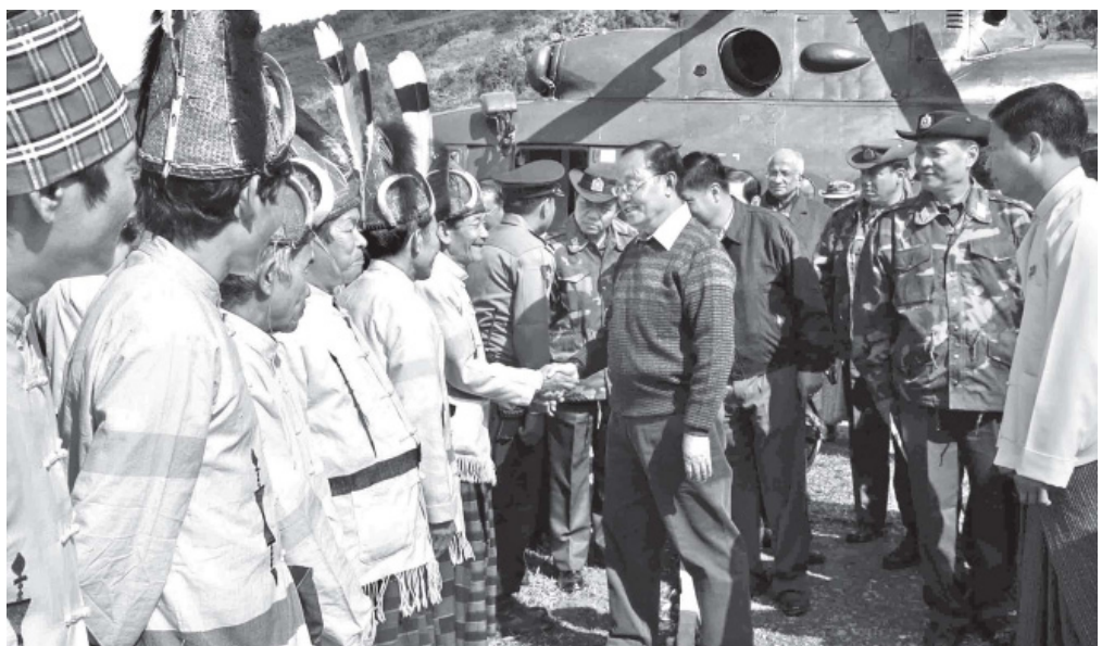
Vice-President Thiha Thura U Tin Aung Myint Oo and party being welcomed by departmental officials, townselders and local national races in Nanyun of Naga Self-Administered Zone.—MNA

After cordially greeting those present, the Vice-President inspected the hostels. (See page 8)