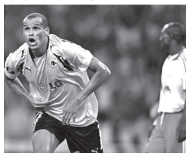
Former Brazil star and World Footballer of the Year Rivaldo, pictured here in 2007, has signed a one-year contract with Angola premier league club Kabuscorp Sport Clube do Palanca.