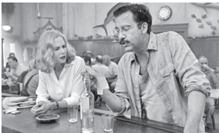
In this image released by HBO, Nicole Kidman, left, and Clive Owen are shown in a scene from the HBO film, "Hemingway & Gellhorn." Owen and Kidman portray writer Ernest Hemingway and war reporter Martha Gellhorn in the film debuting in May.

PASADENA, 15 Jan—Nicole Kidman and Clive Owen play writers Martha Gellhorn and Ernest Hemingway in a new HBO film, but they'd prefer to keep their own lives off-screen.