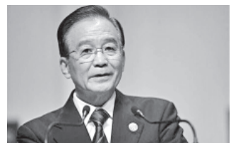
China's Premier Wen Jiabao delivers a speech at the opening ceremony of World Economic Forum (WEF) Annual Meeting of the New Champions, in northeastern China's port city of Dalian in this 14 September, 2011.

"Both sides must strive together to expand trade and cooperation, upstream and downstream, in crude oil and natural gas," said Wen, referring to access to extracting oil and gas and then processing