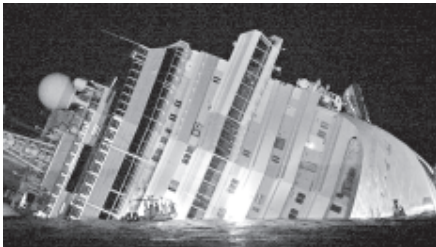
Big search-and-rescue operation continued overnight.