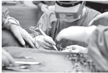
File illustration photo shows surgeons performing an operation. Foreigners from many countries are adding surgery to holiday trips in India that often include visits to the Taj Mahal in Agra and other tourist spots.

They admit that vanity is a key motive behind their choice to go under the surgeon's knife in a faraway country, saying they want their tummies tucked and breasts firmed up so they can again