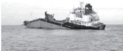
The Doora 3, oil tanker carrying petroleum, lies damaged after it exploded in waters off South Korea's western port city of Incheon. —INTERNET