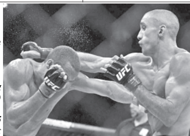
Edson Barboza, from Brazil, left, exchanges punches with Terry Etim, from the UK, during their lightweight mixed martial arts bout at the Ultimate Fighting Championship (UFC) 142 in Rio de Janeiro, Brazil, on 15 Jan, 2012.