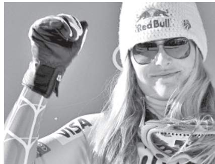
American Lindsey Vonn has bagged her 47th World Cup race success in winning the super-G at Cortina d'Ampezzo.

Vonn increased her lead in the overall standings where she leads Maze by 291 points.— Internet