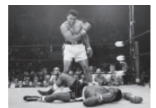
In this 25 May, 1965, file photo, heavyweight champion Muhammad Ali stands over fallen challenger Sonny Liston, after dropping Liston with a short hard right to the jaw in Lewiston, Maine. Ali turns 70 on 17 Jan, 2012.