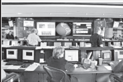
A view of the Symantec Security Operations Center in a photo courtesy of the company.

The technology lets students rate their comprehension of a lecture presentation slide by slide and the instructor can see the feedback in real time. Questions can be asked that teaching assistants can answer while the lecture continues, and the questions and answers become anonymously visible to the entire class. Students can type notes in the system alongside the instructor's slides and can bookmark slides for later review, the UM release said.—Internet