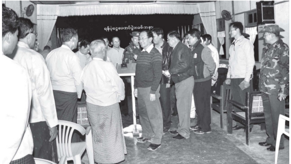
Vice-President Thiha Thura U Tin Aung Myint Oo greets those present at the fund raising ceremony at district General Administration Department in Hkamti.

He explained the purpose of two tasks for assistance. With regard to the first type, he said that the first type is to render assistance to religious and social tasks such as the assistance for donations to monastic education schools, setting up of medical trust-funds at hospitals, convenient accommodation for teachers and provisions for Border Region National Race Youth