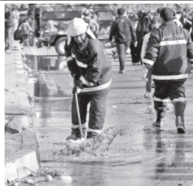
Security forces clean the scene of a bomb attack on Shiite pilgrims, killing and wounding some scores of people, police said, near the southern port city of Basra, Iraq's second-largest city, 550 kilometres (340 miles) southeast of Baghdad, Iraq, on 14 Jan, 2012.