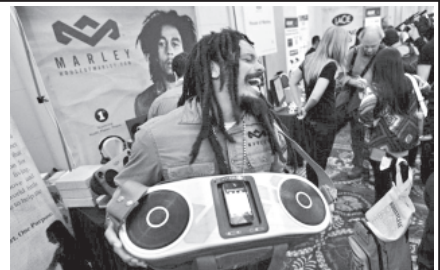
CES gadgets bringing the "Matrix" to life.

"The best of Intel computing is now coming to smartphones," California-based Intel's chief executive Paul Otellini said. "It is coming first to China, the largest market for