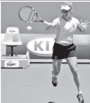
Kim Clijsters of Belgium plays a stroke during a training session ahead of the 2012 Australian Open tennis tournament in Melbourne on 15 Jan, 2012.