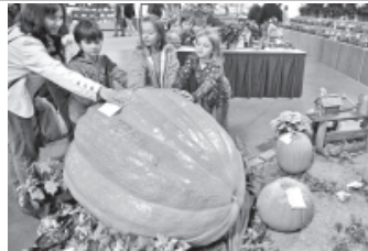
Children put their hands on a huge pumpkin weighing 735 pounds during the 96th Pennsylvania Farm Show in Harrisburg, the United States, on 12 Jan, 2012. The Pennsylvania Farm Show is the largest indoor agricultural exposition in the country, with nearly 6,000 animals, 10,000 competitive exhibits and 290 commercial exhibits. About 400,000 visitors would join the show.