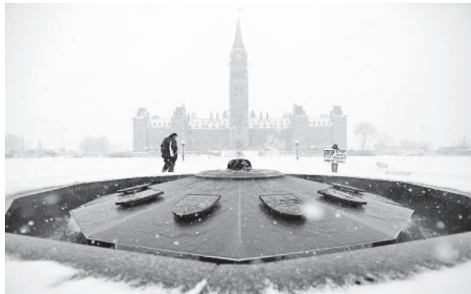
The Eternal Flame on Parliament Hill burns as snow continues to fall in Ottawa, Canada, on 13 Jan, 2012. Over 15 centimeters of snow was expected to fall in the capital on 13 January.

Super Model Miranda Kerr arrives at the W Magazine Best Performances Issue and The Golden Globes celebration hosted by Dom Perignon and W Magazine held at Chateau Marmont on 13 Jan, 2012 in Los Angeles, California. INTERNET