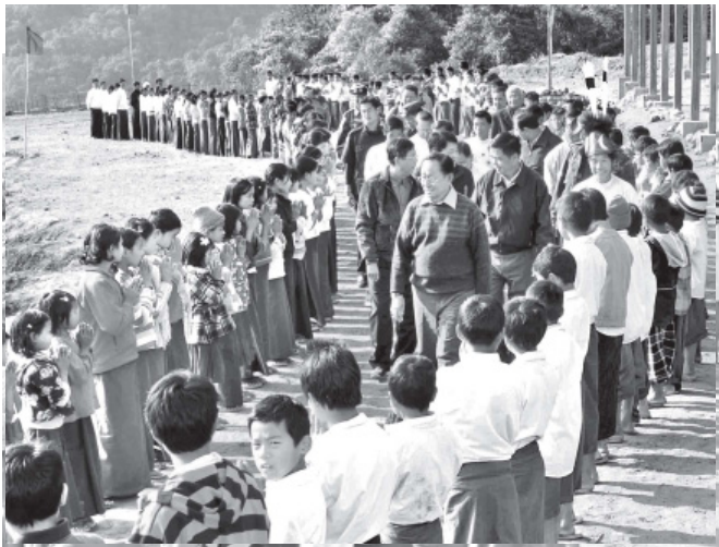
Vice-President Thiha Thura U Tin Aung Myint Oo cordially greets students of Panhsaung BEHS.

construction of irrigation canal for terraced farming and medical fund to Nanyun Township Hospital was provided as well.