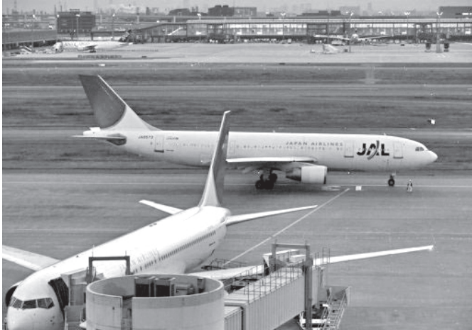
This file photo shows Japan Airlines passenger planes on the tarmac at Tokyo International Airport at Haneda. A Japan Airlines flight bound for Sydney was forced to turn back after takeoff when a business class passenger seat caught fire, according to reports.