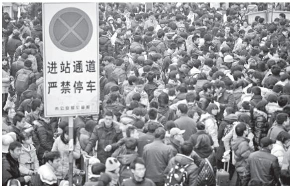
Passengers wait for buses at a coach station in Nanjing, capital of east China's Jiangsu Province, on 14 Jan, 2012. As the spring festival holidays approaches, coach stations in Nanjing witnessed a travel peak recently.