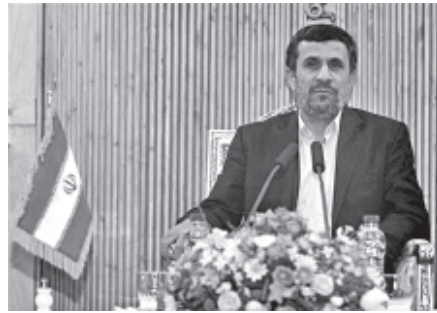
Iran's President Mahmoud Ahmadinejad speaks with journalists at Teheran's Mehrabad airport after his visit to Latin American countries on 14 Jan, 2012.

Iran in the past has accused Israel of causing a series of spectacular and sometimes bloody mishaps to its nuclear programme. Israeli officials do not comment on any involvement in those events,