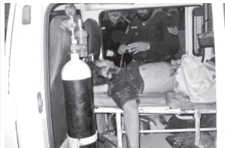
Rescuers transfer an injured man following an attack by militants on a police station in northwest Pakistan's Dera Ismail Khan on 14 Jan, 2012. Pakistani security forces quelled a militant attack on a police station in which 9 people were killed including four suicide bombers, two police and three civilians, police said.