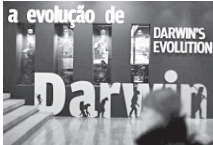
A woman walks past the entrance for the Darwin's Evolution Exhibition in Lisbon 12 February, 2009.