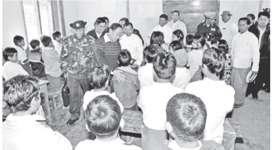
Vice-President Thiha Thura U Tin Aung Myint Oo in meeting with students at Nanyun BEHS.

He then cordially greeted shopkeepers and locals of Panhsaung and spoke words