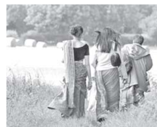
Gokul farm near London is built next to the Bhaktivedanta Manor, which Beatles guitarist George Harrison donated to the Hare Krishna movement in the early 1970s and is now their British base.