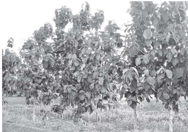
Some young teak trees on Monywa-Bodhi Tahtaung Road.