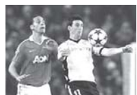
Manchester United's English defender Rio Ferdinand (L) vies with Valencia's Spanish midfielder Aritz Aduriz during their UEFA Champions League Group C football match at Old Trafford in Manchester.

But Ferguson said afterwards he is confident that Ferdinand, who missed the World Cup with a serious knee injury, will be in the team for a match that could go a long way to shaping United's season.