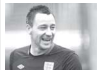
Chelsea captain John Terry