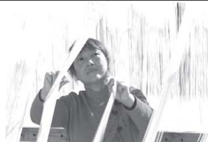
A villager dries handmade longevity noodles at a courtyard in Zhuji of Shaoxing City, east China's Zhejiang Province, on 5 Dec, 2010. The longevity noodles are so called for their length of several metres, which is a metaphor for people's longevity according to Chinese tradition.