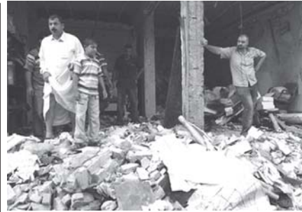
People stand at the scene an explosion in Basra, Iraq's second-largest city, 550 kilometres (340 miles) southeast of Baghdad, Iraq, recently.

Over 670 NATO soldiers, most of them Americans, have been killed in Afghanistan since beginning this year.