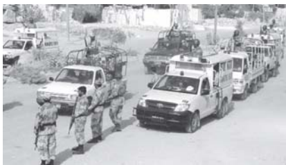
Pakistani soldiers patrol during a search operation in Karachi, Pakistan, on 8 Dec, 2010. Rangers conducted a search operation in Karachi, arresting several Taliban suspects and recovering a large cache of arms.

Violence and sporadic high-profile bomb attacks continue in the Iraqi cities despite the country's lawmakers approved an agreement that aimed at bringing Iraq's feuding political blocs into a new government led by Prime Minister Nuri al-Maliki.— Xinhua