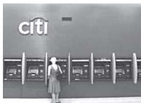
A woman uses an ATM inside a Citi bank branch in New York on 12 August, 2009.

WASHINGTON, 8 Dec—The US government sold off its remaining shares in Citigroup Inc on Monday for $4.35 each, marking an exit from ownership in the bailed-out banking giant with a $12 billion gross profit for taxpayers.