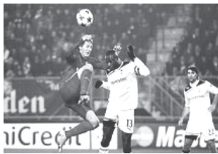
Luuk de Jong of FC Twente (L) fights for the ball with William Gallas of Tottenham Hotspur during their Champions League.