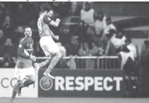
Werder Bremen's Peruvian striker Claudio Pizarro celebrates with teammate Austrian striker Marko Arnautovic.

3-3 at FC Twente to win Group A, Inter go through as runners-up, but despite their first win of the competition Bremen finish last and have failed to even claim a Europa League place.