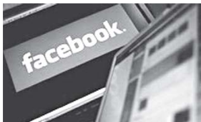
Facebook founder Mark Zuckerberg unveiled changes to member profile pages on Sunday.