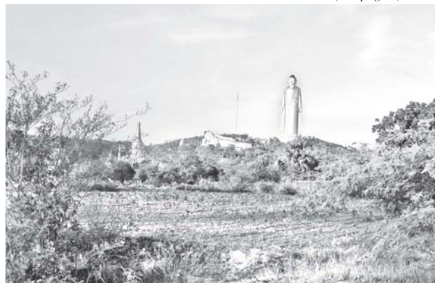
The area of 424 feet high Bodhi Tahtaung Standing Buddha Image covered with green woodlands.

In the dim and distant past, the region used (See page 7)