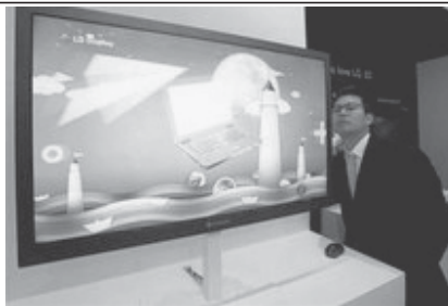
A visitor looks at a liquid crystal display (LCD) television made with LG Display flat screens.