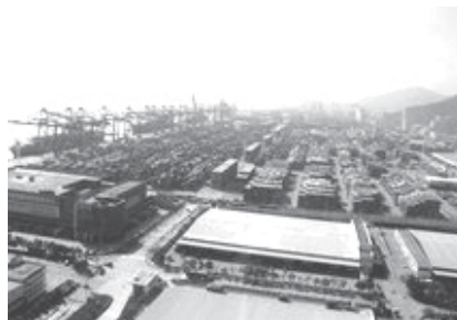
The port of Shenzhen in the Pearl River Delta.

"With reference to the central bank's practice of raising interest rates right before the release of CPI, there is a sensitive policy window around this weekend," the news-