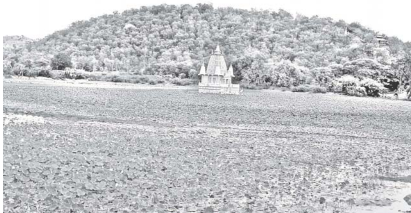
The lake full of lotus flowers in Bodhi Tahtaung Kyaukkar Shwe Myin Tin seen with Shwe Myin Tin Mountain in the background.

Beyond Yadanabon Bridge is the border of Sagaing Region. Shwe Min Win Mountain, also known as Sagaing Mountain, east of Monywa-Mandalay Road close to the river Ayeyawady, is thoroughly covered with vegetation.