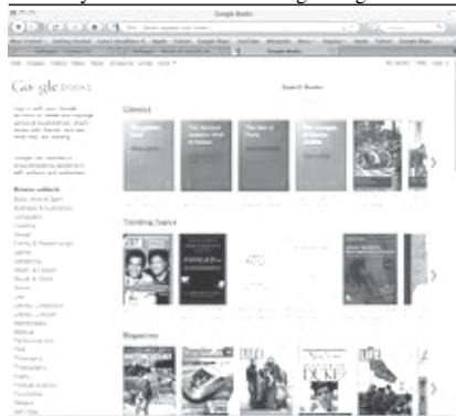
In this screen shot the Google books website is shown. The long-awaited Internet book store opening on Monday.

An injured woman of the explosion accident answers questions to the media while receiving medical treatments in a hospital in Yanggu County, east China's Shandong Province, 8 Dec, 2010. An explosion occurred at the Zhongshi Chemicals Co, Ltd. plant in Yanggu County at 5:40 am Wednesday. Seven people were injured in the accident.