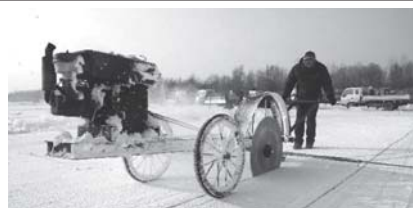
A worker split the ice on the Songhua River in Harbin, capital of northeast China's Heilongjiang Province, on 8 Dec, 2010. More than 5,000 workers began to collect ice from the Songhua River for the 10th Harbin Ice and Snow World. The Harbin Ice and Snow World will give its text run on 24 Dec this year.