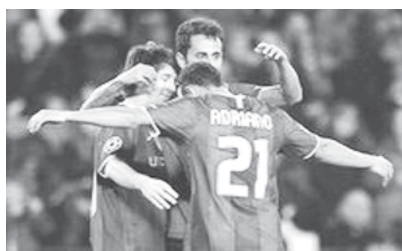
Barcelona's Argentinian forward Lionel Messi (L) and Barcelona's Adriano (R) congratulate after scoring in Champion League.