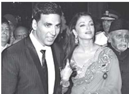
Indian Bollywood film actor Akshay Kumar (L) and former Bollywood film actress Aishwarya Rai.