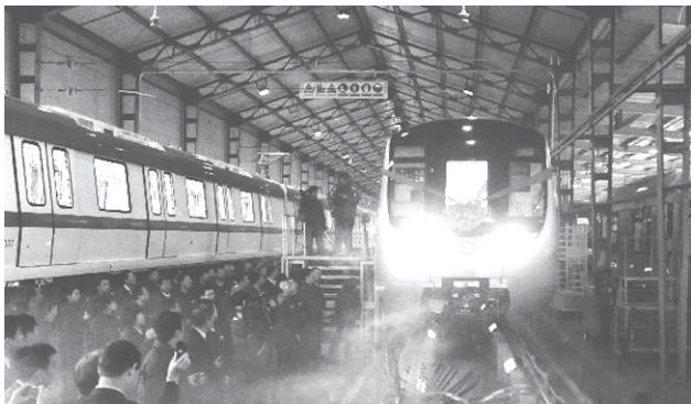
Photo taken on 6 Dec, 2010 shows the first train Changchun Railway Vehicles Company manufactured for MTR Corporation's West Island Line (WIL) project in Changchun, northeast China's Jilin Province. Changchun Railway Vehicles celebrated its manufacture of the 1,000 th railway vehicle in 2010 and the release of the first train for MTR Corporation's WIL project on Monday.