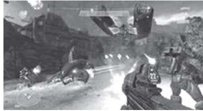
In this video still provided by Microsoft Corp, a scene from 'Halo: Reach' is shown.

NEW YORK, 8 Dec—Nearly three-quarters of American households own a device that's used specifically for video games, whether it's a console, a handheld device or a dedicated computer, according to Nielsen Co. Add to that all the people who play games on their smart phones or their home or work PCs, and no one's