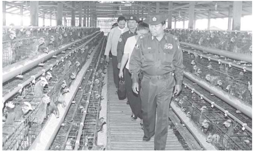
Maj-Gen Tin Ngwe of Ministry of Defence visits layers farm in No. 1 Nyaunghnapin Agriculture and Breeding Special Zone. (News on page 16)—MNA

He then inspected progress of implementation of An Creek Hydropower Project.—MNA