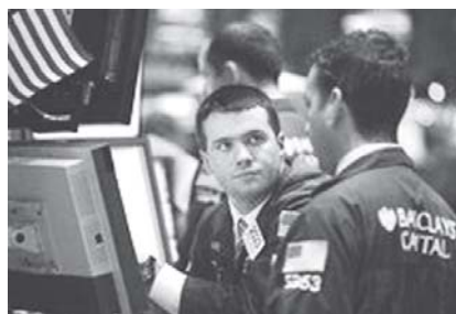
Traders work on the floor of the New York Stock Exchange on 2 December, 2010.