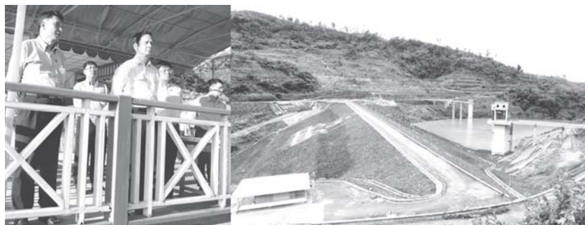
EP-1 Minister U Zaw Min views progress of Kunchaung Hydropower Project.—MNA

NAY PYI TAW, 8 Dec—Minister for Electric Power No. 1 U Zaw Min arrived at Kunchaung Hydropower Project, nine miles southwest of Pyu, on 6 December.