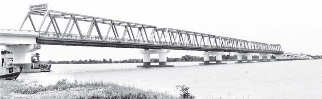
Yazudaing Bridge No. 1 stretching across Yazudaing River.