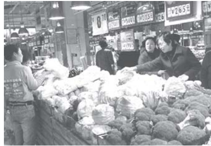
Shoppers select vegetables at an indoor market in the Putuo District of Shanghai Municipality, east China, on 23 Nov, 2010. Direct sale of vegetables has been initiated in four pilot districts of Shanghai, a metropolitan with a population of nearly 20 million, as part of the government's price control measures.