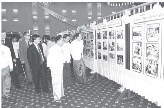
Minister U Maung Maung Swe views documentary photos to mark International Day of Persons with Disabilities 2010.