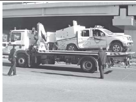
A patrol car damaged by a roadside bomb attack is towed away in Baghdad, Iraq, on 2 Dec, 2010. Iraqi authorities say rush-hour bombings in Baghdad have wounded several civilians and police officers.