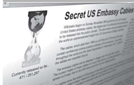
The Internet homepage of WikiLeaks is shown in this photo taken in New York, on 1 Dec, 2010. WikiLeaks' release of secret government communications should serve as a warning to the nation's biggest businesses: You're next.