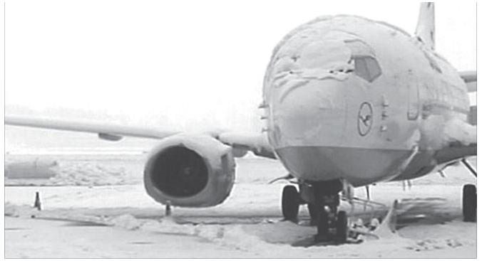
Snow has shut Geneva Airport, while eight homeless people have died in after the mercury dropped below -20C in Poland.—INTERNET

In the Russian Capital, Moscow, temperatures dropped to -23.6C (-10.5F), the lowest on record for 1 December since 1931. In Poland it was even colder, with the eastern city of Bialystok registering temperatures of -26C (-14.8F). Police in the country appealed to the public to get in touch if they found any homeless people living outdoors after eight homeless men were found frozen to death.—Internet