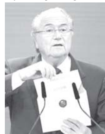
FIFA President Joseph Blatter announces Russia to host the 2018 World Cup during the announcement of the host country for the 2018 soccer World Cup in Zurich, Switzerland, on 2 Dec, 2010.

ZURICH, 3 Dec — Picture soccer fans partying where tanks and missiles paraded on Red Square in the Cold War’s darkest days. Imagine high-tech