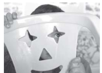
An autistic child looks out from behind a chair at a consulting centre for autism in Amman, on 30 March, 2010. —INTERNET

preliminary, but if confirmed in several more and larger studies, they might replace current subjective tests now used to diagnose the disorder. —Internet