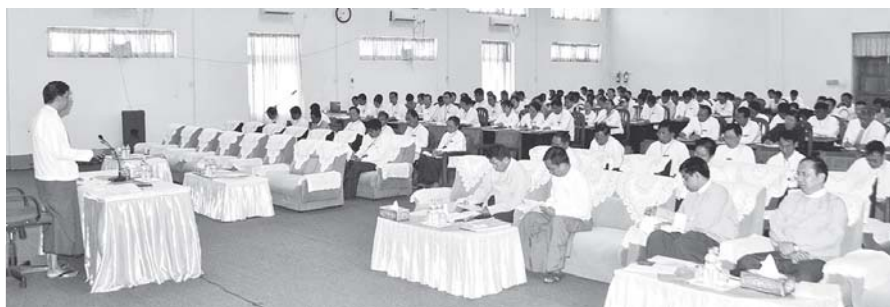
Minister Dr Chan Nyein addresses work coordination meeting on basic education sector of the Ministry of Education.—MNA