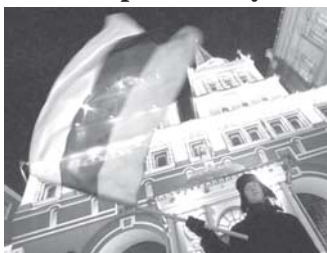
A local supporter waves the Russian national flag as he celebrates after FIFA President Joseph Blatter announced on 2 December, in Zurich, that Russia will host the 2018 World Cup.

The announcement means that after the 2014 tournament in Brazil, the World Cup will be staged in two countries that have never hosted the event before. And it will head to the Middle East for the first time in the heat of Qatar. Russia prevailed in the 2018 race after upsetting