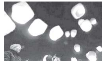
People launch lanterns in Moscow as they celebrate Russia's victory in their bid to host the 2018 World Cup.