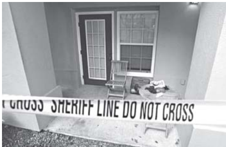
This photo taken on 1 Dec, 2010, shows the crime scene at a condominium in Celebration, Fla.

Police are investigating the first ever murder in Celebration, the Disney-developed community in Florida.— INTERNET