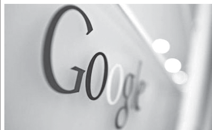
The Google logo is seen at the Google headquarters in Brussels.