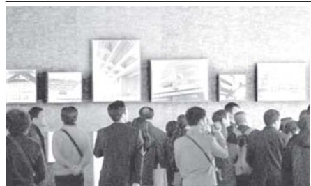
Visitors view the China Pavilion retrospect exhibition at China Pavilion of the World Expo in Shanghai, east China, on 1 Dec, 2010. After a month's closure and rearrangement, the China Pavilion of Shanghai World Expo reopened to public on Wednesday, attracting streams of visitors.

Sumitomo Corporation, a Company incorporated in Japan, of 8-11, Harumi 1-chome, Chuo-ku, Tokyo, Japan, is the Owner of the following Trade Mark:-