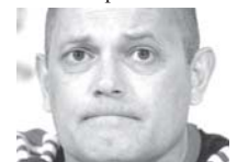
Chelsea have reached a compensation agreement with Ray Wilkins, just a few weeks after the English champions sacked him as their assistant manager.

LONDON, 3 Dec — Chelsea have reached a compensation agreement with Ray Wilkins just a few weeks after the English champions sacked