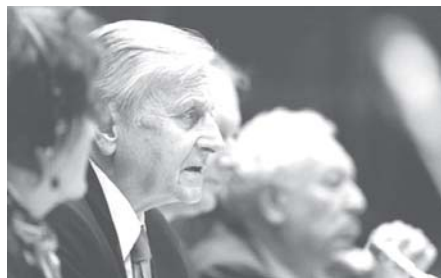
President of the European Central Bank Jean Claude Trichet, second left, speaks in front of the Economic and Financial Committee at the European Parliament in Brussels on 30 Nov, 2010.