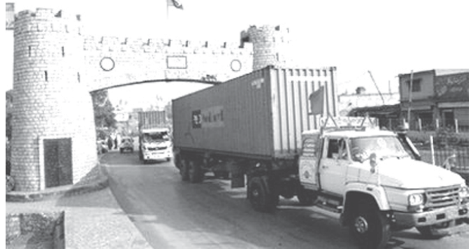
File photo shows Pakistani drivers driving through the famous Khyber Pass as they carry supplies for NATO and US-led forces into Afghanistan. Taleban militants in northwest Pakistan attacked a NATO supply truck before dawn Thursday, killing the driver and damaging the vehicle, police said.

The bulk of supplies and equipment required by foreign troops in Afghanistan is shipped through the Khyber region, although US troops increasingly use alternative routes through central Asia. Scores of NATO supply vehicles were destroyed in gun and arson attacks while Pakistan's Khyber crossing was shut, as Taleban militants stepped up efforts to disrupt the route and avenge US drone strikes in Pakistan's tribal belt.