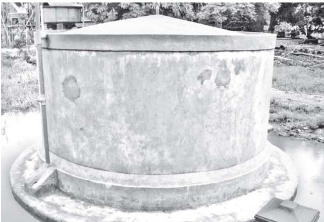
Photo shows 5000-gallon-capacity rainwater tank Kyaunghtauk Village.

Translation: TTA Myanma Alin: 27-11-2010