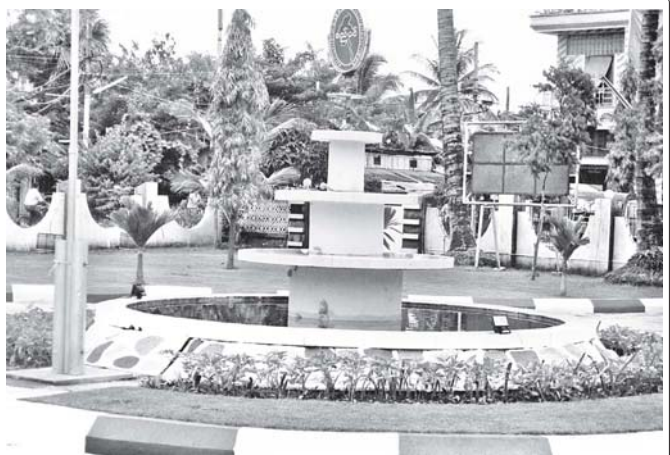
Beautifying tasks undertaken by Mawlamyinegyun Township DAC.

With regard to communication sector, the township has been provided with one post office, one telegraphic office, one telephone office, 700 auto-telephones, 396 CDMA-450