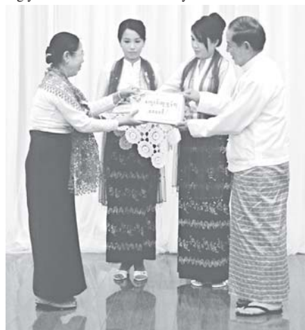
Minister U Maung Maung Swe presents prize to an official of school that won outstanding award.