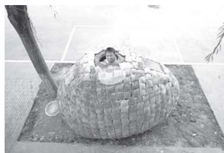
The outside look of Dai's egg-house in Beijing, on 1 Dec, 2010.

splints on the inside and wood chippings and grass seeds in between. "The seeds will grow in the natural environment and it's cold-proof," Dai explained.