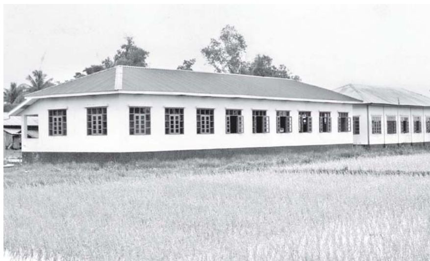
Photo shows neat and tidy building of Affiliated Basic Education Middle School in Kyaunghtauk Village in Mawlamyinegyun Township.

Article: Tin Htwe (MNA)