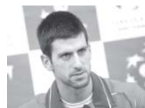
Serbian Davis Cup player Novak Djokovic

BELGRADE, 3 Dec — Novak Djokovic will carry the hopes of Serbia in the Balkan nation’s first ever Davis Cup final against nine-times former winners France at the 16,000 capacity Belgrade Arena this weekend. The world number three is seen here as a solid bet to win both his singles rubbers, leaving his team-mates free to add the clinching point in one of the three remaining ties. But with both captains