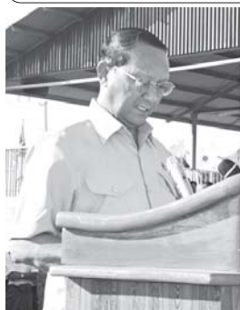
Minister Thura U Aye Myint addresses opening of 4 th Nay Pyi Taw Inter-ministry Volleyball Tournament 2010.—MNA