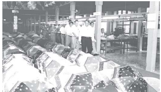
Industry-1 Minister U Aung Thaung visits Myanmar Umbrella Factory.

On arrival at the Bicycle Factory (Yangon) under the Cottage Industries Department, he inspected manufacturing conditions, products, passenger and cargo