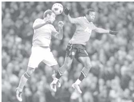
Manchester City's Pablo Zabaleta, left, jumps for the ball against Manchester United's Nani during their English Premier League soccer match at The City of Manchester Stadium, Manchester, England, on 10 Nov, 2010.