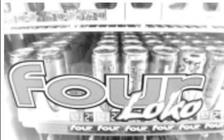
Four Loko and other alcoholic energy drinks are seen in the cooler of a convenience store on 10 Nov, 2010, in Seattle.

OLYMPIA, 12 Nov—Retailers have a week to clear millions of dollars worth of alcoholic energy drinks from their shelves after state regulators banned them on Wednesday, citing the hospitalization of nine dangerously drunk college students last month.