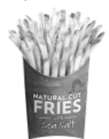
A product image provided by Wendy's, shows the Natural Cut Fries with Sea Salt. With an eye toward appealing to foodies, Wendy's is remaking its fries with Russett potatoes, leaving the skin on and sprinkling sea salt on top.—INTERNET

ads airing later this month, to highlight the changes.— Internet