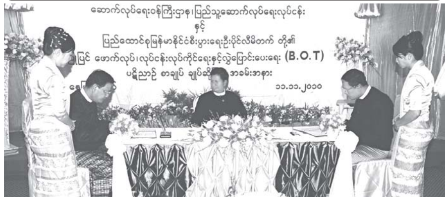
A signing ceremony of BOT contract between Public Works and Union of Myanmar Economic Holdings Limited in progress in the presence of Minister for Construction U Khin Maung Myint.

NAY PYI TAW, 12 Nov — Minister for Construction U Khin Maung Myint attended the signing ceremony of BOT contract between Public Works and Union of Myanmar Economic Holdings Limited at Tawwin