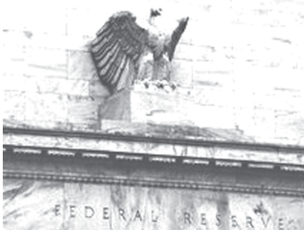
The US Federal Reserve Building is pictured in Washington, on 15 Dec, 2009.

NEW YORK, 12 Nov—Three top Federal Reserve officials on Monday voiced concerns about the central bank's latest efforts to boost the economy, with one warning the Fed's bond buying might need to be curbed to head-off inflation.