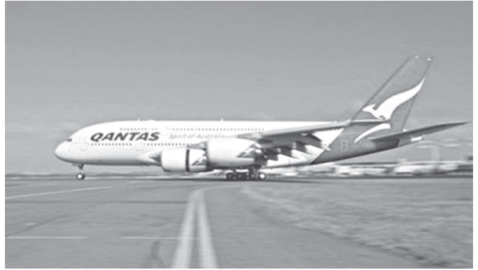
A Qantas Airbus A380 lands at Sydney International Airport. Qantas grounded its Airbus A380 superjumbos until further notice Thursday, a week after a mid-air engine blast prompted serious safety worries over the world's biggest passenger jet.