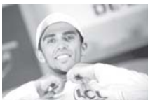
Tour de France champion Alberto Contador licit and performance-enhancing blood transfusion. Earlier Wednesday a report in AS sports daily claimed the RFEC would take "at least two months" to decide whether it would sanction Contador or not.

Contador has claimed his positive result for trace amounts of the banned weight loss/muscle-building drug, following a test on the Tour de France in July, was down to eating contaminated meat — although sceptics suggest he may have inadvertently put clenbuterol back into his system through an il-