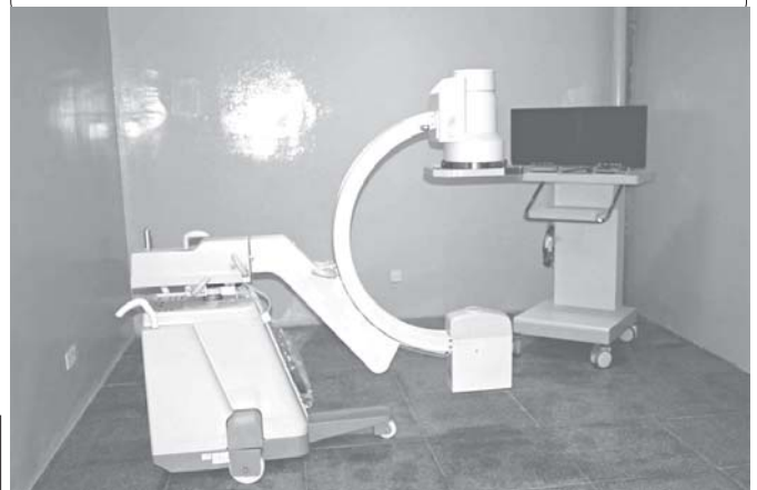
Modern hospital equipment seen at Outara Thiri Hospital.