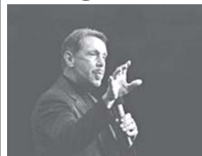
Oracle CEO Larry Ellison speaks during his keynote address at the Oracle Open World in San Francisco.

OAKLAND, 12 Nov—Oracle Corp CEO Larry Ellison testified that SAP's theft of its software cost his company $4 billion, doubling his previous estimate, but failed to bring strong supporting written evidence.