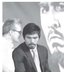
Manny Pacquiao, right, listens to his trainer Freddie Roach, left, during a news conference on 10 Nov, 2010, in Arlington, Texas.