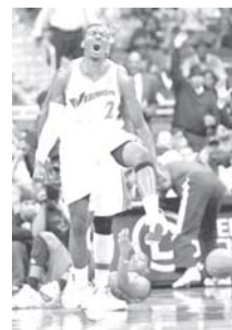
Washington Wizards' John Wall (2) reacts after his dunk during the first half of an NBA basketball game against the Houston Rockets, on 10 Nov, 2010, in Washington.

The 6-foot-4 Wall had his own highlight moment when he showed off his athleticism early in the second quarter. With