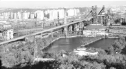
Photo taken on 7 Nov, 2010 shows a general view of a steel factory of Shougang Group, a Chinese iron and steel maker, in Beijing, capital of China. By the end of 2010, Shougang Group will close the last furnaces in its old factories in western Beijing and finish relocating facilities there to Hebei Province due to the government's efforts to reduce air pollution in the capital. After relocation, the old factory site will be developed into a complex of tourism, entertainment, business, and residential housing.

RICHMOND, 12 Nov—Corpses, cancer patients and diseased lungs are among the images the federal government plans for larger, graphic warning labels that would take up half of each pack of cigarettes sold in the United States. Whether smokers addicted to nicotine will see them as a reason to quit remains a question.