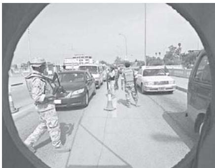
Iraqi soldiers man a checkpoint at the entrance of the southern city of Basra in March 2010. A car bomb in a crowded market in the southern Iraqi city of Basra on Monday killed at least 10 people and wounded 30, a military officer said.