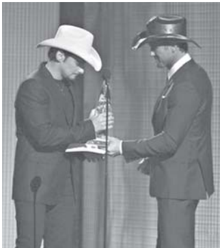
Brad Paisley, left, accepts the Entertainer of the Year Award from Tim McGraw at the 44th Annual Country Music Awards in Nashville, Tenn, on 10 Nov, 2010.

NASHVILLE, 12 Nov —Miranda Lambert's coronation at the Country Music Association Awards came with the most authentic endorsement you can get in Music City: Loretta Lynn. "Nobody in country music is more