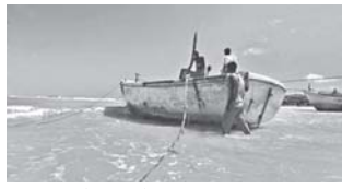
Armed Somali pirates carrying out preparations to a skiff in Hobyo, northeastern Somalia, in January 2010.

The sailors had been crewing the Singaporean-flagged "Golden Blessing"