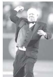
Broadcaster Dave Niehaus