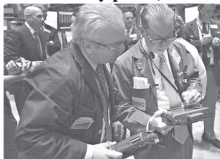
Traders work on the floor of the New York Stock Exchange on 8 Nov, 2010.

Obama tried to defuse tensions, saying a strong US economy would help the rest of the world and