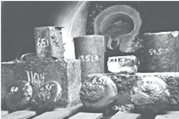
Various rare earth samples are shown in this undated handout image. INTERNET

TORONTO, 10 Nov—Rows of moss-covered concrete bricks block the opening of the Monmouth rare earth mine in Canada, keeping curious hikers from entering the long-abandoned shaft.