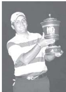
Francesco Molinari of Italy shows off his champion trophy during the award ceremony of the HSBC Champions.

SHANGHAI, 10 NOV—HANGHAI - The PGA Tour continues to shortchange the one World Golf Championship held outside the United States by only offering a three-year exemption to the winner if he is a member of the American-based tour.