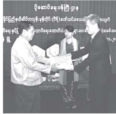
Minister for Transport U Thein Swe accepts bags of rice worth US$ 50,000 donated for storm victims of Rakhine State by Daewoo International Corporation on behalf of Shwe Project members. (News reported).