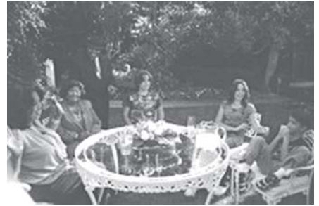
In this photo taken on 9 Oct, 2010 and provided by Harpo Productions Inc, talk-show host Oprah Winfrey, left, is seen with the Jacksons, during an interview with Katherine Jackson, second from left, mother of the late pop star Michael Jackson, in a taping of 'The Oprah Winfrey Show' in Encino, Calif.