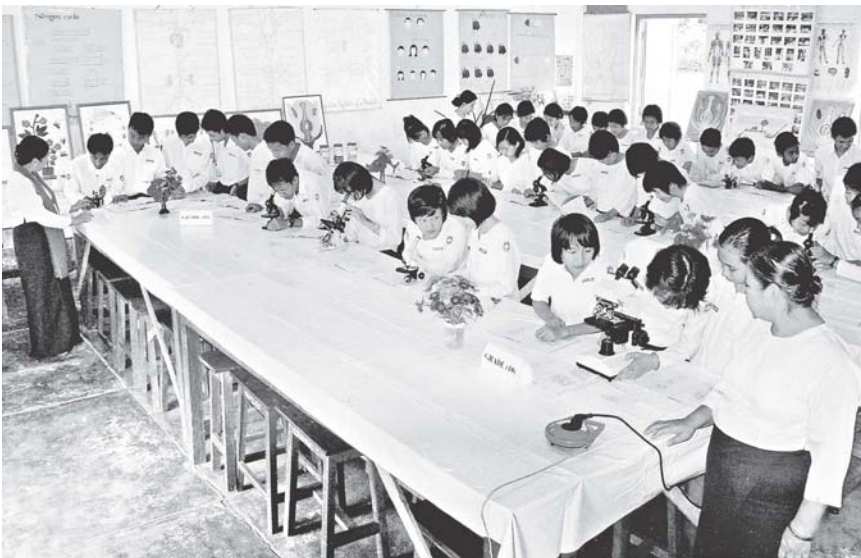
Students learning at room of practical Basic Education High School No. 2, Loikaw.