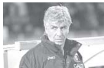
Gian Piero Gasperini, seen here in 2009, was sacked as coach of Serie A side Genoa on Monday.

ROME, 10 NOV—Gian Piero Gasperini was sacked as coach of Serie A side Genoa on Monday after four years at the helm, the president of the