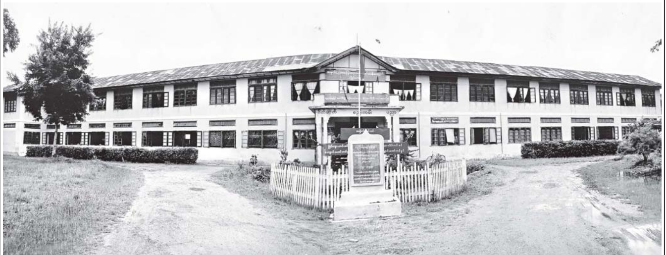
University of Computer Studies (Loikaw) is under construction for enabling national race youths to pursue higher computerized technology.

Translation: TTA Myanma Alin: 10-11-2010