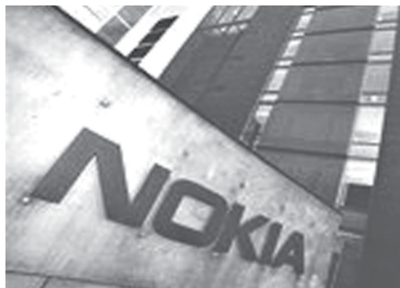
Nokia Research Centre INTERNET

Nokia bought out other shareholders in Symbian in 2008 and opened the software for any manufacturers to use for free on an open-source basis. But it failed to win wide adoption and this year Samsung Electronics and Sony Ericsson abandoned it in favor of Google's Android.