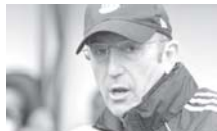
Stoke City manager Tony Pulis watches his team play Newcastle United during an English FA Premier League.

Pulis said "six or seven" games had been directly affected by decisions against Stoke this season - notably when a goal was disallowed in a home loss to Tottenham, a handball going unpun-