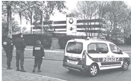
French policemen stand outside the offices of automaker BMW in Montigny-Le-Brettonneux, west of Paris. A man enraged by problems with his BMW car grabbed a shotgun and took an employee hostage at the automaker's French headquarters on Monday, an official said.