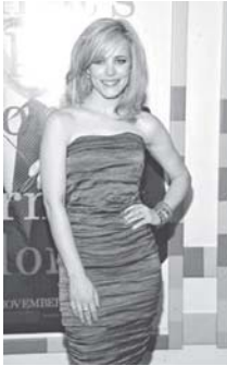
FWD101 Rachel McAdams attends the premiere of "Morning Glory" in New York on Sunday.

NEW YORK, 10 NOV—When Hollywood's A-list stars gather for a movie premiere, it is always news, especially when the movie in question is packed with top names. But at the premiere of the new comedy "Morning Glory" held on Sunday, 7 Nov, at the Ziegfeld Theater in New York, it was hard to tell where the news left off and the film began.