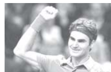
Swiss Roger Federer