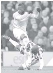
Manchester City's Italian forward Mario Balotelli (top) tackles West Bromwich Albion's Congolese defender Youssouf Mulumbu, a challenge which lead to Balotelli being sent off.