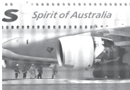
A Qantas Airbus A380 plane is seen after an emergency landing at the Changi International airport.