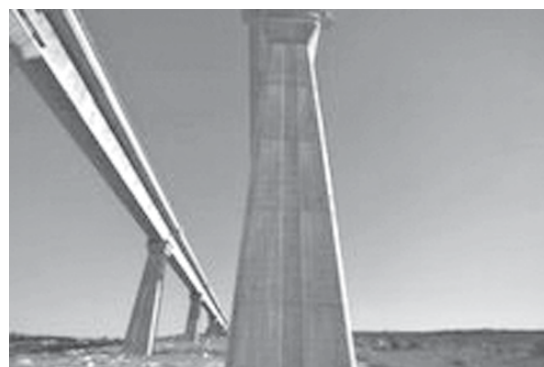
In this photo taken on 3 Nov, 2010, a view of the bridge in construction for the planned high speed train to run.