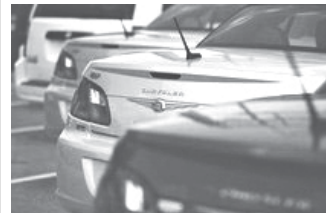
Chrysler vehicles are on display at a dealership in Alexandria, Virginia on 2 June, 2010.

DETROIT, 10 Nov—Chrysler Group LLC forecast an operating profit this year, thanks to cost cuts, but Chief Executive Sergio Marchionne said the automaker had to "fight harder" to revive its image and seize market share.