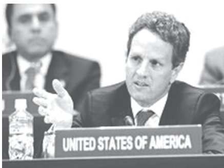
US Treasury Secretary Timothy Geithner, seen here on November 6, said Monday that the US economy was starting to pick up and that chances of a “double-dip” recession were lower than at any time in the last 12 months.