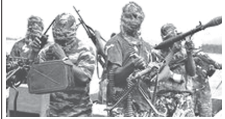
Fighters with the Movement for the Emancipation of Niger Delta (MEND) prepare for an operation in 2008.