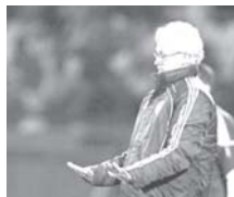
Denmark coach Morten Olsen, seen here in June, has announced he will stand down after 12 years.

Under his guidance Denmark qualified for the 2002 and 2010 World