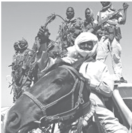
In this photo taken on 7 Nov, 2010, joint Sudanese-Chadian border patrol forces in trucks and on horseback attend a meeting with Sudanese government officials near Seleah in West Darfur, Sudan.

Many Darfur rebels come from tribes that overlap the border. Members of Darfur's key group—the Justice and Equality Movement—are believed to cross it unrestrained in pursuit of weapons.