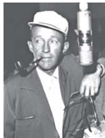
In this 1958 file photo Bing Crosby is shown during a recording session in Los Angeles.

There was no 140-character limit for Bing Crosby, who wrote an eight-paragraph letter to me in 1972. He ended with the claim: "I've reached