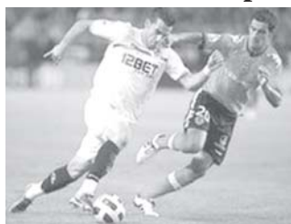
Sevilla's forward Alvaro Negredo (L) vies for the ball with Valencia's Portuguese defender Ricardo.