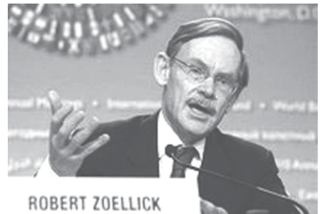
World Bank President Robert Zoellick speaks at the Development Committee news conference during the annual IMF-World Bank meetings in Washington on 9 October, 2010.

In typical Zoellick style, the proposal before the G20 leaders' summit in Seoul is aimed at fueling a broader debate on currencies that goes beyond competitive