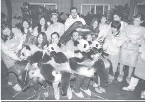
In this undated handout photo, Panda enthusiasts pose for photo at a panda breeding and research centre in Chengdu, capital of southwest China's Sichuan Province.