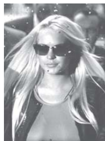
File photo shows Confetti flies as Lindsay Lohan arrives at the Beverly Hills courthouse in Beverly Hills, California.