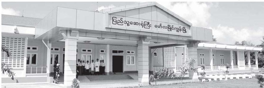
Photo shows 100-bed Mawlamyinegyun General Hospital under construction.

Schools, universities, Universities of Computer