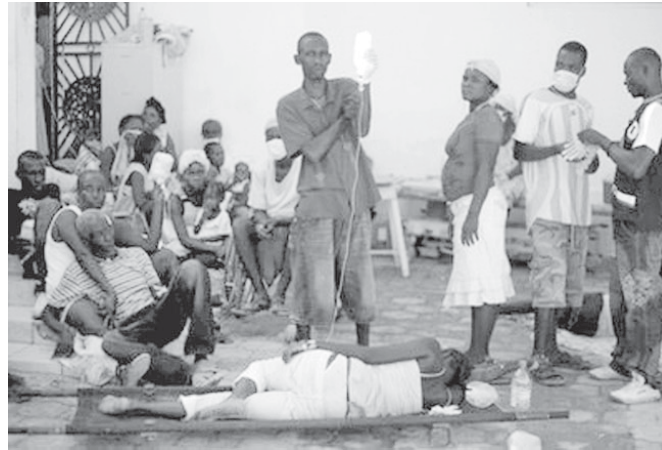
Patients suffering from diarrhea and other cholera symptoms are helped by other residents as they wait for treatment at the St. Nicholas hospital in Saint Marc, Haiti, on 22 Oct, 2010.