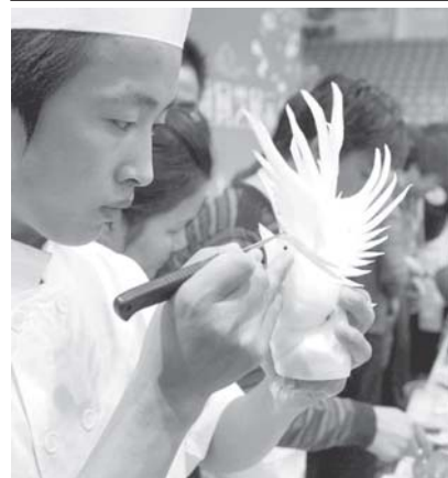
A resident cooks during the cooking section of 5th neighbourhood festival in a community in Yixing city, of east China's Jiangsu Province recently.