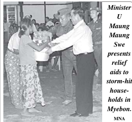
Minister U Maung Maung Swe presents relief aids to storm-hit households in Myebon.

After that, they attended a ceremony to present relief supplies to storm victims at Township PDC Office, and presented relief supplies to the victims. They held discussion with