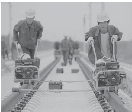
Workers fix up railway track on Beijing-Shanghai High-Speed Railway in Cangzhou City, east China's Hebei Province recently. The track laying operation of Beijing-Shanghai High-Speed Railway will be completed by the end of this October.