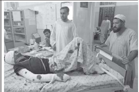
A wounded Afghan policeman is brought to a hospital in Kandahar, south of Kabul, Afghanistan recently. Three explosions just minutes apart rocked Kandahar, killing at least two Afghan police officers and wounding almost a dozen others, according to the provinces officials.