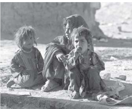
Afghan children internally displaced by war sit outside their tent in Kabul recently.