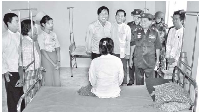
Senior General Than Shwe comforts patients at 25-bed hospital opened at Cyclone Shelter in Pyinsalu Village, Pyinsalu.

Next, the Head of State gave guidance. Although Ayeyawady Region including