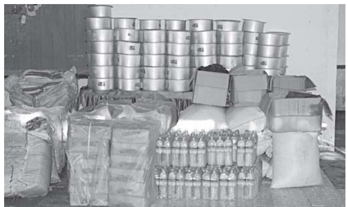
Relief aids for storm-hit households in Myebon.