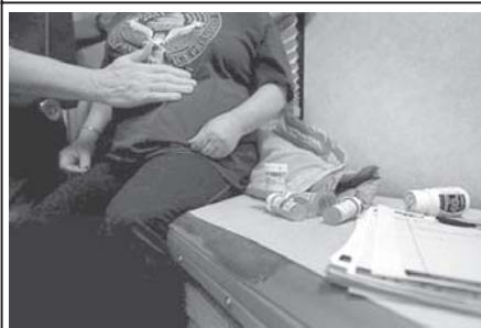
A doctor examines a patient before prescribing her depression medicine at a free medical clinic in 2009. Scientists in the United States said on Sunday they had found a gene that appears to play a key role in the onset of depression, a finding that could unlock new avenues for drug engineers.

The company's new type of 5-megawatts (MW) offshore wind turbines will be rolled out to the market in 2013, with first tests due in the fourth quarter of 2012, Gamesa said.—MNA/Reuters