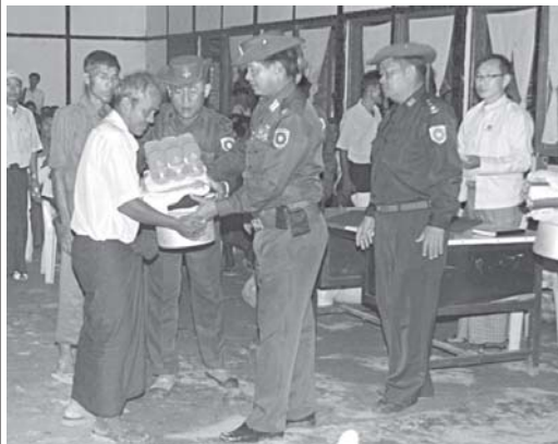
Commander Brig-Gen Soe Thein provides storm-hit households in Myebon with relief aids.