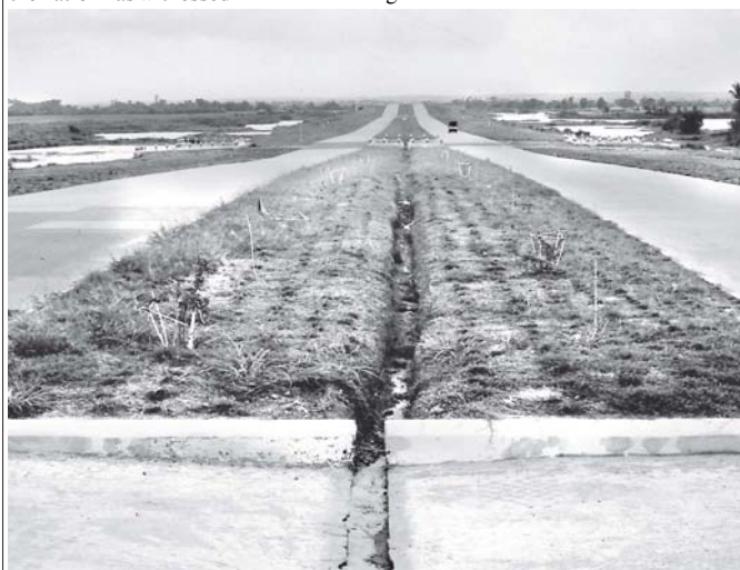
Concrete road on Nay Pyi Taw -Yangon road section of Yangon-Mandalay Highway, which is in line with the norms of ASEAN road standard.