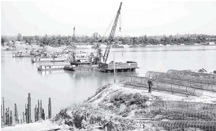
Myanmar engineers are constructing Ayeyawady Bridge (Sinkhan) in Katha District, Sagaing Region.

After I had read and watched news stories on construction of roads and bridges stated in newspapers and on TV these days, I came to witness that those in authority had been working hard day in, day out to improve the infrastructures for national development.