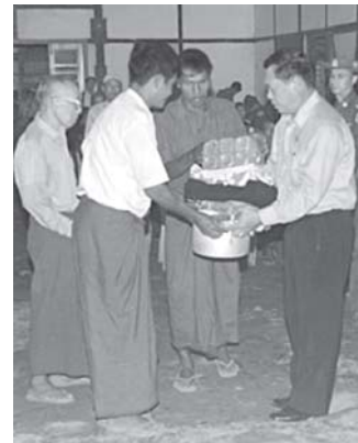
Minister U Thein Swe provides relief aids for storm-hit households in Myebon.