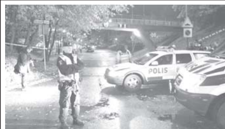
Police secure the area where two immigrant women were shot on Thursday in Malmo, Sweden.