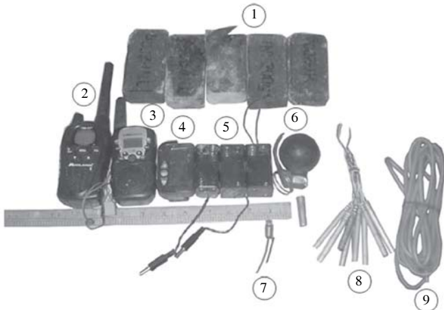
(1) TNT (2) walkie-talkie (3) remote control (4) time clock (5) battery-containers (6) 91 grenade (7) bulb (8) electric detonator (9) string.

NAY PYI TAW, 26 Oct—The government is working hard for successful completion of upcoming 2010 multiparty general elections that will take place soon, while striving in cooperation with the people for national development, peace and stability of the State and the rule of law. But insurgents and minions of alien countries are committing terrorist attacks in the country with the intention of undermining State's peace and stability and disrupting the elections.