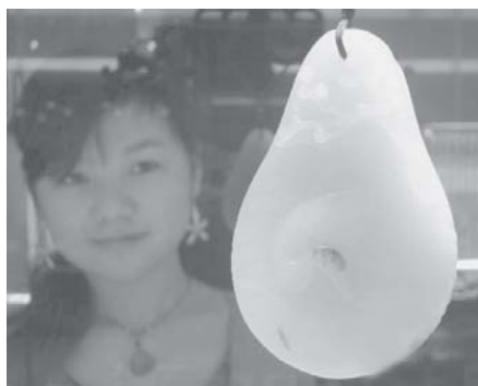
A visitor looks at a jade sculpture on an exhibition in Suzhou, east China's Jiangsu Province, on 17 Oct, 2010. More than 300 jade sculpture works made by Su Ran, an artist of jade sculptures, were seen on a 10-day jade sculpture exhibition kicked off on Saturday.