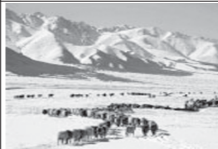
Photo shows sheep flock walking in snow at the foot of Tianshan Mountain in Hami, northwest China's Xinjiang Uygur Autonomous Region. A cold front hit Xinjiang since last Friday, bringing snow and plunging the temperature.