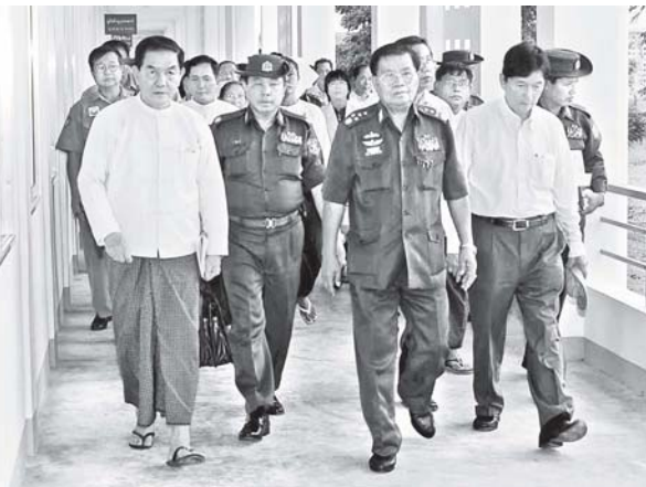
Head of State Senior General Than Shwe visiting new 200-bed Labutta General Hospital.

Smooth transport will contribute to convenience in traveling from one place to another along with improvement in social, economic, education and health sectors