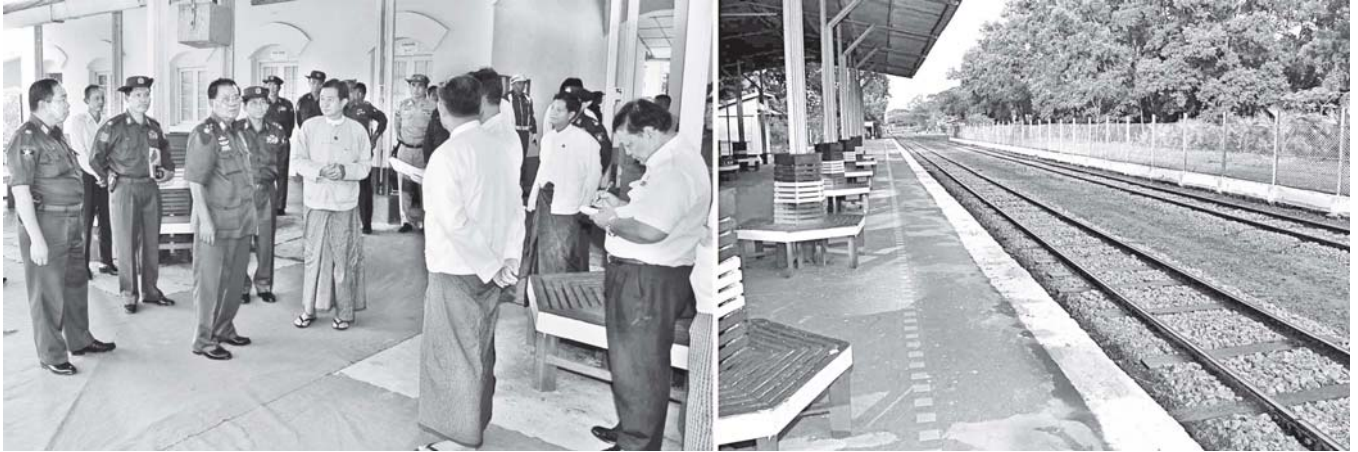
Senior General Than Shwe visiting Patheingyi Railway Station.