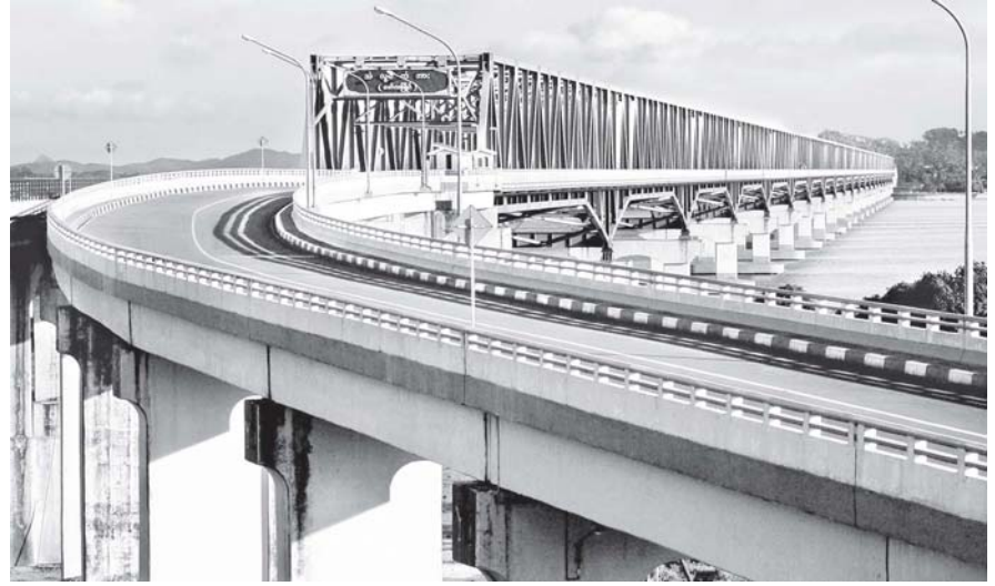
Thanlwin Bridge (Mawlamyine) is playing an important role in north-south transportation of Myanmar.

Next one is Ayeyawady Bridge (Malun) close to Pahtanago and Malun that is intended to link Patheingyi-Kyangin-Pakokku Railroad on the western bank and Pyay-Aungmye-Taungdwingyi-Magway-Chauk Railroad on the eastern bank of the Ayeyawady River. It has a 4695 feet long two-lane