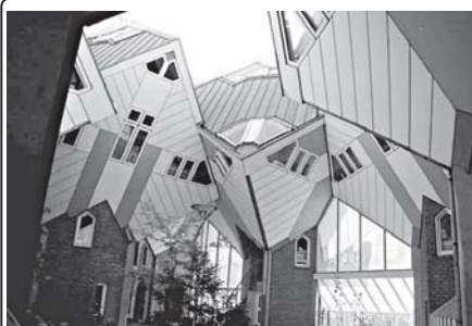
Incredible cube houses