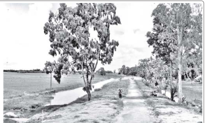
Pathein-Ngapudaw road section will be upgraded to a tarred one.

been built; that construction tasks were being expedited to complete the remaining bridges as scheduled; that so, local people including those in seaside regions soon could travel with convenient to other regions through the road network; and that Public Works would complete