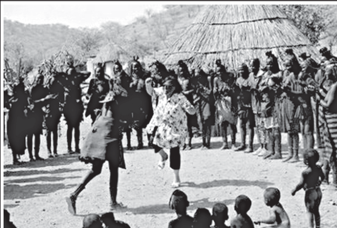
A tourist is seen here dancing with a Himba woman in the village of Ohungumure, in northern Namibia. Their bare-chested bodies painted with rich ochre-red colours, Himba women sing and dance in villages untouched by modernity since their ancestors settled on the Angola-Namibia border 200 years ago.