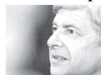
Arsenal manager Arsene Wenger ruled out entering the race to sign Wayne Rooney after watching the Gunners.

The rout means Arsenal have now racked up an incredible 14 goals in three games. And with an embarrassment of attacking riches either left on the substitutes bench or still to return from injury, Wenger said there was no chance of trying to lure want-a-away Manchester United striker Rooney.