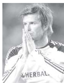
Football megastar David Beckham

"This is fantastic news for football fans and for tourism in the Hunter (Valley)," said the region's state MP,