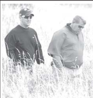
File photo shows David Duval, left, and John Daly walking in the rough.

Duval was one of those can't-miss college stars — he had the 54-hole lead at a PGA Tour event as an amateur — but in his first attempt to get on tour, he failed miserably. He didn't even make the 72-hole cut for the final two rounds of qualifying school.