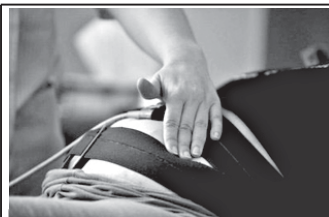
A midwife examines a pregnant woman. A new study published on Wednesday boosts suspicions that a child's risk of allergies could be linked to the season that coincides with the first three months of pregnancy.