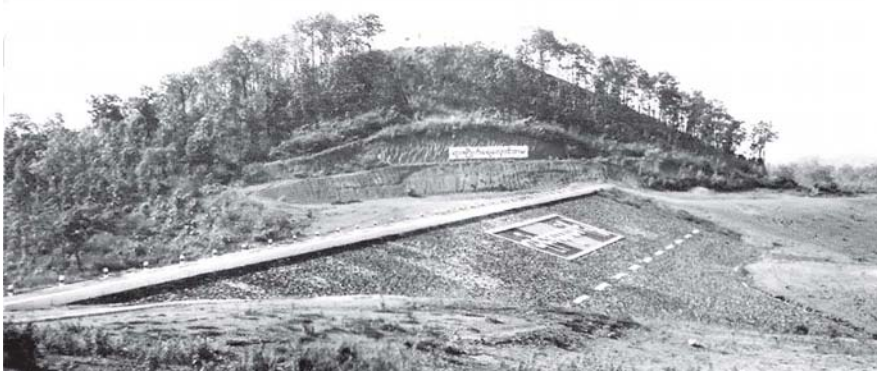
Photo shows progress of embankment of Yazagyo Dam.