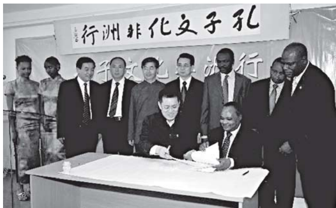
Representatives from the Chinese Delegation "Confucian Culture In Africa" and the Confucius Institute at Kenya's University of Nairobi sign an memorandum of understanding in Nairobi, capital of Kenya, 19 Oct, 2010.