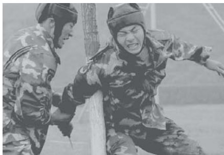
Two armed policemen compete in a military training competition held in Xi'an, capital of Shaanxi, 19 Oct, 2010. More than 500 armed policemen of Shaanxi Province attended the competition dating from 16 to 20 Oct.