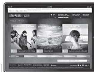
In this screen-shot provided by Starbucks Corp., the website for Starbucks' Digital Network is displayed on an Apple iPad. Starbucks Corp. is launching its digital network on 20 Oct, 2010, giving users free access to some paid sites such as the Wall Street Journal, free e-books and other content to better compete with its rivals.

Other partners also include Apple Inc.'s iTunes, The New York Times, Patch, USA Today and Zagat. The offerings include advance copies of books, through deals with publishers such as HarperCollins and Penguin Group books, and iTunes downloads.—Internet