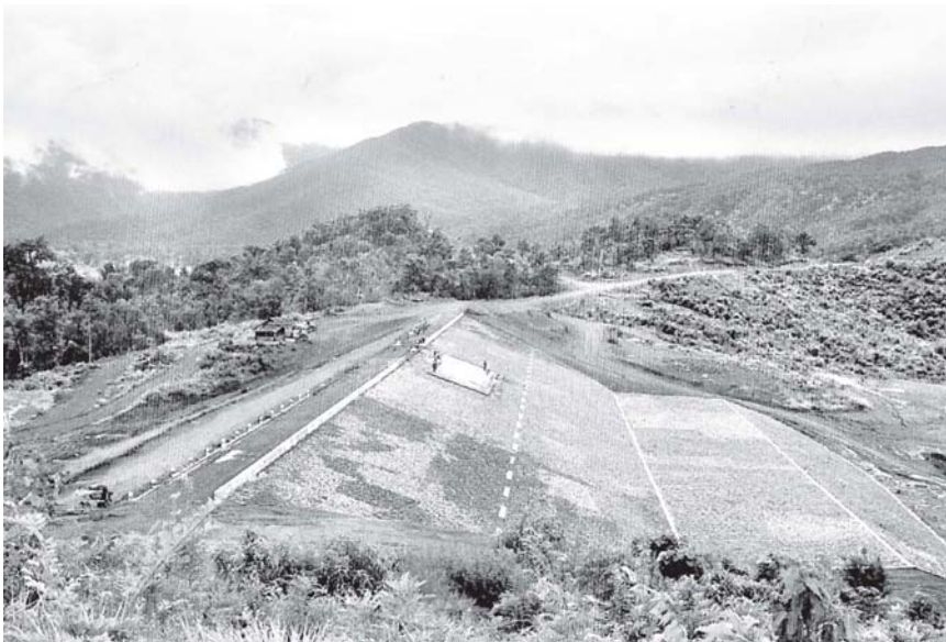
An aerial view of a saddle dyke at Yazagyo Dam.

Article & Photos: Khin Maung Than (Sethmu)