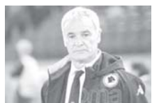
AS Roma coach Claudio Ranieri (pictured) was in defiant mood despite his team suffering a humiliating 3-1 home defeat to FC Basel.

And the former Chelsea, Juventus and Valencia boss ruled out any possibility of him throwing in the towel.