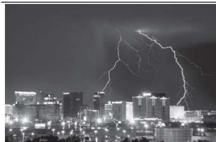
Lightning flashes over Strip casinos as a thunderstorm passes through the Las Vegas Valley in Las Vegas, Nevada 19 October, 2010.