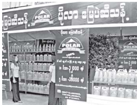
Photo shows booth of Polar groundnut oil.