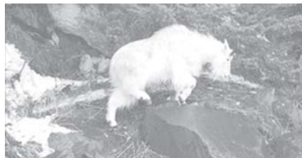
Mountain goats usually stand about 3ft (0.9m) tall at the shoulder and can weigh up to 300lbs (136kg).