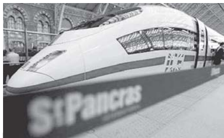
The new ICE German high speed train is seen after it arrived at St Pancras station in London, 19 October, 2010.