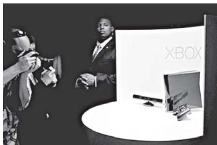
Photographers take pictures of the Kinect peripheral and the new Xbox 360 console at a Microsoft press briefing in Los Angeles, California, in June 2010. Microsoft unveiled an array of Xbox 360 videogames tailored for play using the movement-sensing Kinect controller set to debut in November.