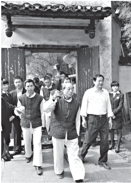
A worker walks with a torch during a rekindling ceremony of the Hulu kiln in China's porcelain capital, Jingdezhen City, eastern Jiangxi Province, on 19 Oct, 2010. The inflaming ceremony of Hulu kiln can date back to the Hongwu Period (1368-1398) when the first emperor of the Ming Dynasty (1368-1644) ruled the country. A total of 300 potteries and porcelain craftworks was burnt in the kiln this time, which would last for 18 hours.