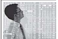
A man walks past a display showing stock market prices inside a bank in Taipei on 31 August, 2010.