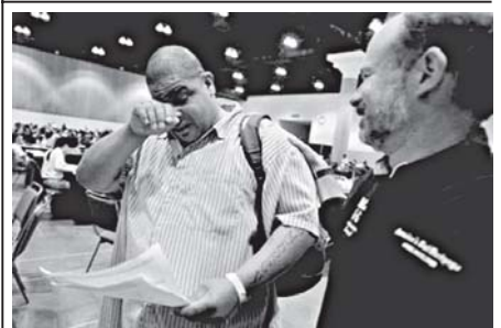
A homeowner (L) becomes emotional during a mortgage restructuring event in Los Angeles. The number of mortgage defaults in the US has soared from an annual average of one percent before 2008 to 10 percent today, according to a leading foreclosure-tracking firm.