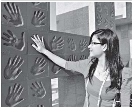
A Vietnamese girl searches for her handprint on the China-Vietnam handprint wall in Nanning, capital of south China's Guangxi Zhuang Autonomous Region, 20 Oct, 2010. The handprint wall, with handprints of 5,600 young people from China and Vietnam, was inaugurated here Wednesday, which was a part of the activity marking the 60th anniversary of the establishment of the diplomatic relations between the two countries.