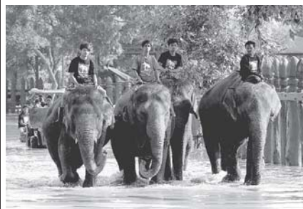
Mahouts ride elephants along a flooded road near the Lopburi River towards the Royal Elephant Kraal elephant sanctuary in Ayutthaya, 80 km (50 miles) north of Bangkok 19 October, 2010.