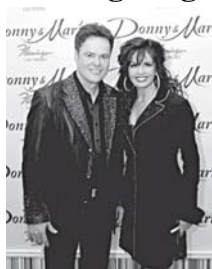
Donny Osmond, left, and Marie Osmond

NEW YORK, 20 Oct—He's a little bit rock 'n' roll, she's a little bit country. Together, they're going to be a whole lot of Broadway.