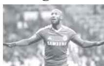
Nicolas Anelka of Chelsea celebrates his goal during the Champions League Group F football match.

It was a happier result for the English side than their last appearance here when they lost on penalties to Manchester United