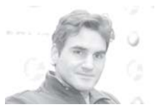
Switzerland's tennis star Roger Federer

Federer is keen to end his season on a high note over the next six weeks with four events including Stockholm, Basel, Paris and the London year-end finals to go.