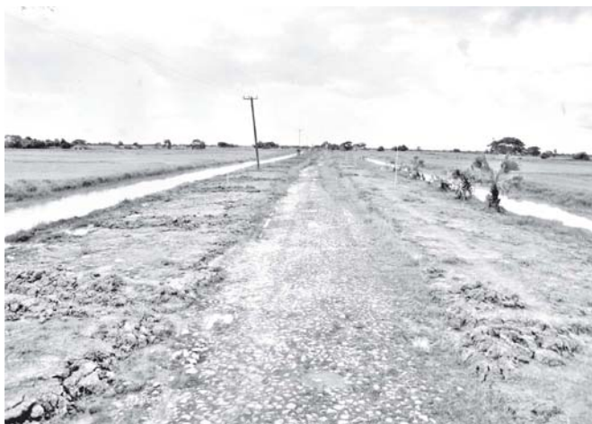
Groundwork is being carried out to upgrade Pathein-Ngapudaw Road to a 34 feet wide tarred facility.