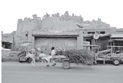
A donkey cart passes through the main square of Shali with an abandoned fortress in the background in Siwa, Egypt, on 18 Oct, 2010. Located in the Libyan Desert, Egypt's Siwa Oasis is home to one of the Middle East's most ancient settlements.