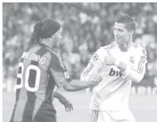
Real Madrid's Cristiano Ronaldo (right) salutes AC Milan's Ronaldinho before their Champions.