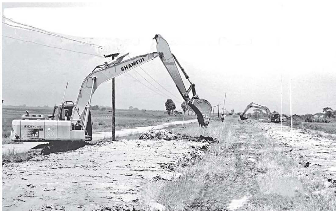
Excavators at work at Pathein-Ngapudaw Road Project.