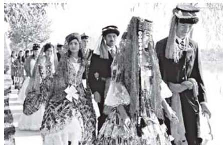
Brides and groomsmen attend a group wedding ceremony in Zepu, northwest China's Xinjiang Uygur Autonomous Region, 19 Oct, 2010. A total of 100 couples of Uygur, Tajik and Han ethnics attended the group wedding ceremony.