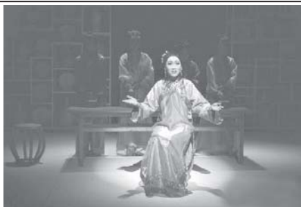
An actress of Singapore's Toy Factory Productions perform in a drama called "Crab Flower Club" in Beijing, capital of China, 19 Oct, 2010. "Crab Flower Club" was presented on Tuesday as the premier drama during the ongoing fourth international drama season organized by the National Theater Company of China.