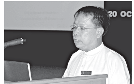
A resource person reading out a research paper.