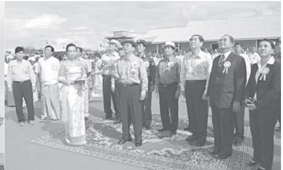
Prime Minister U Thein Sein unveils the archway of extended hospital (200-bed) in 3rd Mile Satellite Town, Labutta Township.

Minister and party attended the opening of extended hospital (200-bed) in 3rd Mile Satellite Town, Labutta Township at 9 a.m.