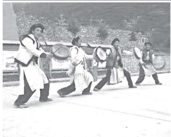
People of the Qiang ethnic group dance in Yanmen Township of Wenchuan County, southwest China's Sichuan Province, on 27 Sept, 2010, to celebrate the upcoming National Day that falls on 1 Oct. As the reconstruction work goes on, many new buildings have been finished in the county. Wenchuan was the epicentre of the massive earthquake happening on 12 May, 2008.—XINHUA

The report, "The Importance of Family Dinners VI," was issued by the National Center on Addiction and Substance Abuse at Columbia University in New York.—Internet