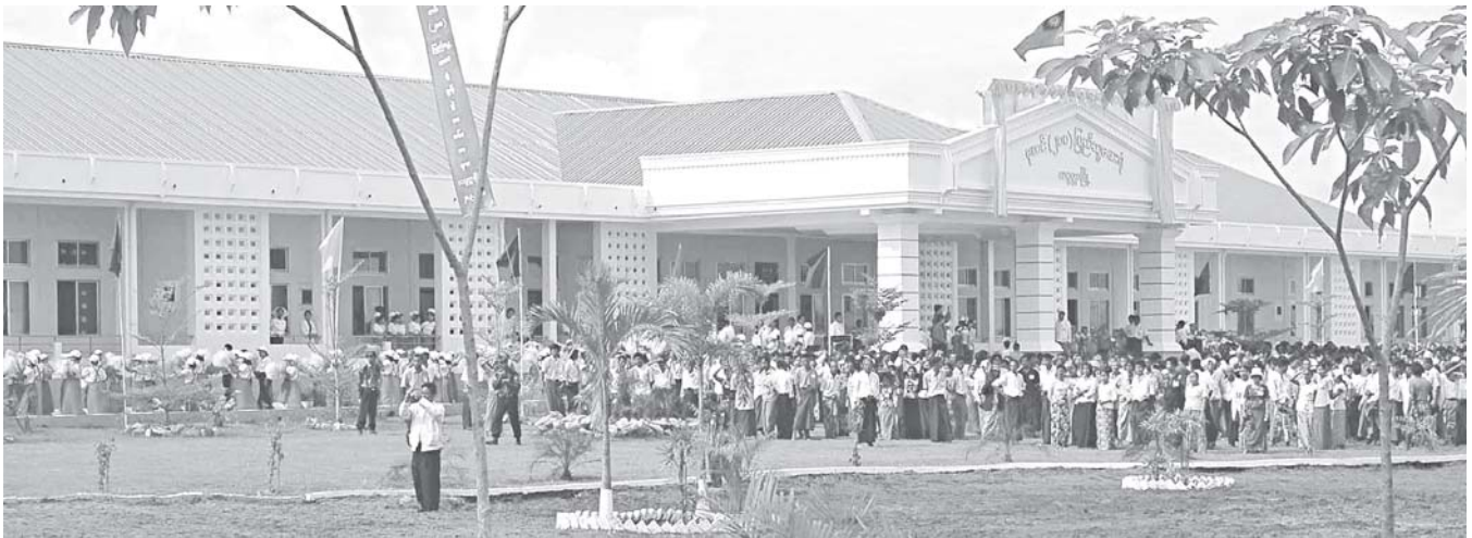
Extended hospital (200-bed) in 3rd Mile Satellite Town, Labutta Township.—MNA

The newly-opened extended hospital (200-bed) is made up of out-patient department, intensive care department, x-ray room, surgical ward, orthopedic ward, obstetric and gynecological ward, pediatric ward, emergency room and operation theatre.