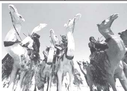
Tuaregs on camel back take part in the Cure Salee, or "Festival of the Nomads" in Ingall, northern Niger.