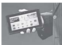
RIM President and Co-Chief Executive Officer Mike Lazaridis announces the new BlackBerry PlayBook as he delivers a keynote address at the BlackBerryDevCon 2010 in San Francisco, California.

PlayBook users can pair the tablet with their BlackBerry smartphone using a Bluetooth connection, RIM said, noting that content stored on the smartphone is only temporarily cached on the tablet.—Internet