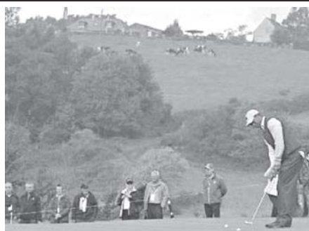
US Ryder Cup player Tiger Woods puts on the second green during practice ahead of the 2010 Ryder Cup at Celtic Manor in Newport, south Wales on 28 September, 2010.