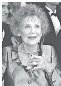
File photo shows actress Gloria Stuart arrives at the 70th Annual Academy Awards in Los Angeles. Stuart was nominated for best performance by an actress in a supporting role in the film 'Titanic.'