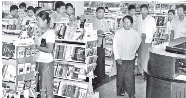
Minister for Information U Kyaw Hsan at Sarpay Beikman Books Centre.

Altogether 960 books on children literature in Myanmar, 1500 books in English, 2000 journals and 600