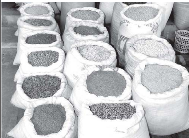
Photo shows sample of beans and pulses.