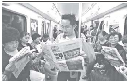
Photo taken on 27 Sept, 2010 shows passengers read newspapers in a carriage on the newly opened subway line in Chengdu, capital of southwest China's Sichuan Province.