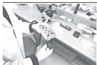
A researcher removes a colony of stem cells from an incubator. A US appeals court heard debate Monday over whether to suspend embryonic stem cell research funded by the government, as the Obama administration argued that a ban would waste millions of dollars already invested in scientific study.