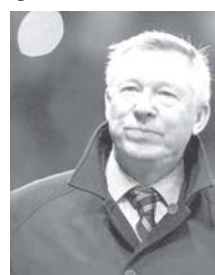
Manchester United manager Sir Alex Ferguson.

Ferguson watched his side labour to a 0-0 draw against Rangers in their Group C opener and will hope for more attacking bite at Valencia, as well as more defensive stability than they have shown of late.— Internet