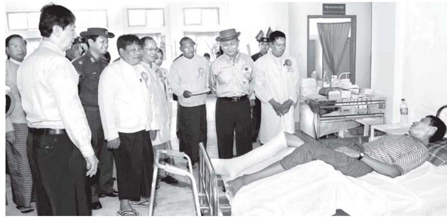
Prime Minister U Thein Sein comforts a patient at extended 200-bed hospital in Labutta Township.

Since Labutta is on a small area of land and densely populated, it was prone to outbreak of fire. So the Head of State gave guidance to upgrade the 3rd Mile camp with proper geographical condition that can prevent tidal waves as a district town in order to extend Labutta.