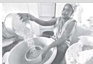
A Senegalese woman sorts "Niebe" black-eyed peas at a factory in Dakar. The black-eyed pea — known also as the cowpea — has the potential to feed millions and to act as a substitute for wheat which is not grown here or in many countries in the region, according to participants at the Fifth World Cowpea Research Conference set to start in Dakar next week.—INTERNET