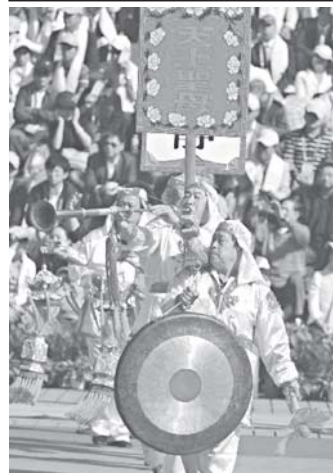
Actors participate in a parade during the opening ceremony of the 5th Chinese Tianjin Mazu Goddess Cultural Travel Festival in north China's Tianjin Municipality, on 27 Sept, 2010.

The Shenzhen Component Index dropped 1.19 percent, or 135.33 points, to end at 11,274.49.—Xinhua