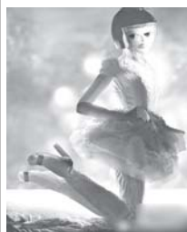
Beauties made out of vegetables