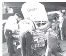
Clint Bowyer's crew takes apart his car in the garage area as a NASCAR official watches after the NASCAR.

his win in the opening round of the Chase for the Sprint Cup championship, Bowyer had the wind knocked out of him 72 hours later when NASCAR ruled the car he drove to victory at New Hampshire was illegal.