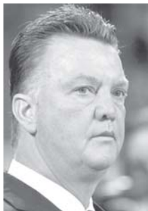
Bayern Munich's Dutch head coach Louis van Gaal attends his side's Bundesliga match against Hoffenheim.

BERLIN, 28 Sept — Bayern Munich coach Louis van Gaal on Monday extended his contract with the German giants