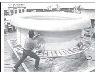
An aircraft worker crafts an engine part for a Boeing 777 at one of the plane-makers' production facilities. Air China has ordered four of the long-haul aircraft for 1.1 billion dollars, the US aeronautics giant has said.