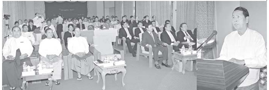
Minister U Soe Tha addresses opening of Myanmar-Korea Economic Forum.