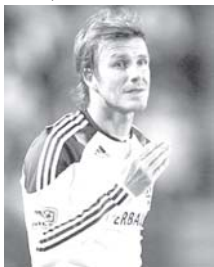
David Beckham from the LA Galaxy reacts before being defeated by the New York Red Bulls 2-0 at the Home.

LOS ANGELES, 28 Sept — The Los Angeles Galaxy have decided not to take any action against David Beckham who confronted a supporter who heckled him after Friday's loss to the New York Red Bulls, the club said on