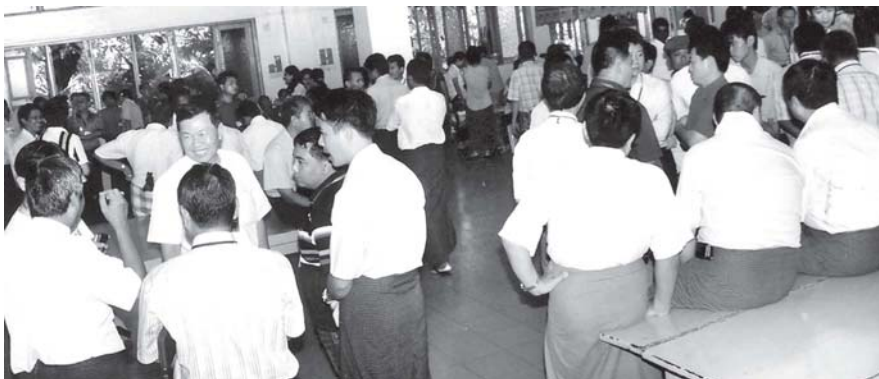
Dealers gathering together at Bayintnaung brokerage house to coordinate trading.