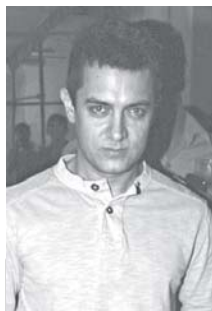
Indian Bollywood producer and actor Aamir Khan arrives for a promotional event for the Hindi film 'Peepli Live' in Mumbai on 3 August. Bollywood superstar Khan will be hoping for third time lucky at next year's Oscars, after the latest movie he produced was chosen as India's entry for the Best Foreign Language Film category.