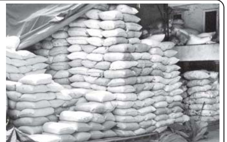
Bags of beans and pulses at Bayintnaung brokerage house.

Now, beans and pulses from dealers and brokerage houses of states and regions comes to Bayintnaung brokerage houses in thousands of