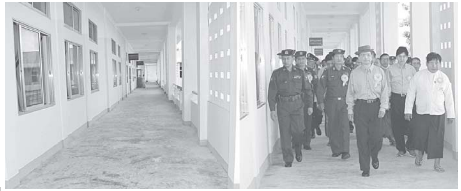
Prime Minister U Thein Sein at extended 200-bed hospital in Labutta Township.—MNA

In his address, the Prime Minister said that Extended Hospital (200-bed) in Labutta Township of Labutta District opened by the government today is to enable the local people to receive medical treatment in their own region on an equal basis like the