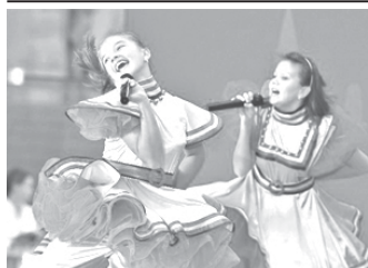
Actress from Russia perform during a ceremony celebrating the National Pavilion Day of Russia in the World Expo Park in Shanghai, east China, on 28 Sept, 2010.