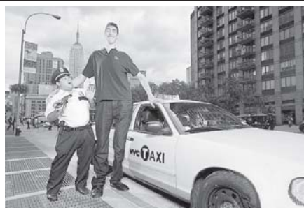
Various Guinness record: The tallest man.