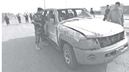
A policeman inspects a damaged vehicle at the site of a bomb attack in Kirkuk, 250 km (155 miles) north of Baghdad on 27 September, 2010.

Abduction is common in Nigeria. Over 300 foreigners have been seized in the Niger Delta since 2006. Almost all have been released unharmed after paying a ransom.— Xinhua