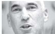
US golf team captain Corey Pavin speaks during a Ryder Cup news conference with European team captain.