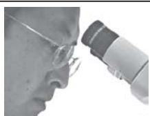
A scientist highlights how mosquitos are dissected in Rockville, Maryland. Scientists and doctors from around the world have been meeting to discuss progress made in developing a vaccine against malaria, and the news is expected to be good.