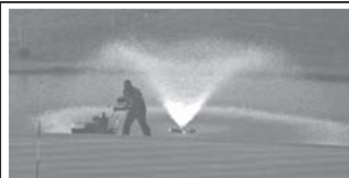
A greenkeeper prepares the 18th green for the 2010 Ryder Cup golf tournament in Newport, Wales, on 28 Sept, 2010. The tournament starts on 1 Oct.

He also linked the country's progress with high rate of literacy and education, noting the country will not make progress until and unless we ourselves work to achieve the goal and this noble goal is achievable only if we send our children to school and let them get education.—Xinhua