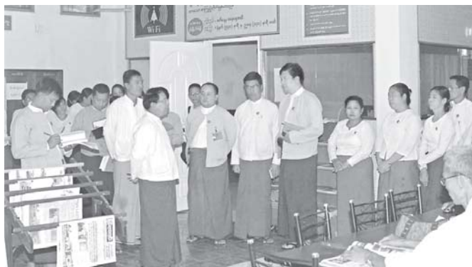
Minister for Information U Kyaw Hsan inspects Pyinnya Alin e-Library of Information and Public Relations Department.—MNA

On his arrival at the office of Yangon West District Information and Public Relations Department on Pansodan Street in Kyauktada Township, the minister inspected reading room and surfing the Internet, reading room for the children and publications that are available in the e-Library and urged officials