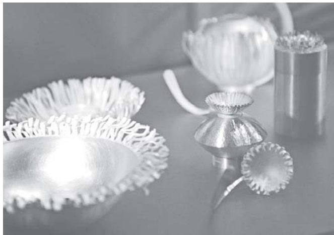
Silverwares are seen at the 2010's Goldsmiths' Fair at the Goldsmiths' Hall in London, Britain, on 27 Sept, 2010.