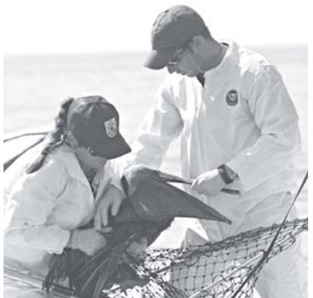
A team of biologists catch an oil-soaked brown pelican at Sandy Point in the Gulf of Mexico. Over half the oil released from a busted BP well remains in the Gulf of Mexico, a presidential panel has been told, contrary to government claims, as the US pointman lamented a "dysfunctional" response to the disaster.

The assessment implied some 2.5 million barrels of oil — or 105 million gallons — was still embedded in the fragile ecosystem, out of the estimated 4.9 million barrels that gushed into the Gulf during the 87 days before the well was capped.—Internet