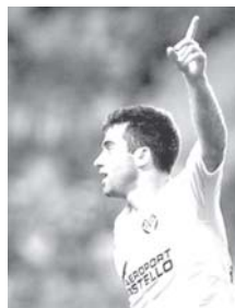
Villarreal's Italian forward Giuseppe Rossi celebrates after scoring against Malaga.

MADRID, 28 Sept — Villarreal swept into second place in the Spanish first division on Monday with a 3-2 win at Malaga in a game which saw all five goals coming in the first half.