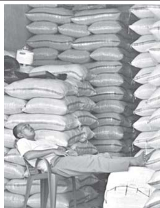
An Indonesian rice vendor takes a nap at his shop in Jakarta on August 22, 2010. Asian countries need to raise the level of their rice stocks to help stabilise prices and improve food security in a region where 65 percent of the world's hungry live, a report said.

A total of 47.7 percent of the families declared they have no debts, while 10 percent said they have high debts. Yet over half of those indebted believed they would be able to pay off their debts in the next month.—Xinhua