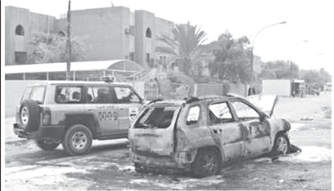
A police vehicle passes a burnt vehicle which belongs to Iraqi television presenter Alaa Muhsin after a bomb attack in Baghdad on 27 September, 2010. A sticky bomb attached to the car of Muhsin who works for state-run Iraqiya TV, wounded him in Baghdad's southern Saidiya district, police said.