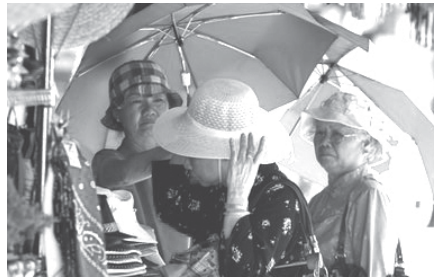
Women try on hats and cover themselves with umbrellas, from the scorching heat in the Chinatown section of downtown Los Angeles on 27 Sept, 2010. The National Weather Service says downtown Los Angeles has recorded an all-time record high of 113 degrees as a heat wave bakes California.