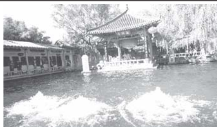
Visitors view the gurgling Baotu Spring in Jinan, capital of east China's Shandong Province, on 23 Sept, 2010. The underground water level of Baotu Spring rose to 30.01m, hitting a new record high since 1966.

LONDON, 28 Sept — Migraine sufferers could have their headaches "switched off" after researchers discovered a gene that acts like a pain thermostat in the brain. The finding could allow scientists to create a new generation of drugs that can simply turn up the threshold at which the body feels pain.