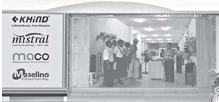
Khind Electro World of Monarch Company Limited in Mandalay.

NAY PYI TAW, 28 Sept — Newly opened Khind Electro World of Monarch Company Limited in Mandalay will offer special discounts in coming October as a gesture of hailing Thadingyut festival and expressing thanks to its customers.