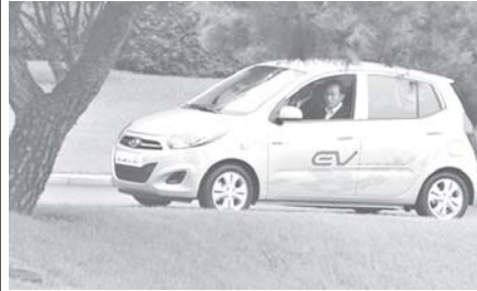
South Korean President Lee Myung-bak test drives an electric vehicle at the compound of the presidential house in Seoul, South Korea, on 9 Sept, 2010.