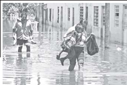
Residents walk through a flooded street in Villahermosa, Tabasco State, Mexico on 7 September. Floods that have affected almost one million people in the south and east of Mexico will likely worsen after the opening of a dam and predictions of more rain, a state governor said on Wednesday.

An evacuation was underway in the village of Bastan, where flames had already destroyed four houses, she said.