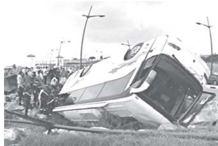
Rescuers check a vehicle for casualties after a crash in northern Morocco on 8 September. Nine Portuguese tourists were killed and 14 injured when the bus plunged into a ravine in northern Morocco, the interior ministry said.

The injured were ferried to hospitals in Tetouan, Fnideq and