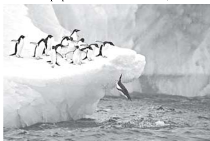
Adele penguins jumping off of iceberg, Antarctica.