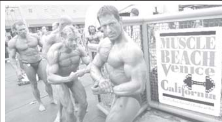
Male bodybuilders take part in the annual Muscle Beach Championship bodybuilding and bikini competition at Venice Beach, Los Angeles on 6 Sept, 2010.