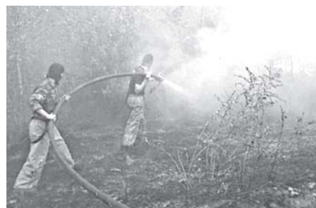
A firefighters work to extinguish a peak fire in a forest near the village Ryazanovka, outside Moscow in July 2010. Forest fires flared again in Russia on Wednesday as President Dmitry Medvedev demanded better protection for the country's prized forests to avoid a repeat of this summer's disaster.—INTERNET