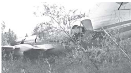
Russian pilots have safely landed a passenger plane in Siberia after the aircraft lost power at 10,600m (34,800ft). None of the 81 passengers and crew was injured in the emergency landing on a disused military airstrip on 7 Sept, 2010, Russian officials said.