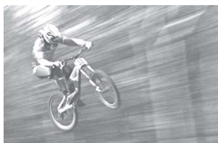
Spain's Bernat Guardia Pascual takes a jump as he cycles during the men's downhill at the UCI Mountain Bike World Championships in Mount Ste-Anne, Beaupre on 5 September, 2010.