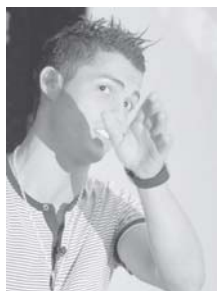
Real Madrid's Portuguese forward Cristiano Ronaldo

MADRID, 9 Sept — Real Madrid star Cristiano Ronaldo said on Wednesday he has “almost” recovered from an ankle injury and may be available to play against Ajax in the European Champions League next week. The Portuguese winger took a knock to his