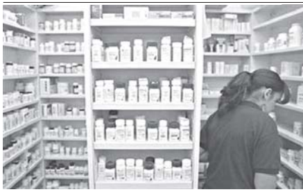
File photo shows A pharmacy employee looks for medication as she works to fill a prescription while working at a pharmacy in New York. INTERNET