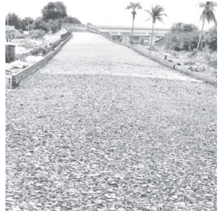
Construction of extended approach road of Ayeyawady Bridge (Yadanabon) on Mandalay bank.