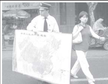
This file photo shows a security officer helping a woman to carry a map of China across a street in Shanghai. China has granted licences to 31 companies to provide web mapping services in the world's biggest online market, an official said on Thursday, but many foreign firms including Google have yet to apply.