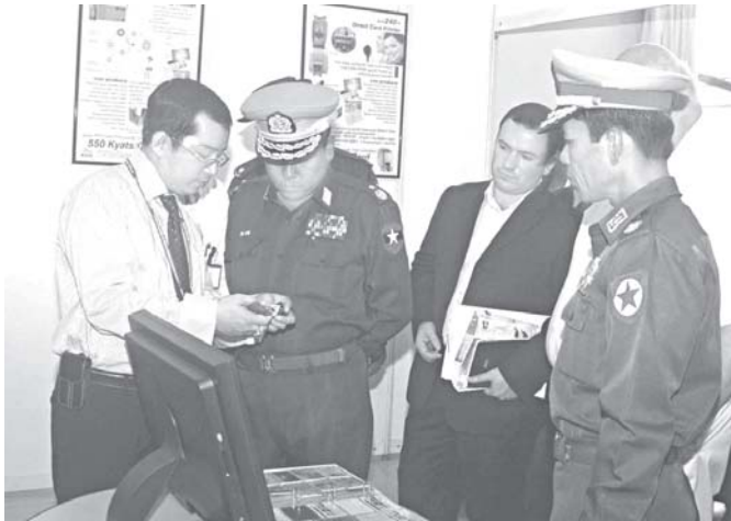
Maj-Gen Tin Ngwe of Ministry of Defence visits 1st Myanmar-Korea ICT Products & Solutions Exhibition 2010. (News on page 16)—MNA