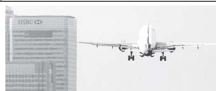
An aeroplane takes off from London City airport, from where the business jet involved in the near-collision had just departed.