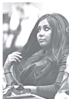
Nicole Polizzi, better known as 'Snooki' from the MTV show 'Jersey Shore' sits in court on 8 Sept, 2010, in Seaside Heights, NJ, waiting to face charges of being a public nuisance and annoying others on the Seaside Heights beach in July.

Her lawyer said Polizzi was under the influence of alcohol when she stumbled around the beach in Seaside Heights, using loud language that disturbed other beachgoers.