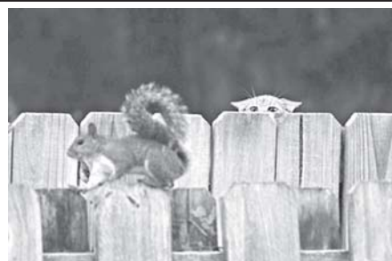
A cat eyes a squirrel as it makes it's way along a fence in Ormond Beach Fla, on 8 September, 2010. Cat and squirrel parted without incident.

The Sun said a check of its records found the word "limn" had been used 47 previous times in the newspaper since 1991, including two headlines.