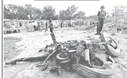
A security official stands near the wreckage of a vehicle used in the last night's bombing in Kohat, 60 kilometres (37 miles) south of Peshawar, Pakistan on 8 Sept, 2010.

All the injured people have been shifted to hospital in the area. No group has claimed responsibility for the blast.—Xinhua