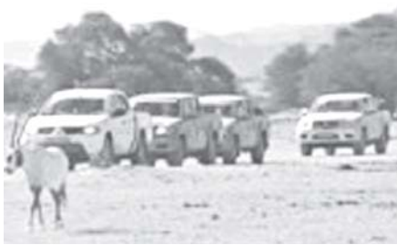
A Jeep Journey for Women Only in the South of Israel 27 October to 2 November 2010.—INTERNET

TEL AVIV, 9 Sept—Tens of women from Israel and around the world are expected to participate in the third annual women-only Desert Queen jeep expedition through Israel's desert landscape, which will take place from 27 October to 2 November 2010. Desert Queen 2010 combines a competitive outdoor adventure and 4WD driving expedition with personal empowerment – and the opportunity to experience the sheer beauty of Israel's deserts and the warmth of its people. Organized by the Jewish Agency for Israel and Geographical Tours with the cooperation of the Tourism Ministry, the Israeli jeep expedition is a sister project of international Desert Queen journeys. This year's seven-day journey will take place in the beautiful desert terrains of Israel's southern region, including Mitzpe Ramon, Nahal Barak and Moa, with an orientation day on 26 October. In addition to the traditional jeep and outdoor adventure, Desert Queen 2010 will also include special features, for example, a unique desert-based ecological project. The final route will be kept confidential by the organizers with details only revealed to the participants on a day-to-day basis.