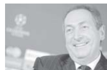
Former France coach Gerard Houllier