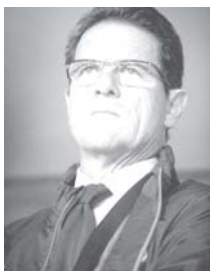
England manager Fabio Capello

The renewed success of his team had raised questions about whether Capello would try and stay on after the European Championships in Poland and Ukraine —