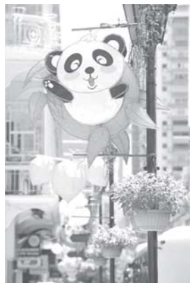
Photo taken on 7 Sept, 2010 shows a panda-shaped Mid-Autumn lantern in Macao of south China, on 7 Sept, 2010. Two giant pandas from the Chengdu Research Base of Panda Breeding will soon be sent here as a gift to the Macao Special Administrative Region.