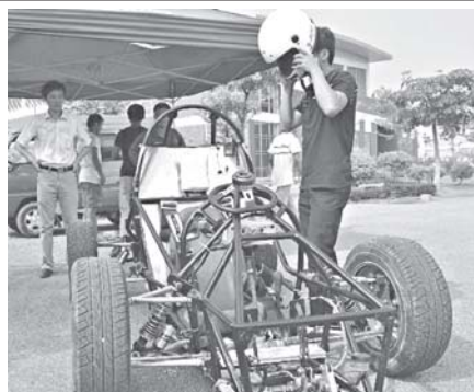
A student puts on the helmet to test a race car, built by students of LS Racing team from Guangxi Engineering College, in Liuzhou, southwest China's Guangxi Zhuang Autonomous Region, on 9 Sept, 2010.