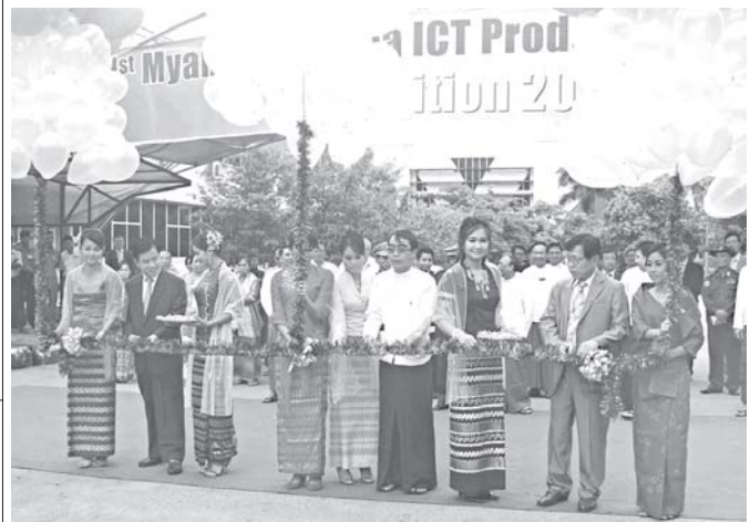
The opening ceremony of 1st Myanmar-Korea ICT Products & Solutions Exhibition 2010 in progress at Myanmar Info-Tech in Hline University Campus in Yangon. (News on page 16)