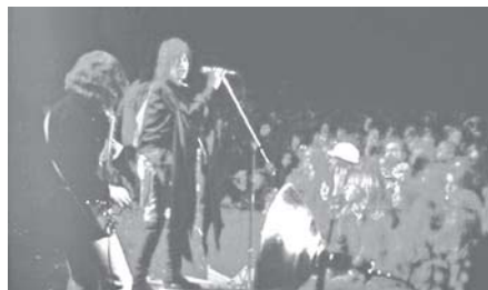
In this 8 Dec, 1969 file photo, the Rolling Stones perform at the 'Gimme Shelter' rock concert at the Altamont Race Track in California.

LOS ANGELES, 9 Sept—There are music documentaries that are all about the music — concert films that focus solely on the artistry and thrill of live performance — and then there are juicy ones that are all about backstage ego and volatility. "I'm still here," which follows Joaquin Phoenix's tumultuous transforma-