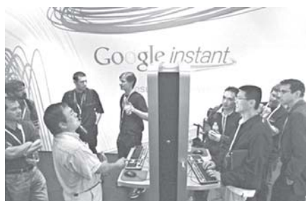
Members of the media and invited guests use the new Google Instant during a special launch event in San Francisco, California. Google announced the launch of Google Instant, a faster version of Google search that streams results live as you type your query.