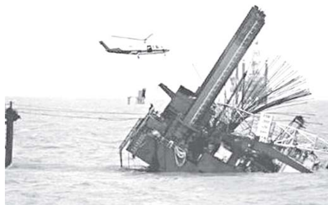
A rescue helicopter searches for missing workers above a tilted drilling platform on Bohai Bay, off eastern China's Shandong Province, in this photo distributed by China's official Xinhua News Agency, on 8 September, 2010.—INTERNET