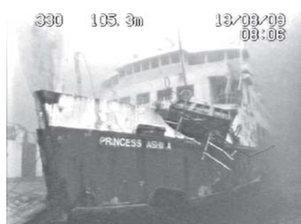
A Royal New Zealand Navy photo shows the Tongan ferry Princess Ashika sitting on the seabed after sinking in August 2009. Four men have pleaded not guilty to manslaughter over the sinking of the Princess Ashika with the loss of 74 lives.

The Princess Ashika, built in the early 1970s, was on its fourth voyage in Tonga when it sank, and the inquiry blamed authorities for allowing it to sail as evidence mounted of its unseaworthiness which led to the 74 deaths.— Internet